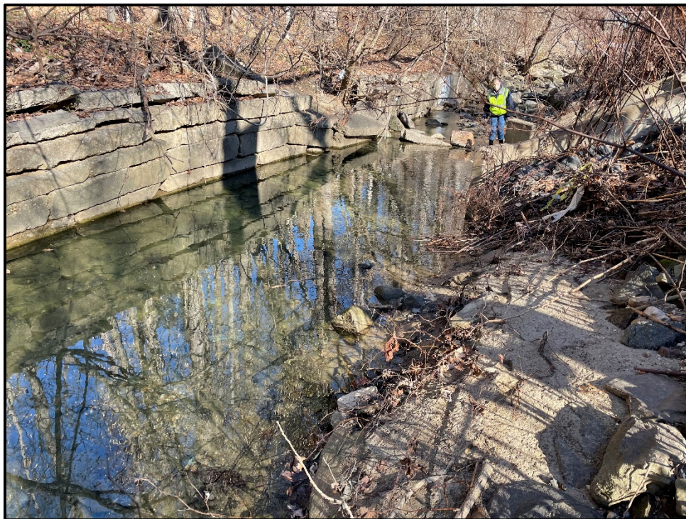
Waterway 32L – Perennial