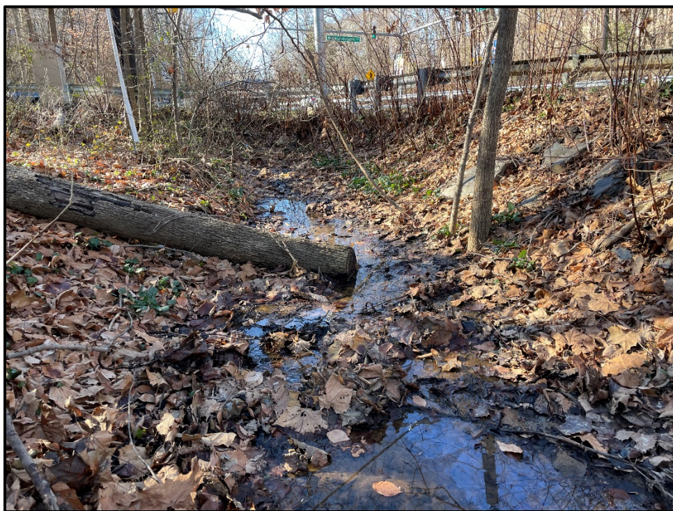
Waterway 32M – Perennial