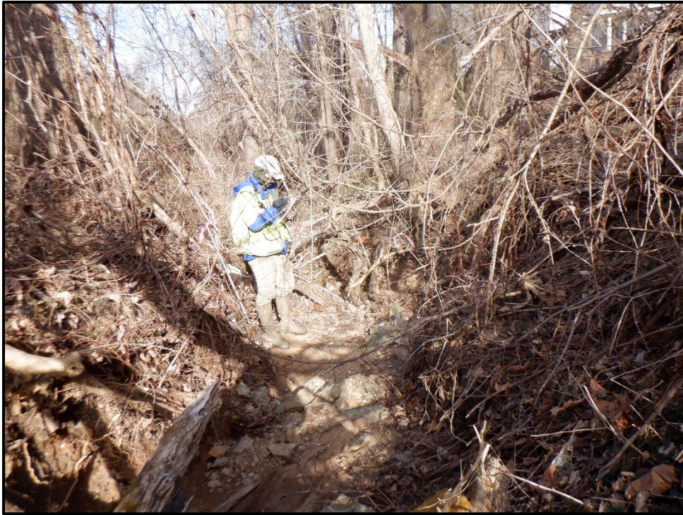
Waterway 31000 – Intermittent