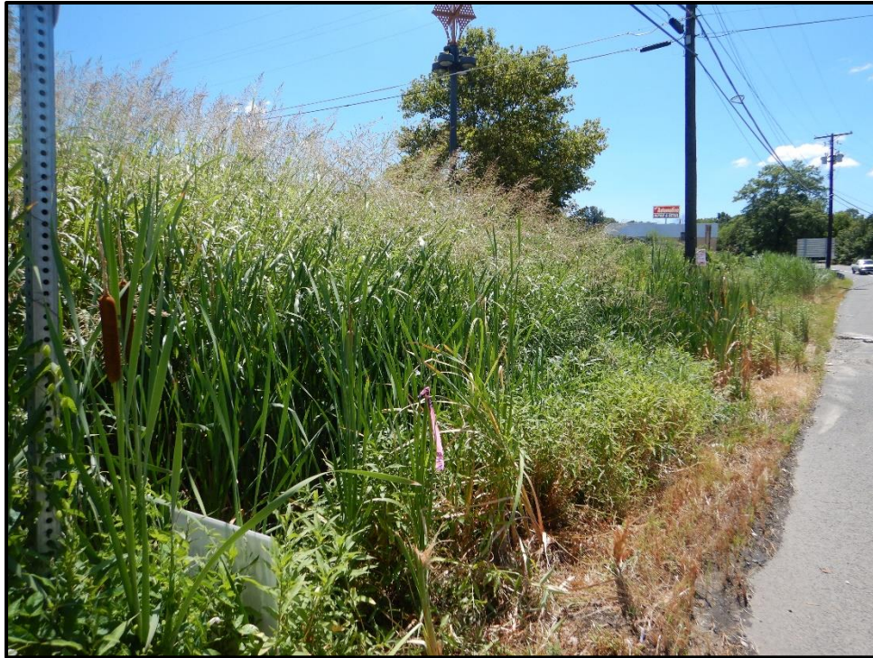
Wetland 8U – PEM