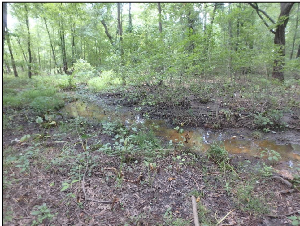
Wetland 9HH – PFO