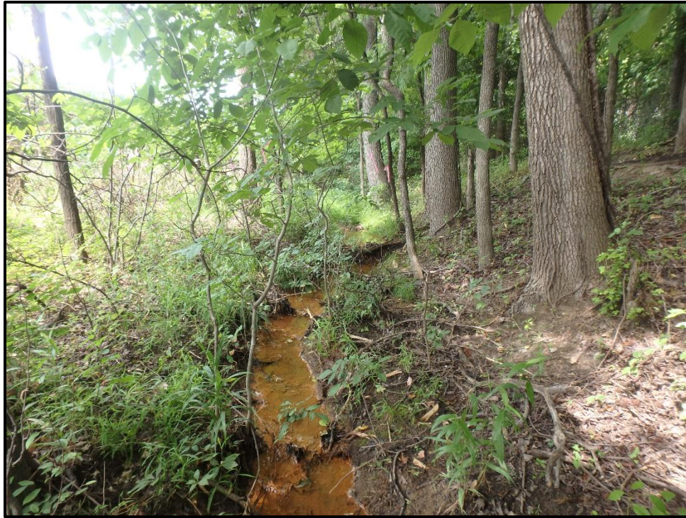
Waters 7T – Perennial