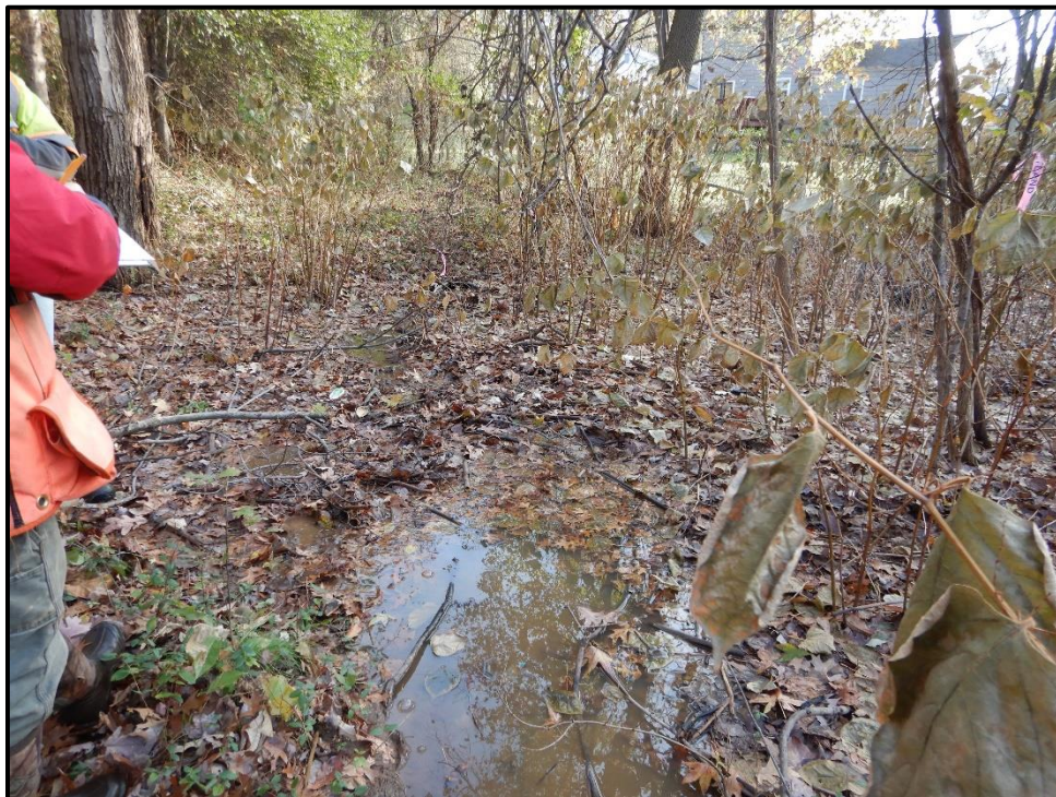
Waters 9QQ – Ephemeral/Intermittent