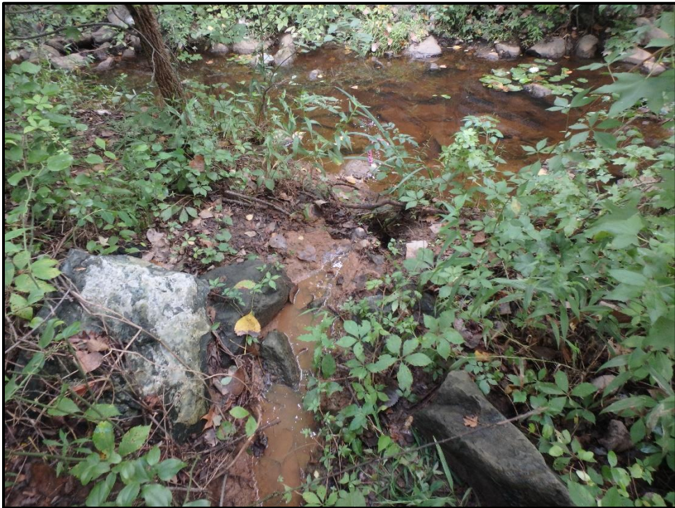
Waters 9O – Ephemeral