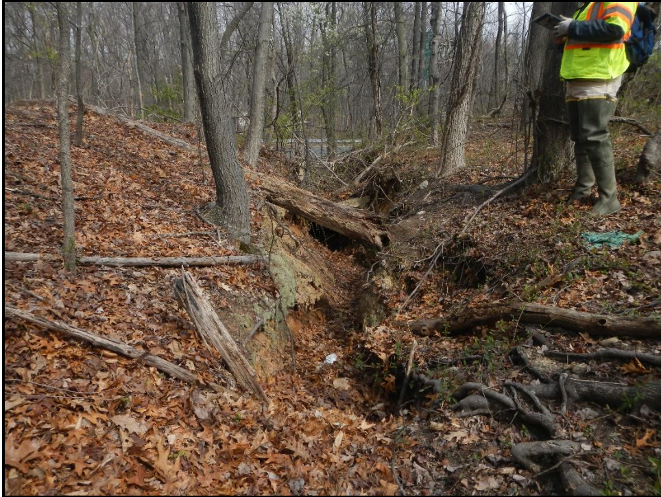
Waters 12R – Intermittent