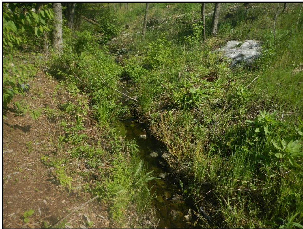
Waters 12QQQ – Intermittent