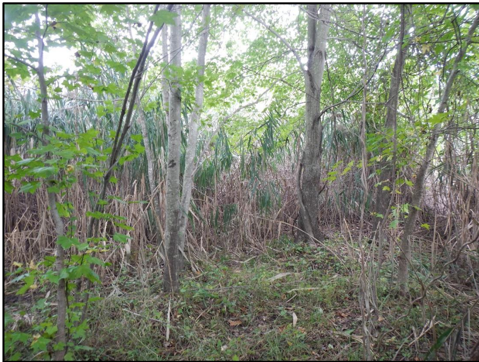
Wetland 11FF - PEM