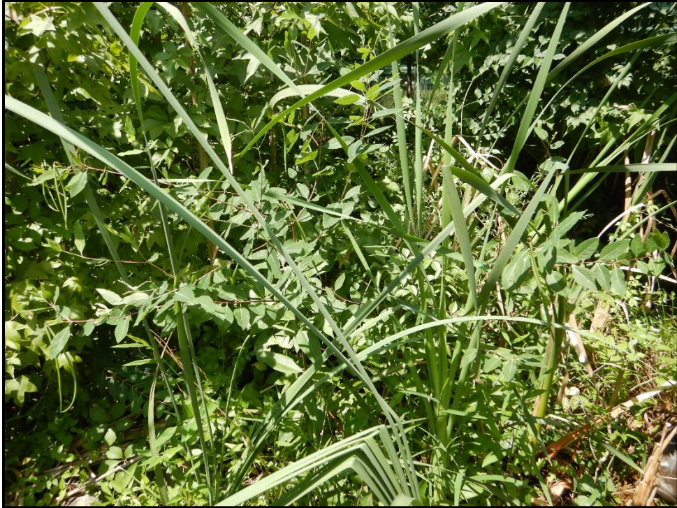
Wetland 9K – PSS