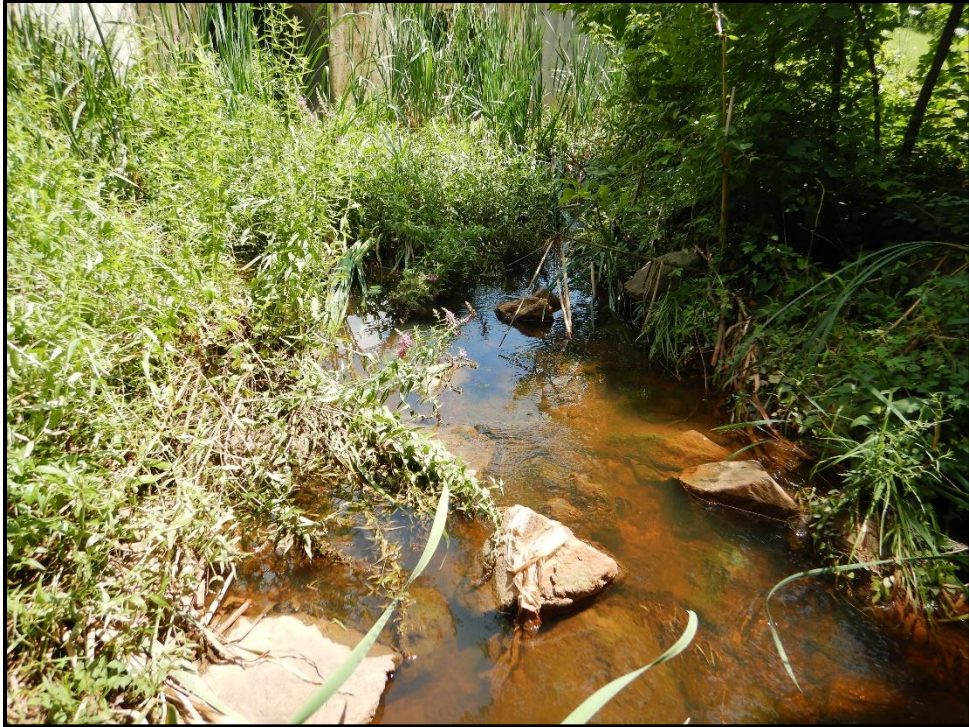
Waters 9J – Perennial