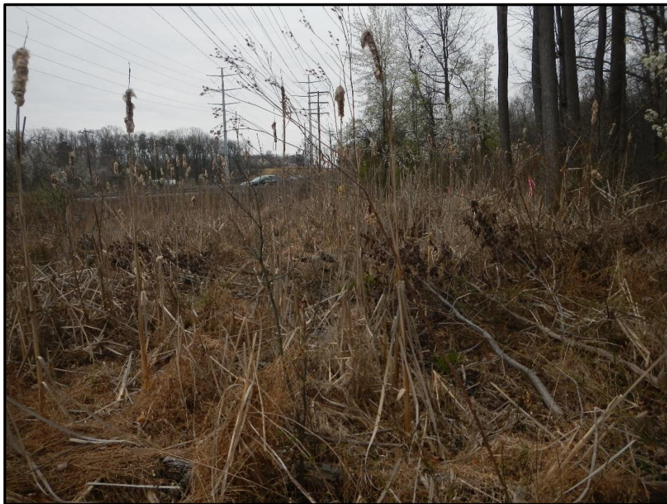
Wetland 12X – PEM