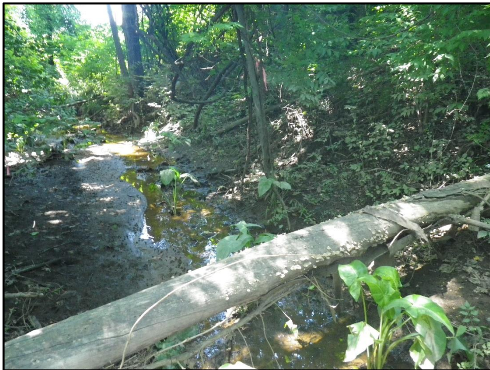
Wetland 11N - FPO