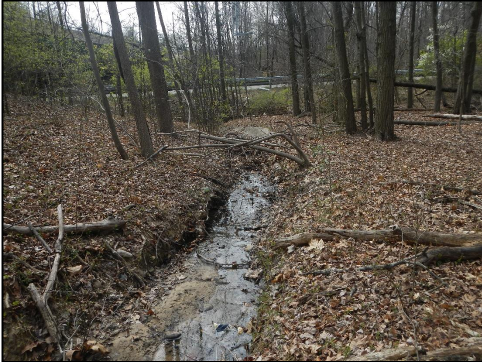
Waters 12S – Intermittent