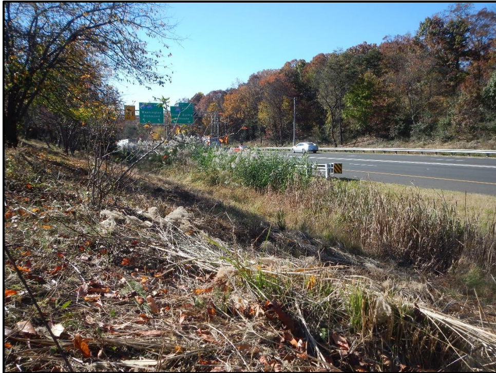
Wetland 12XXX – PEM