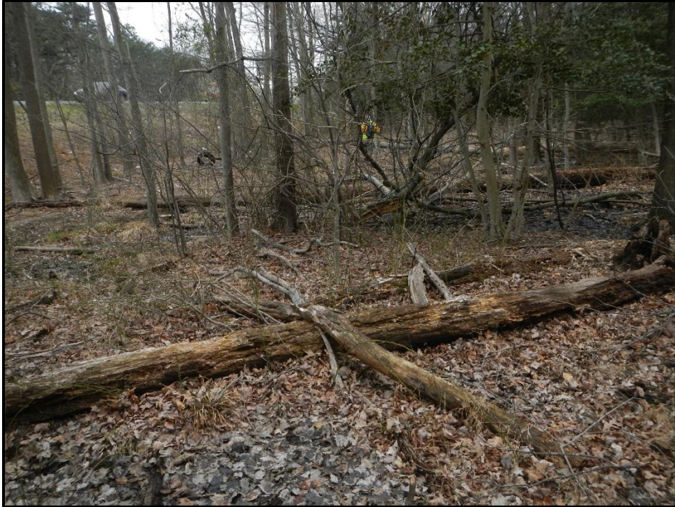
Wetland 12BB - PFO