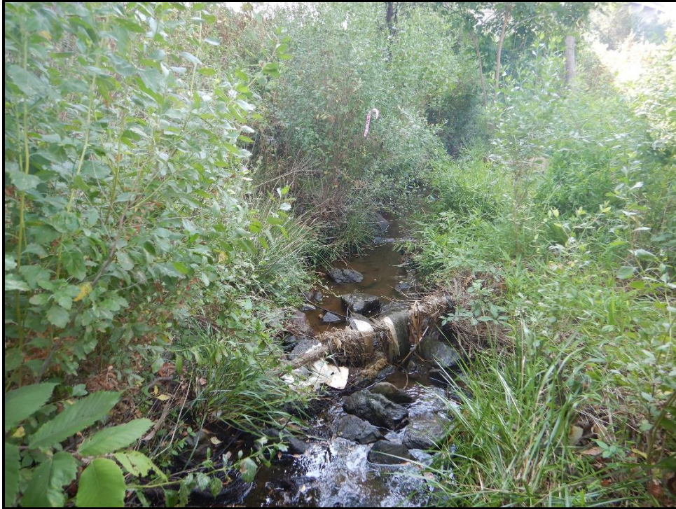
Waters 8N – Perennial/Intermittent