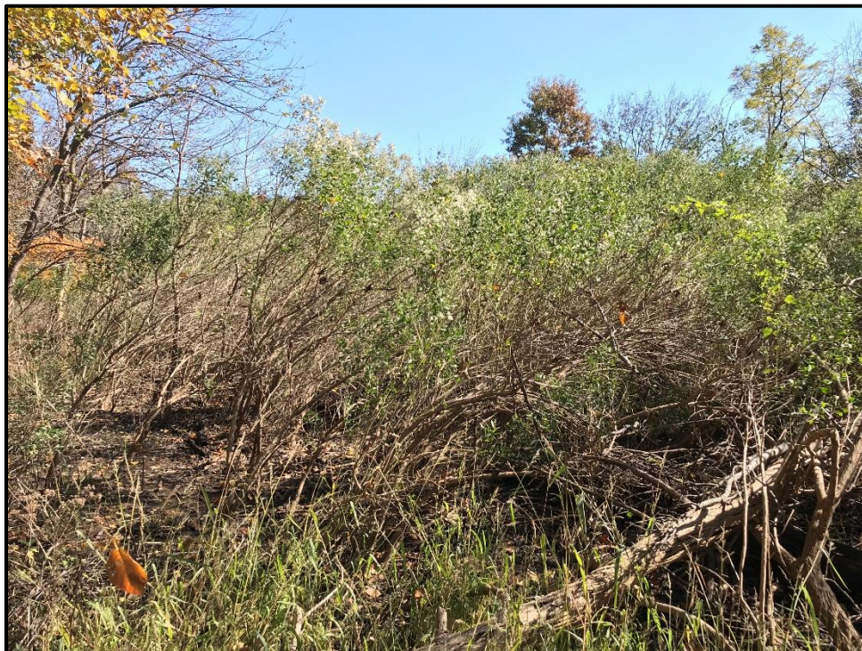
Wetland 8KK – PSS