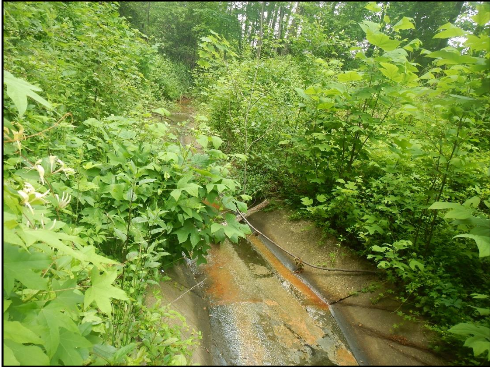
Waters 10Y – Perennial