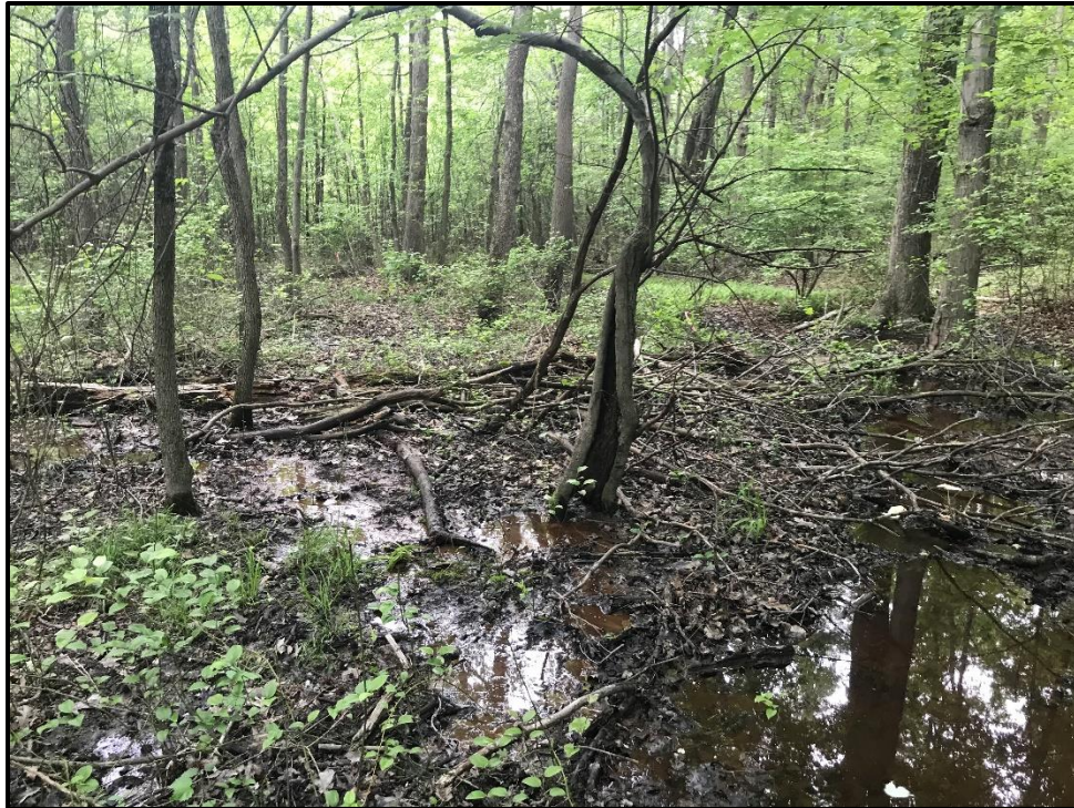
Wetland 12NNNN – PFO