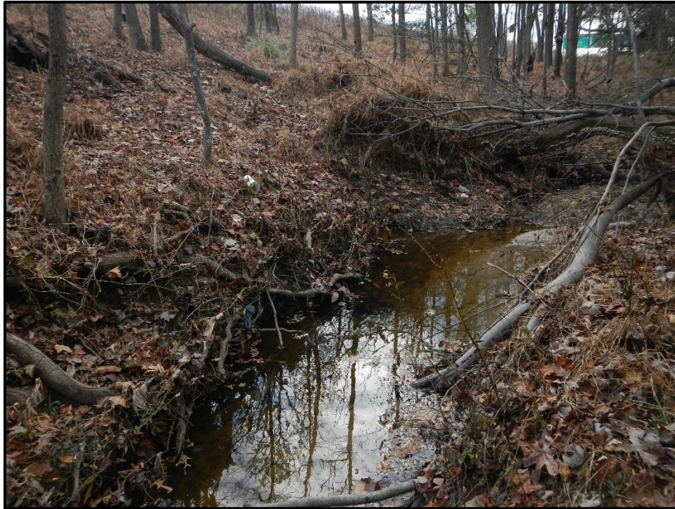
Waters 12EEEE – Perennial