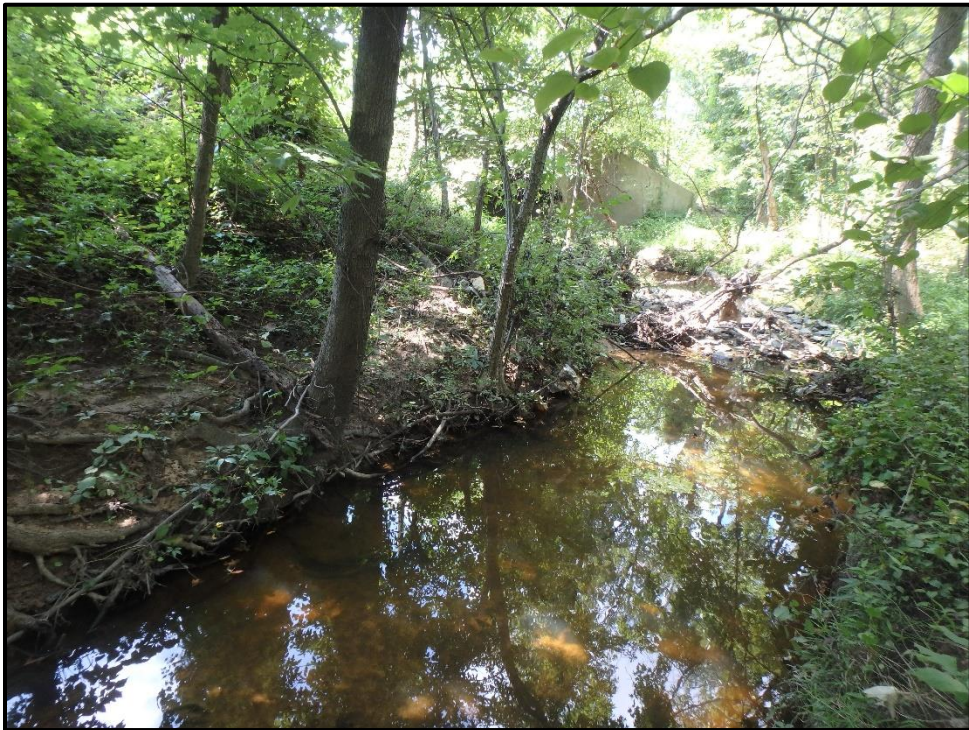
Waters 9JJ – Perennial