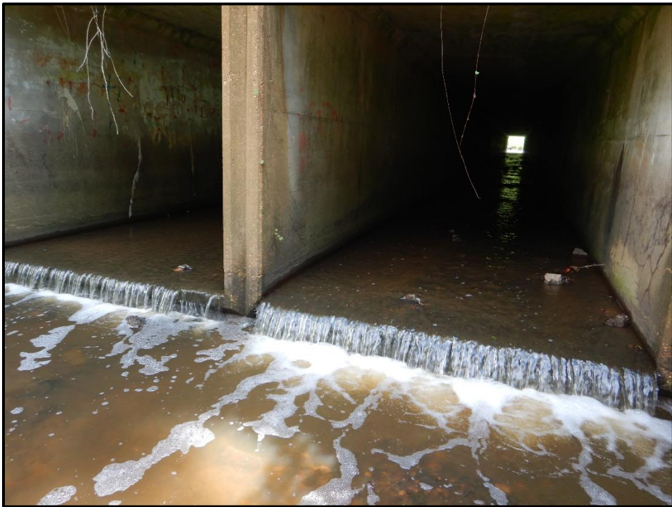
Waters 9G – Perennial