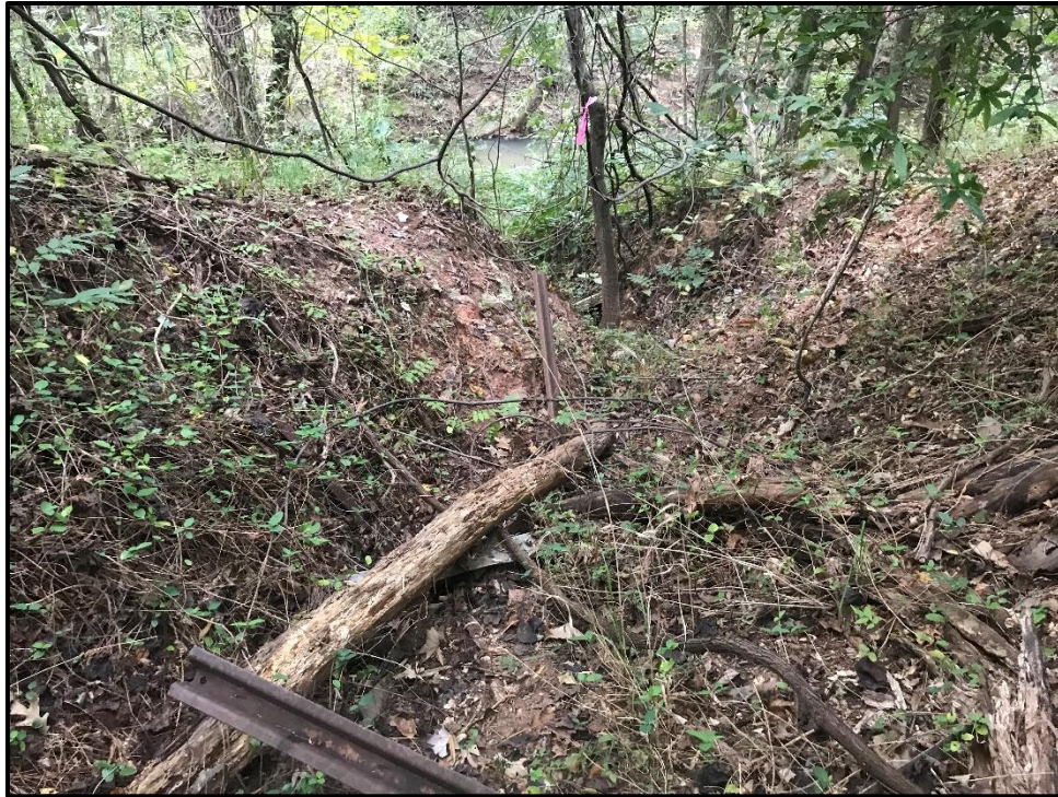
Waters 8CC – Ephemeral