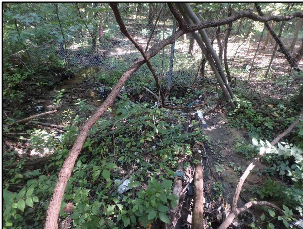
Waters 900 – Ephemeral