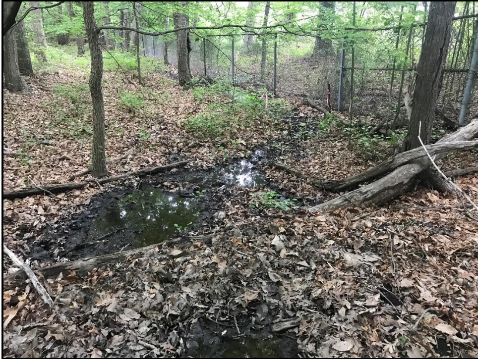
Wetland 120000 – PFO