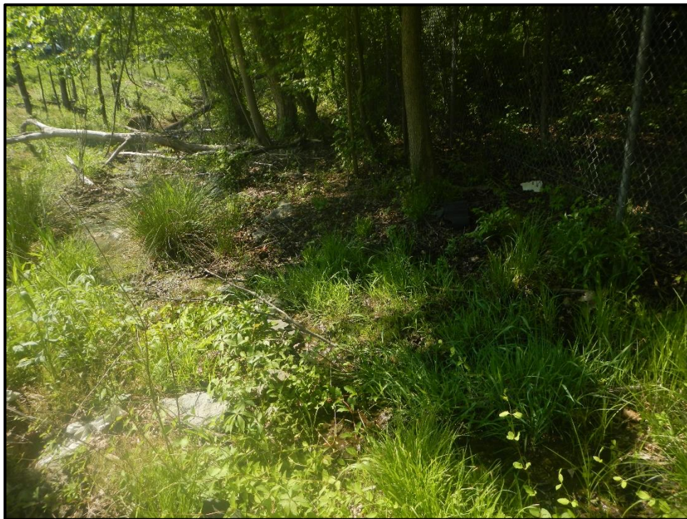
Wetland 12000 – PEM