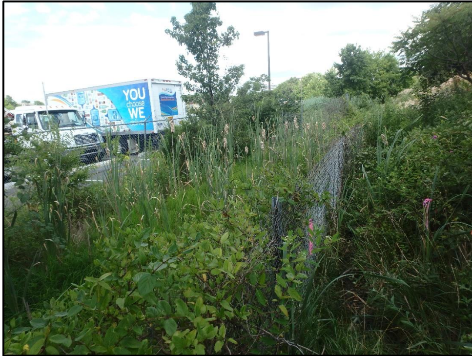
Wetland 7P – PEM