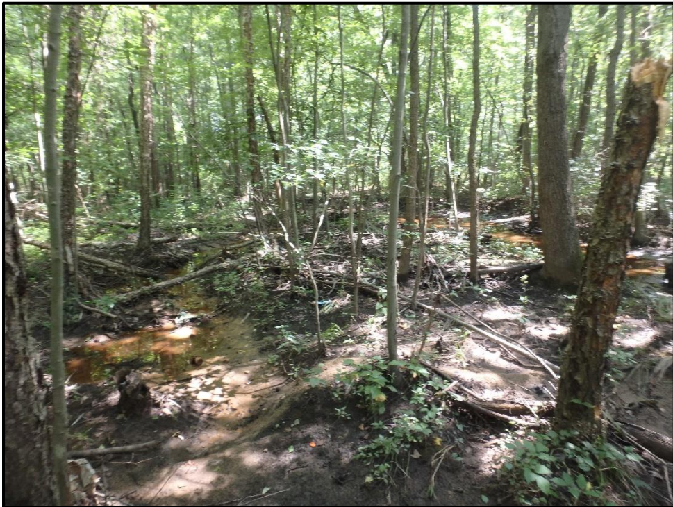
Wetland 9KK – PFO