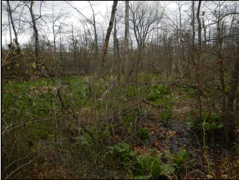
Wetland 12NN - PFO