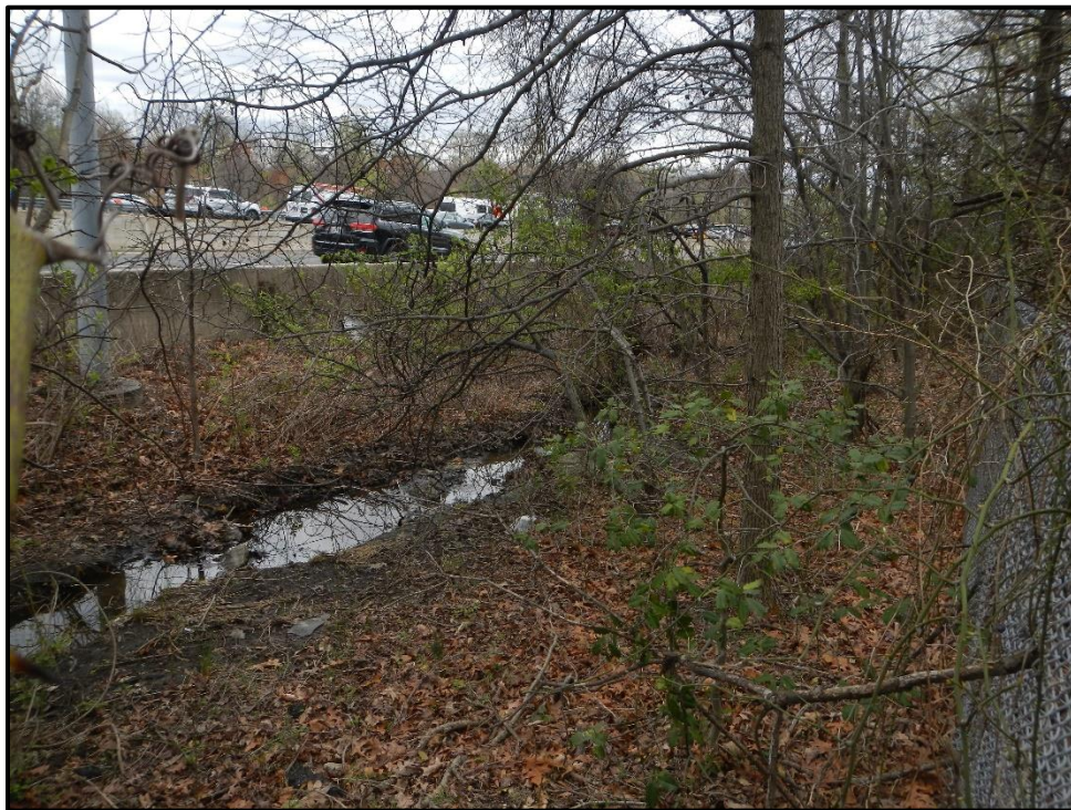
Waters 12MM – Intermittent