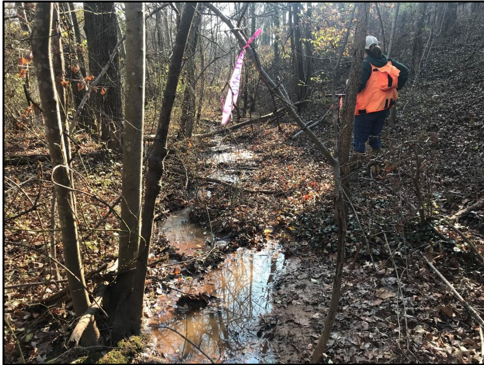
Waters 9VV – Intermittent