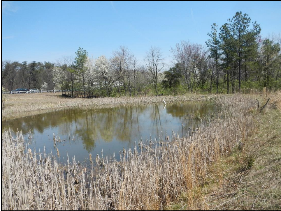
Wetland 12DD – POW