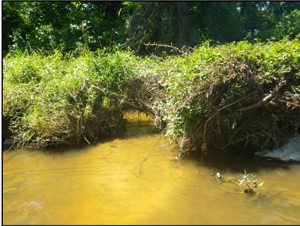
Waters 11M – Intermittent