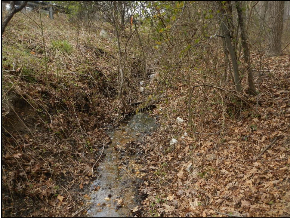
Waters 12T – Intermittent