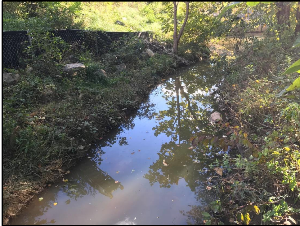
Waters 8AA – Perennial