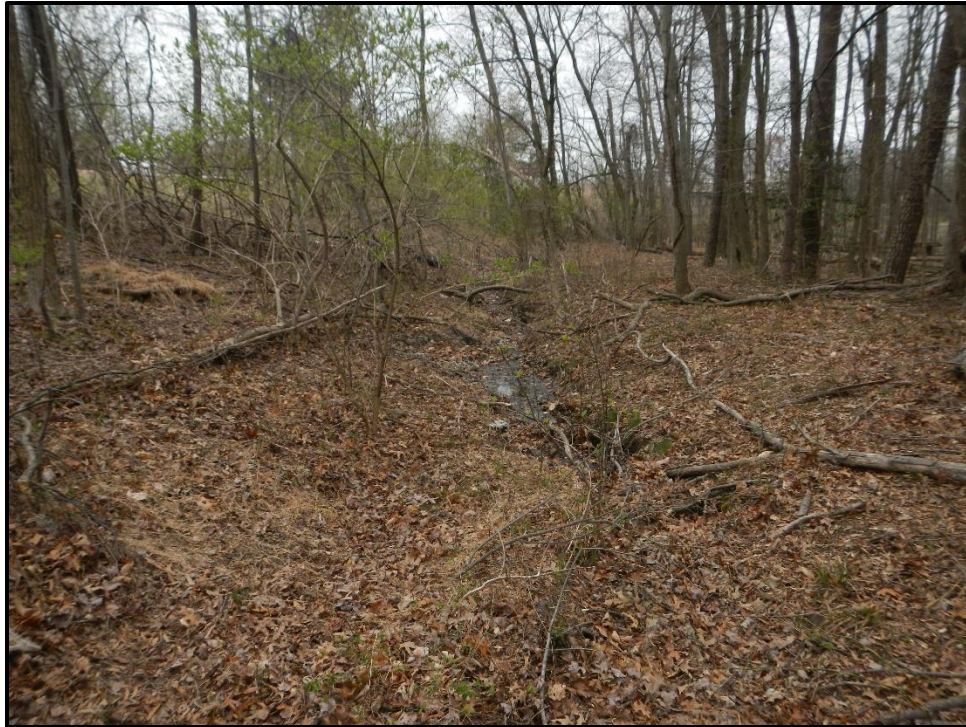
Waters 12Y – Perennial