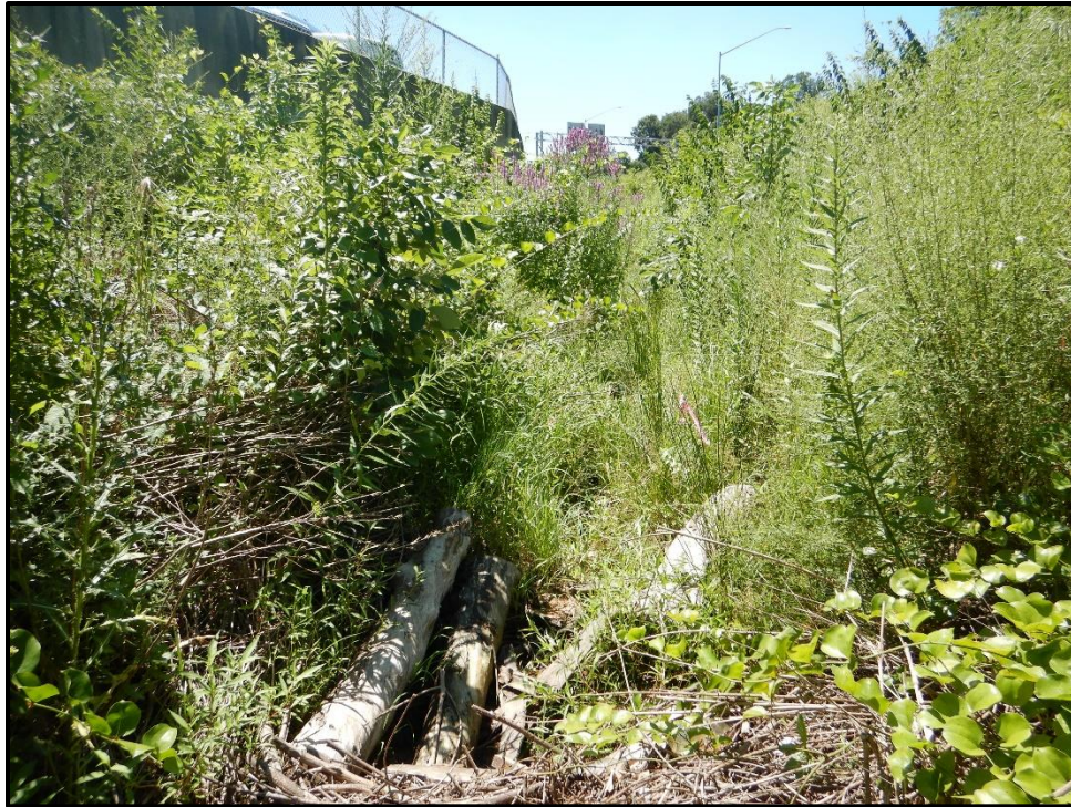
Waters 8S – Ephemeral