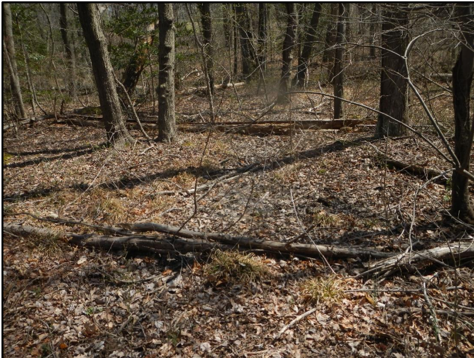
Wetland 12J - PFO