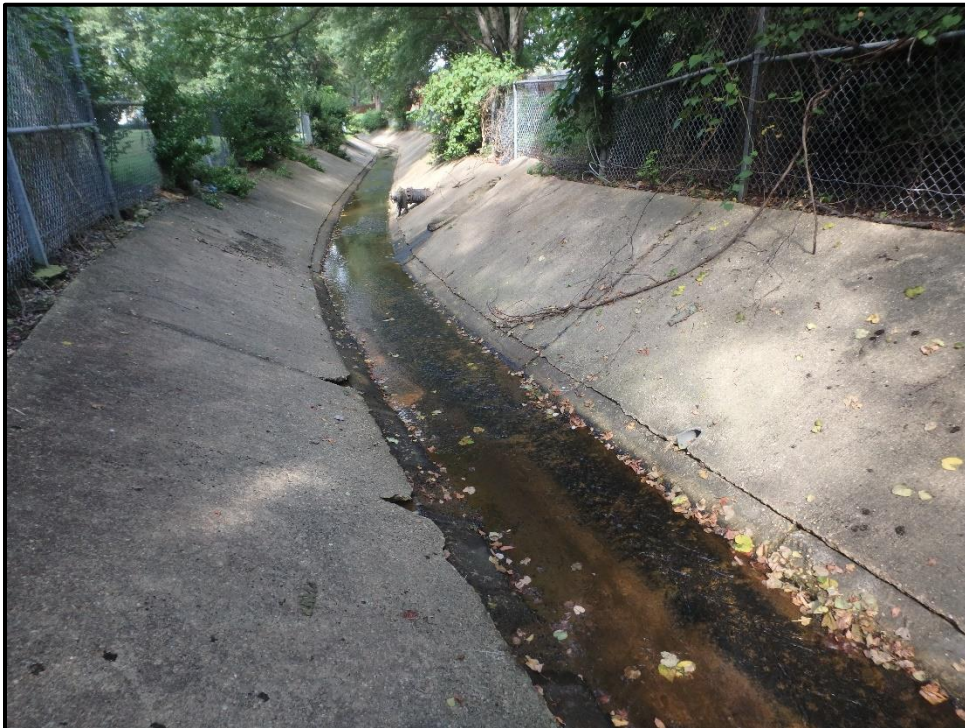
Waters 7O – Perennial