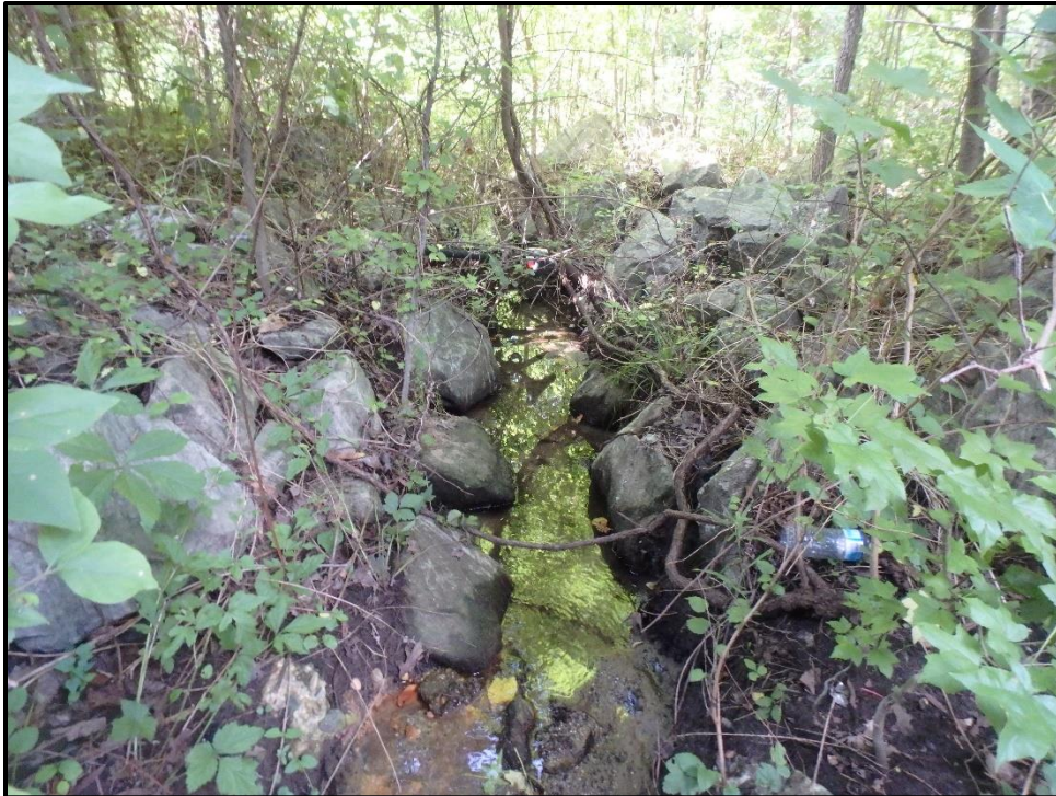
Waters 9CC – Perennial