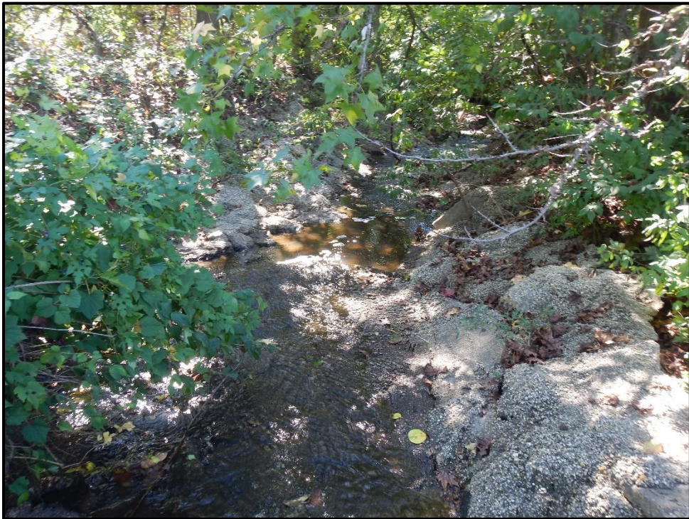
Waters 10YY – Perennial