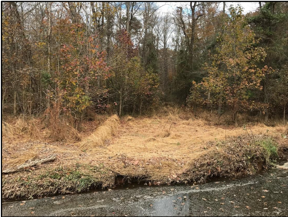
Wetland 10VV – PEM