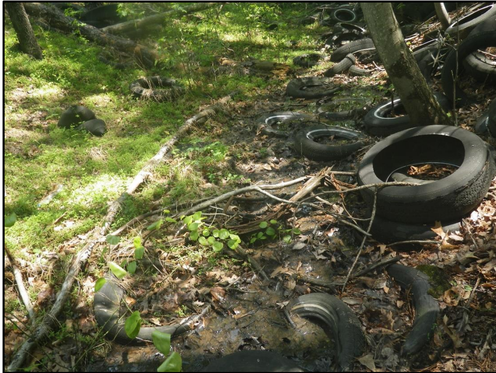
Wetland 10H – PFO