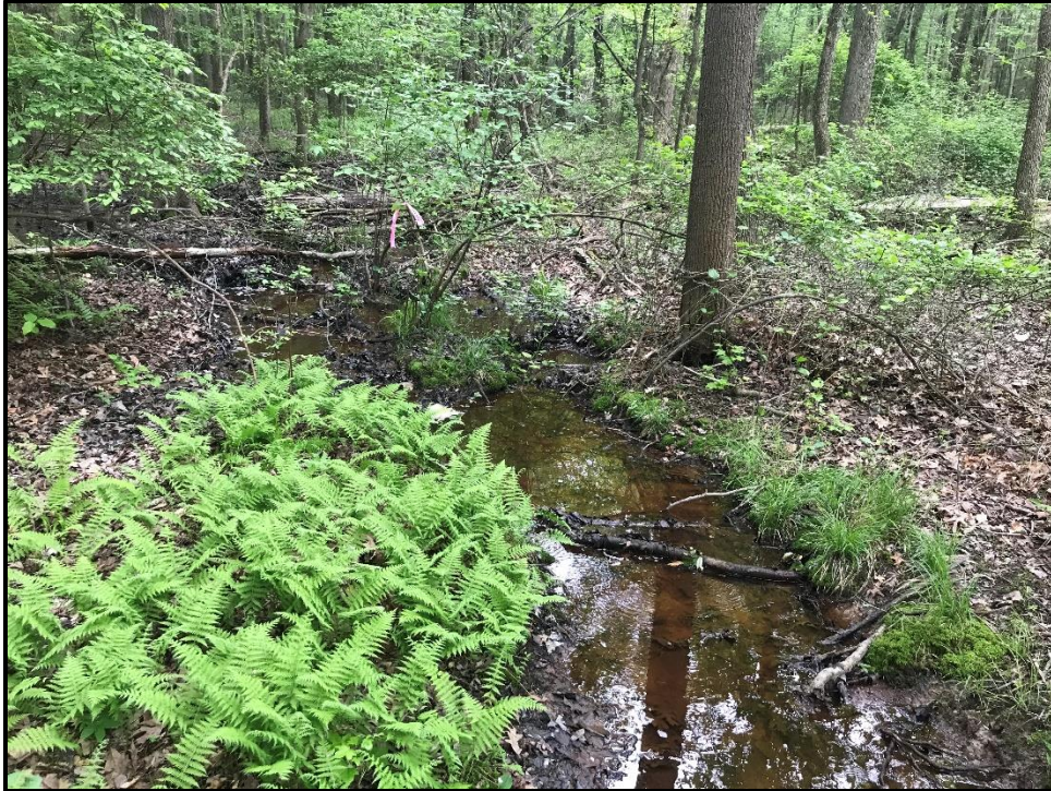
Waters 12LLLL - Intermittent