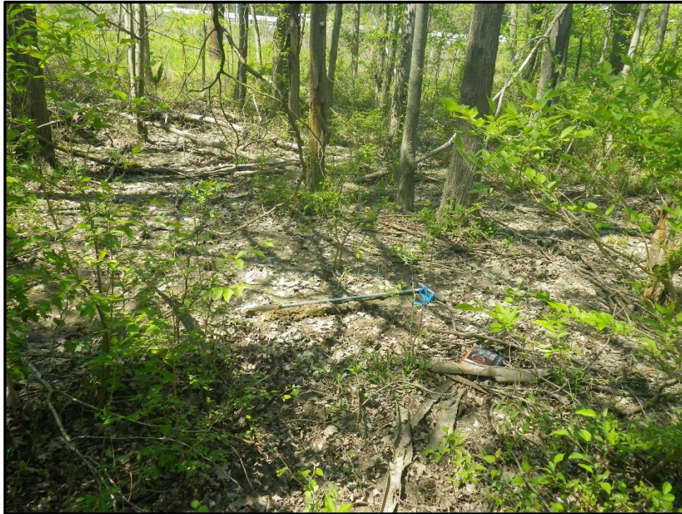
Wetland 12EEE – PFO