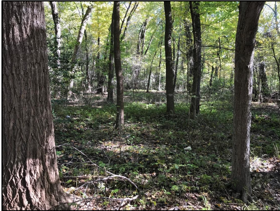
Wetland 8FF – PFO