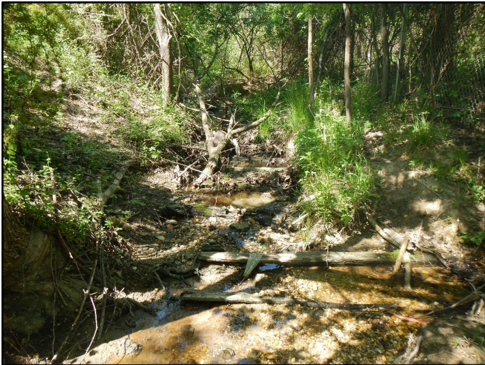
Waters 12III – Intermittent