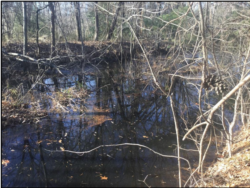
Waters 12FFFF – POW