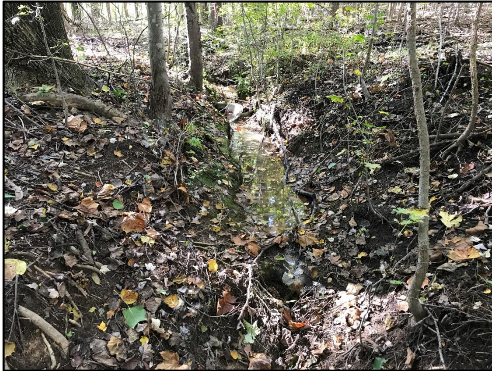
Waters 8HH – Intermittent