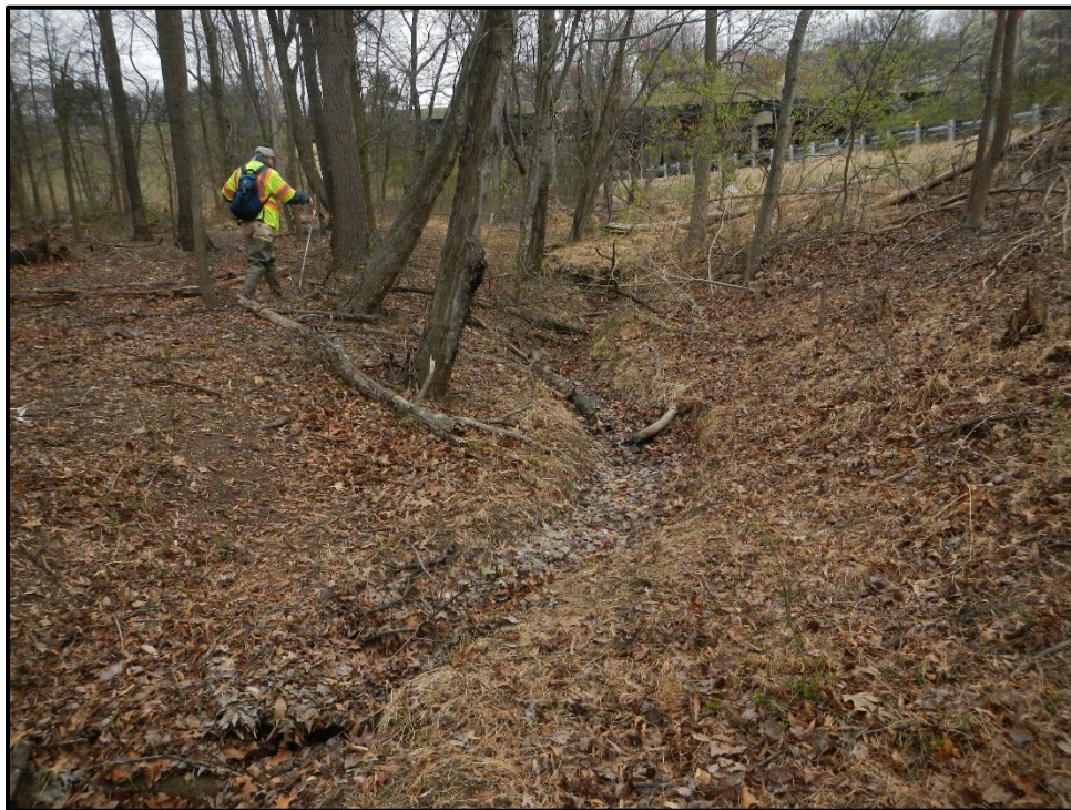
Waters 12Y – Perennial