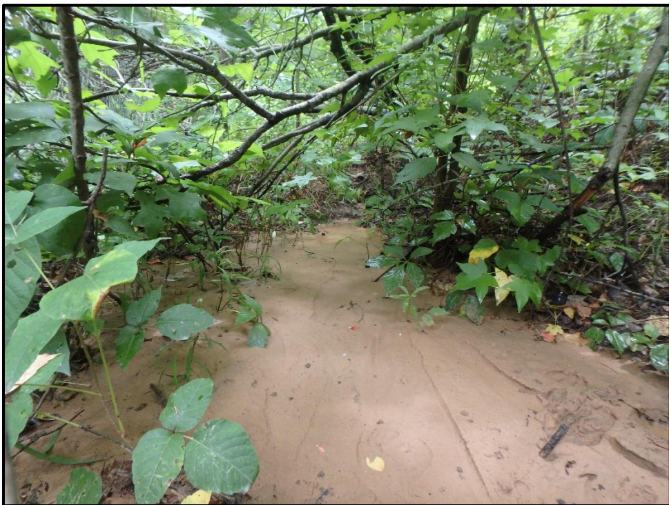
Waters 9F – Intermittent