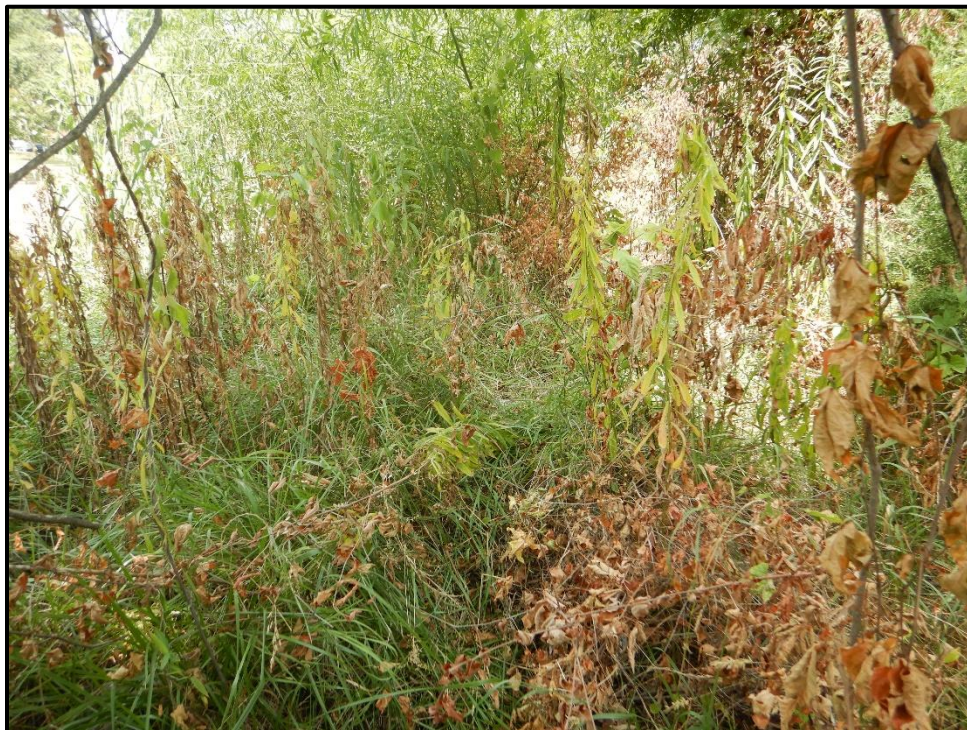
Wetland 8P – PSS