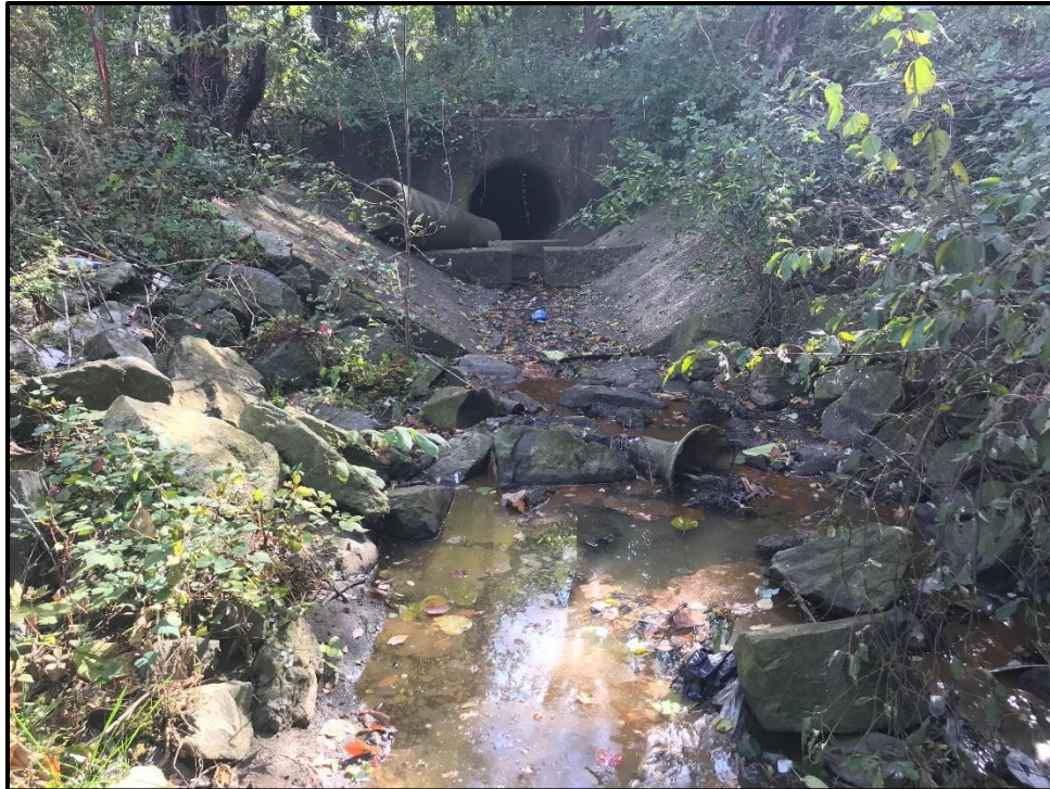
Waters 7PP – Intermittent