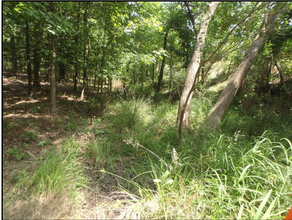
Wetland 8H – PFO