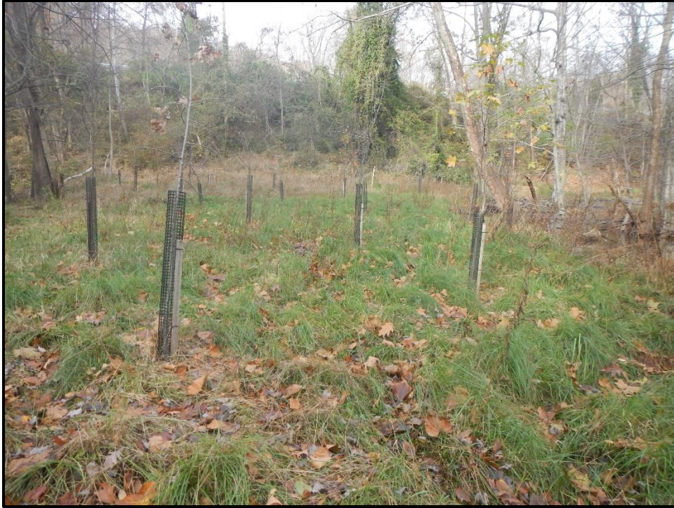
Wetland 12ZZZ – PFO