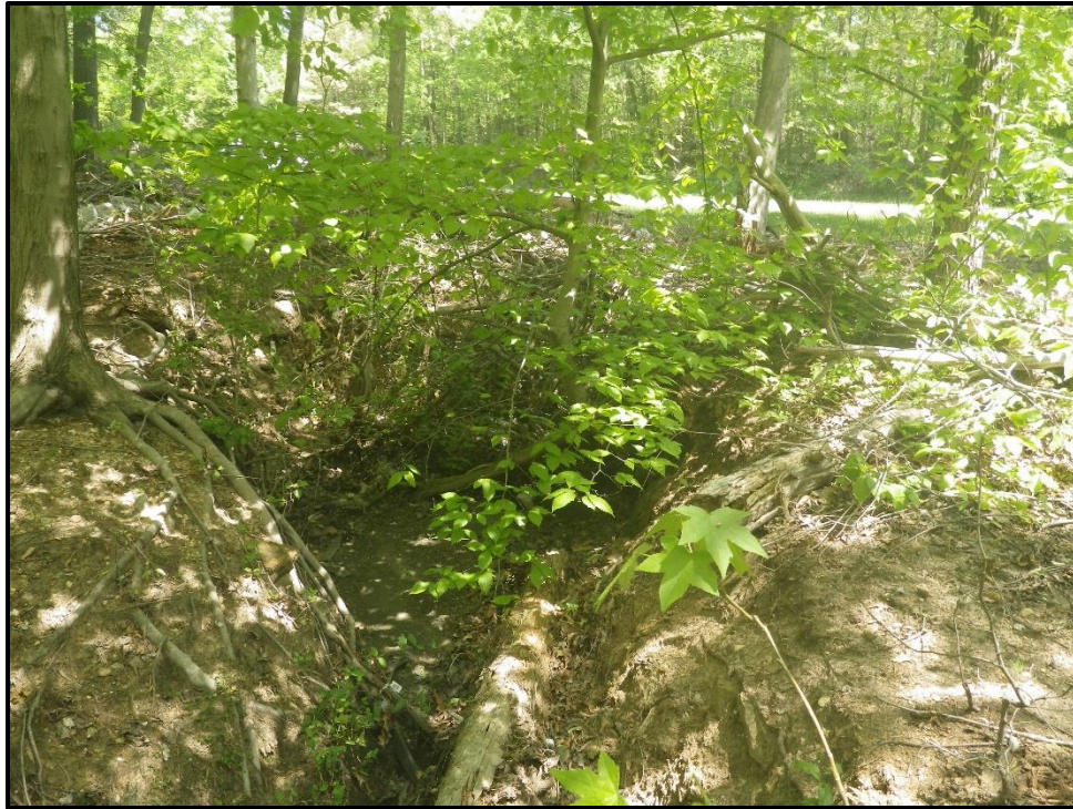
Waters 10A – Ephemeral