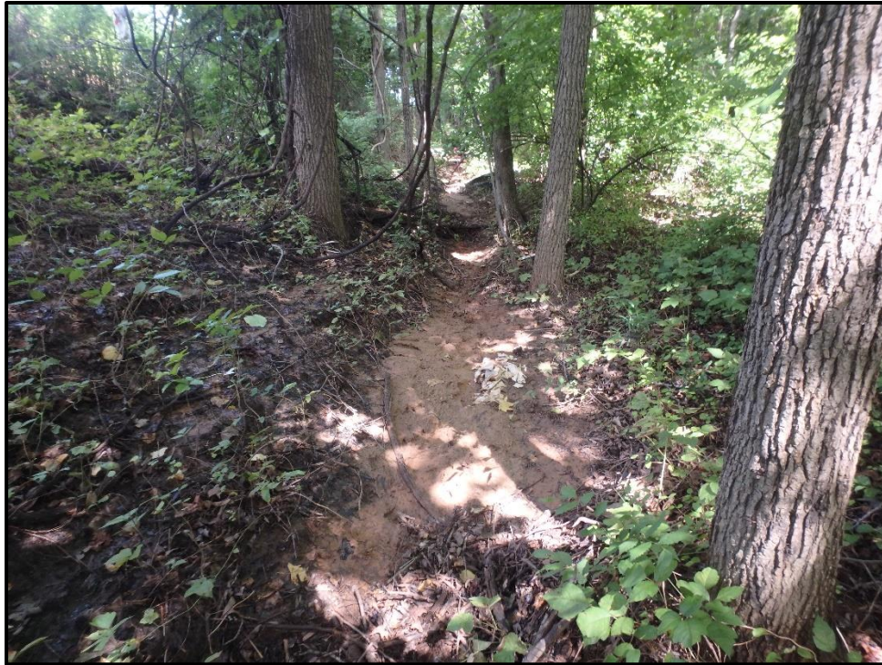
Waters 9P – Ephemeral