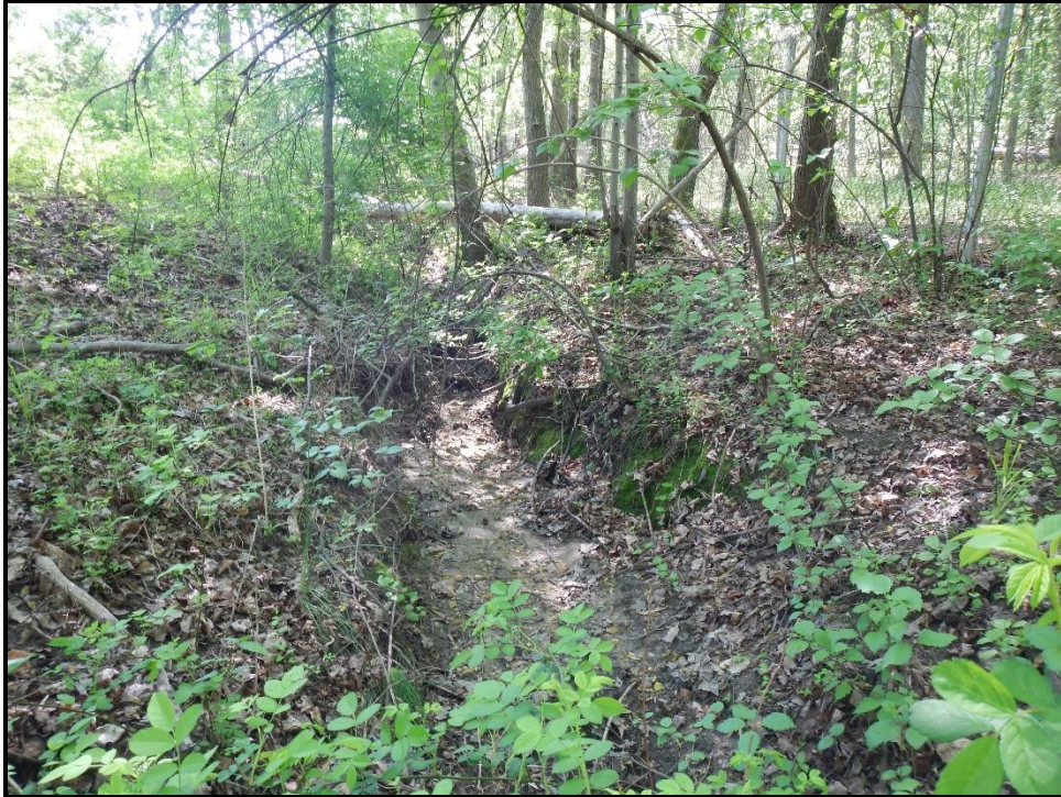
Waters 12GGG – Ephemeral