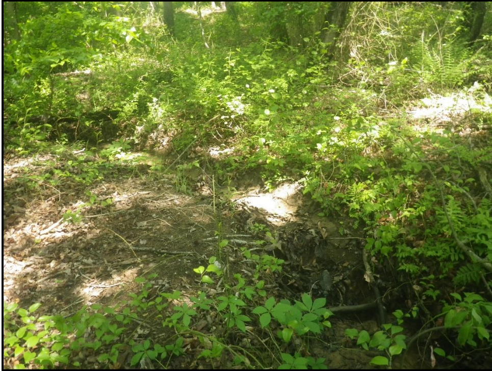
Waters 10F – Intermittent