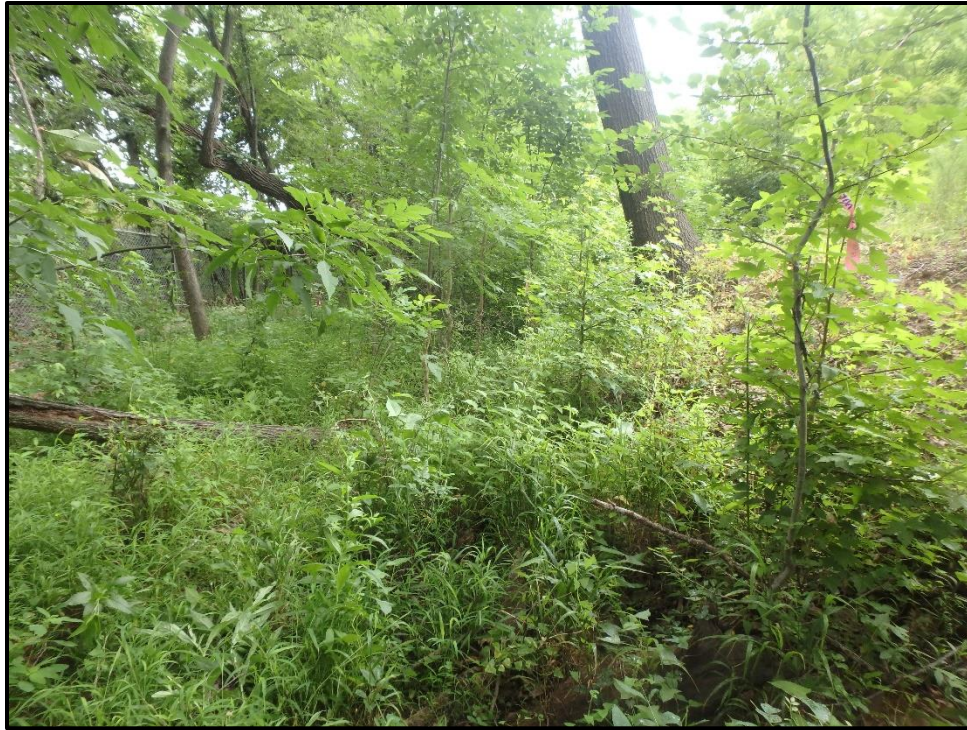
Wetland 7U – PSS