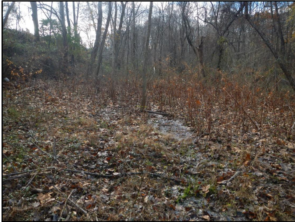
Wetland 12BBBB – PFO