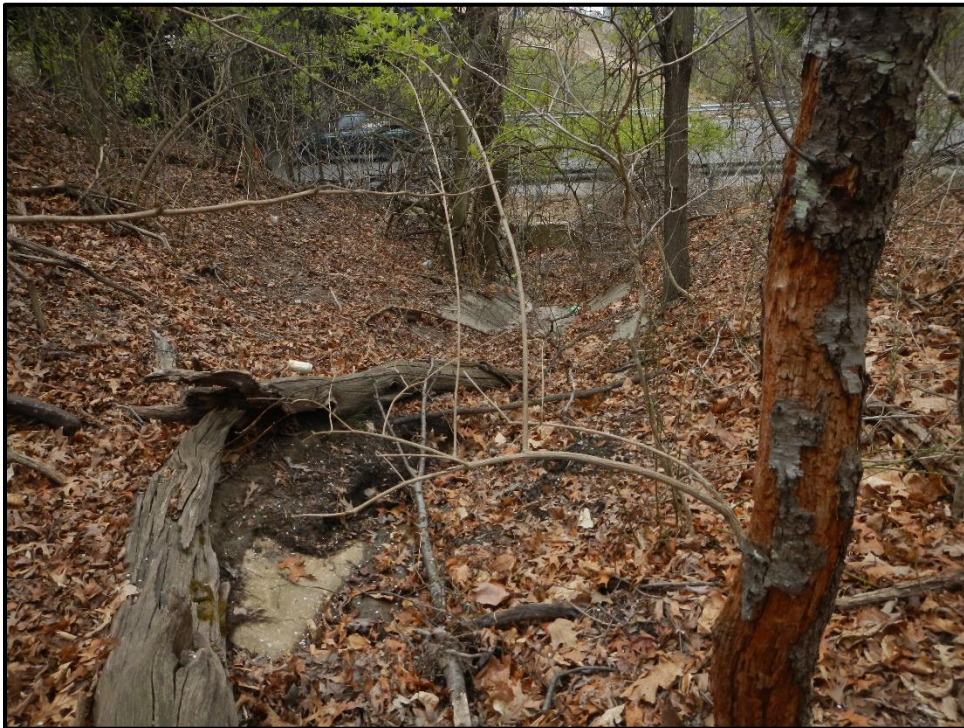
Waters 12Z – Intermittent