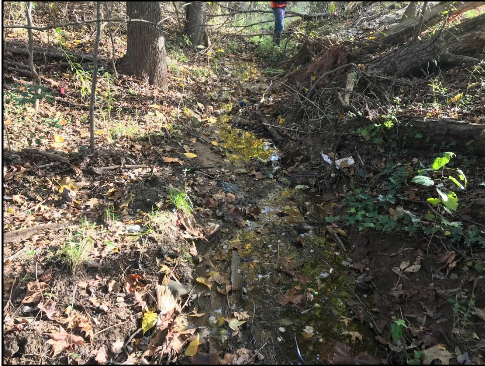
Waters 8DD – Intermittent