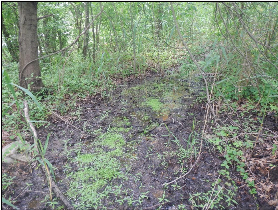
Wetland 10T – PFO