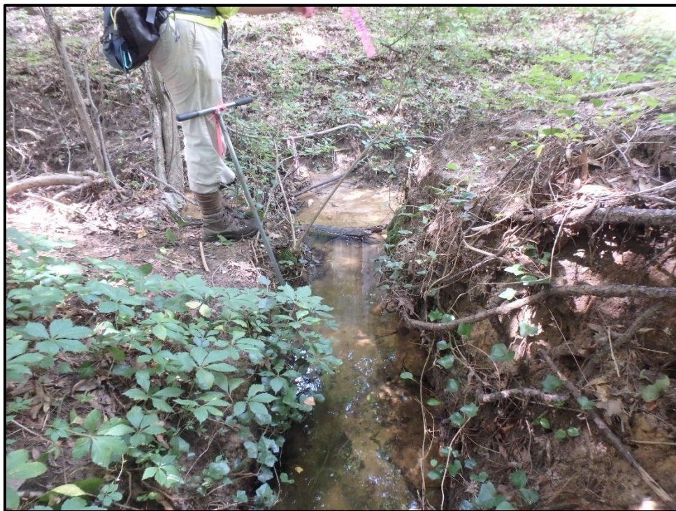
Waters 9GG – Intermittent