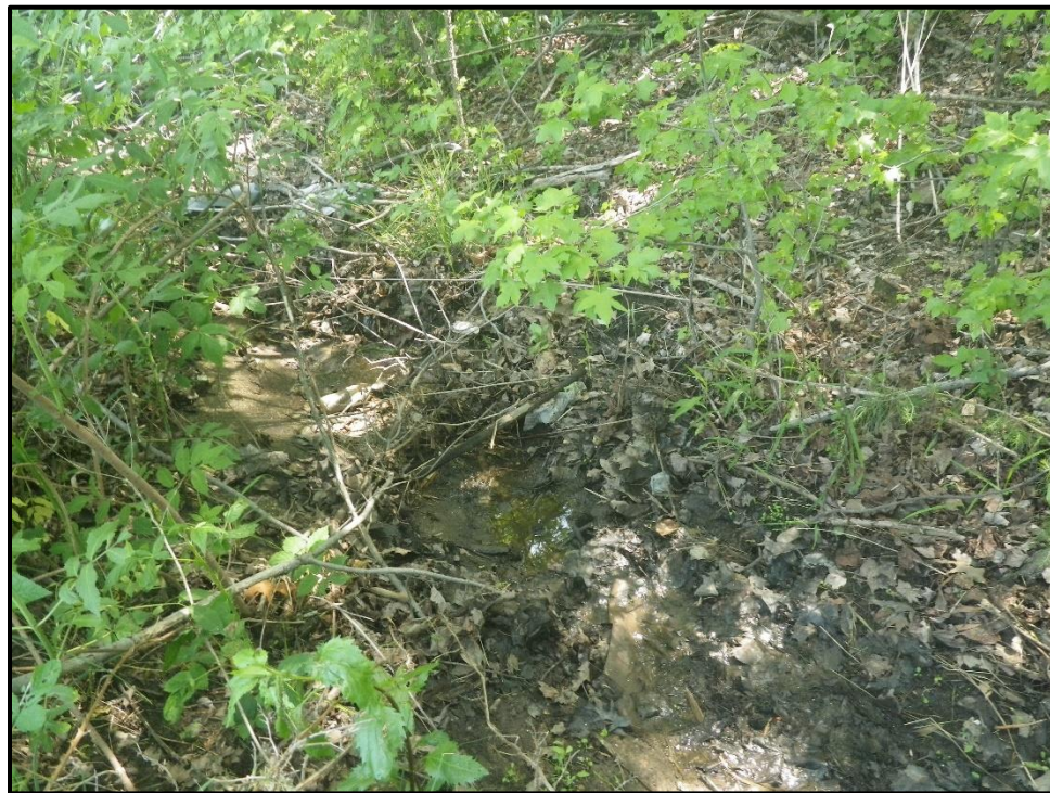
Waters 10J – Intermittent