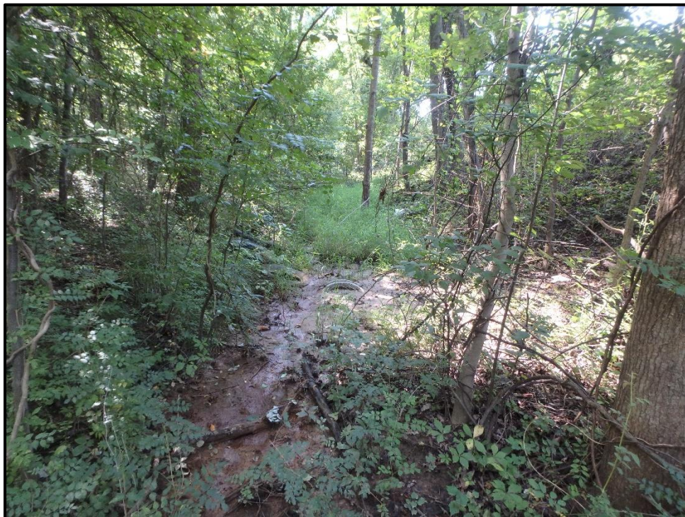
Wetland 9NN – PFO