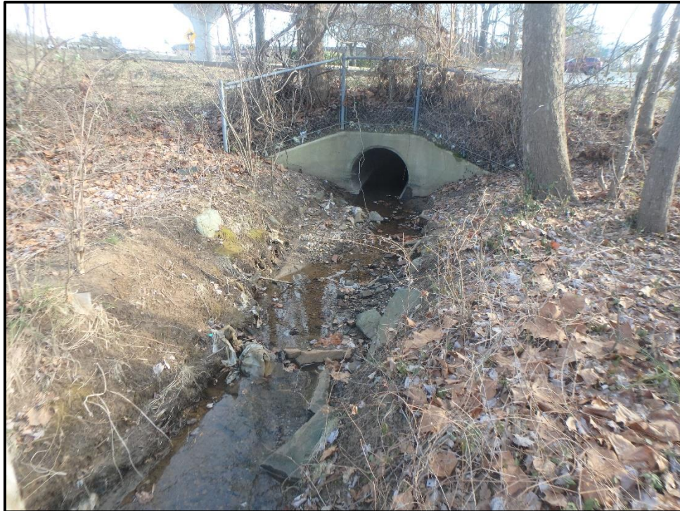
Waters 8MM – Intermittent