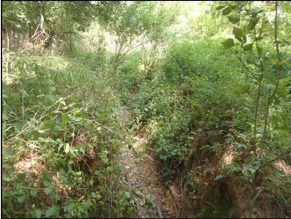
Waters 8G – Ephemeral