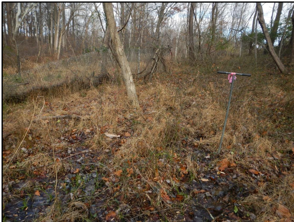
Wetland 12BBBB – PFO