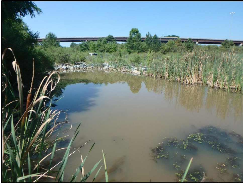
Waters 8D – POW