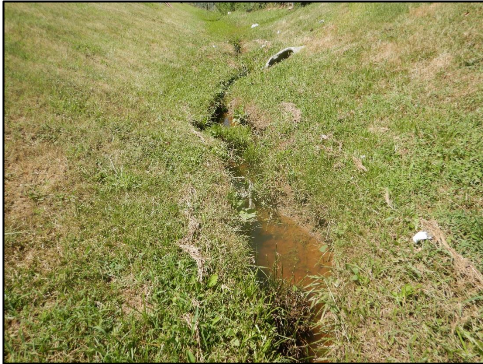
Waters 8T – Ephemeral