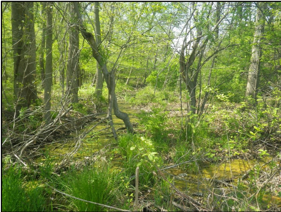
Waters 12BBB – Intermittent