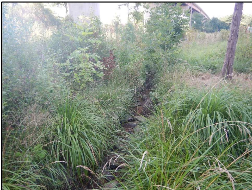
Waters 8A – Intermittent