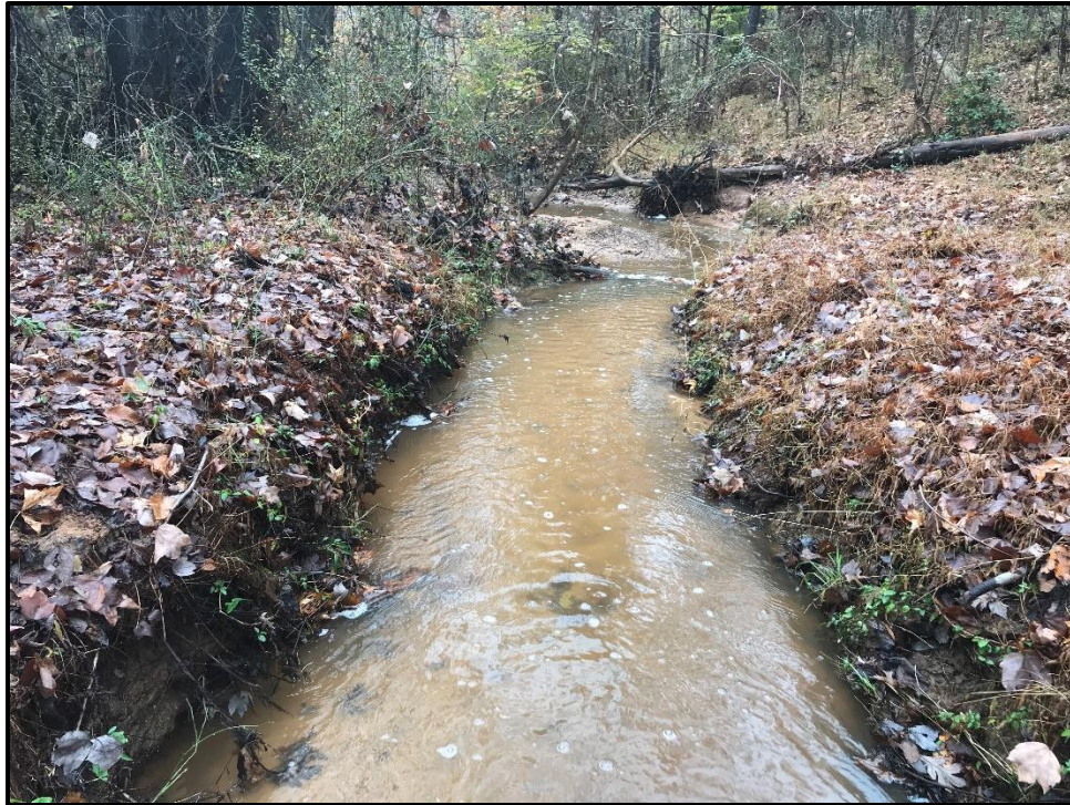
Waters 10QQ – Intermittent