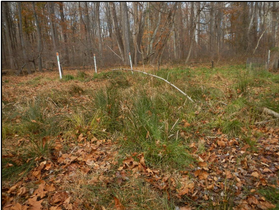
Wetland 12CCCC – PFO