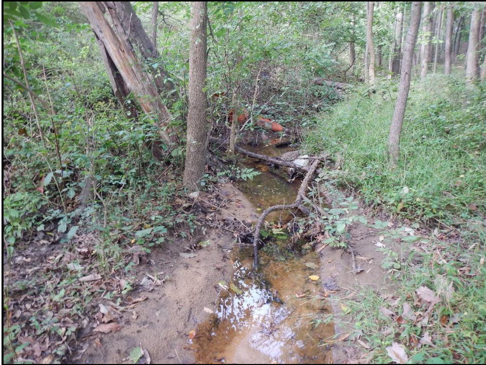
Waters 11Y – Intermittent