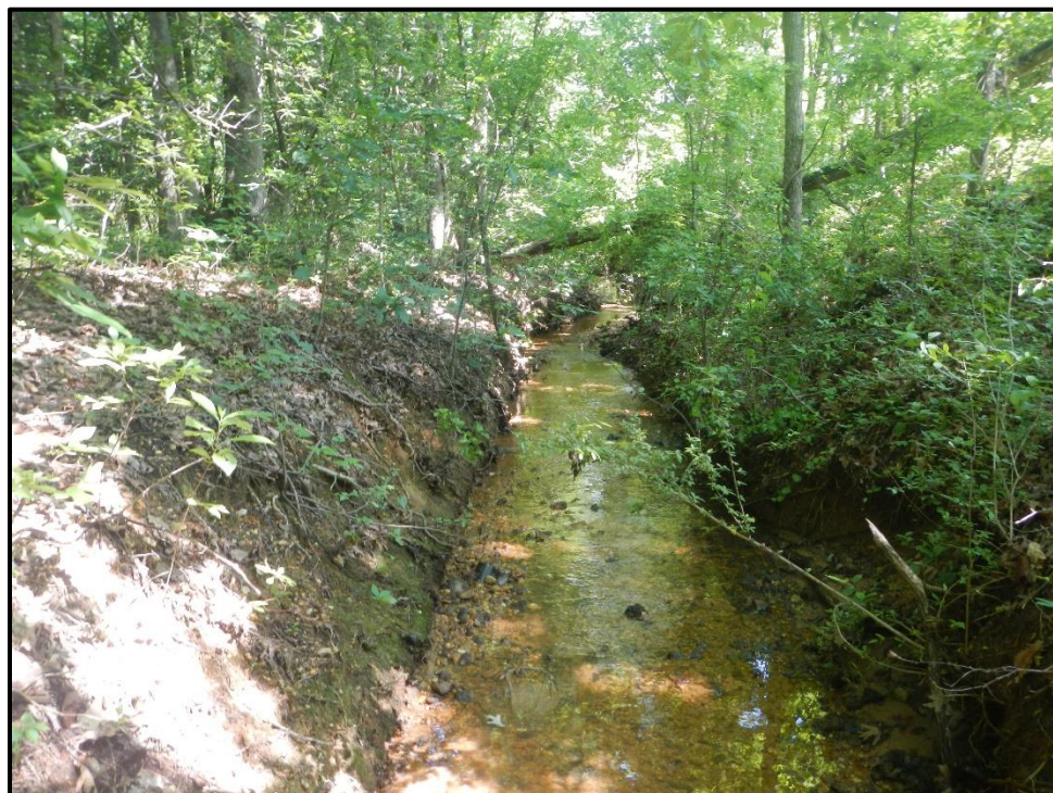
Waters 10BB – Perennial