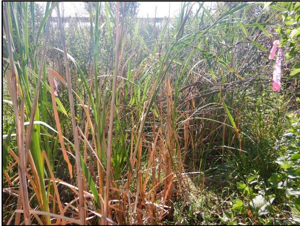
Wetland 8M – PEM