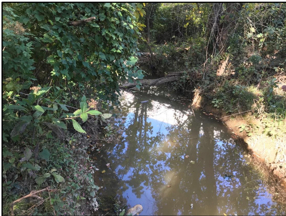
Waters 8AA – Perennial