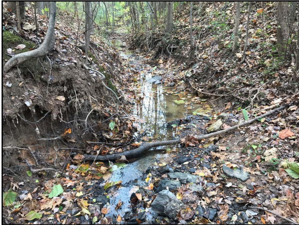
Waters 10LL – Intermittent