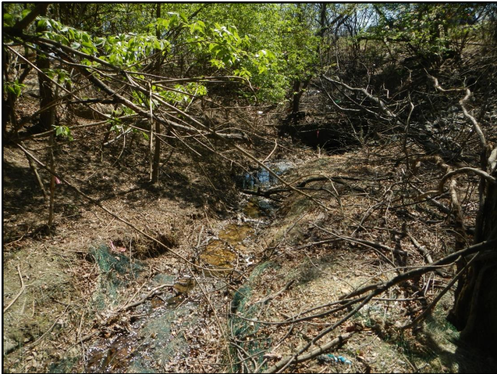
Waters 12EE – Intermittent