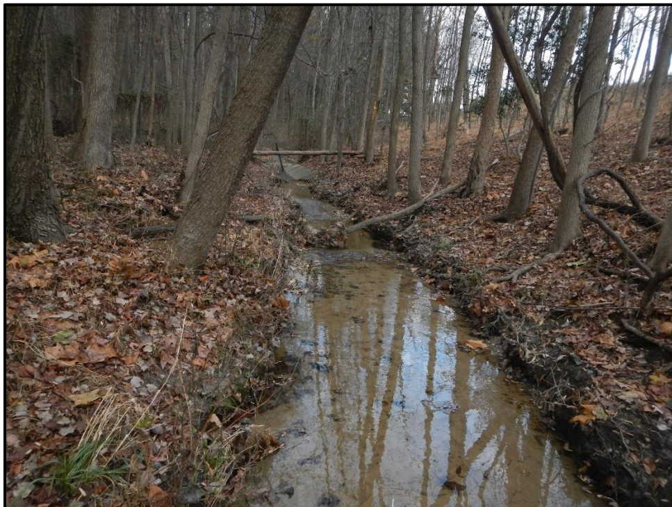
Waters 12EEEE – Perennial