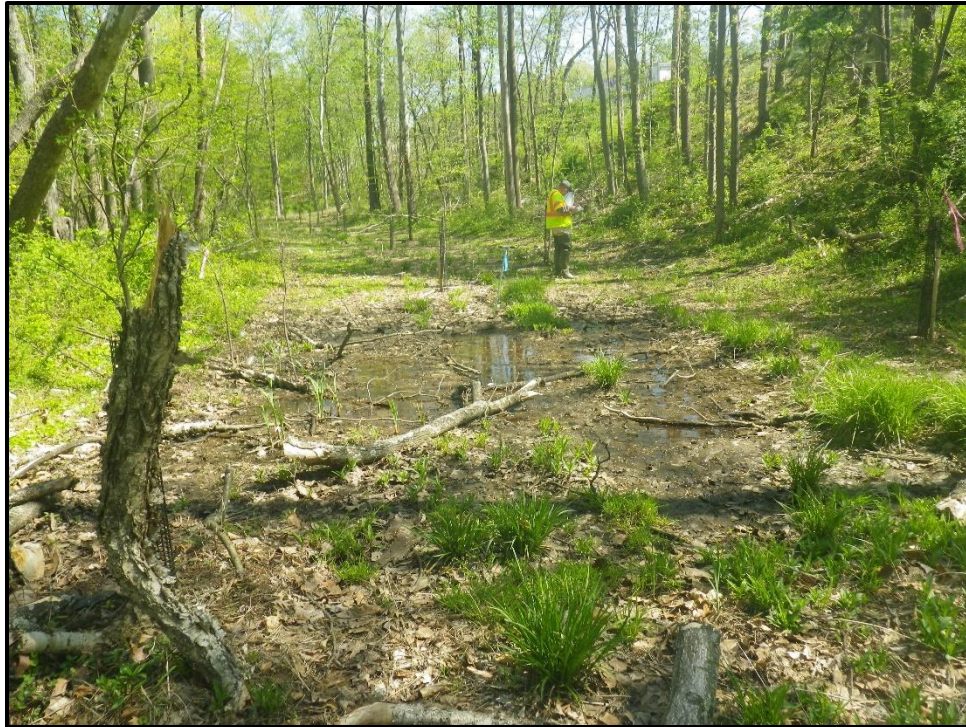
Wetland 12VV – PEM