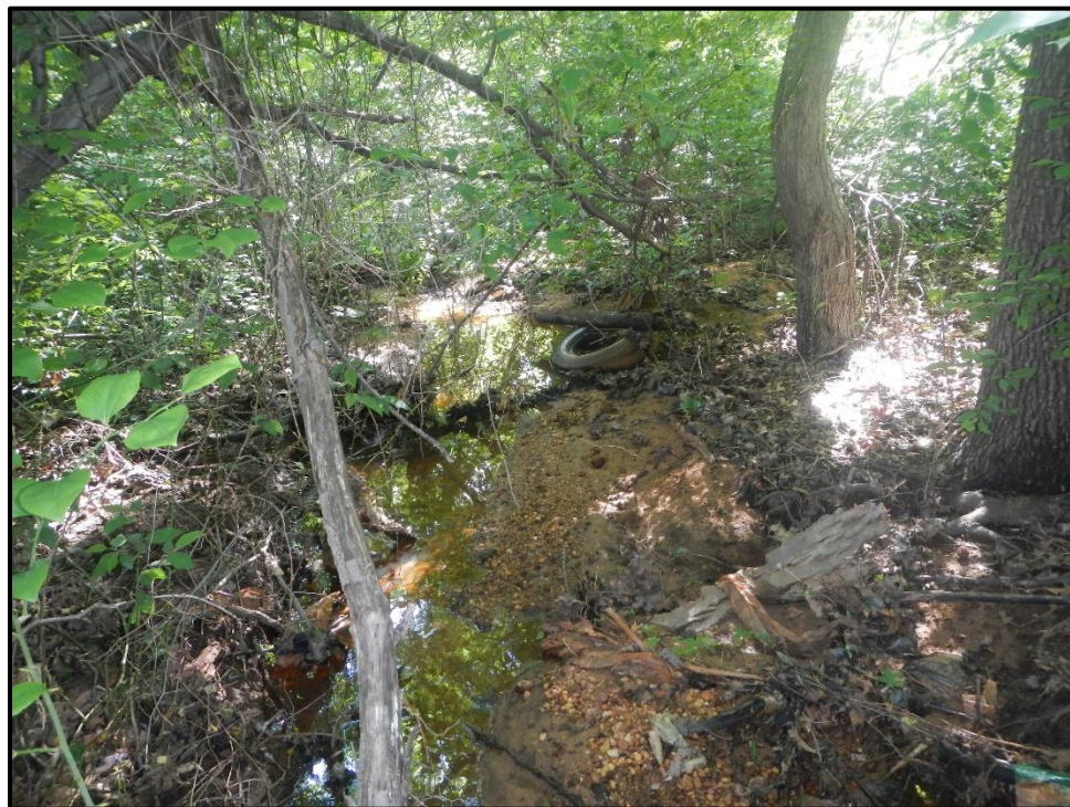
Waters 10AA – Perennial