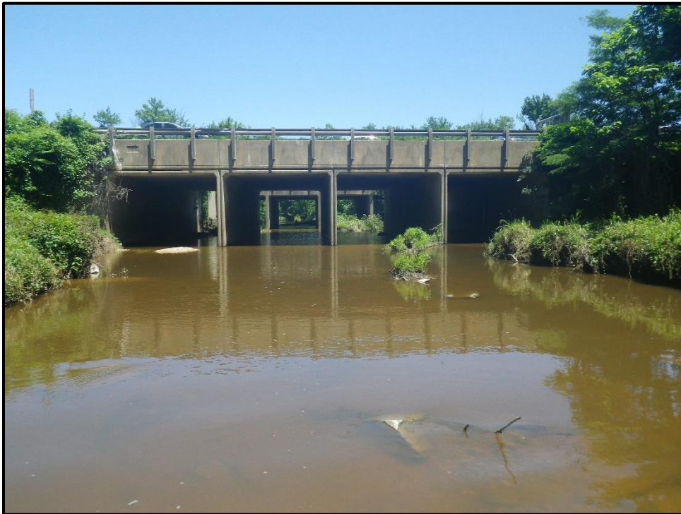
Waters 11L – Perennial