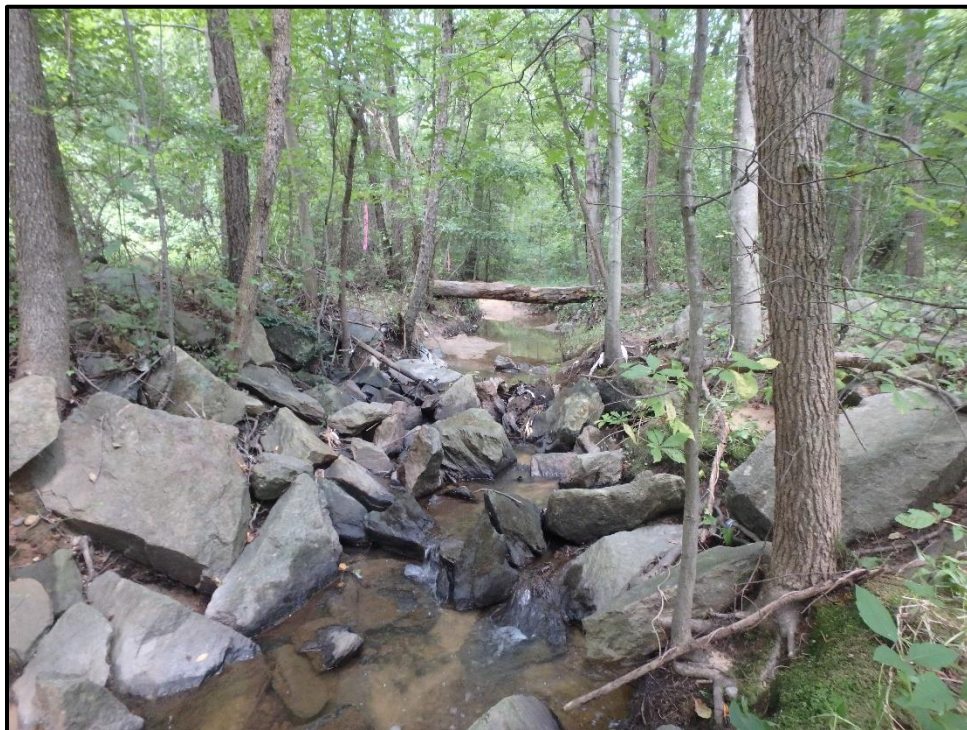
Waters 9Y – Perennial