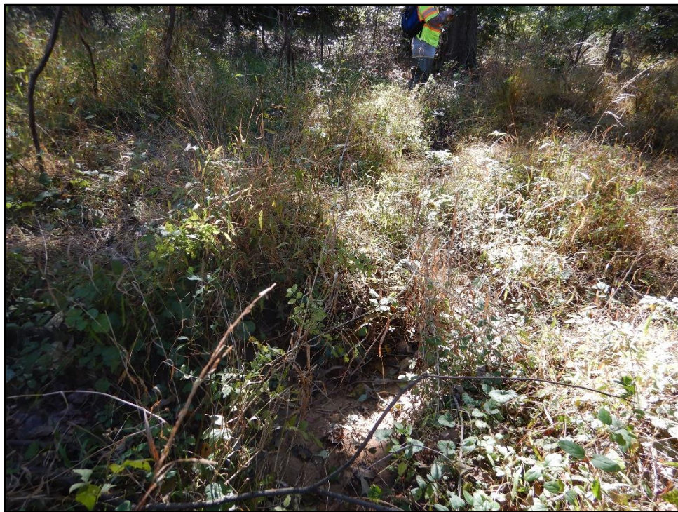
Waters 11GG – Ephemeral