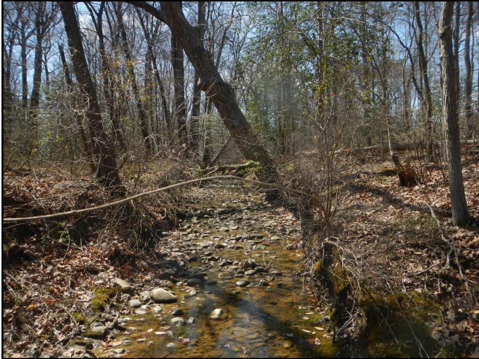
Waters 12H – Perennial