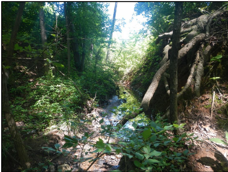
Waters 10N – Intermittent