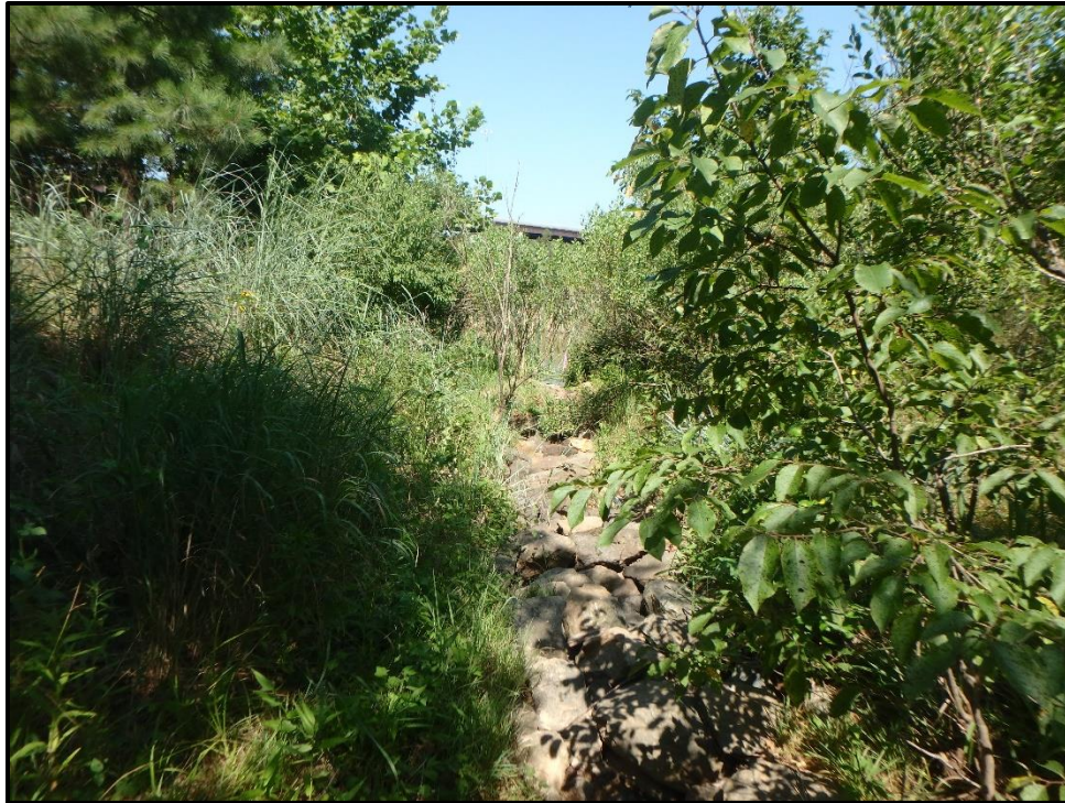
Waters 8E – Ephemeral/Intermittent