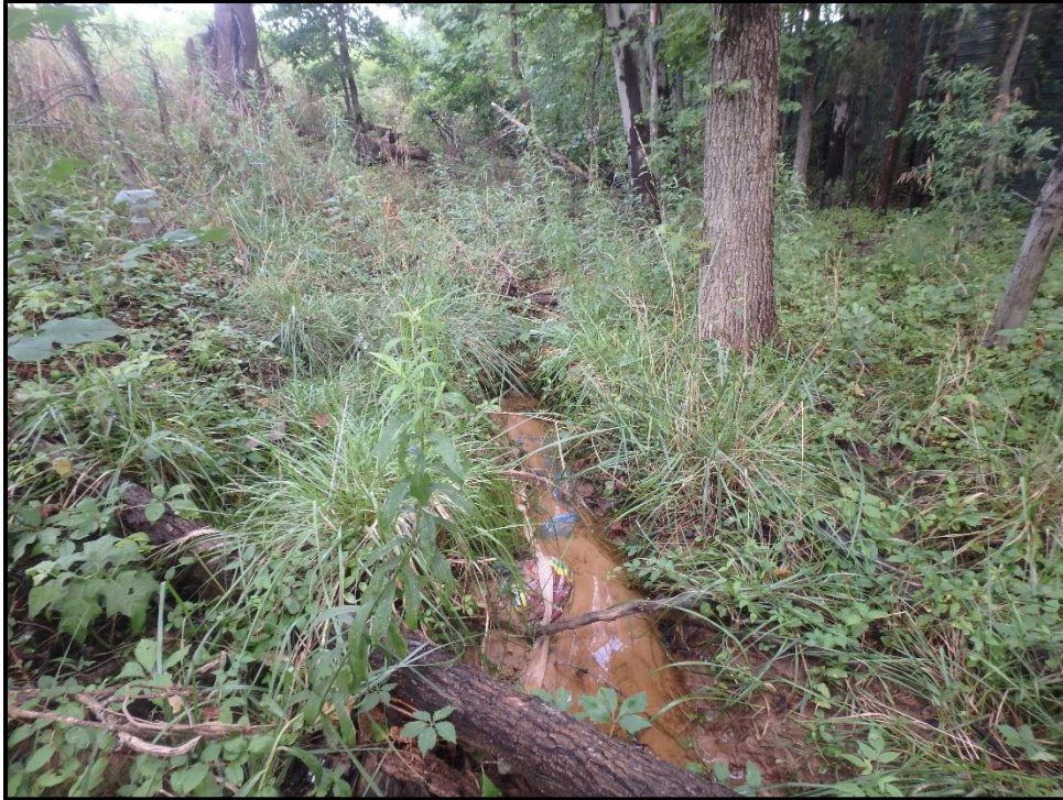
Waters 9M – Intermittent