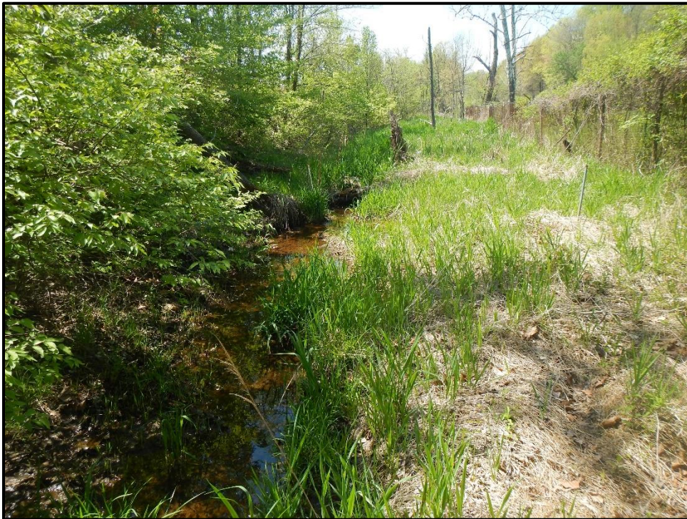
Wetland 12SS – PEM