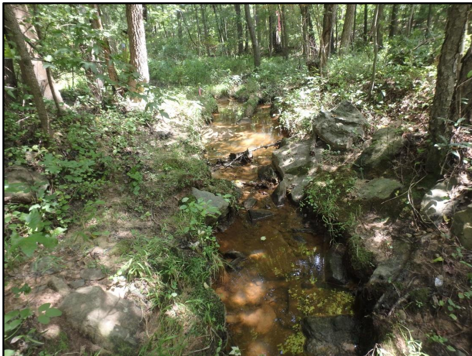
Waters 9II – Intermittent