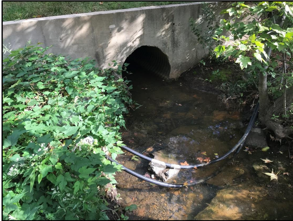
Waters 8X – Intermittent