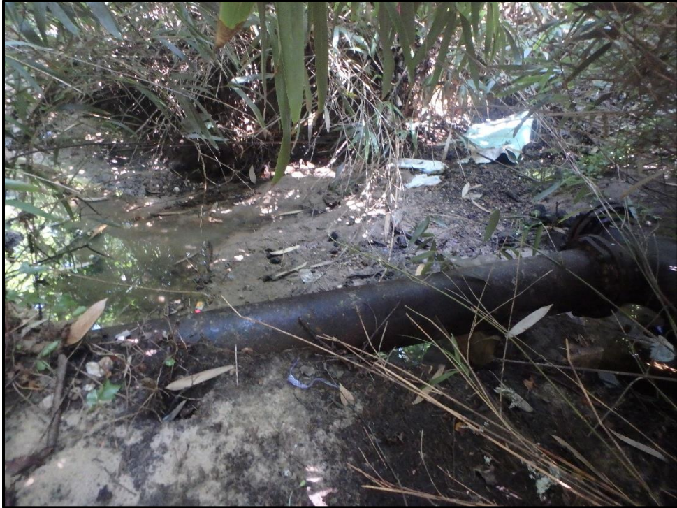
Waters 9U – Intermittent