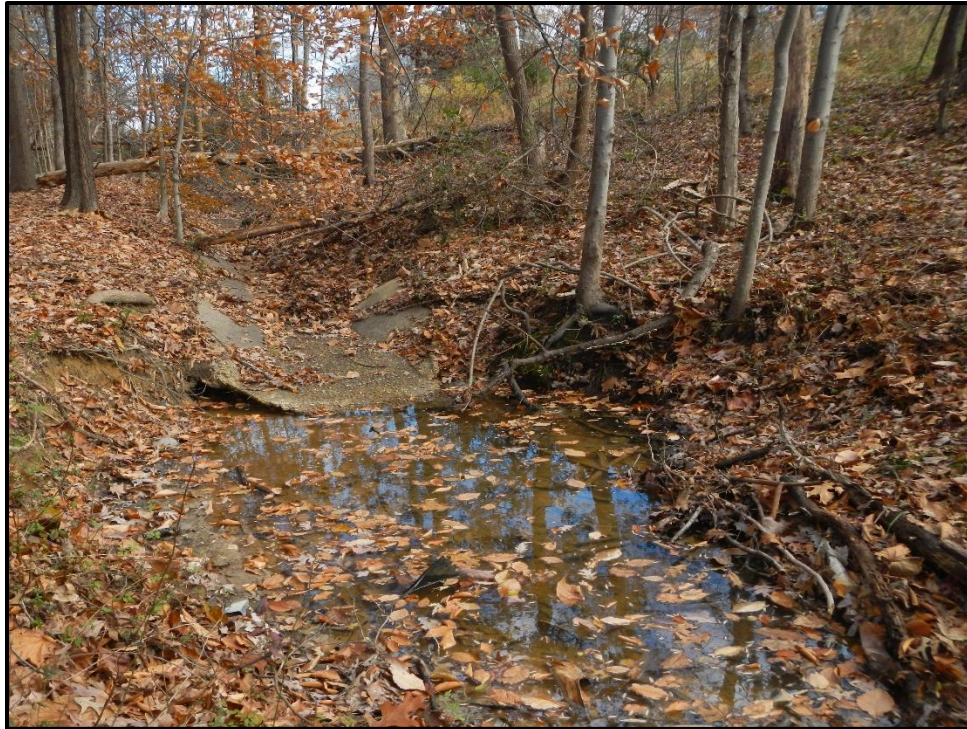
Wetland 12AAAA – Intermittent