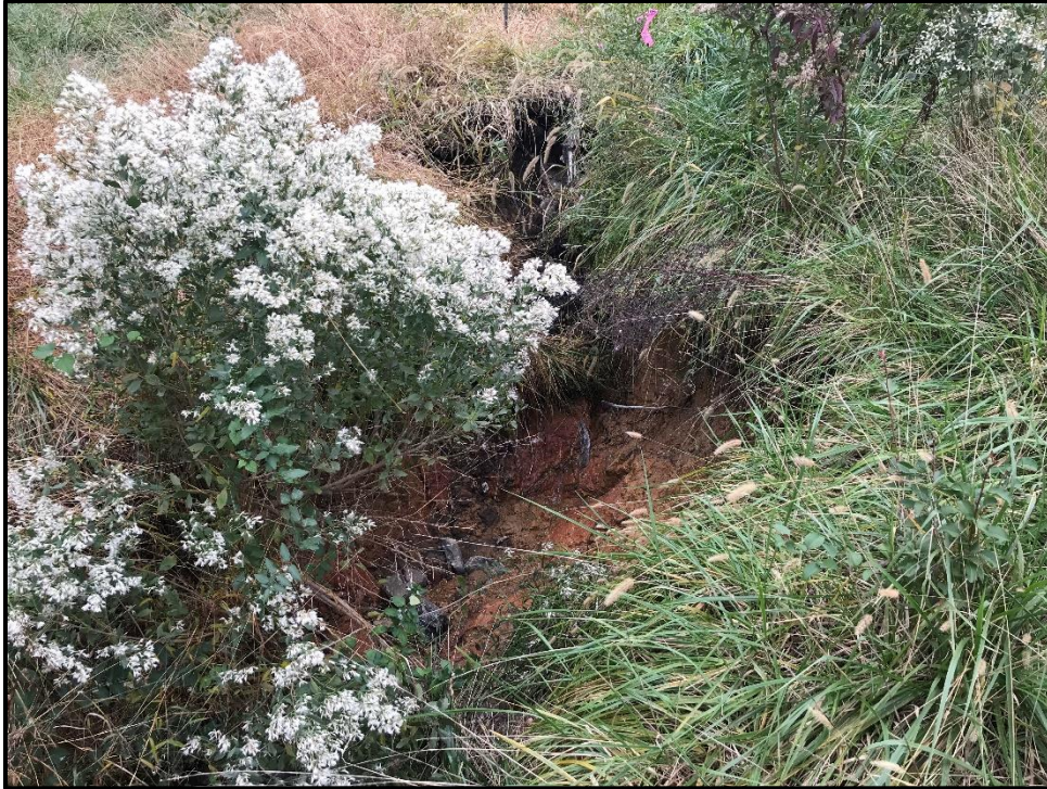
Waters 7NN – Ephemeral