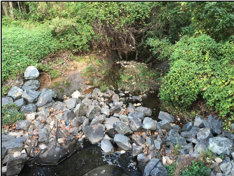
Waters 8W – Intermittent