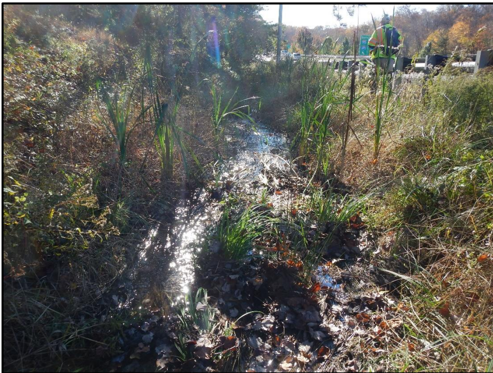
Waters 12YYY – Perennial