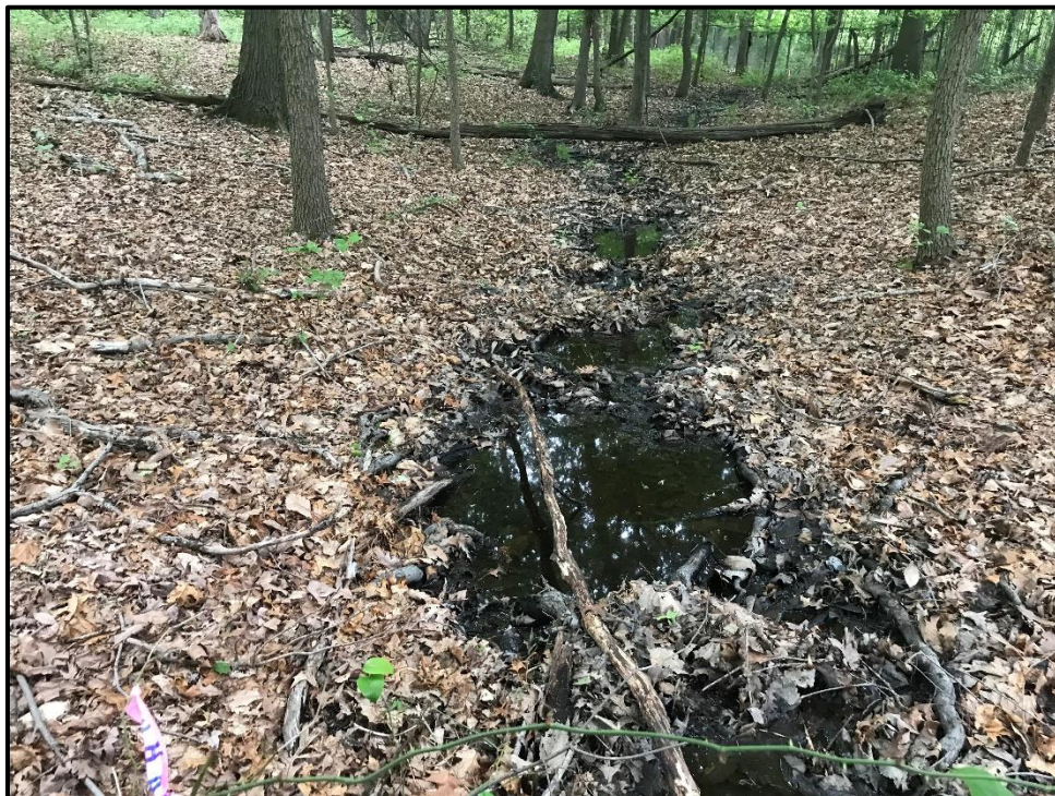
Waters 12HHHH – Intermittent