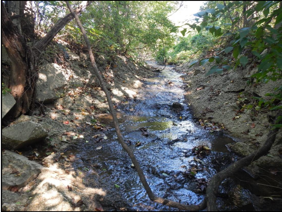
Waters 10YY – Perennial