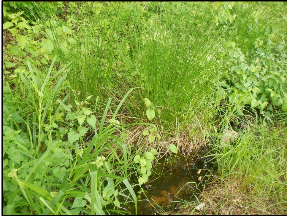
Wetland 10W – PEM