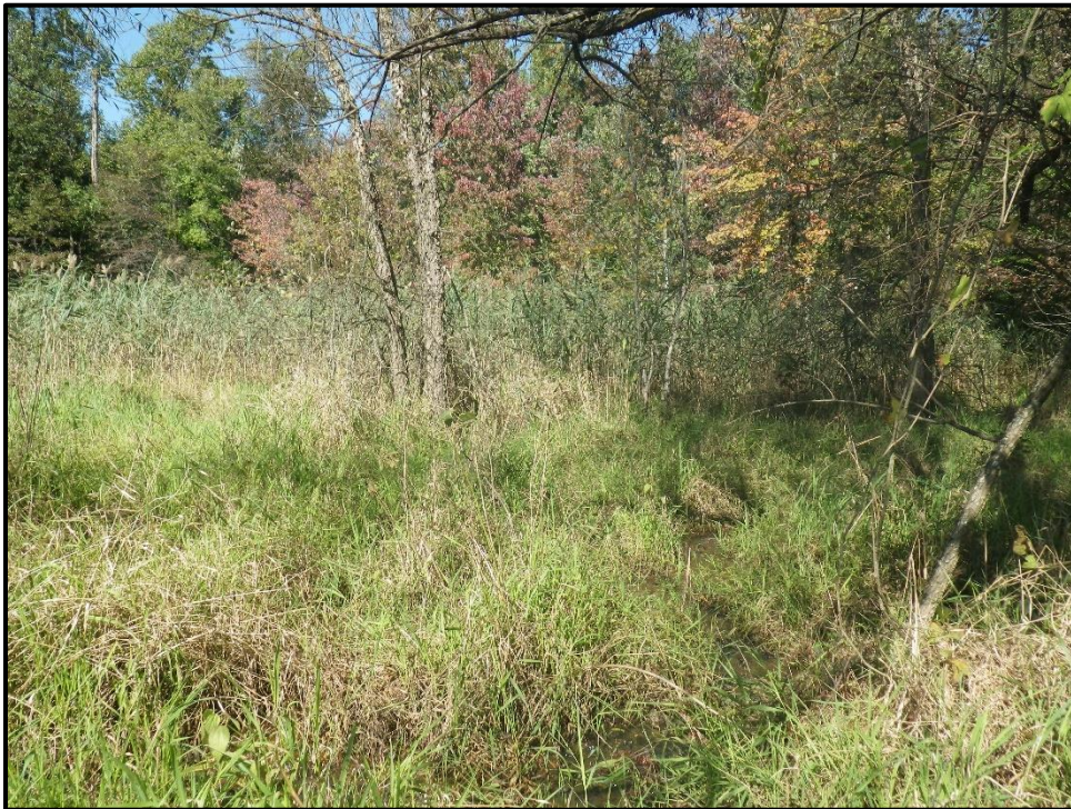
Wetland 12SSS – PFO