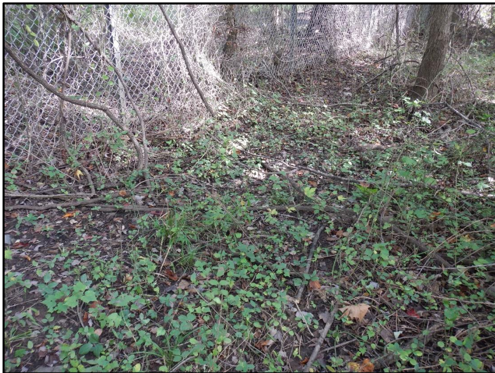
Wetland 11EE – PFO