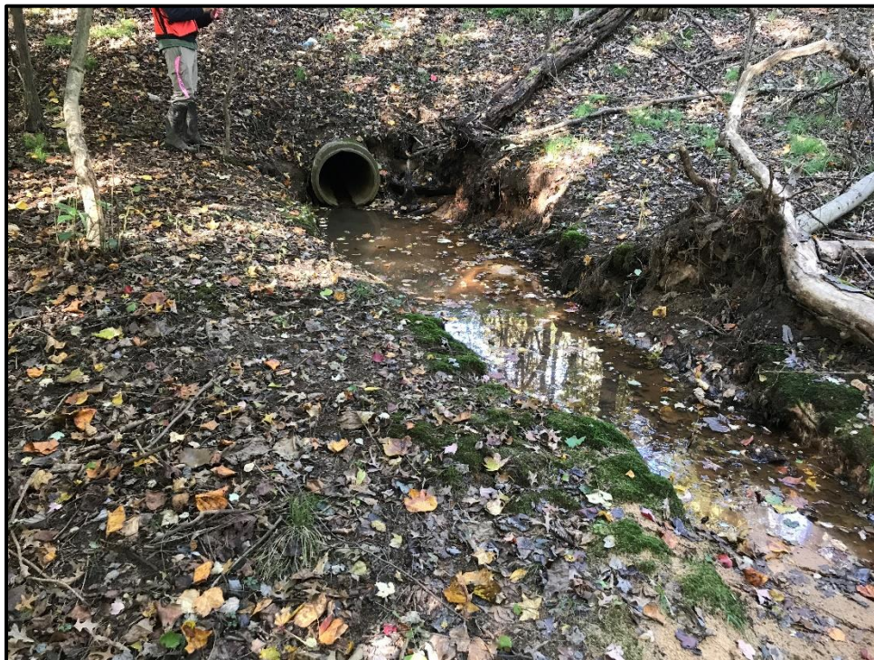
Waters 8GG – Intermittent