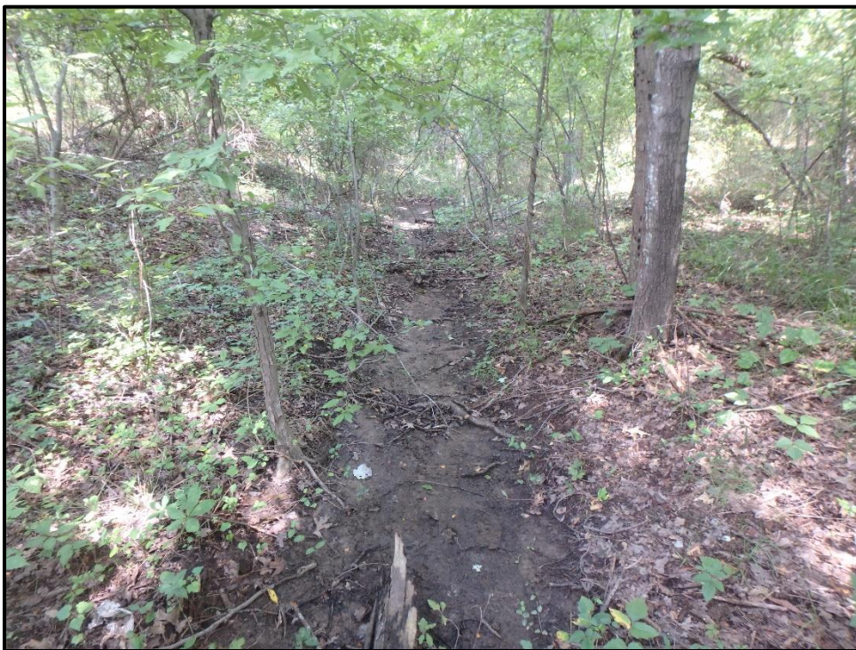
Waters 9FF – Ephemeral