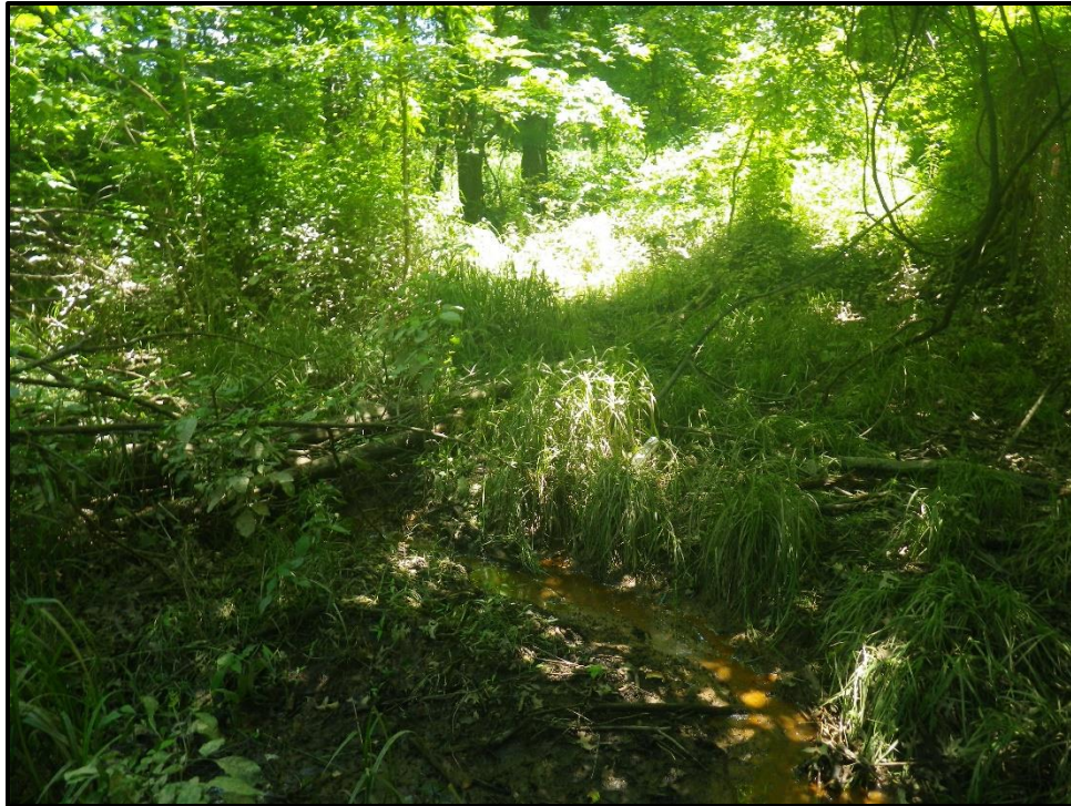
Wetland 11I – PFO