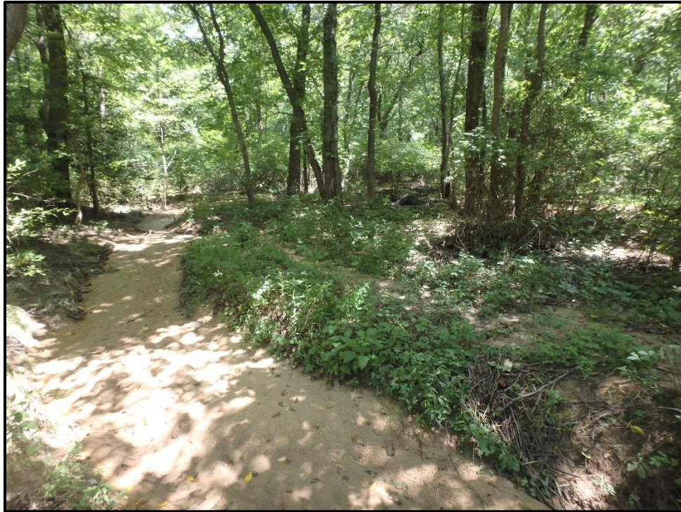
Wetland 9HH – PFO