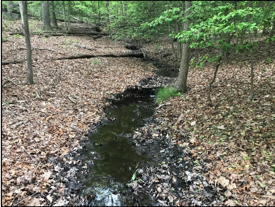
Waters 12HHHH – Intermittent