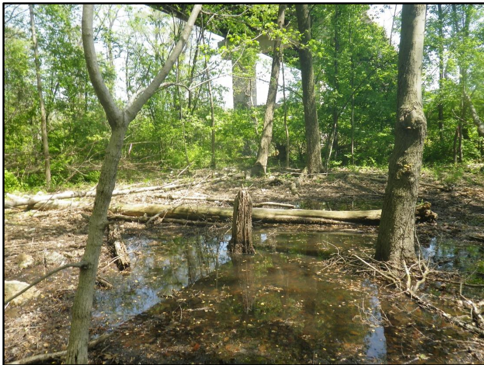
Wetland 12YY – PFO