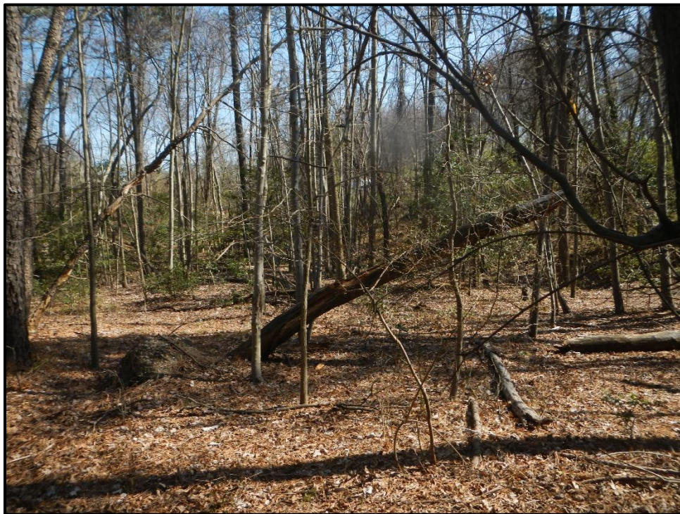
Wetland 12Q - PFO