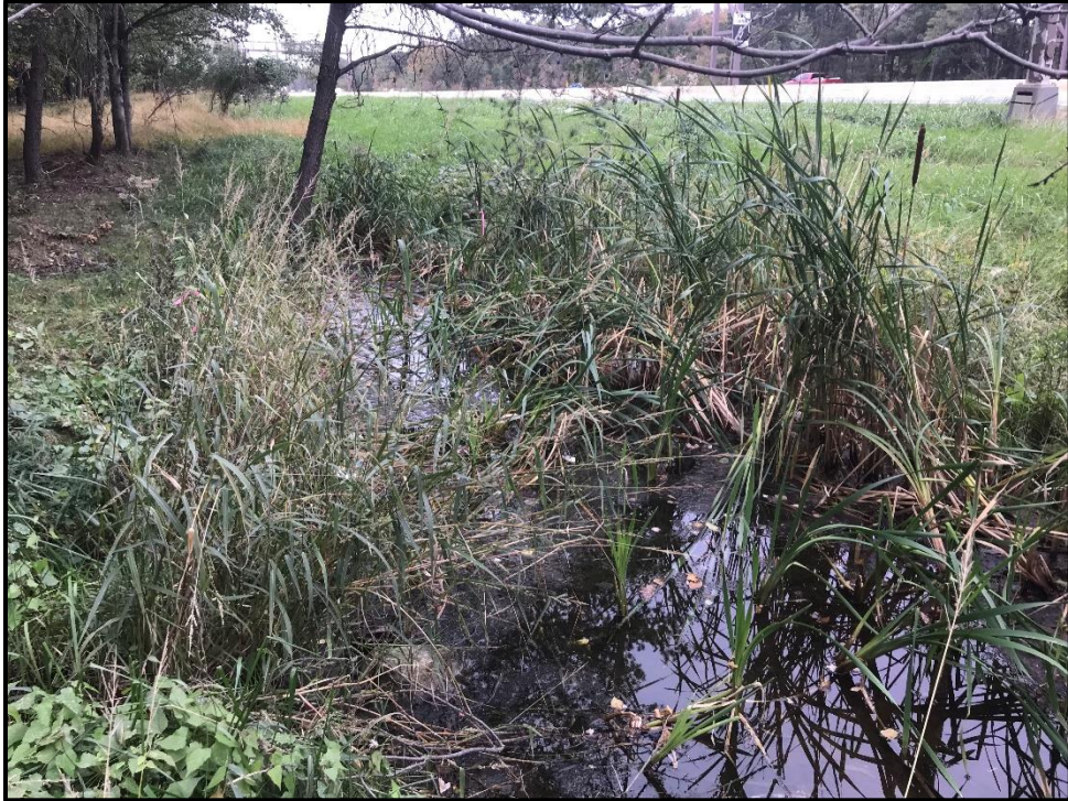
Wetland 7RR – PEM