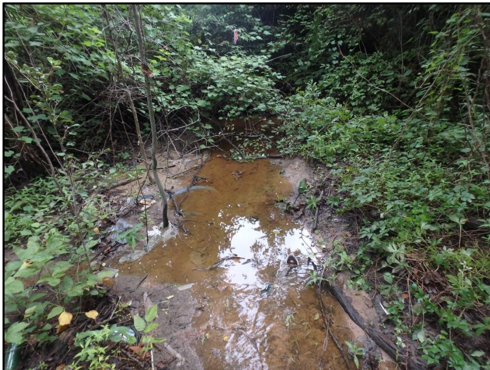
Waters 8S – Ephemeral