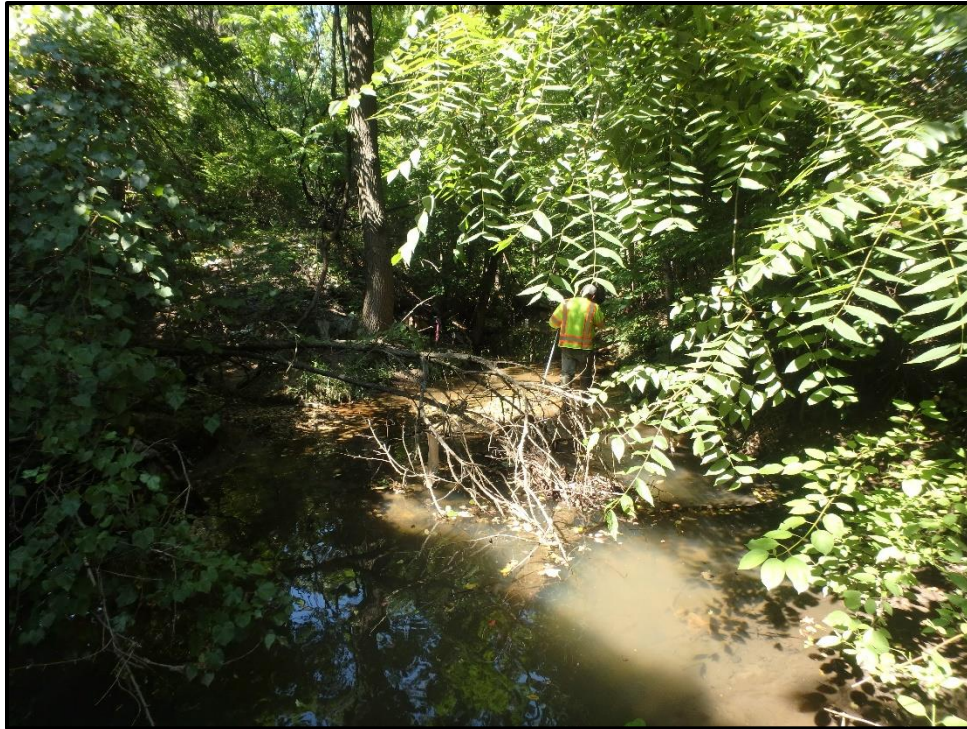
Waters 7O – Perennial