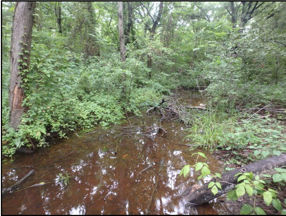
Wetland 9D – PFO