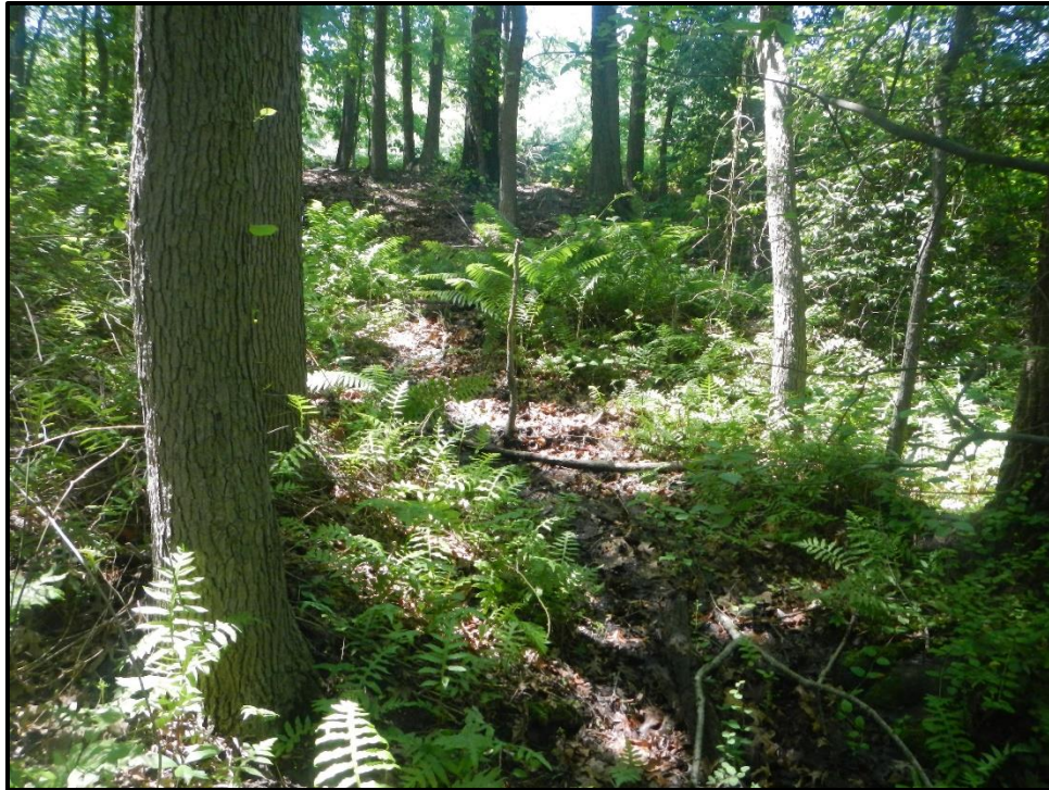
Wetland 10P – PFO