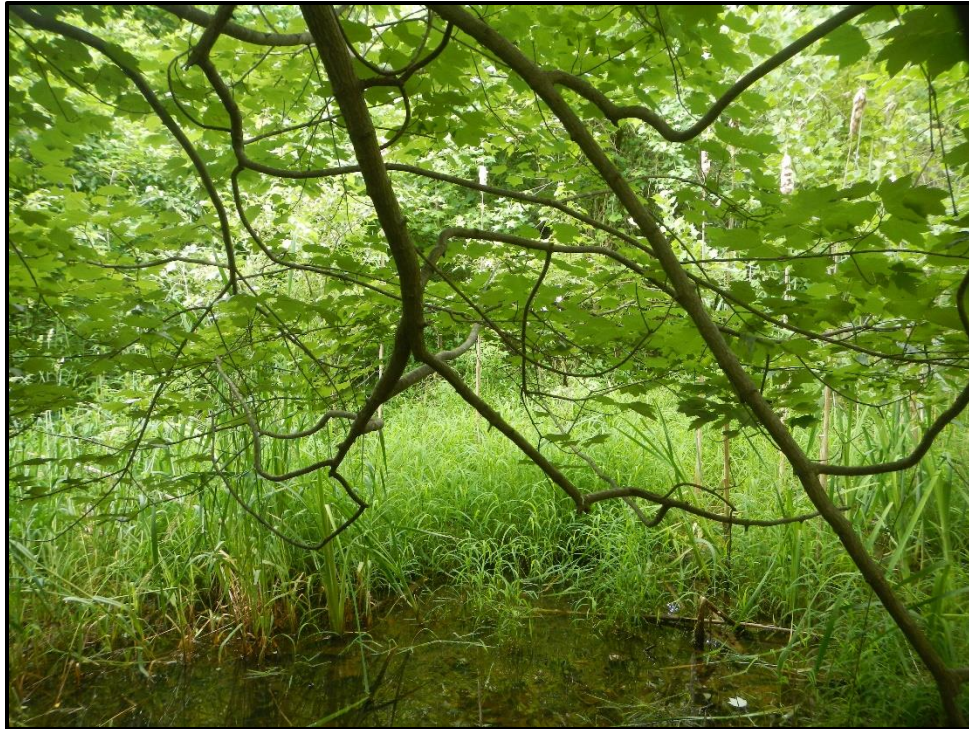
Wetland 11F – PEM