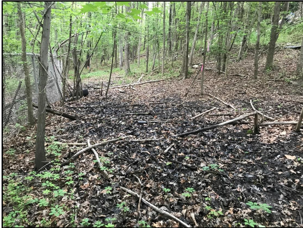
Wetland 12PPPP – PFO