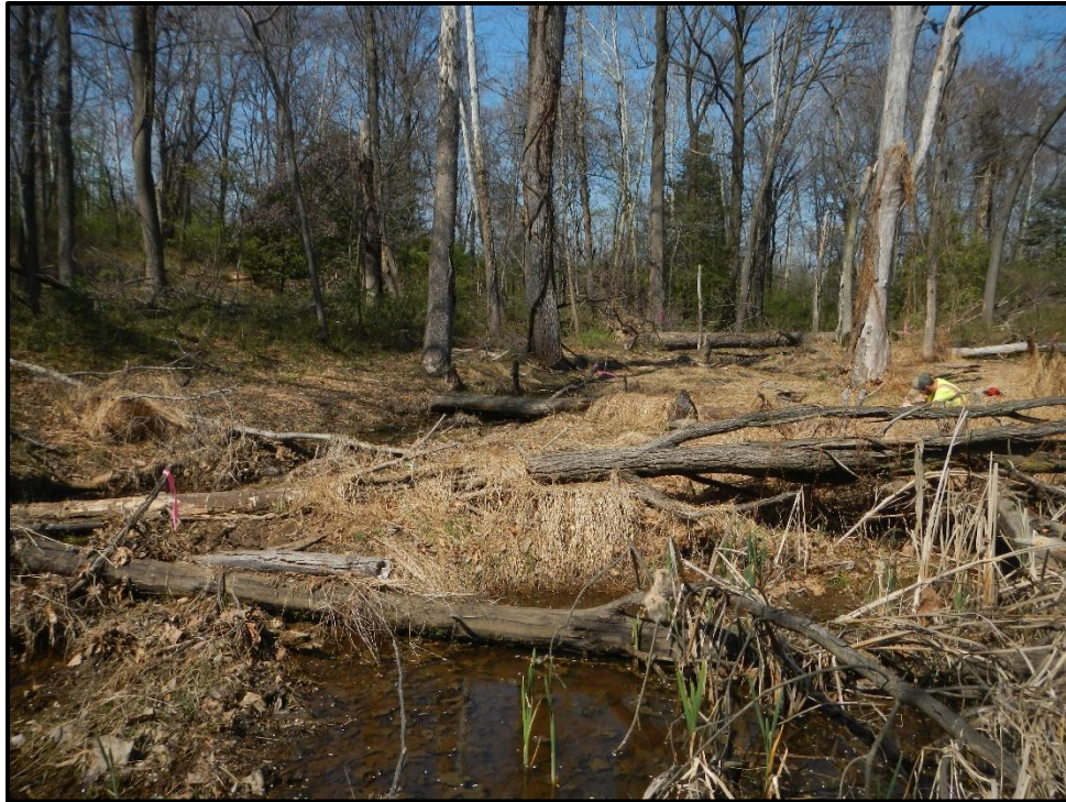
Wetland 12JJ - PEM