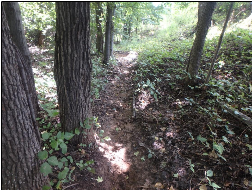
Waters 9P – Ephemeral

Wetland 9PP – PFO – Access denied to property, no photo available.