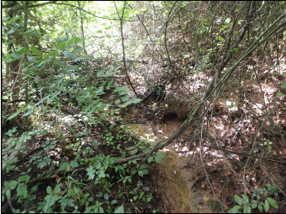
Waters 9O – Ephemeral