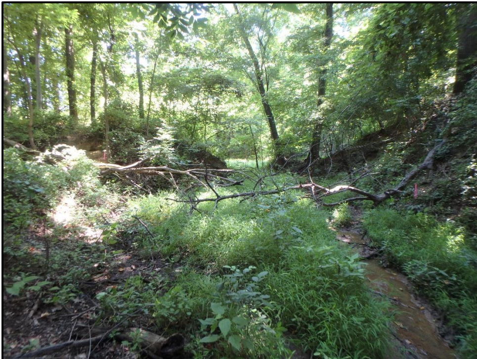
Wetland 7Z – PFO