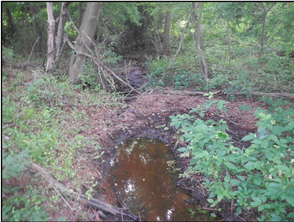
Waters 10Q – Ephemeral