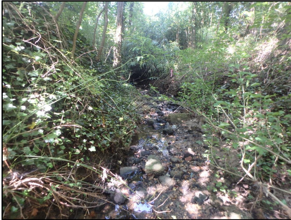
Waters 9T – Intermittent