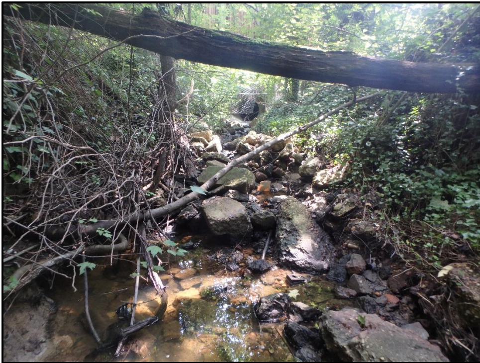
Waters 9T – Intermittent