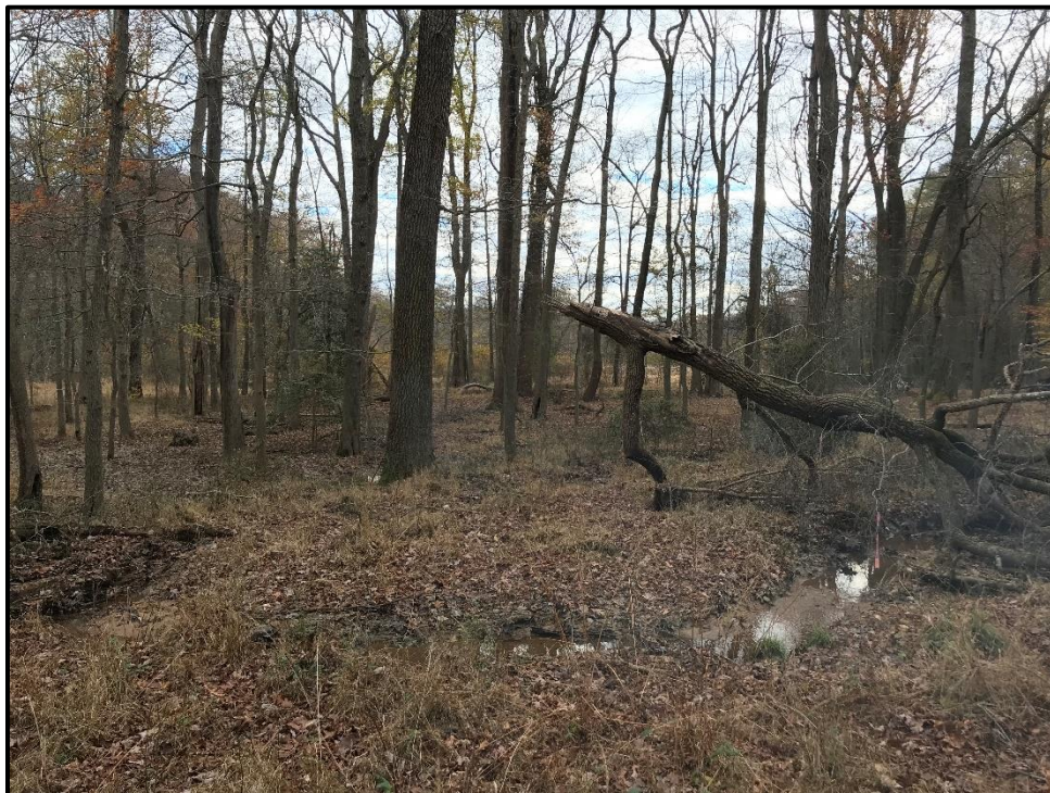
Wetland 10WW – PFO