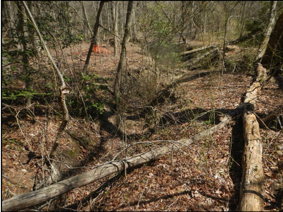
Waters 12M – Intermittent