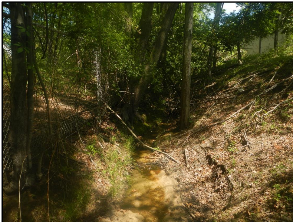
Waters 12NNN – Intermittent