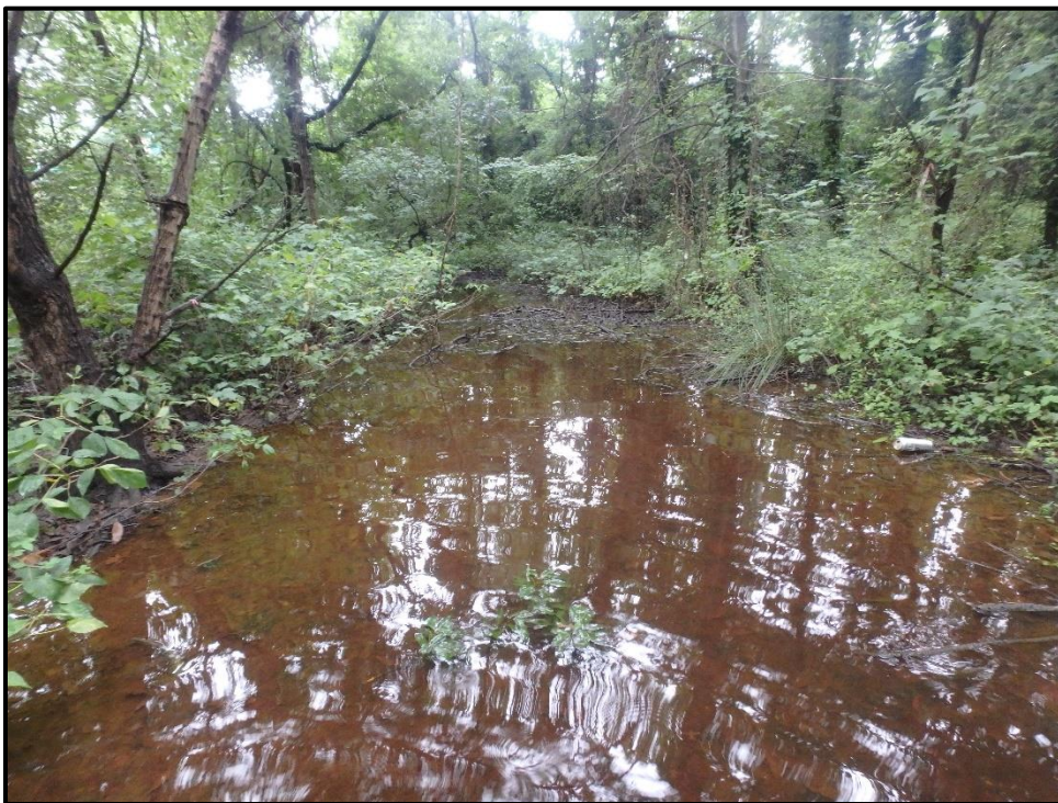
Wetland 9D – PFO