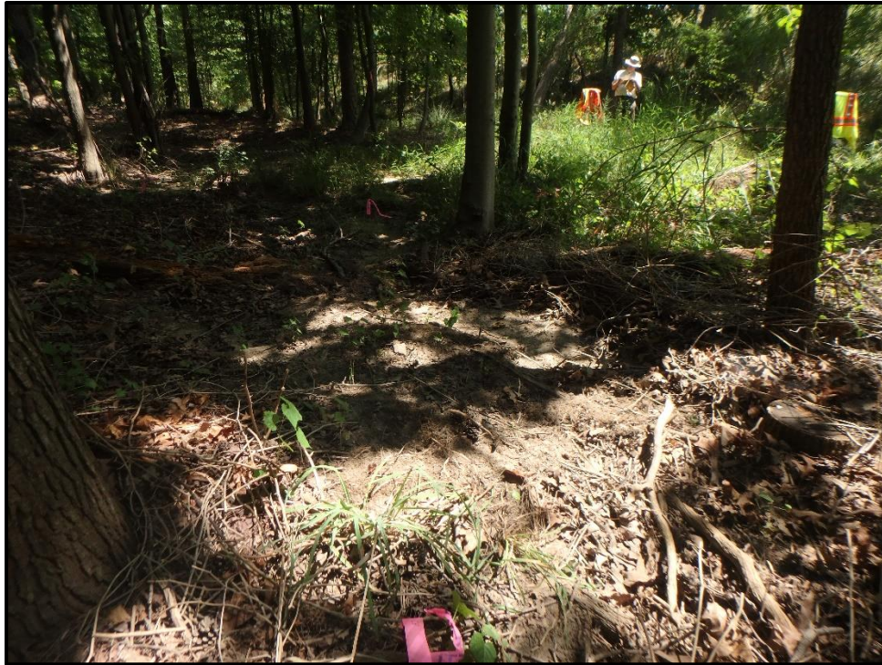
Waters 8I – Ephemeral