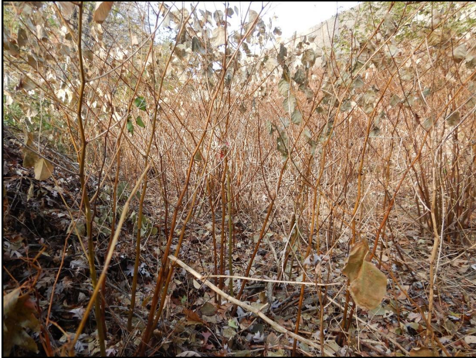
Wetland 9SS – PFO