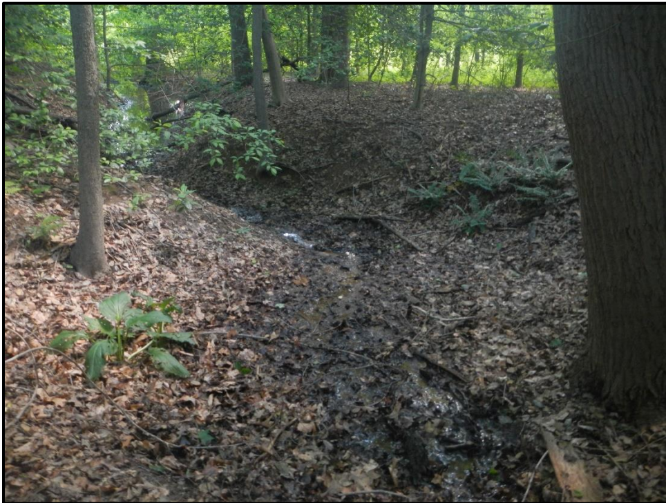
Waters 10CC – Intermittent