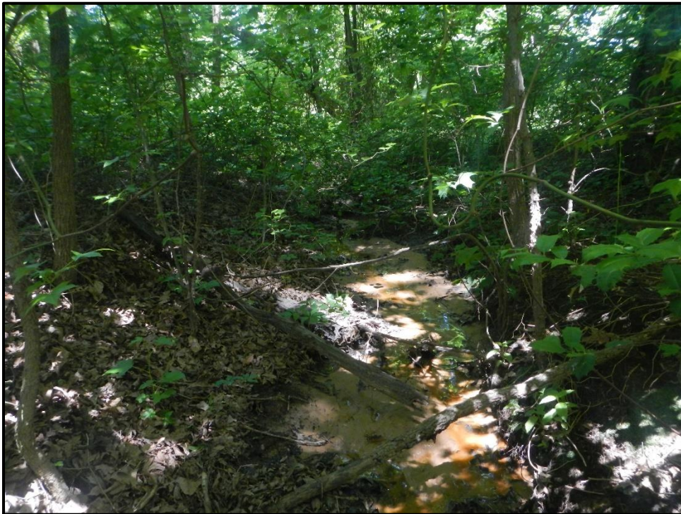
Waters 10O – Ephemeral