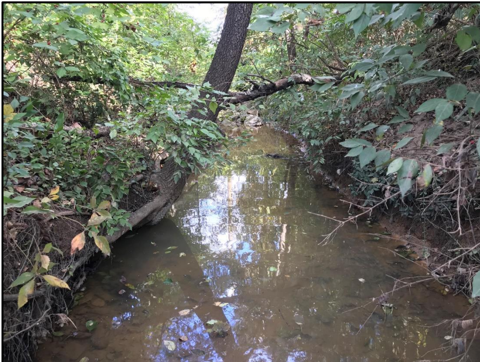
Waters 8BB – Perennial