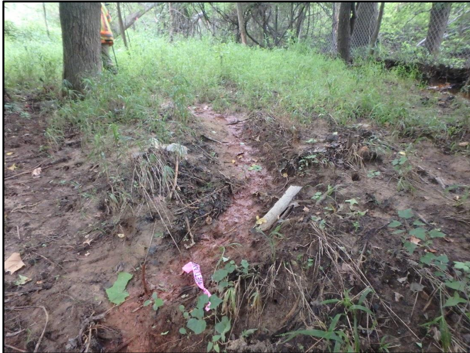
Waters 7V – Ephemeral