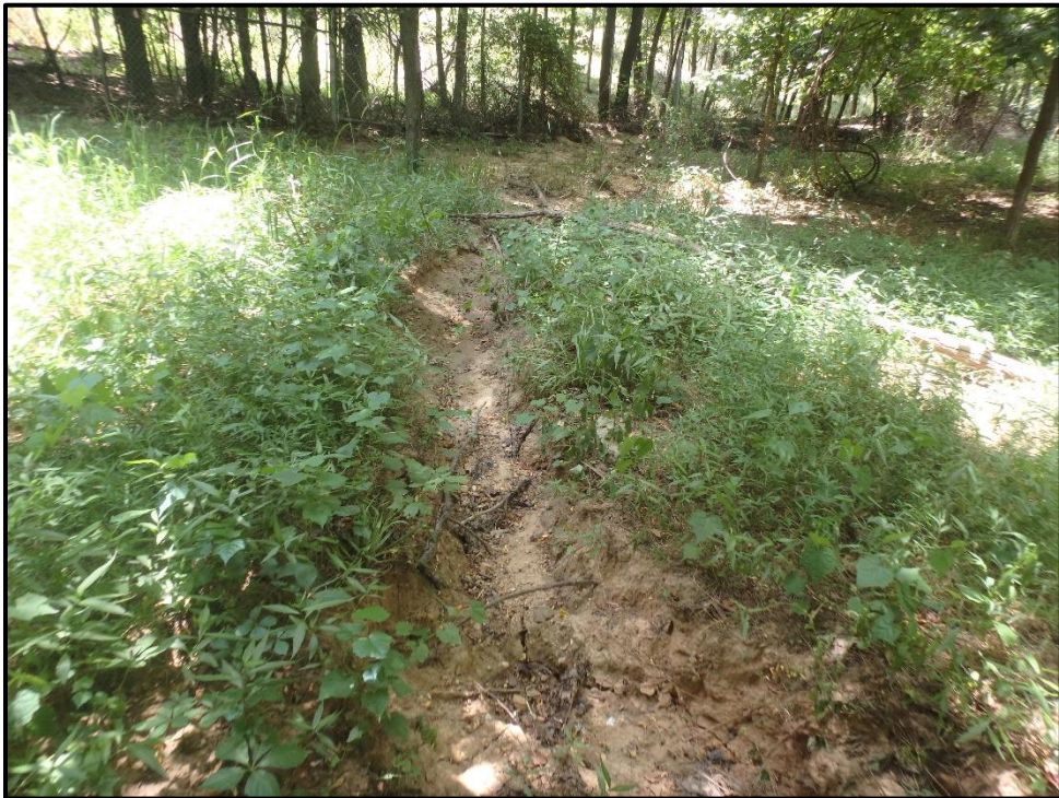
Waters 8G – Ephemeral