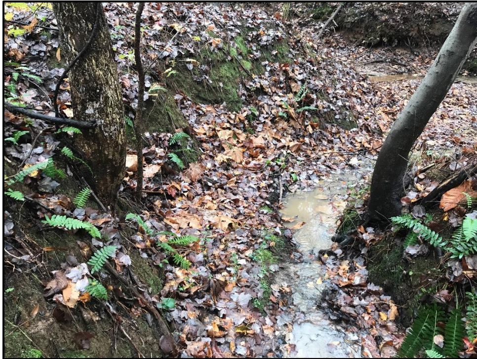
Waters 10RR – Ephemeral