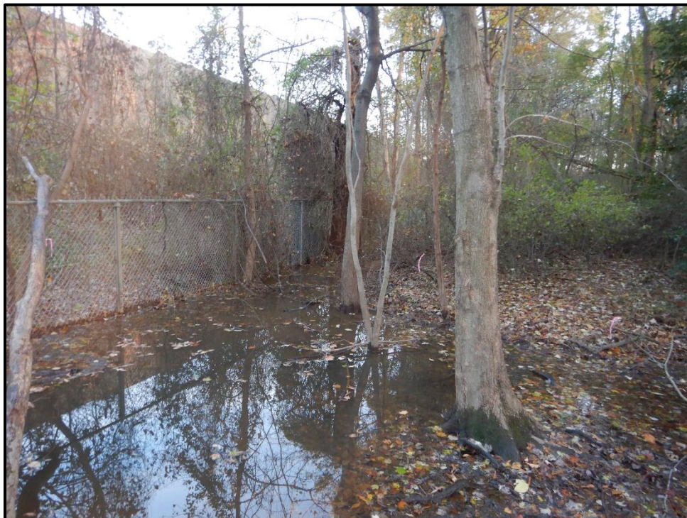
Wetland 9TT – PFO