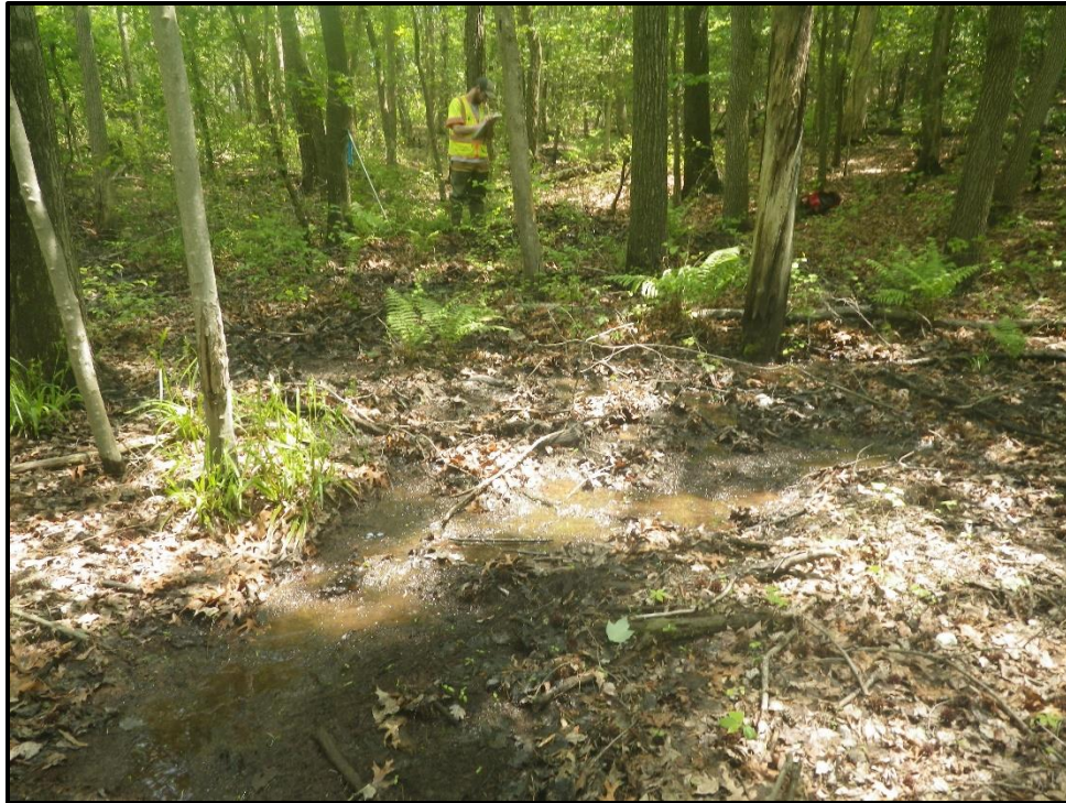
Wetland 10I - PFO