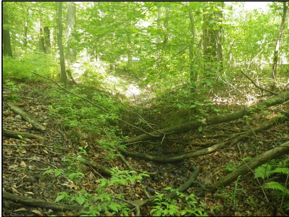
Waters 10G – Ephemeral