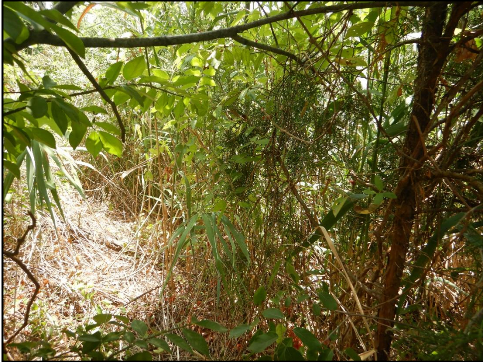
Wetland 8P – PSS