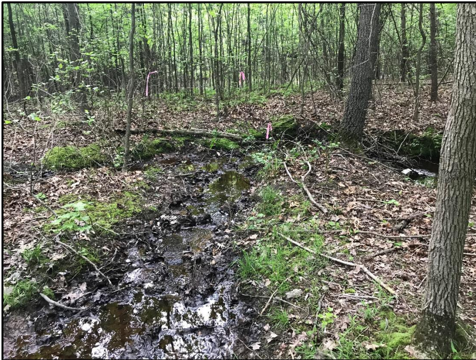
Waters 12LLLL - Intermittent