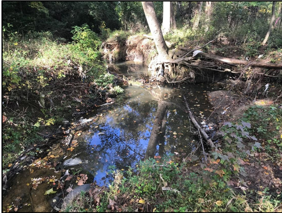
Waters 7S – Perennial

Waters 7SS – Intermittent – Access denied to property, no photo available.