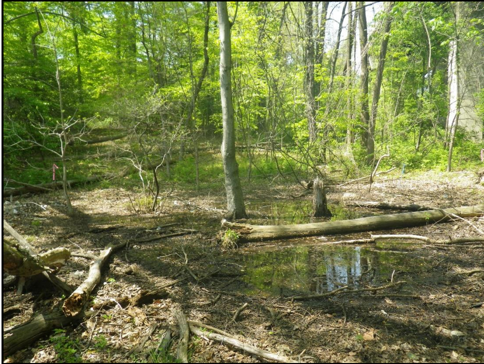
Wetland 12YY – PFO