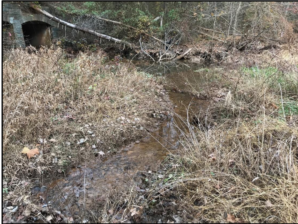
Waters 10UU – Intermittent