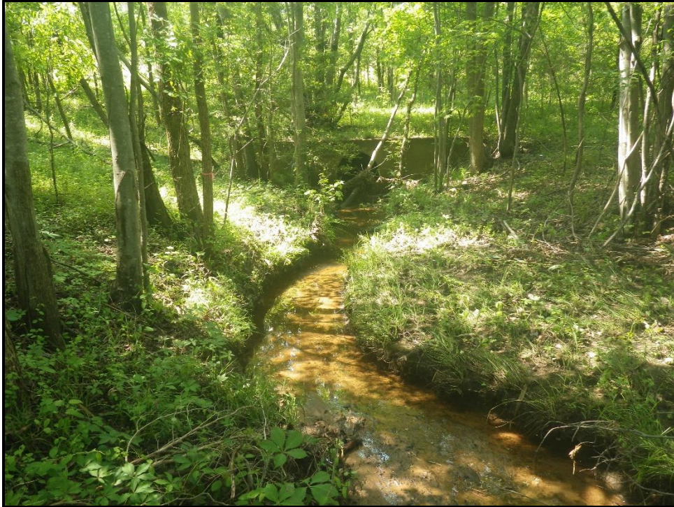
Waters 10C – Perennial