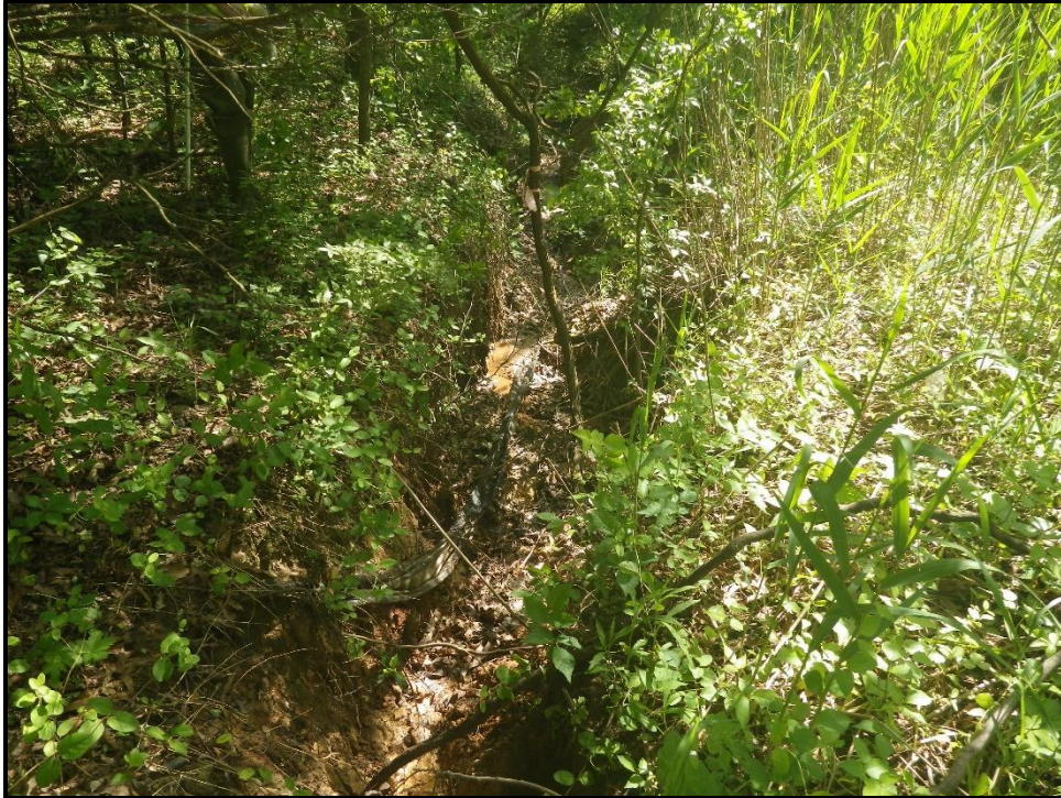
Waters 10K – Intermittent