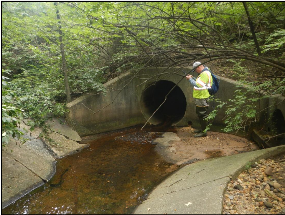
Waters 11T – Perennial