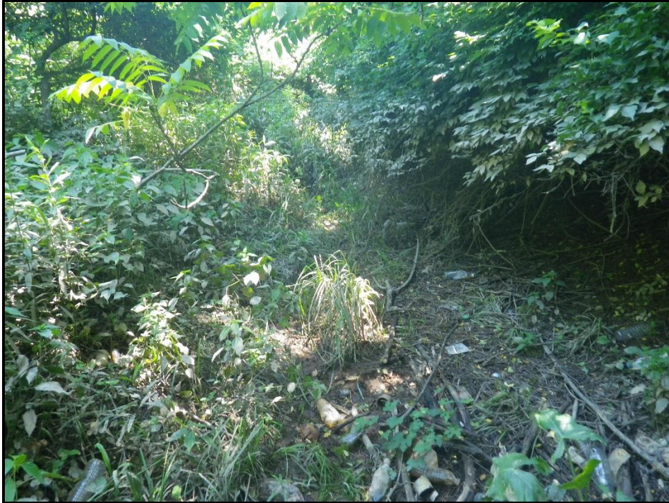
Wetland 11K - PFO