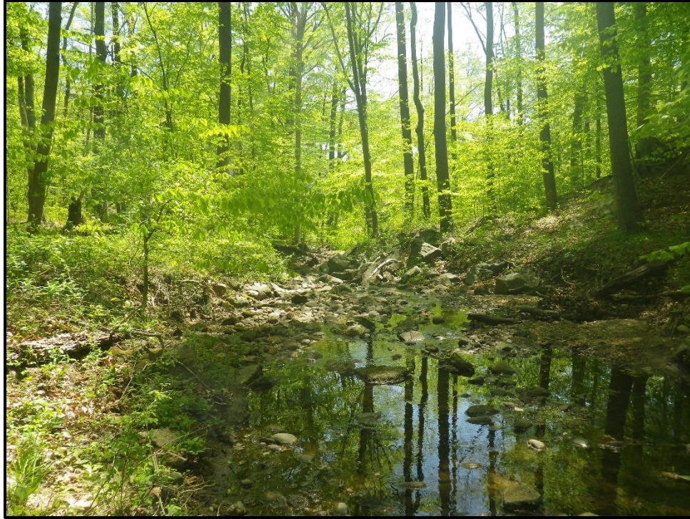
Waters 12XX – Perennial