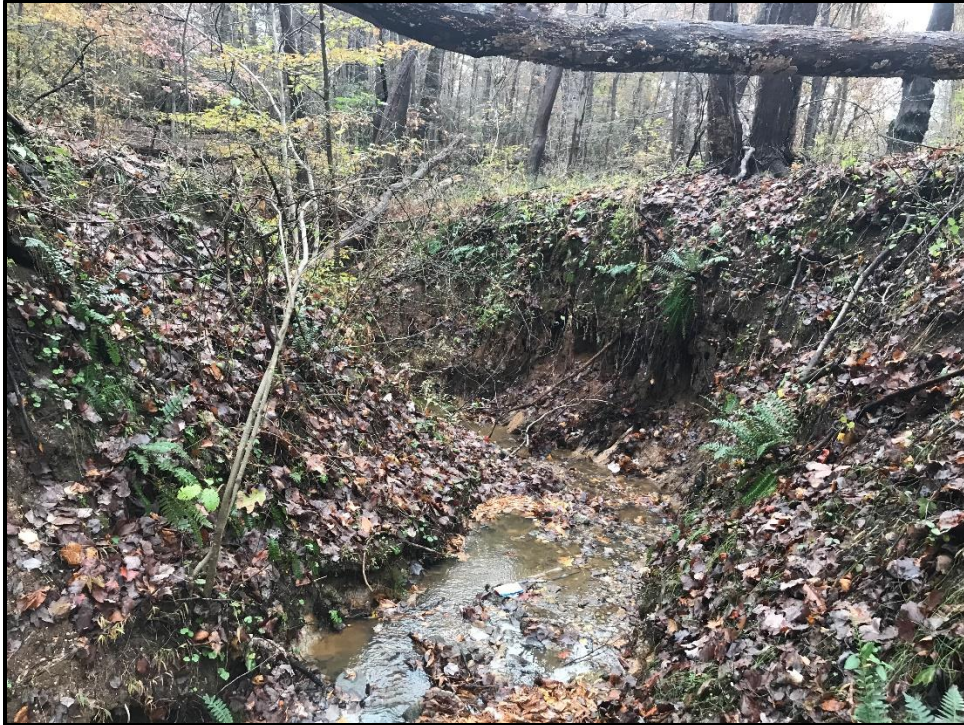
Waters 10SS – Intermittent