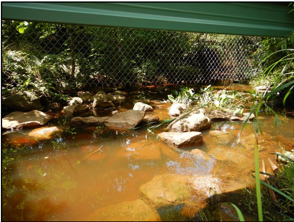
Waters 9J – Perennial