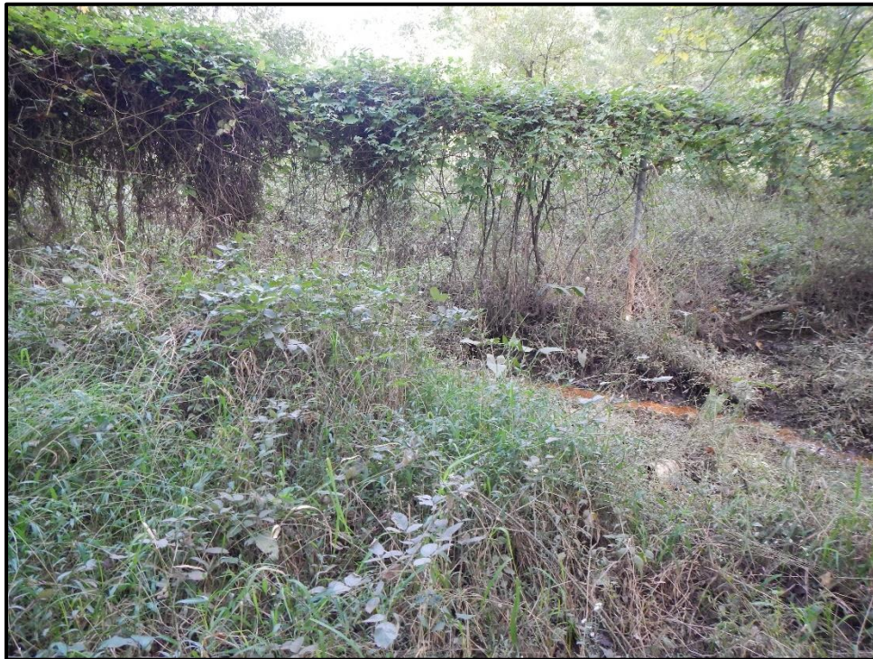
Wetland 11DD - PEM