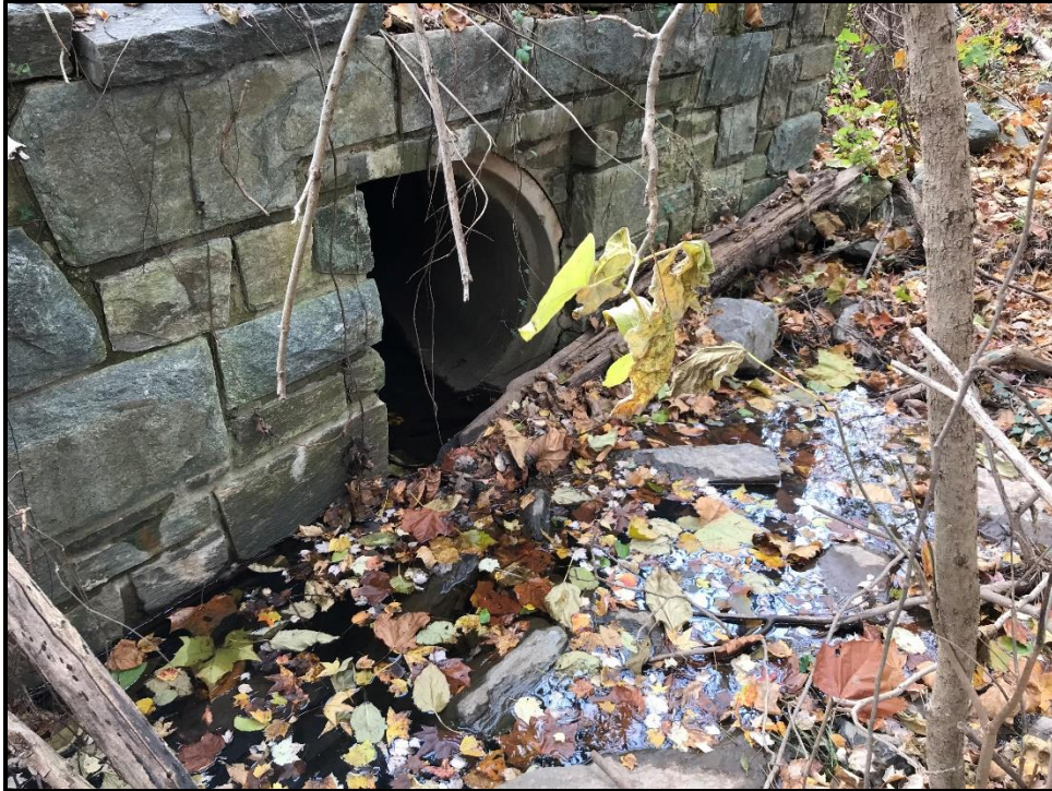
Waters 10PP – Intermittent