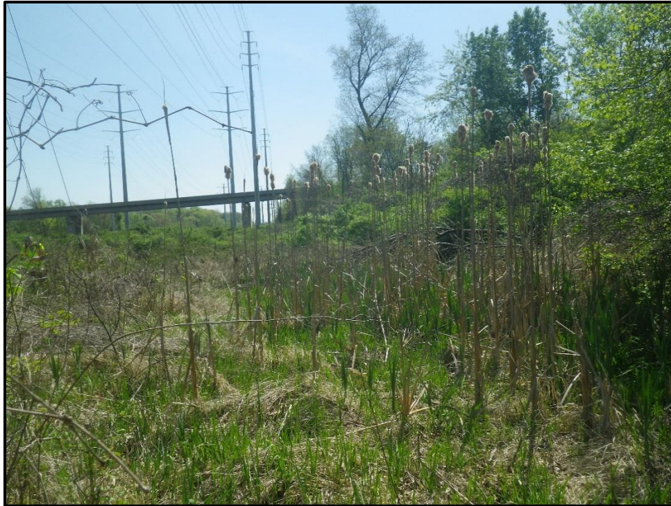
Wetland 12AAA – PEM