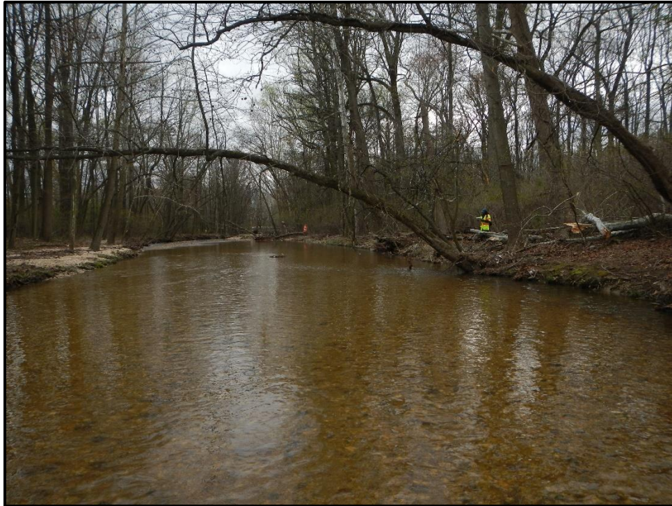
Waters 1200 – Perennial