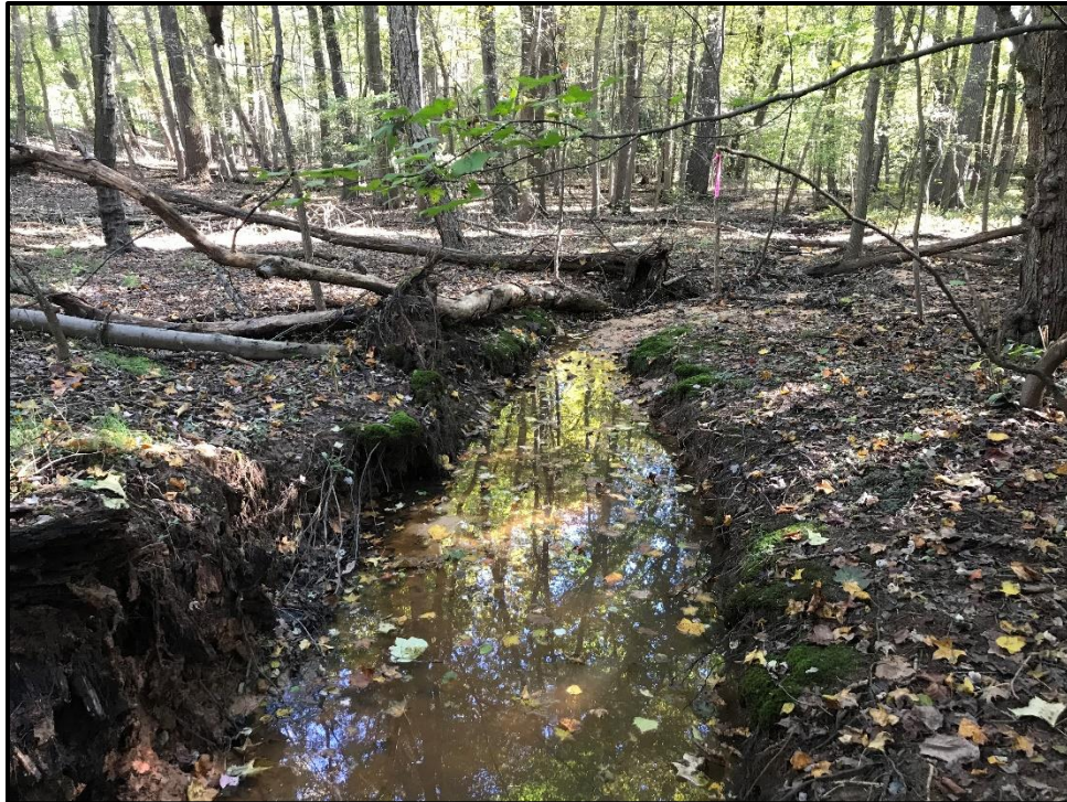
Waters 8GG – Intermittent