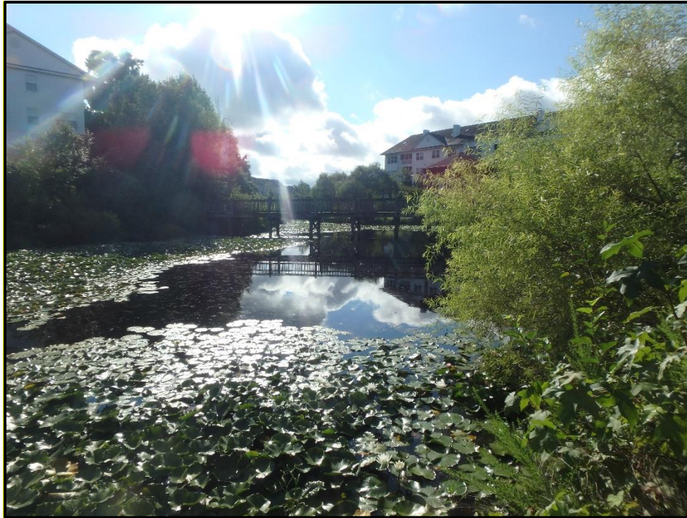
Waters 9L – POW