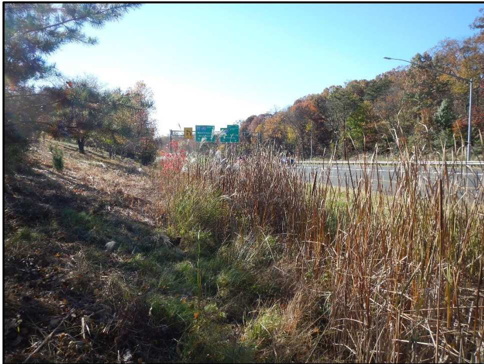
Wetland 12XXX – PEM