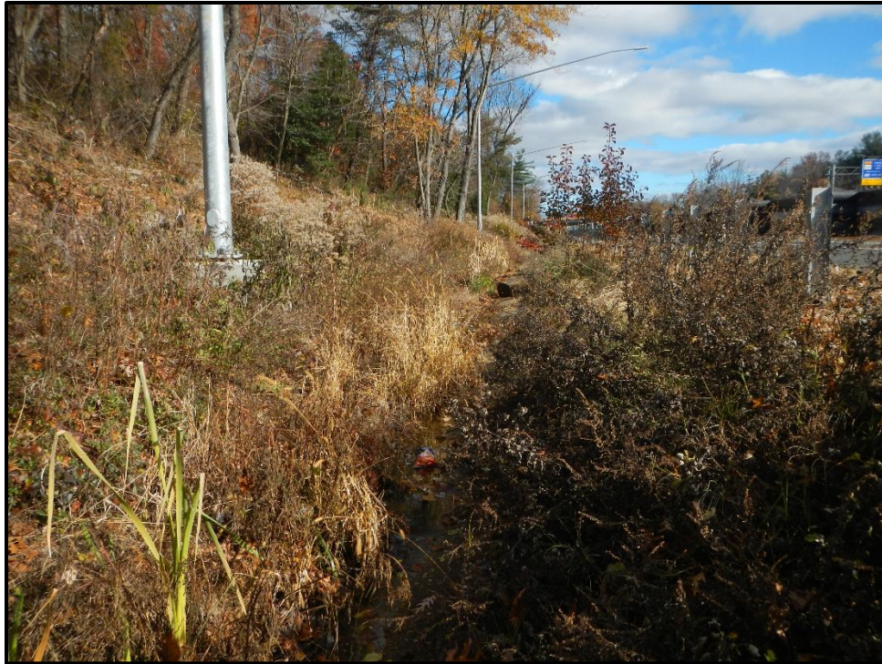
Wetland 12DDDD – PEM