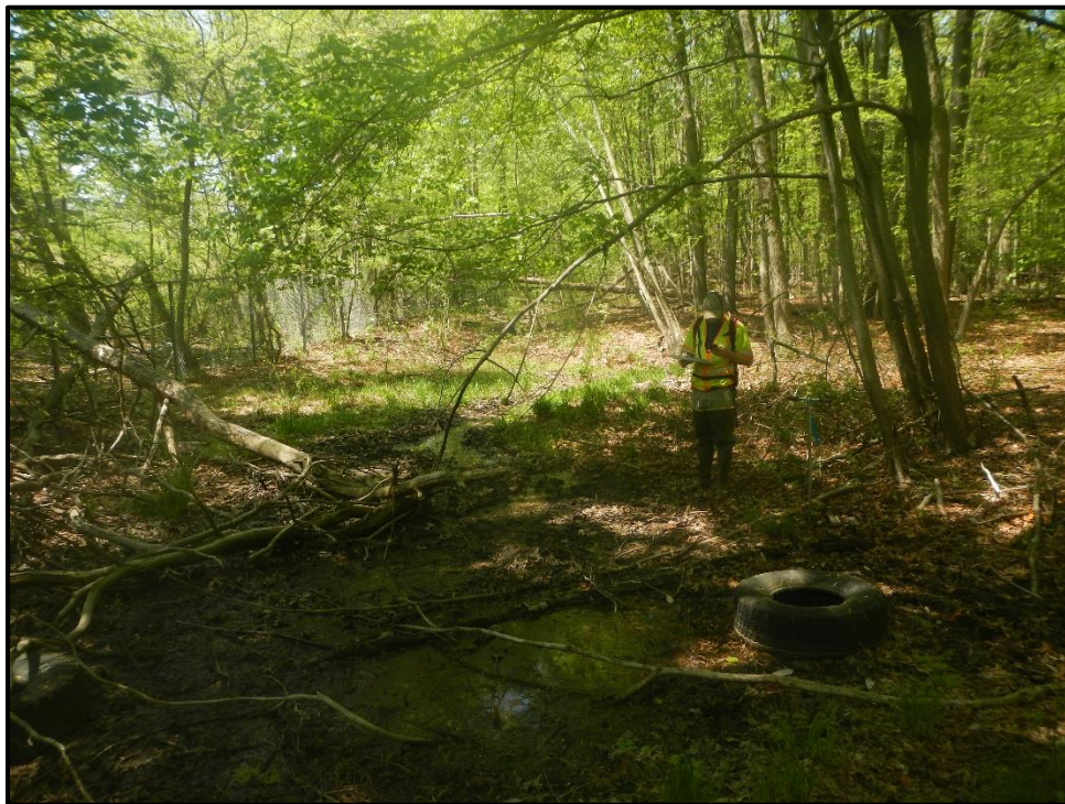
Wetland 12LLL - PFO