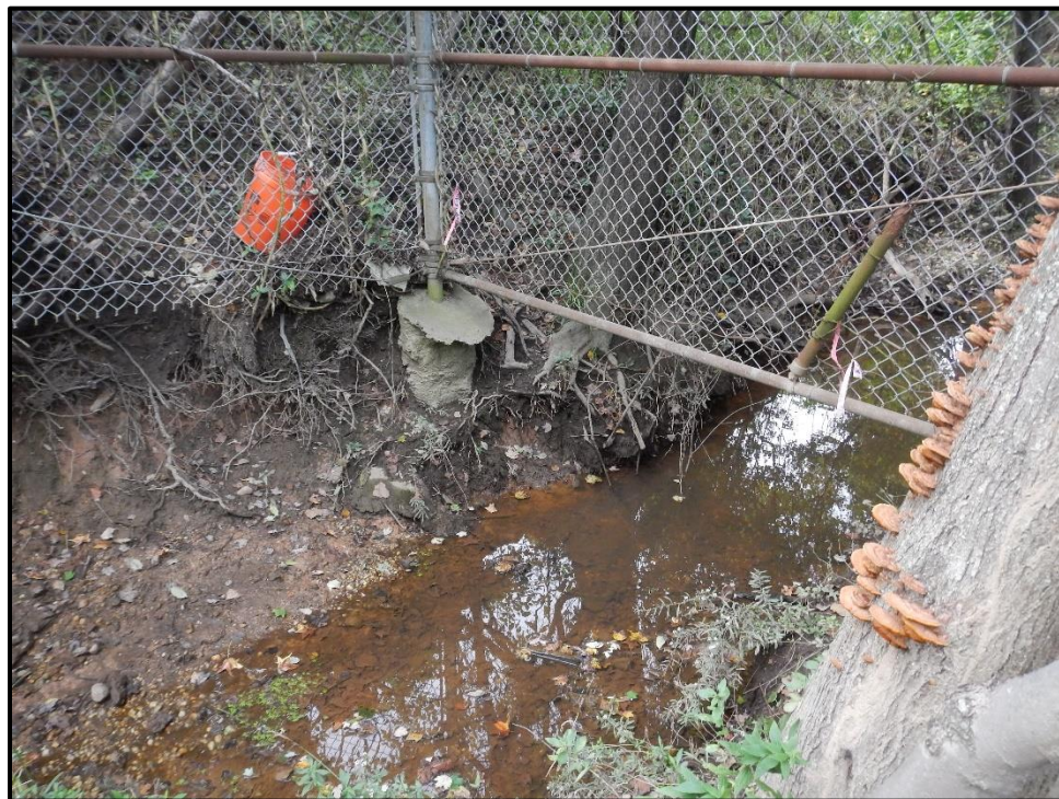
Waters 11AA – Intermittent