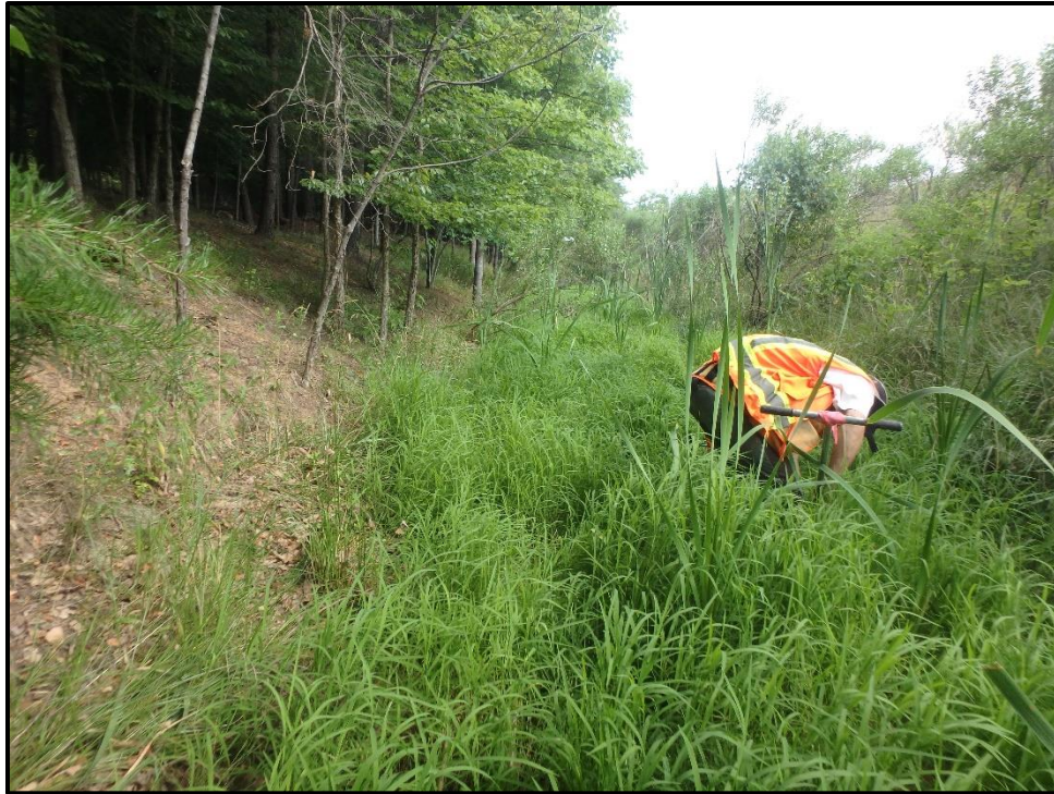
Wetland 8K – PEM