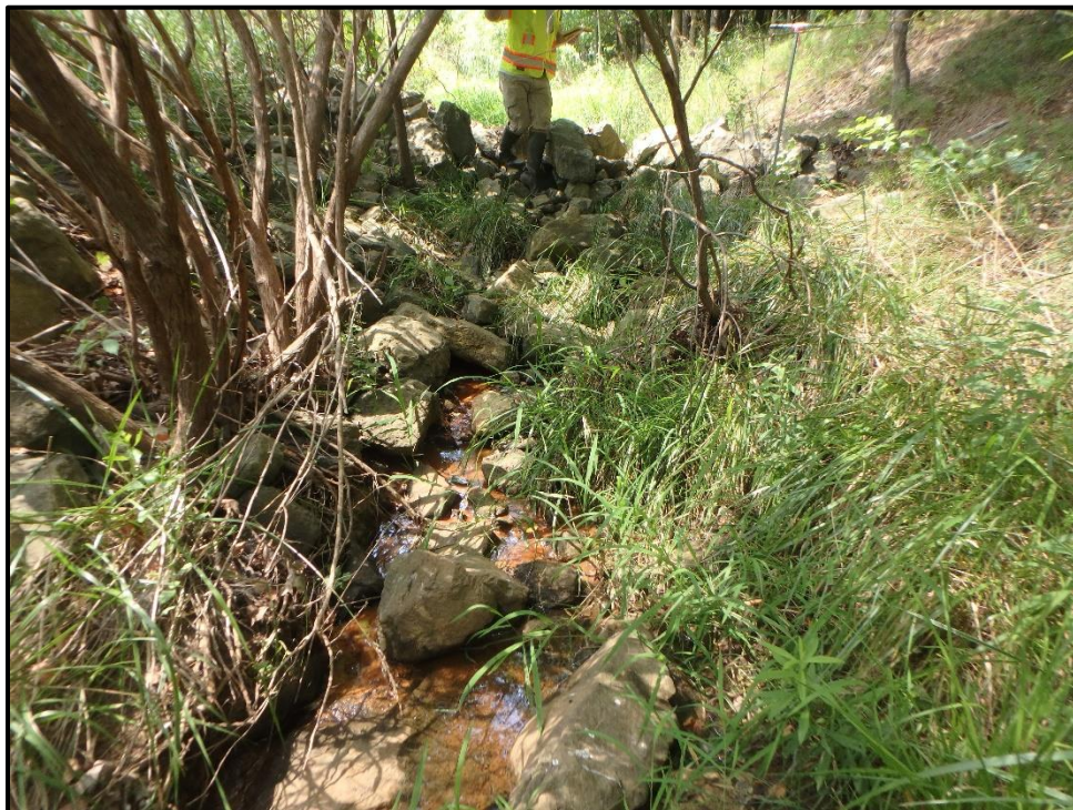
Waters 8J – Intermittent