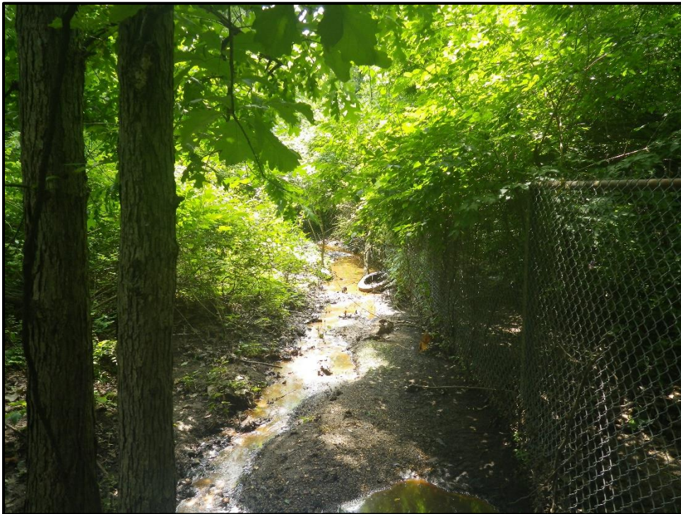
Wetland 11P - PFO