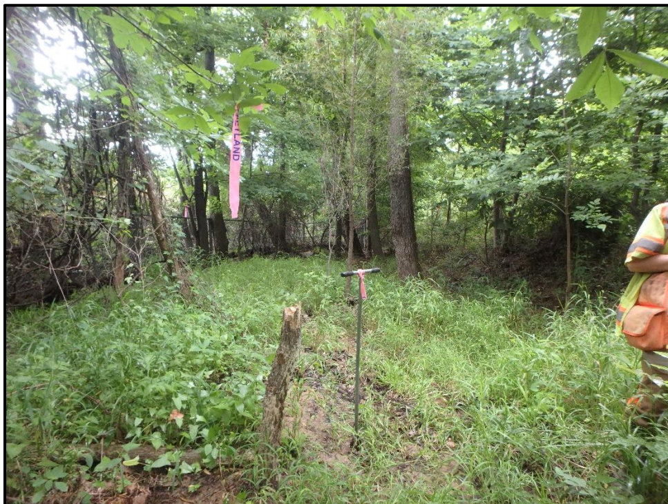
Wetland 7W – PFO