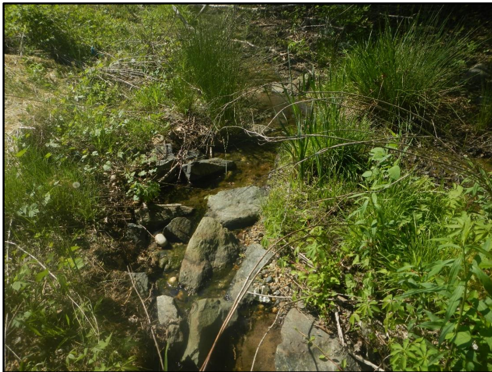
Waters 12PPP – Intermittent