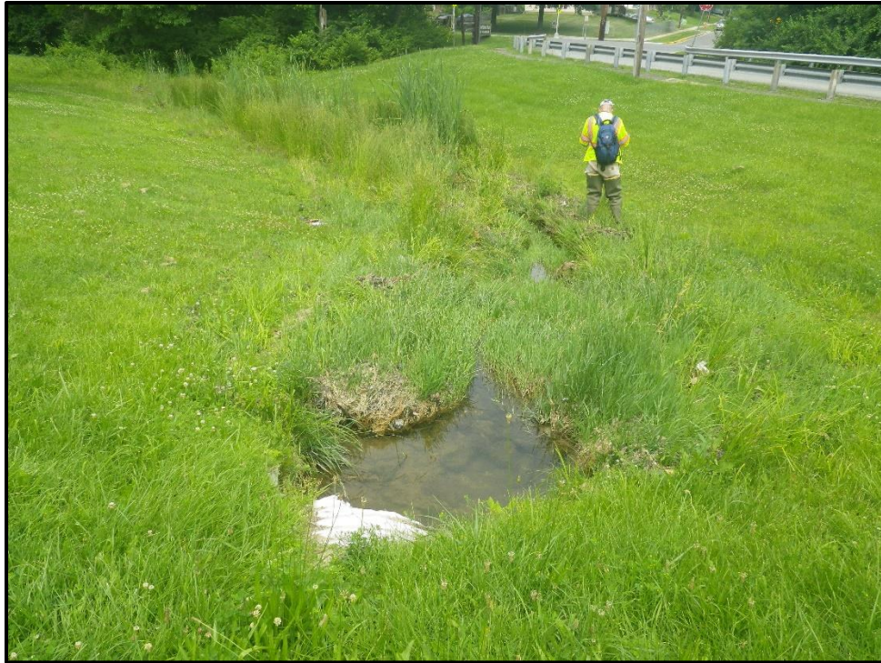
Wetland 11Q - PEM