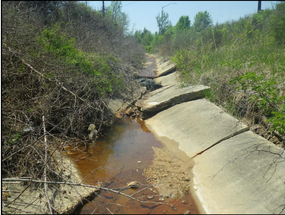
Waters 12CCC – Perennial