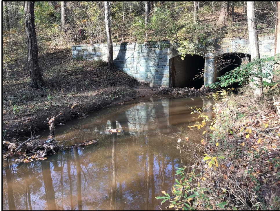
Waters 10TT – Perennial