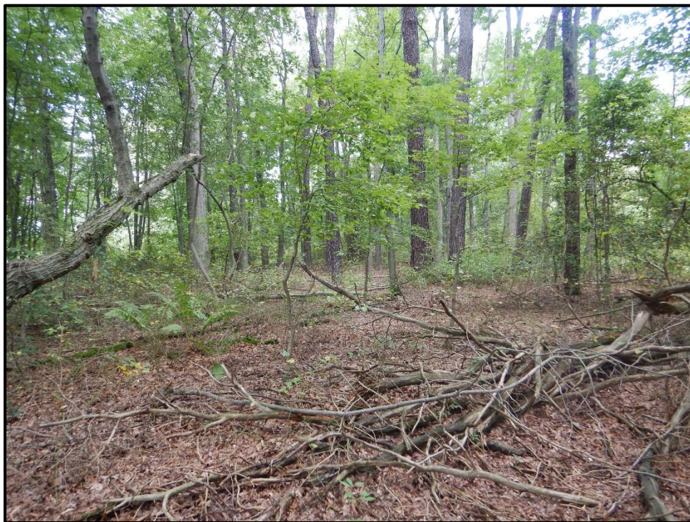
Wetland 9BB – PFO