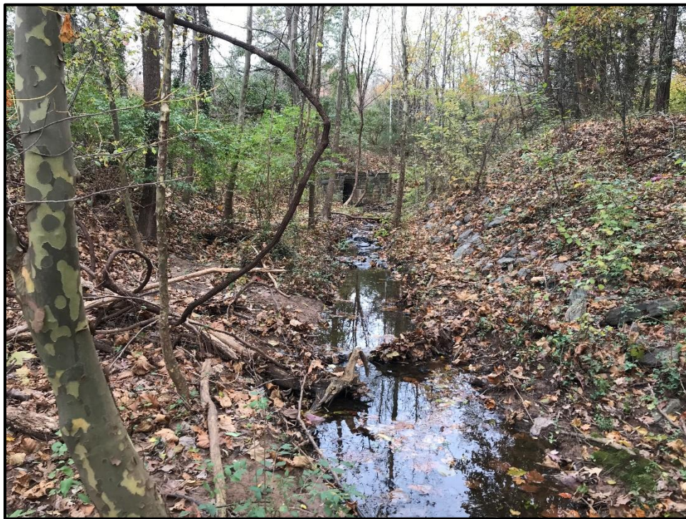
Waters 10HH – Perennial