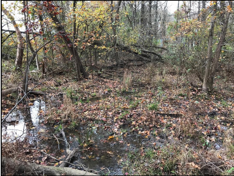
Wetland 10NN - PEM