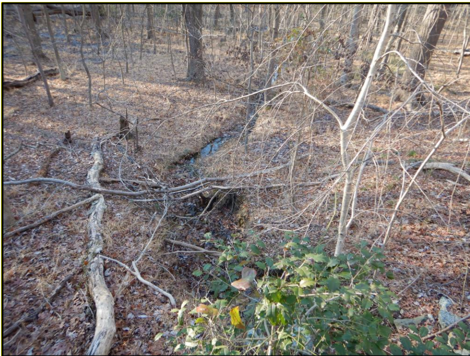
Waters 10AAA – Ephemeral