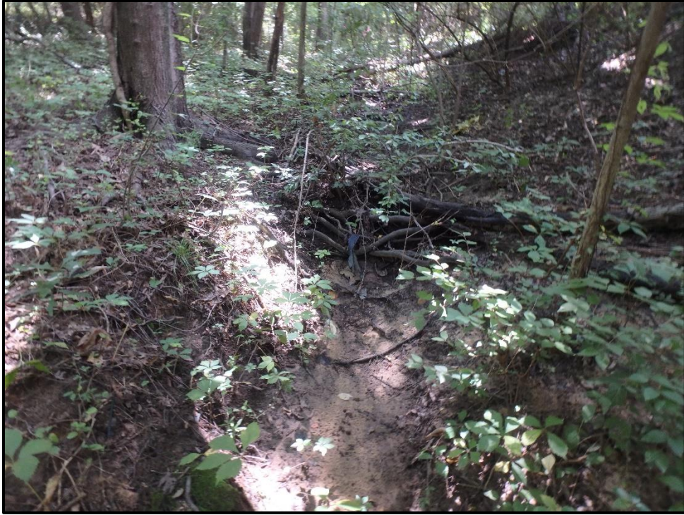
Waters 9FF – Ephemeral