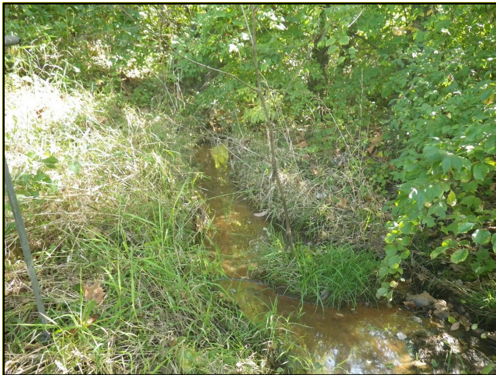
Waters 12UUU – Perennial