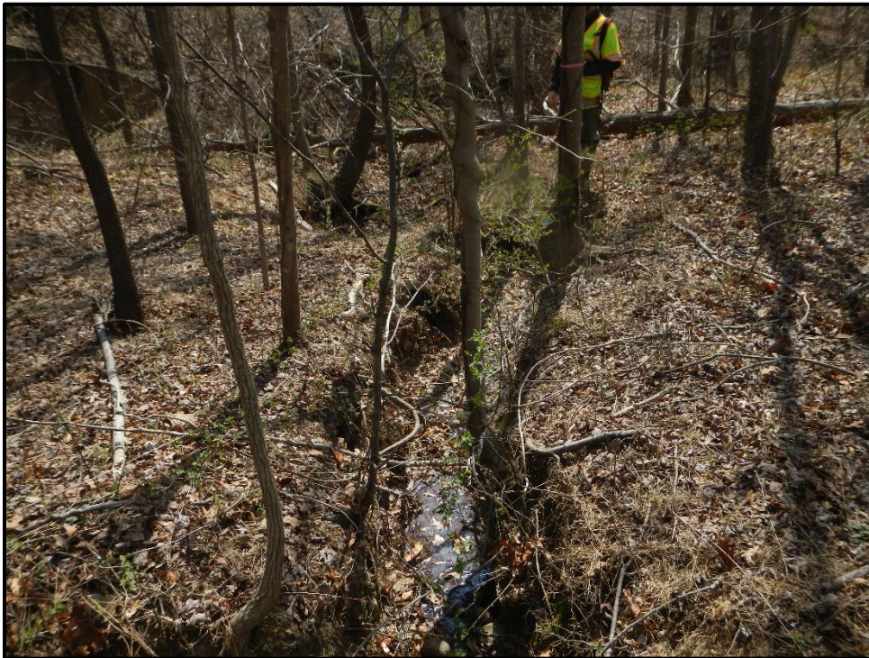
Waters 12I – Intermittent