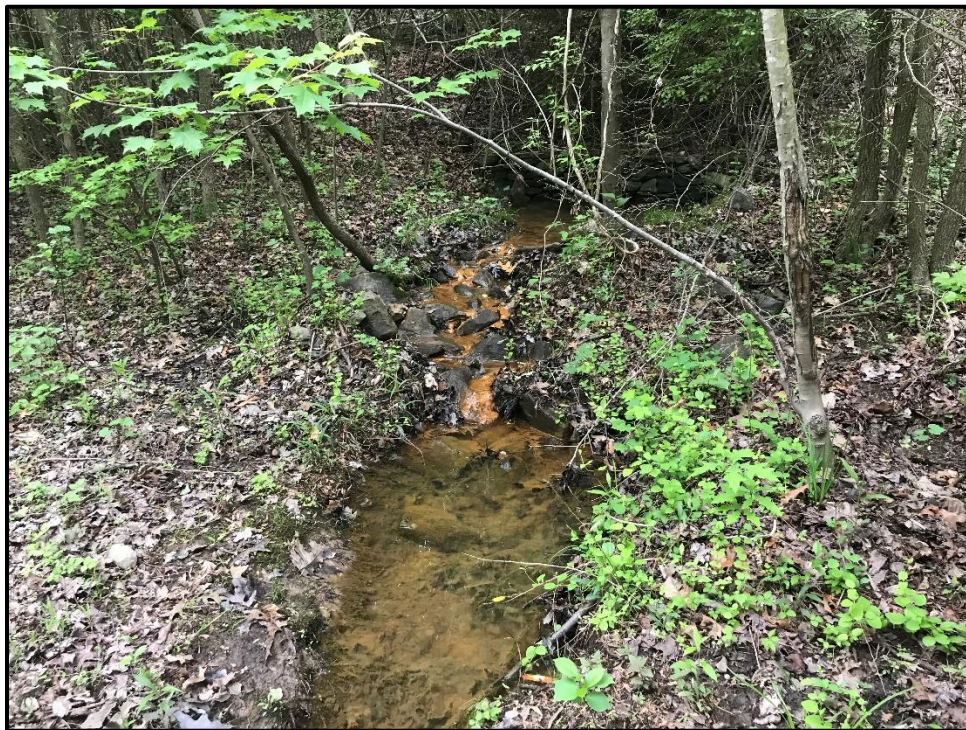
Waters 12KKKK – Intermittent