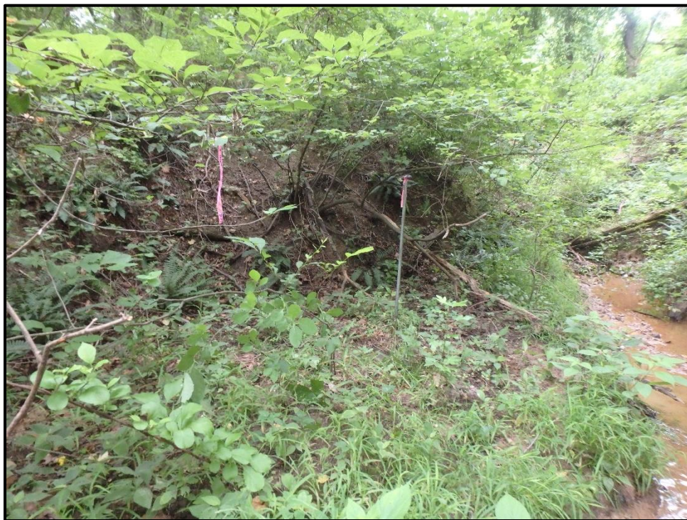
Wetland 7U – PSS