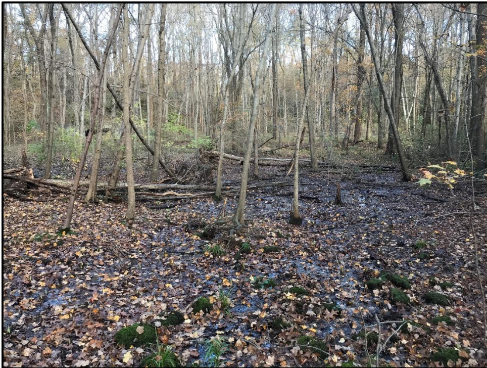
Wetland 10DD - PFO