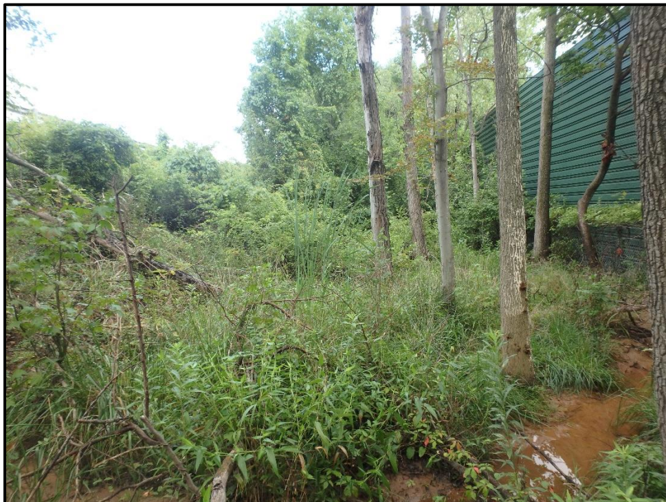
Wetland 9N – PSS