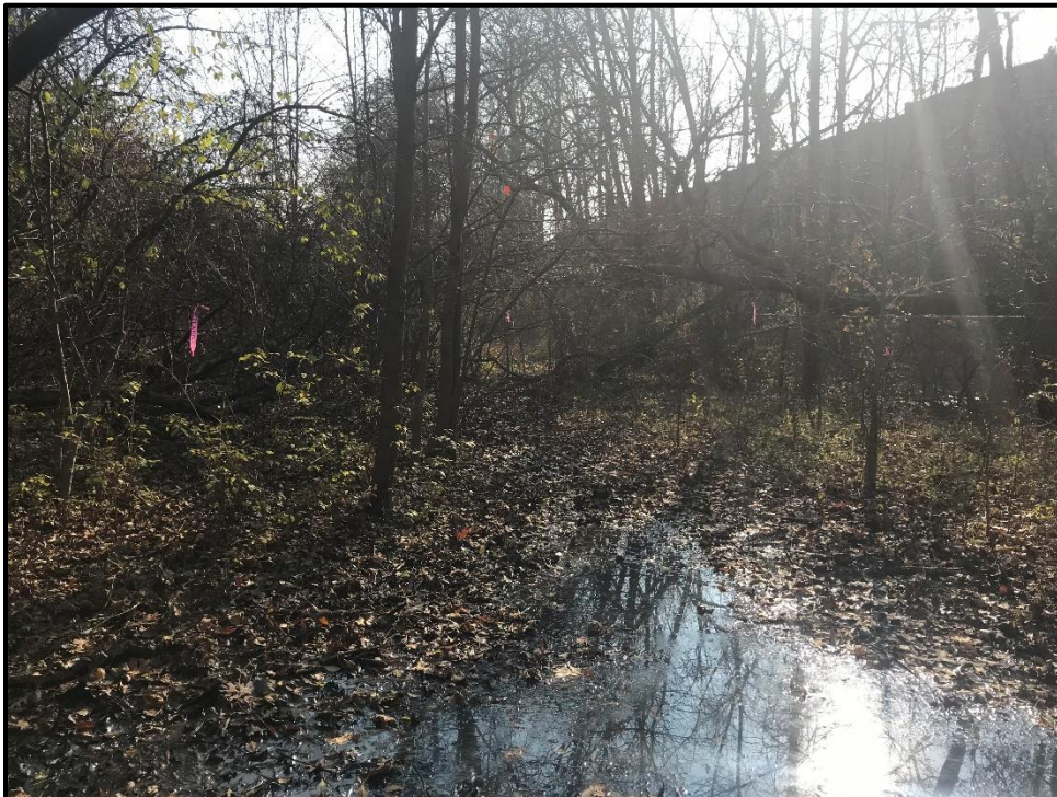
Wetland 9WW – PFO