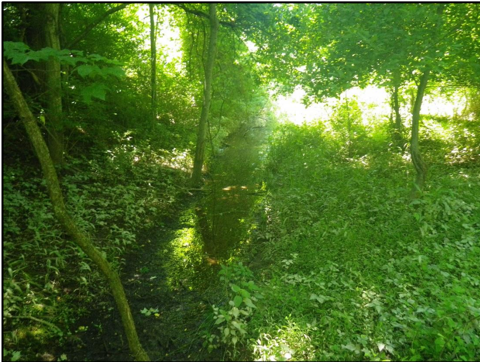
Waters 11J – Intermittent