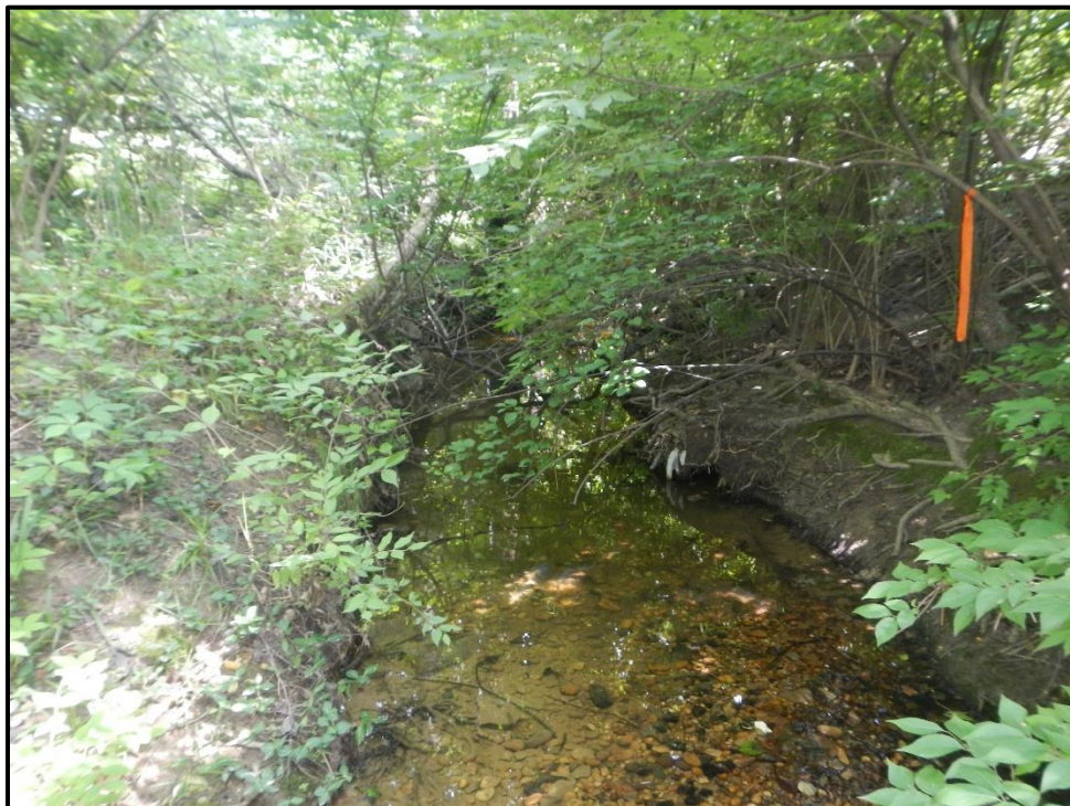
Waters 11R – Intermittent