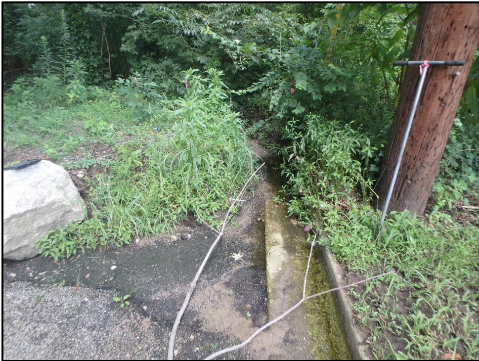
Waters 9U – Intermittent