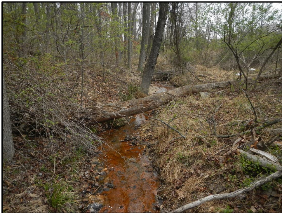
Waters 12V – Perennial