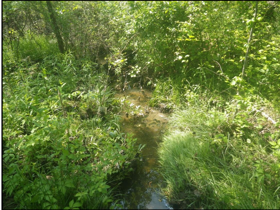
Waters 10E – Perennial