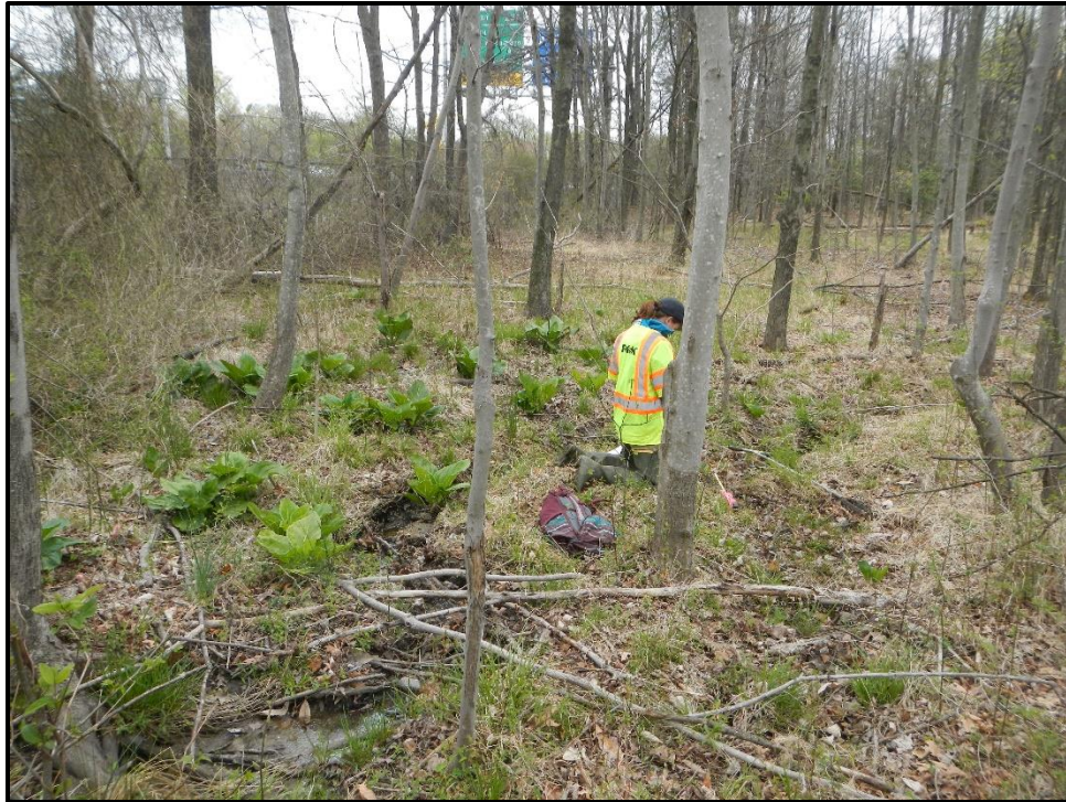
Wetland 12QQ – PFO