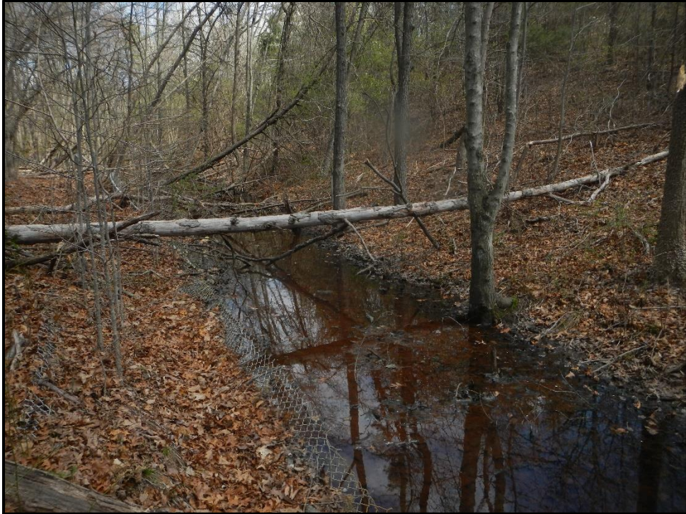
Waters 12E – Perennial