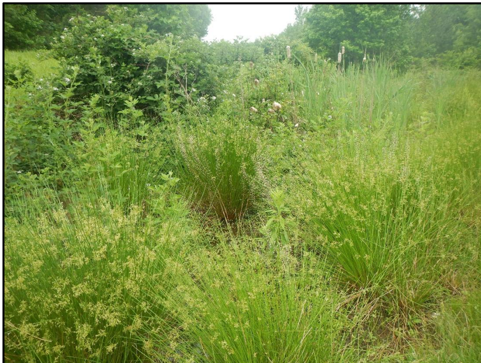
Wetland 10V – PEM