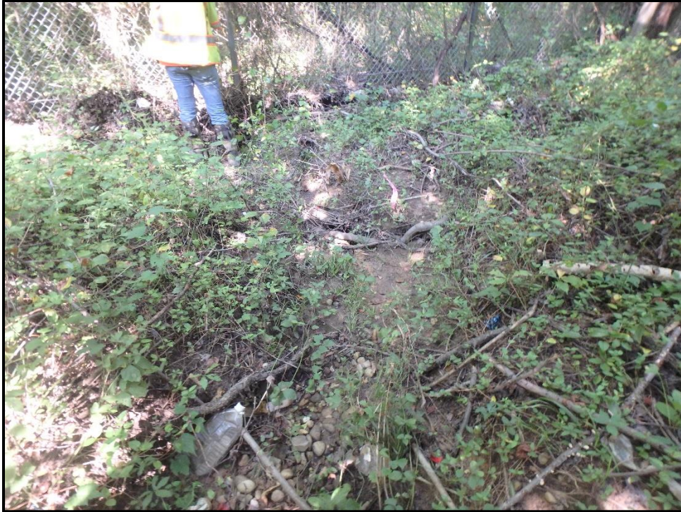
Waters 9LL – Ephemeral