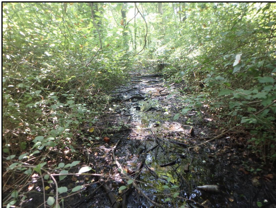
Waters 9V – Intermittent