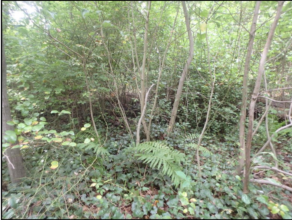
Wetland 9W – PFO