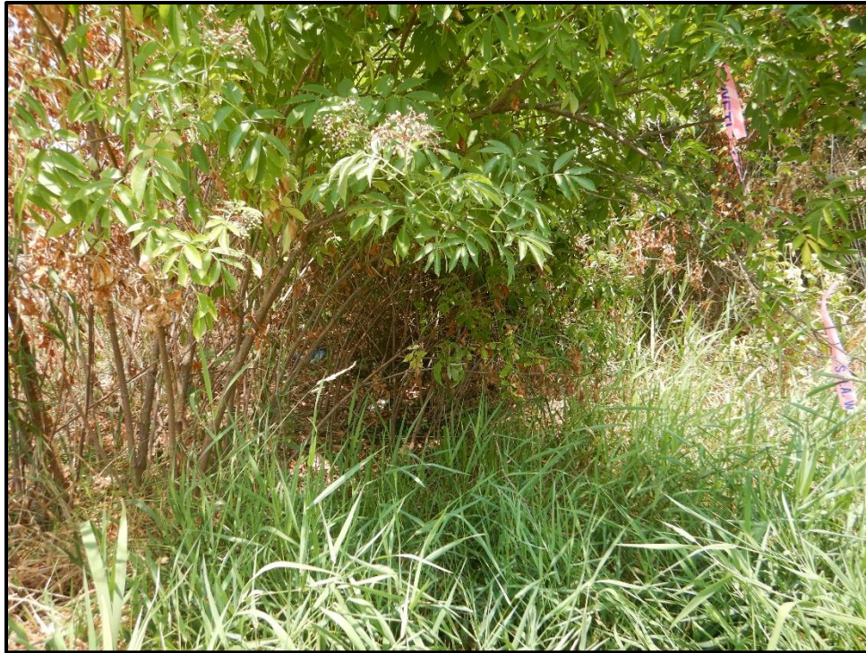
Wetland 8O – PEM