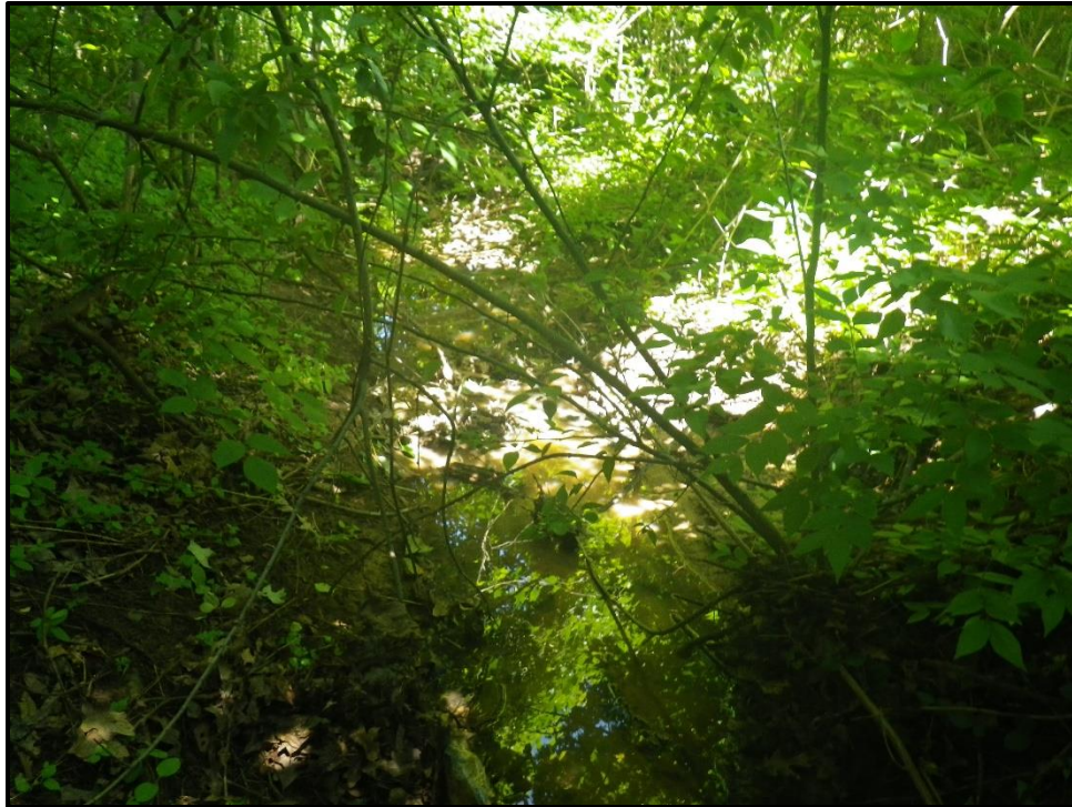
Waters 11H – Intermittent