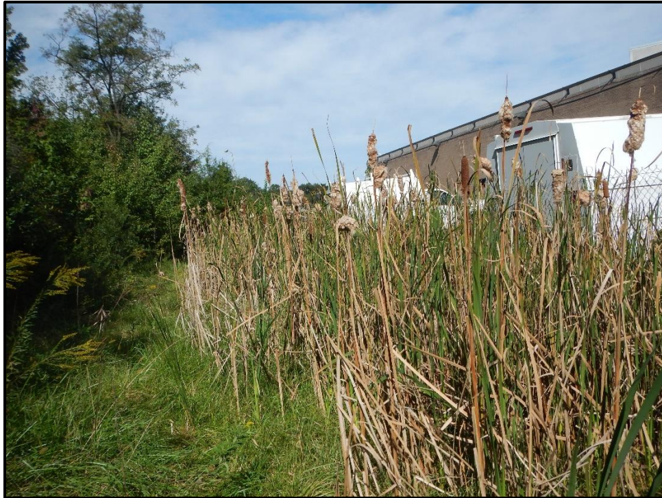
Wetland 11W – PEM