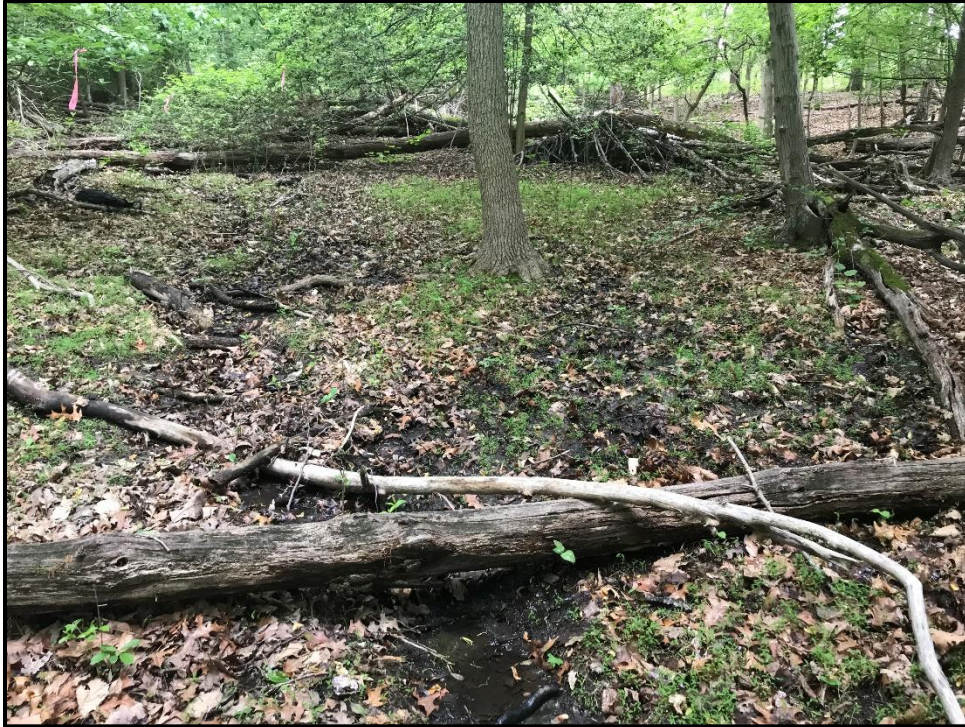
Wetland 12III – PFO