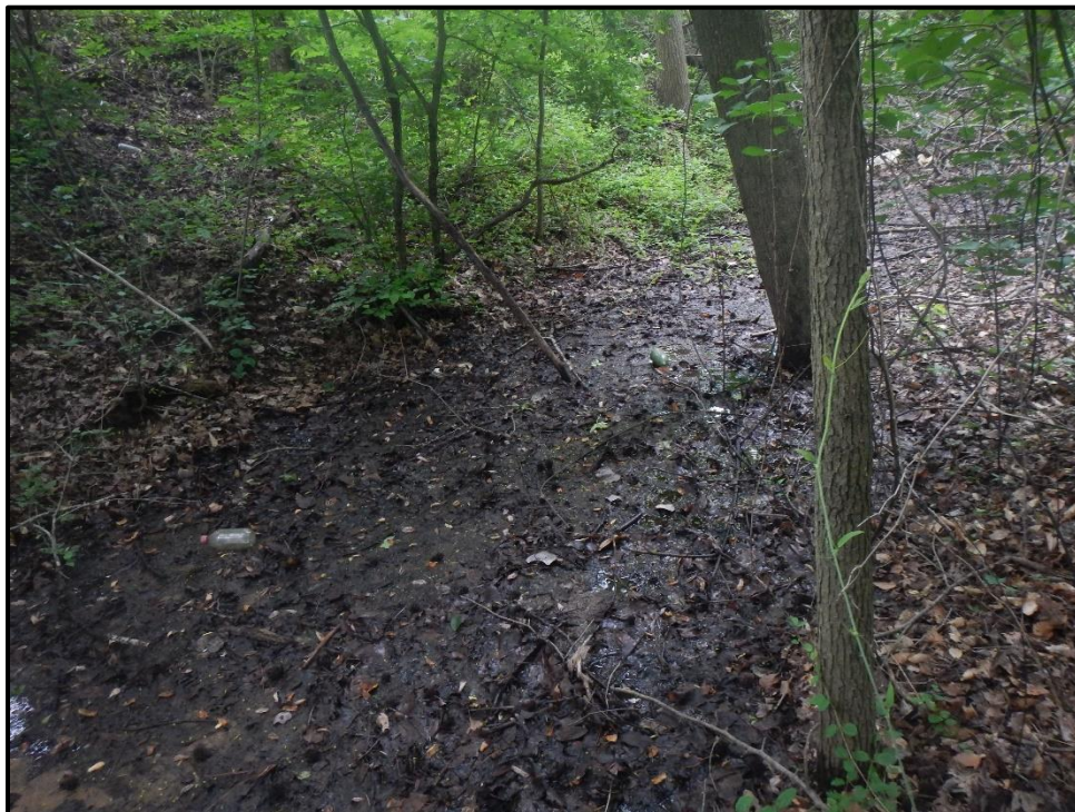
Wetland 10R – PFO