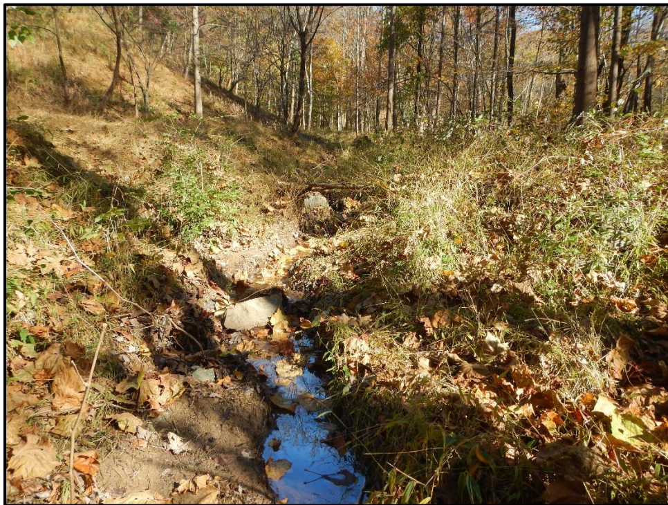
Waters 12VVV – Intermittent