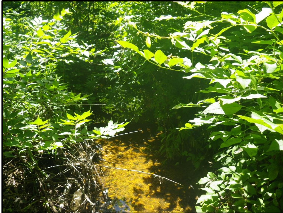
Waters 11G – Intermittent