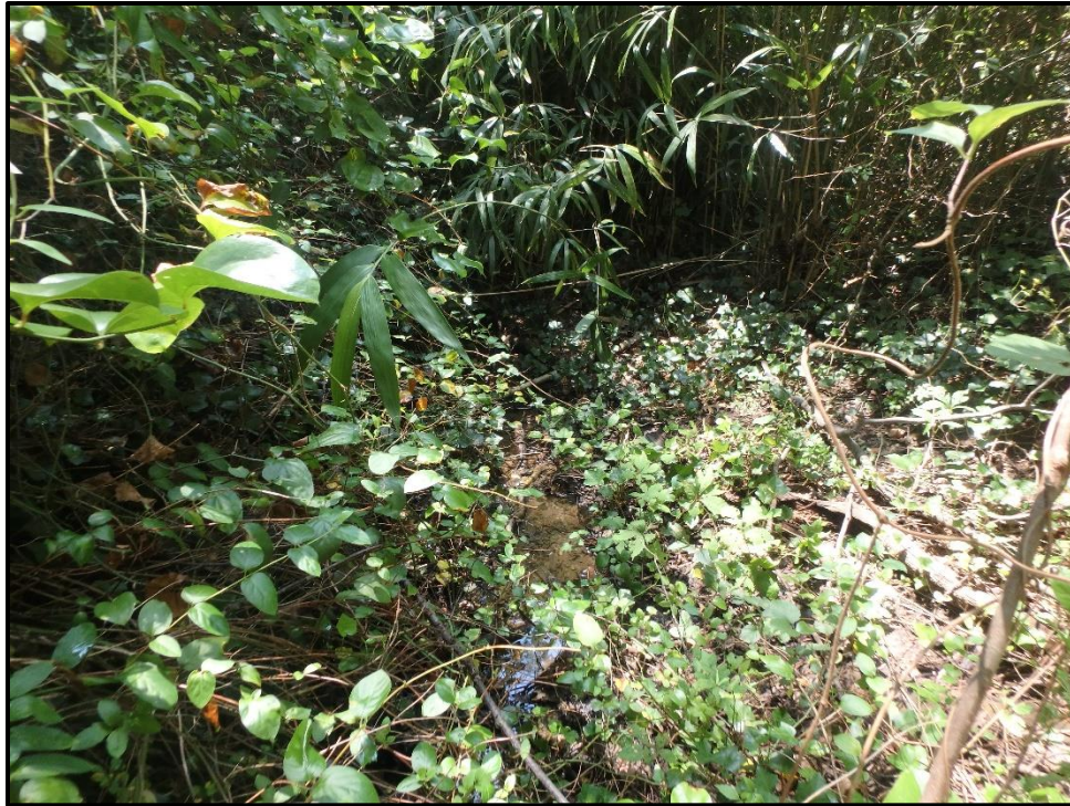
Waters 9V – Intermittent