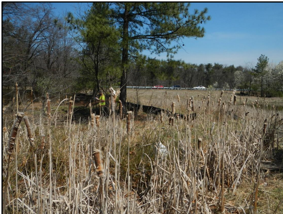
Wetland 12CC – PFO