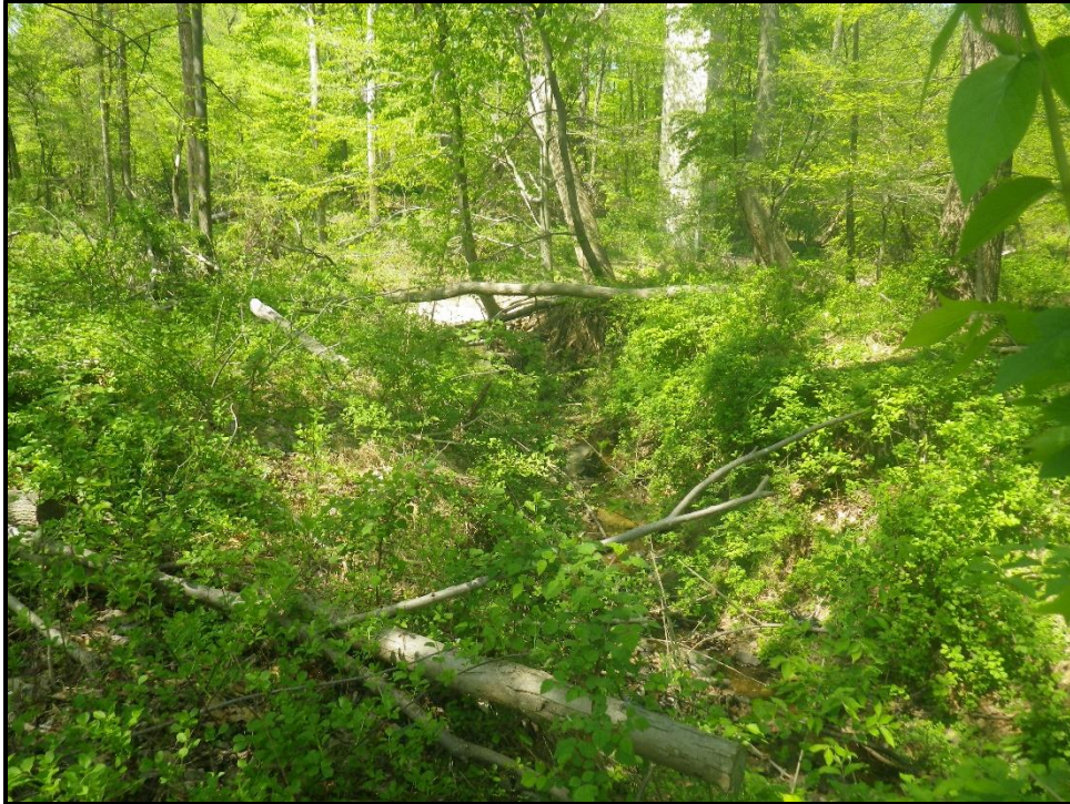
Waters 12WW – Perennial