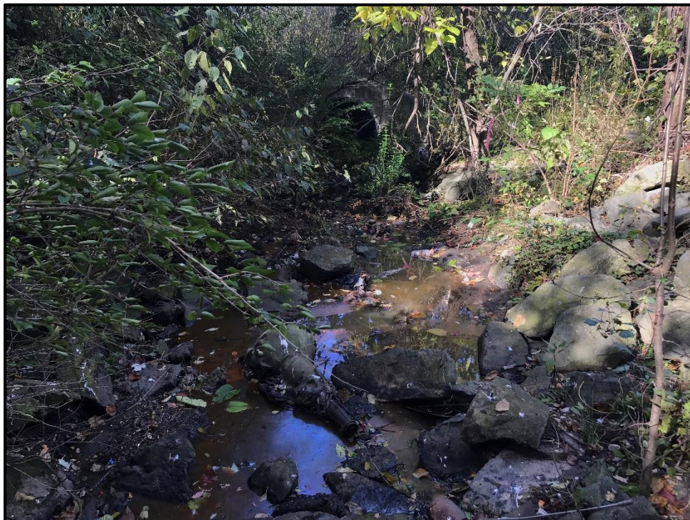
Waters 7PP – Intermittent