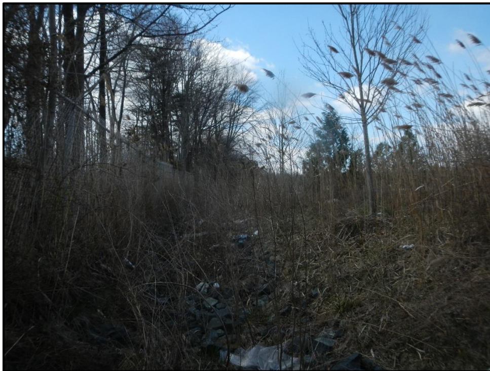
Wetland 12B – PEM