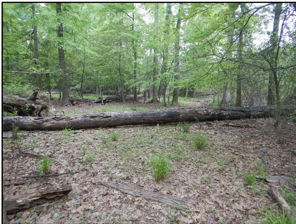
Wetland 11II - PFO