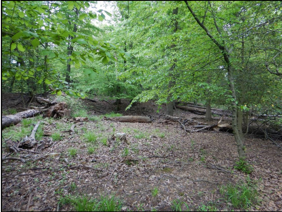
Wetland 11II - PFO