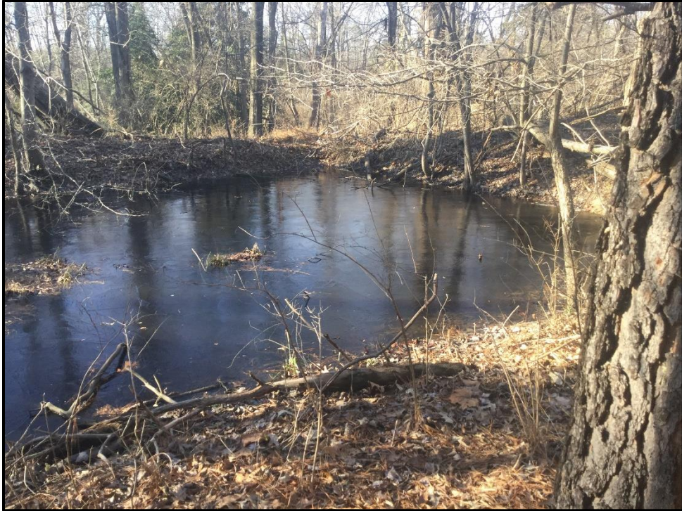
Waters 12FFFF – POW