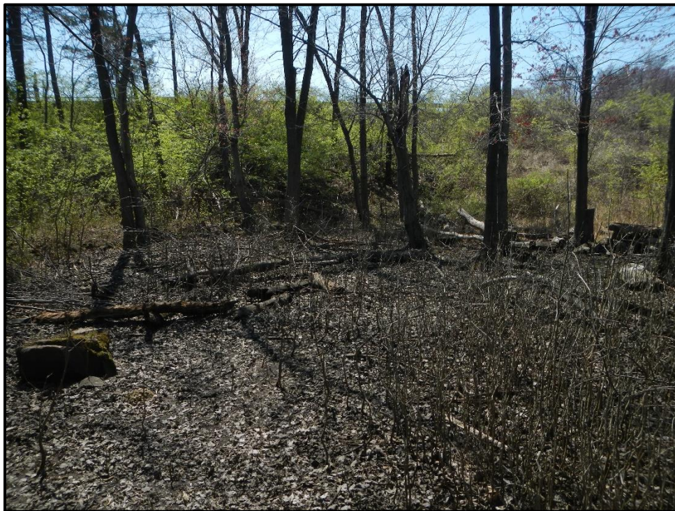
Wetland 12GG – PFO