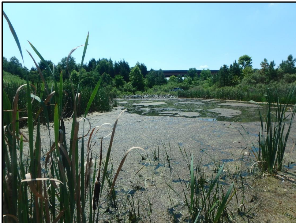
Waters 8D – POW