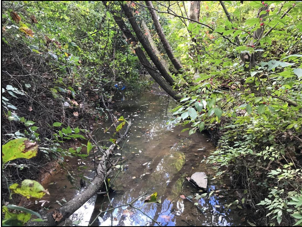
Waters 8BB – Perennial