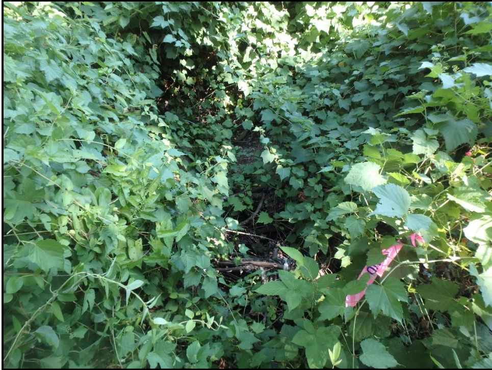
Waters 8V – Intermittent