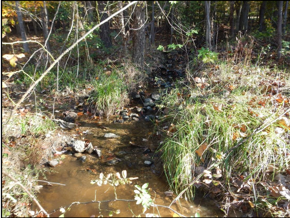
Waters 12YYY – Perennial