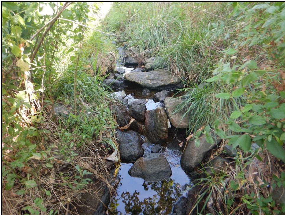
Waters 8N – Perennial/Intermittent