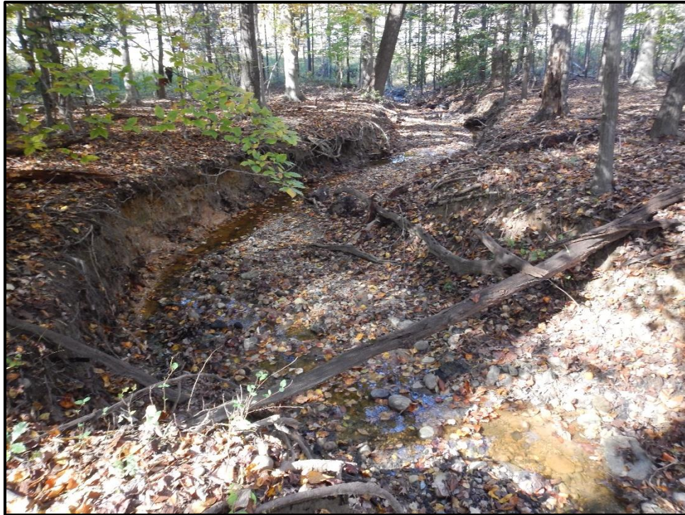
Waters 12WWW - Intermittent