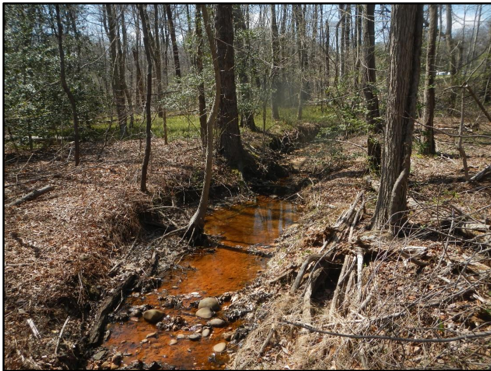
Waters 12K – Perennial