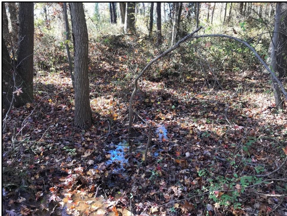
Wetland 10GG - PFO