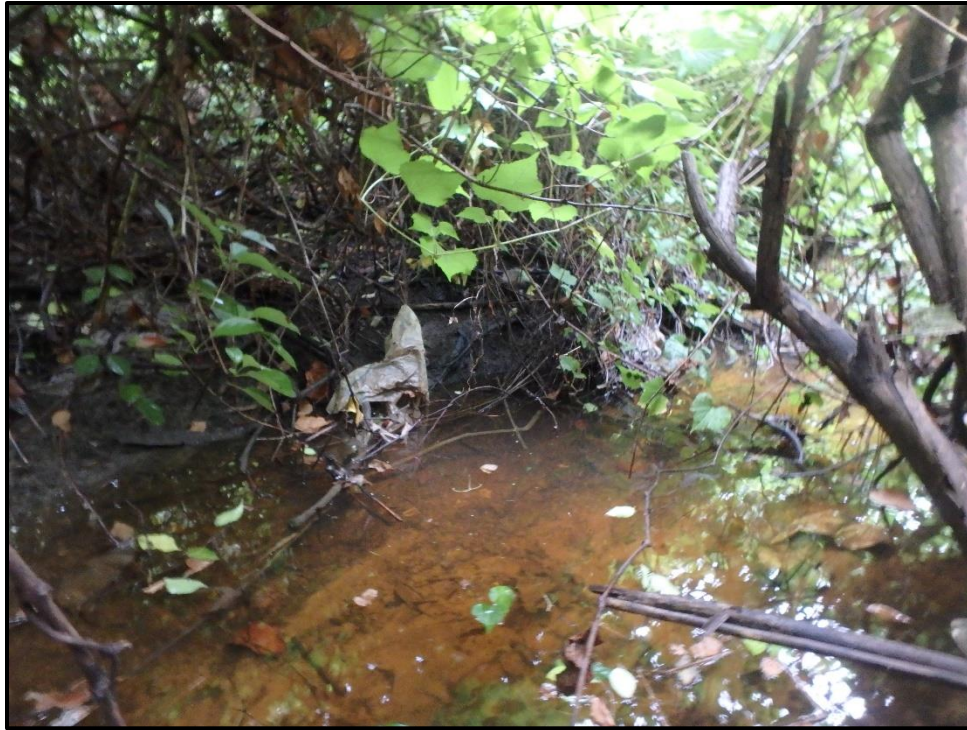
Waters 9C – Intermittent