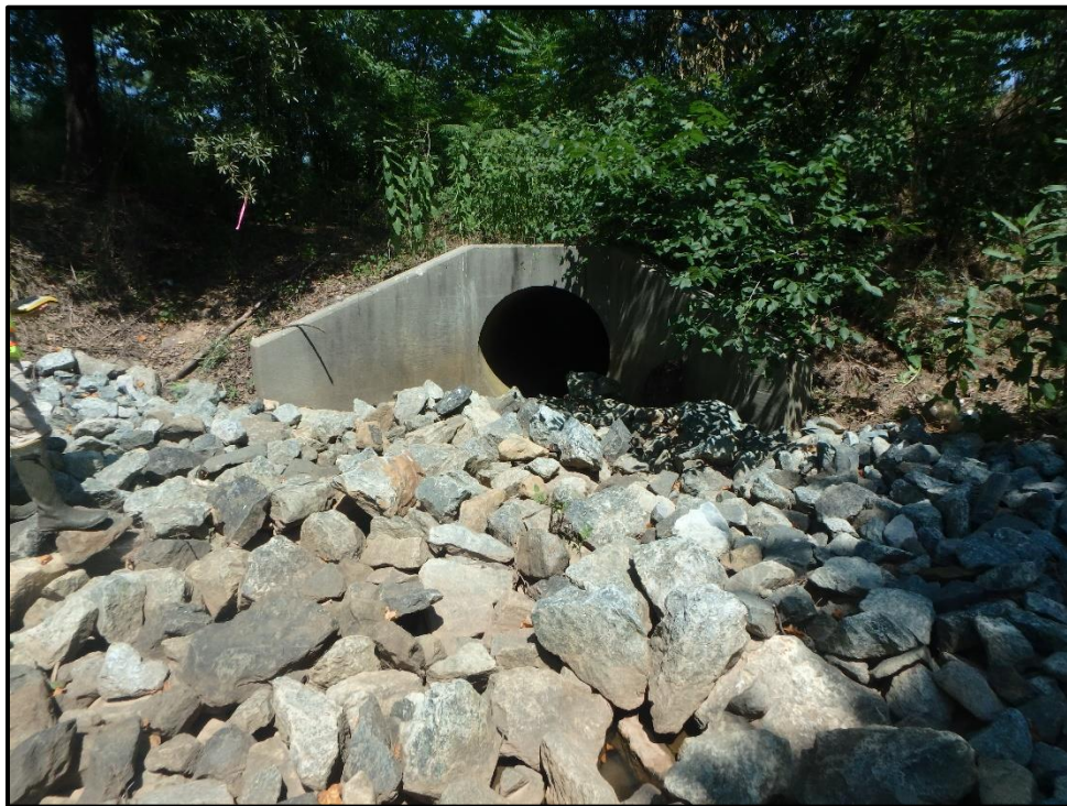
Waters 8F – Intermittent