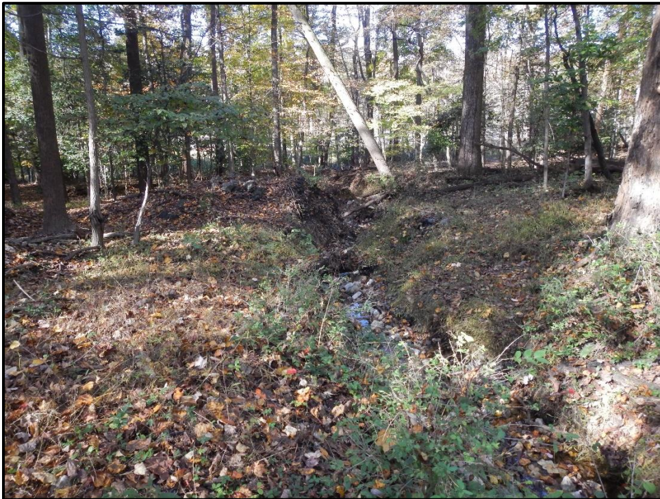
Waters 12WW – Intermittent