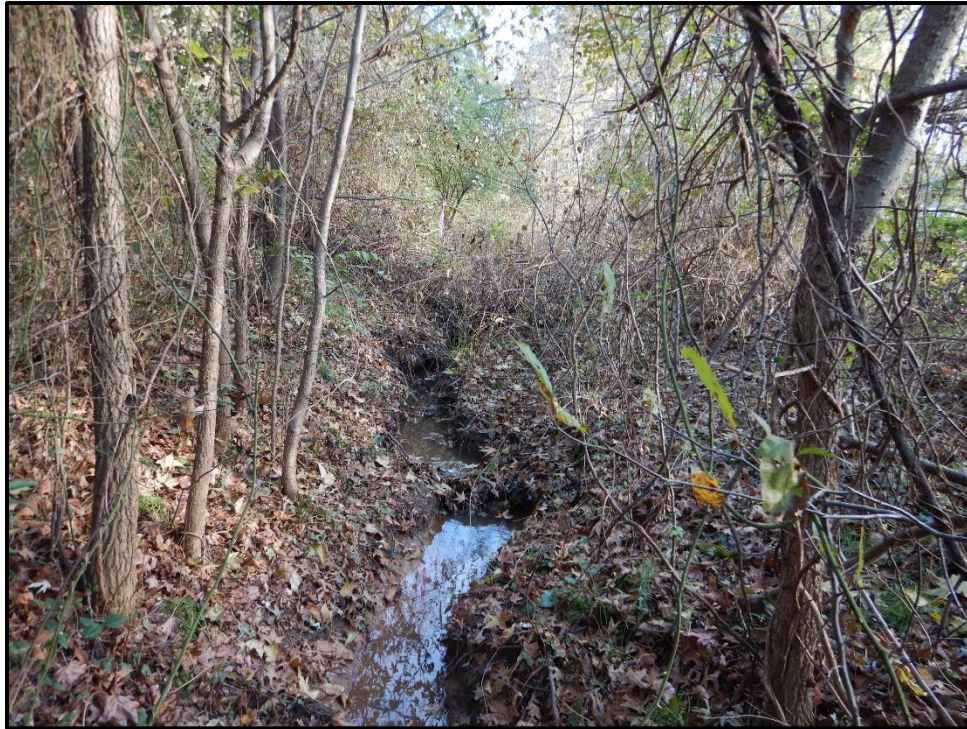
Waters 9RR – Ephemeral