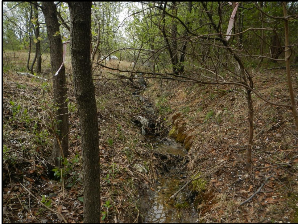
Waters 12LL – Ephemeral