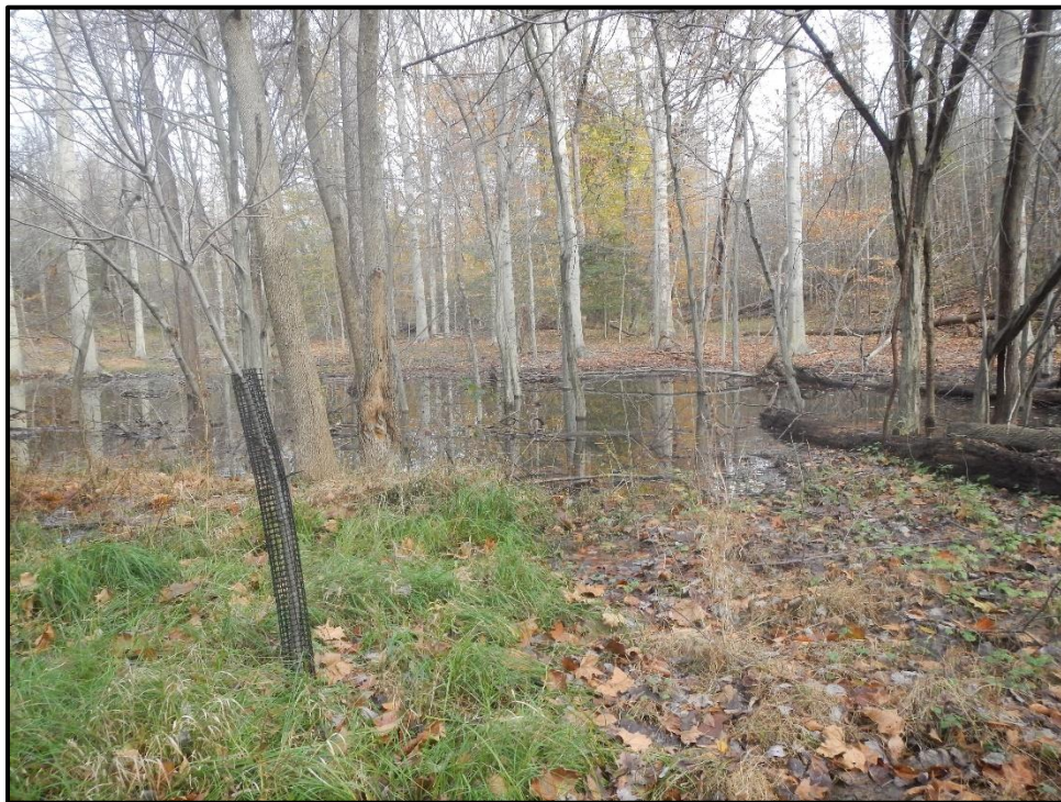
Wetland 12ZZZ – PFO