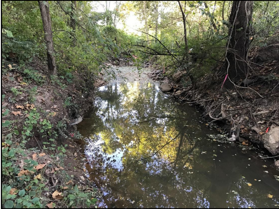
Waters 8Z – Perennial