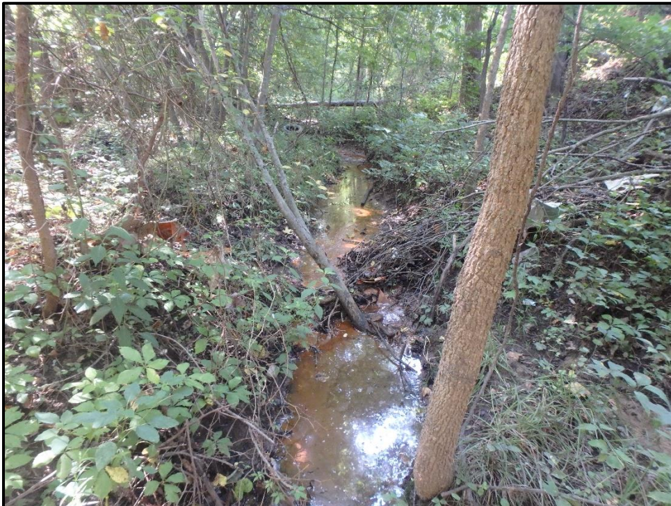
Waters 9MM – Intermittent