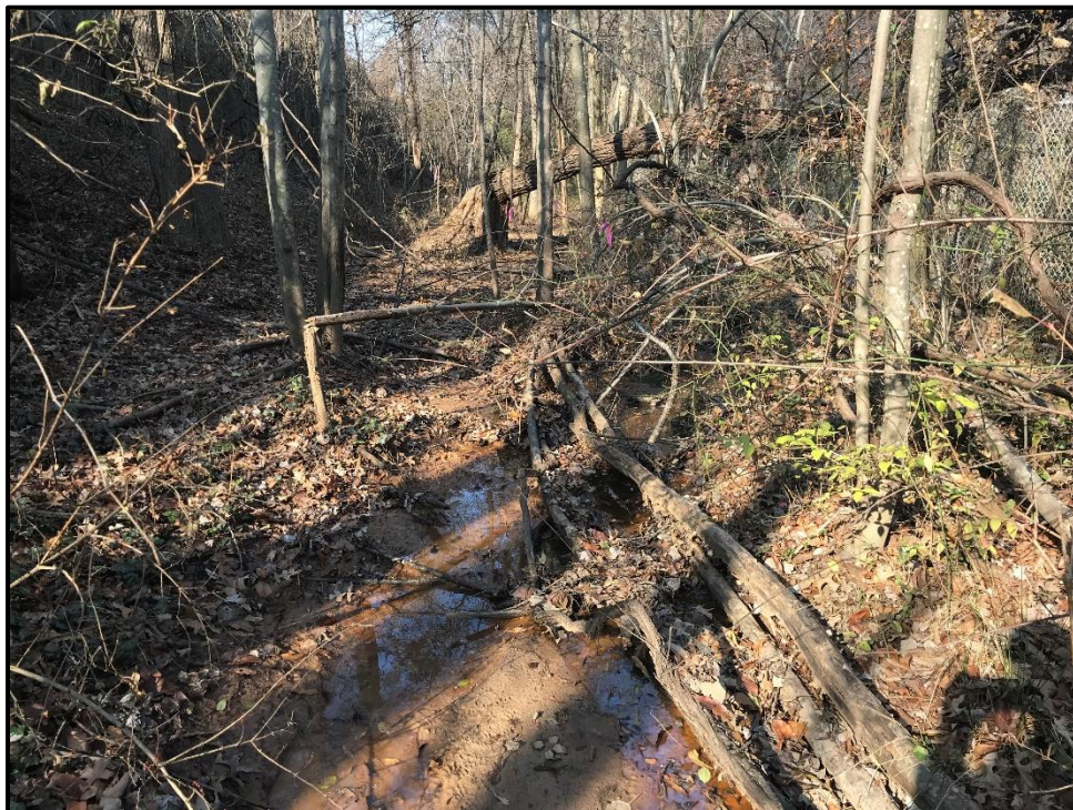
Waters 9VV – Intermittent