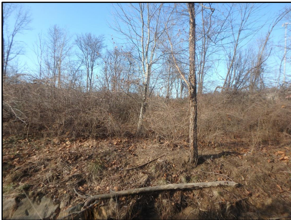
Wetland 8LL – PFO