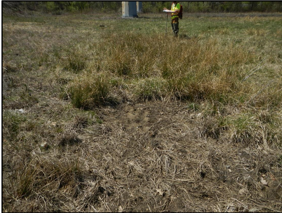
Wetland 12FF - PEM