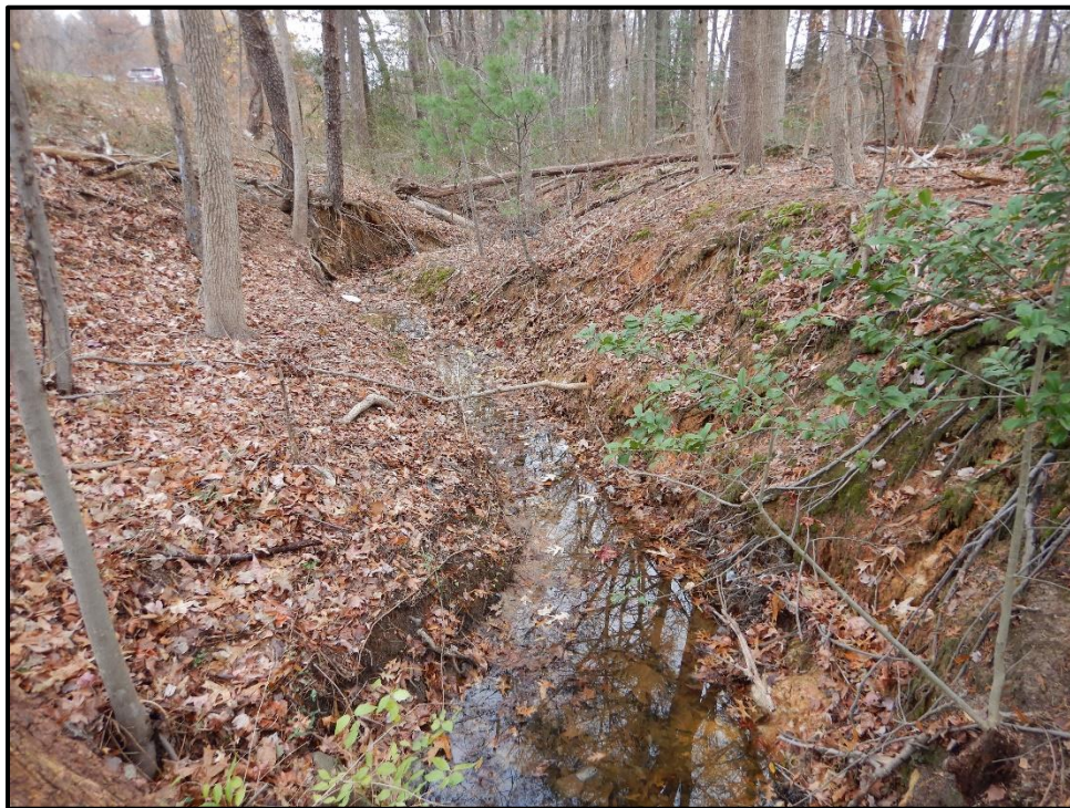
Waters 10JJ – Intermittent