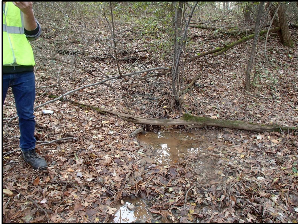
Waters 9UU – Ephemeral