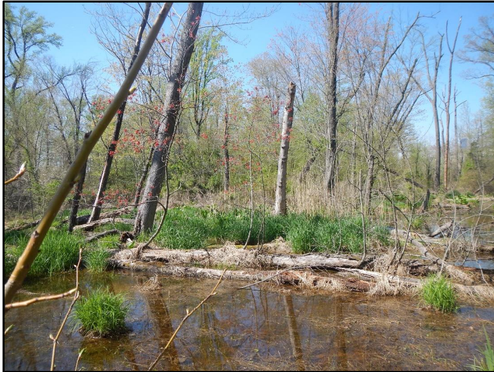
Wetland 12UU – PFO