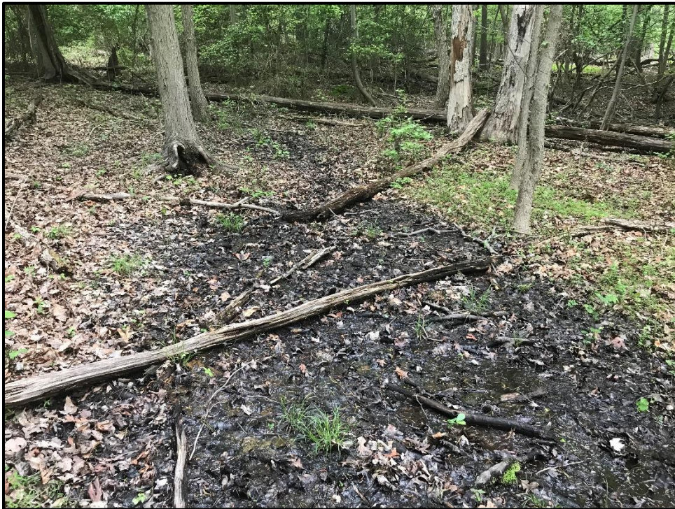
Wetland 12GGGG – PFO