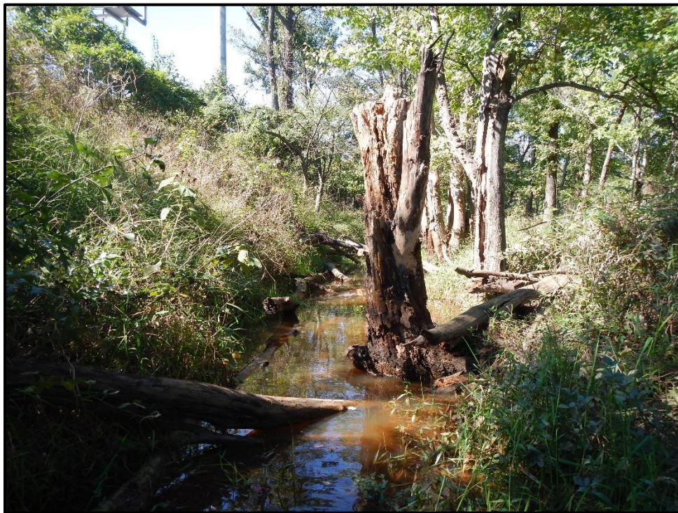
Waters 11V –Perennial