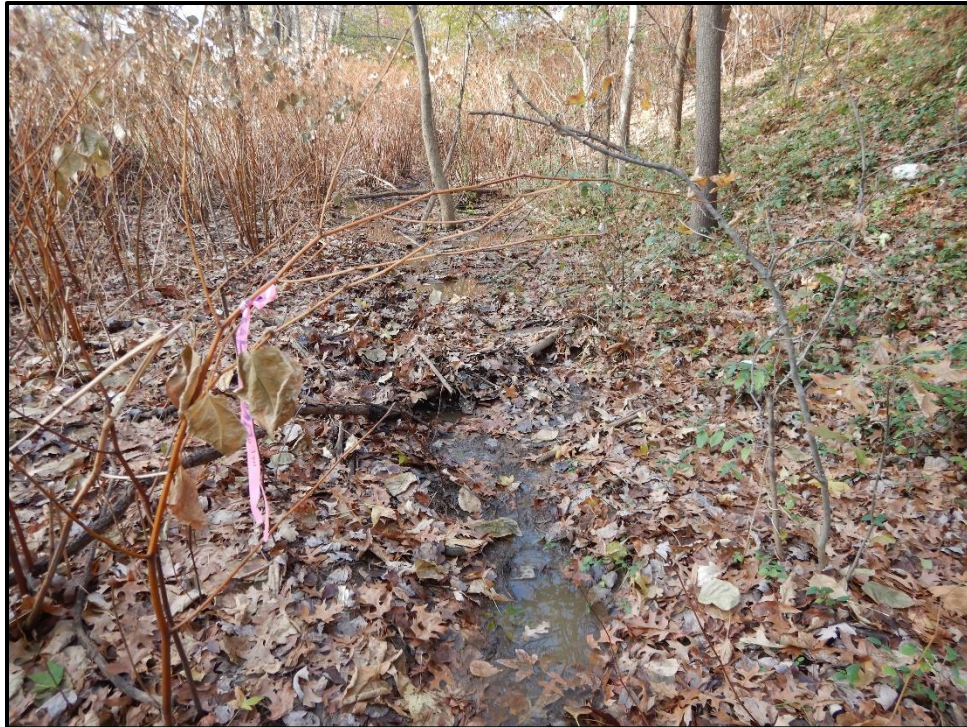
Waters 9QQ – Ephemeral/Intermittent