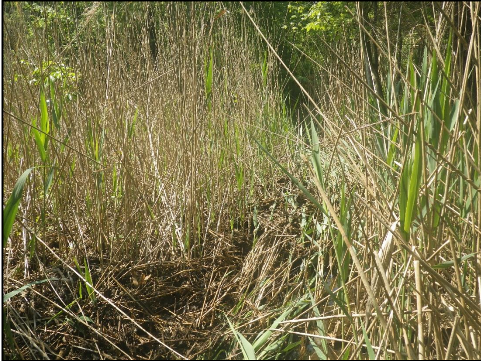
Wetland 10D – PSS