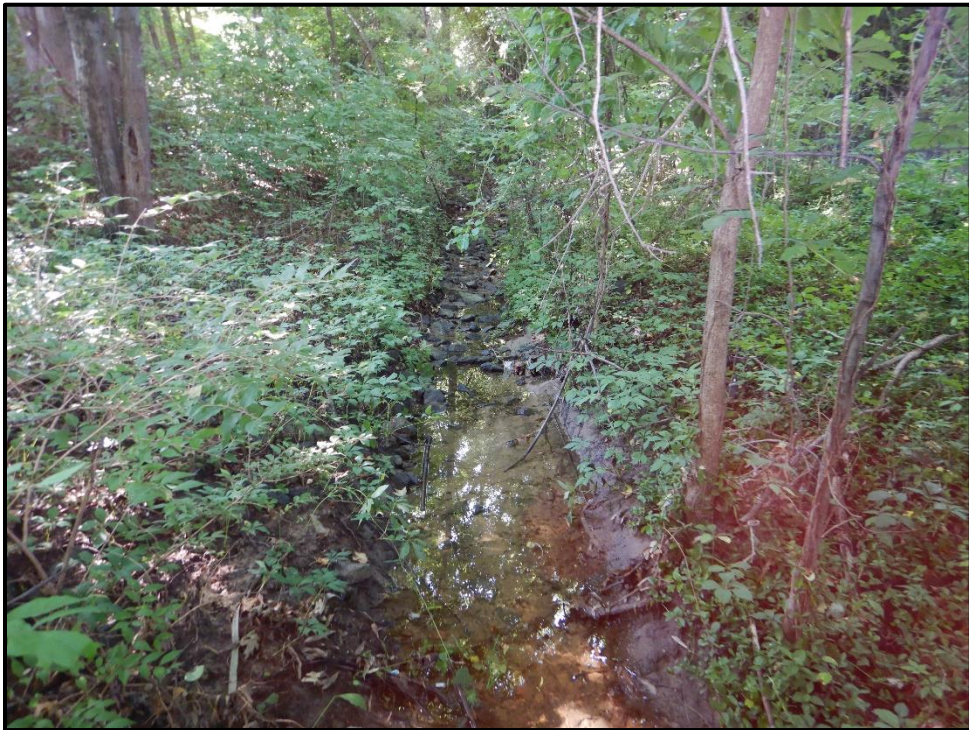
Waters 9Z – Intermittent