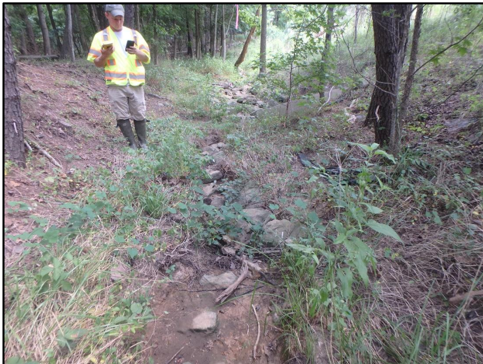
Waters 8E – Ephemeral/Intermittent