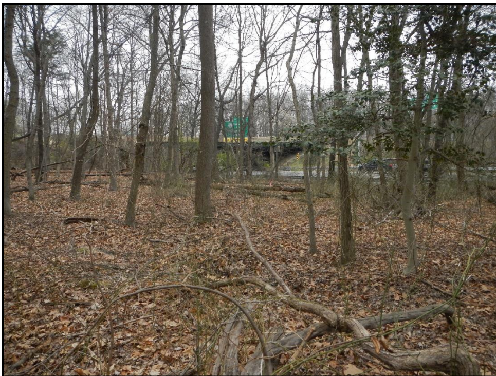
Wetland 12AA – PFO