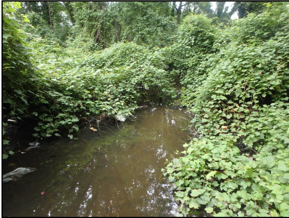
Waters 9A – Intermittent