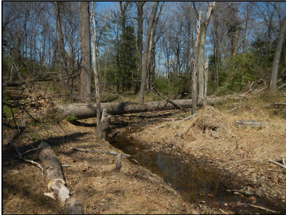
Waters 12KK – Perennial