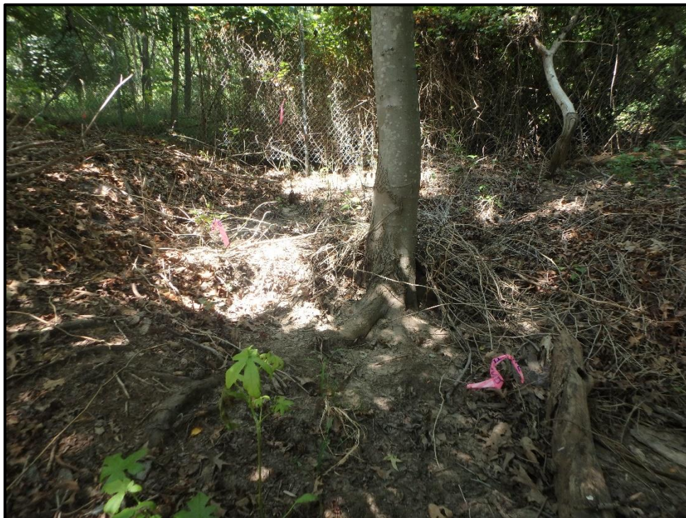
Waters 8I – Ephemeral