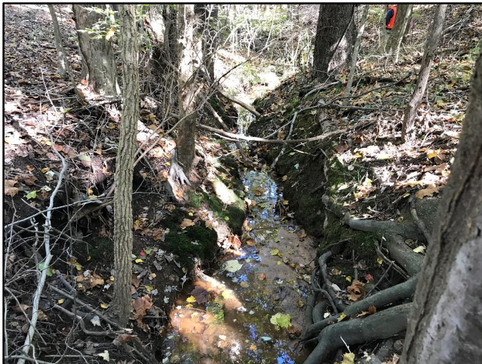
Waters 8HH – Intermittent