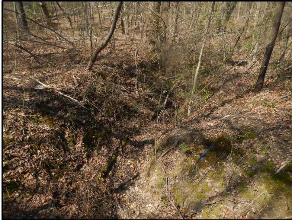
Waters 12G – Intermittent