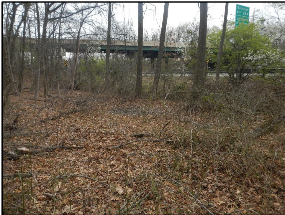
Wetland 12U – PFO