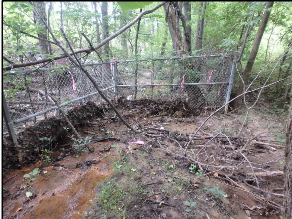
Wetland 7W – PFO