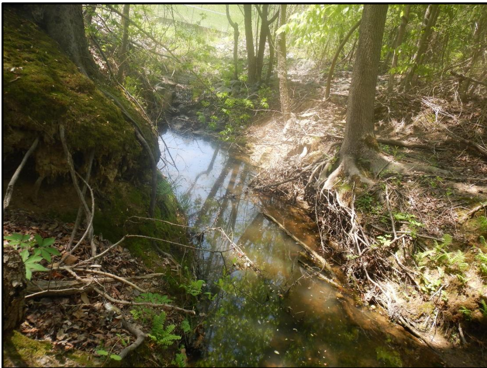
Waters 12JJJ – Perennial