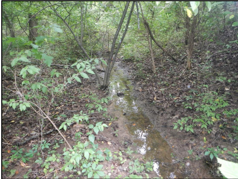
Waters 11B – Intermittent