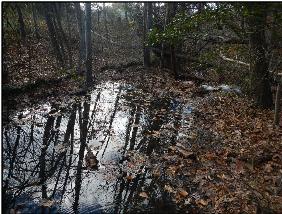
Wetland 12AAAA – Intermittent