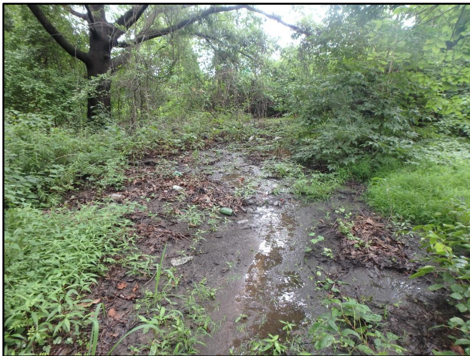
Wetland 9E – PEM