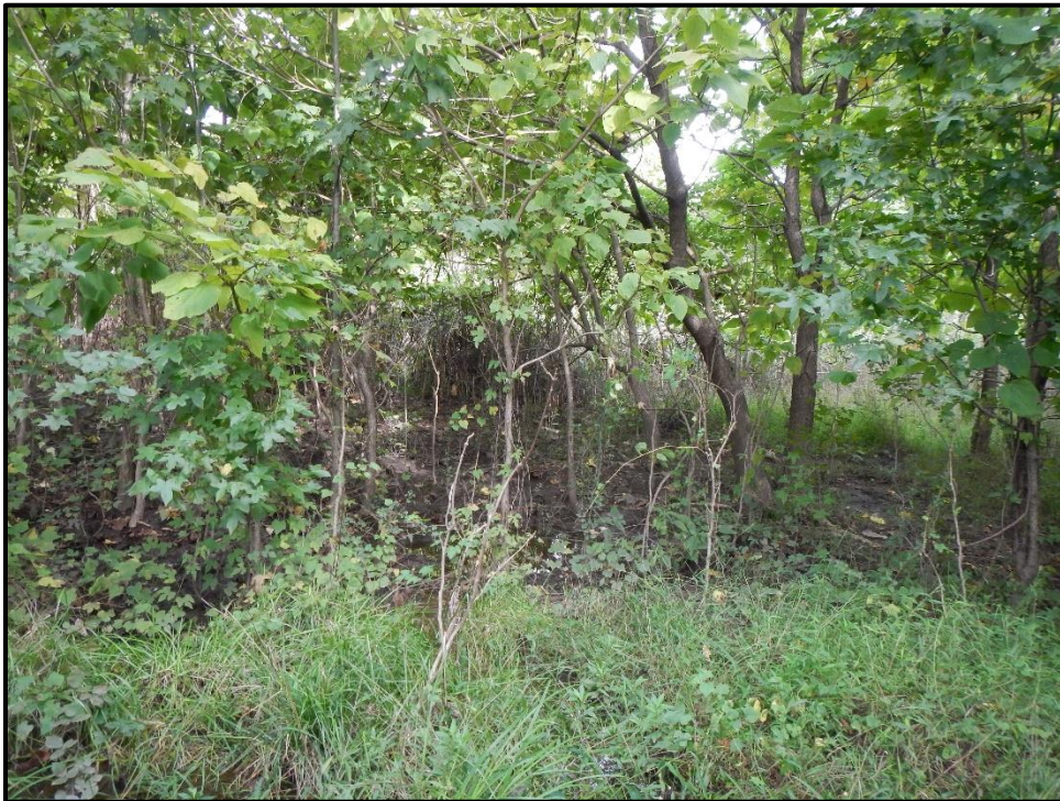
Wetland 11Z - PFO