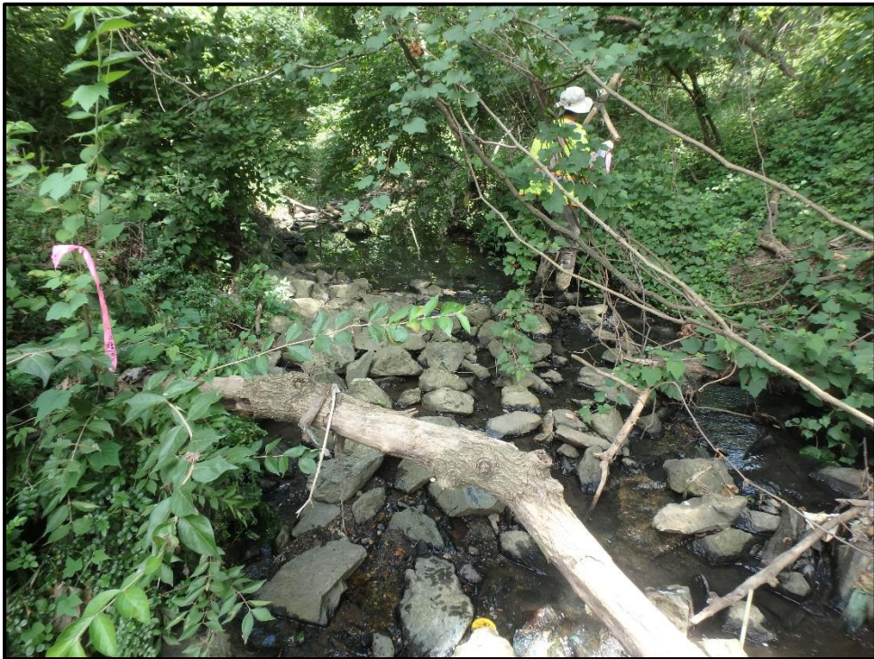
Waters 7S – Perennial