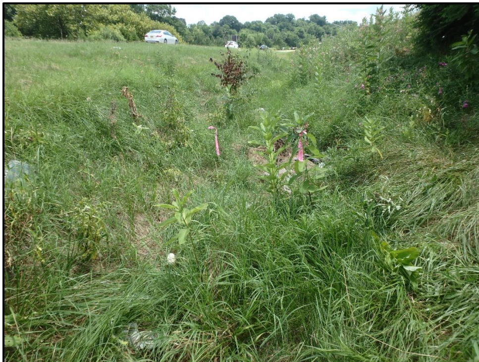
Wetland 7R – PEM