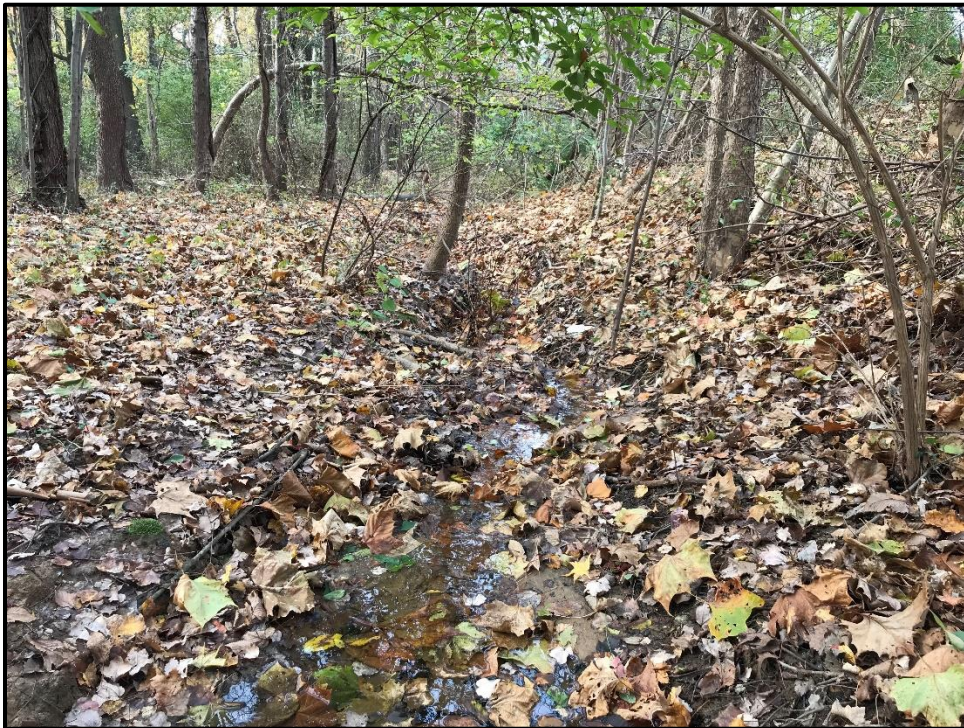
Waters 10KK – Intermittent