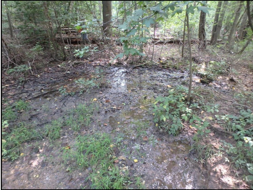
Wetland 9KK – PFO