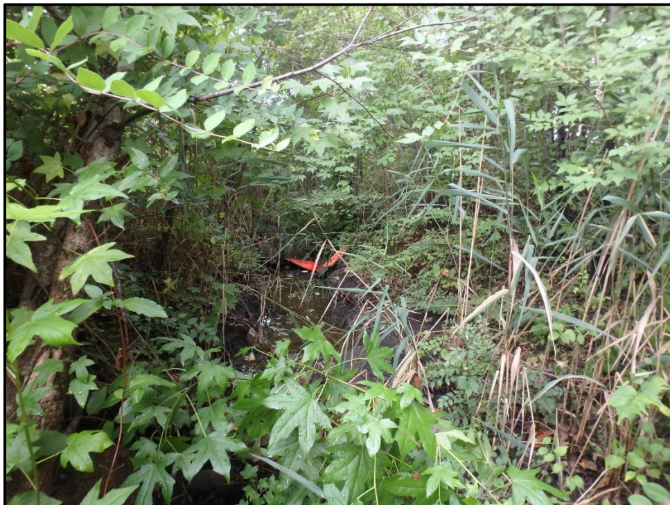
Waters 9UU – Ephemeral