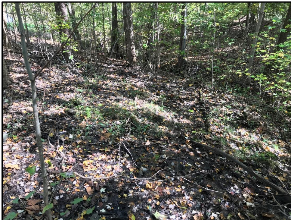
Wetland 8JJ – PFO