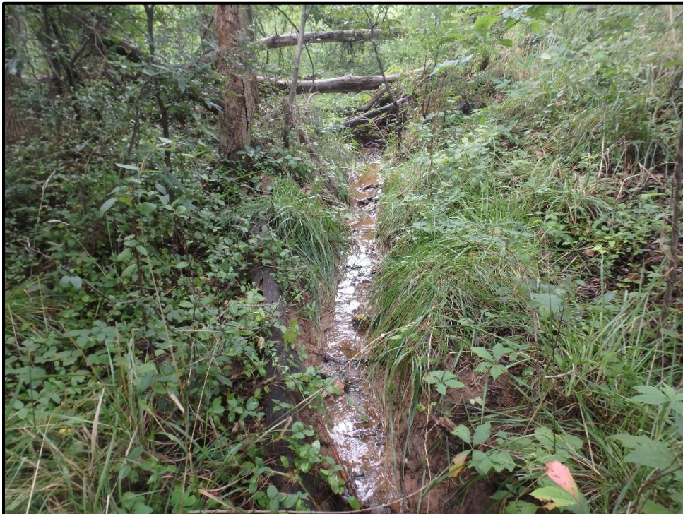
Waters 9M – Intermittent