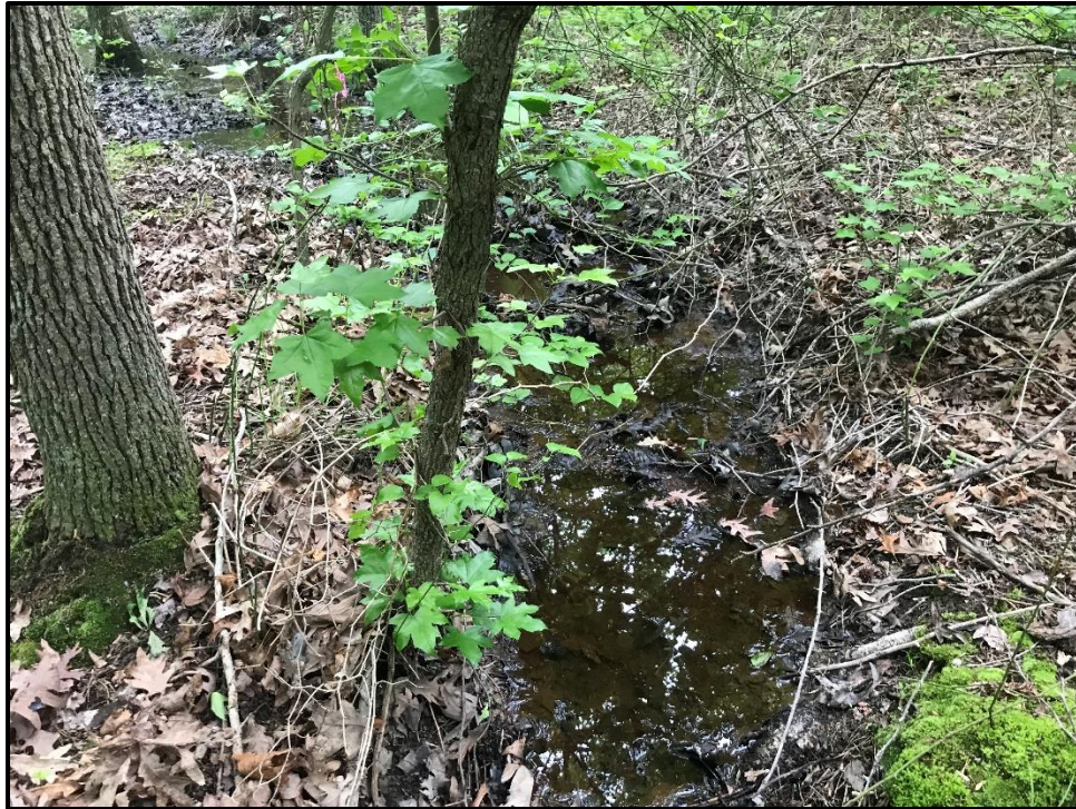
Waters 12MMMM - Intermittent