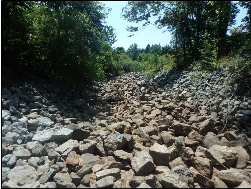
Waters 8F – Intermittent