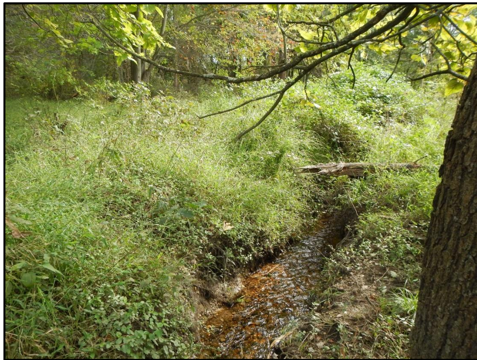
Waters 11BB – Intermittent