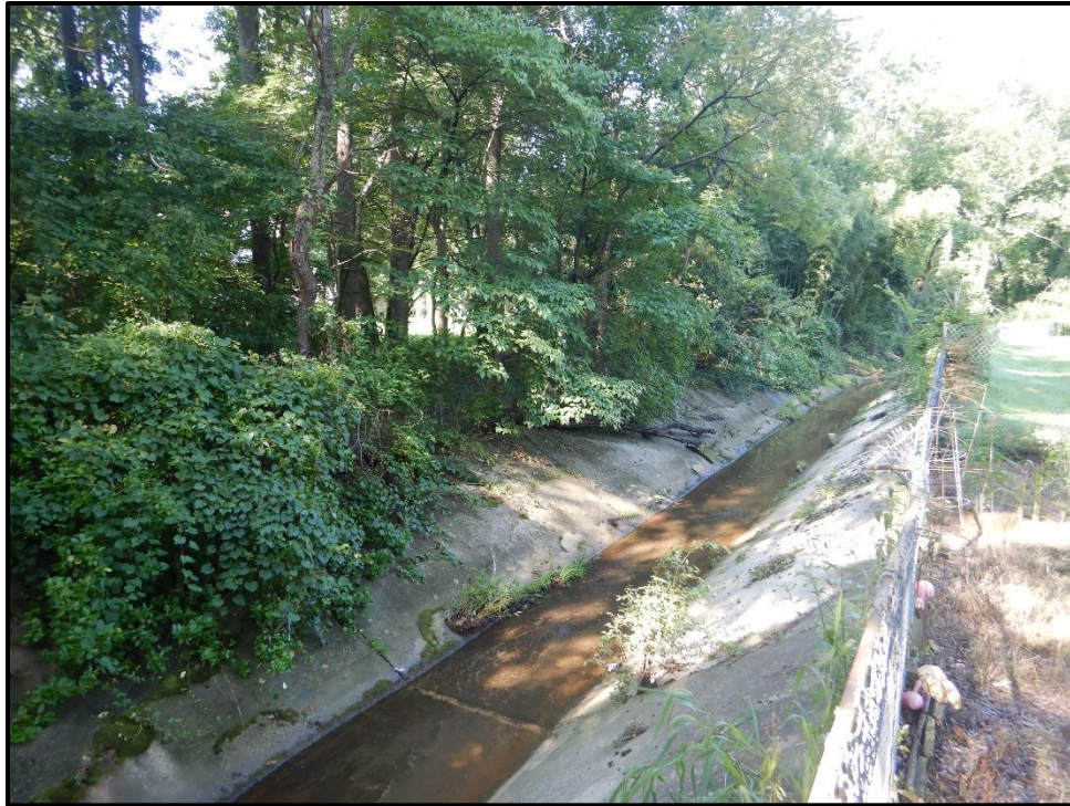
Waters 9Y – Perennial