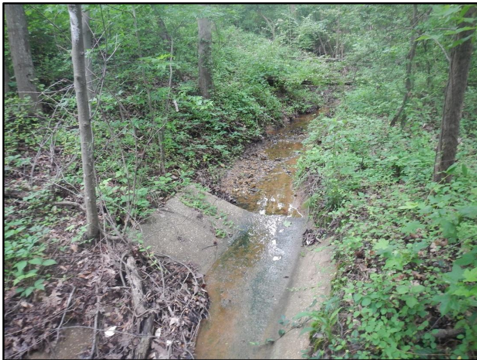
Waters 10S – Perennial