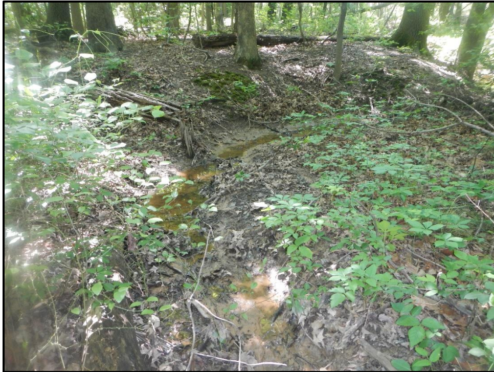
Waters 10L – Intermittent