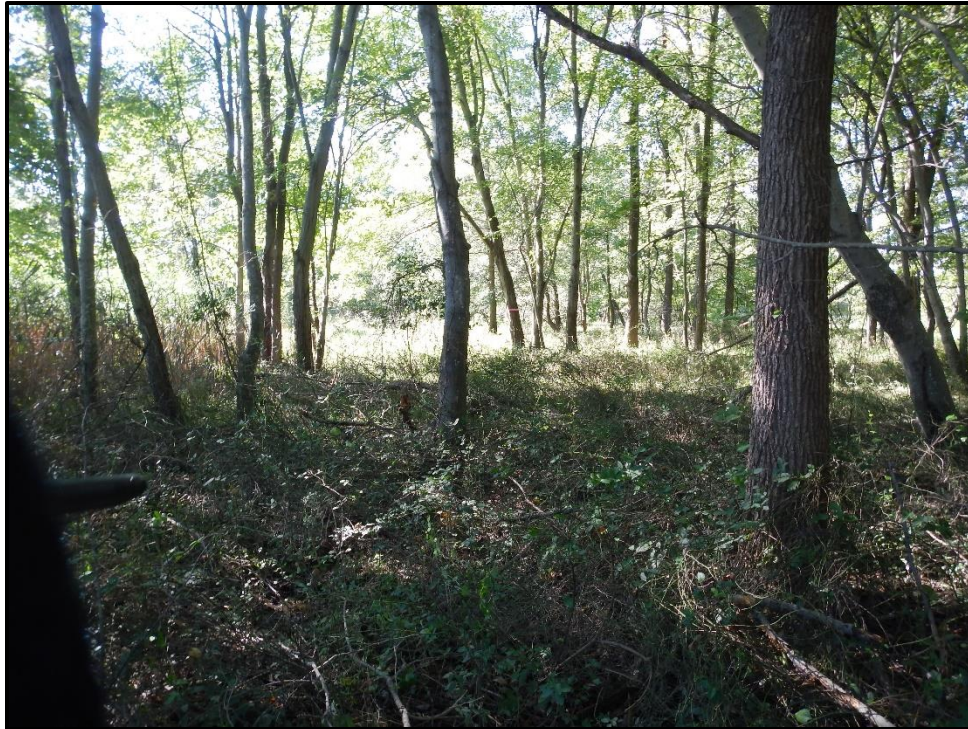
Wetland 11U - PFO