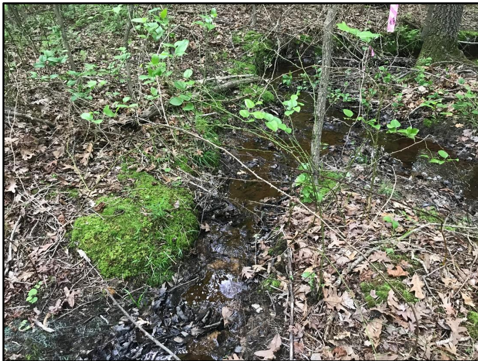
Waters 12MMMM - Intermittent