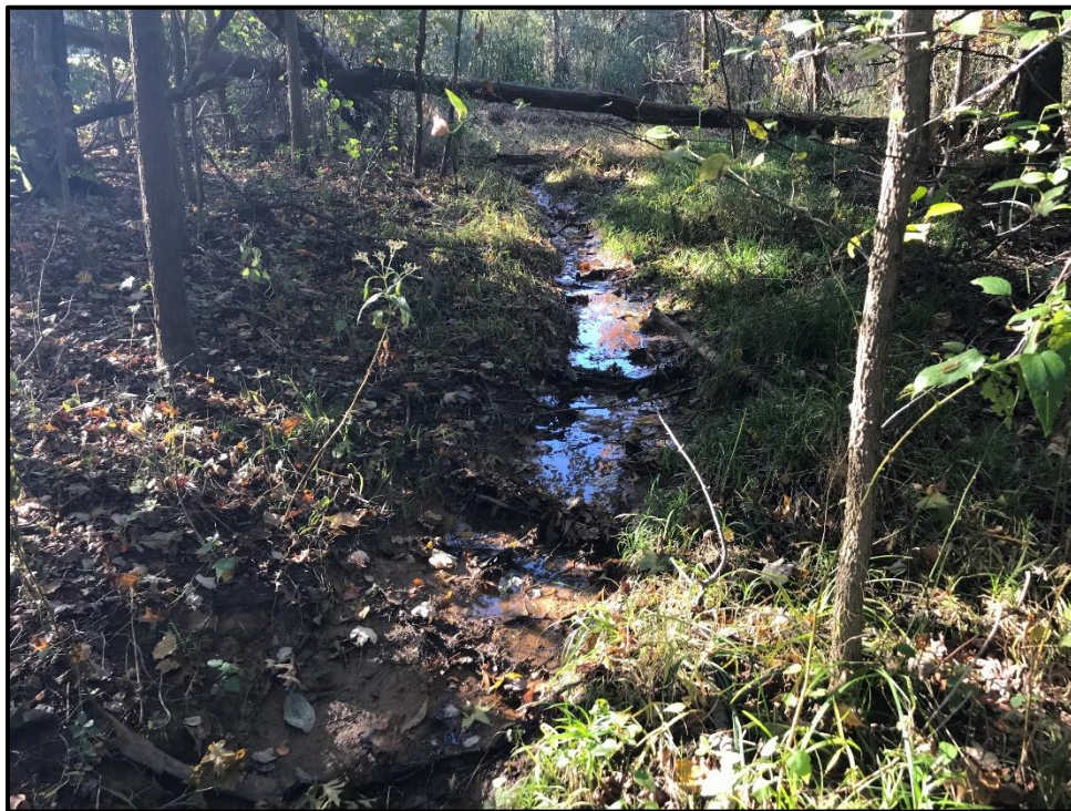
Waters 8EE – Ephemeral