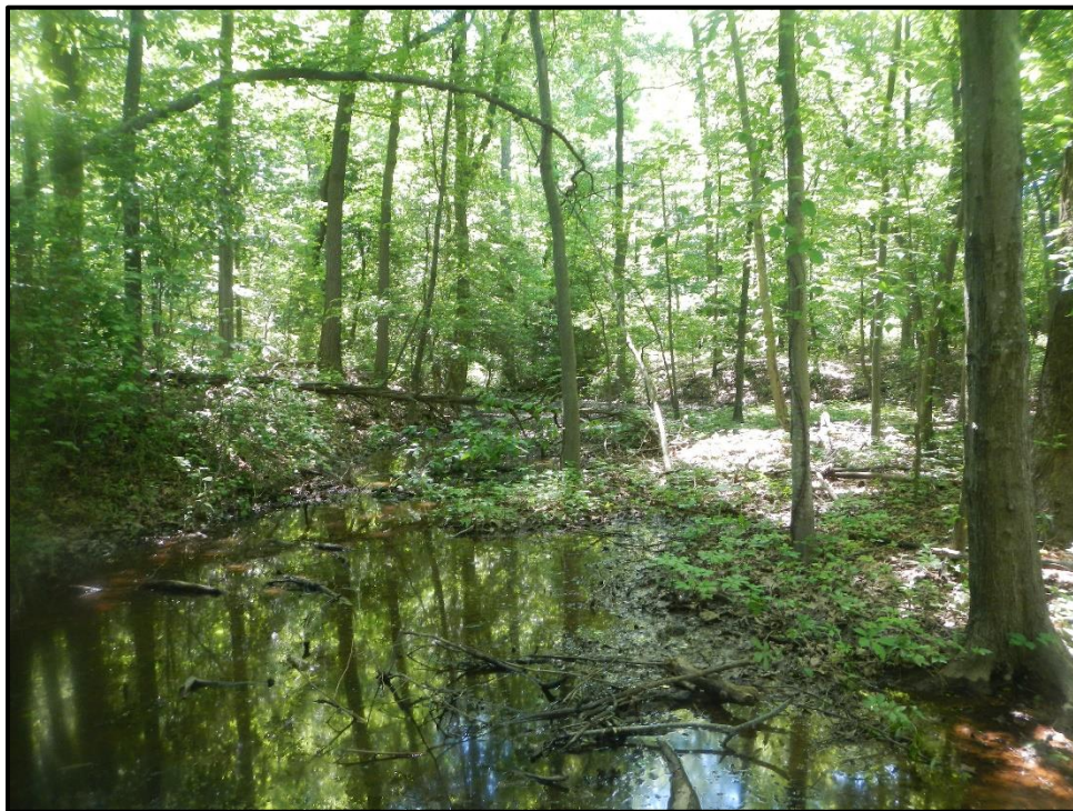
Wetland 10M – PFO