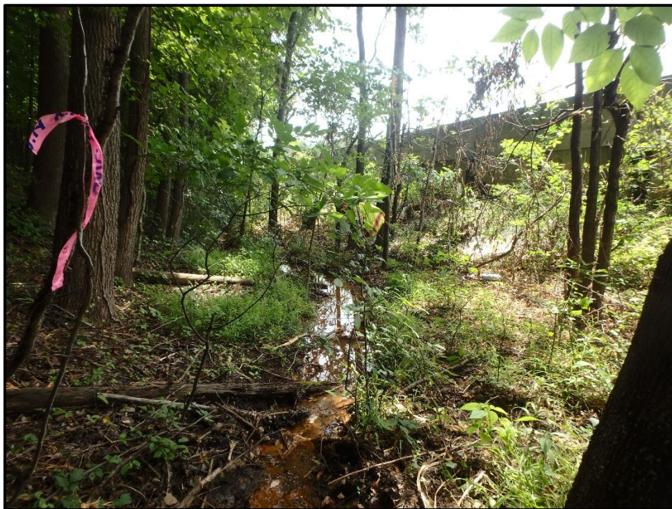
Waters 7T – Perennial

Waters 7SS – Intermittent – Access denied to property, no photo available.