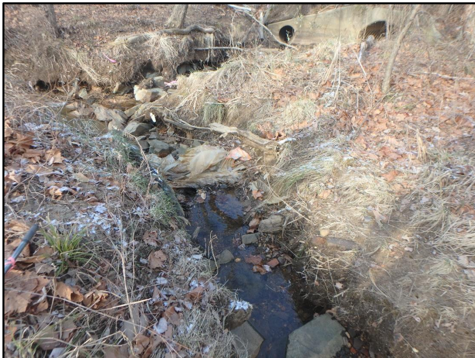
Waters 8MM – Intermittent