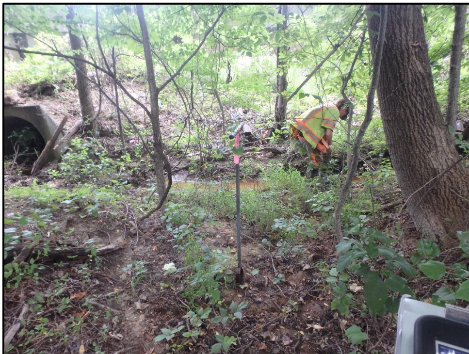
Wetland 7Y – PFO