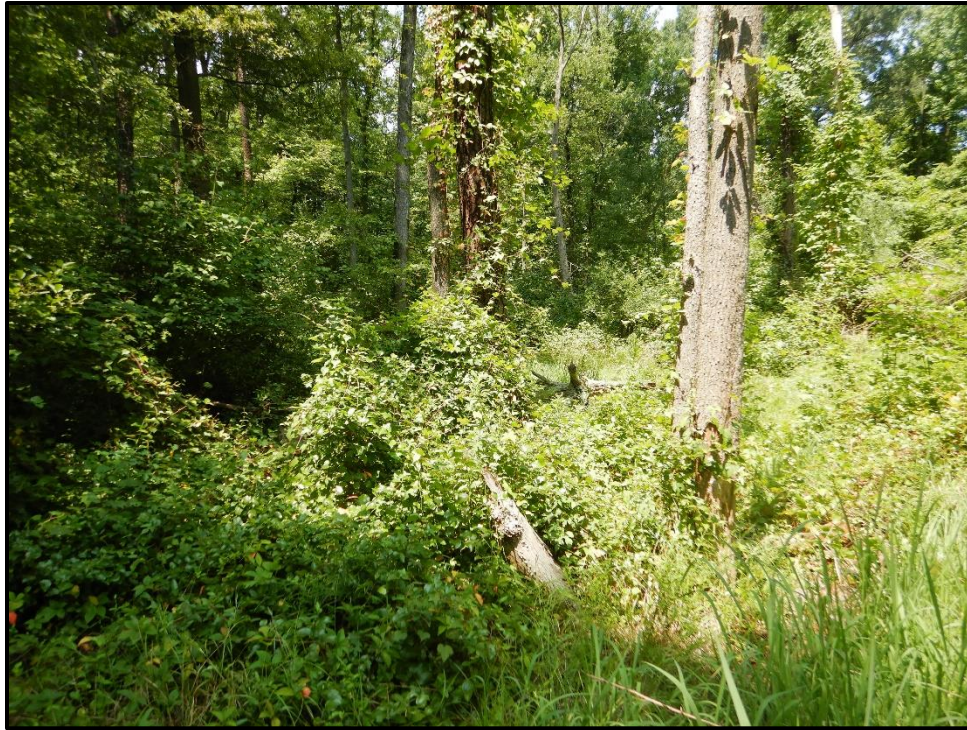
Wetland 9BB – PFO