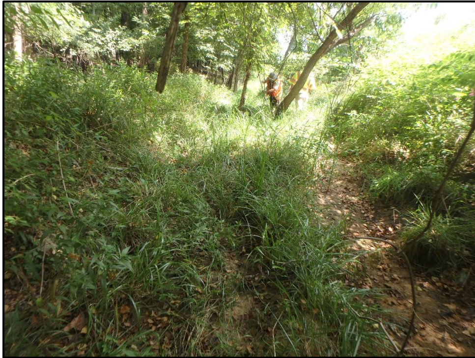
Wetland 8L – PFO