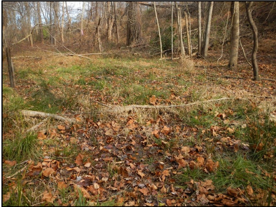
Wetland 12CCCC – PFO