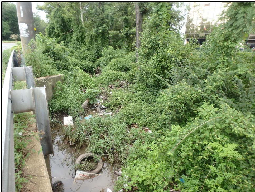
Waters 8R – Perennial