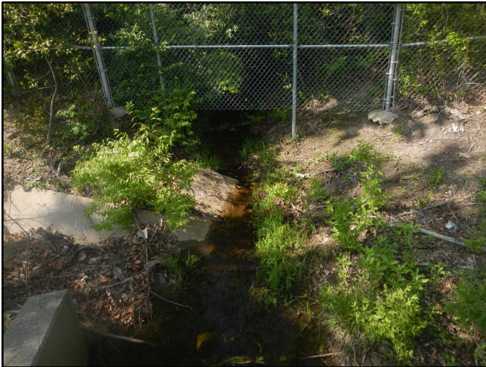
Waters 12RRR – Perennial