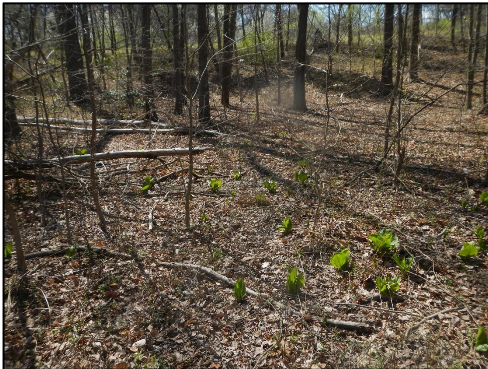
Wetland 12N - PFO