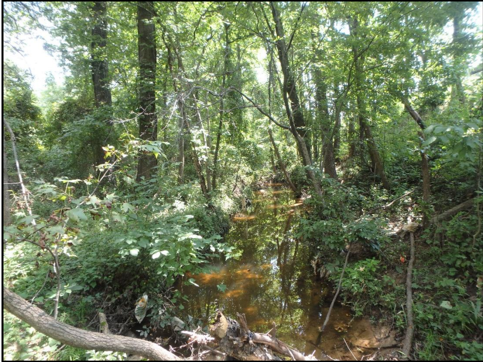
Waters 9JJ – Perennial