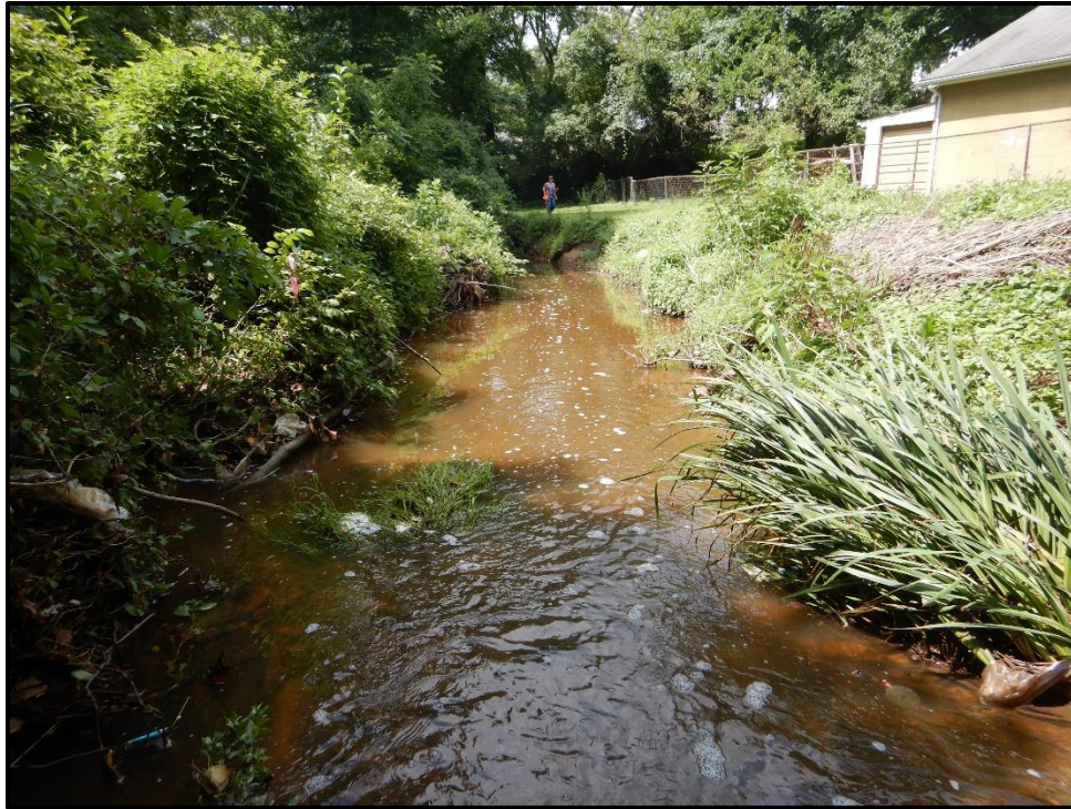
Waters 9G – Perennial