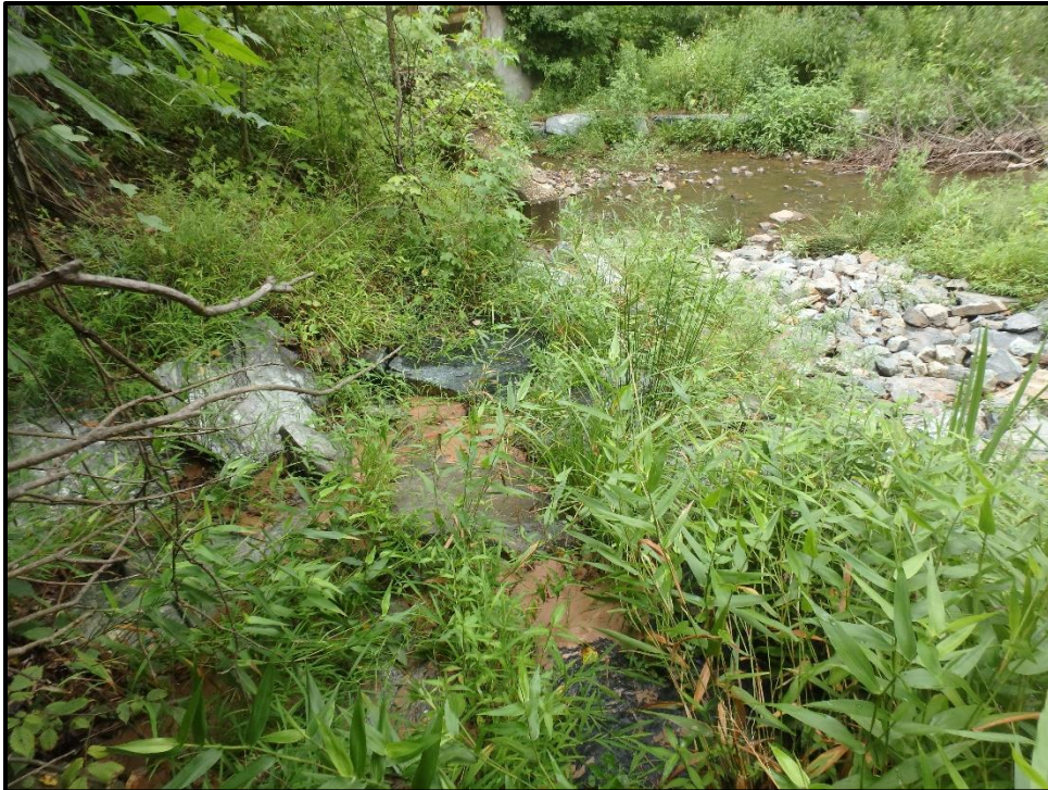
Waters 9F – Intermittent