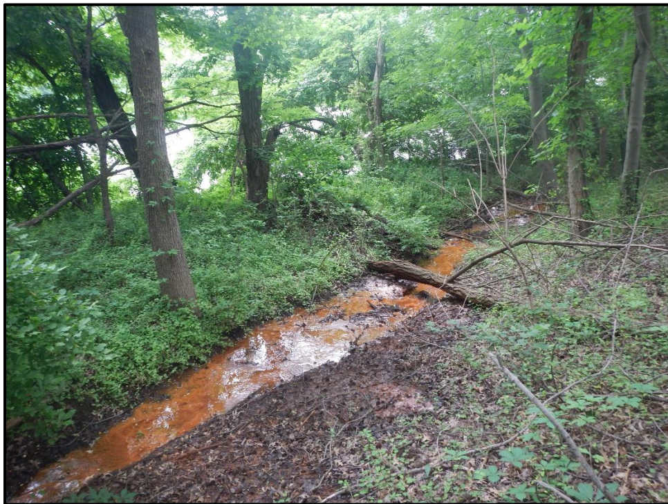
Waters 10U – Perennial