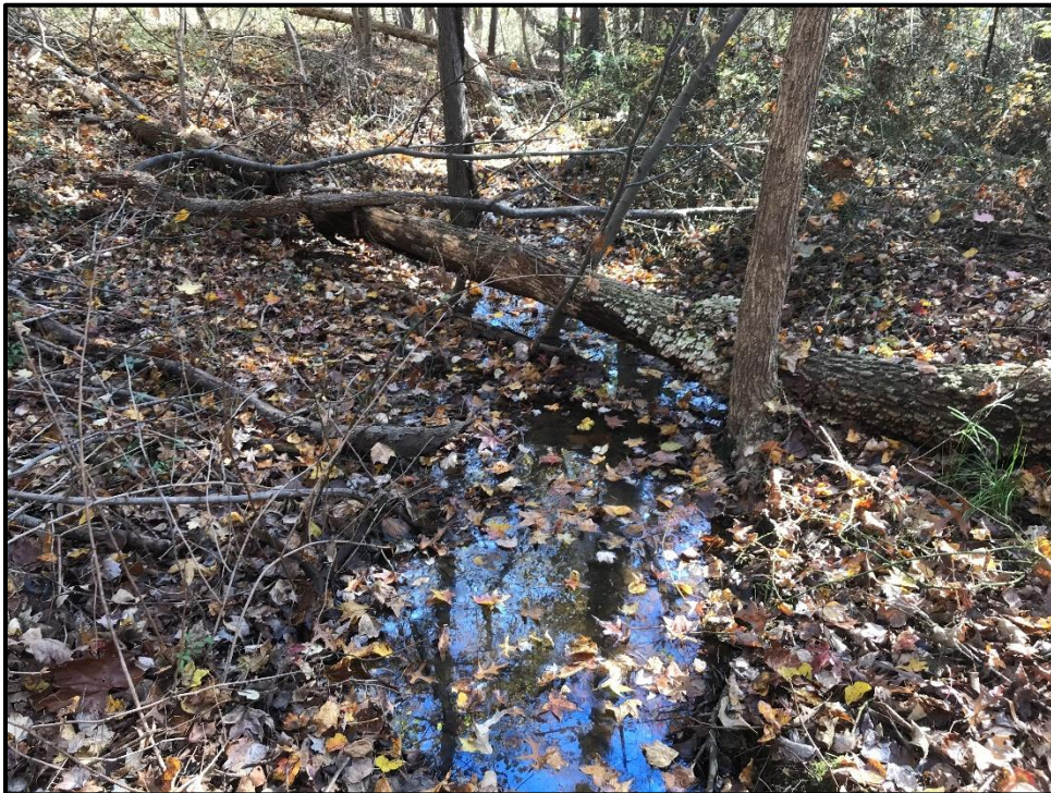
Waters 10FF – Intermittent