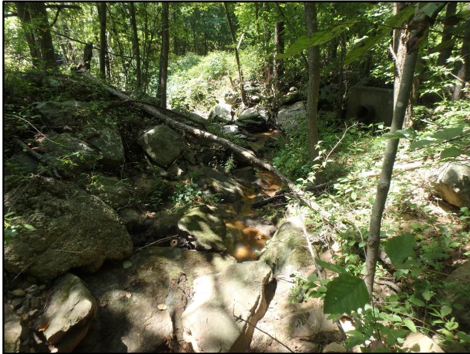
Waters 9II – Intermittent