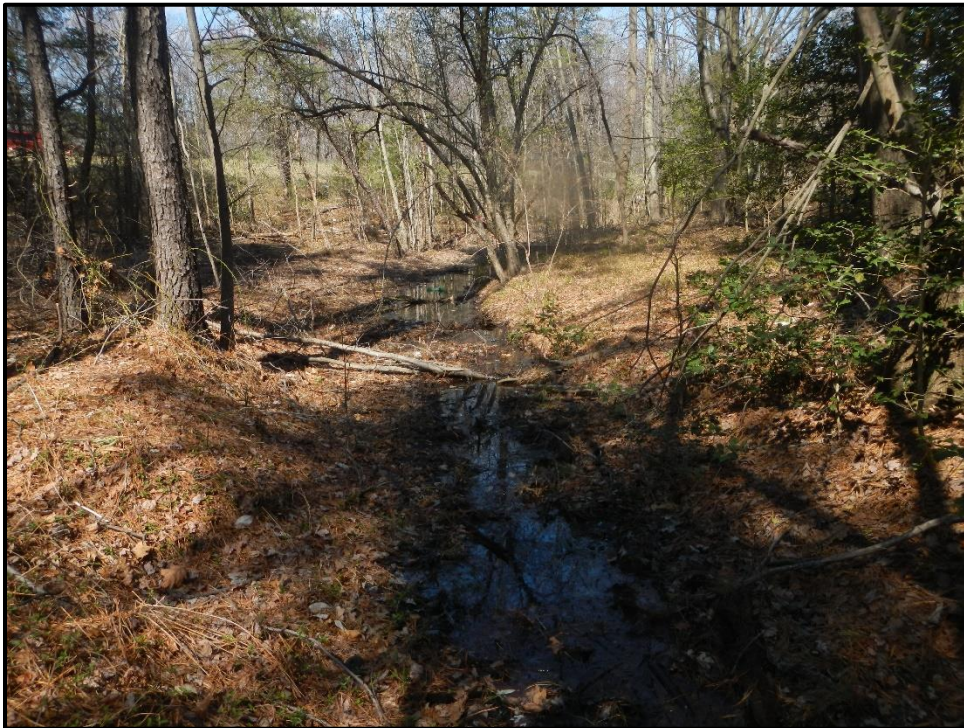
Waters 12P – Intermittent