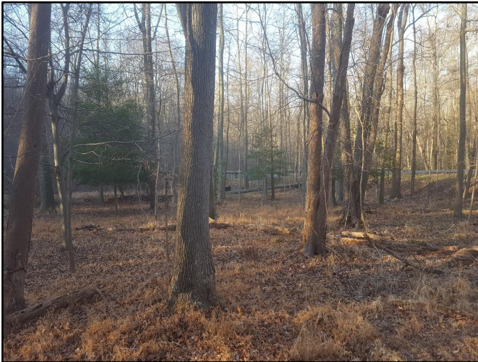
Wetland 10XX – PFO