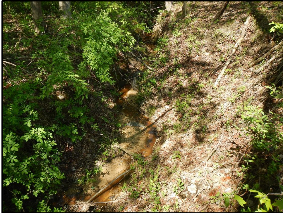
Waters 12HHH – Intermittent