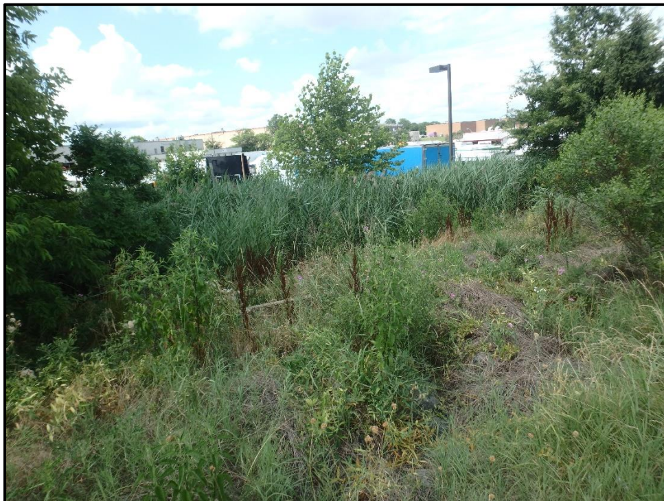
Wetland 7P – PEM