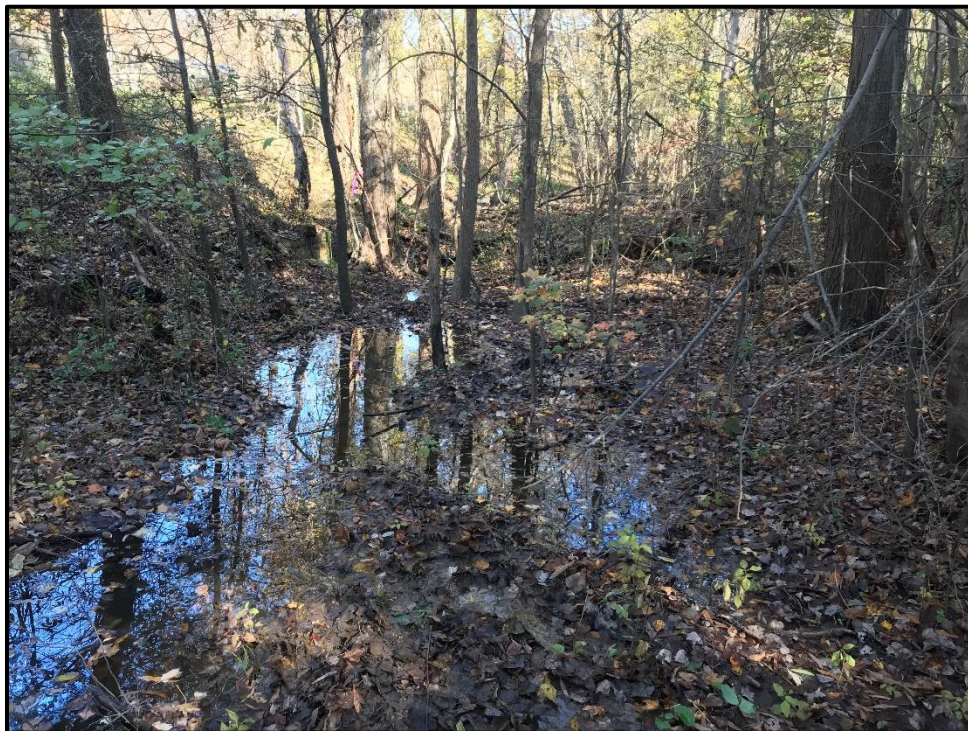
10EE - PFO