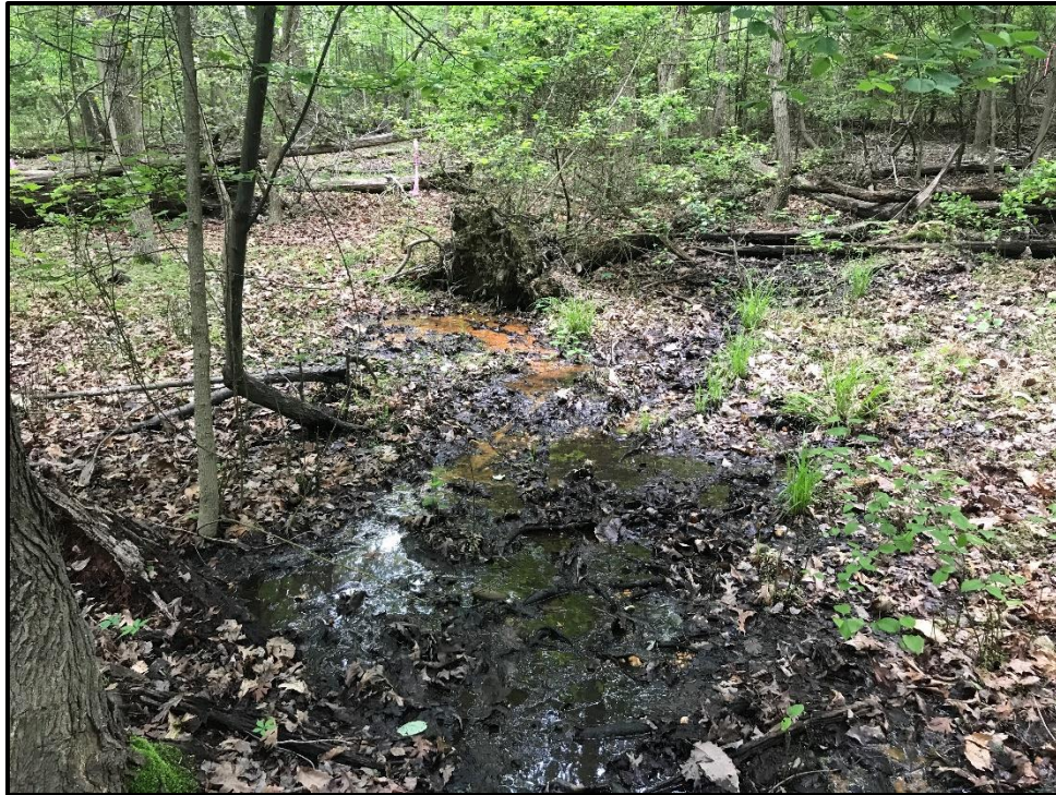
Wetland 12JJJ – PFO