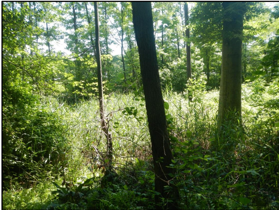
Wetland 10Z – PFO