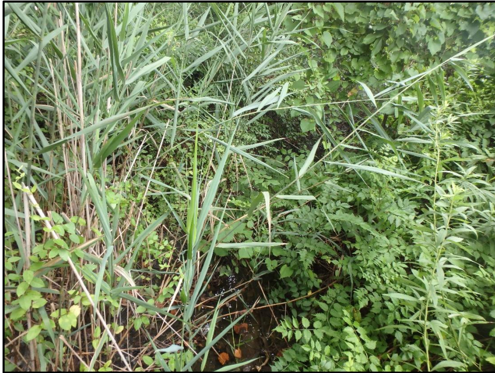
Waters 9R – Intermittent