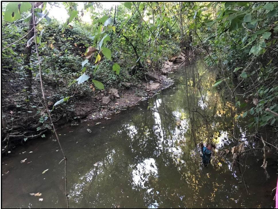
Waters 8Z – Perennial