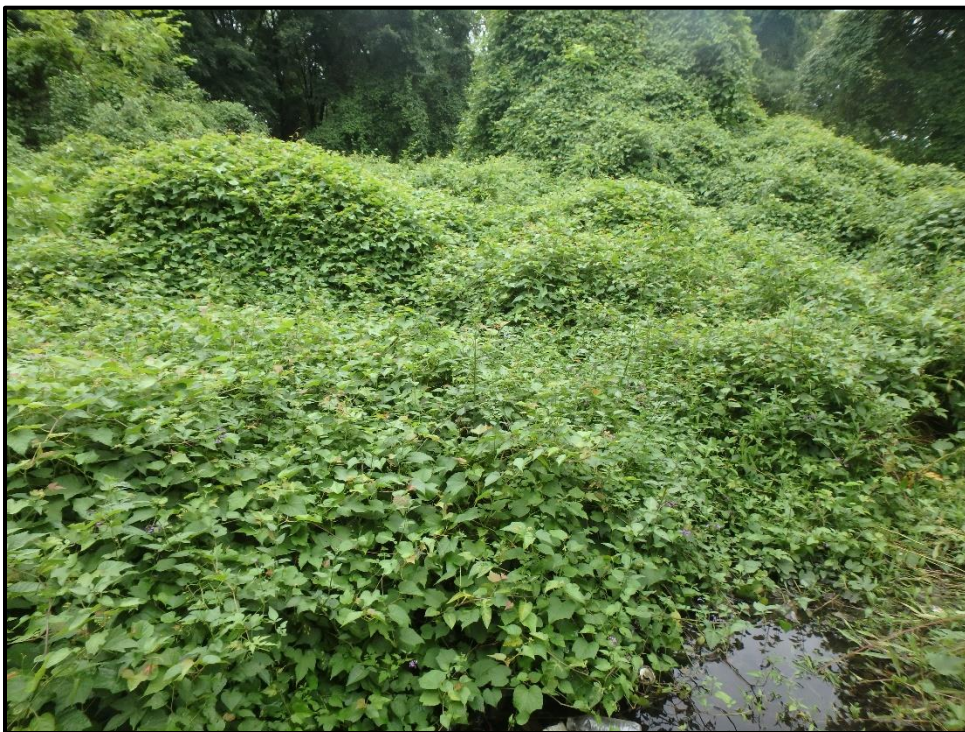
Wetland 9B – PEM