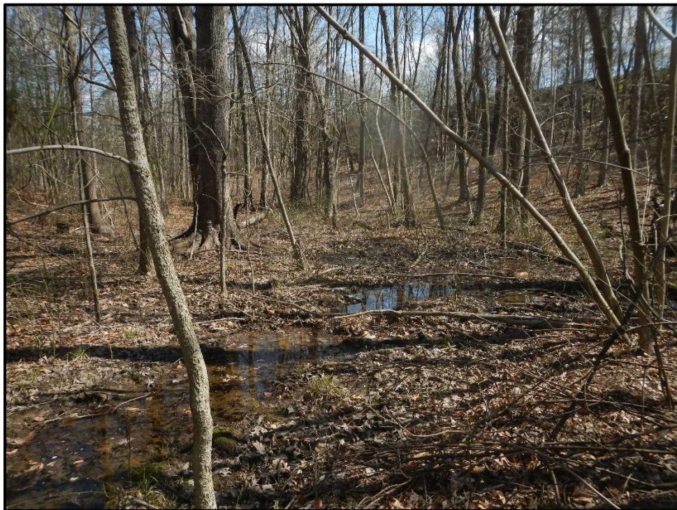
Wetland 12D – PFO