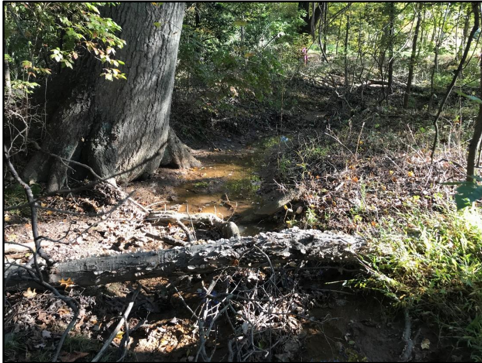
Waters 8EE - Ephemeral