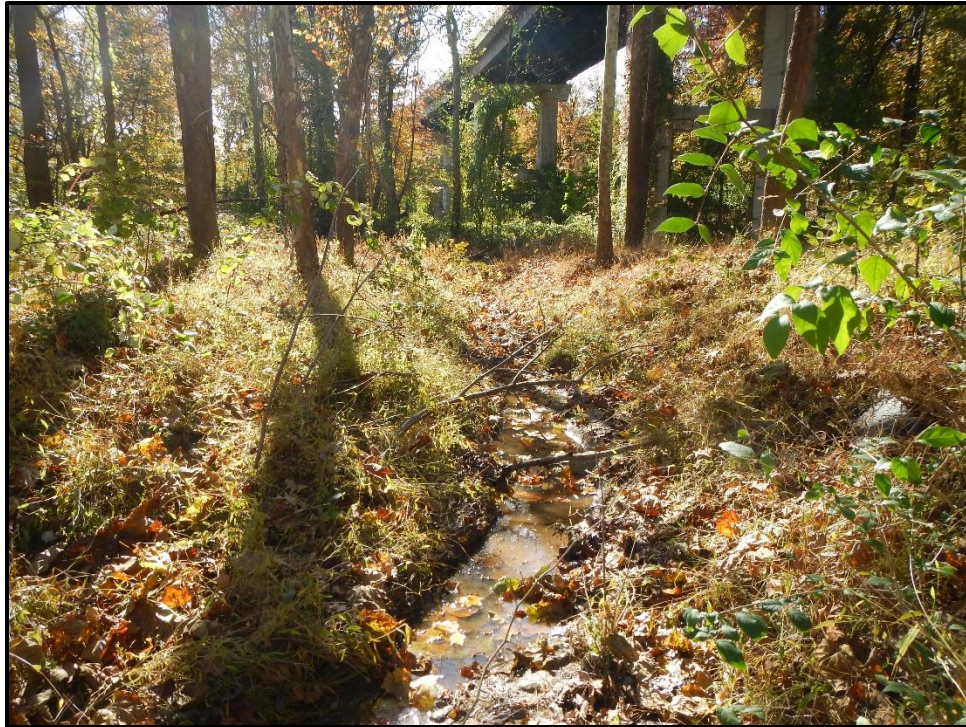
Waters 12VVV – Intermittent