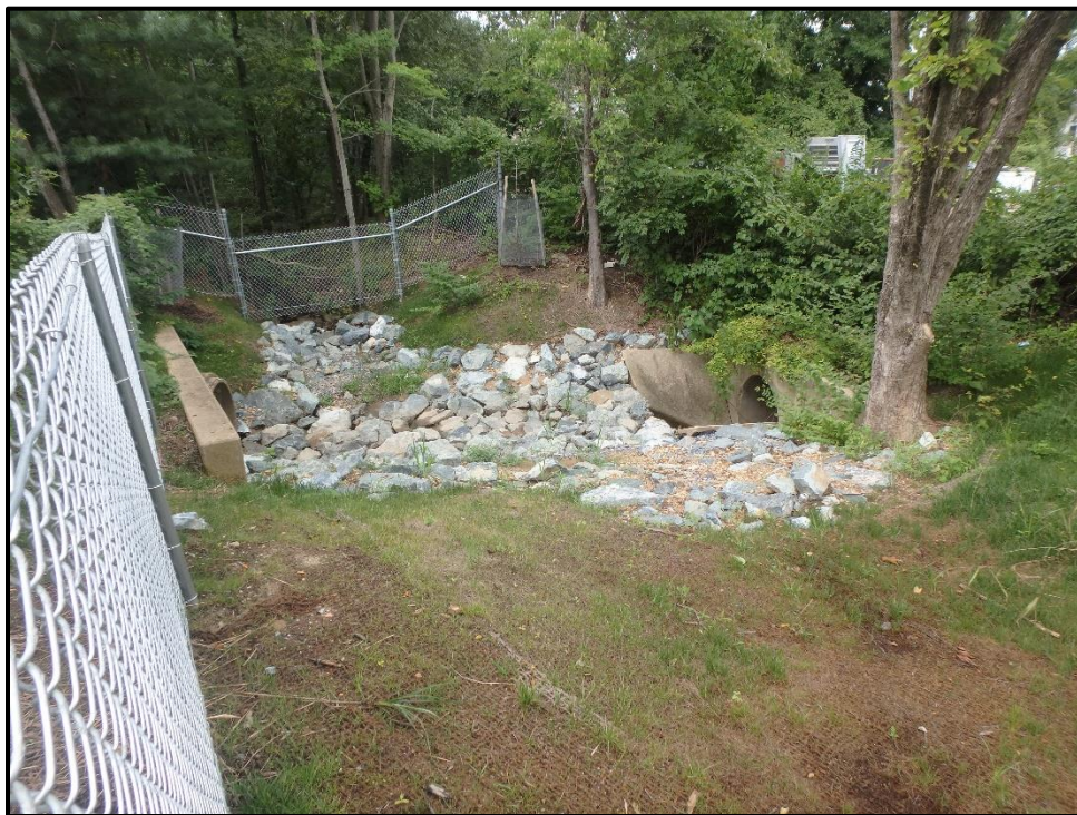
Waters 9C – Intermittent