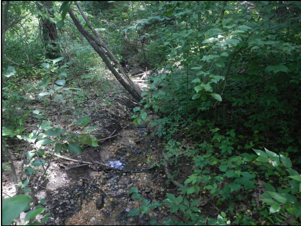
Waters 11C – Intermittent