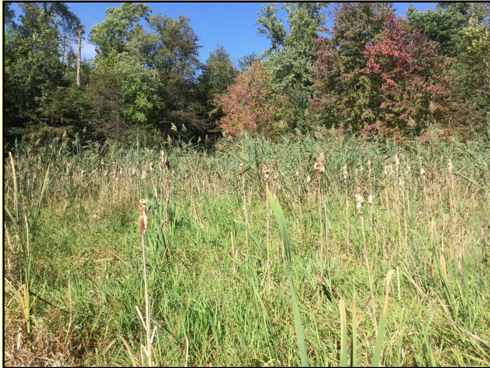
Wetland 12TTT – PEM