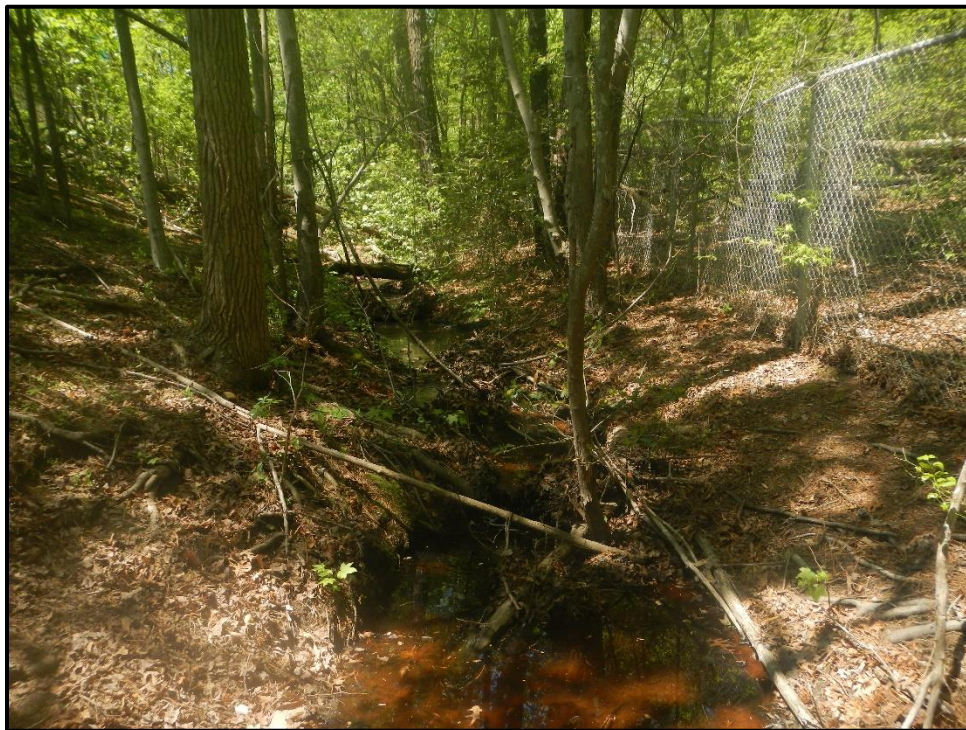
Waters 12KKK – Intermittent