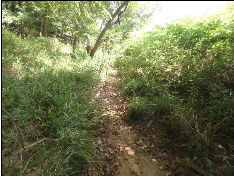
Waters 8J – Intermittent