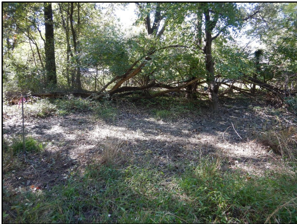
Wetland 11HH - PFO