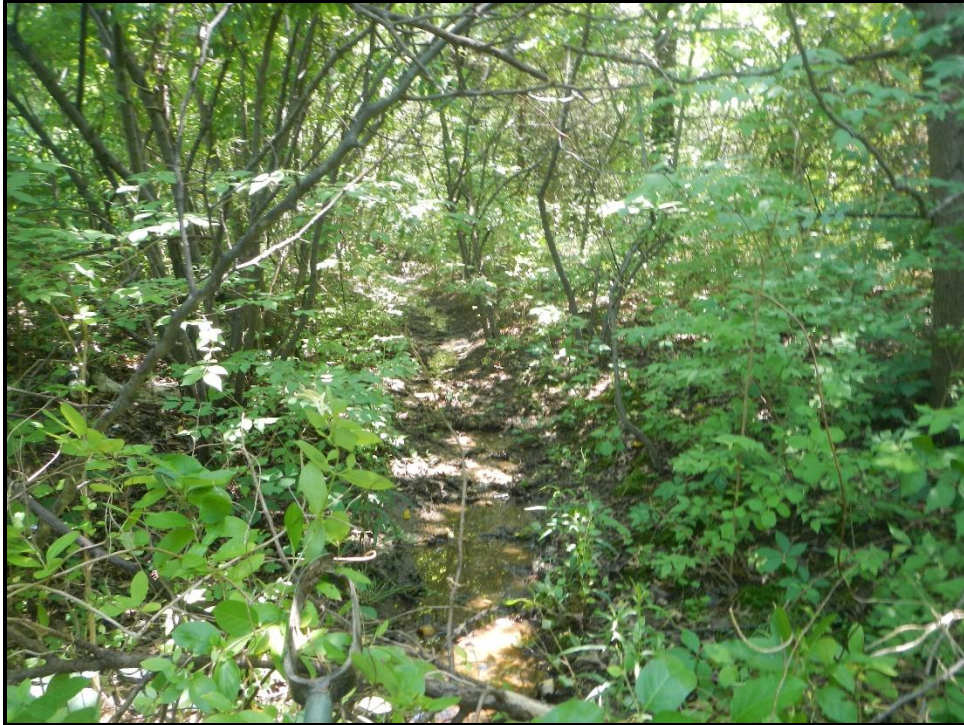
Waters 11D – Intermittent