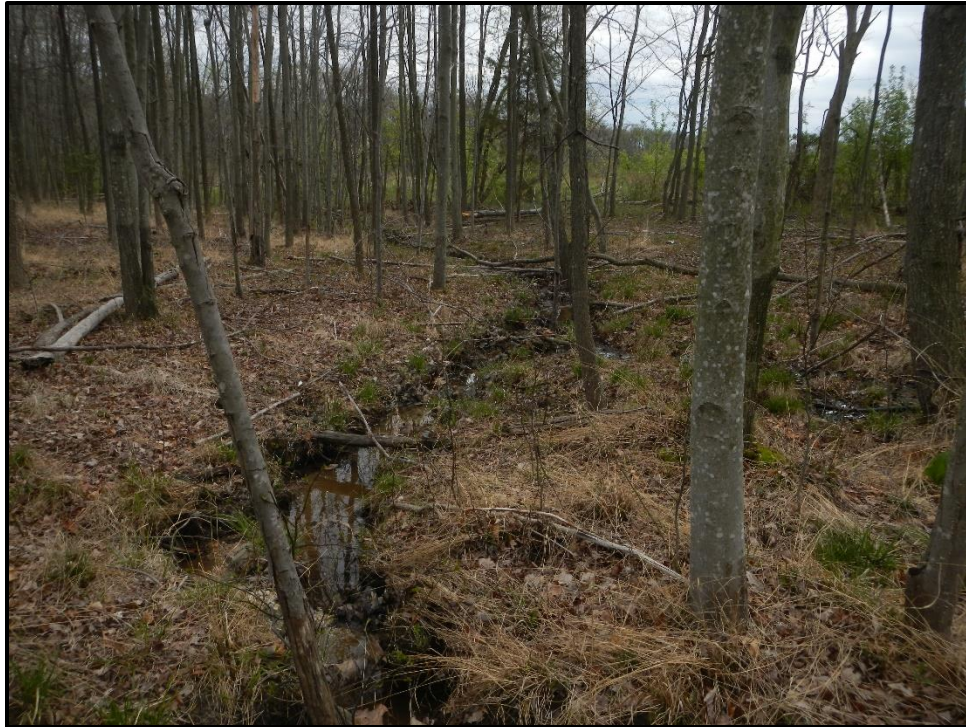
Waters 12PP – Intermittent