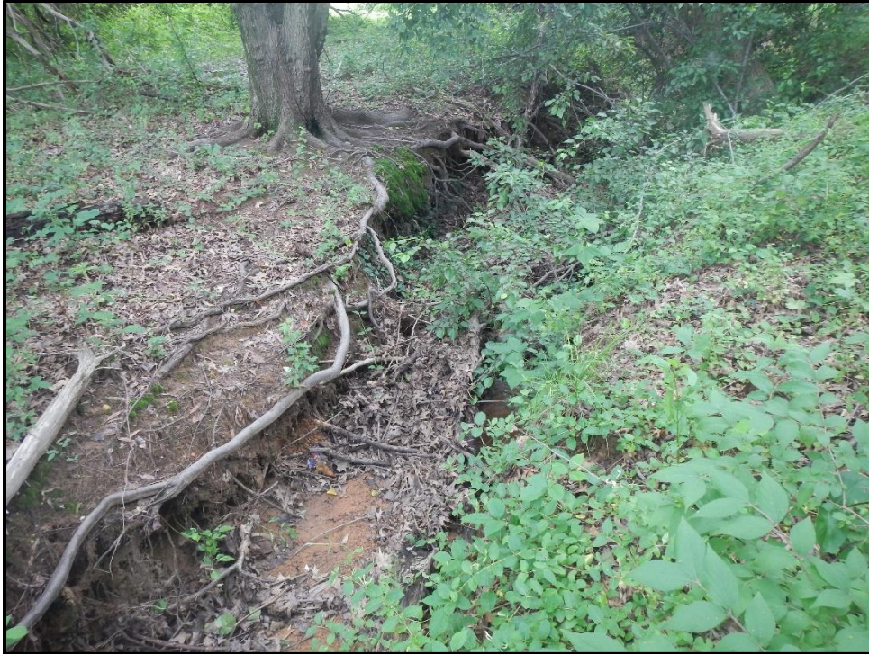
Waters 10X – Ephemeral