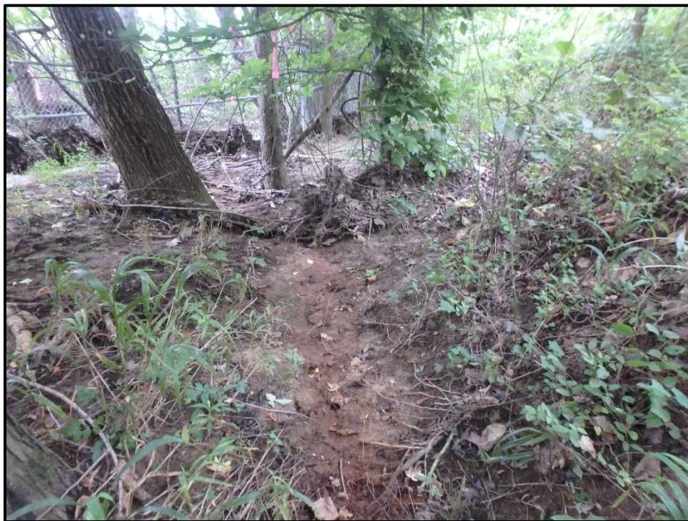
Waters 7V – Ephemeral