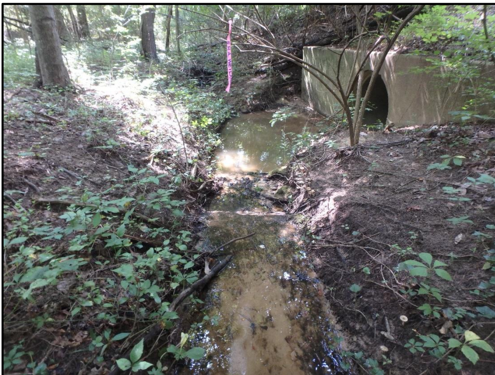
Waters 9CC – Perennial