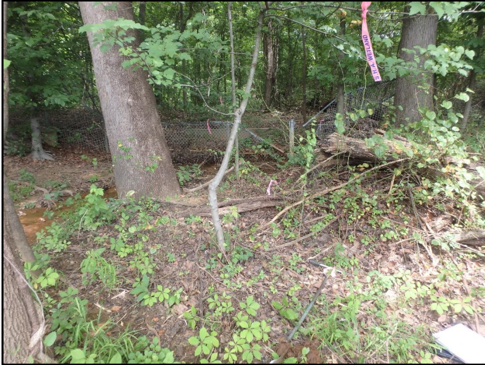
Wetland 7Z – PFO