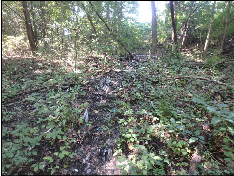
Waters 900 – Ephemeral