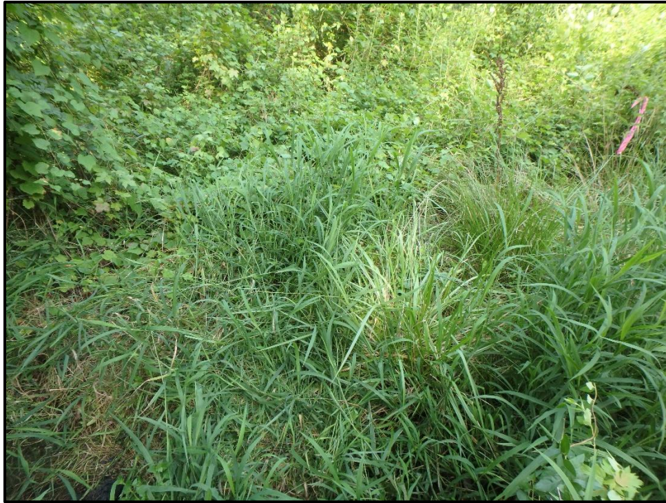
Wetland 9DD – PEM