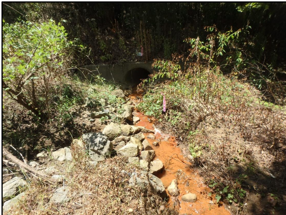
Waters 7Q – Perennial