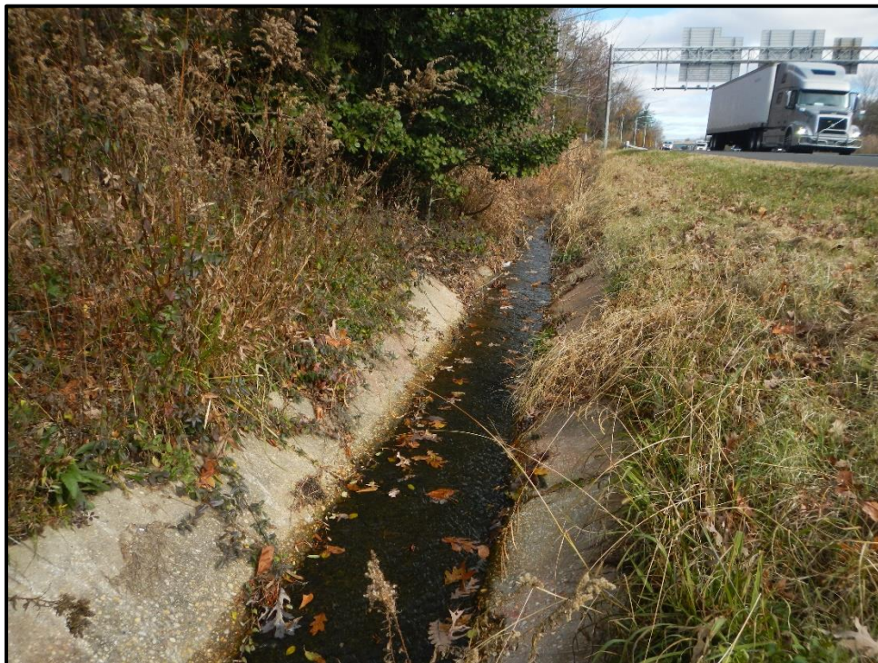
Wetland 12DDDD – PEM