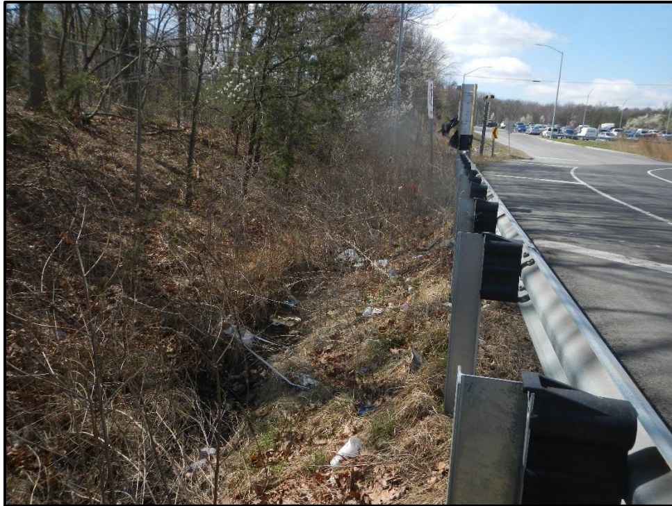
Waters 12C – Perennial