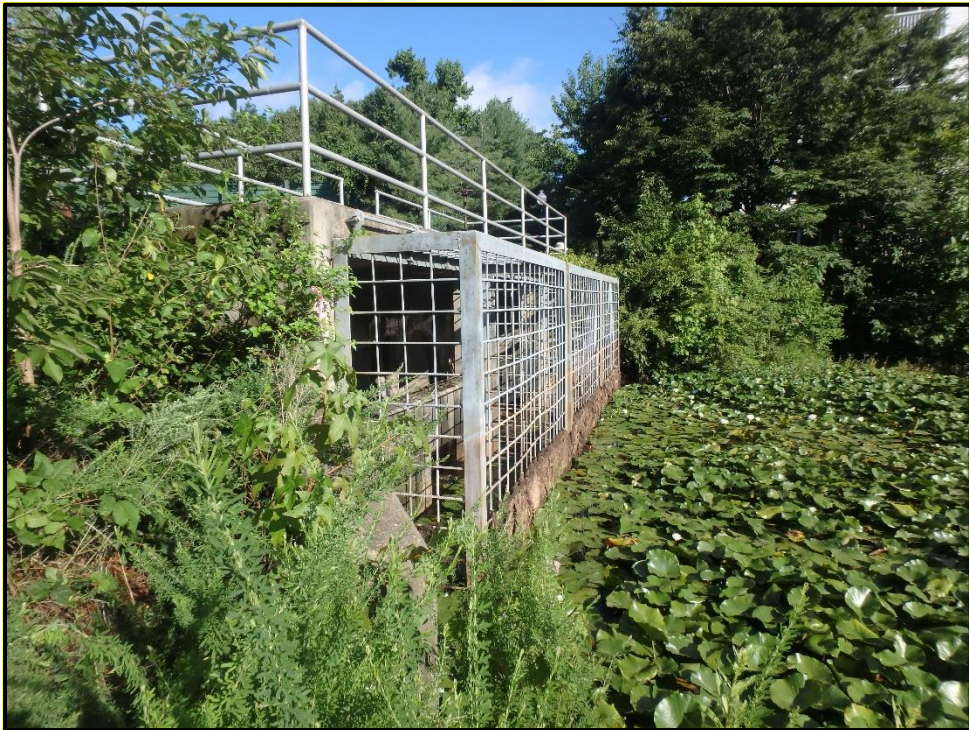
Waters 9L – POW