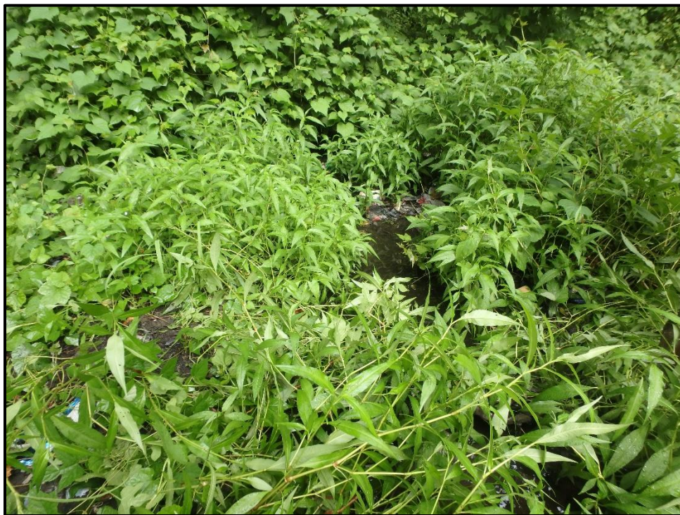
Waters 9A – Intermittent