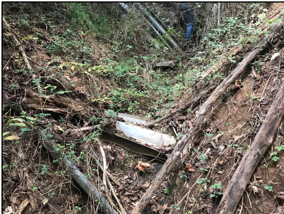
Waters 8CC – Ephemeral