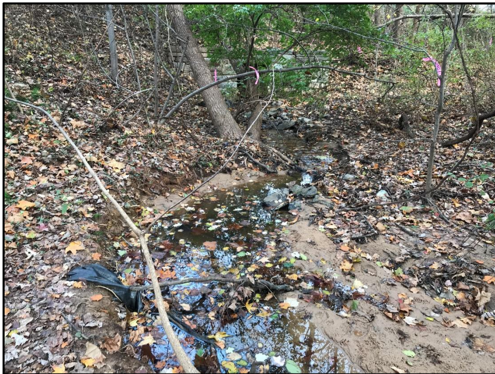
Waters 10LL – Intermittent