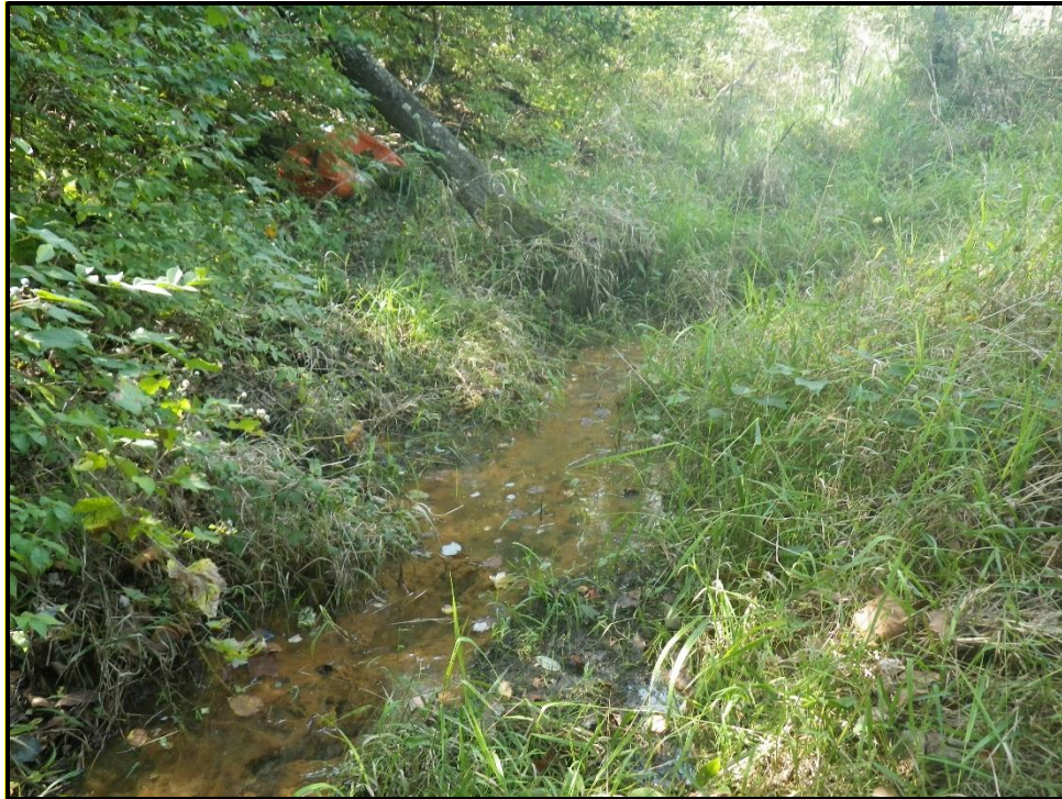
Waters 12UUU – Perennial