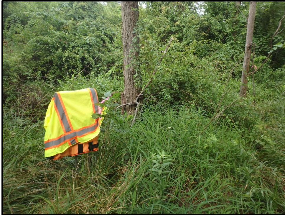
Wetland 9N – PSS