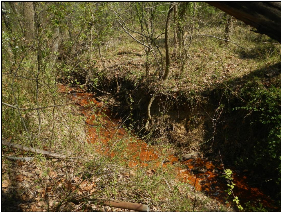
Waters 12HH – Perennial