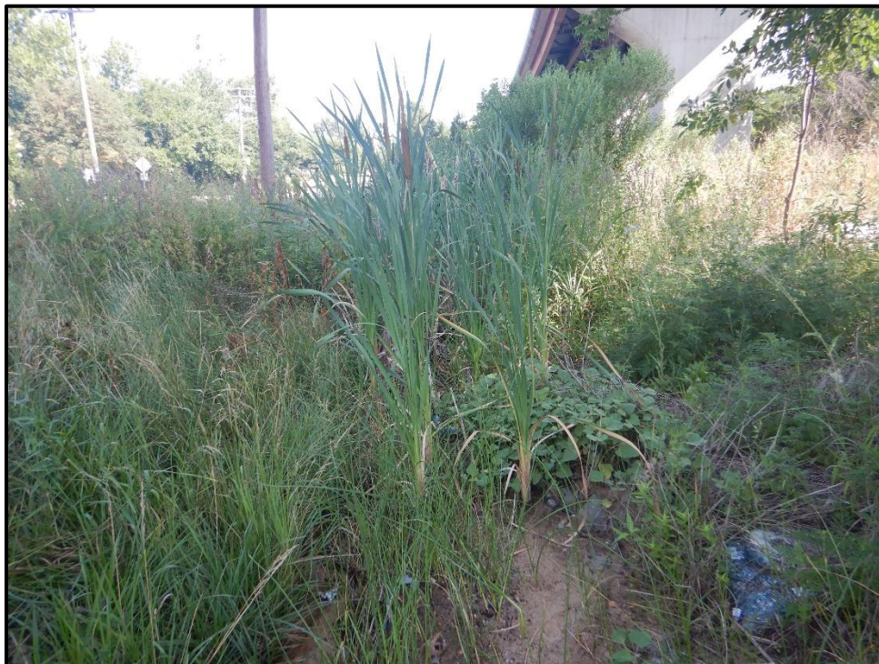
Wetland 8M – PEM