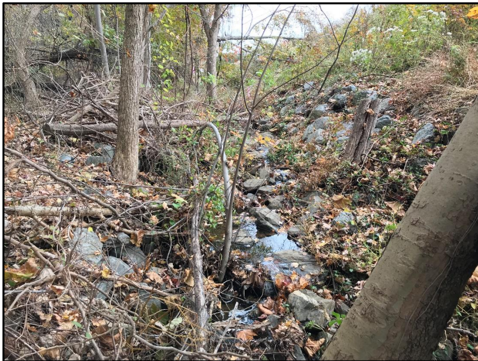
Waters 10PP – Intermittent