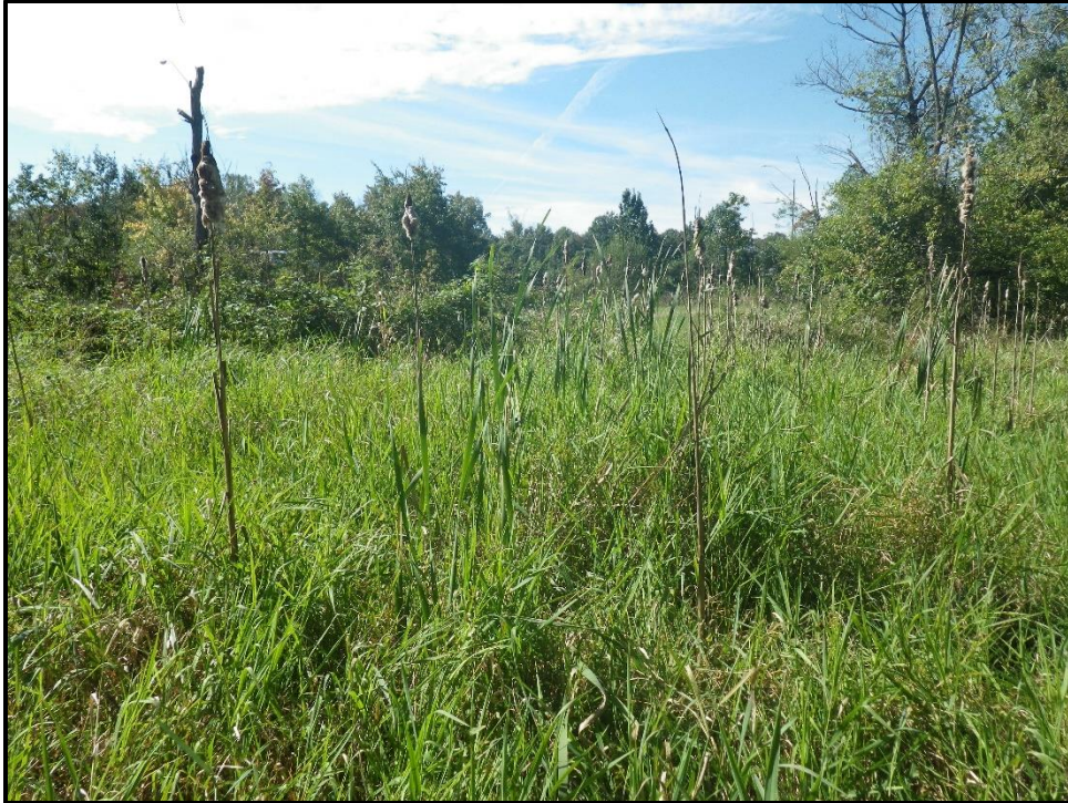
Wetland 12SSS – PFO