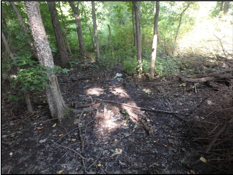
Wetland 9EE – PFO