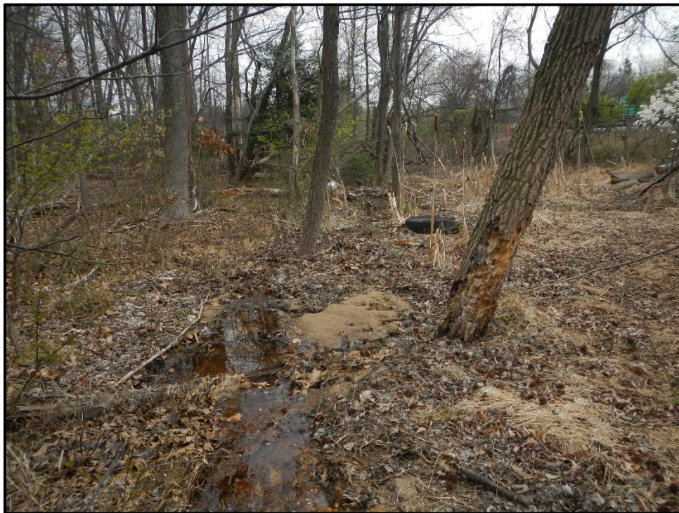
Wetland 12W – PFO