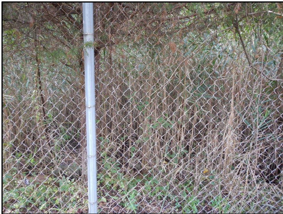
Wetland 11X - PEM