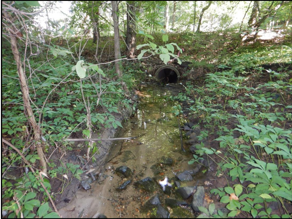
Waters 9Z – Intermittent