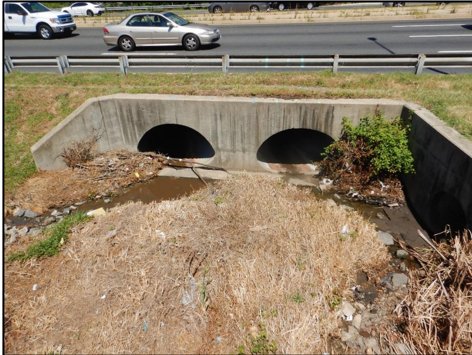
Waters 8R – Perennial