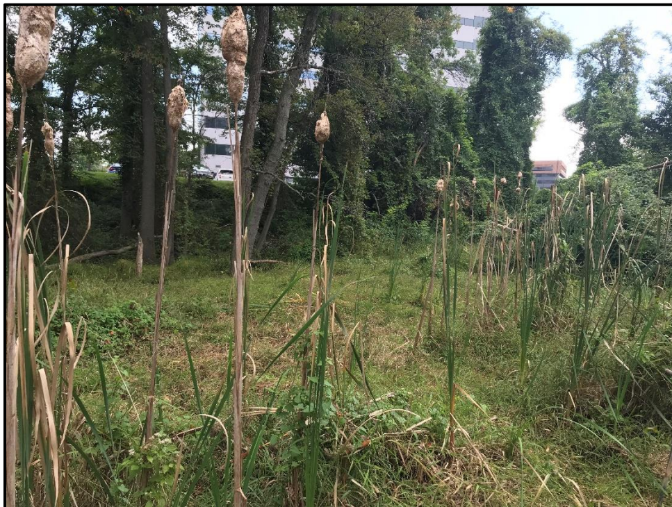
Wetland 8Y – PEM