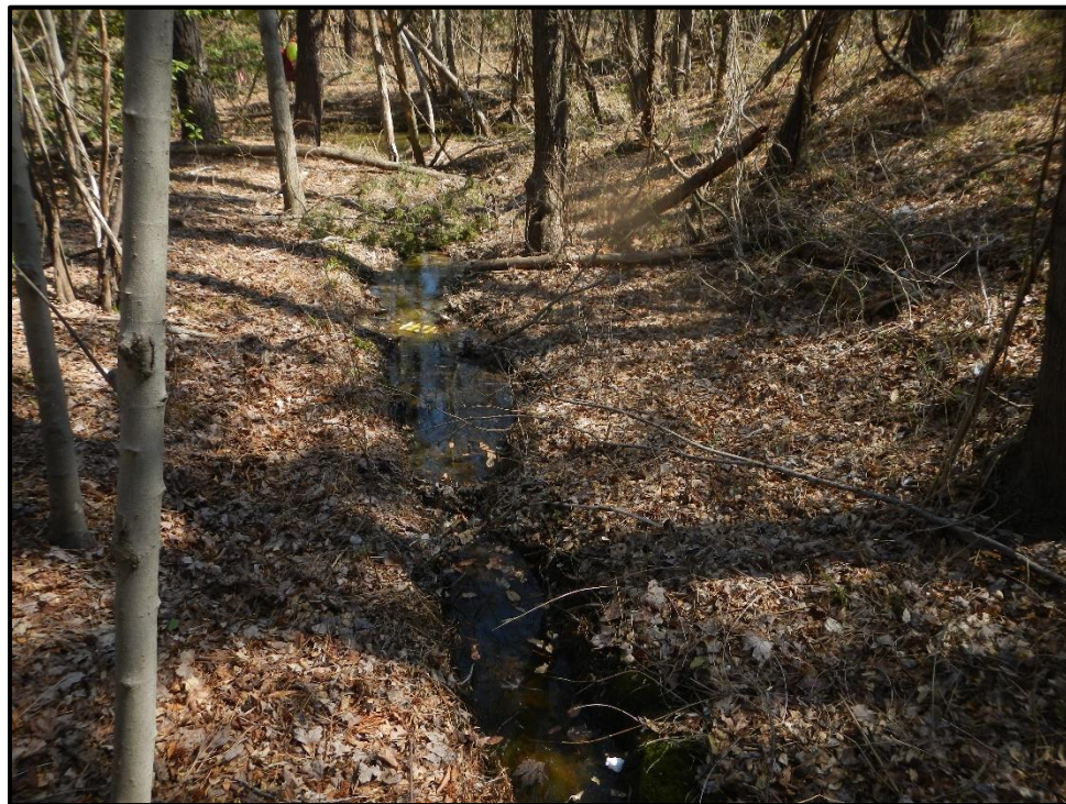
Waters 12O – Intermittent