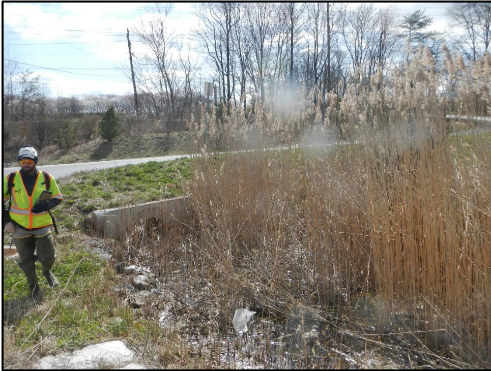
Wetland 12A - PEM