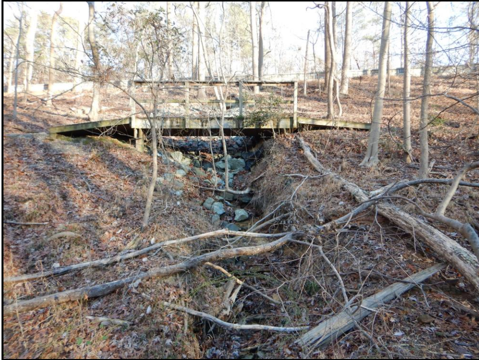
Waters 10AAA – Ephemeral