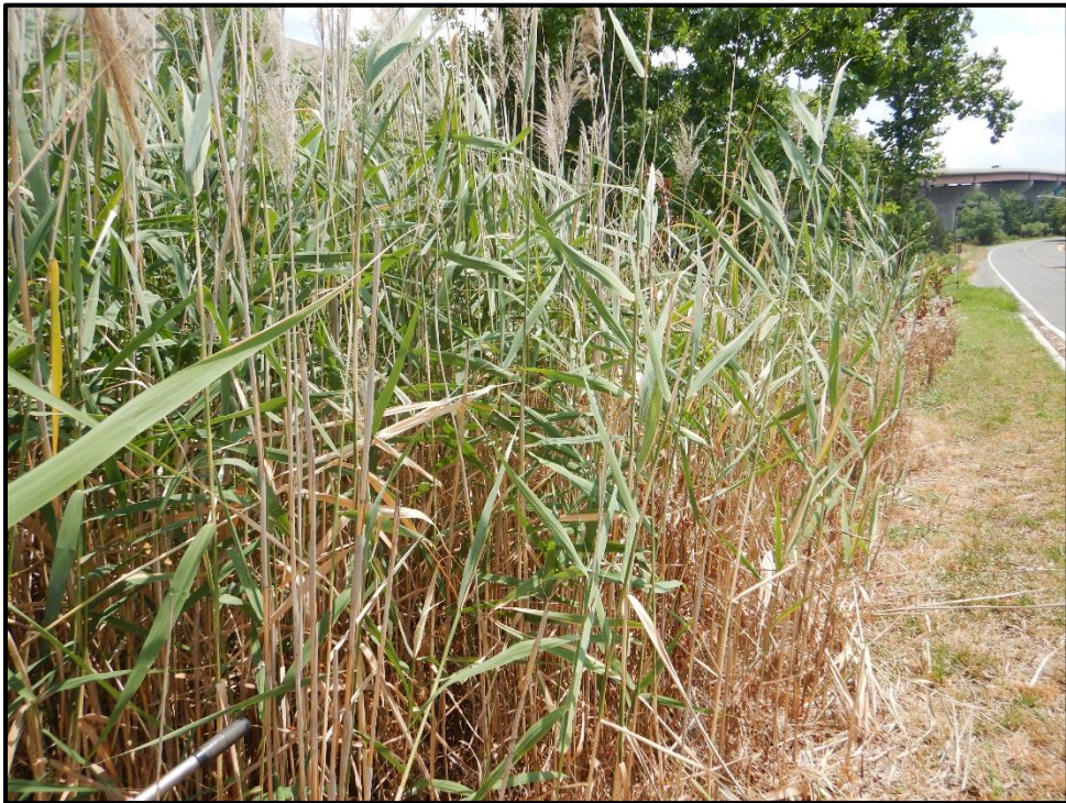
Wetland 8Q – PEM