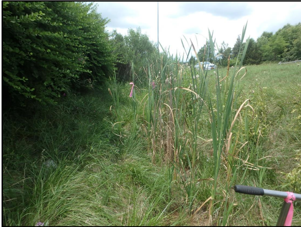
Wetland 7R – PEM