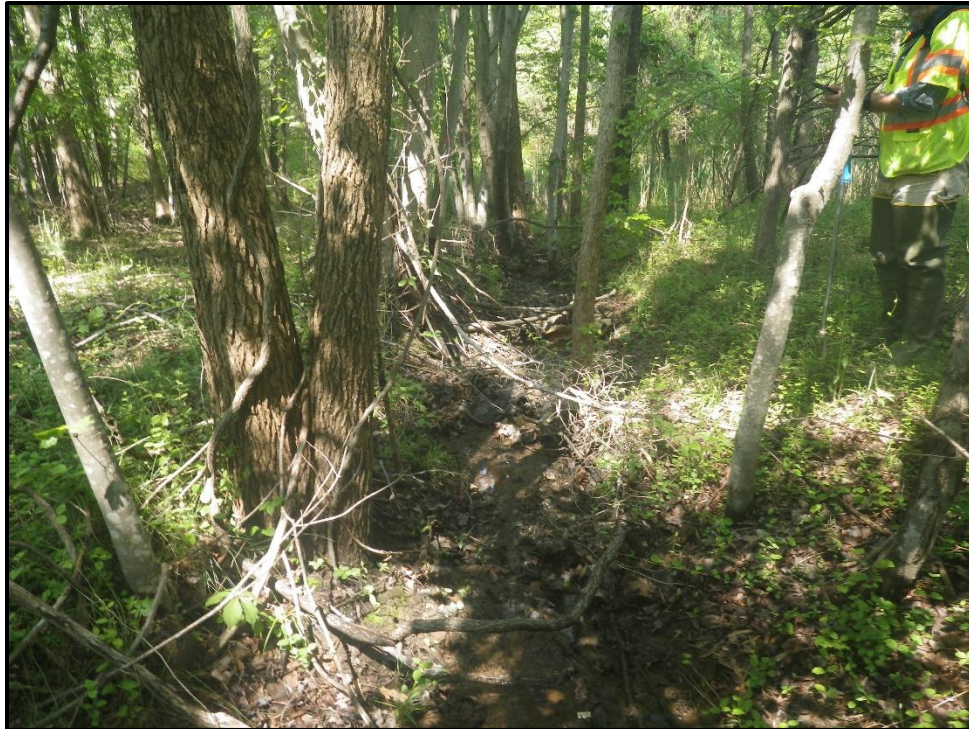
Waters 10B – Intermittent