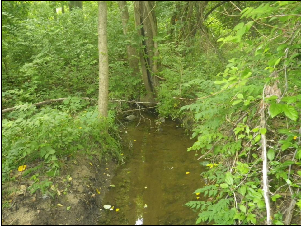
Waters 11S – Intermittent