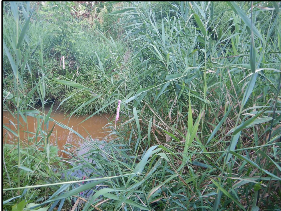
Waters 8A – Intermittent