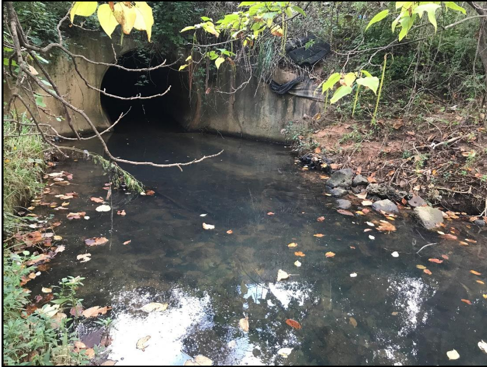
Waters 8W – Intermittent