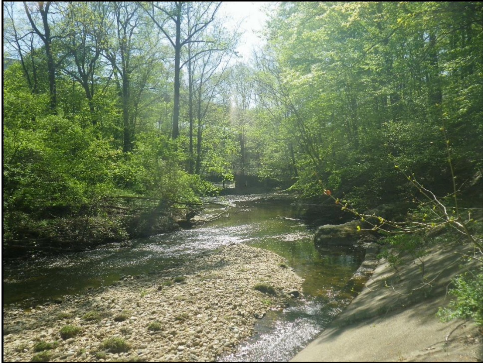
Waters 12II – Perennial