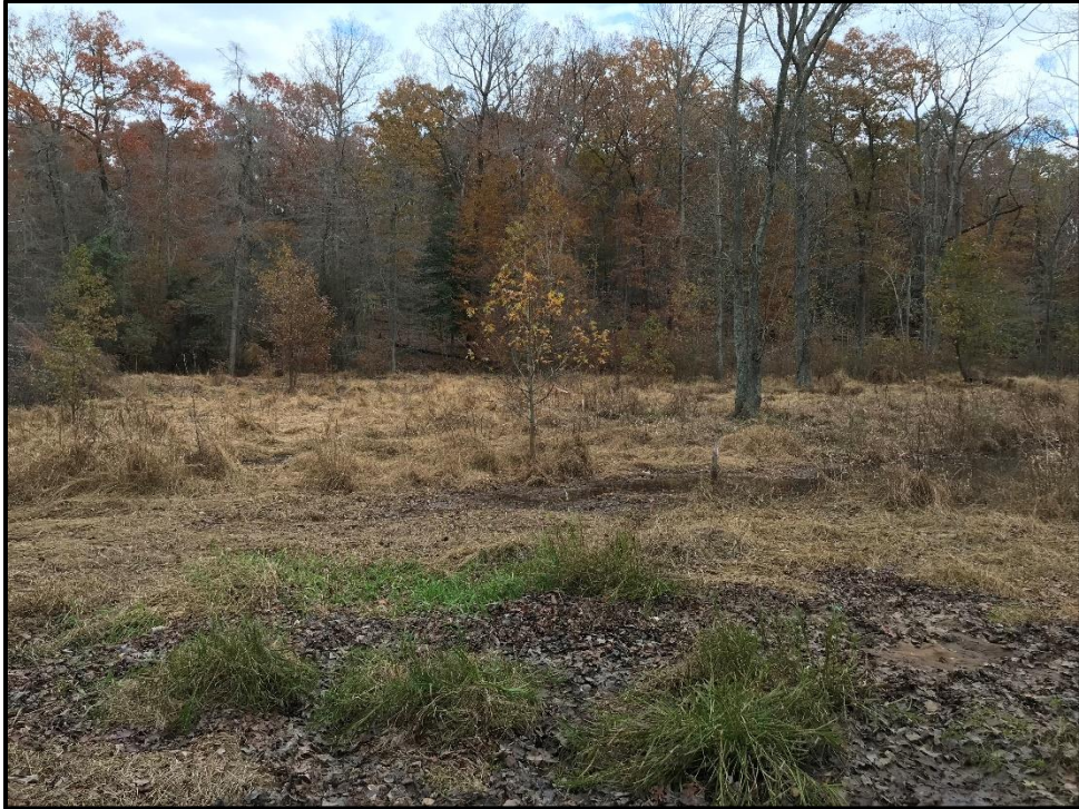
Wetland 10VV – PEM