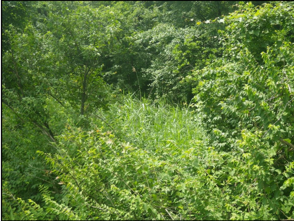
Wetland 11O – PEM