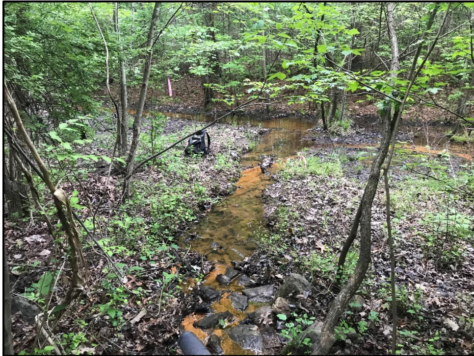
Waters 12KKKK – Intermittent