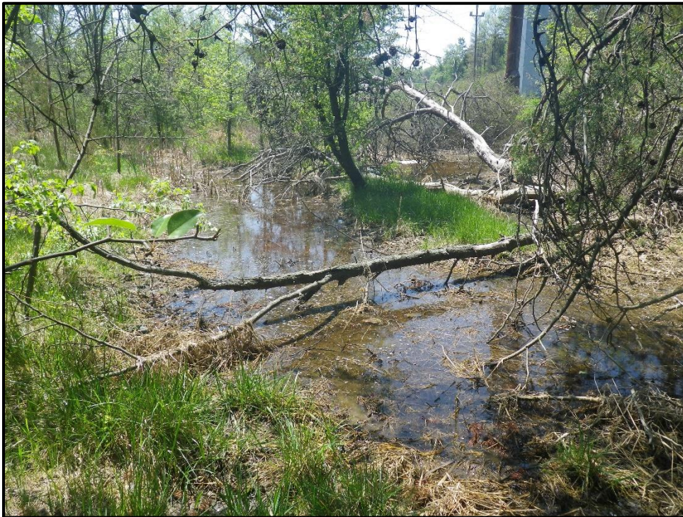
Wetland 12DDD – PEM