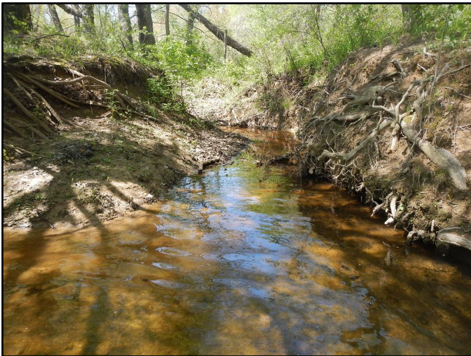
Waters 12TT – Perennial