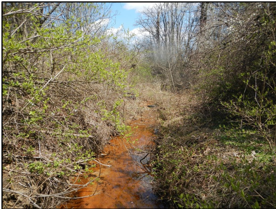
Waters 12F – Perennial