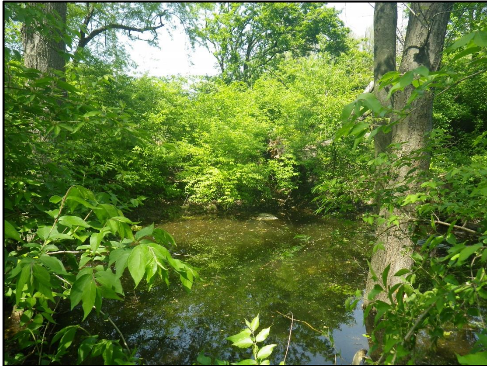
Waters 12ZZ – Intermittent