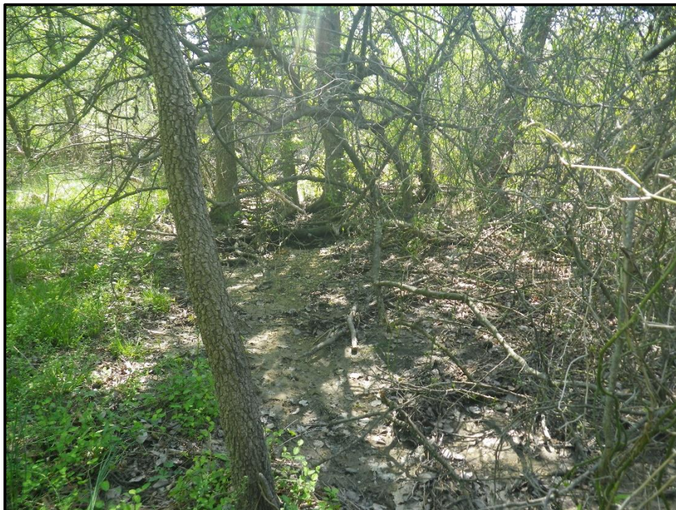
Waters 12FFF – Ephemeral