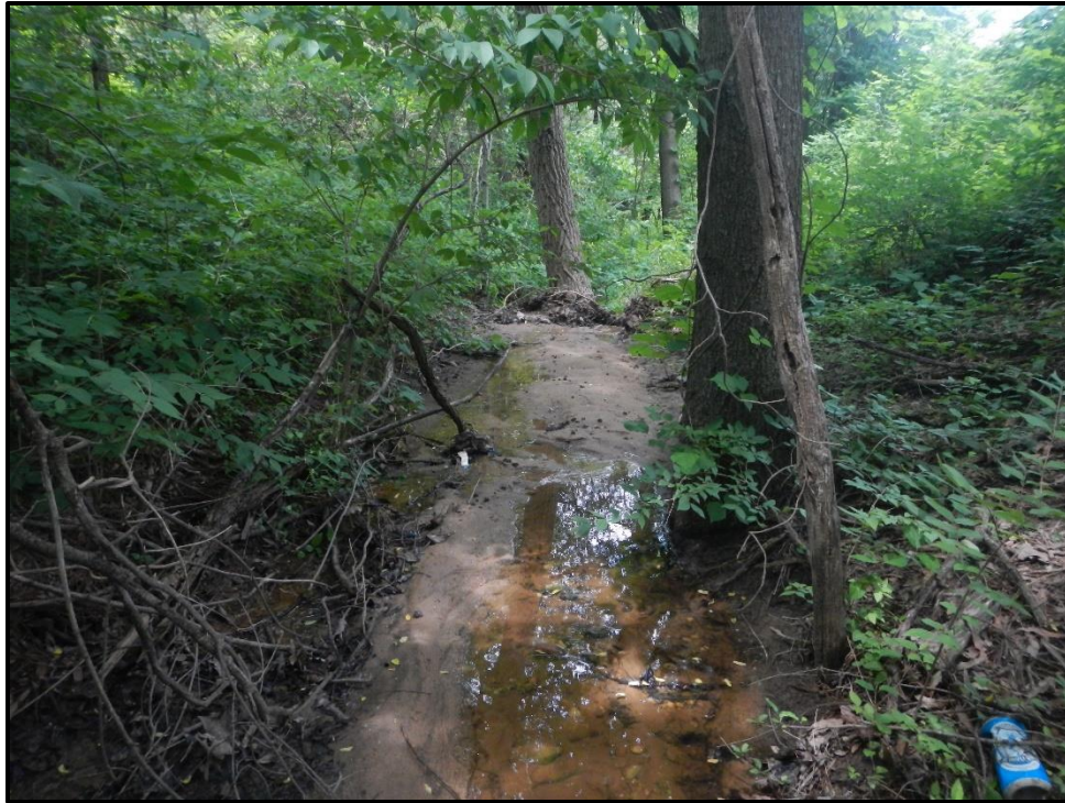
Waters 11A – Intermittent/Perennial