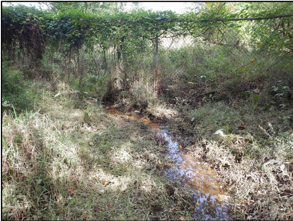
Waters 11CC – Intermittent