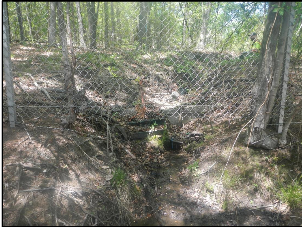
Waters 12MMM - Ephemeral