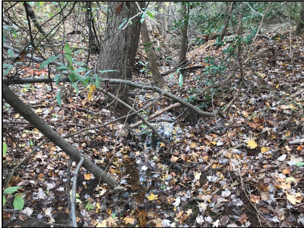
Waters 10JJ – Intermittent