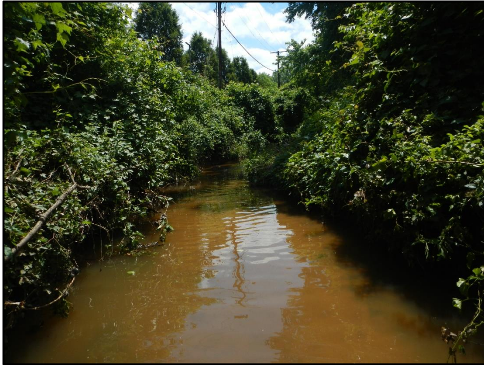
Waters 11E – Perennial