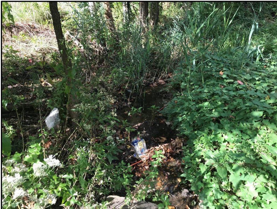
Waters 8X – Intermittent