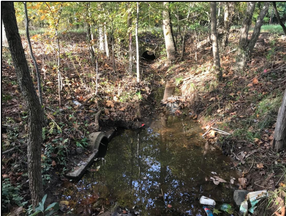
Waters 8DD – Intermittent