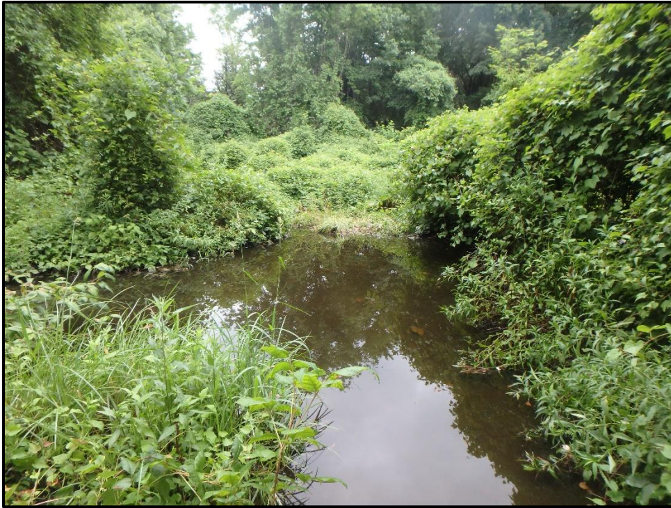
Wetland 9B – PEM