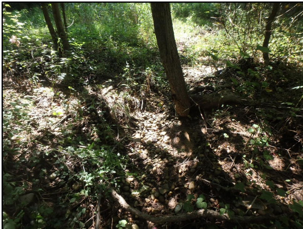
Waters 9LL – Ephemeral