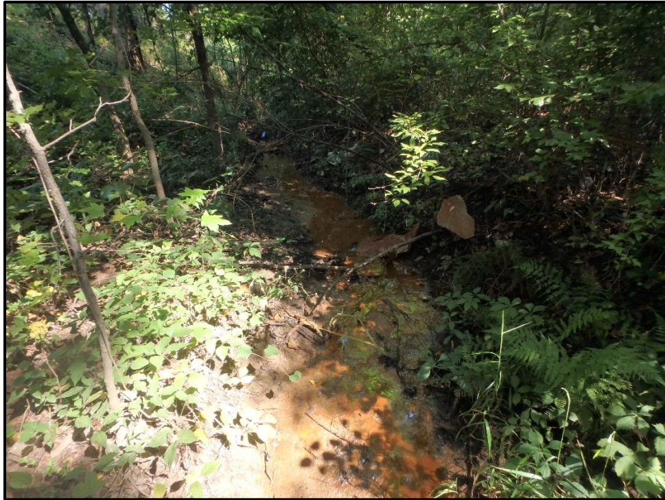
Waters 9MM – Intermittent