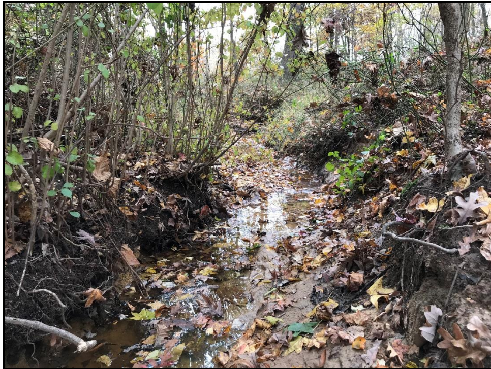
Waters 10MM – Intermittent