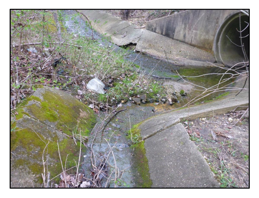
Waters 2H – Intermittent