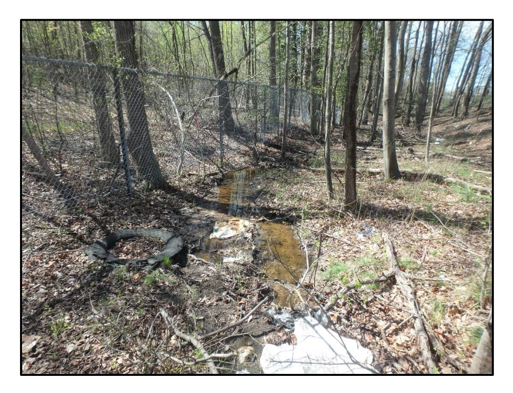
Waters 40 – Intermittent