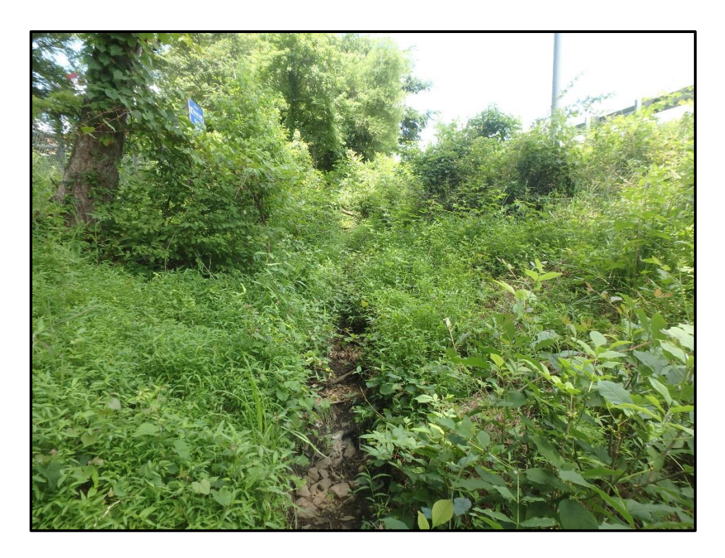
Waters 6TTT – Intermittent