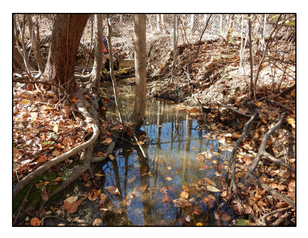
Waters 5KK – Intermittent