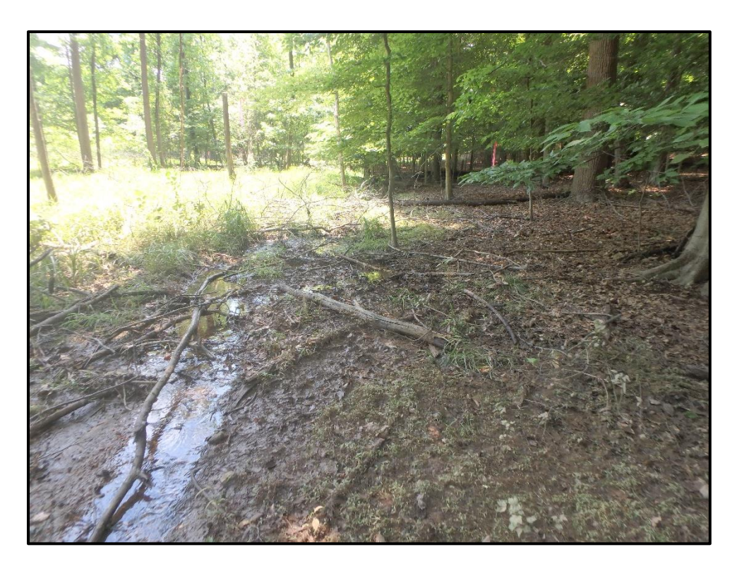
Wetland 4DDD – PFO