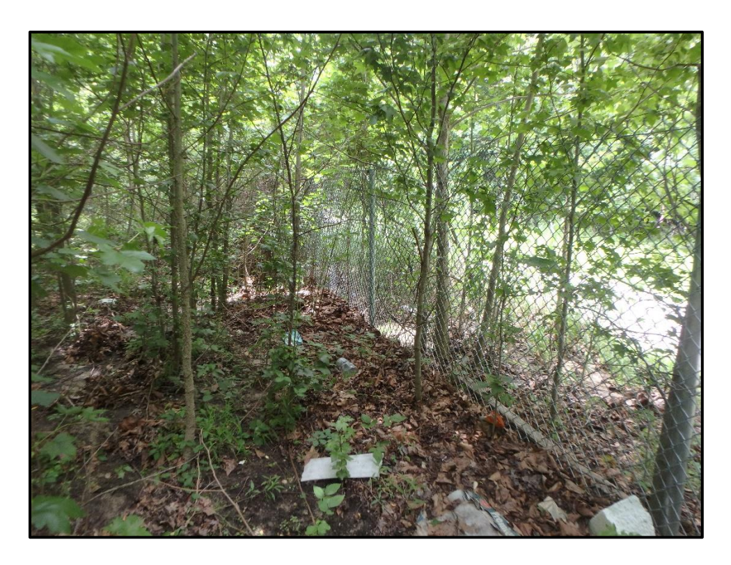
Wetland 4FFF – PFO