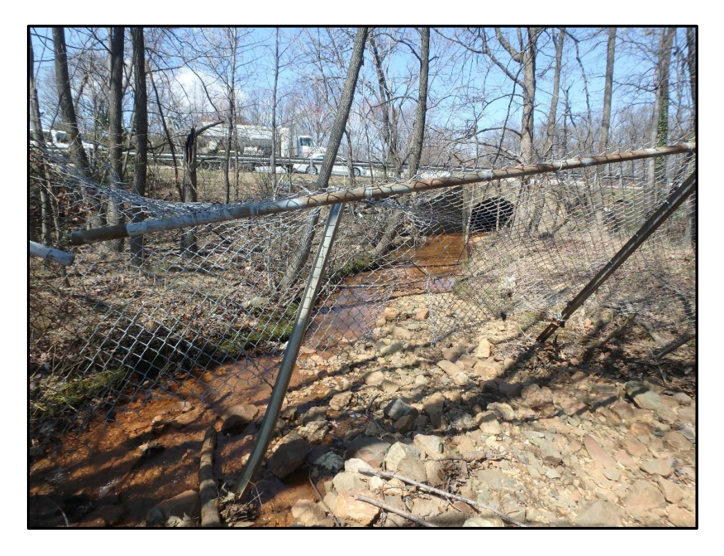
Waters 3D – Perennial