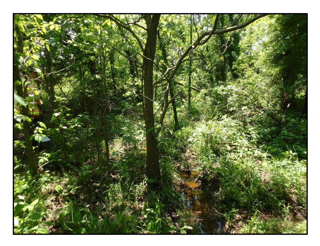
Wetland 3DDD – PFO