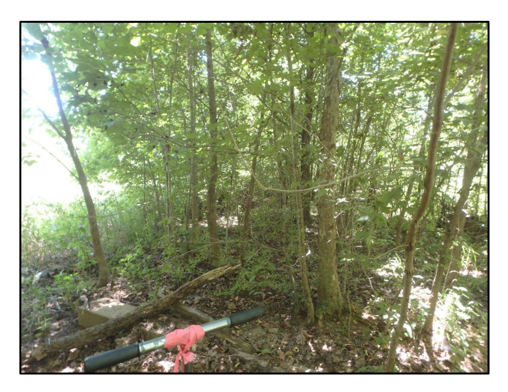
Wetland 7DD – PFO