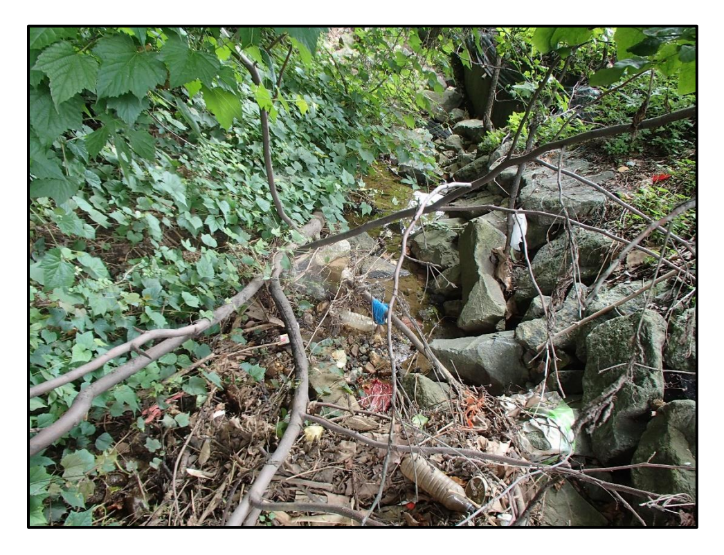
Waters 6AAA – Intermittent