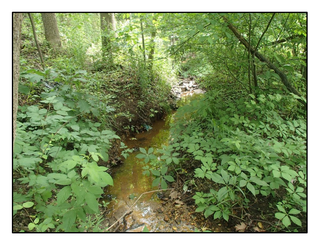
Waters 4QQQQ – Intermittent