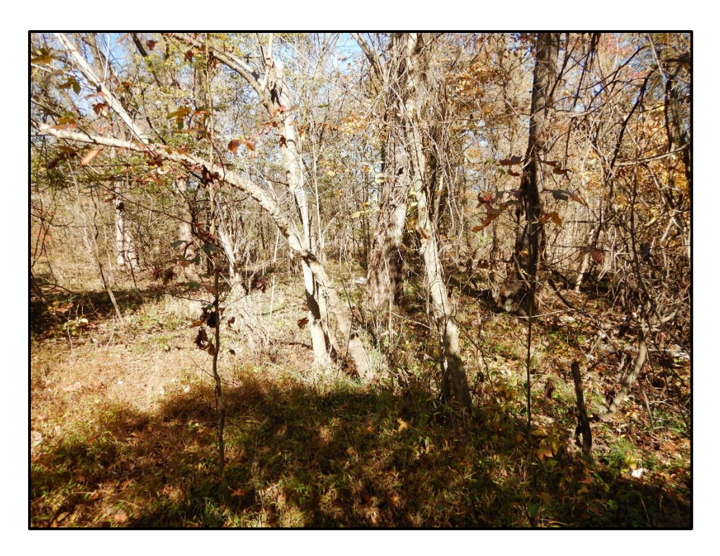
Wetland 5II – PFO