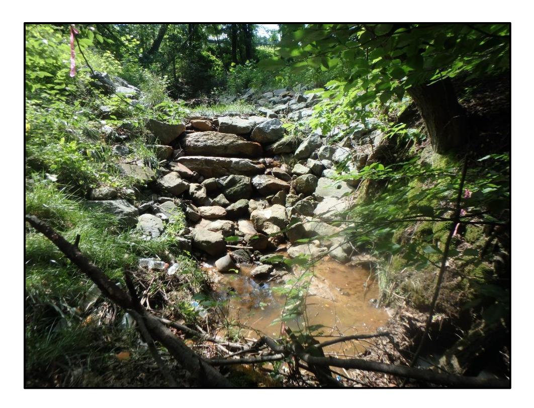
Waters 4TTT – Perennial