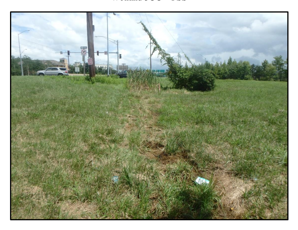
Wetland 5V – PEM