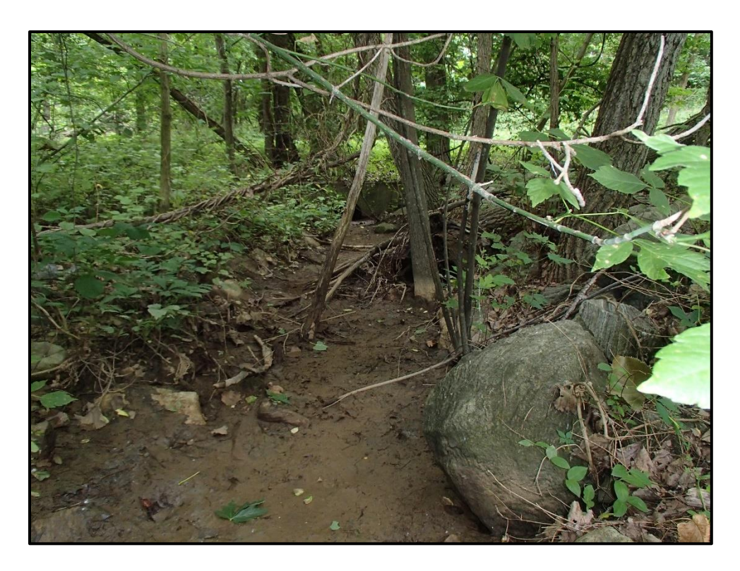
Waters 6AAA – Intermittent