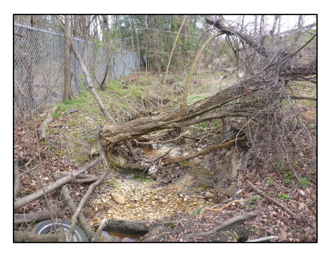
Waters 3U – Intermittent