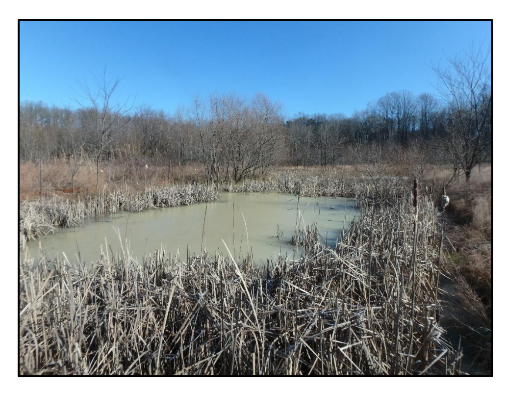
Waters 4BBBBB - POW