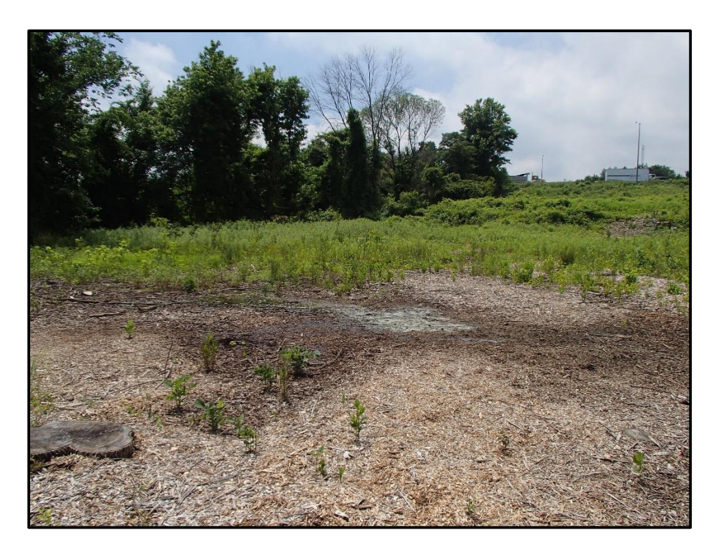
Wetland 6RR – PEM