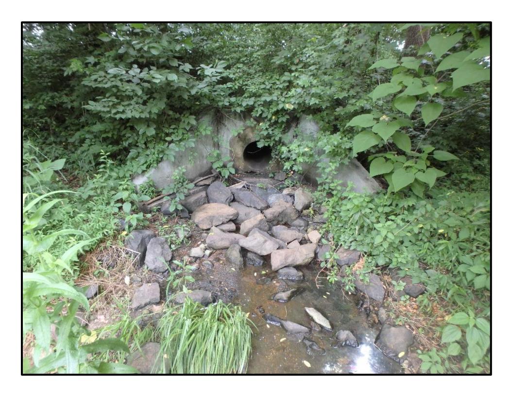
Waters 6SS – Intermittent