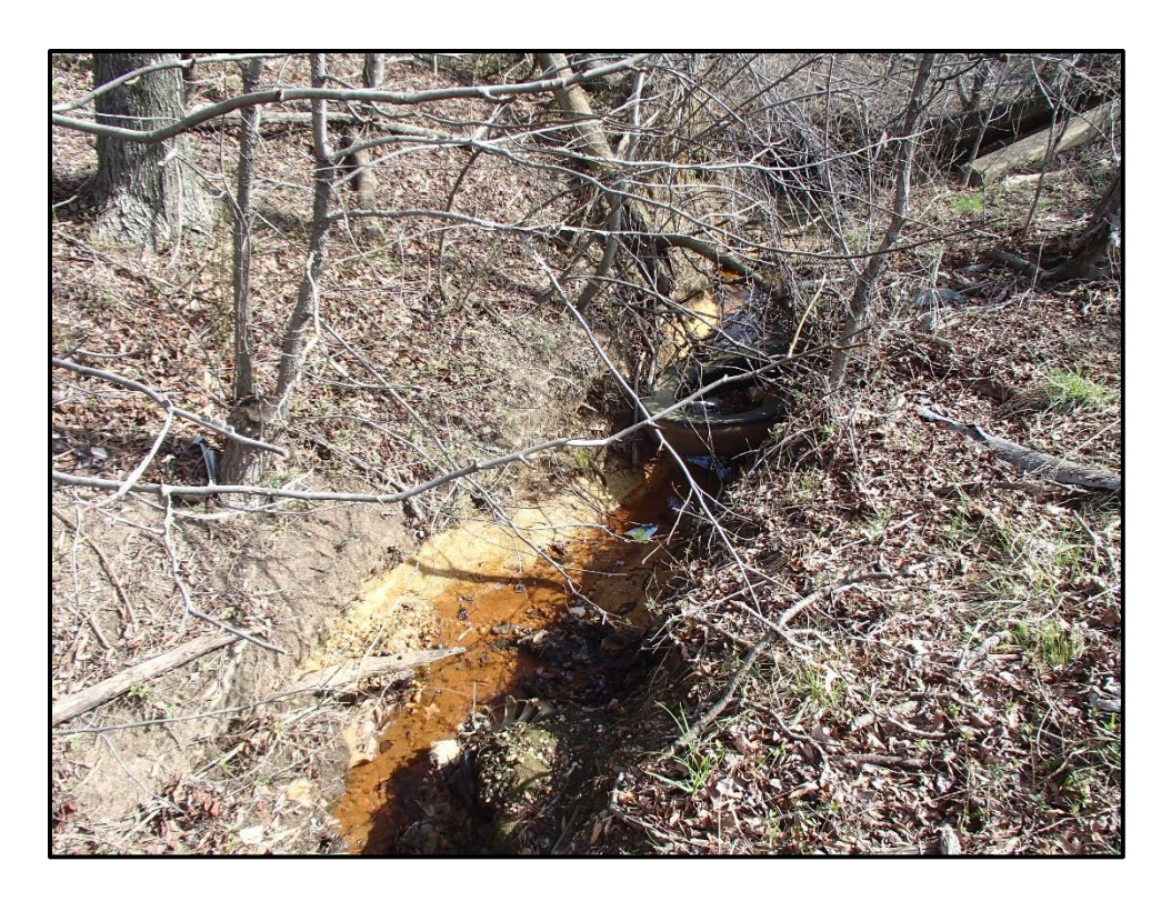
Waters 2T – Intermittent