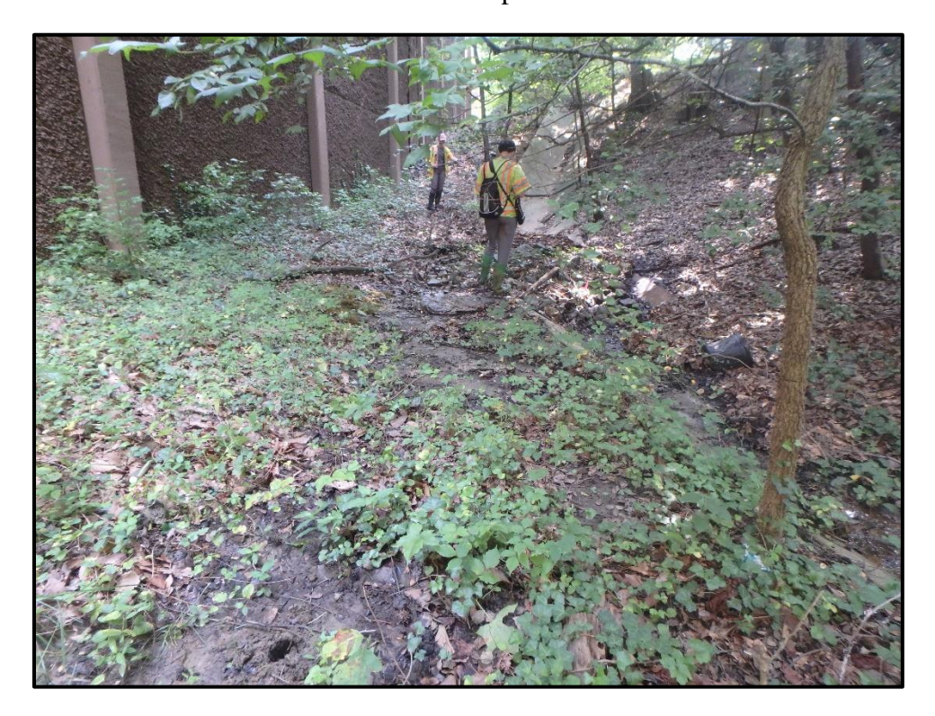
Wetland 1MM – PFO