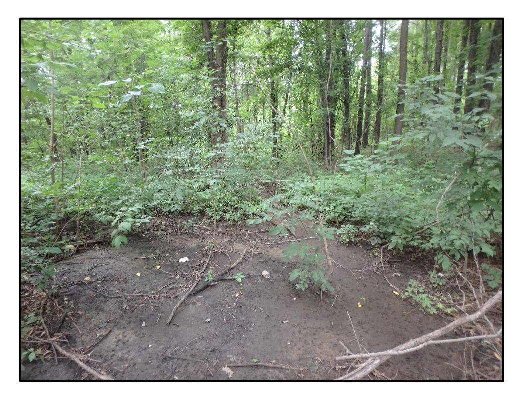
Wetland 6VV – PFO