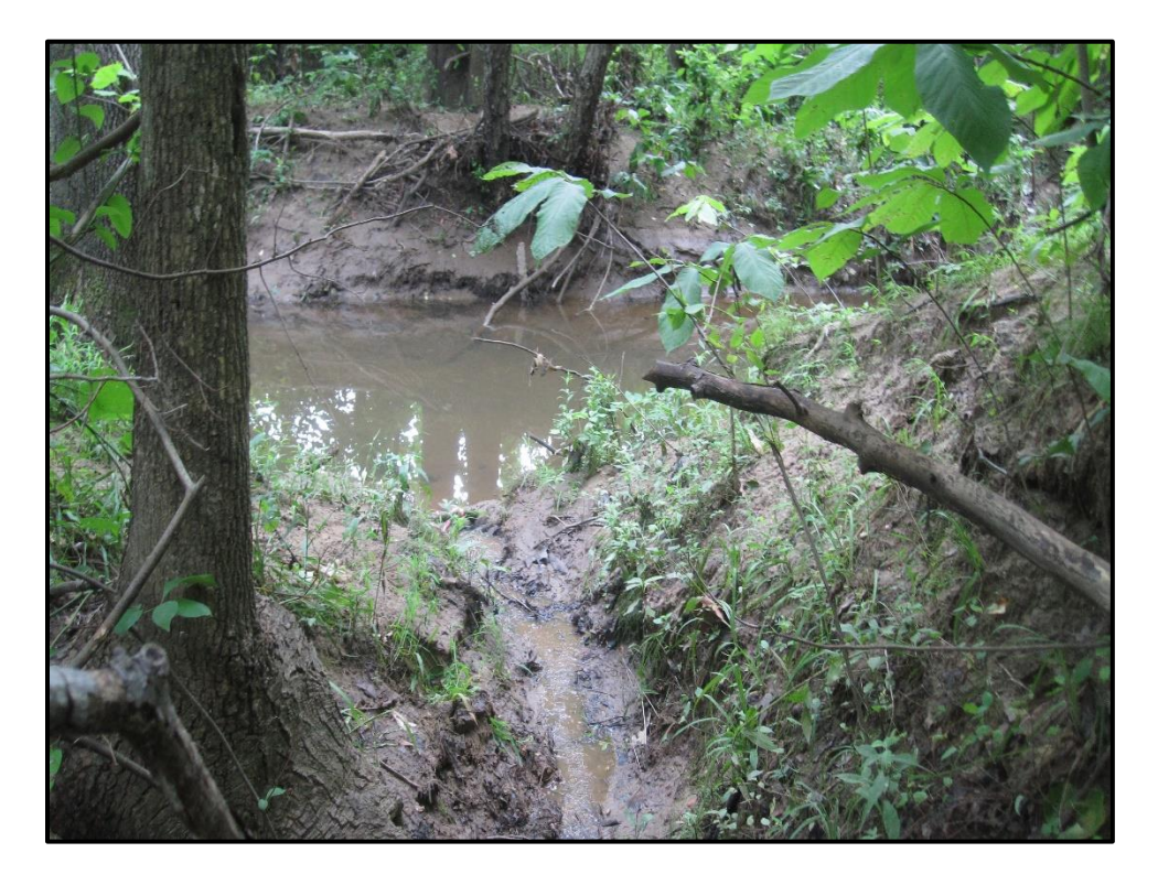
Waters 6KK – Intermittent