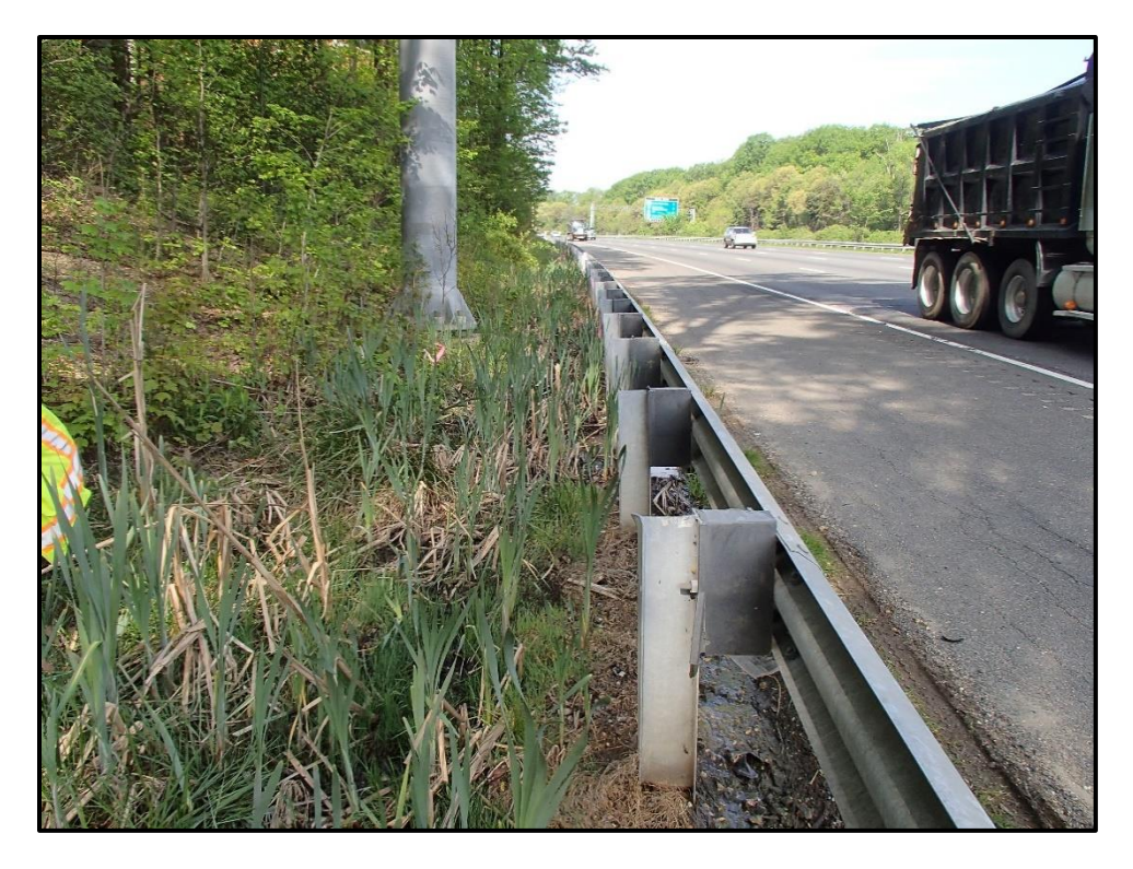
Wetland 1AA – PEM