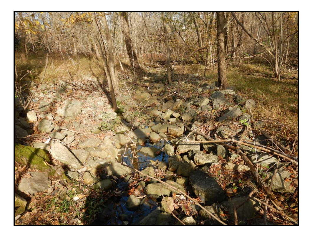
Waters 5HH – Intermittent