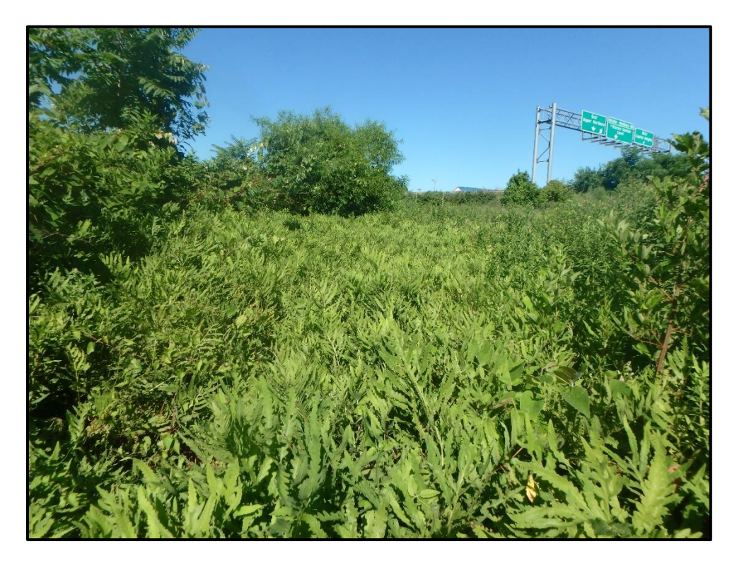
Wetland 5E – PSS