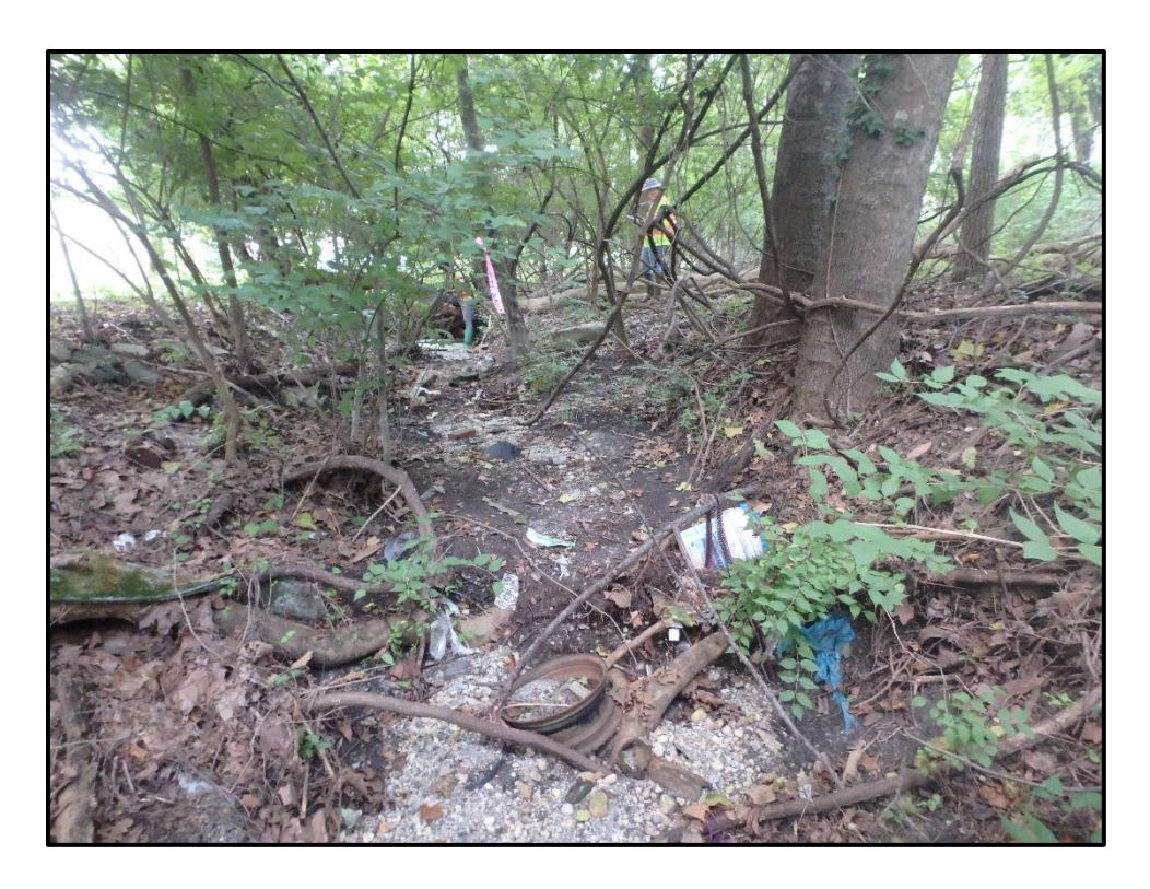
Waters 1NN – Ephemeral