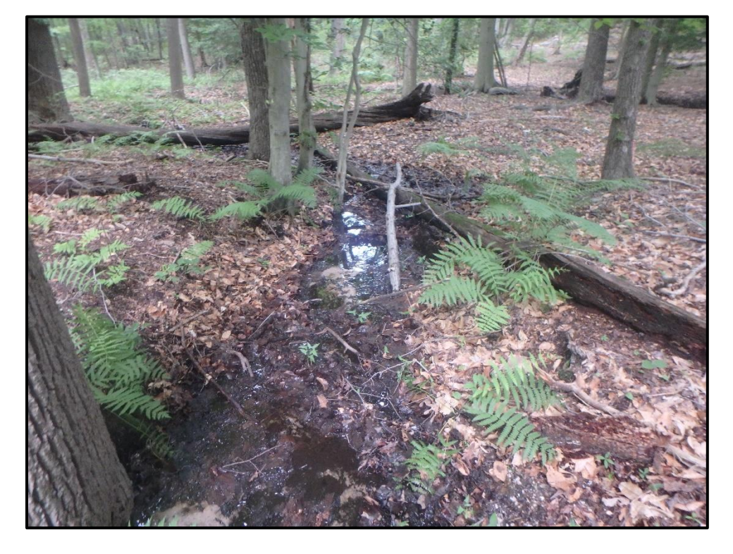
Waters 4SSSS – Intermittent