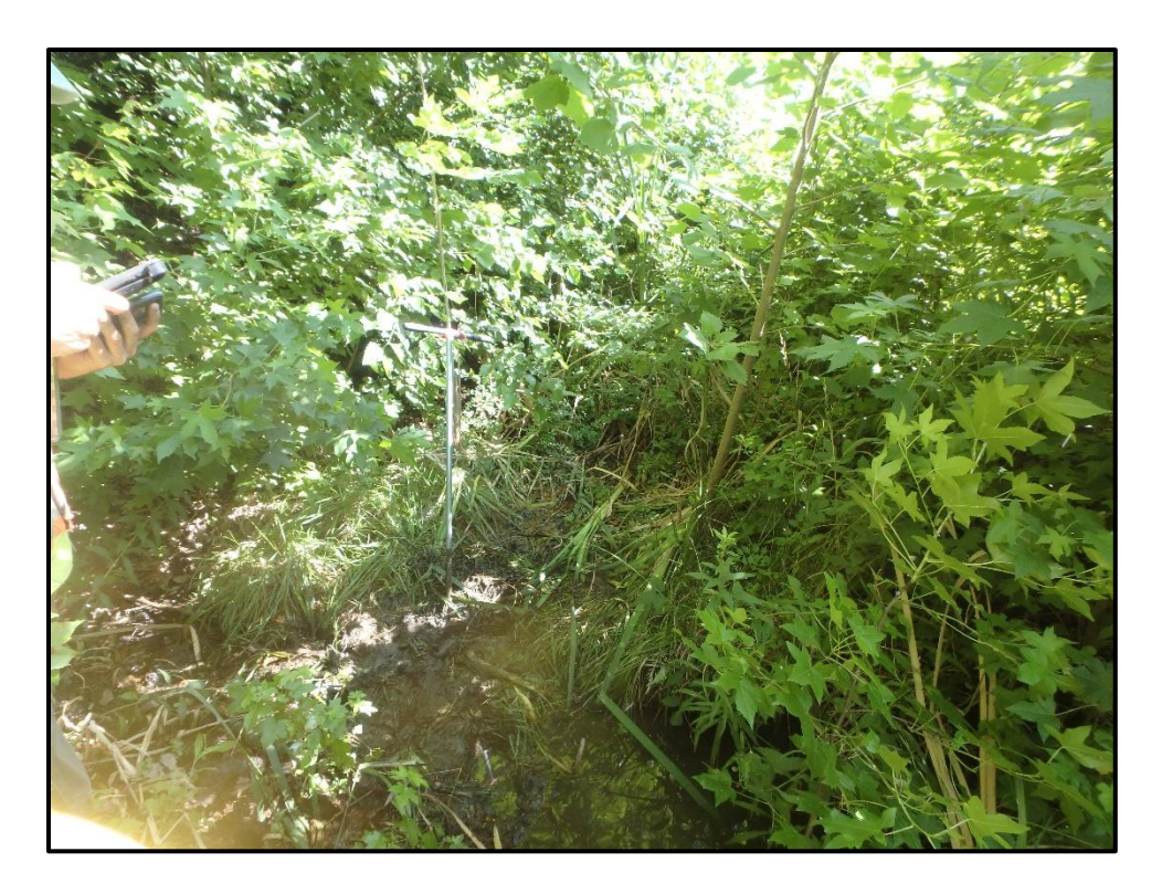
Wetland 6SSS – PEM