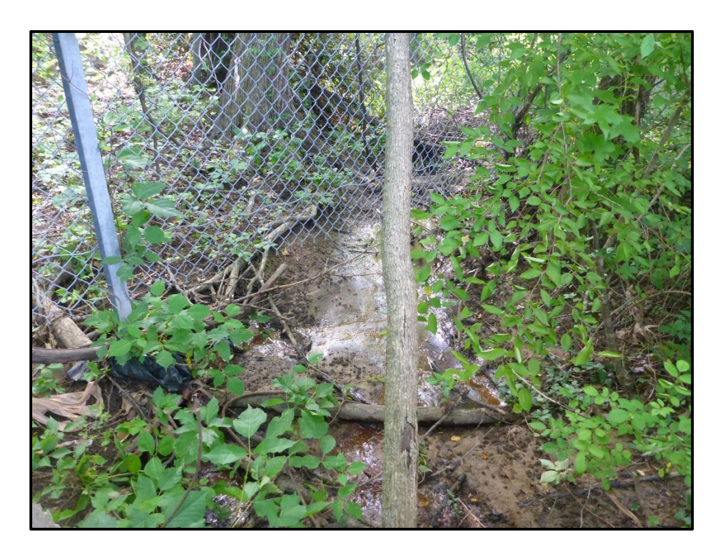
Waters 7D – Intermittent