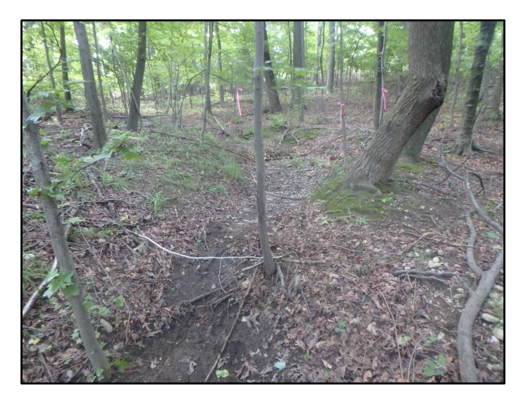
Wetland 4UU – PFO