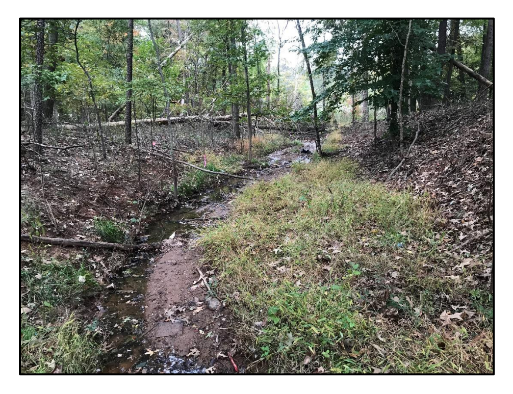
Waters 7MM – Intermittent