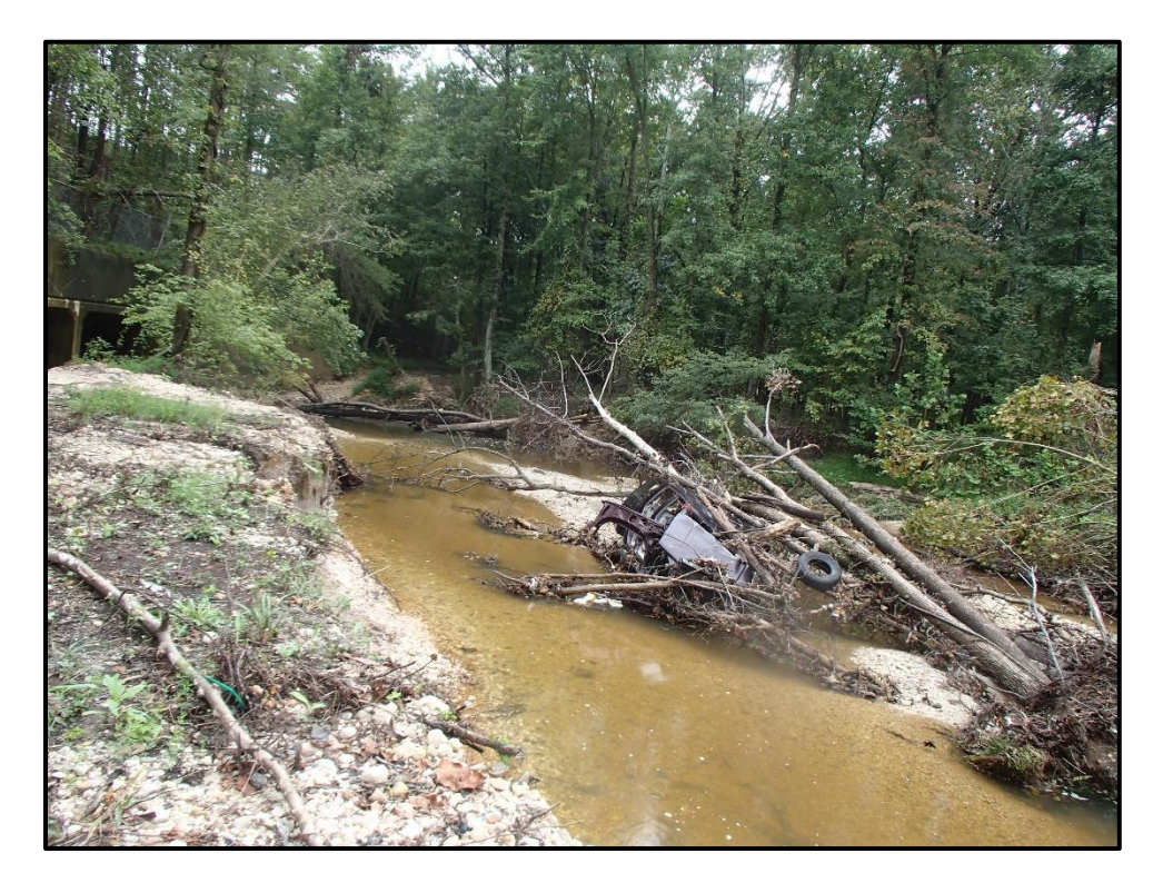
Waters 1VV – Perennial