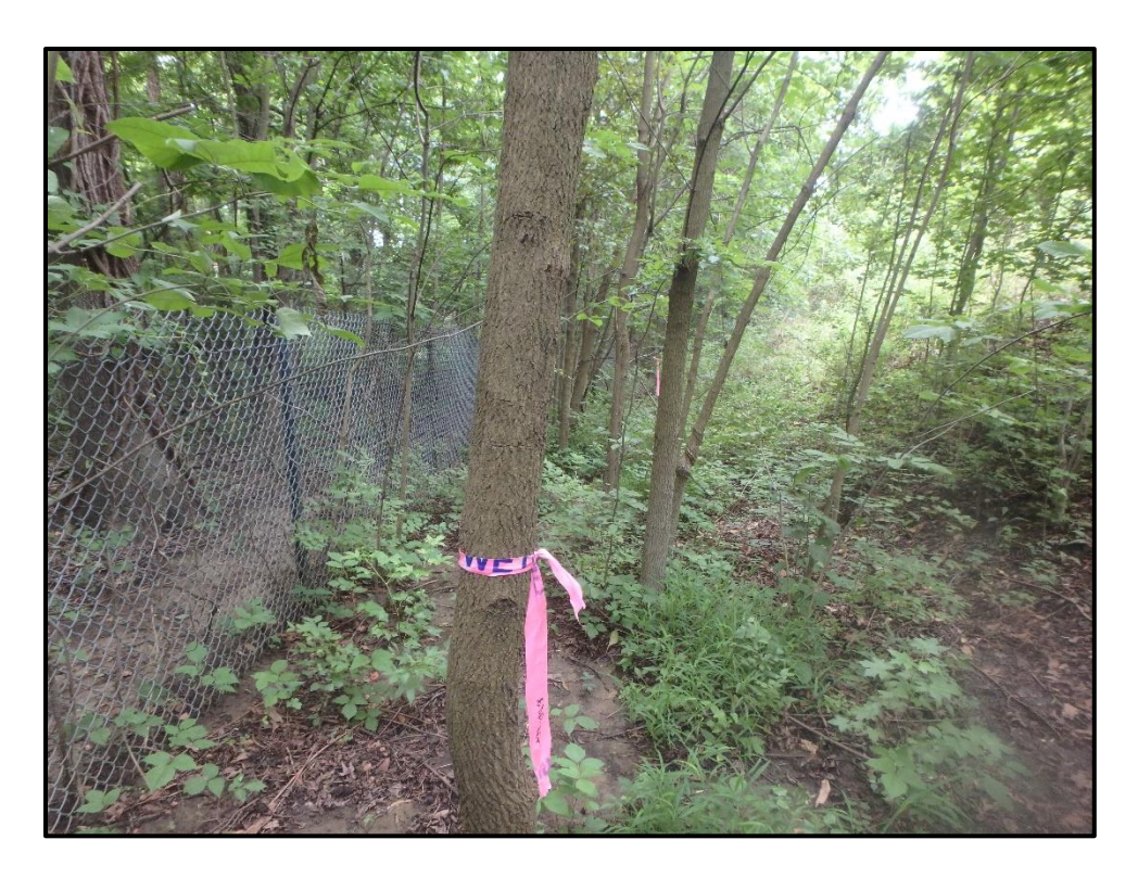
Wetland 6DD – PFO