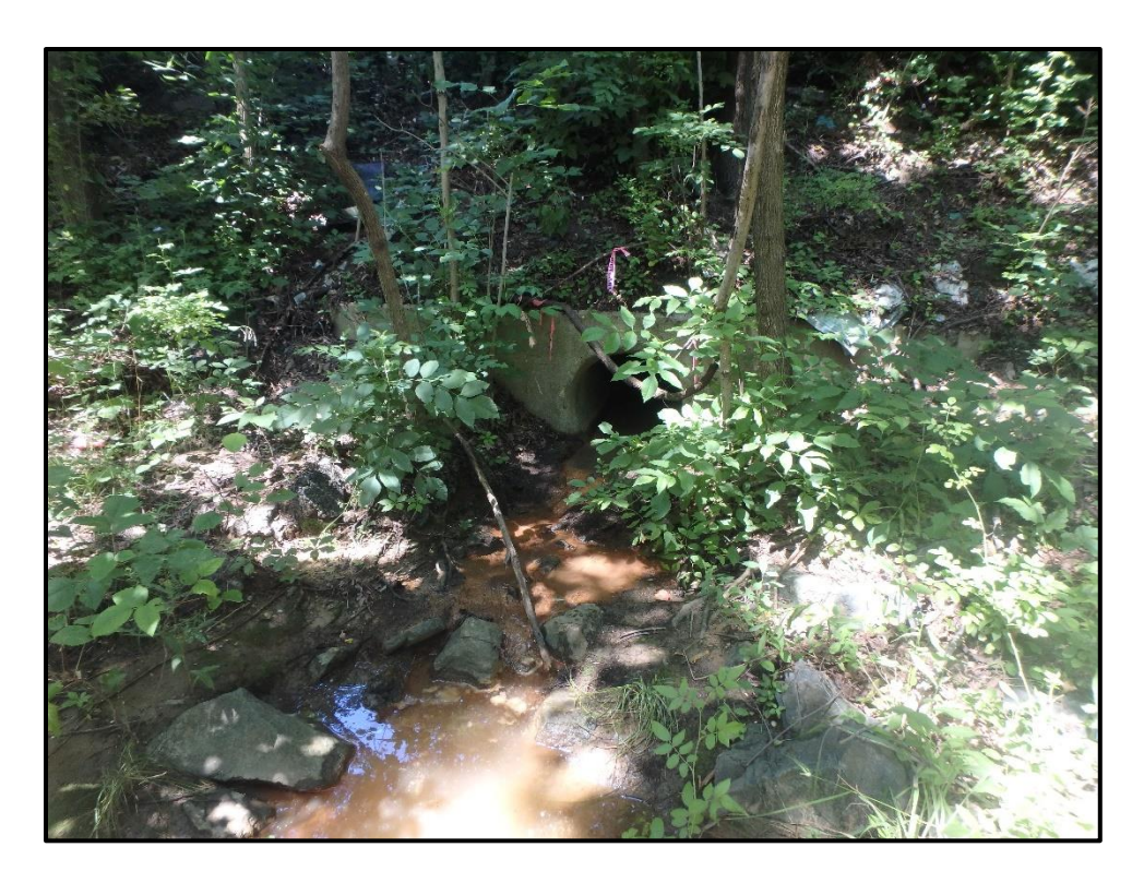
Waters 6UU – Intermittent