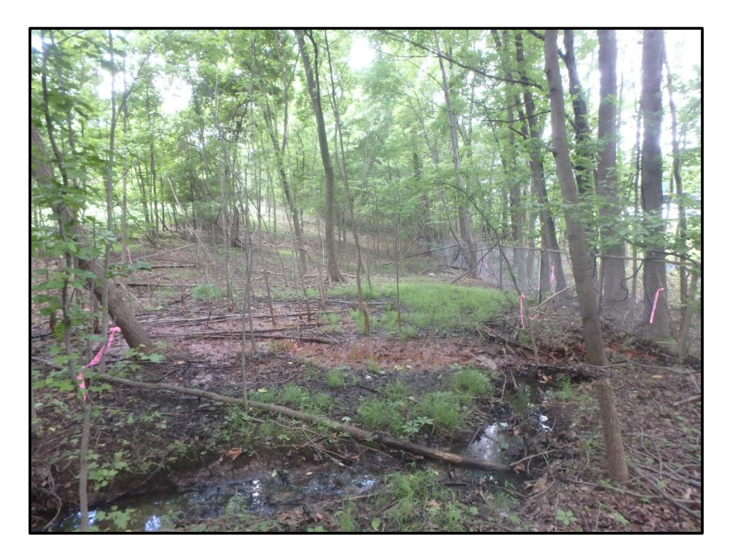
Wetland 4VV - PFO