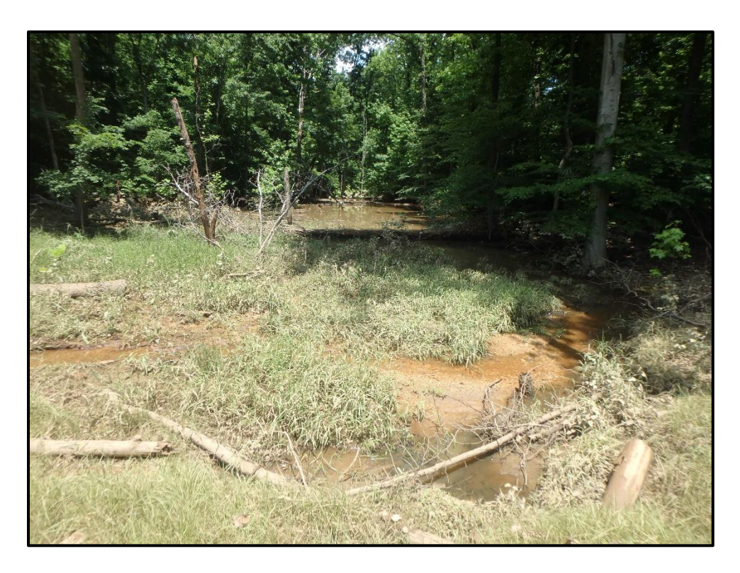
Wetland 4EEE – PEM