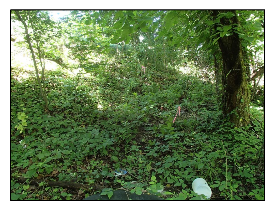
Wetland 6P – PFO