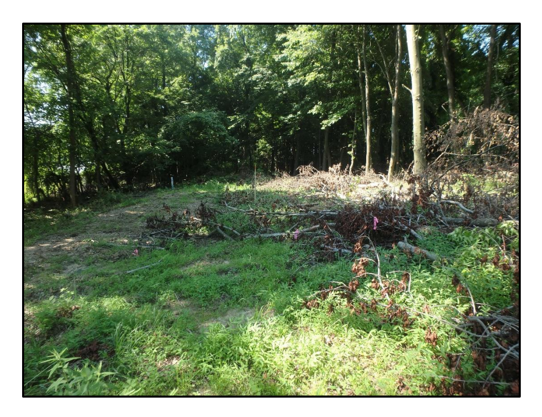
Wetland 6YYY - PEM