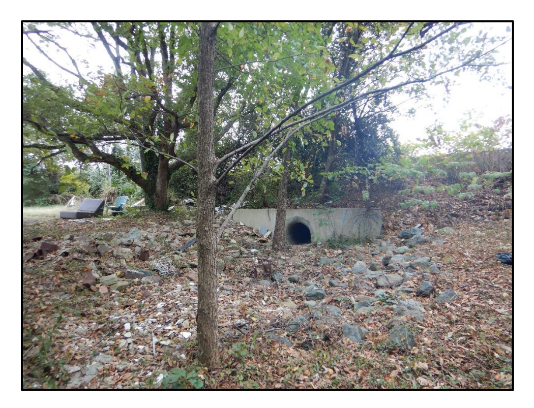
Waters 2ZZ – Ephemeral