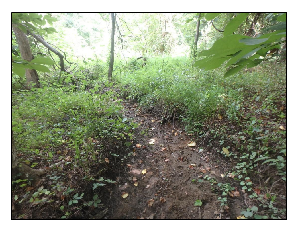
Waters 5B – Intermittent