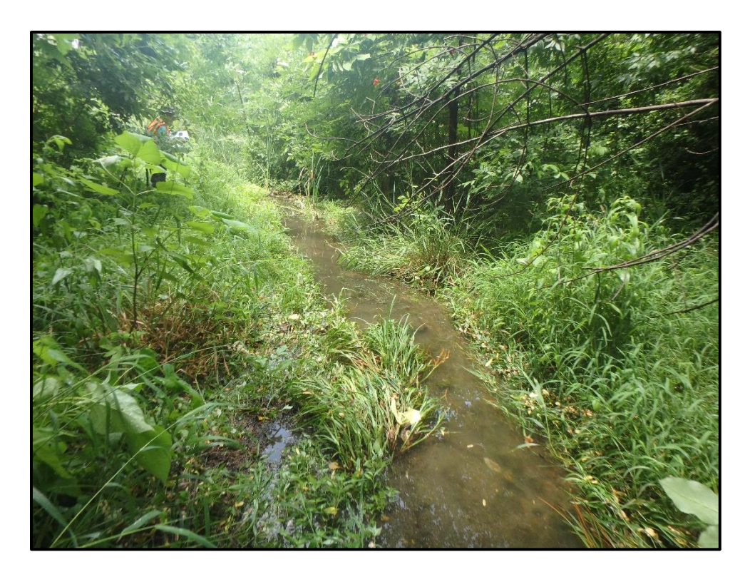
Waters 6Z – Intermittent