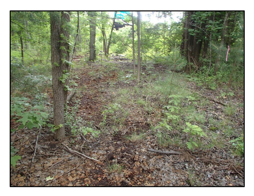
Wetland 6HHH – PFO