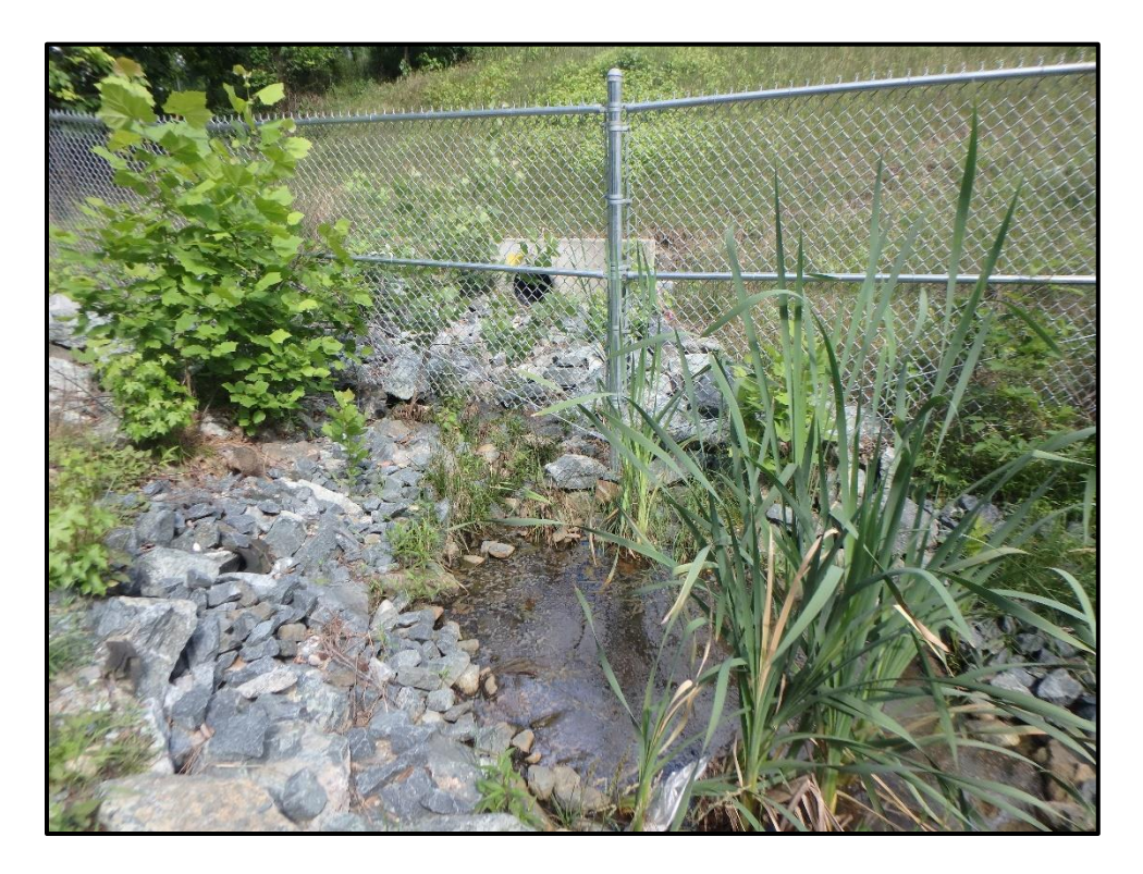
Waters 4HHH – Intermittent