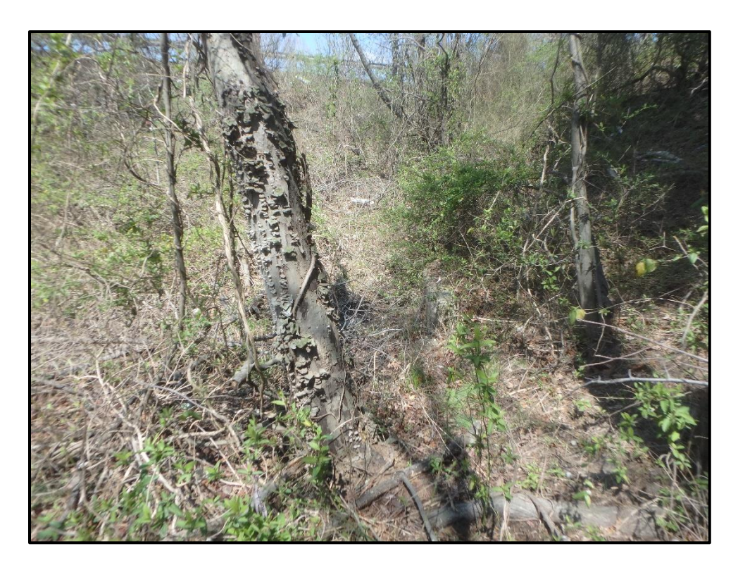
Wetland 3HH – PFO