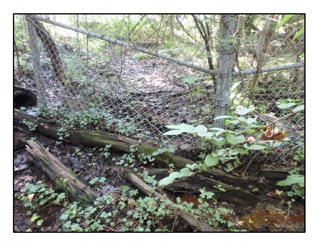
Wetland 1KK – PFO