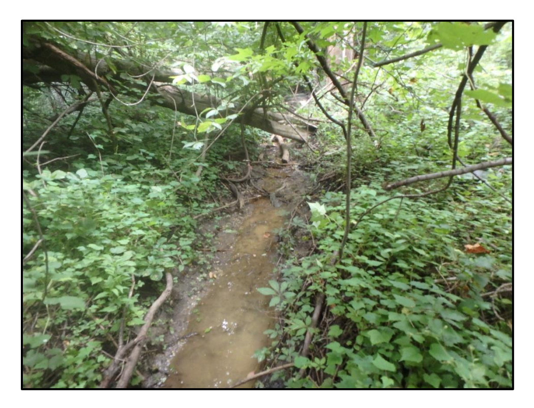
Waters 5P – Intermittent