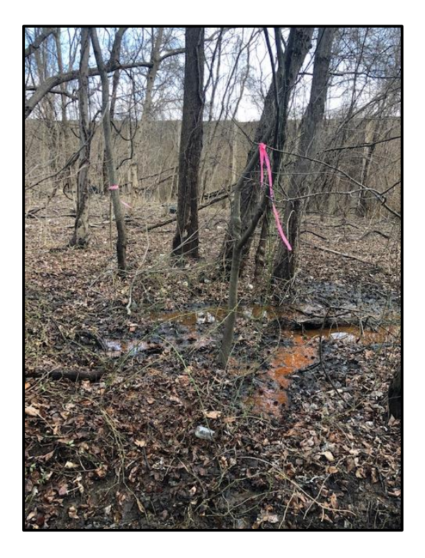
Wetland 6GGGG - PFO