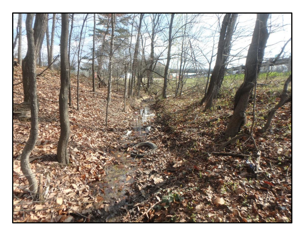
Waters 3CC – Intermittent