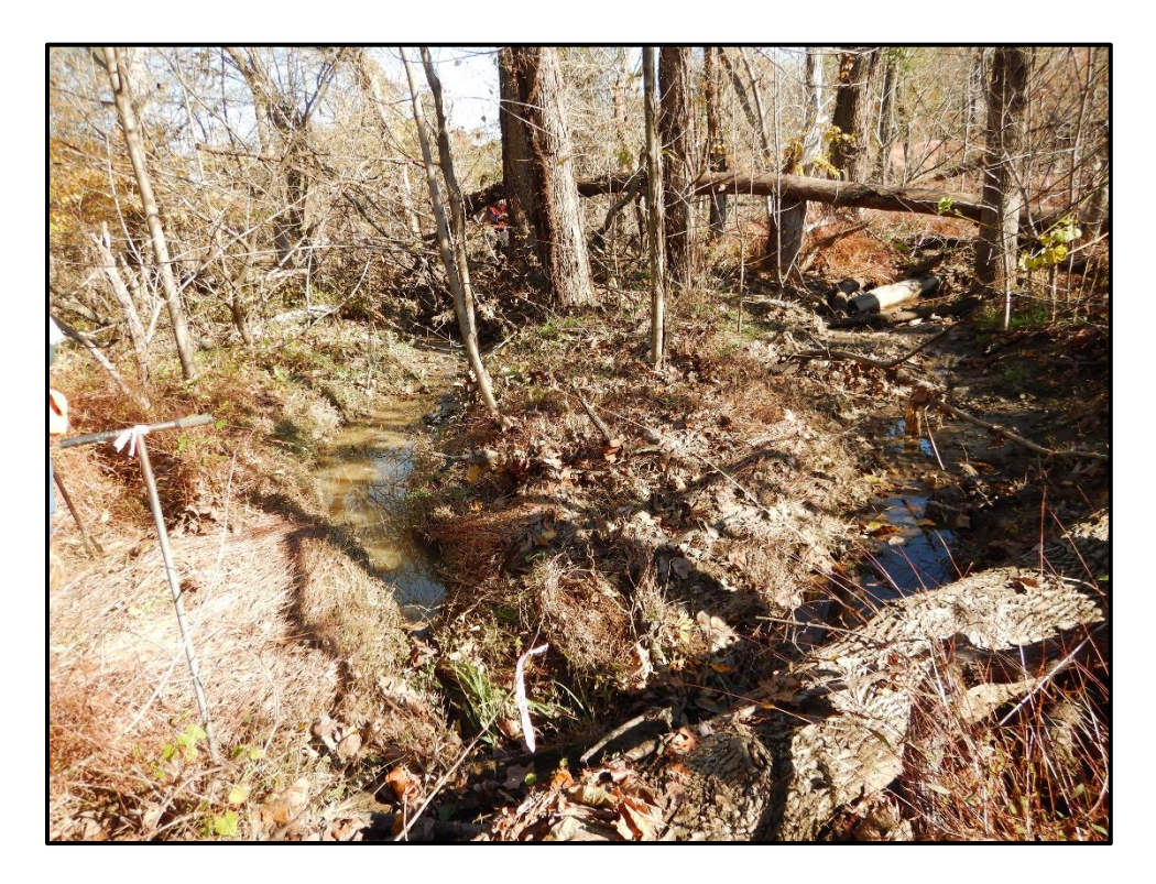
Waters 5NN – Intermittent