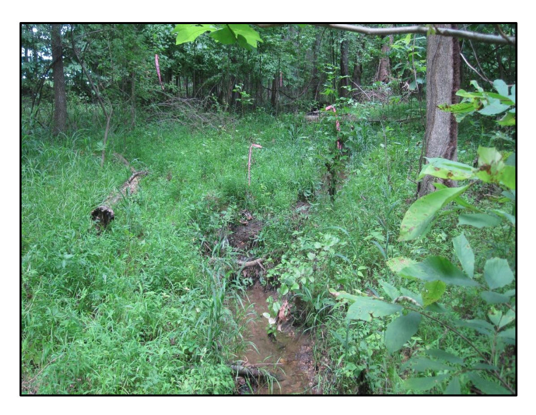
Waters 6KK – Intermittent