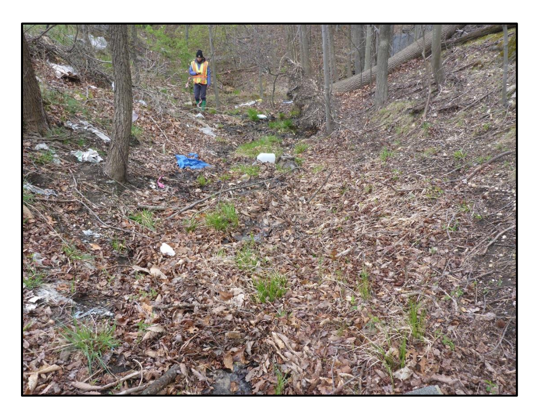
Wetland 4D – PFO