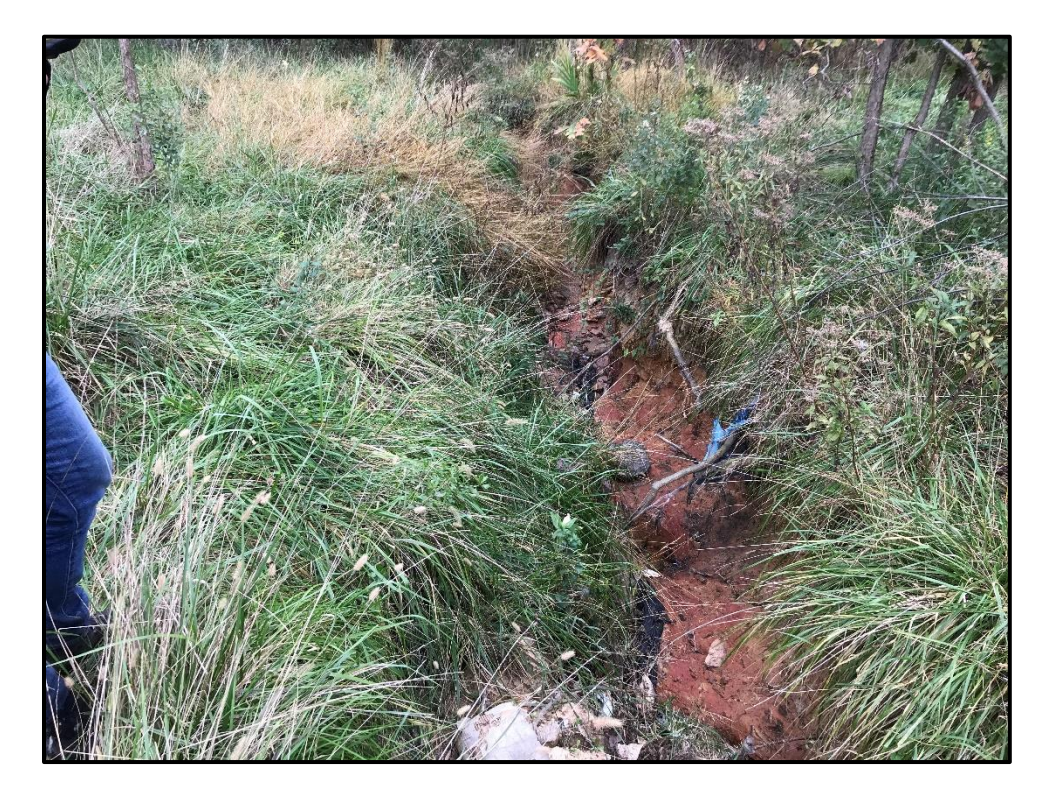
Waters 7NN – Ephemeral