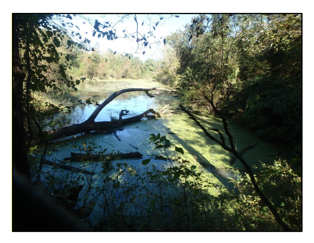
Waters 5EE – POW