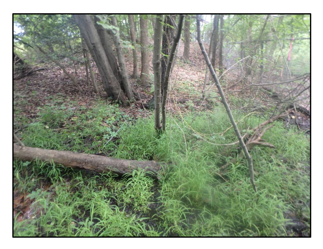
Wetland 4VVV – PFO