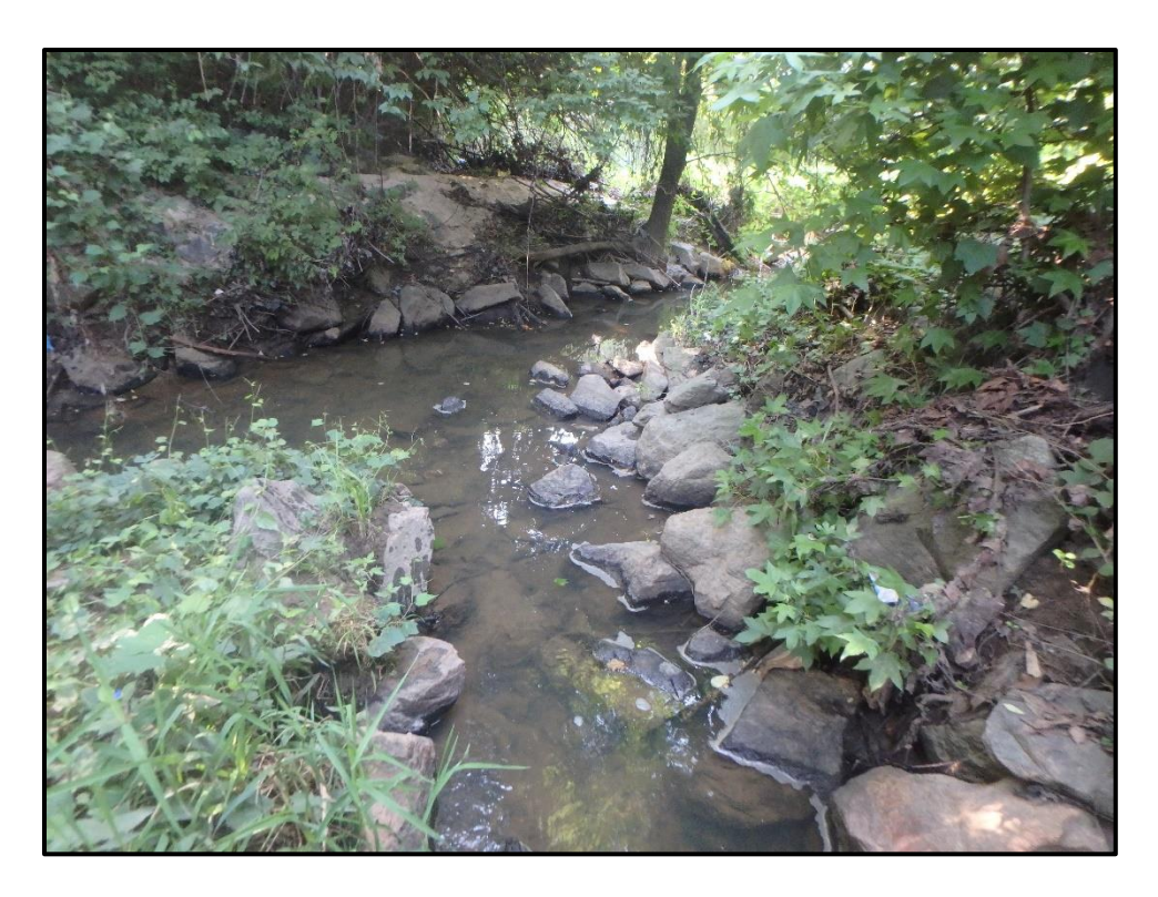
Waters 6MMM – Perennial