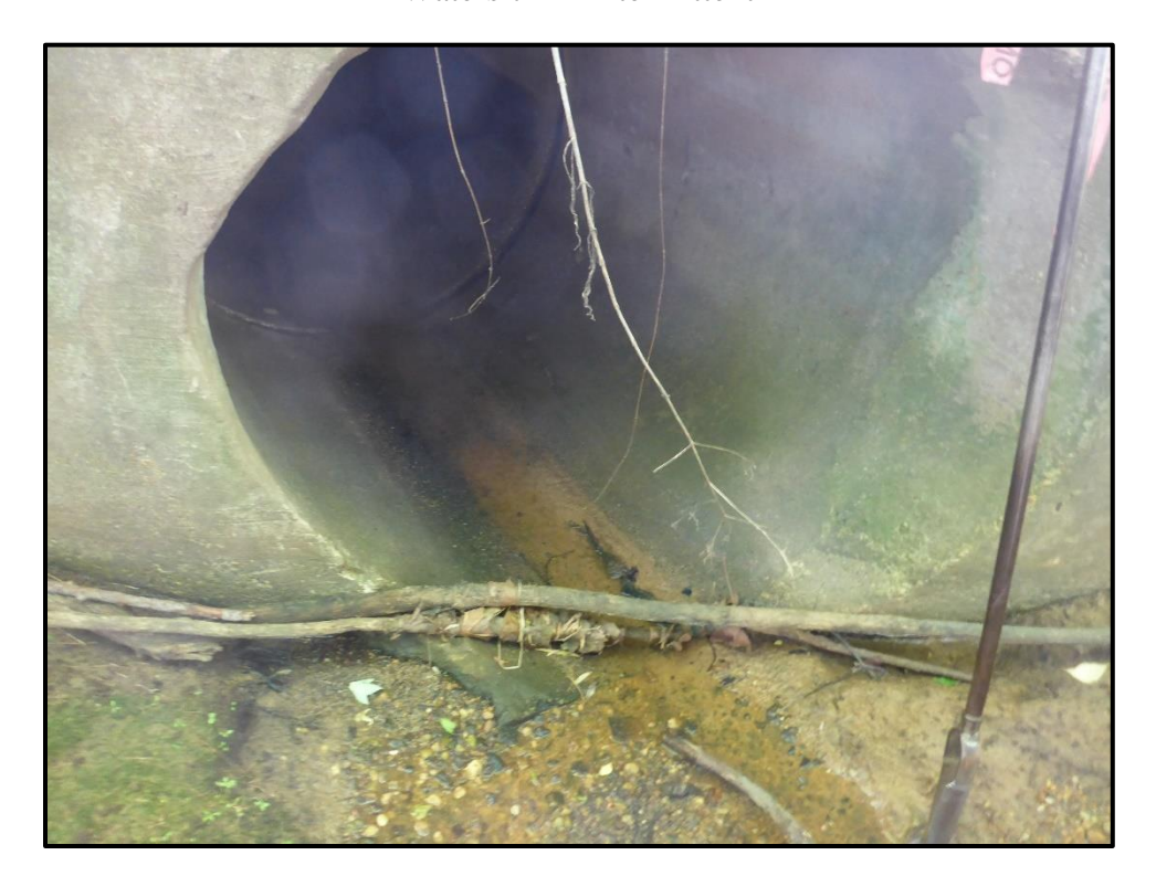
Waters 7A – Intermittent