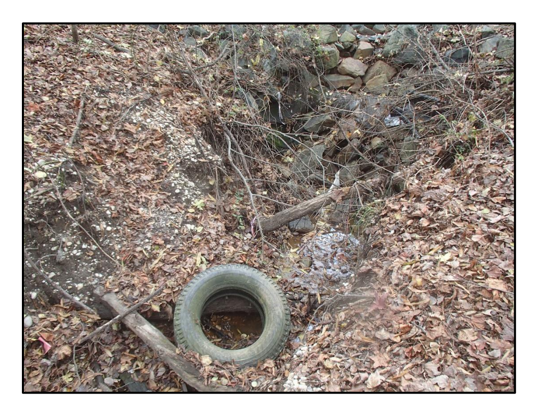
Waters 2VV – Intermittent