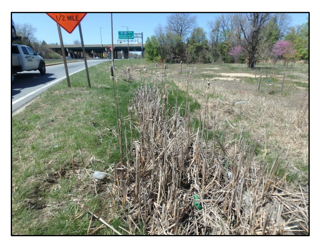
Wetland 4I – PEM