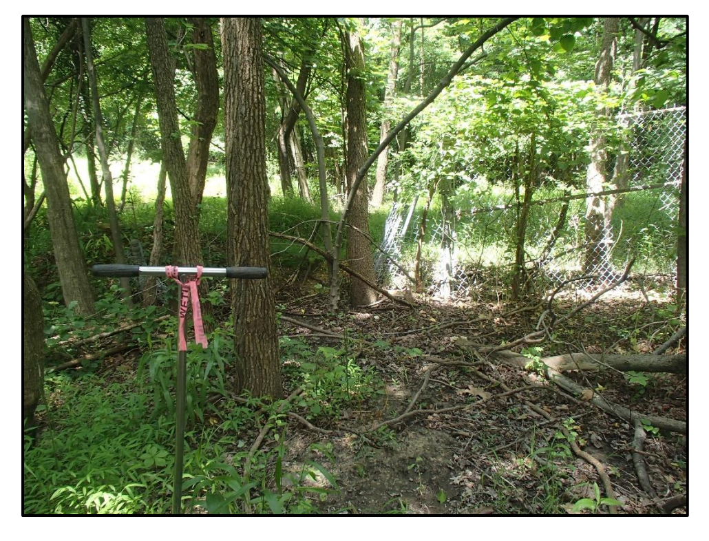
Wetland 4CCCC – PFO