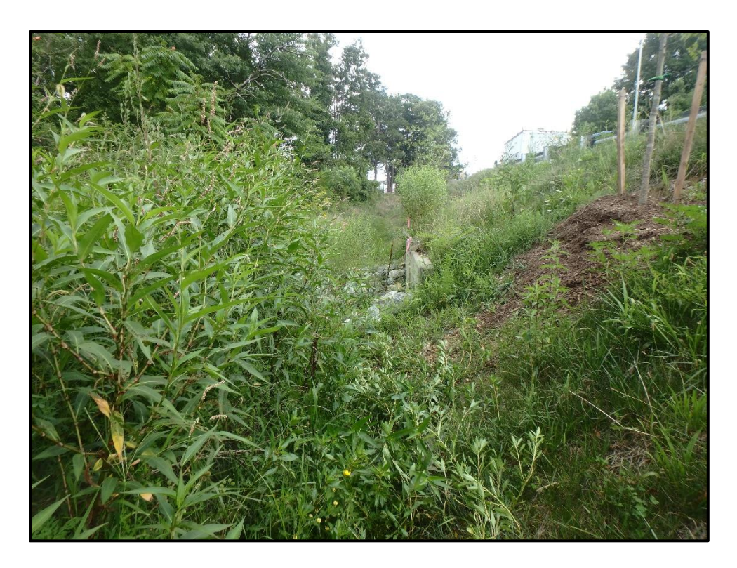
Wetland 2TT – PEM