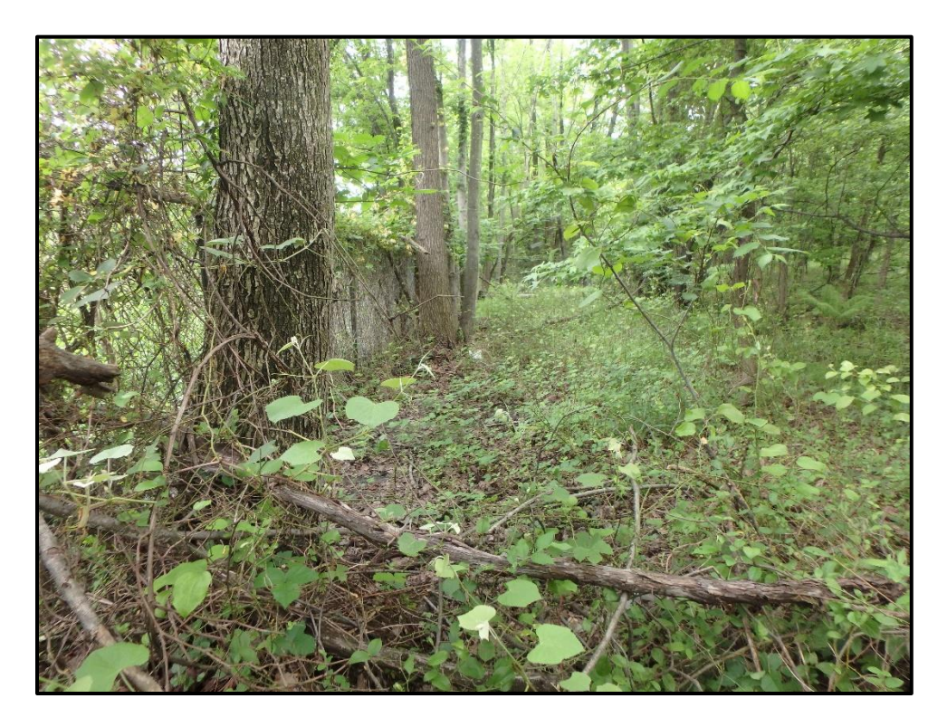
Wetland 4MM – PFO