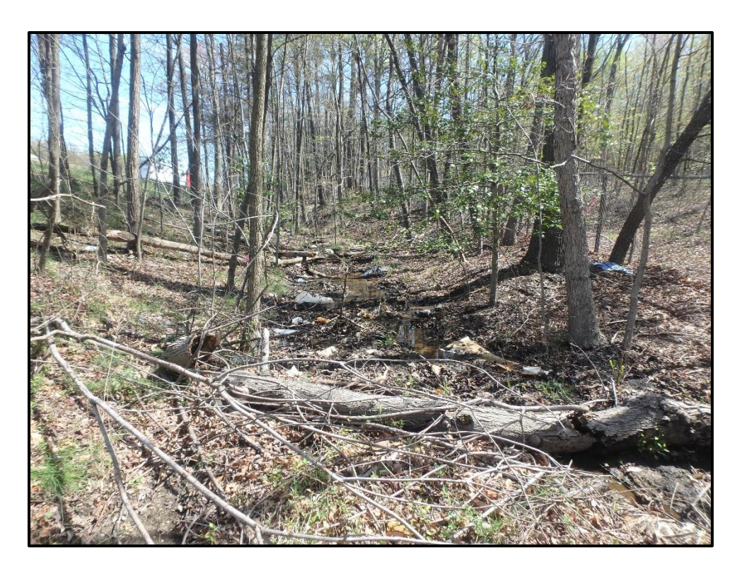
Wetland 4N - PFO