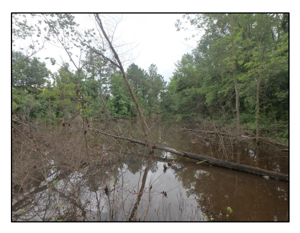
Waters 6DDD – POW