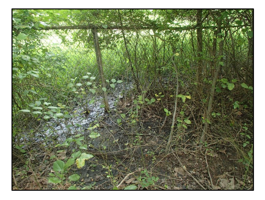
Wetland 4ZZZ – PFO