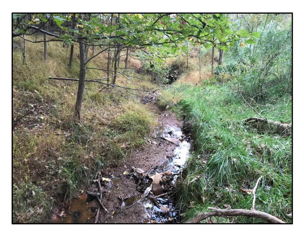
Waters 7MM – Intermittent