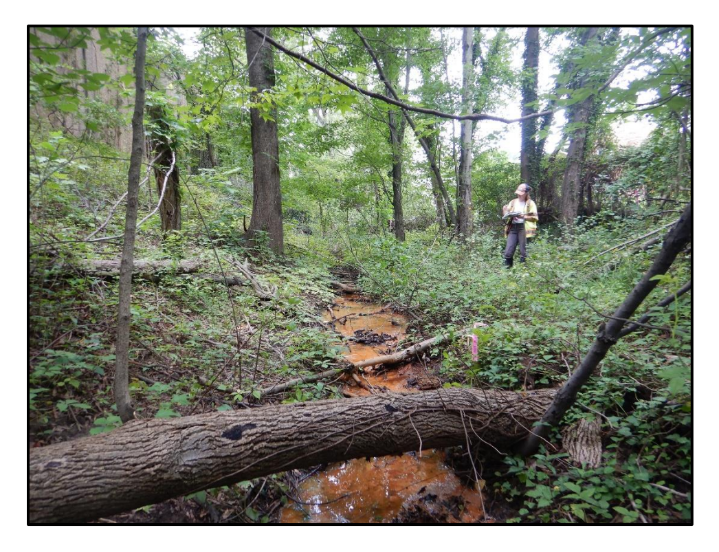
Waters 2JJ – Intermittent