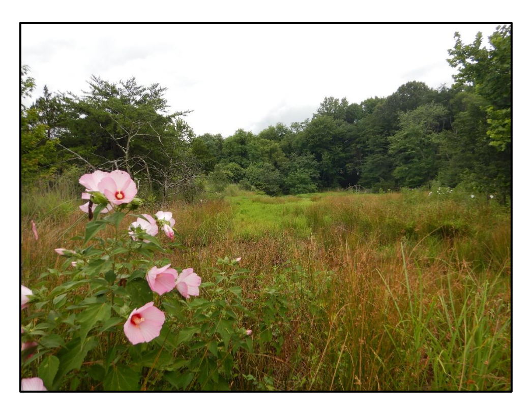
Wetland 2CC – PEM