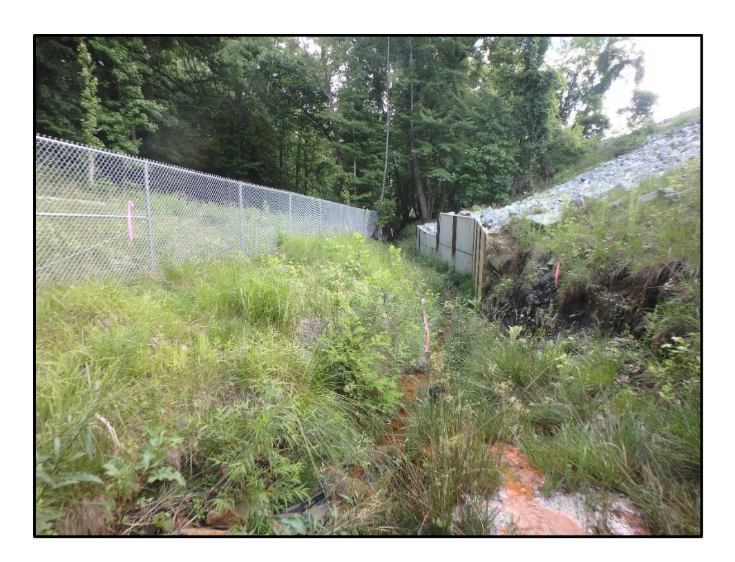
Wetland 4CCC – PEM