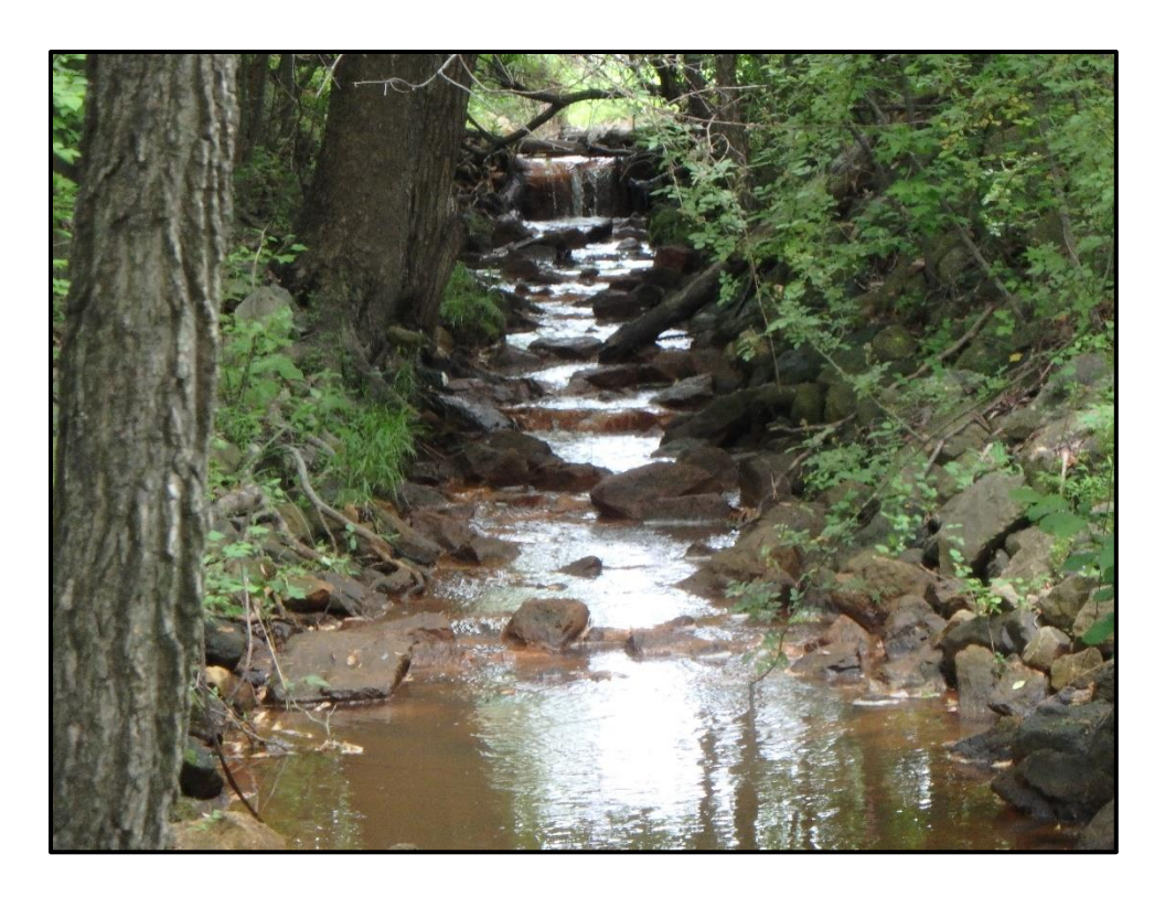
Waters 4Q - Perennial