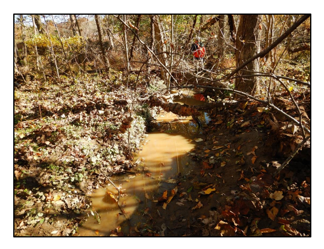
Waters 500 – Intermittent