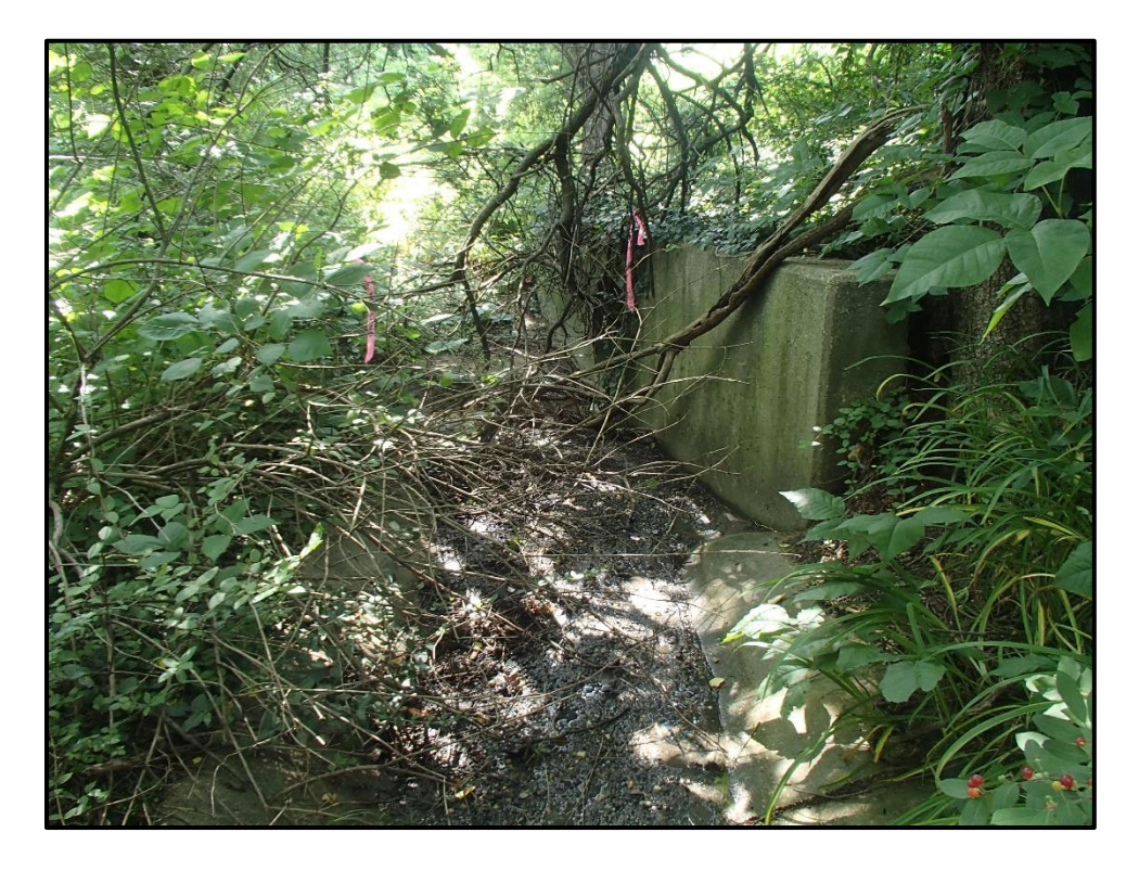
Waters 4YYY – Intermittent