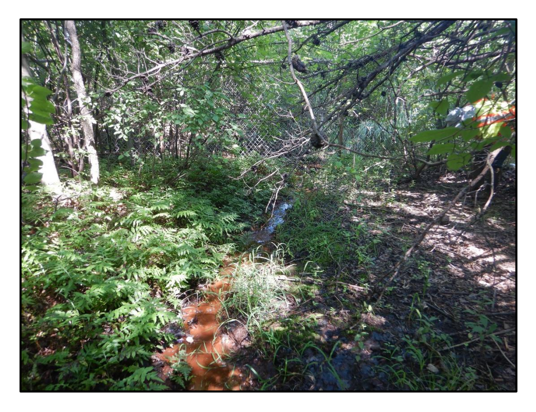
Waters 2PP – Intermittent