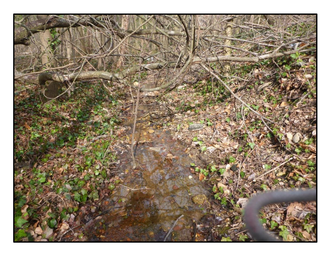
Waters 1P – Intermittent