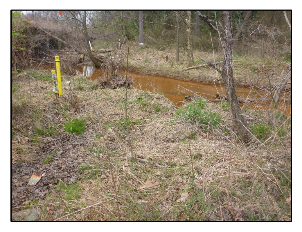
Wetland \ 3R-PSS