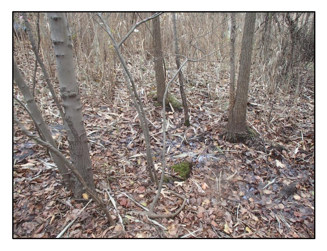
Wetland 2WW – PFO