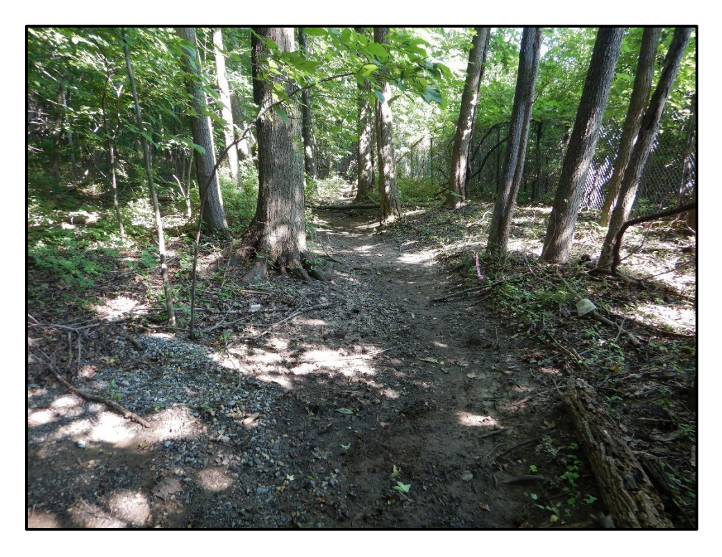
Wetland 6ZZZ – PFO