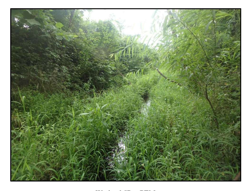
Wetland \ 5R-PEM