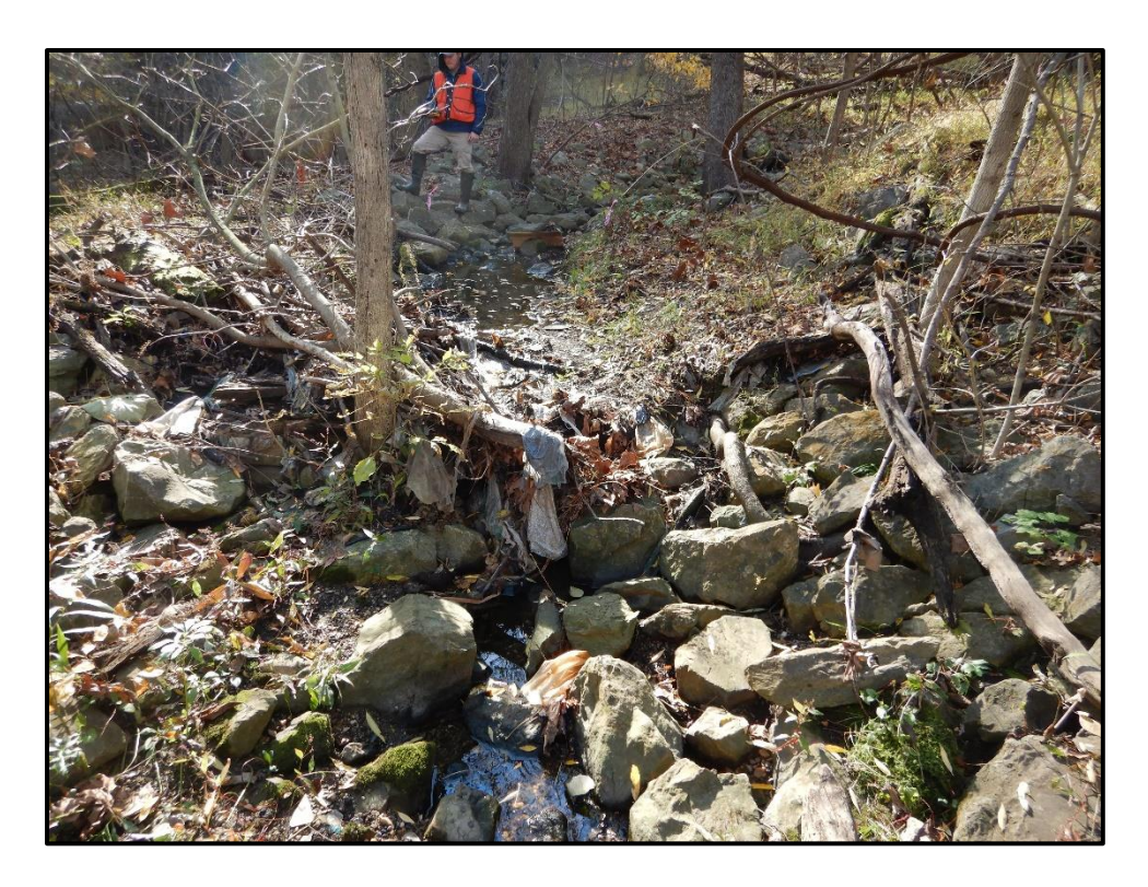
Waters 5HH – Intermittent