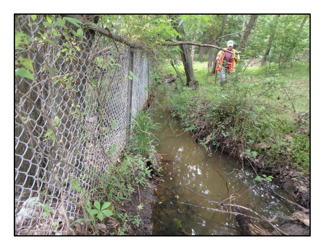
Waters 400 - Intermittent