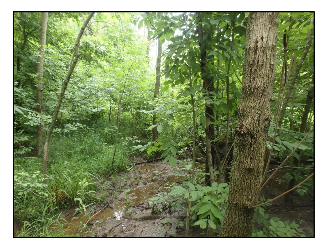
Wetland 6Y – PFO