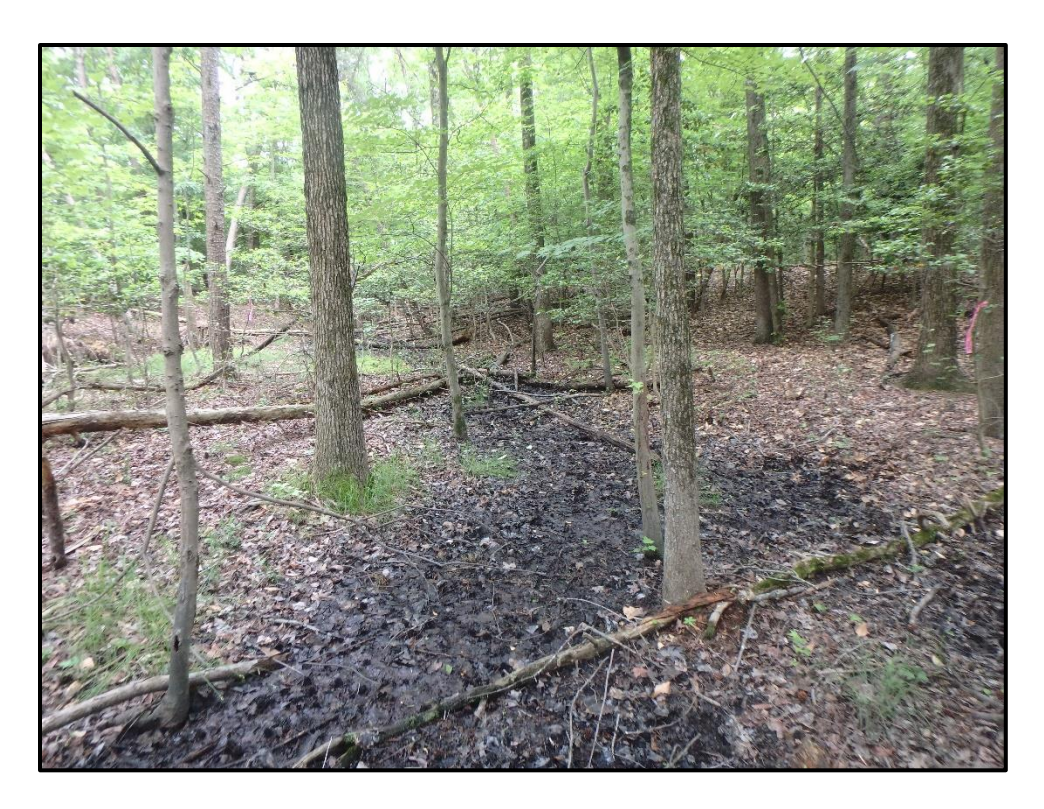
Wetland 2XX – PFO