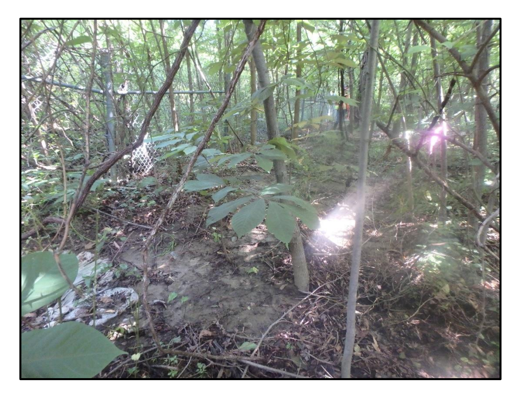
Wetland 6DD – PFO