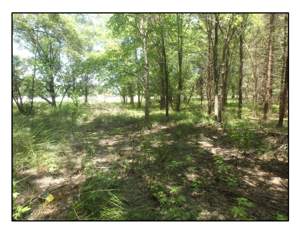
Wetland 7L - PFO