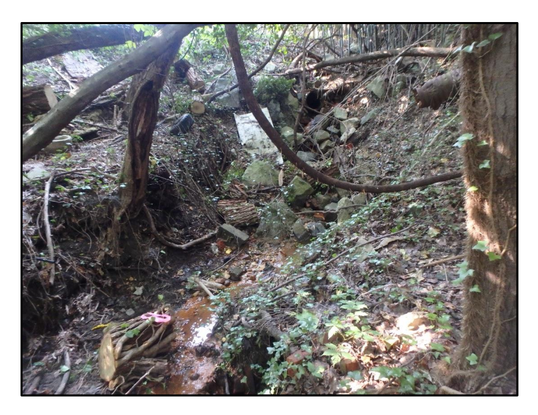
Waters 1L – Intermittent