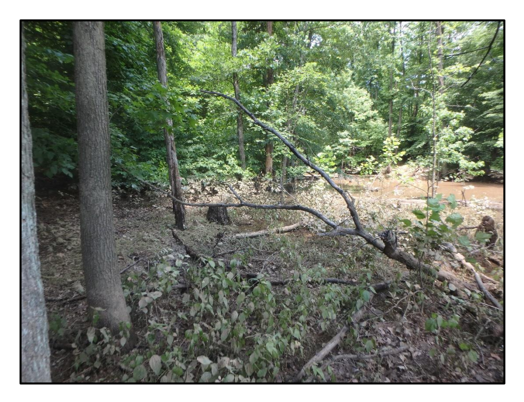
Wetland 4DDD – PFO