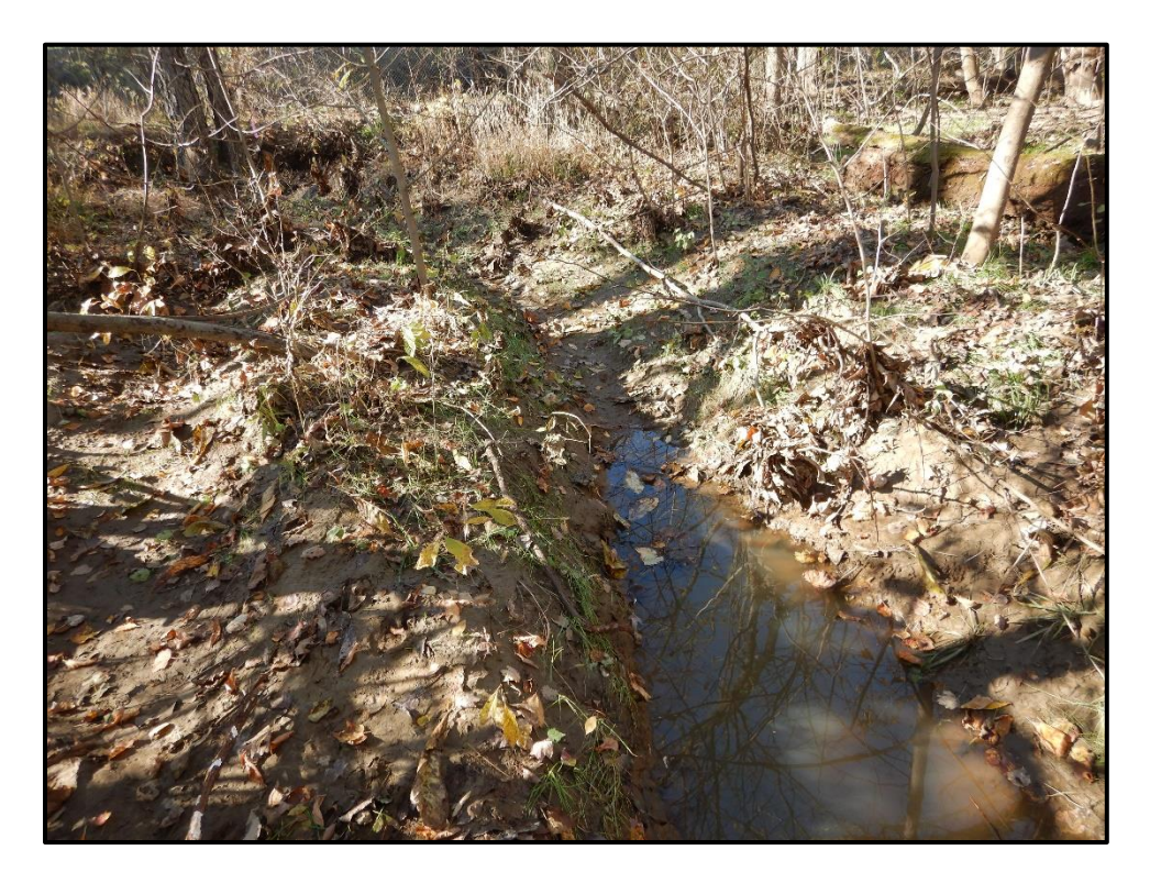
Waters 500 – Intermittent