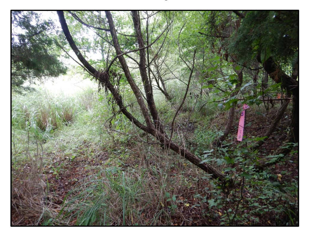
Wetland 2DD – PFO