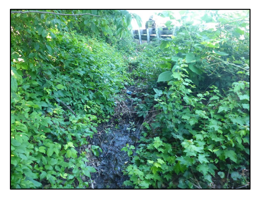
Wetland \ 7K-PEM