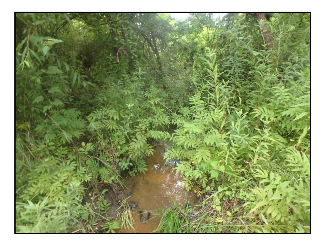
Waters 5N – Intermittent