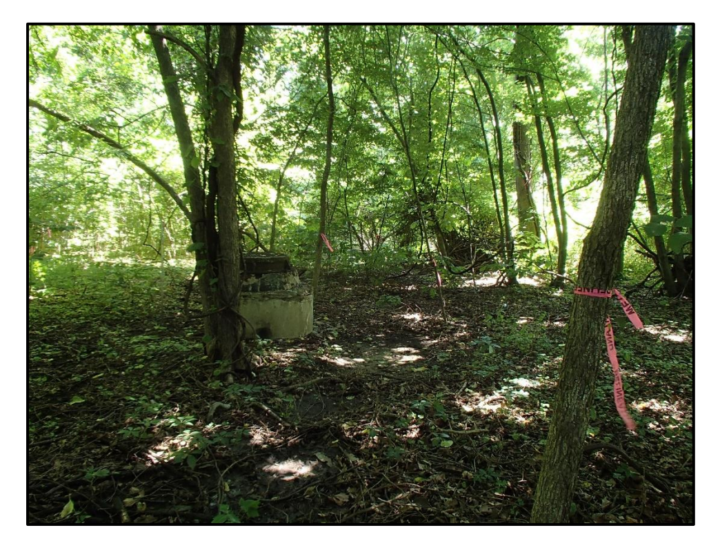
Wetland 6Q - PFO