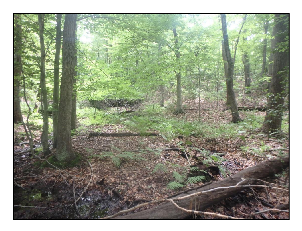
Wetland 4RRRR – PFO