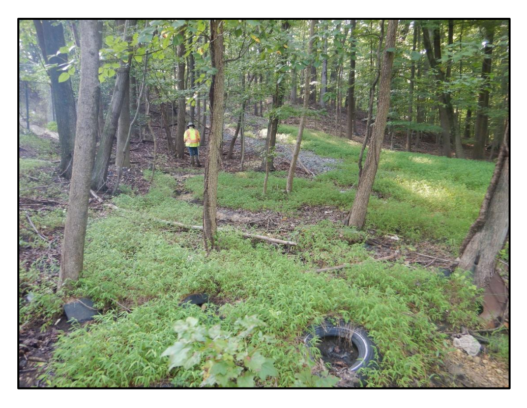
Wetland 2NN – PFO