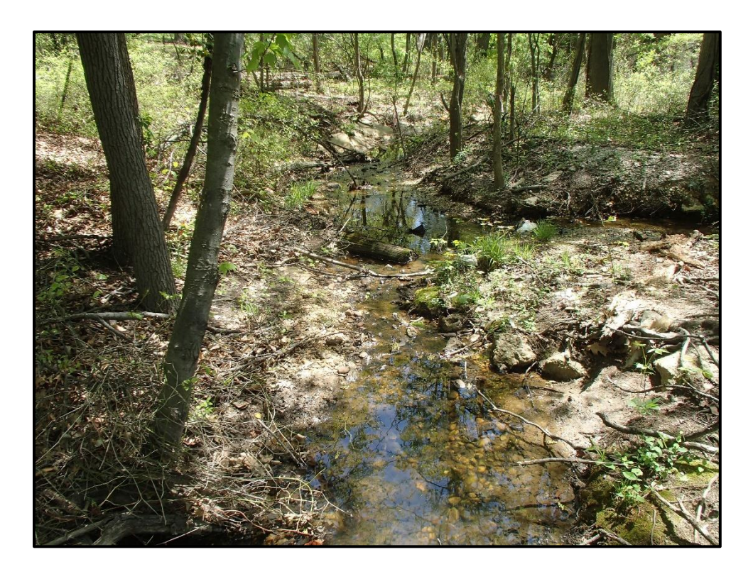
Waters 2Y – Perennial