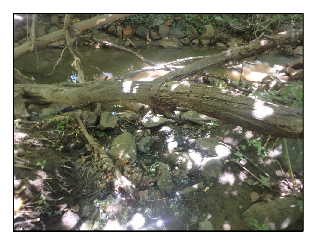
Waters 5J – Intermittent