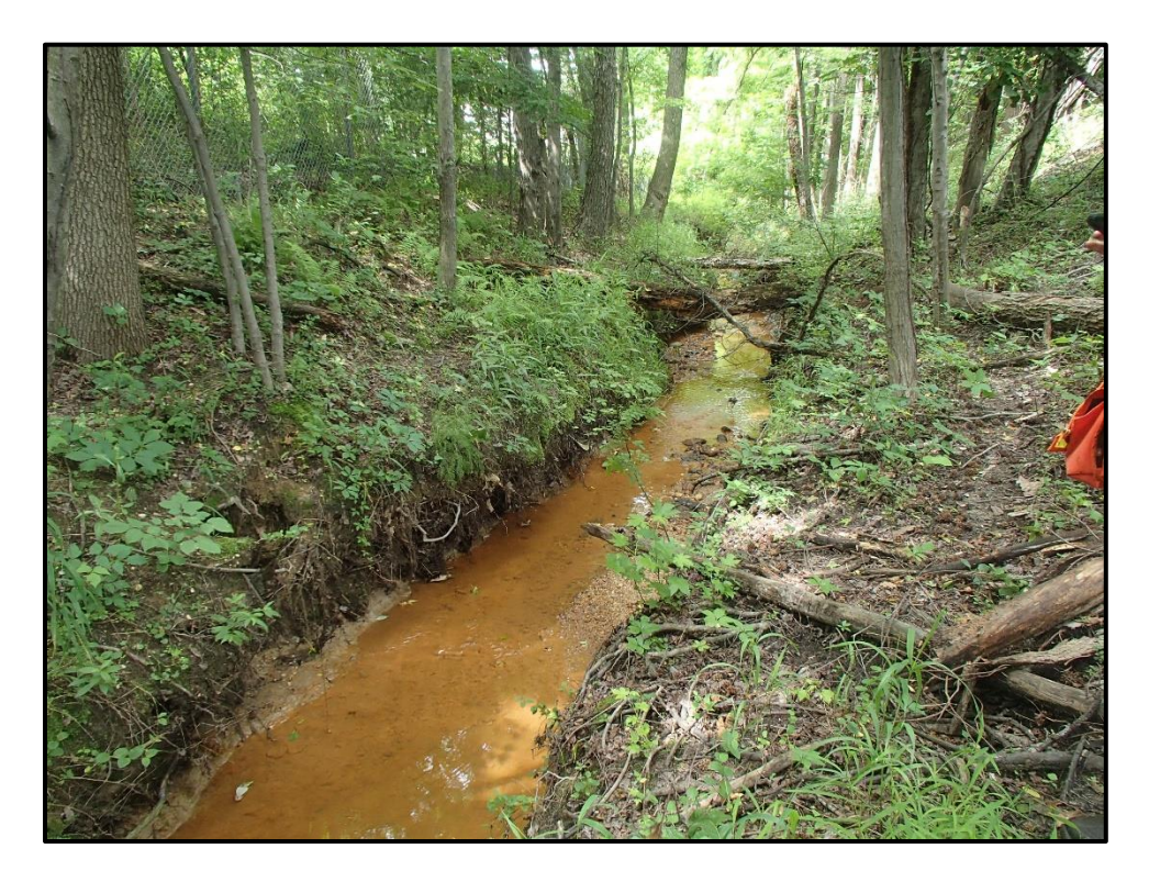
Waters 4PPPP – Perennial