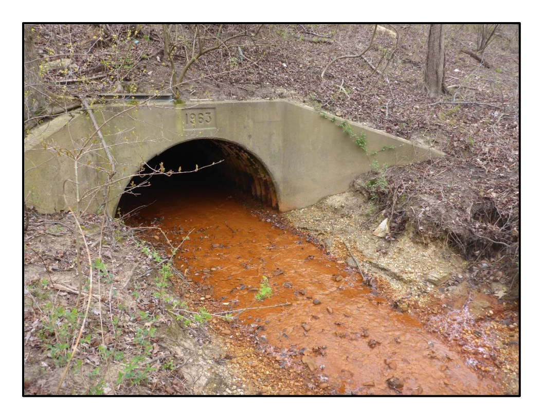
Waters 3AA – Perennial