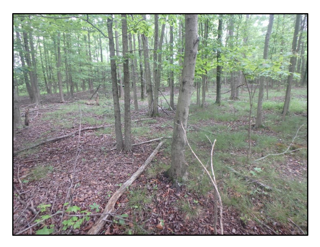
Wetland 3SSS – PFO