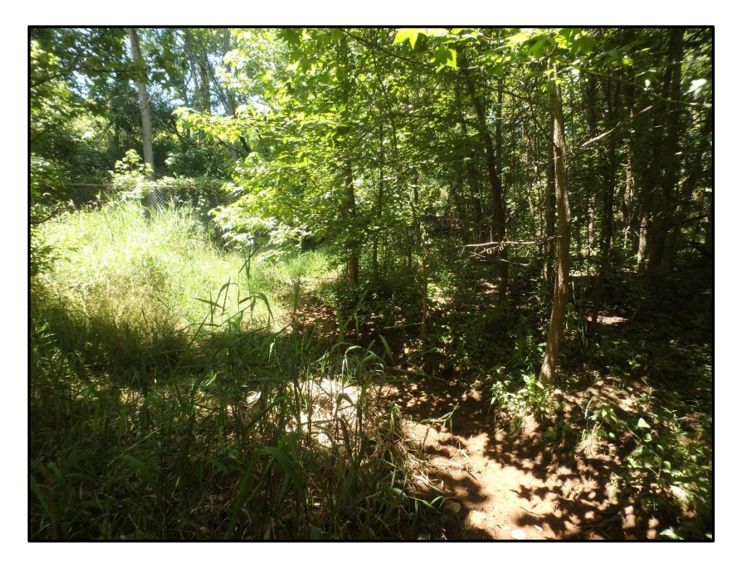
Wetland 7DD – PFO