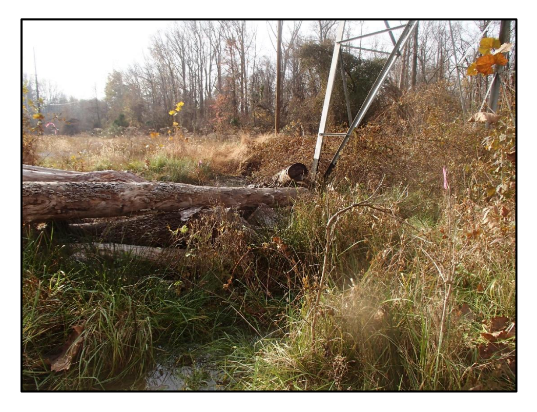
Wetland 1DDD – PEM