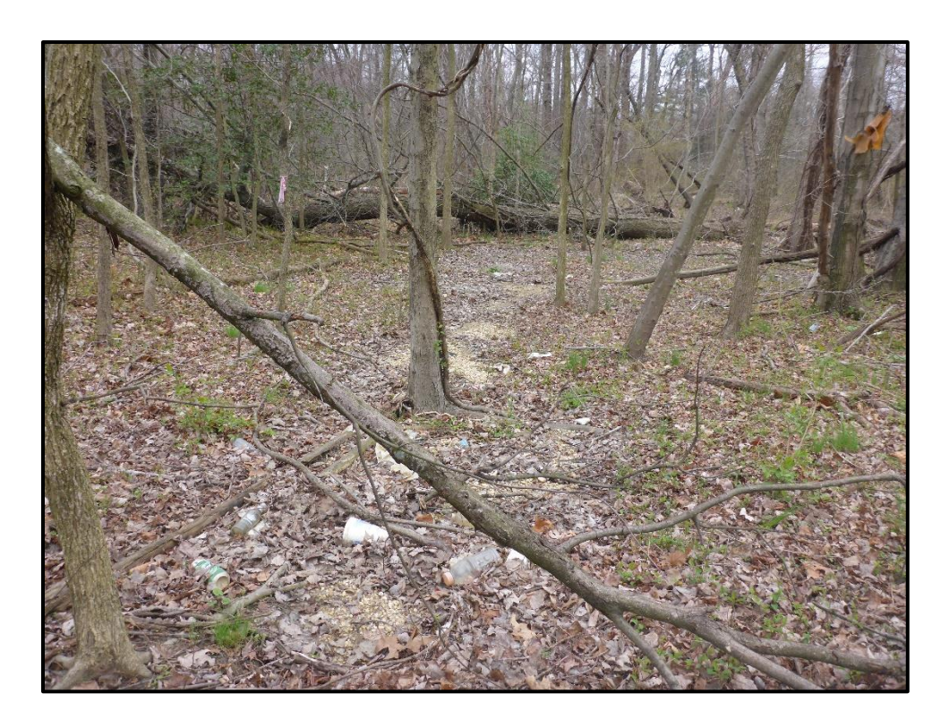
Waters 3Z – Ephemeral