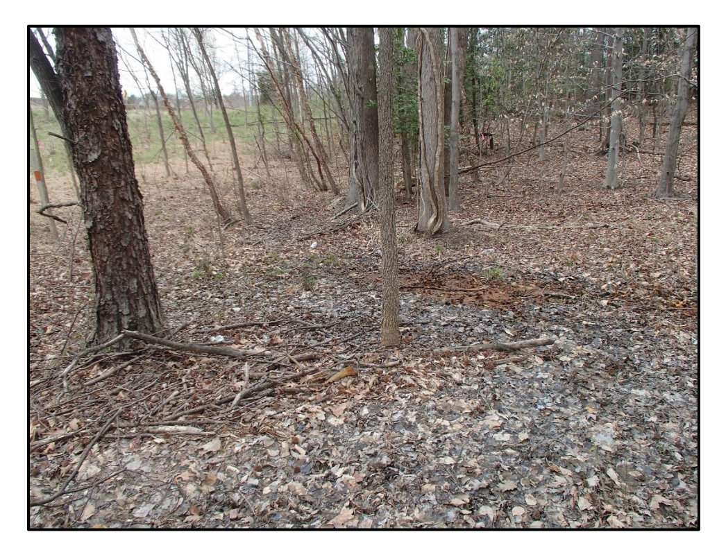
Wetland 2C – PFO