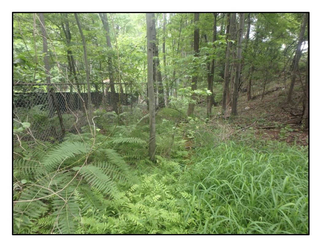
Wetland 4NNNN – PFO