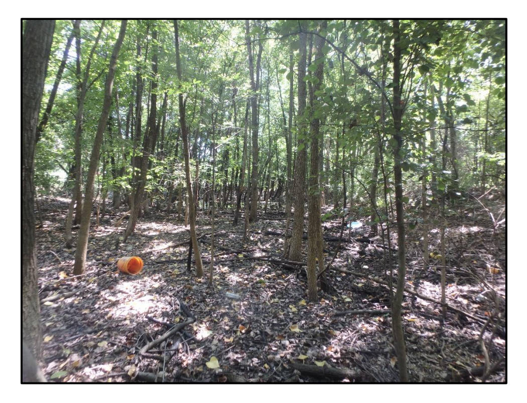
Wetland 1EE – PFO