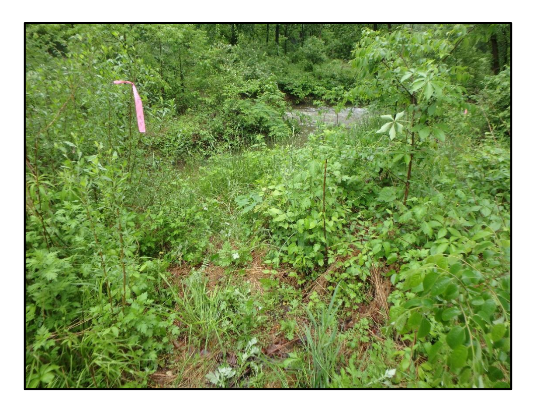
Wetland 3MMM – PEM