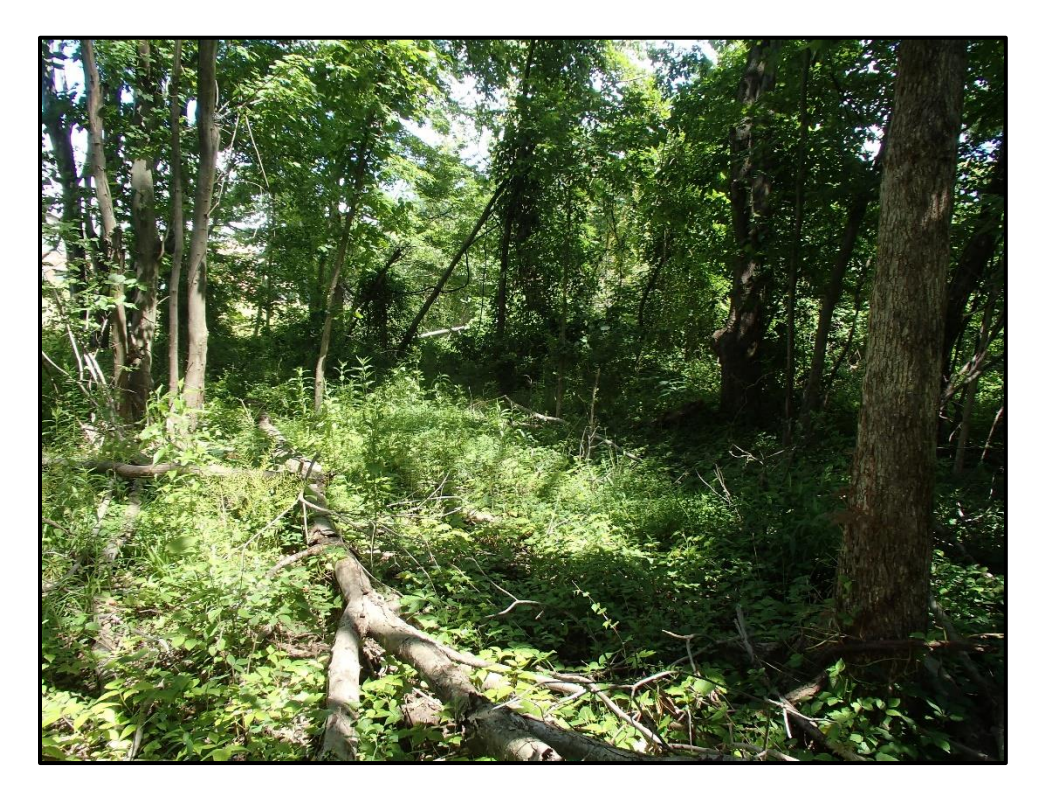
Wetland 6000 - PFO