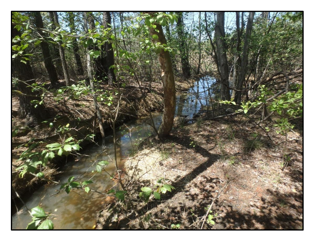
Waters 2V – Perennial