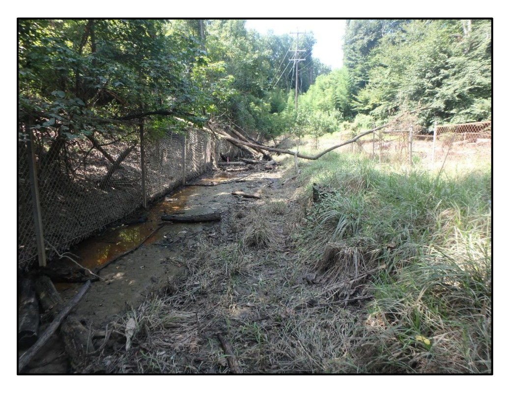
Wetland 1BB – PEM