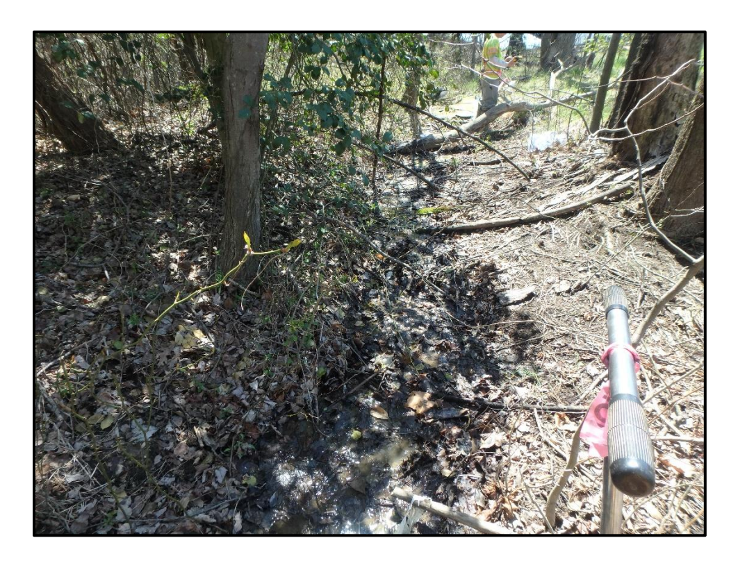
Waters 4K – Intermittent