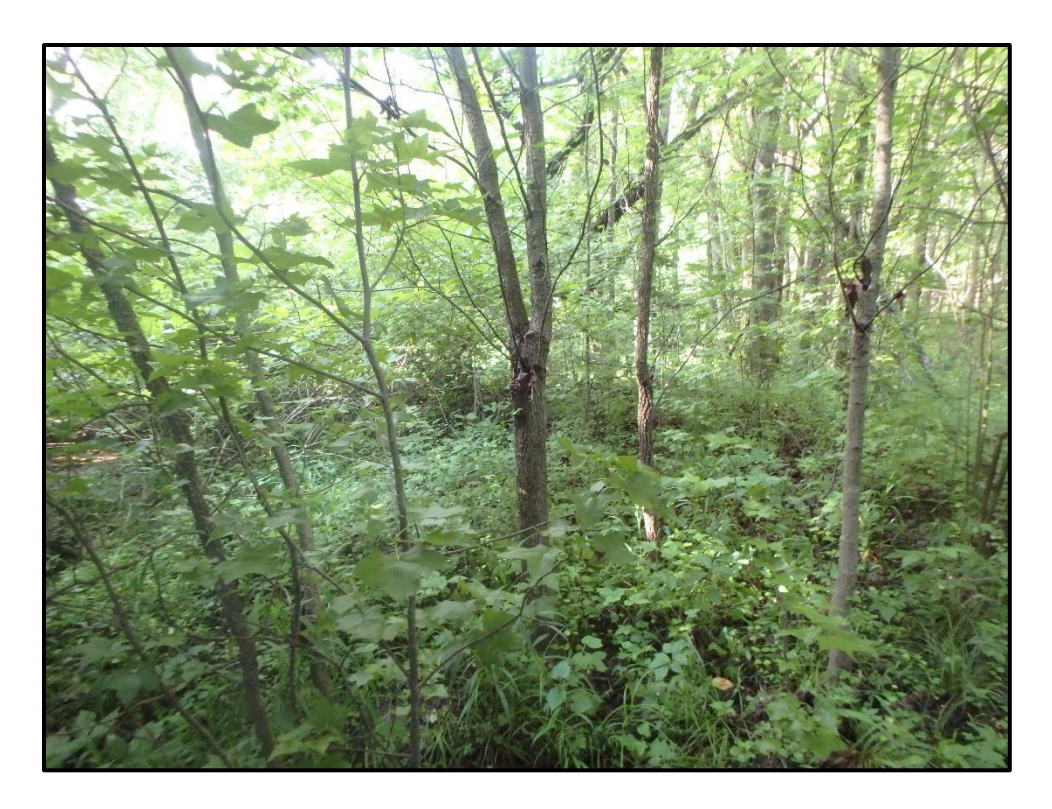
Wetland 4KKK – PFO