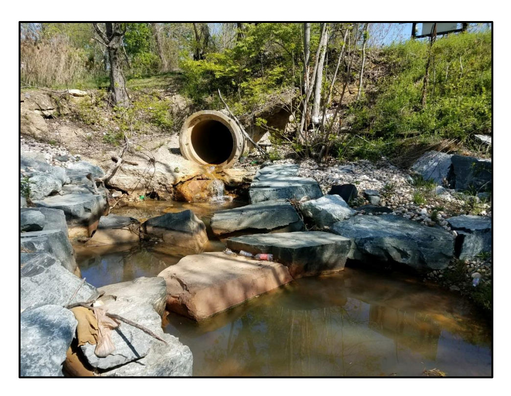
Waters 1W – Perennial