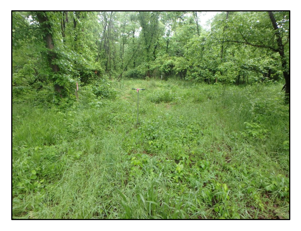
Wetland 3T – PFO