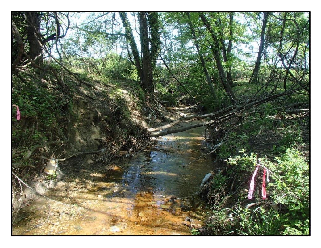
Waters 3WW – Perennial