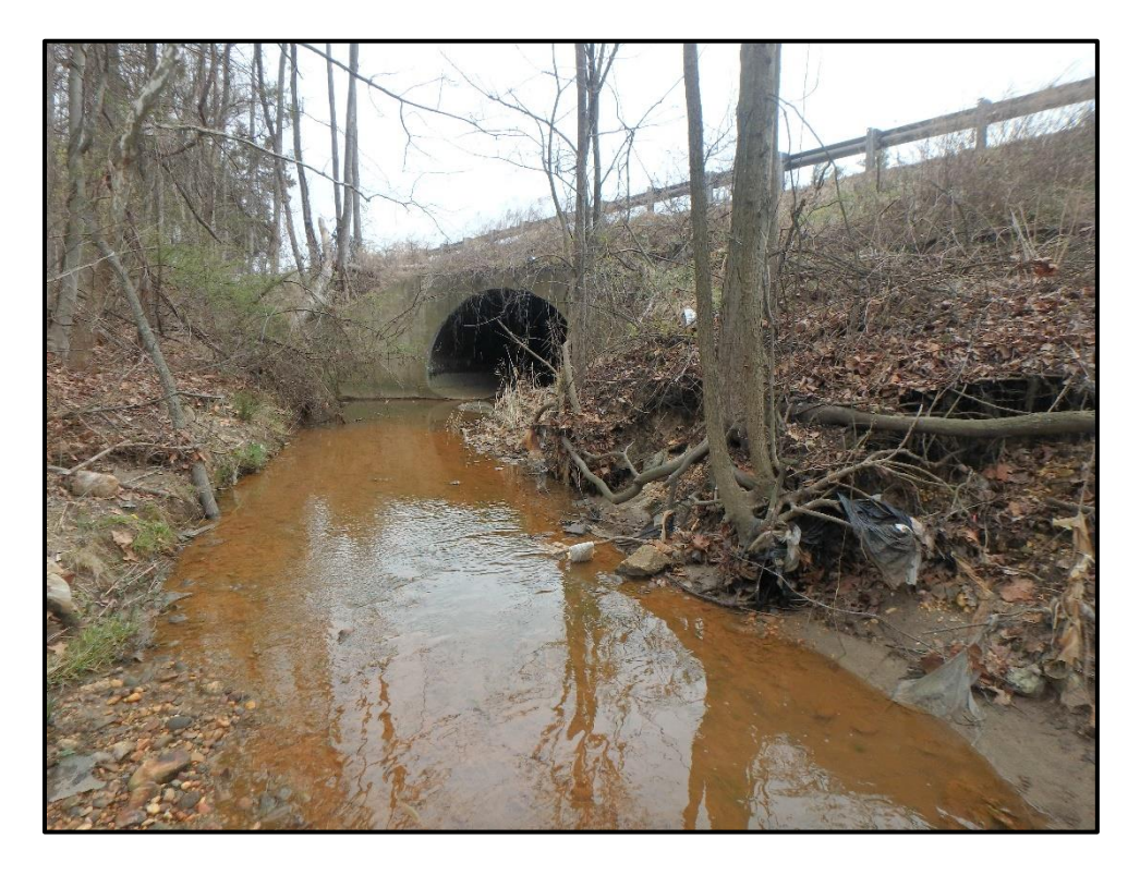
Waters 1D – Perennial