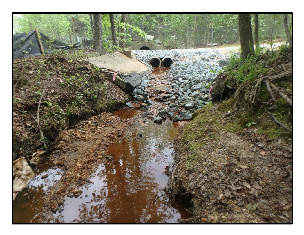
Waters 4W – Perennial