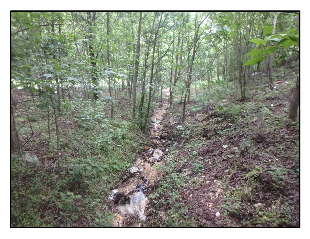
Waters 4GGG – Intermittent