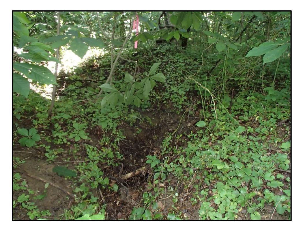
Waters 60 – Ephemeral