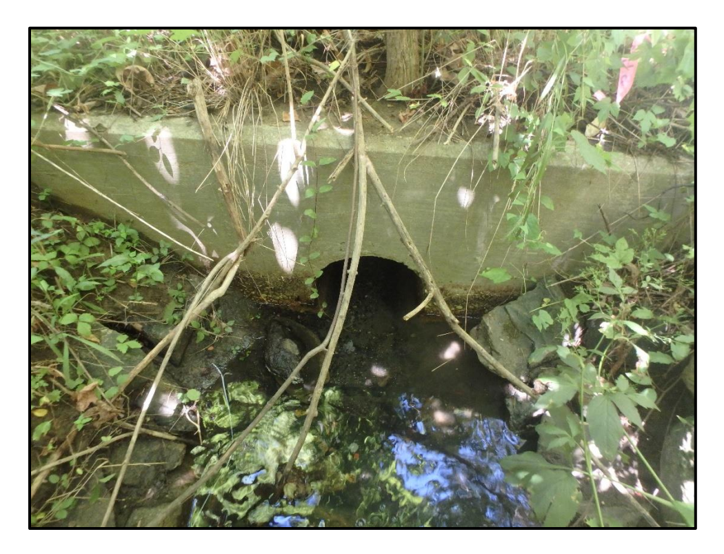
Waters 5J – Intermittent