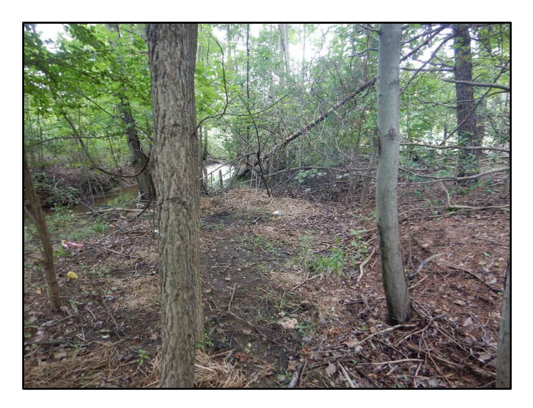
Wetland 2BB – PFO