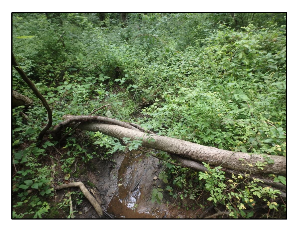
Waters 6WW – Intermittent