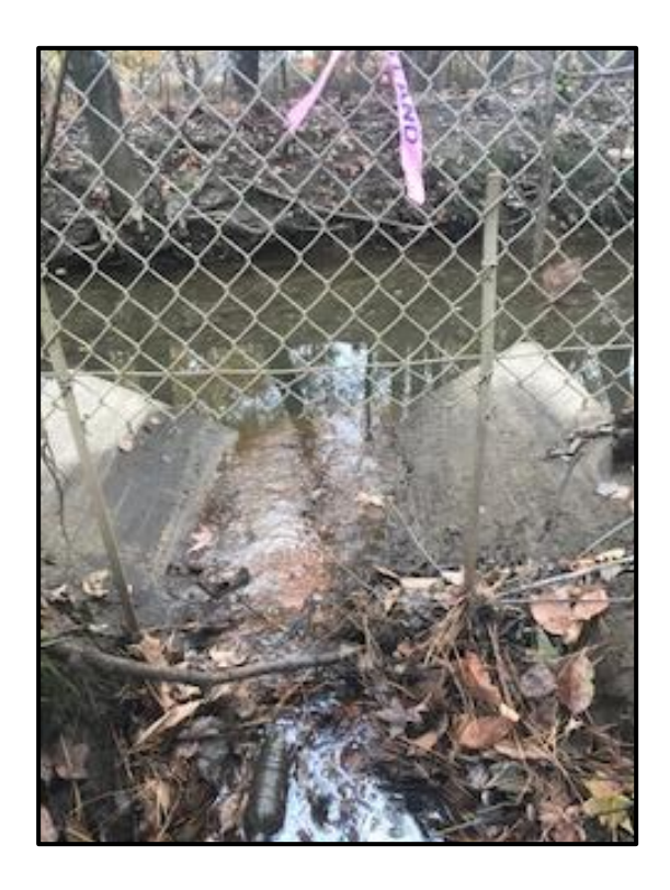
Waters 5PP – Intermittent