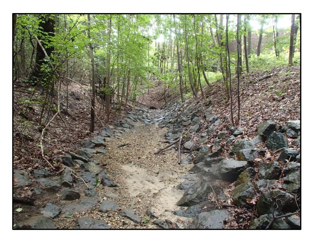
Waters 1RR – Intermittent