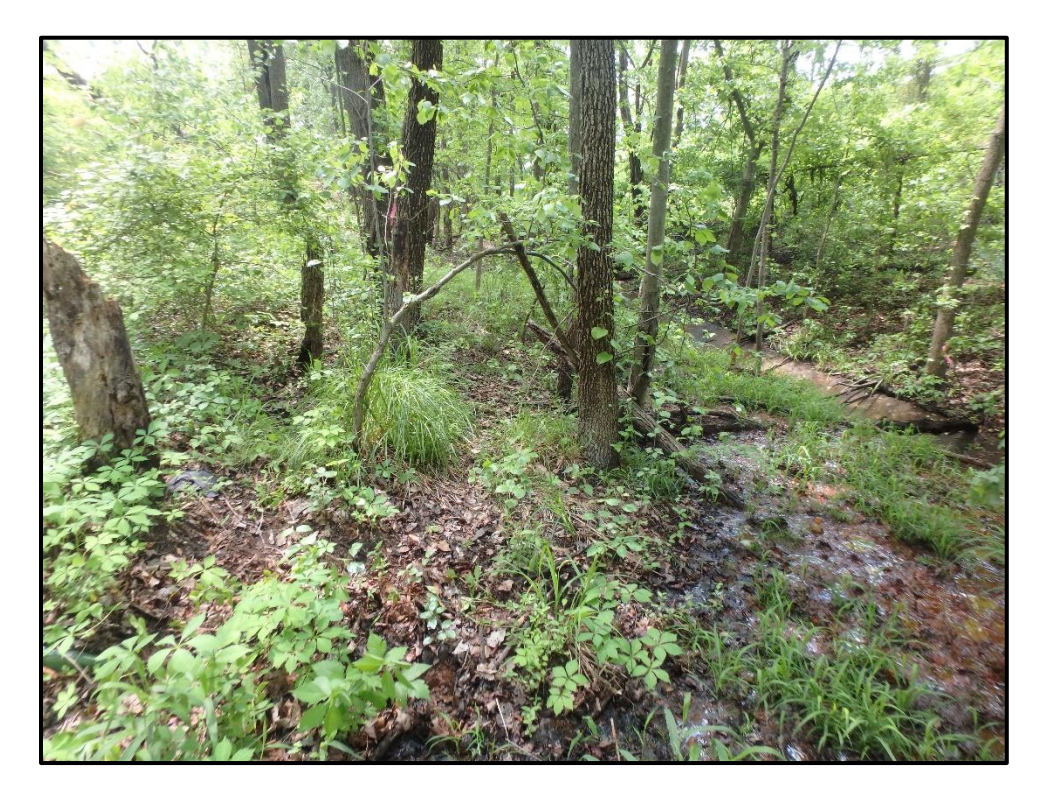
Wetland 3GGG - PFO