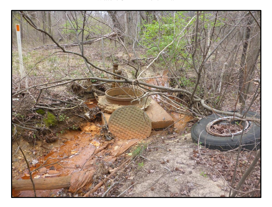
Waters 3AA – Perennial