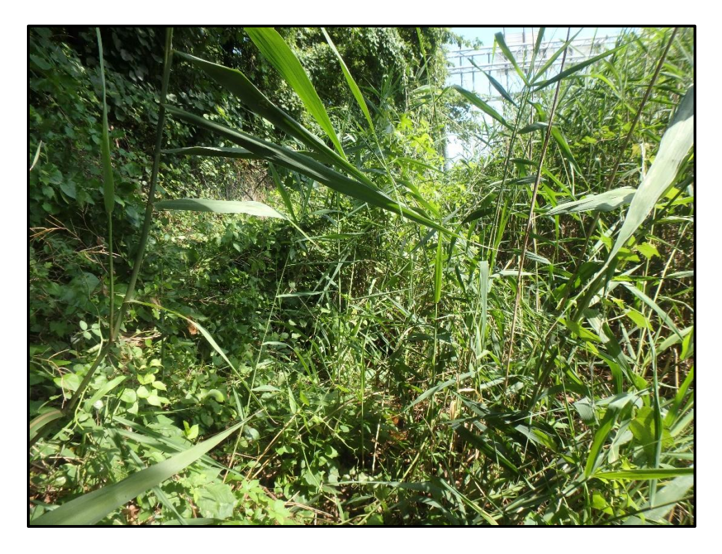
Wetland 6S – PEM