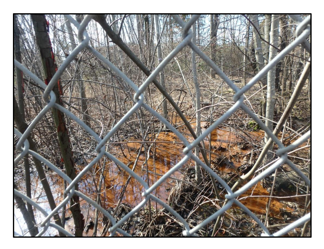
Wetland 2M – PFO