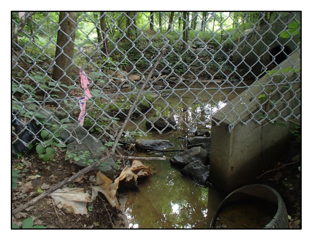
Waters 6LLL – Perennial