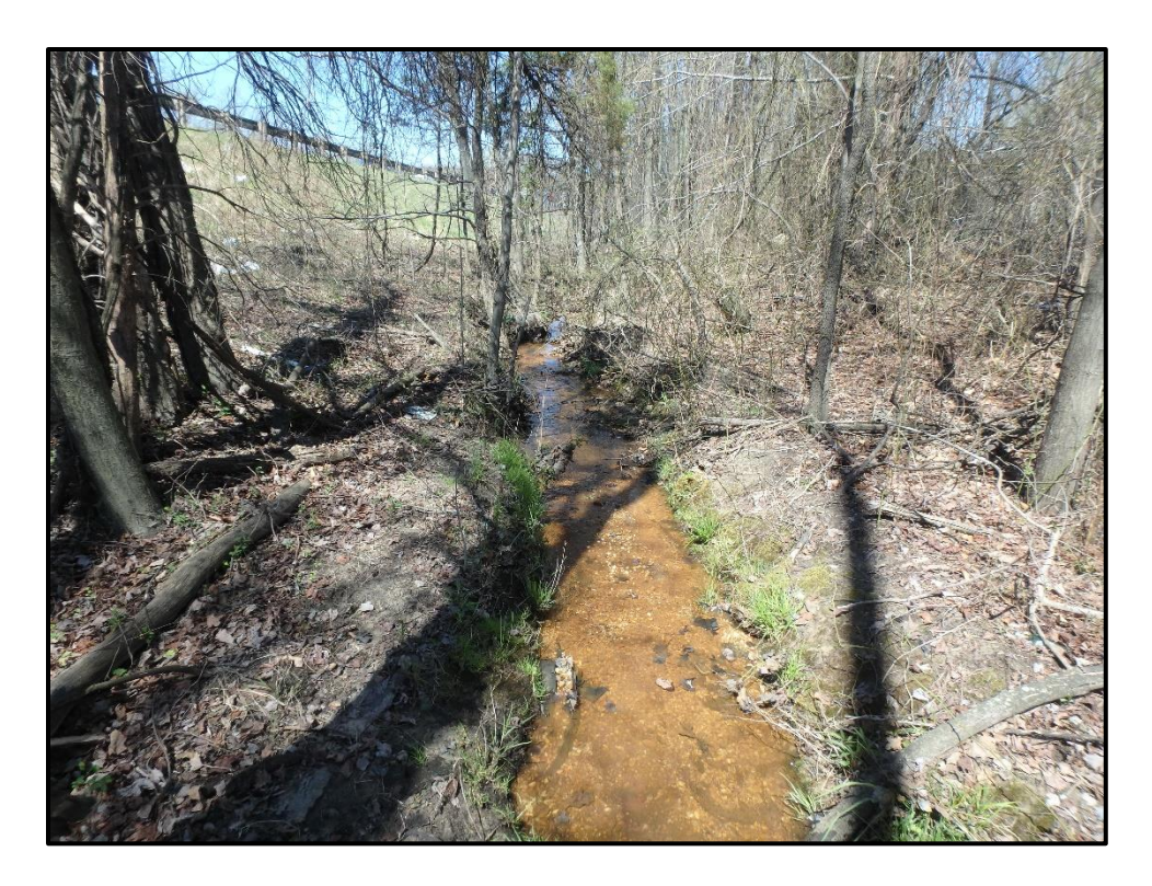
Waters 4M – Perennial