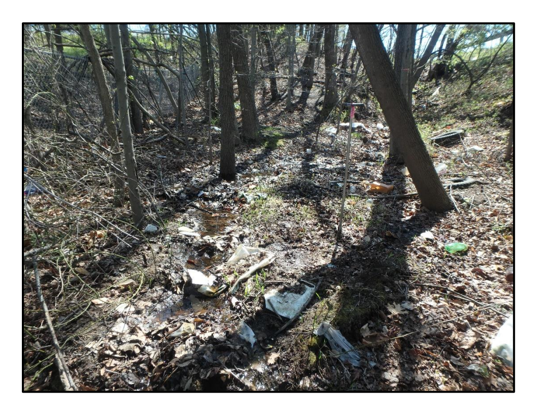
Waters 4U – Intermittent