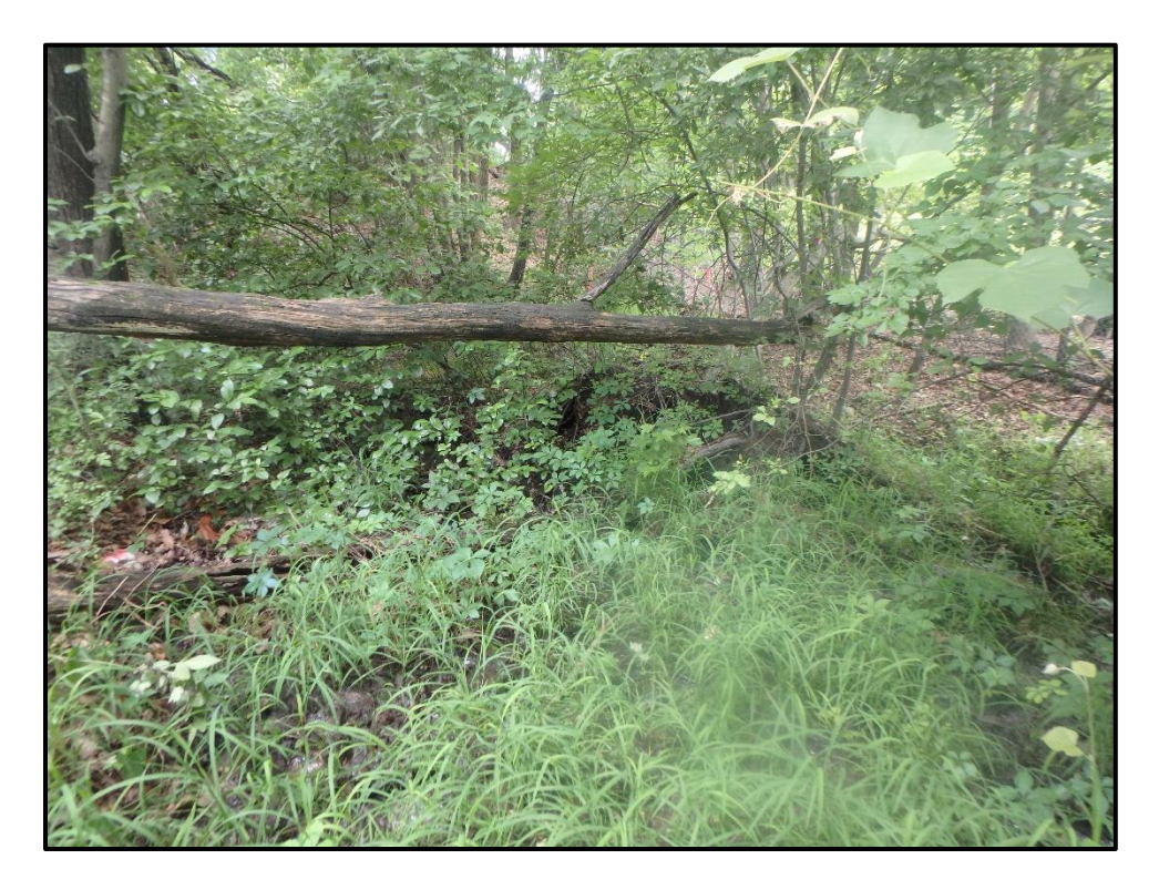
Wetland 4VVV – PFO