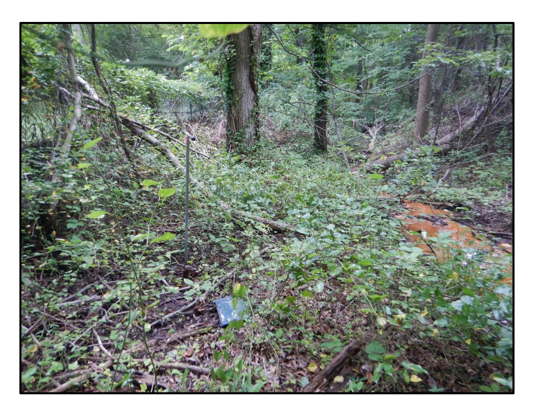
Wetland 2II – PFO