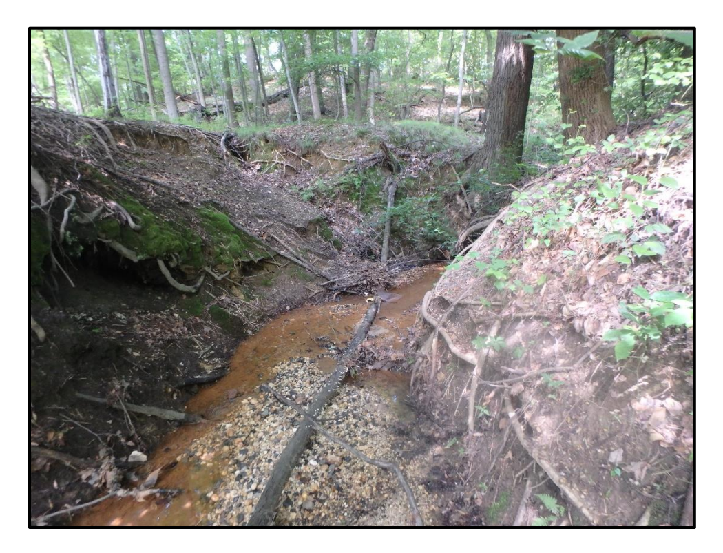
Waters 4TTT – Perennial