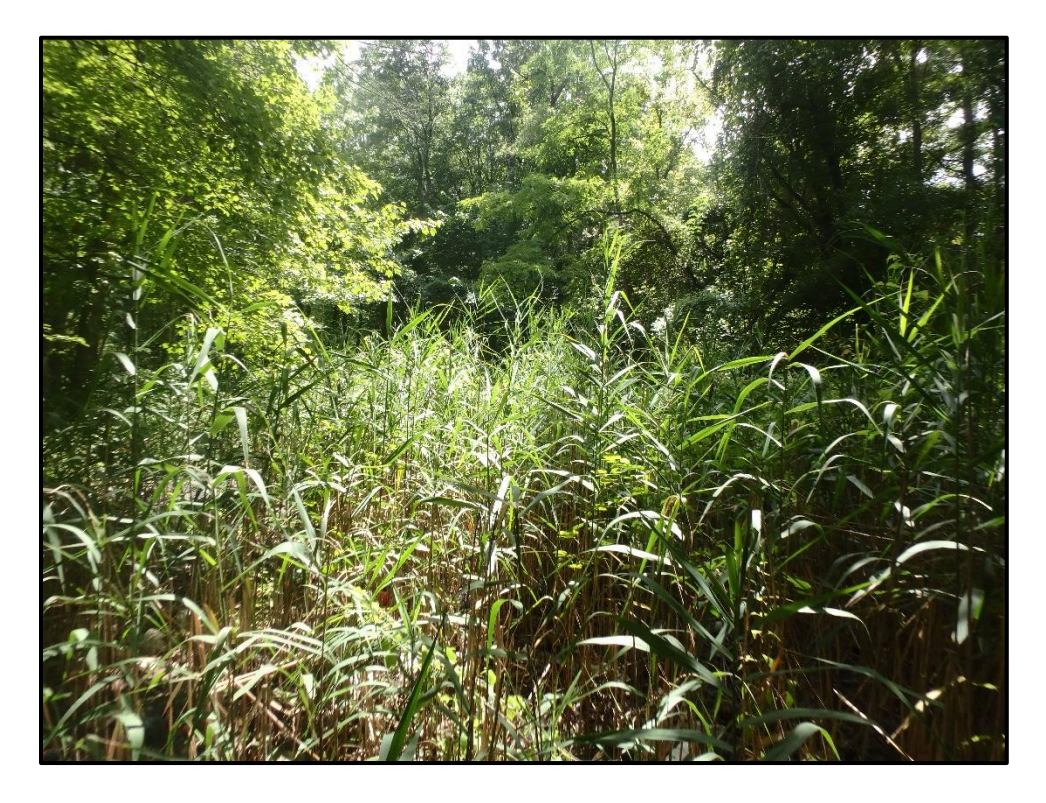
Wetland 5X – PFO