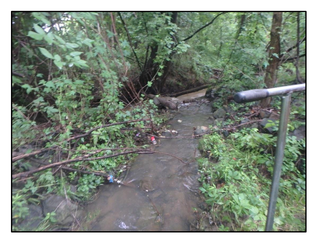
Waters 6AA – Intermittent