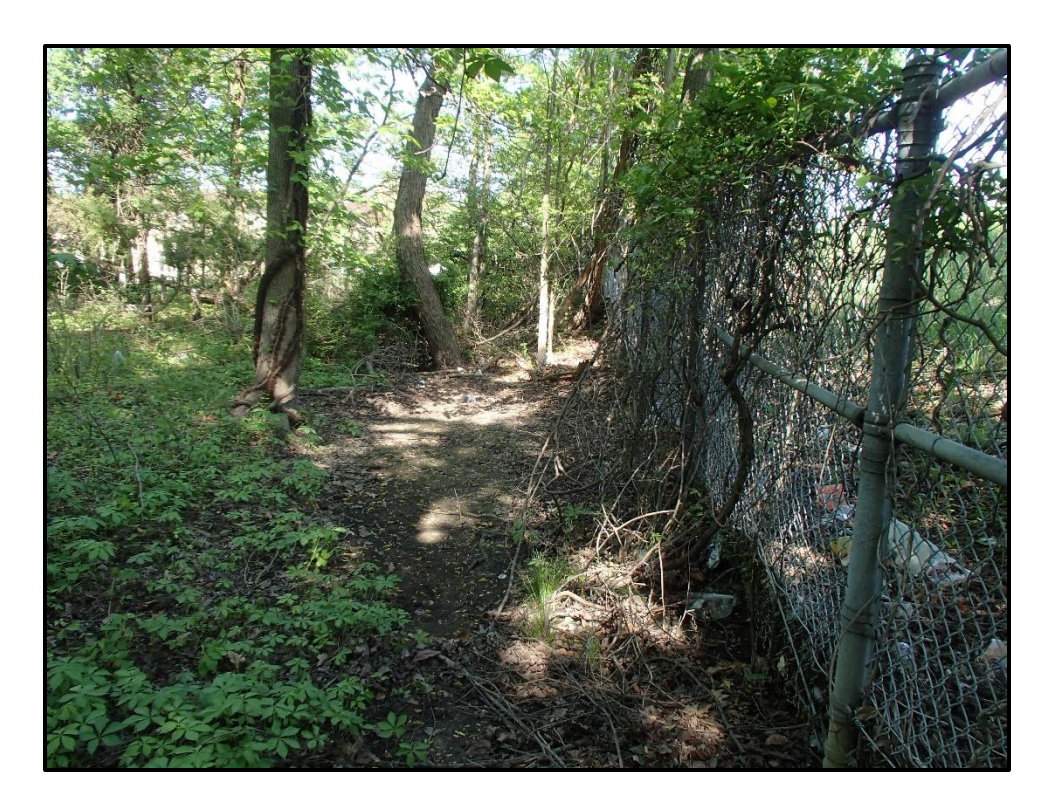
Waters 3QQ – Ephemeral