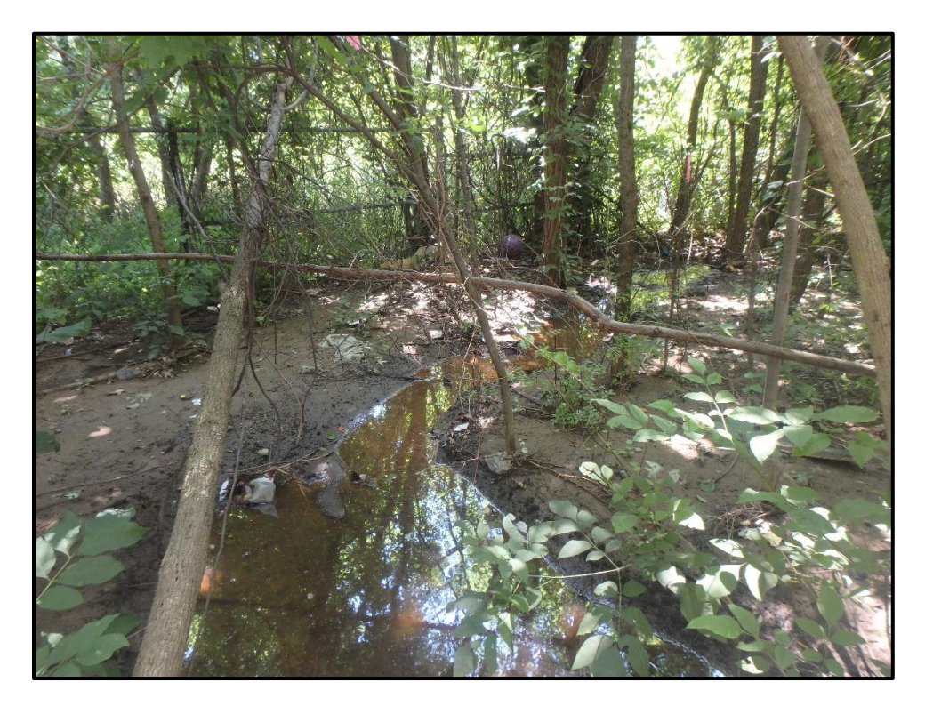
Waters 6UU – Intermittent