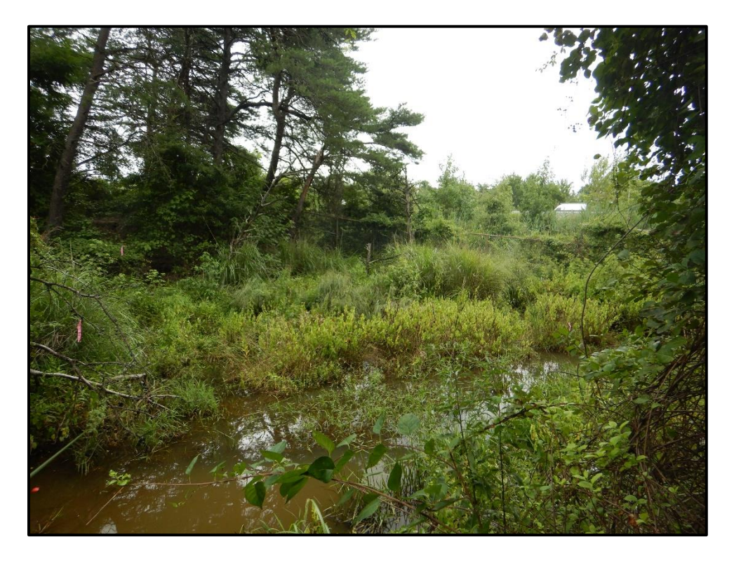
Wetland 2P – PEM