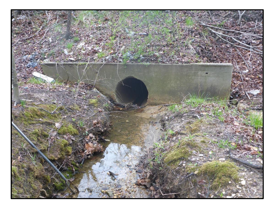
Waters 4B – Intermittent