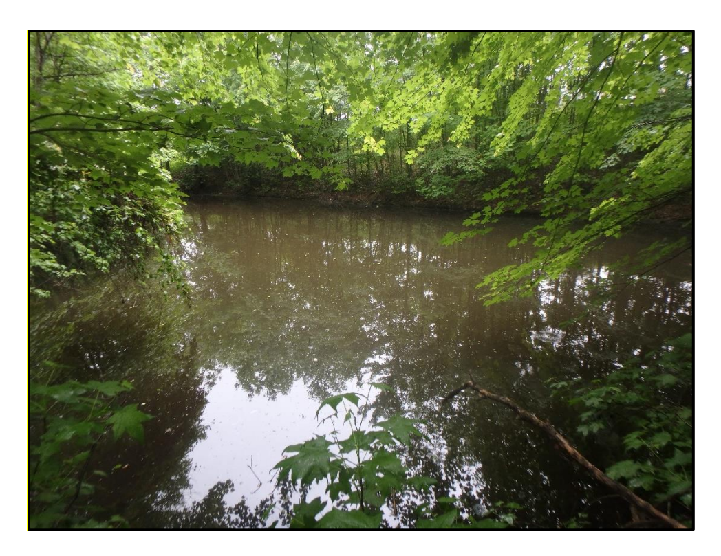
Waters 3000 – POW