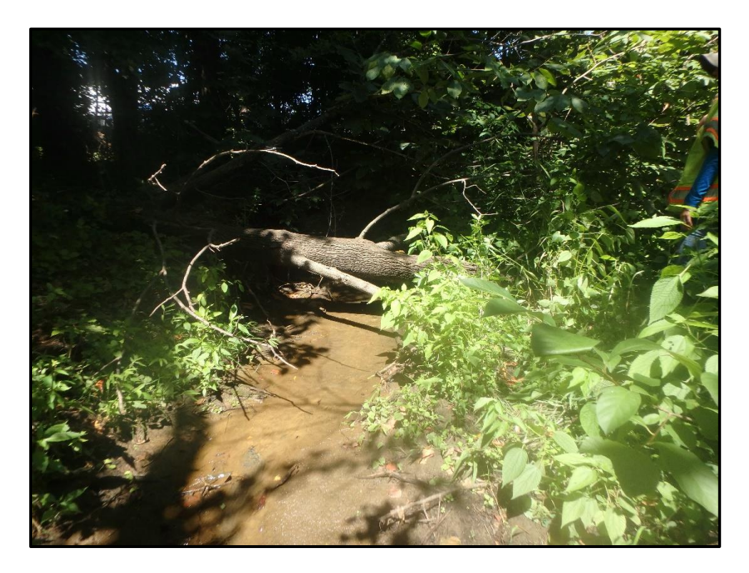
Waters 5H – Perennial