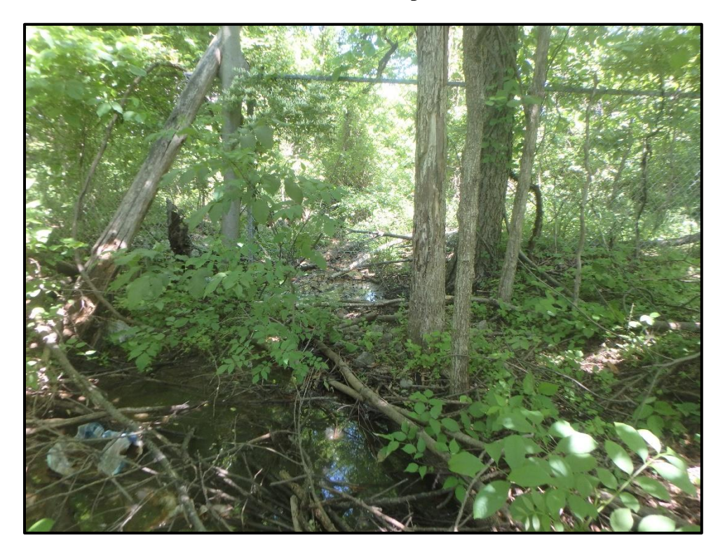
Wetland 6E - PFO