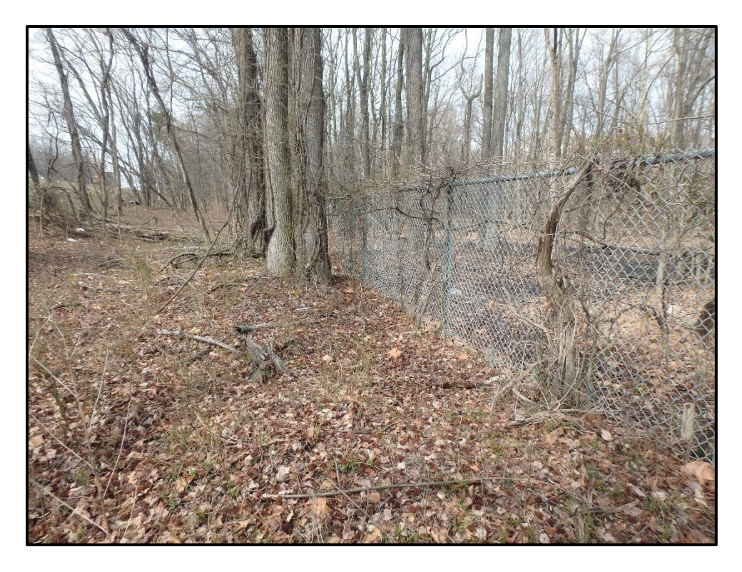
Wetland 1J – PFO