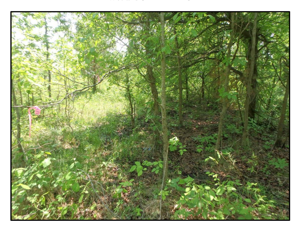
Wetland 3DDD – PFO