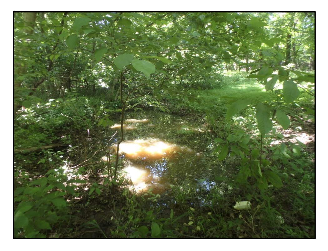
Wetland 6C – PFO