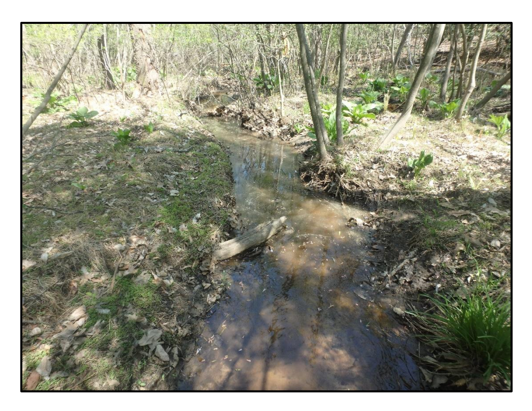
Waters 3VV – Perennial