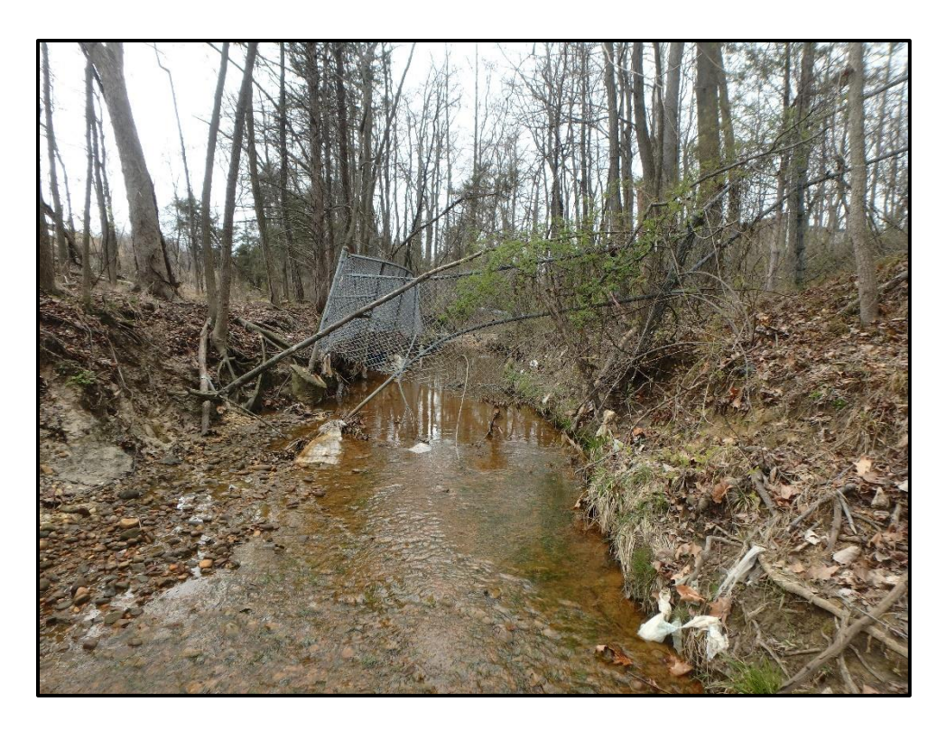
Waters 1D – Perennial