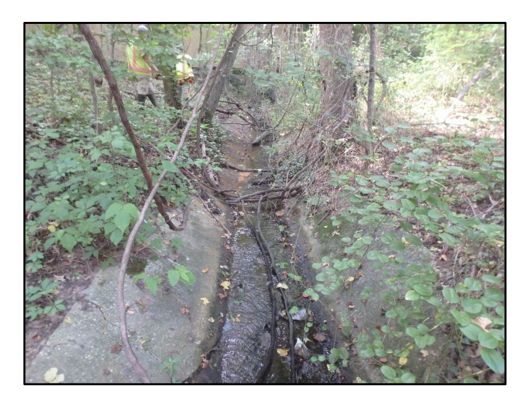
Waters 7N – Perennial