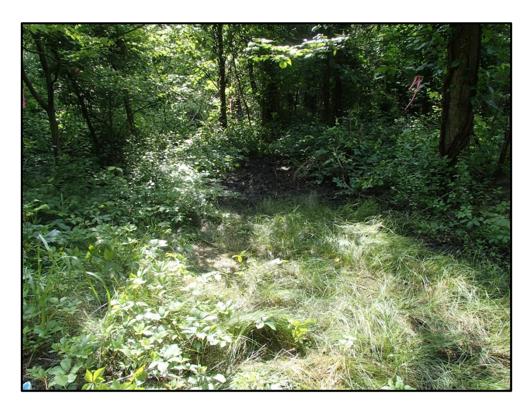
Wetland 4WWW - PFO