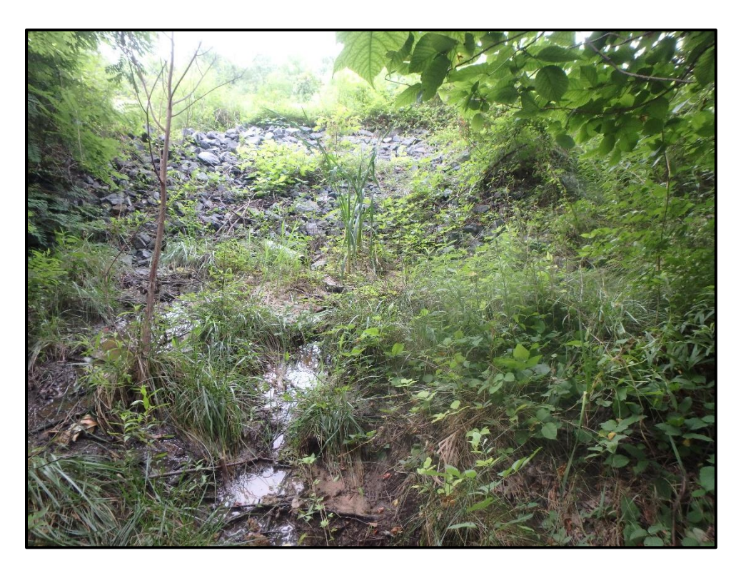
Waters 6YY – Ephemeral