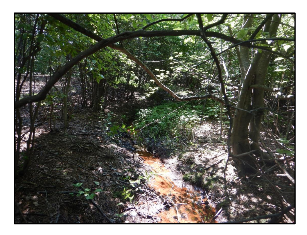
Waters 2PP – Intermittent