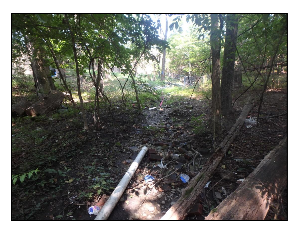
Waters 1M – Ephemeral