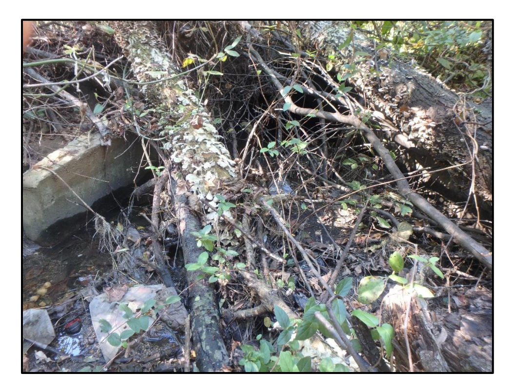
Waters 5FF – Intermittent