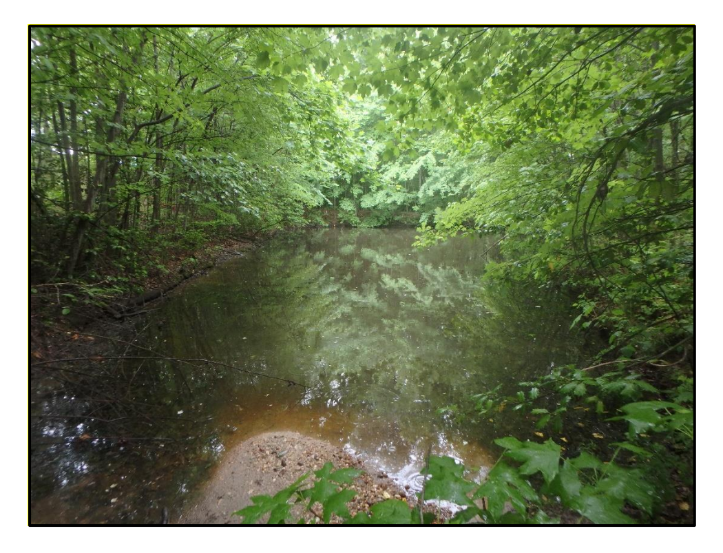
Waters 3000 – POW