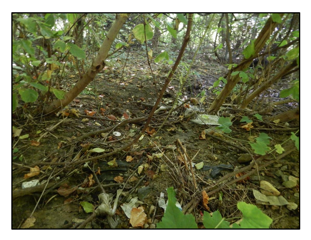
Waters 6AAAA – Ephemeral