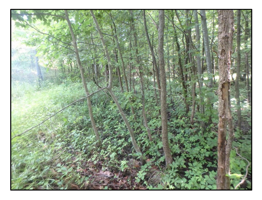
Wetland 4BB – PFO