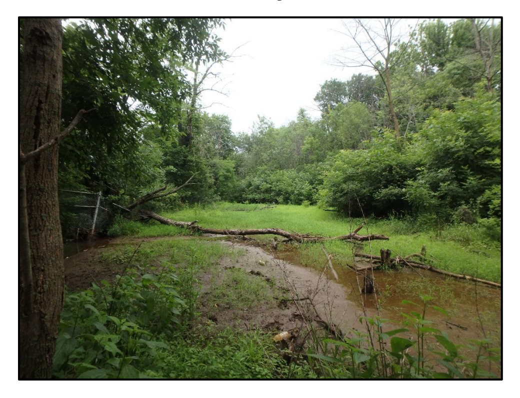
Wetland 6OO – PEM