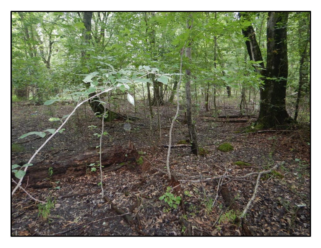
Wetland 2EE – PFO