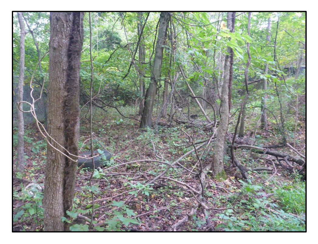
Wetland 1ZZ – PFO