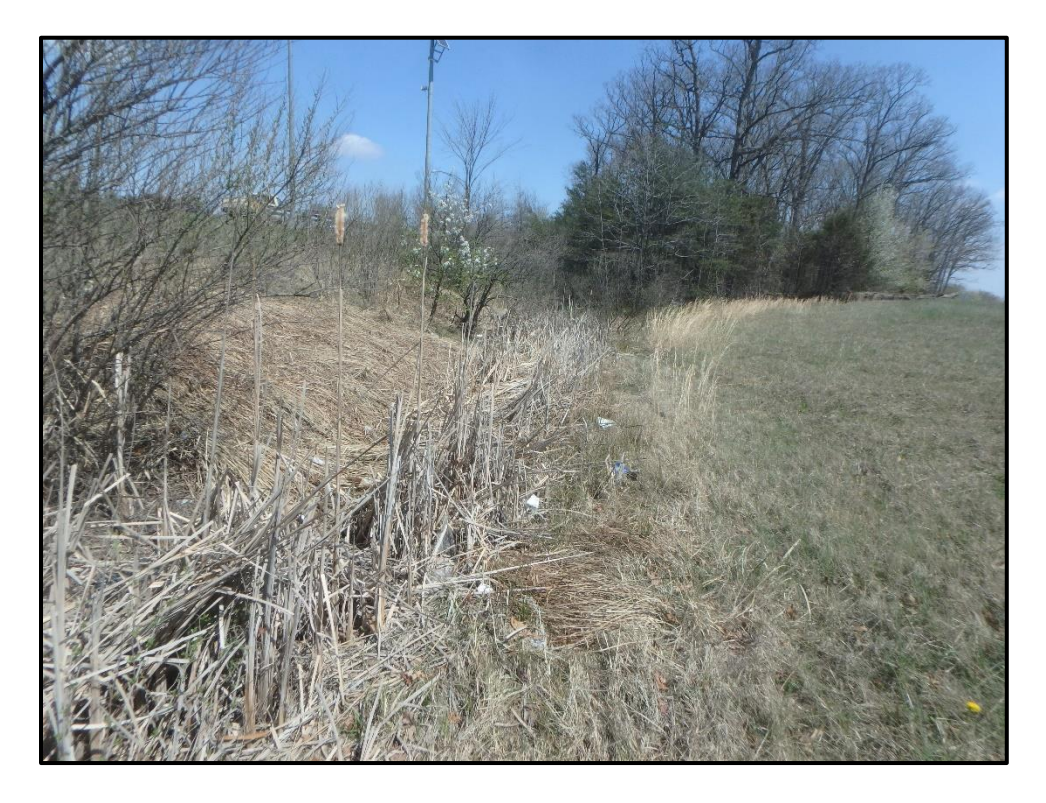
Wetland 3GG – PEM