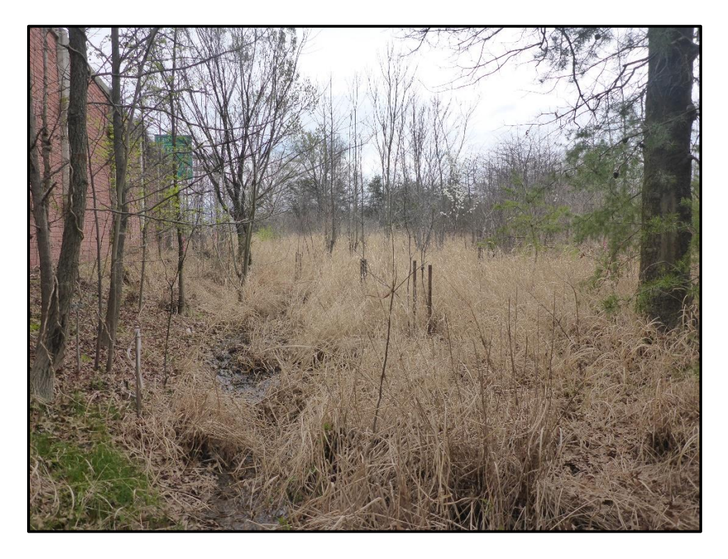
Wetland 2B - PFO