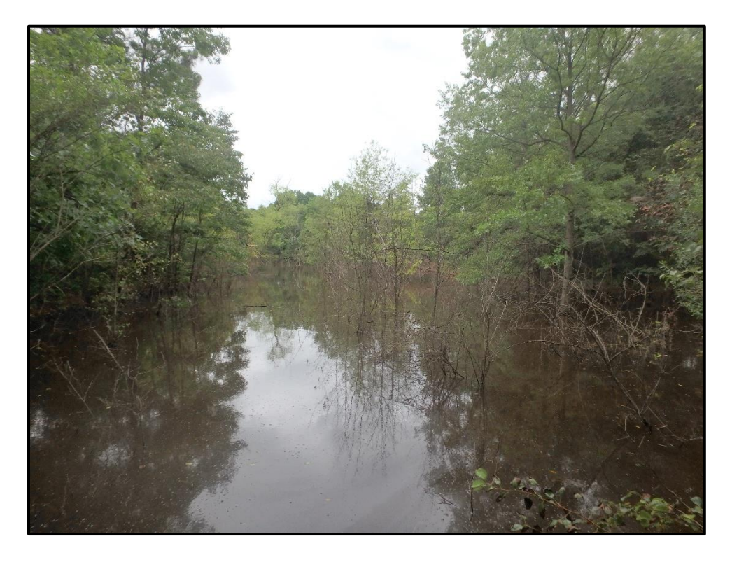
Waters 6DDD – POW