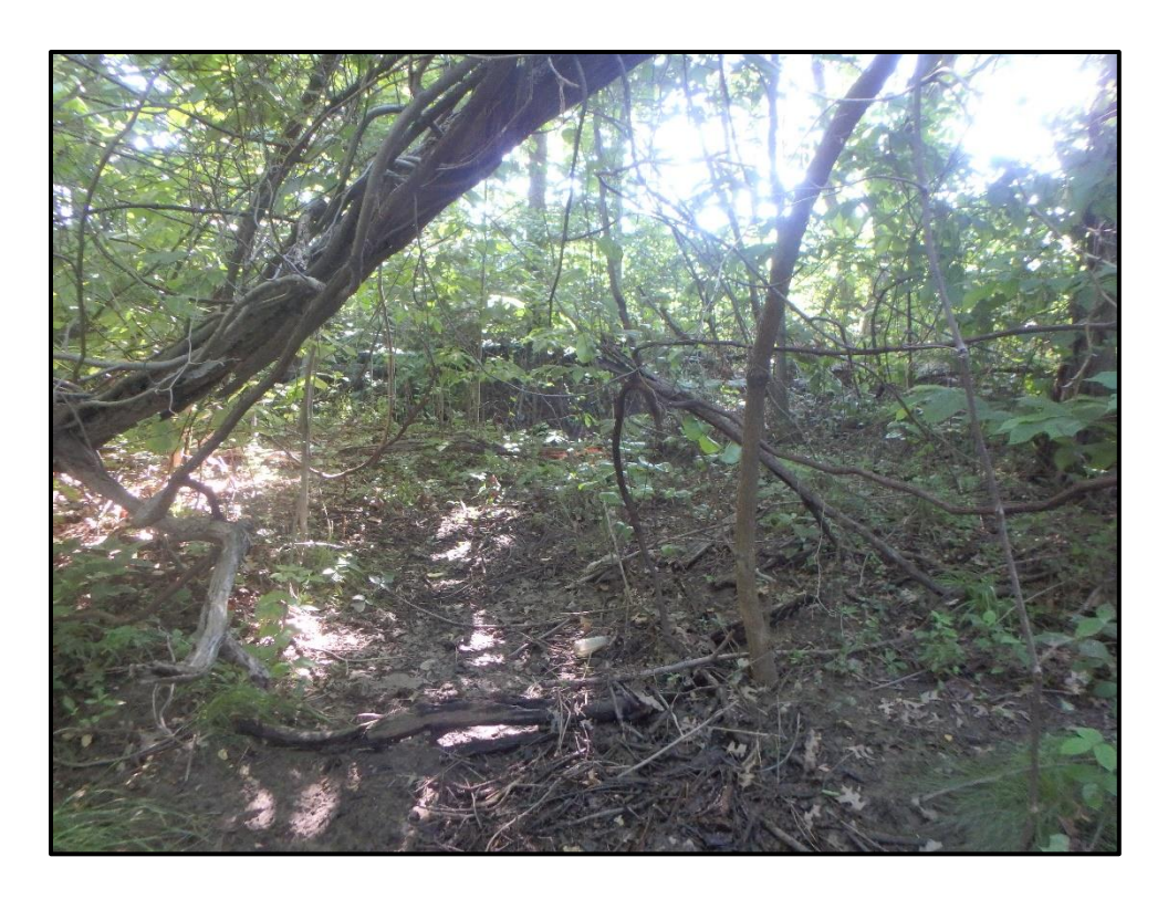
Waters 6J – Ephemeral