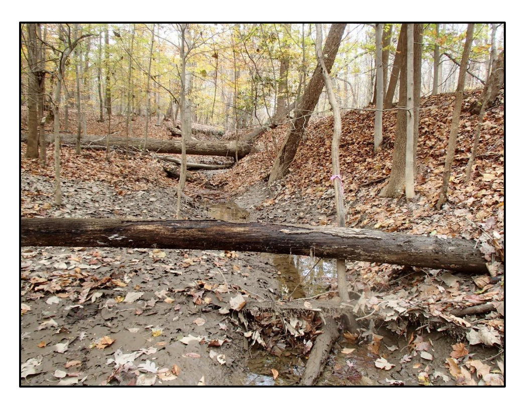
Waters 4UUUU – Intermittent