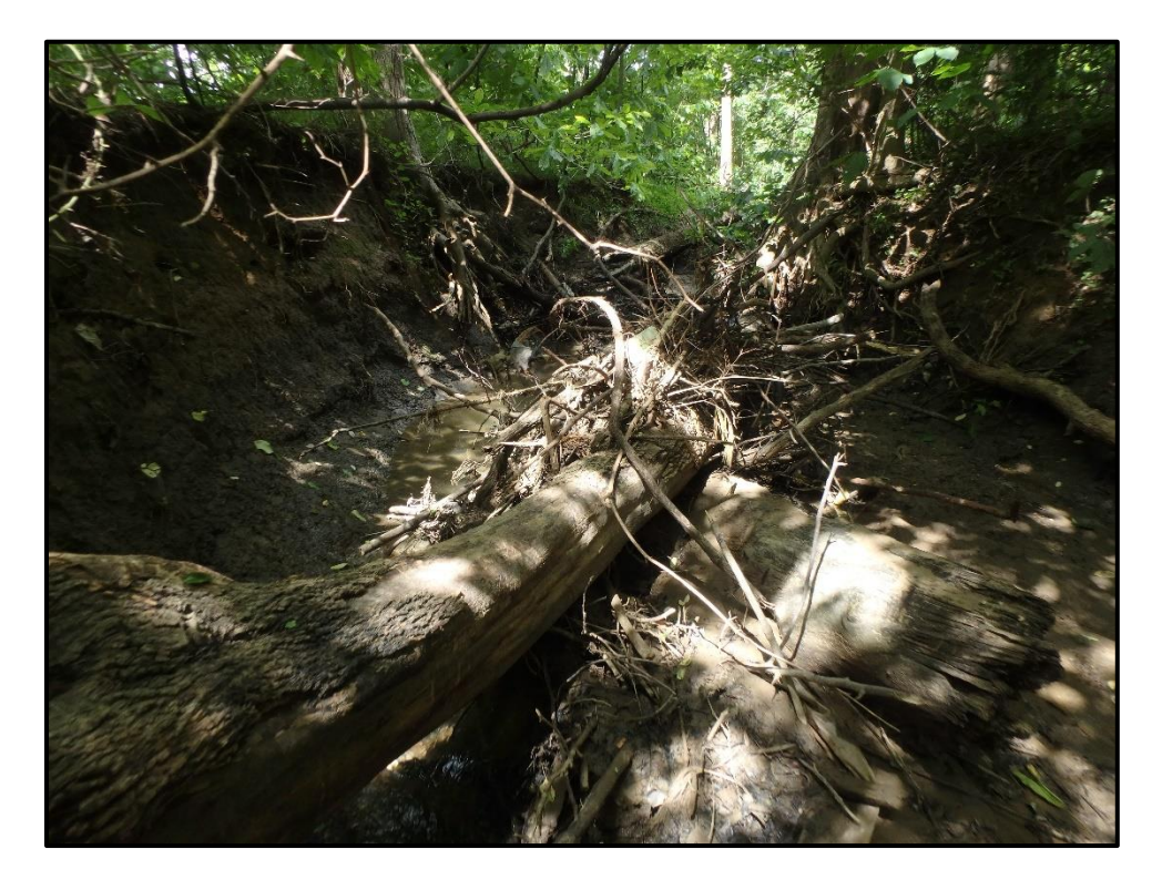
Waters 6M – Perennial