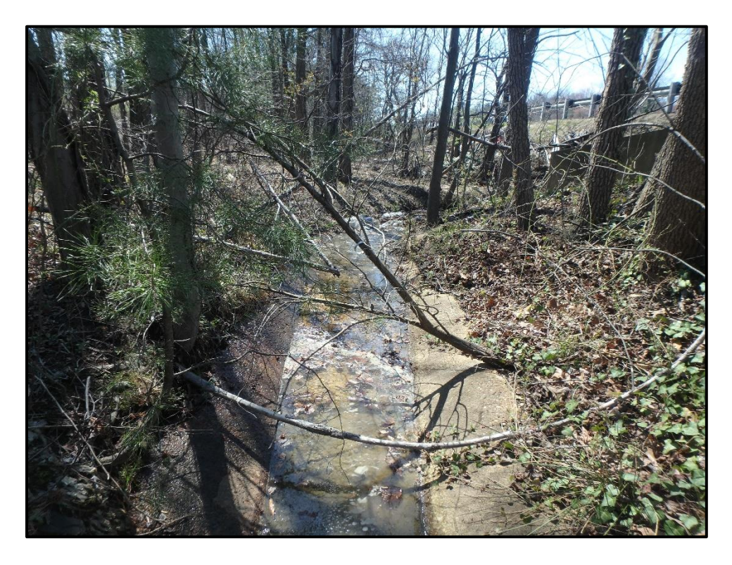
Waters 3I – Intermittent