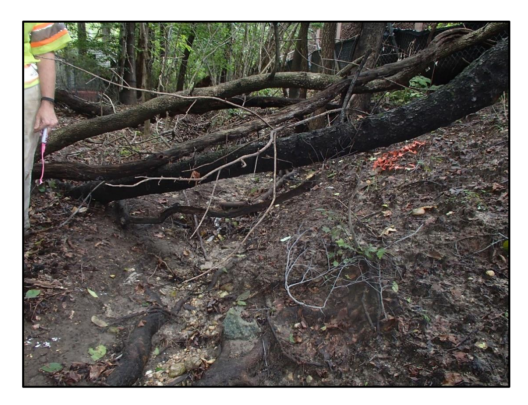
Waters 1SS – Ephemeral