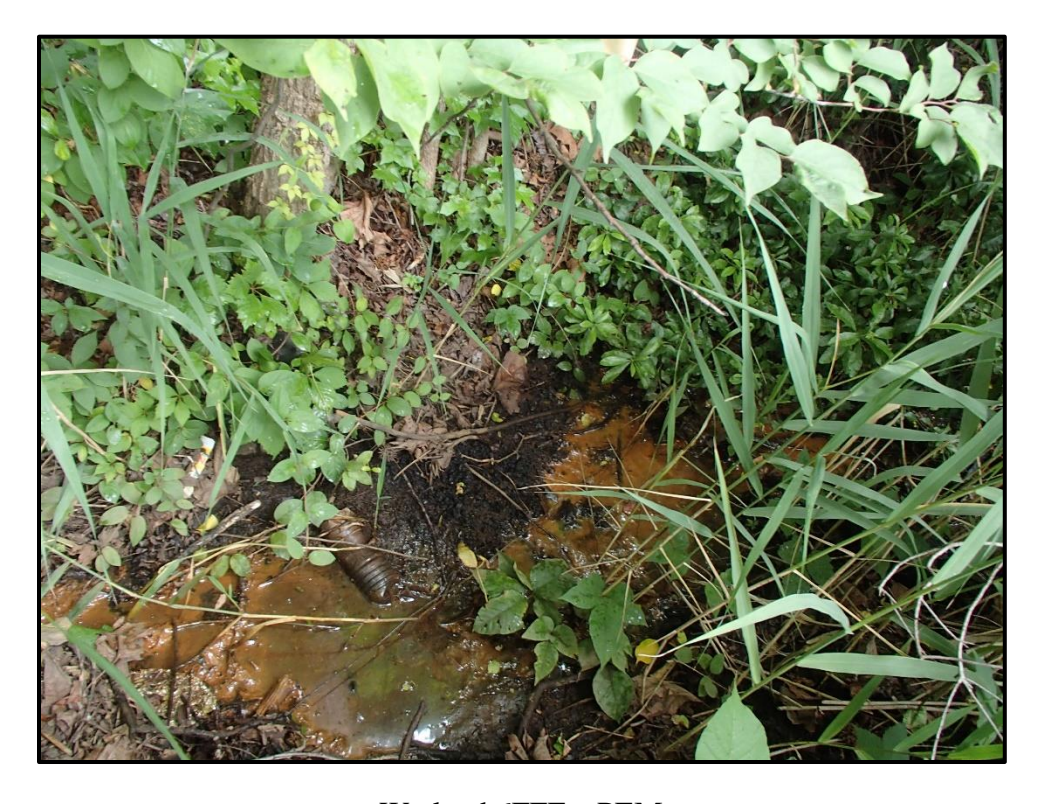
Wetland 6FFF – PEM