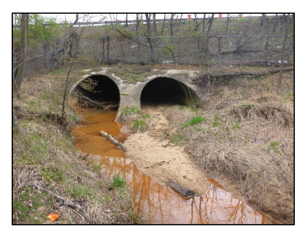
Waters 3L – Perennial