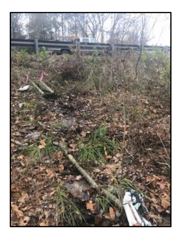
Wetland 5TT – PEM