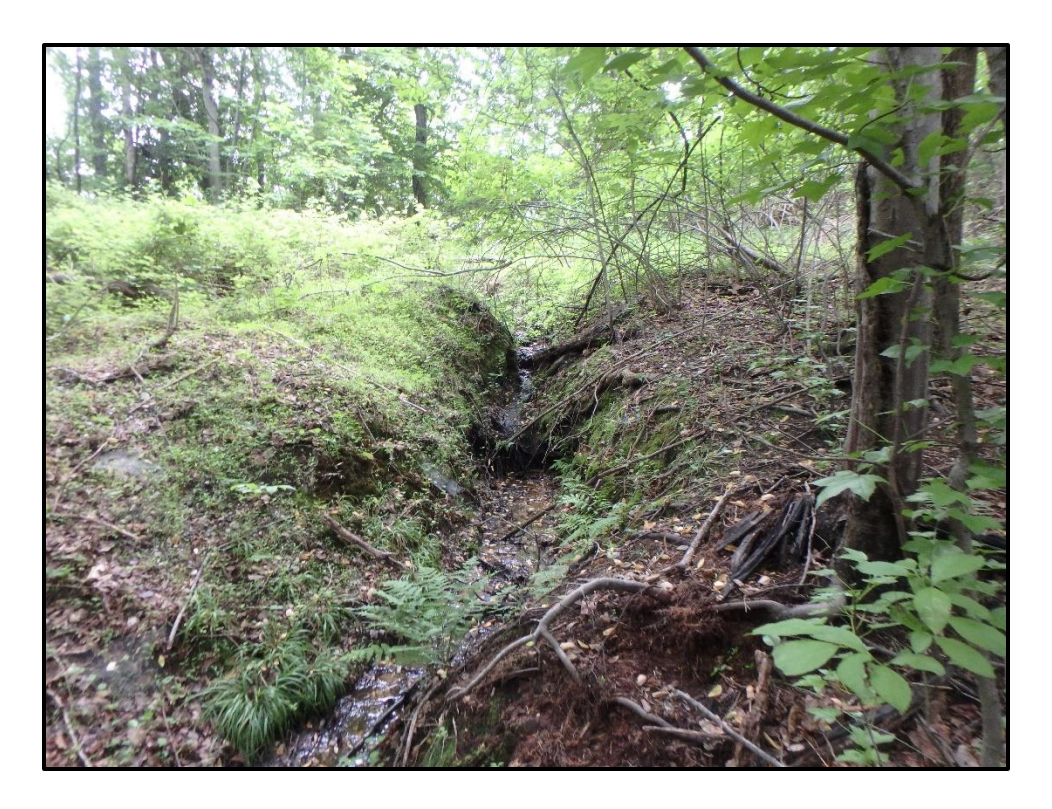
Waters 4LL – Perennial