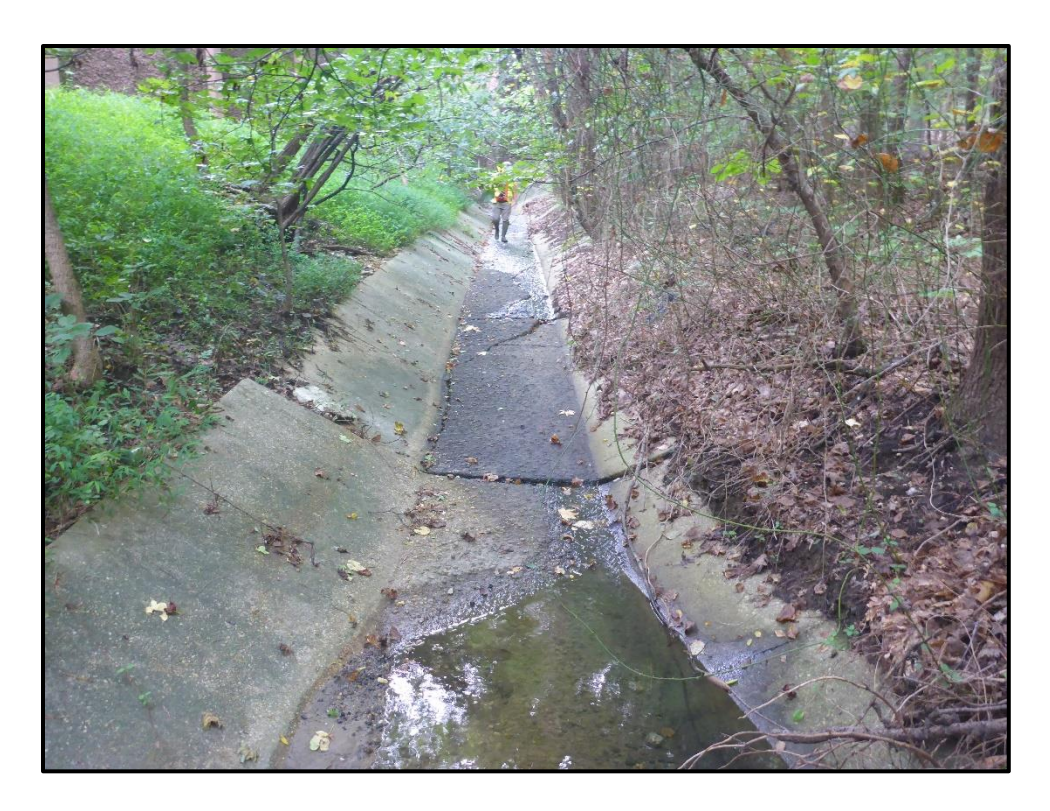
Waters 1YY - Intermittent