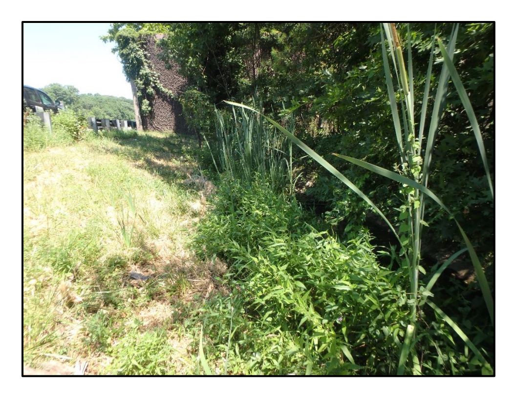
Wetland 7CC – PEM