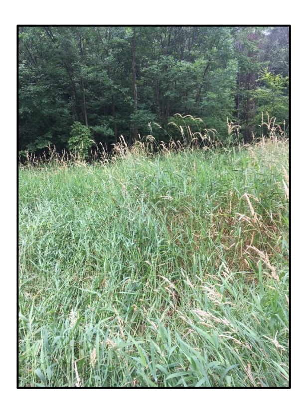
Wetland 6FF – PEM