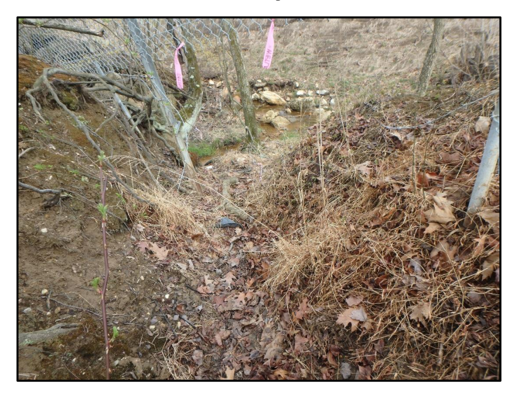
Waters 1G – Ephemeral