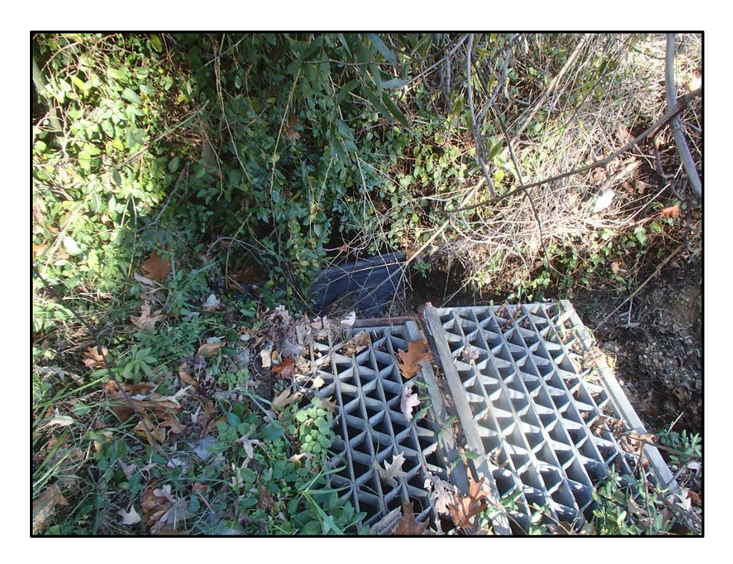
Waters 1EEE – Ephemeral