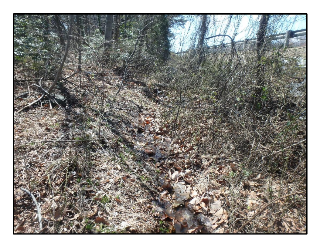
Waters 3H – Intermittent