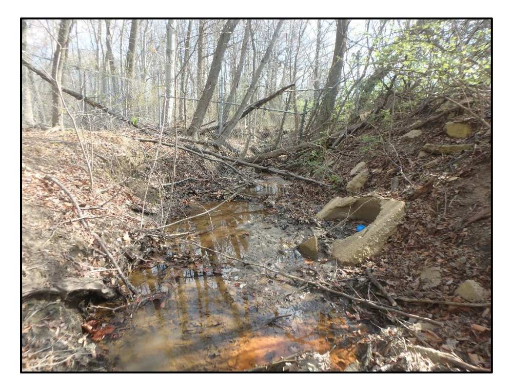
Waters 3DD – Perennial