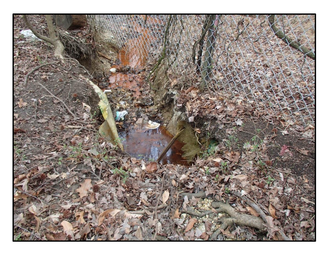
Waters 2E – Intermittent