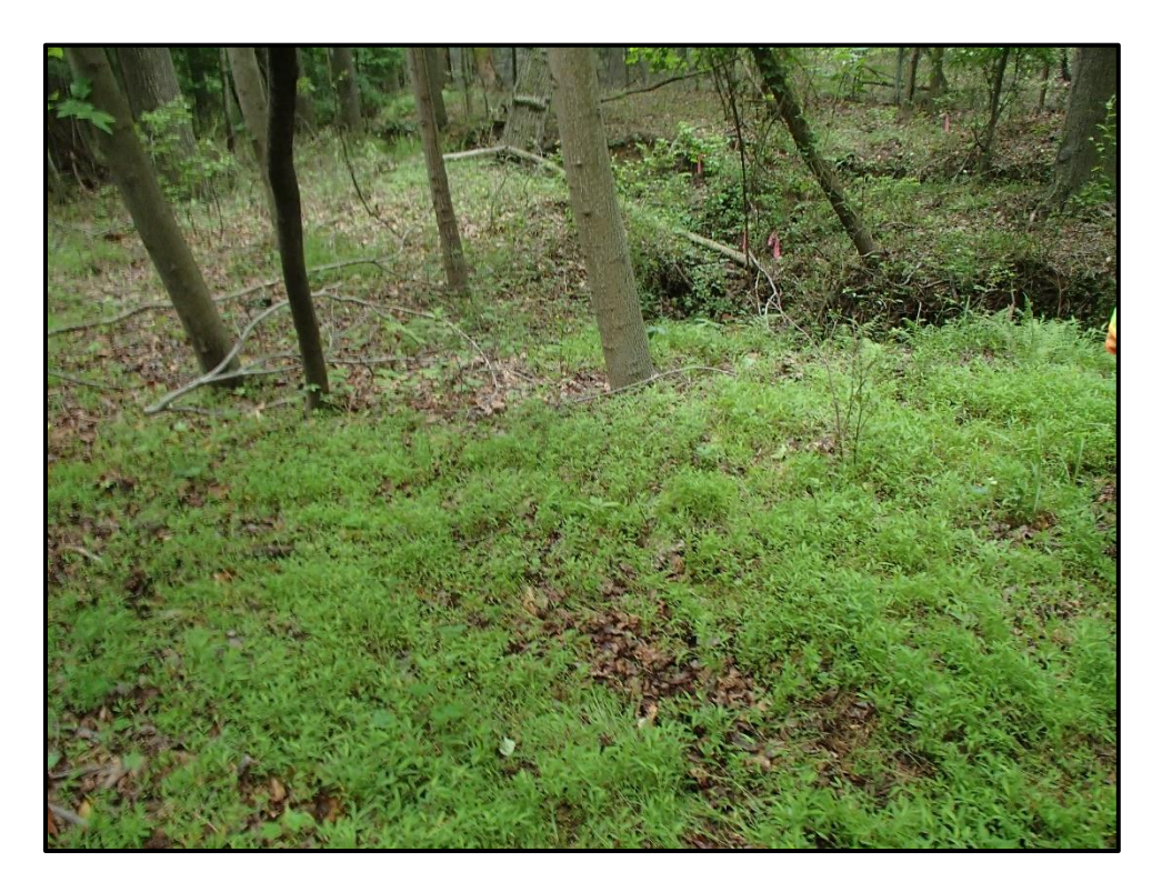
Wetland 4RR – PFO