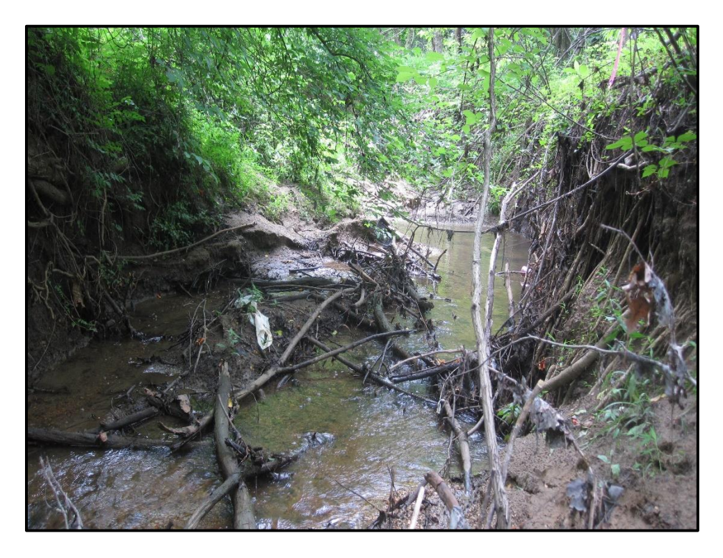
Waters 6HH – Perennial