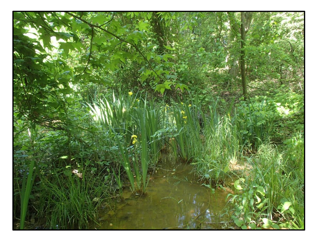
Wetland 3W – PFO