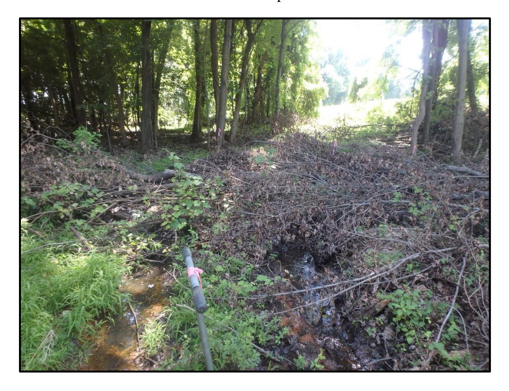
Wetland 6YYY – PEM