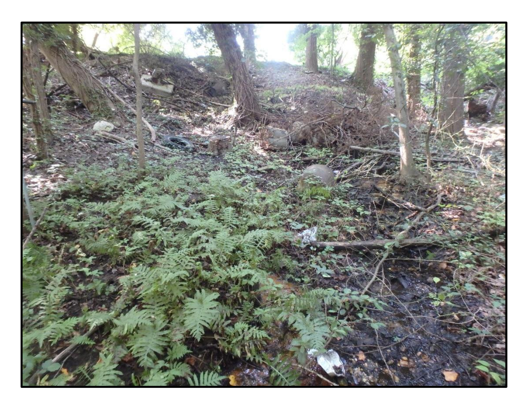
Wetland 1JJ – PFO