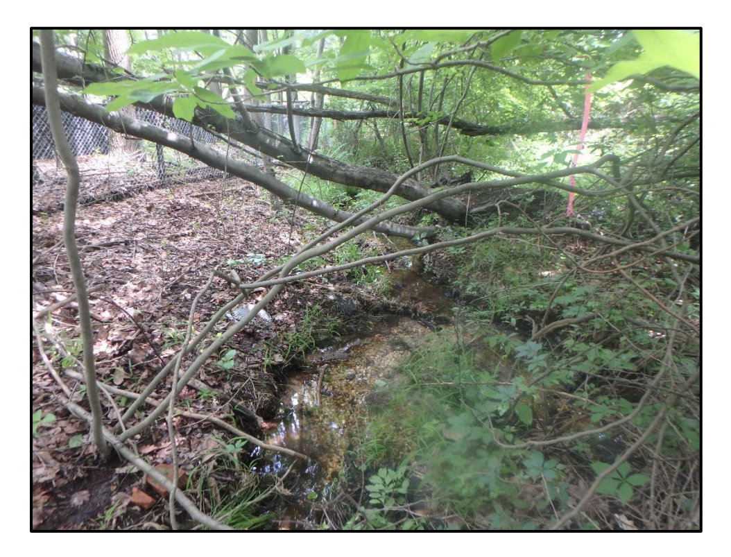
Waters 4UUU – Intermittent