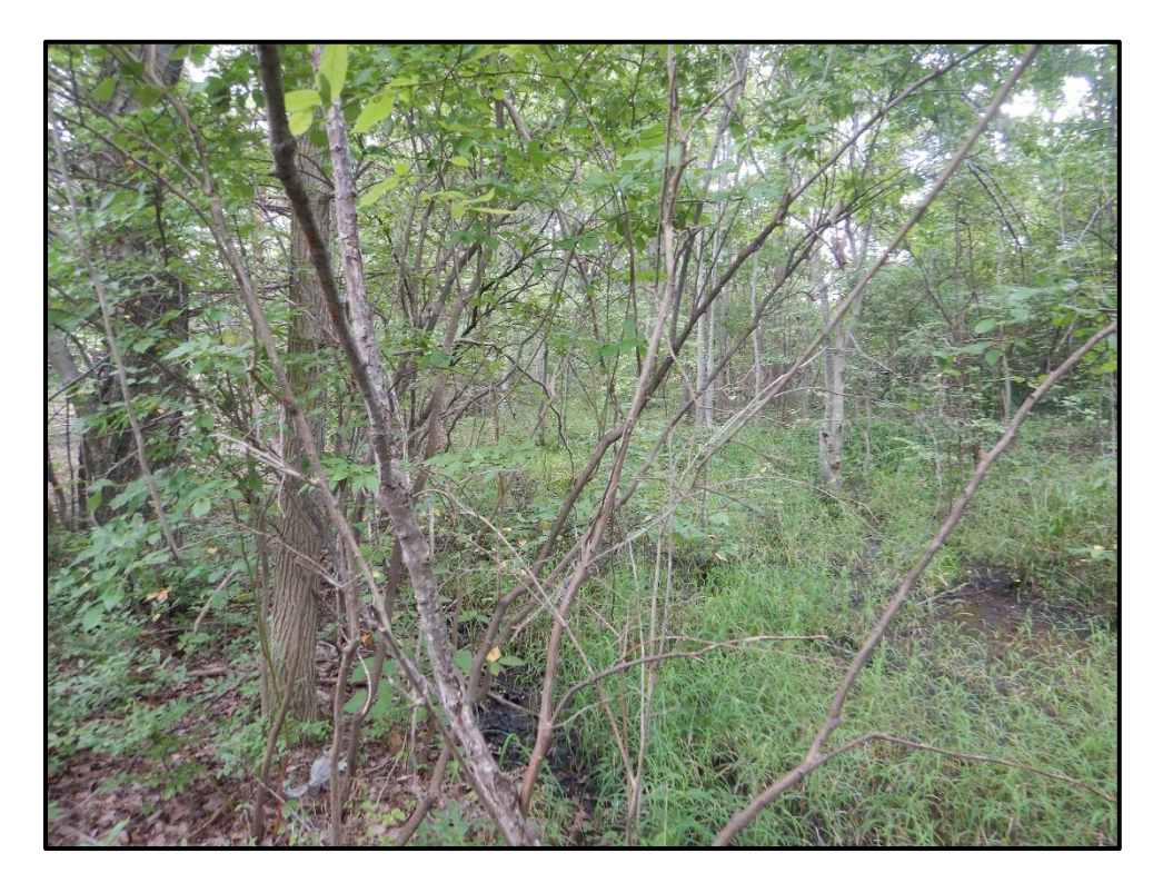
Wetland 2M – PFO