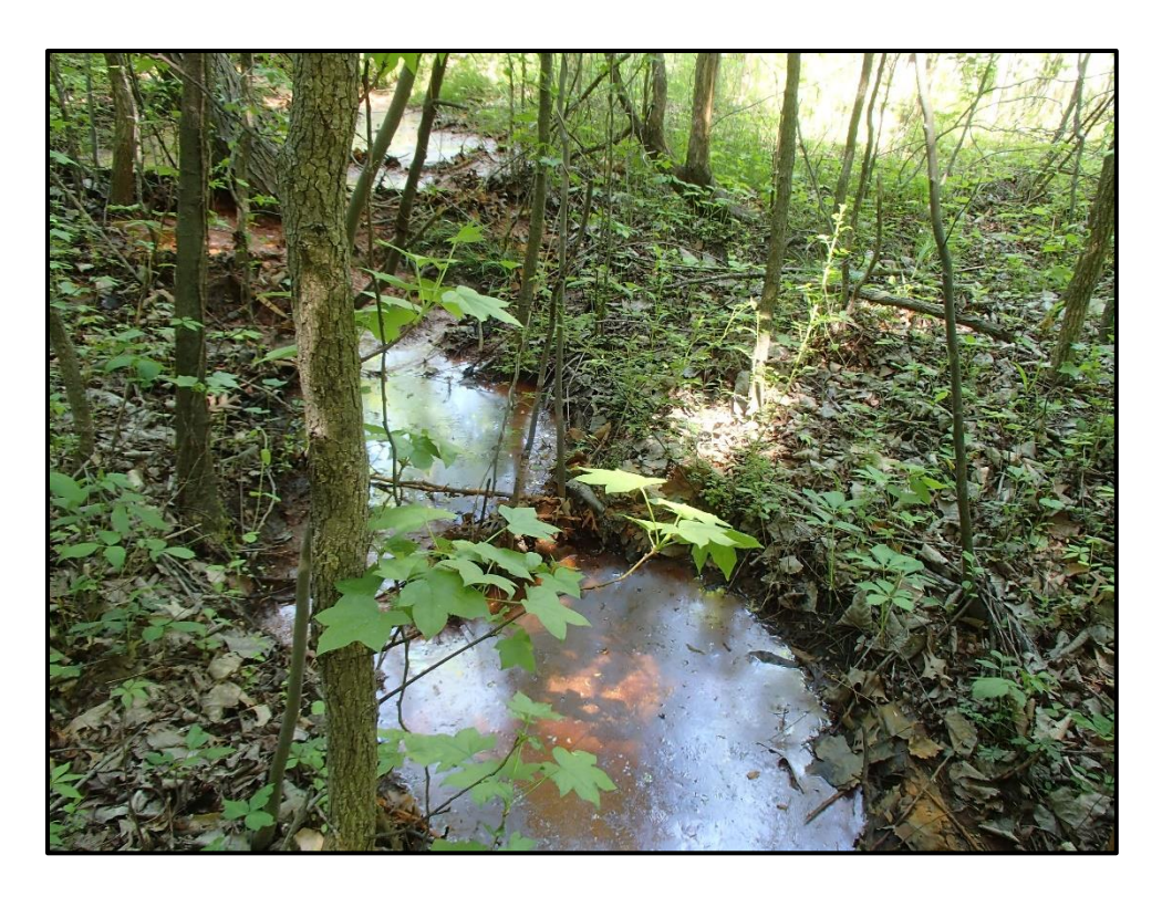
Waters 4AA – Intermittent