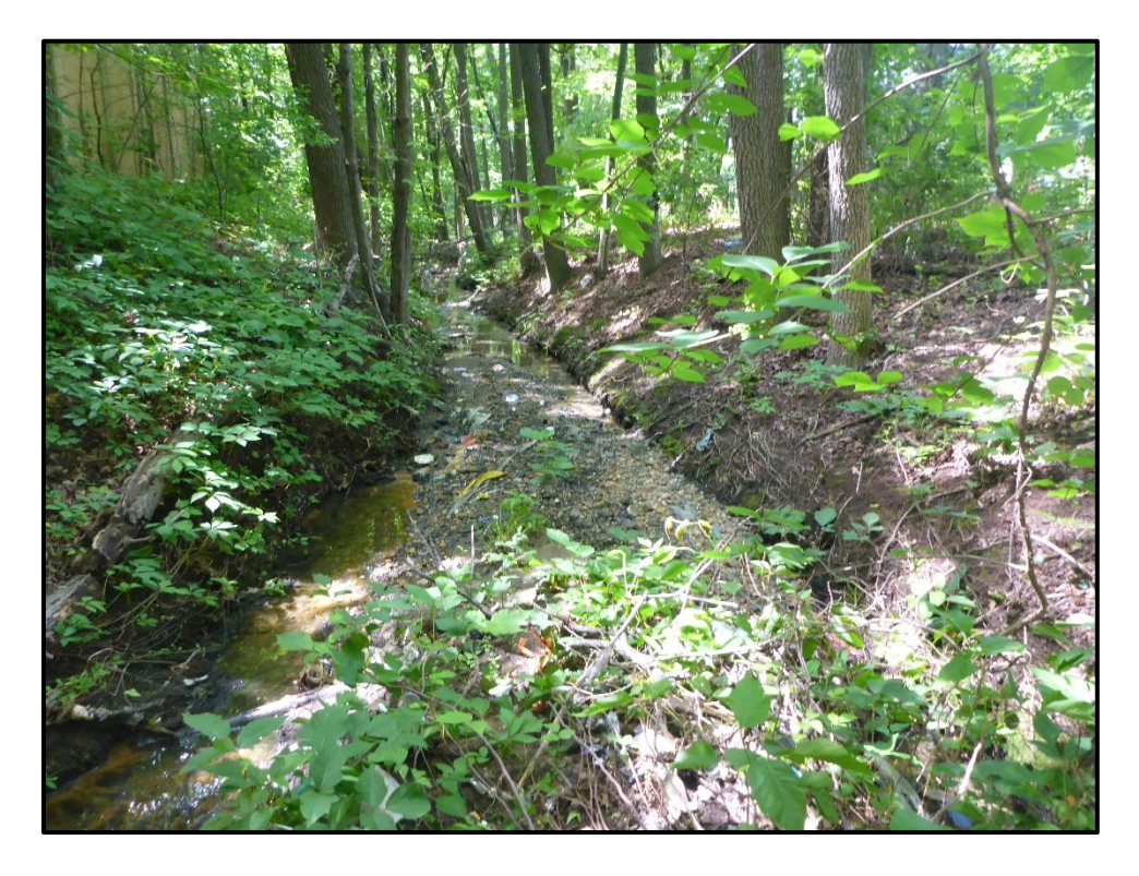
Waters 7F – Intermittent