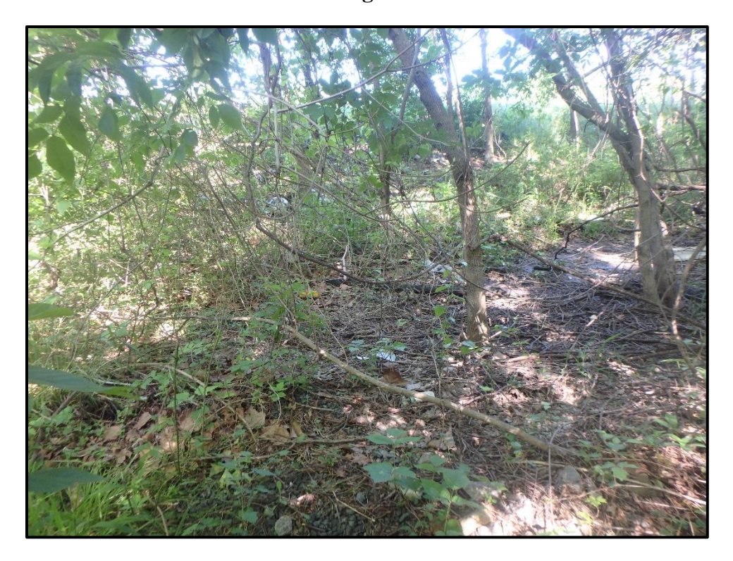
Wetland 6A - PFO