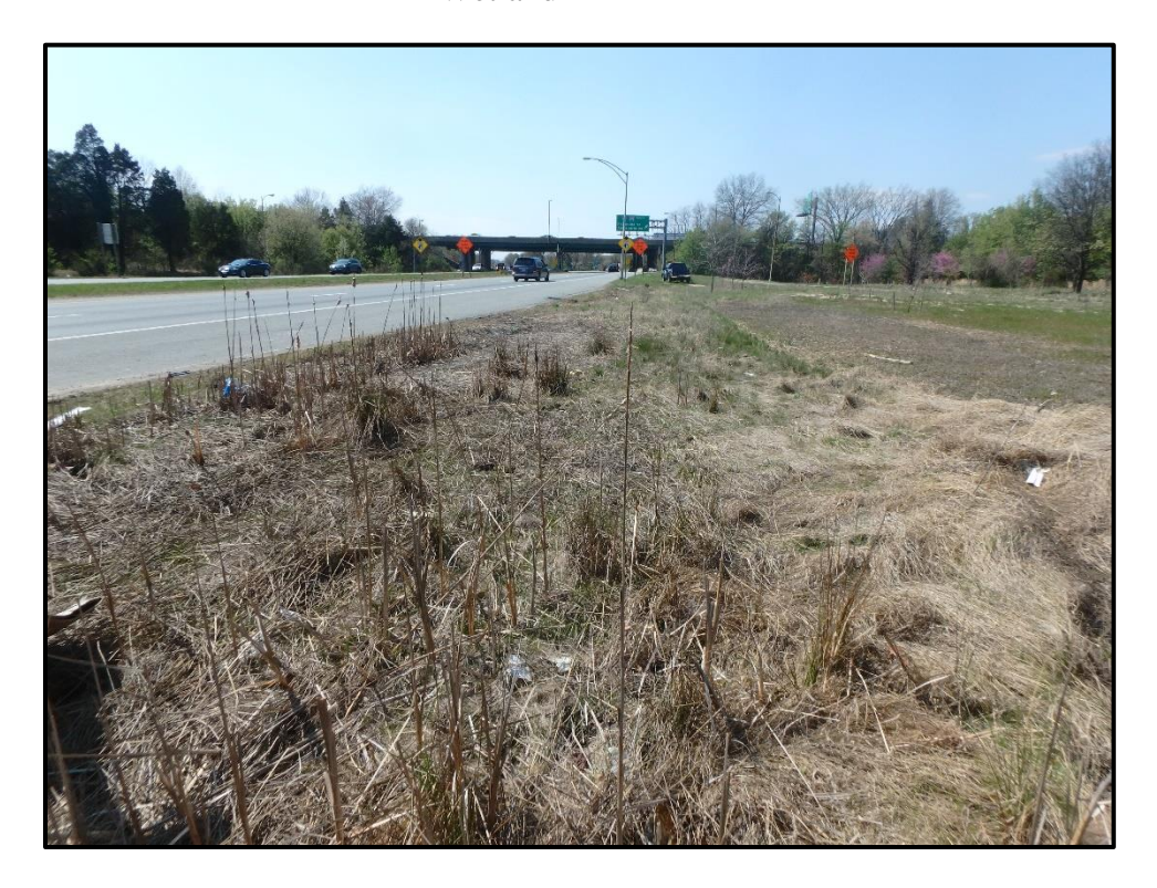
Wetland 4A – PEM