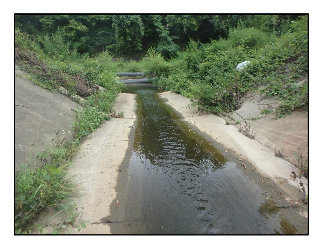
Waters 5T – Perennial