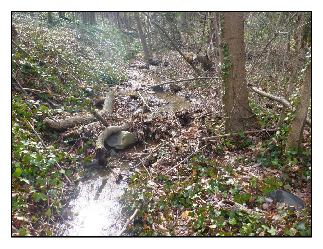
Waters 1P – Intermittent