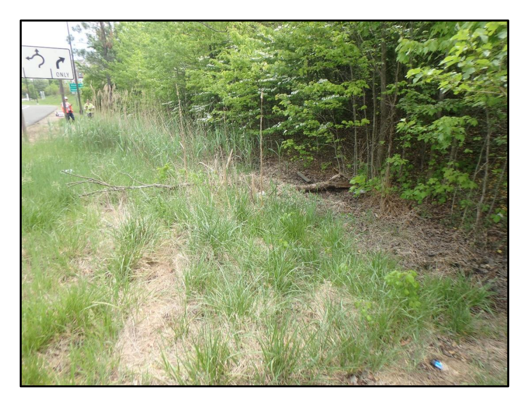
Wetland 4CC – PEM