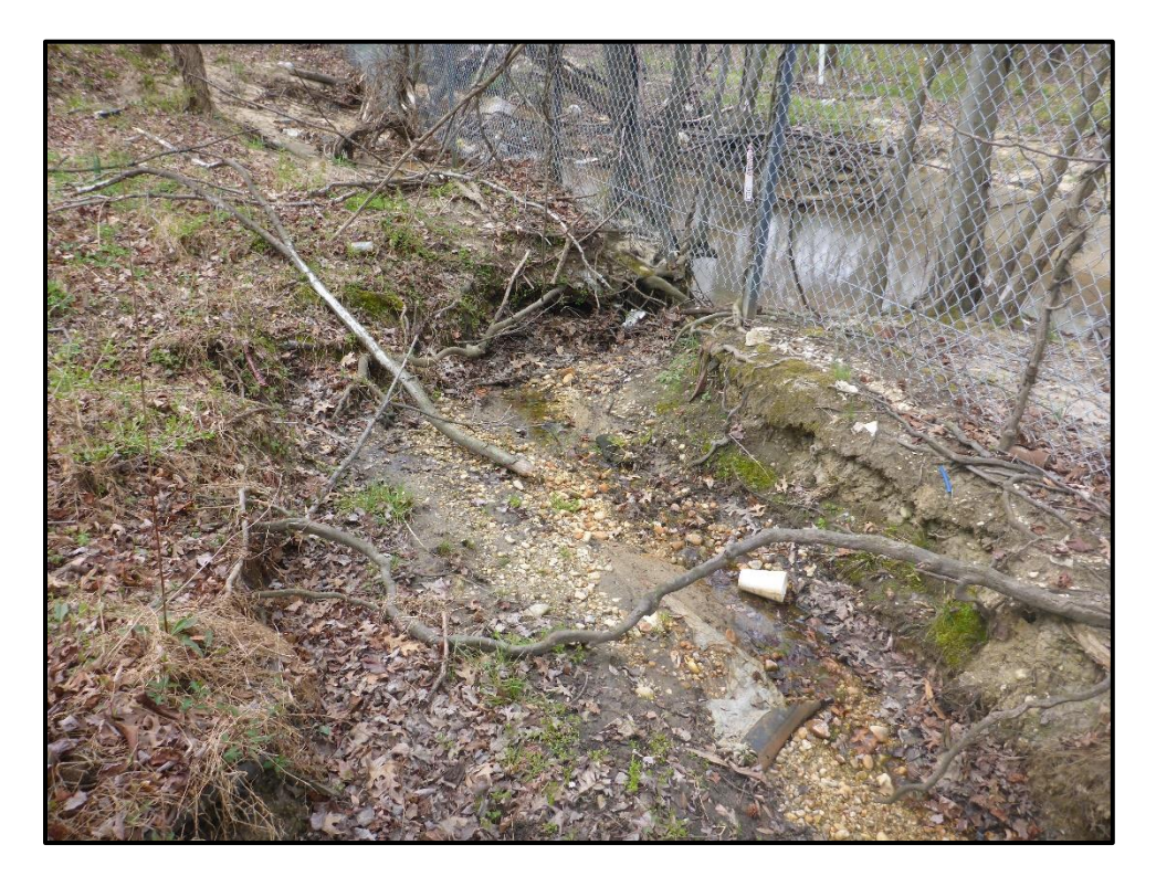
Waters 3U – Intermittent