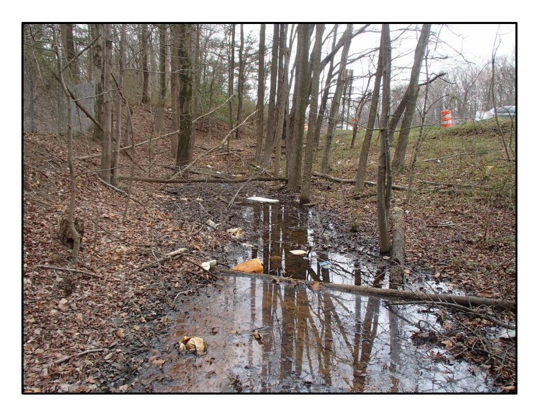
Waters 2F – Intermittent