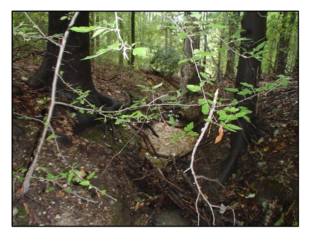
Waters 1RR – Intermittent