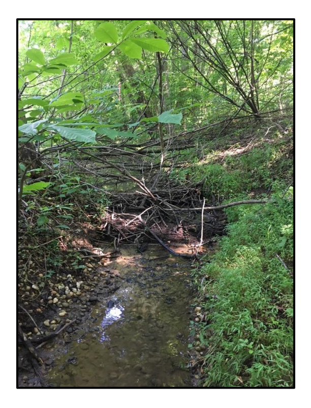
Waters 6EE – Intermittent