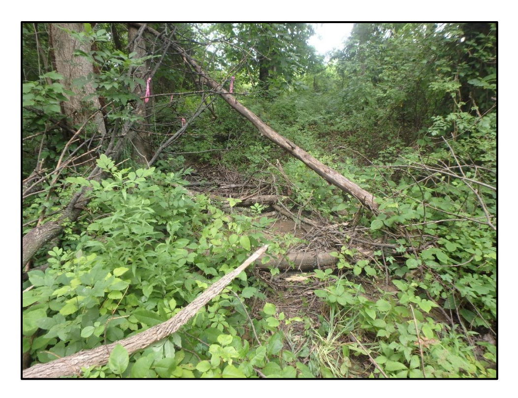
Wetland 6ZZ – PFO