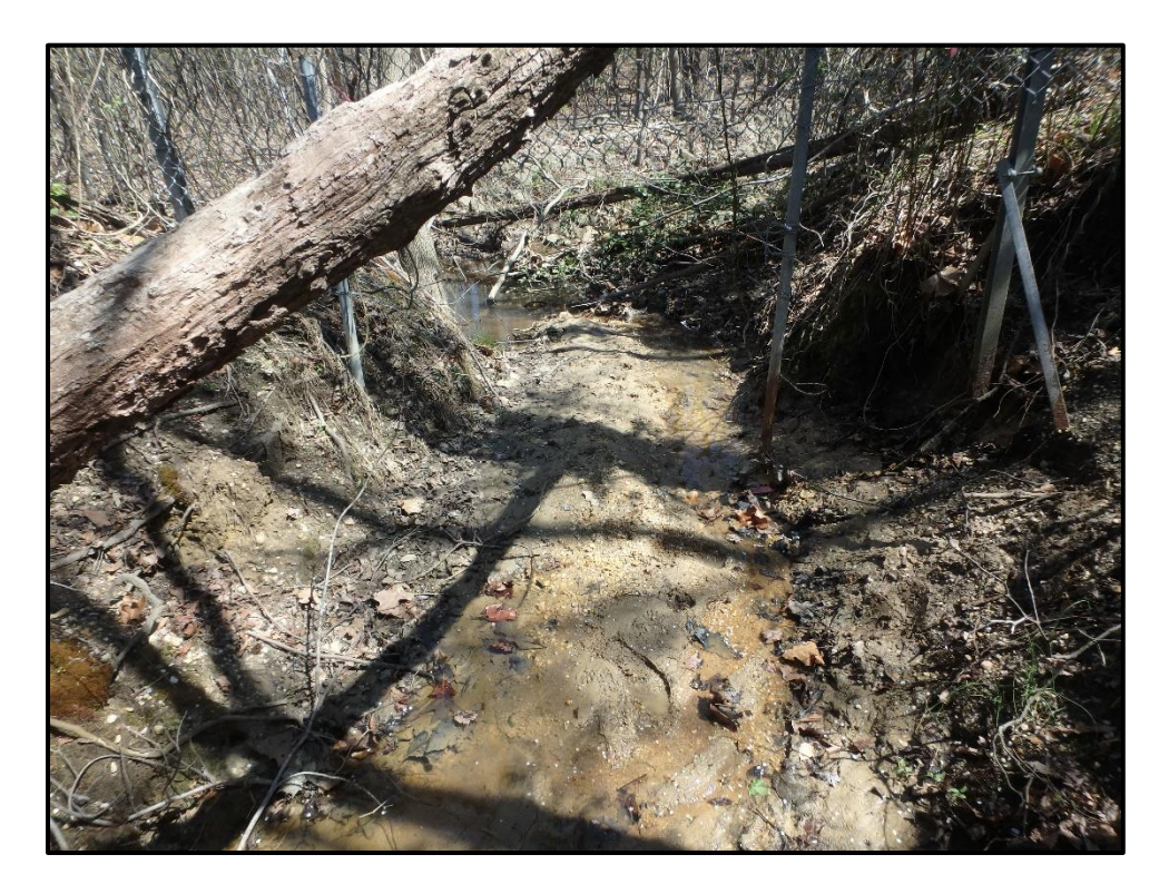
Waters 4L – Intermittent