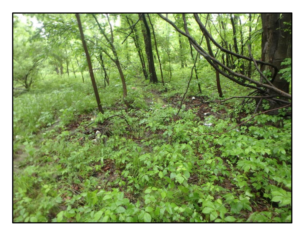
Wetland 3NNN – PFO