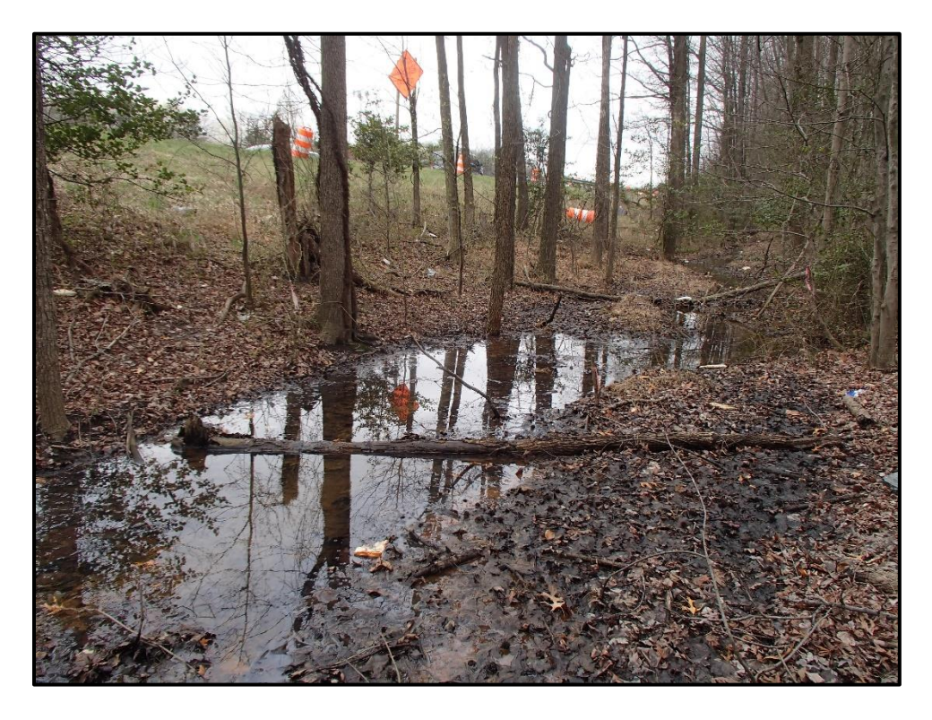
Waters 2F – Intermittent