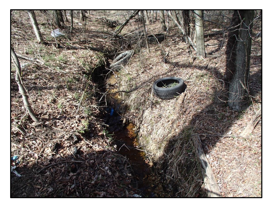
Waters 2T – Intermittent