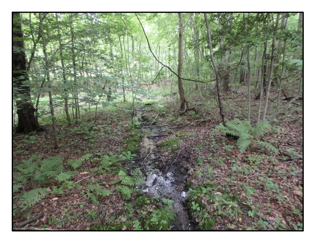
Waters 4LL – Perennial