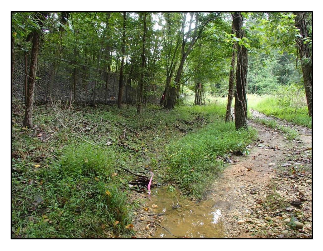
Waters 1XX – Intermittent