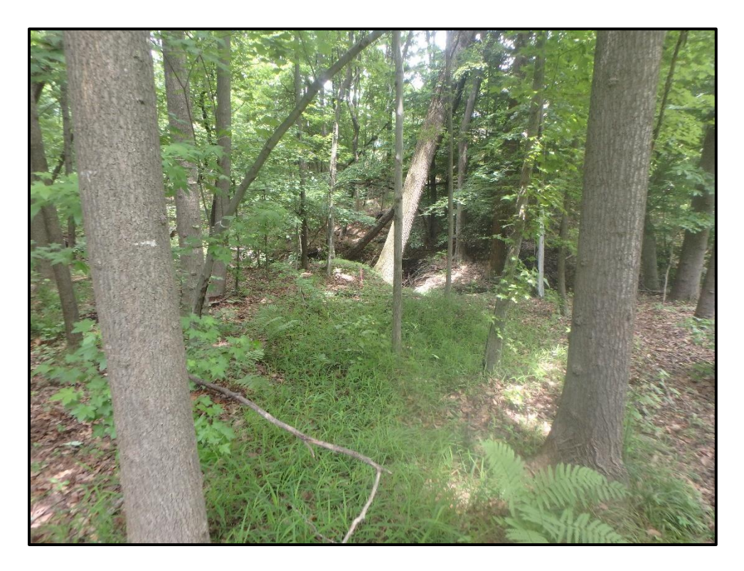
Wetland 4HHHH – PFO