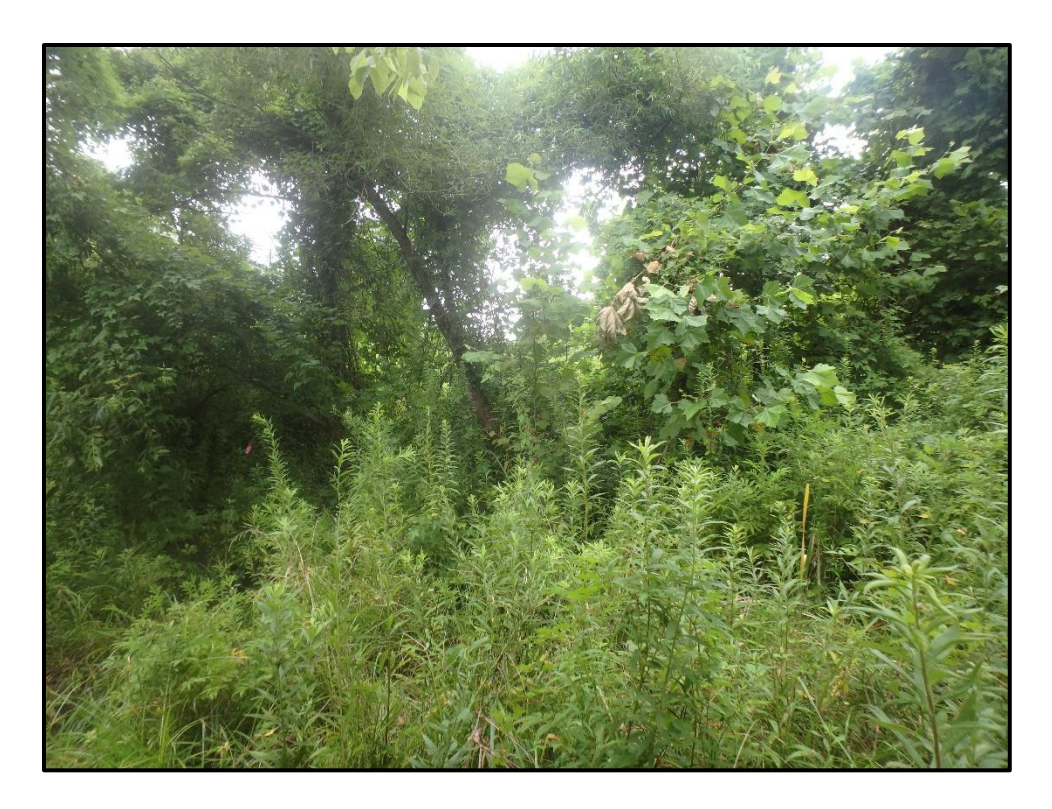
Wetland 5L – PFO