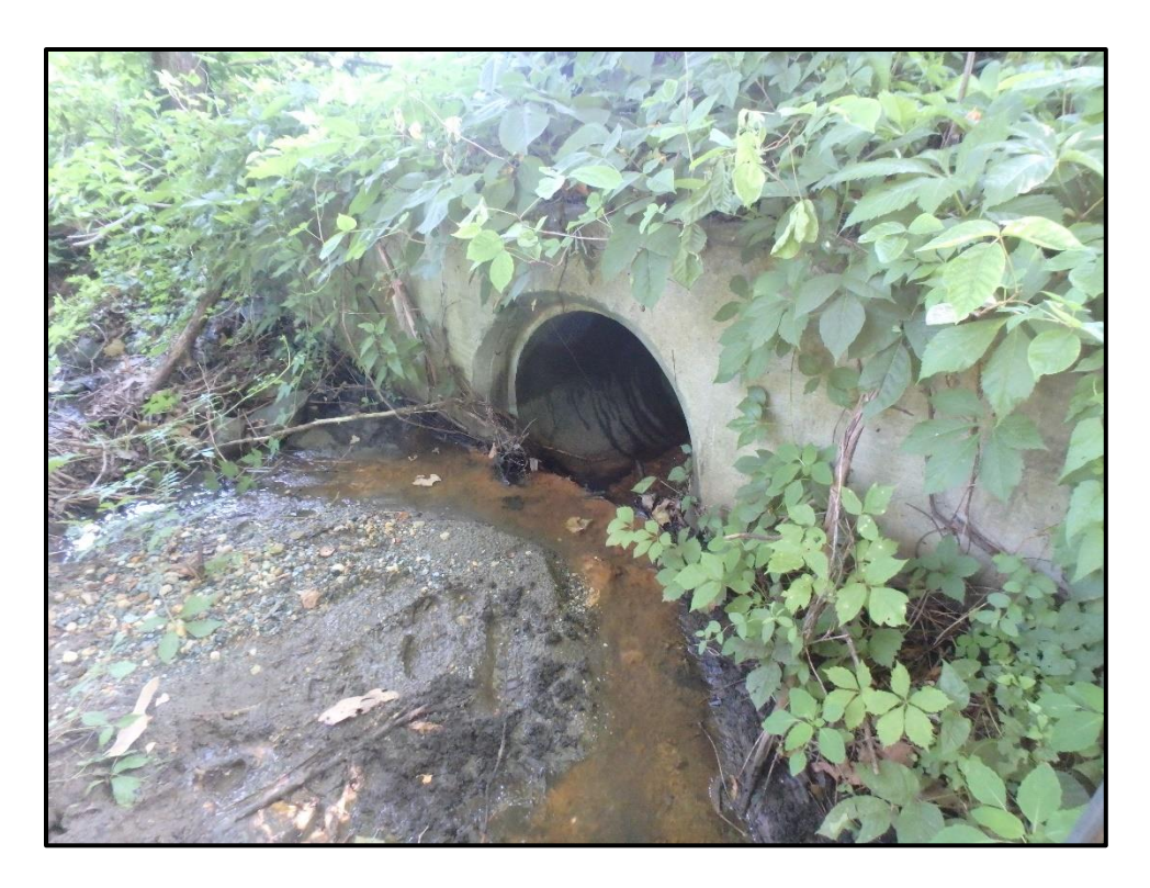
Waters 6BBBB – Intermittent