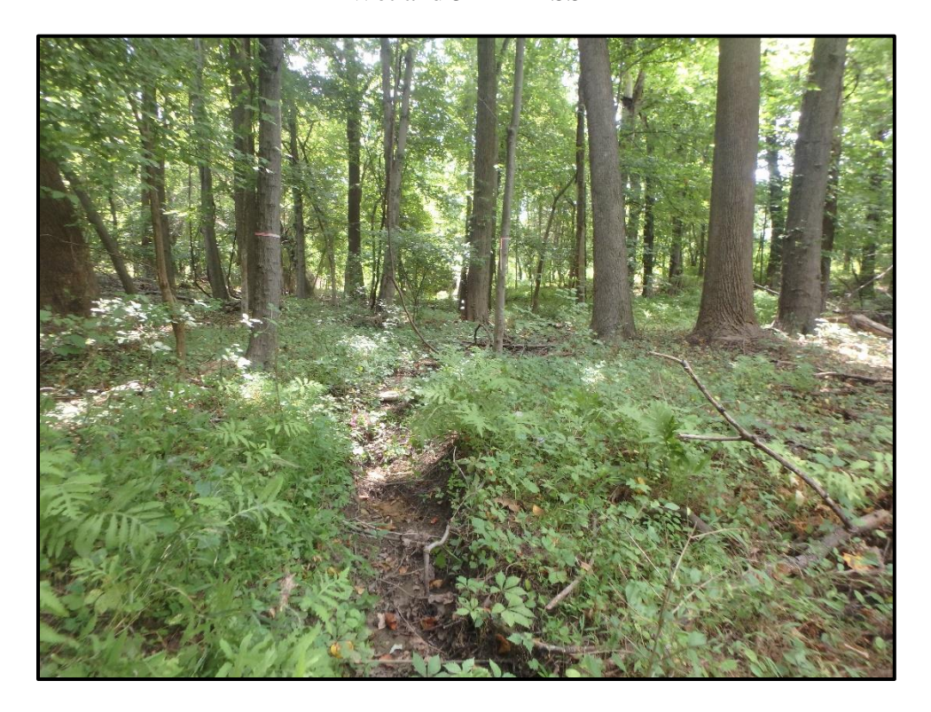
Waters 5B – Intermittent