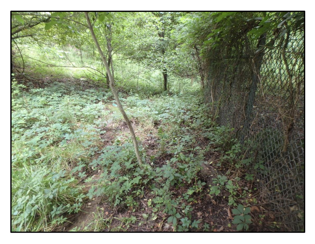
Wetland 6II – PFO