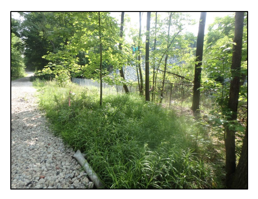
Wetland 4QQQ - PEM