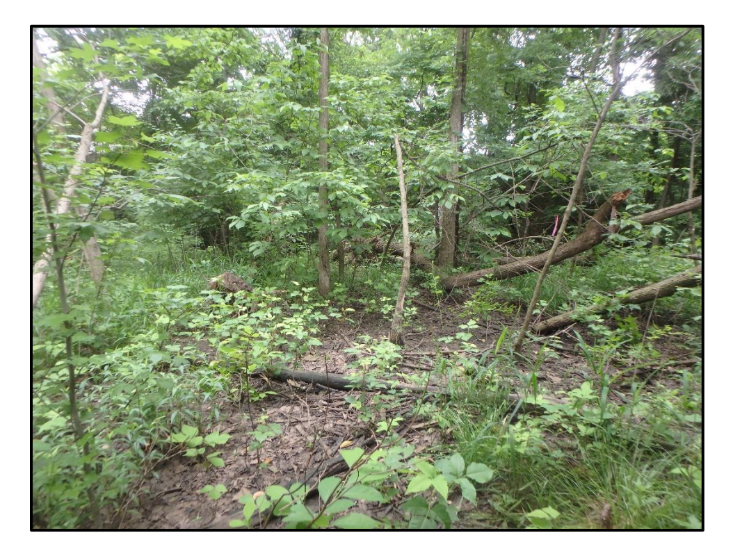
Wetland 6F – PFO