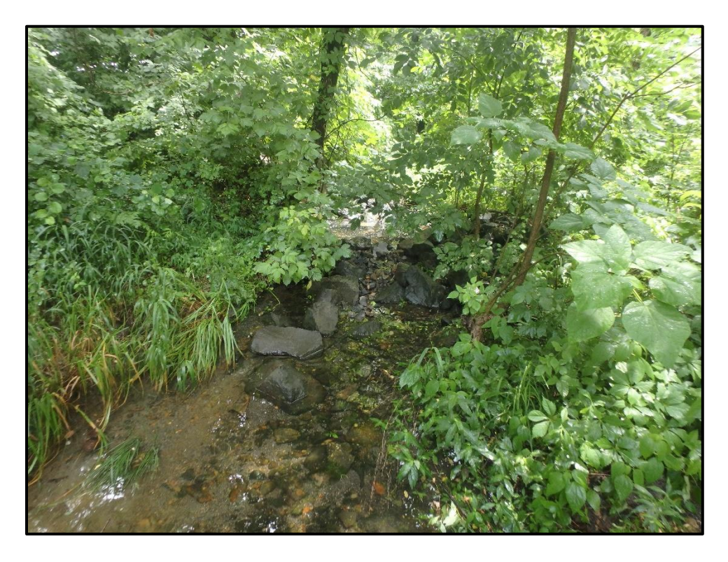
Waters 6Z – Intermittent