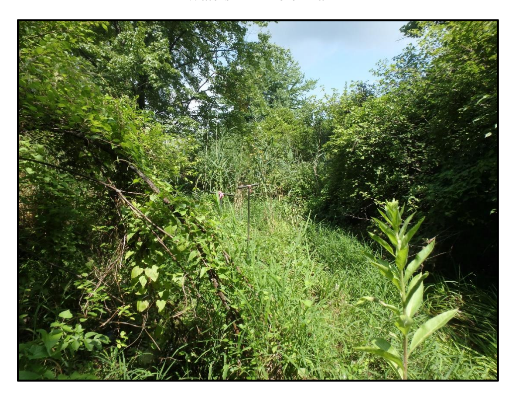
Wetland 2RR – PSS