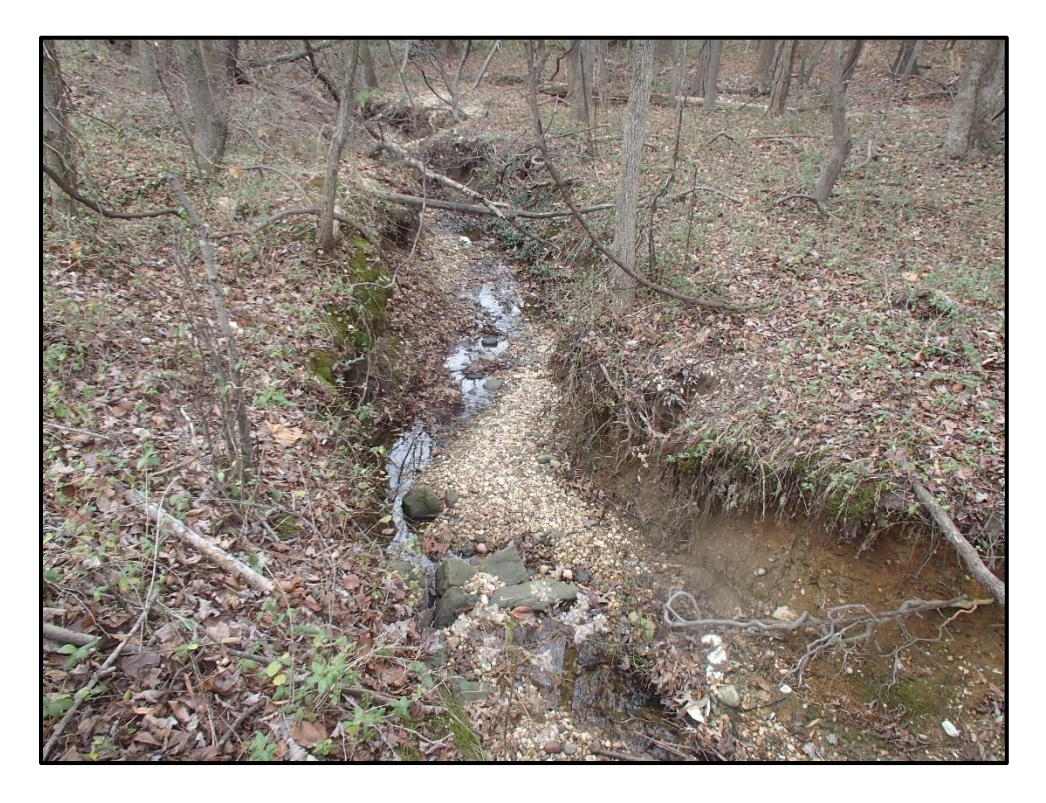
Waters 2UU – Intermittent