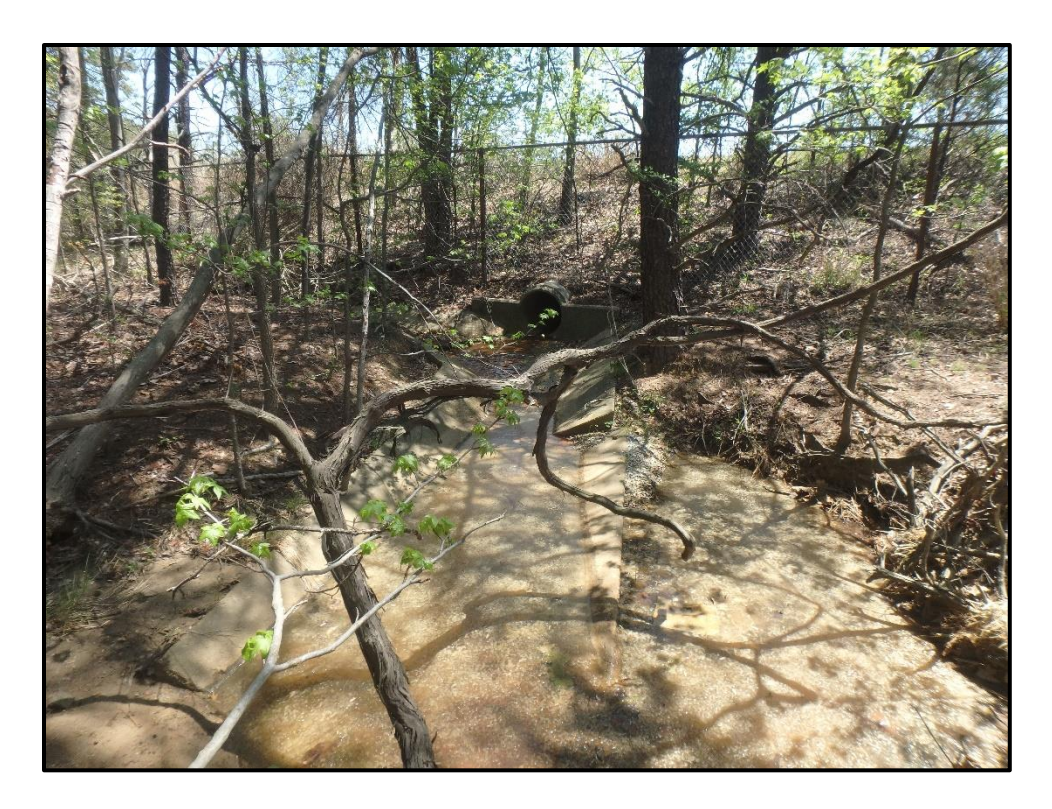
Waters 2V - Perennial