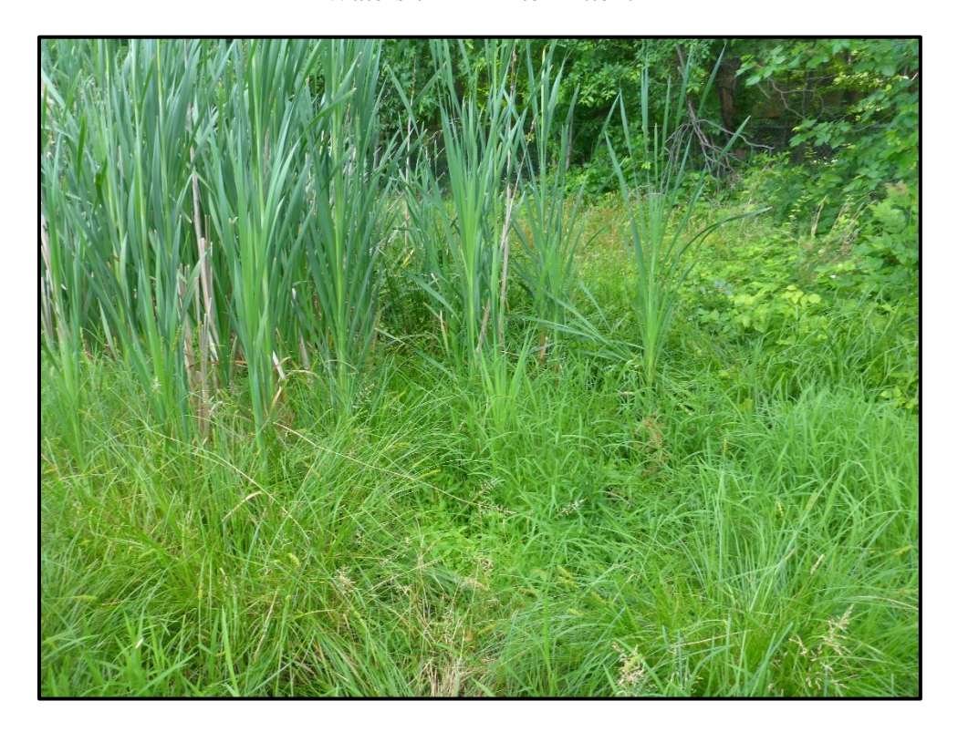
Wetland 7C – PEM