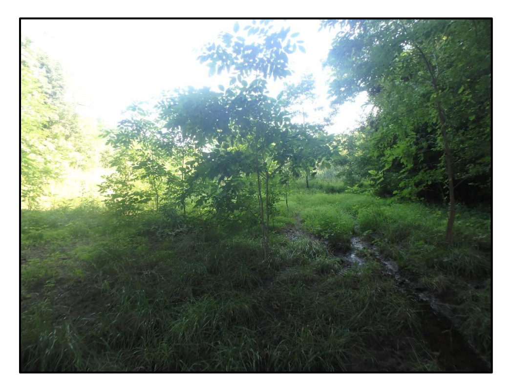
Wetland 6U - PFO