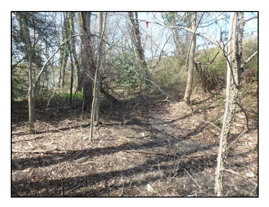
Wetland 3B – PFO