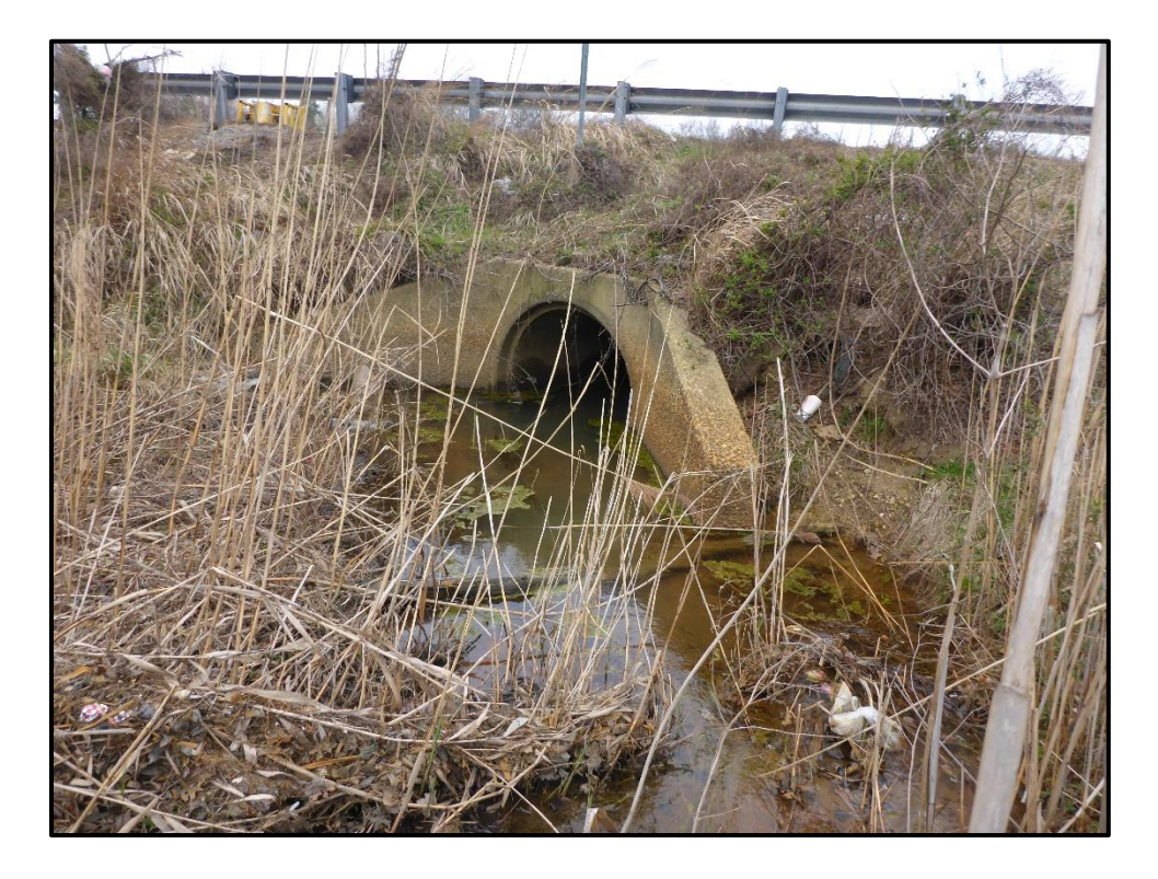
Waters 2J – Perennial