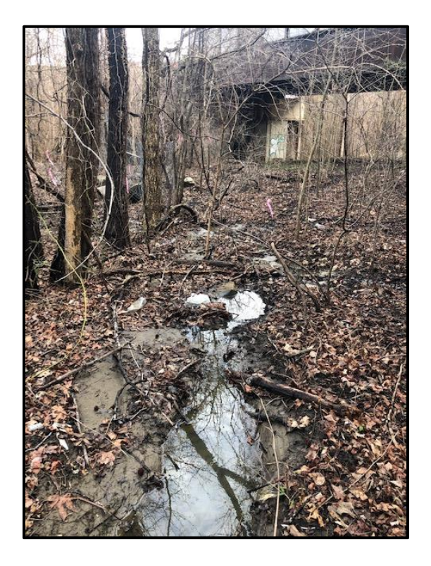
Waters 6FFFF – Intermittent