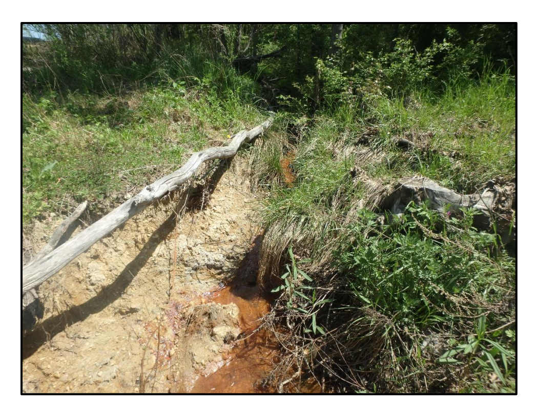
Waters 3SS – Intermittent