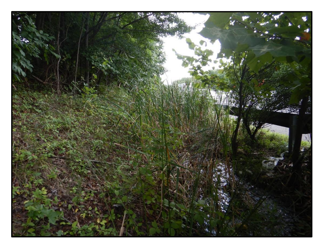
Wetland 2FF – PEM