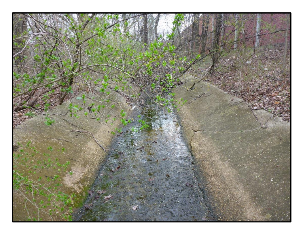
Waters 2I – Intermittent