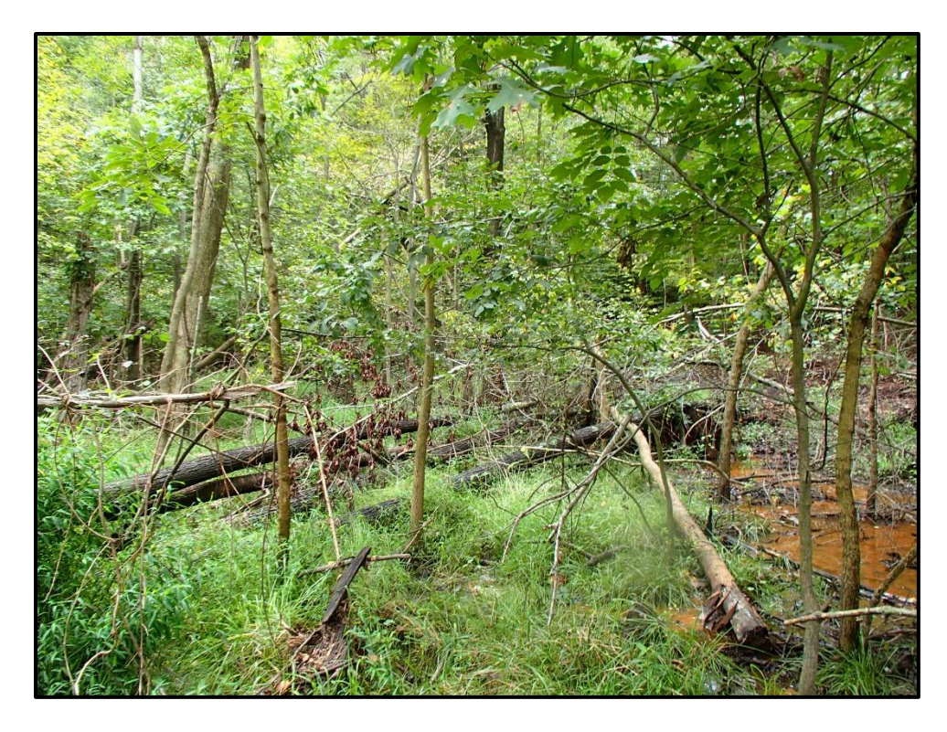
Wetland 1UU – PFO