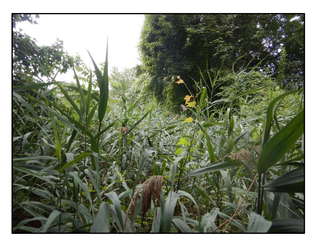
Wetland 2KK – PEM