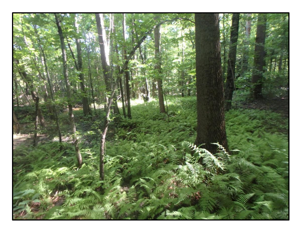
Wetland 4LLL – PFO