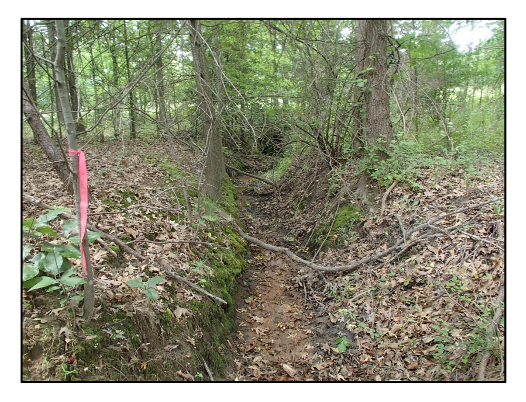
Waters 6GGG – Intermittent