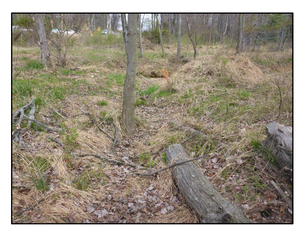
Wetland 3V - PFO