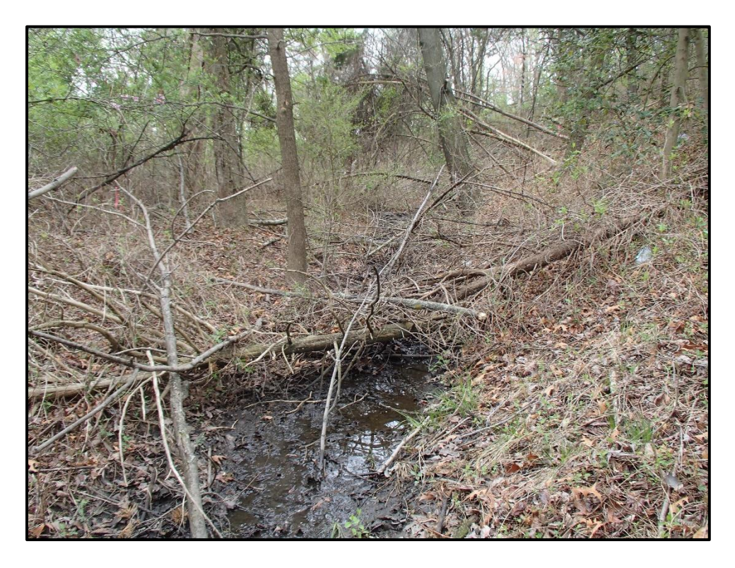
Waters 3JJ – Intermittent