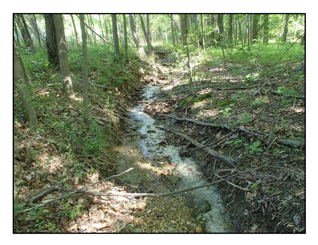
Waters 4Z – Perennial