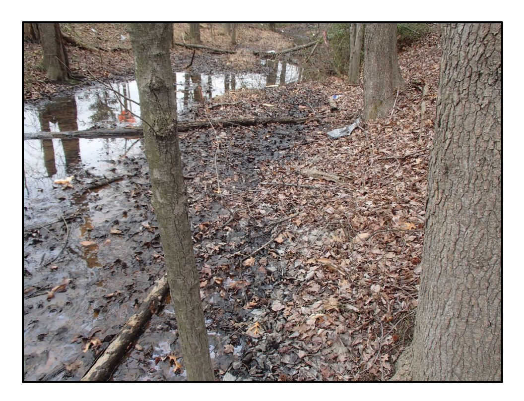
Wetland 2G - PFO