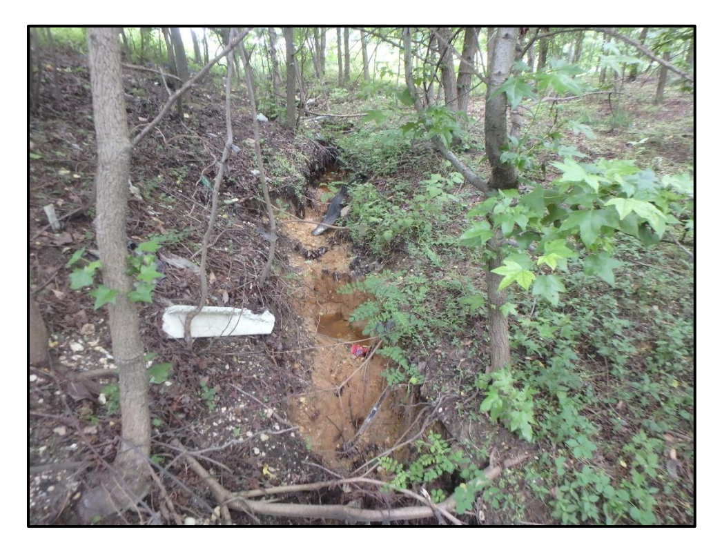
Waters 4GGG – Intermittent