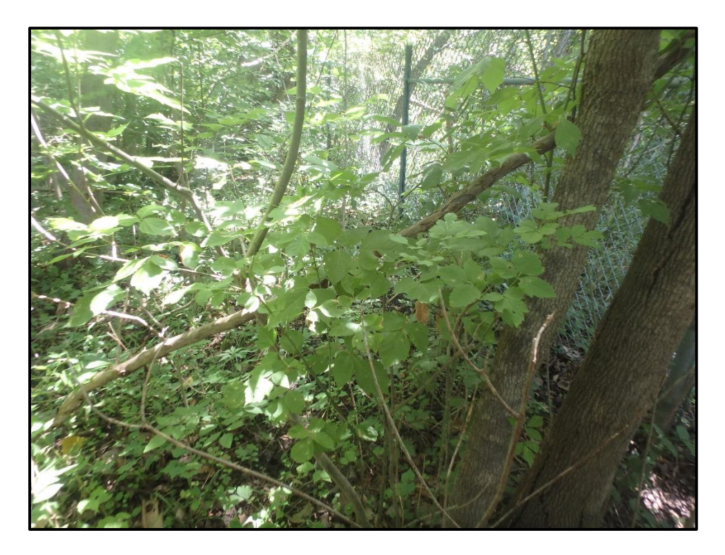
Wetland 5K – PFO