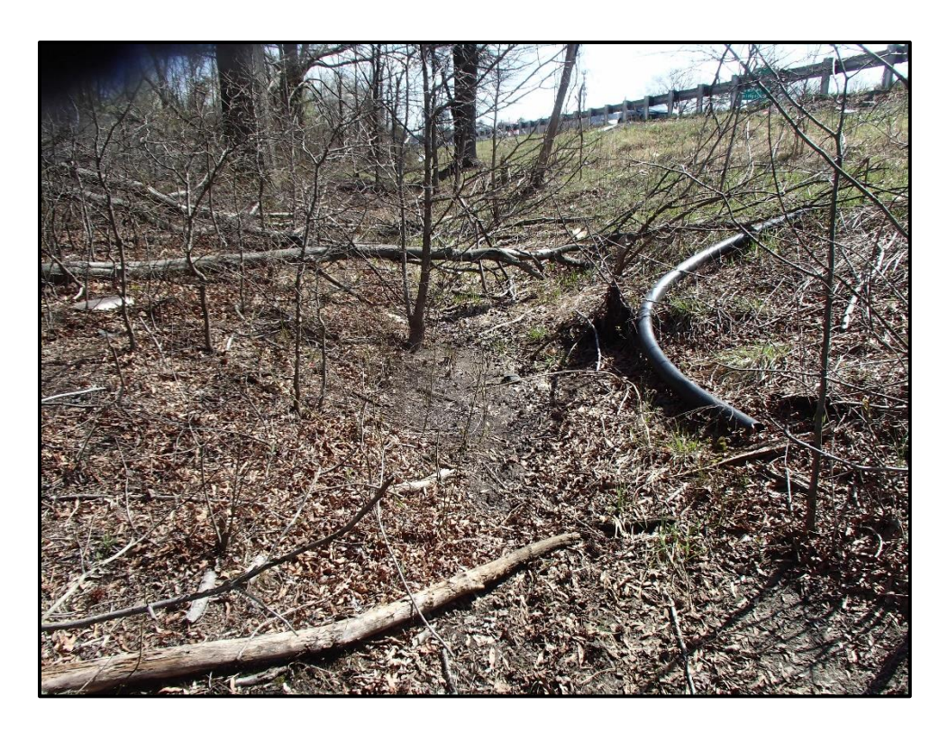
Wetland 2Q - PSS