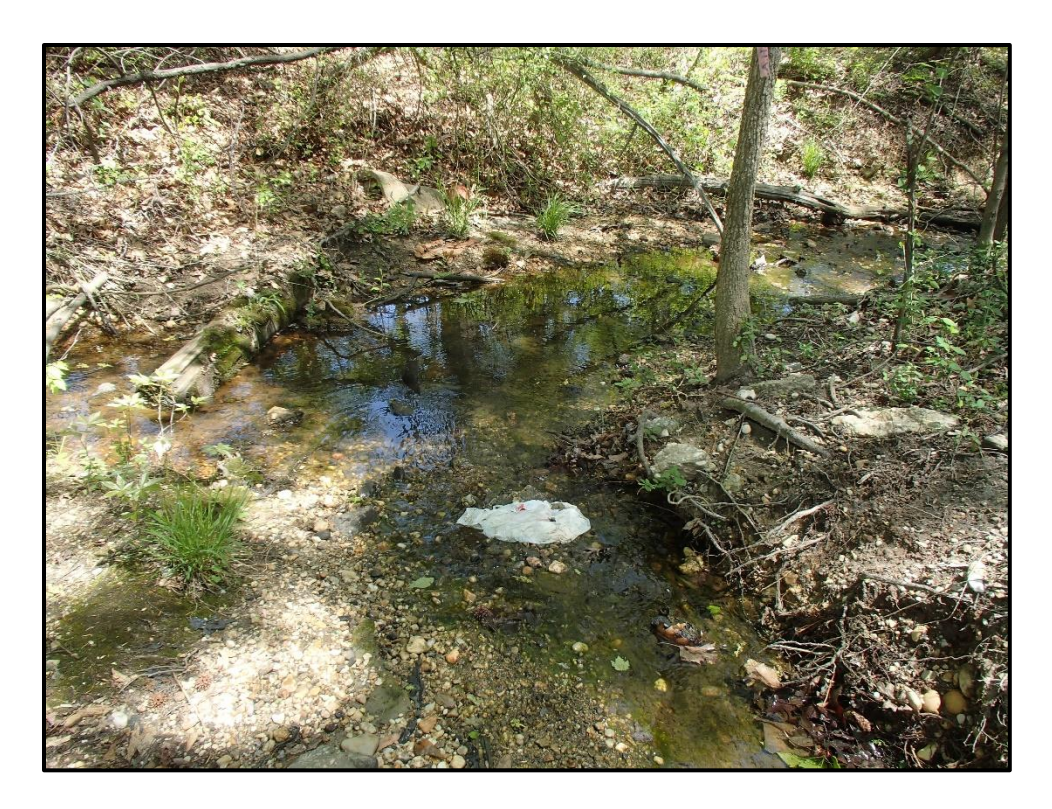
Waters 2Z – Intermittent