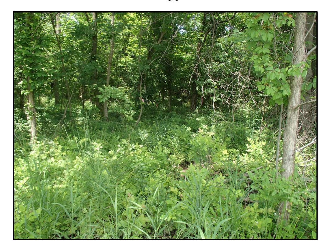
Wetland 6QQ – PFO