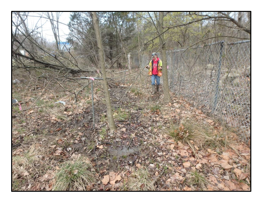
Wetland 1I – PFO