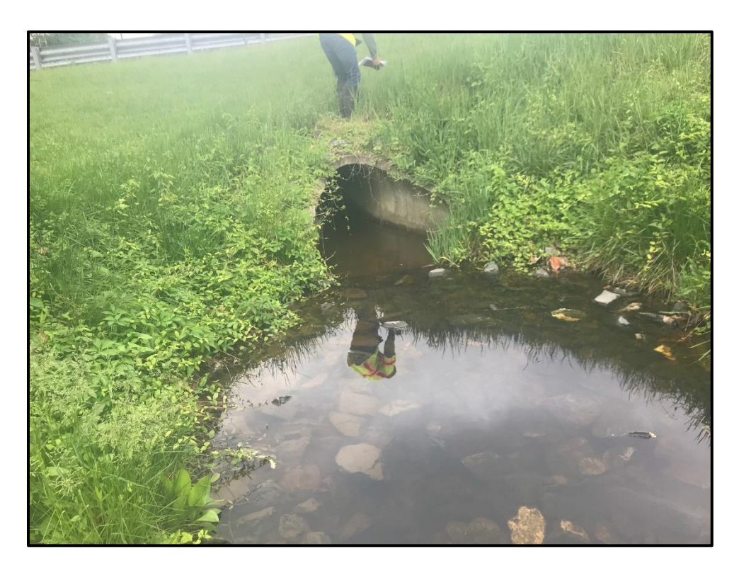
Waters 2YY – Intermittent