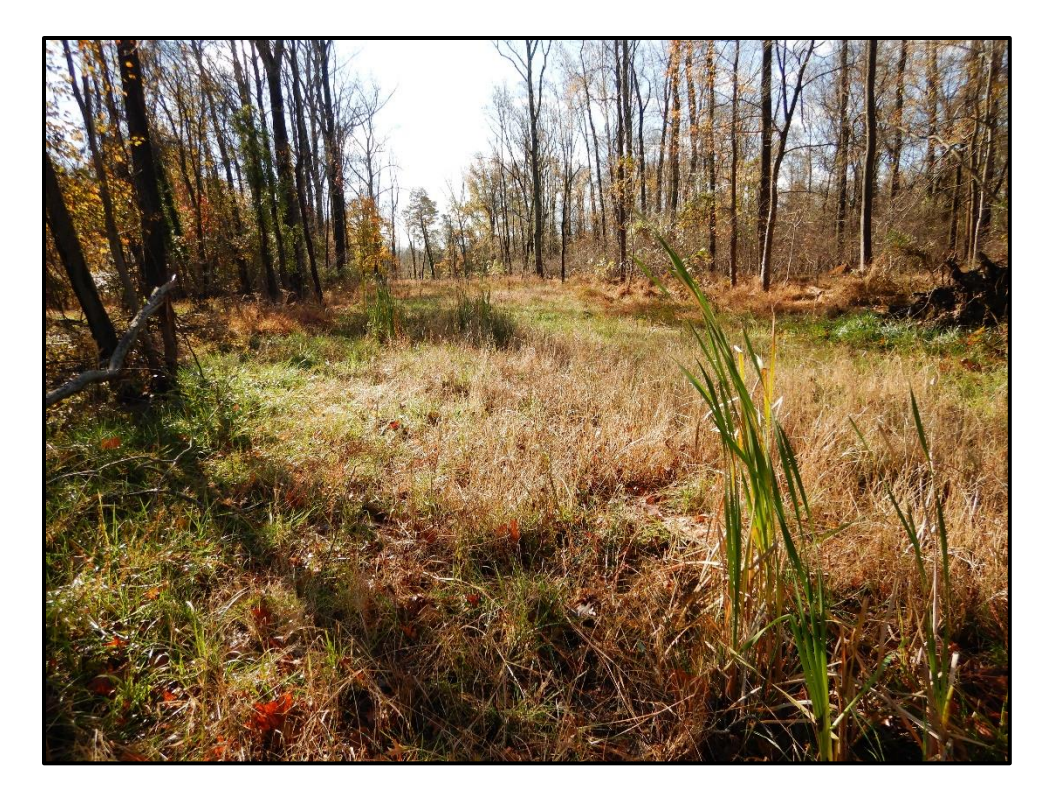
Wetland 1BBB – PEM