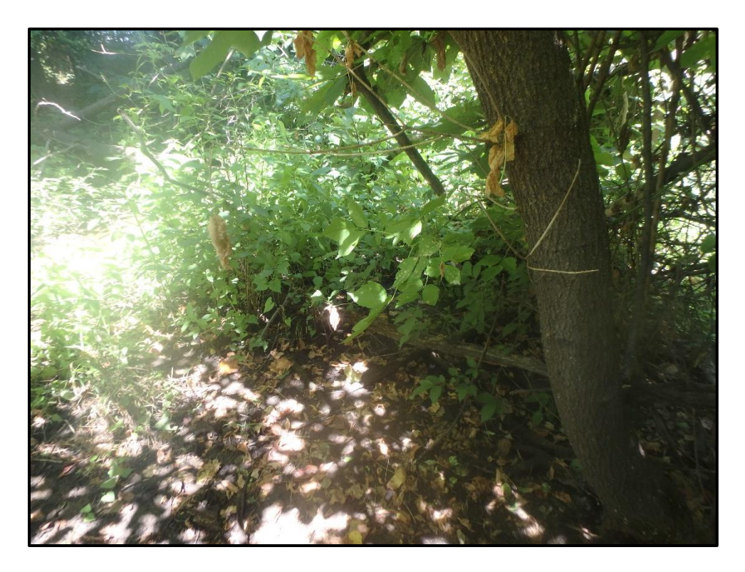
Wetland 5I – PFO