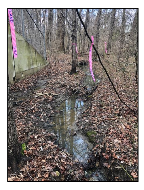
Waters 6FFFF – Intermittent