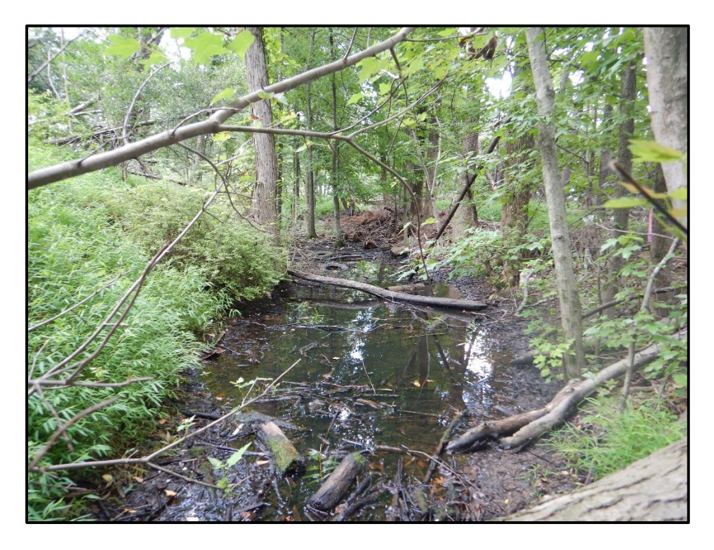
Wetland 2LL - PFO