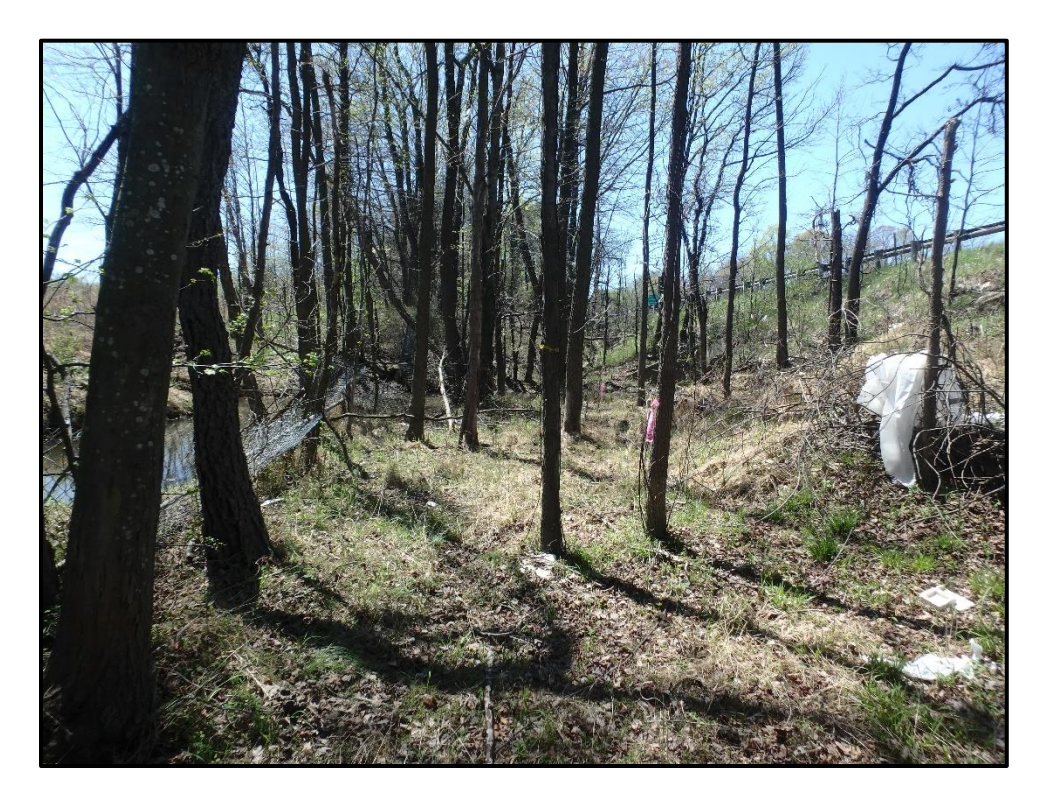
Wetland 4R – PFO