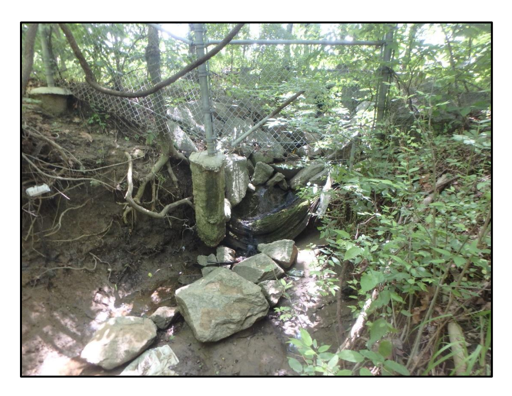
Waters 6L – Intermittent