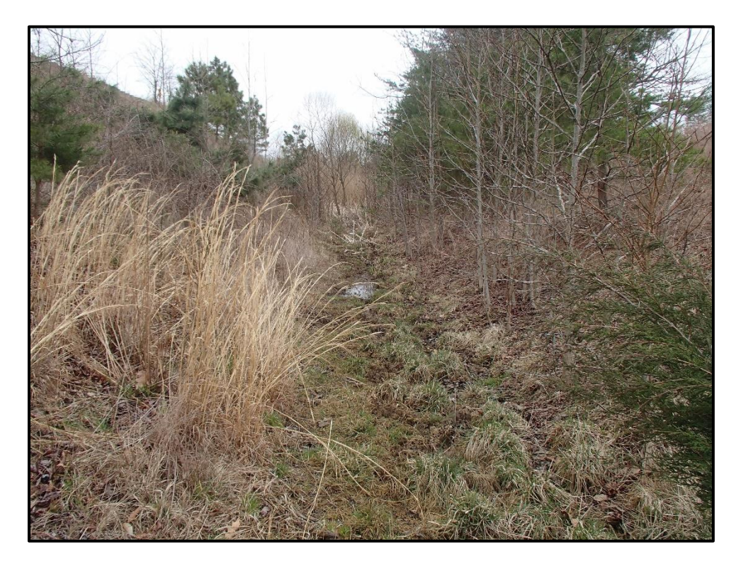
Wetland 1T – PSS