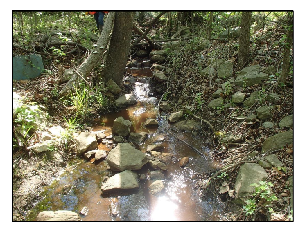
Waters 4W – Perennial