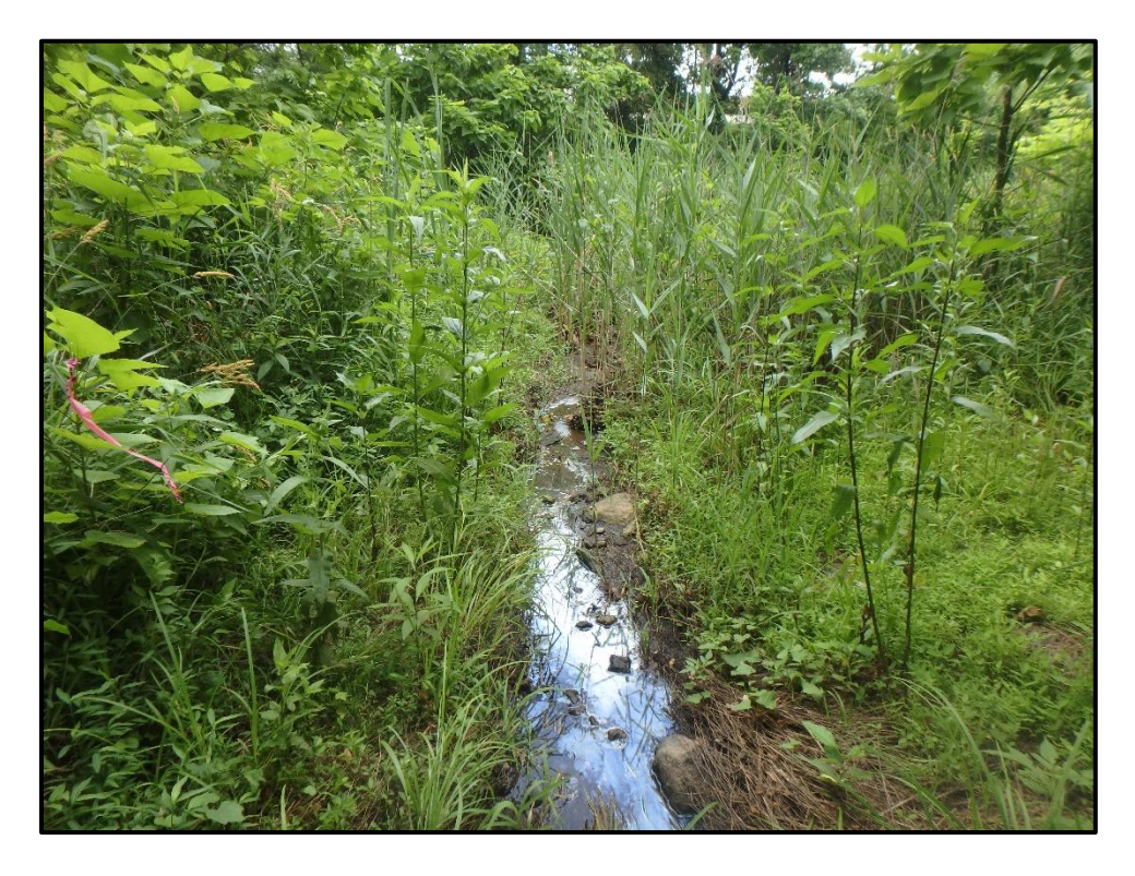
Waters 6SS – Intermittent