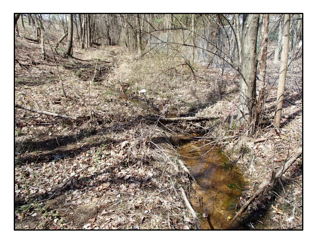
Wetland 2S - PFO