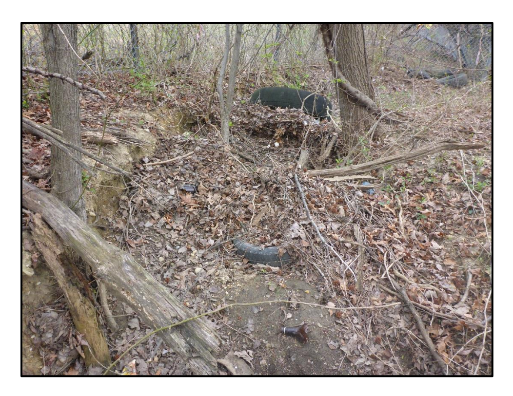
Waters 3BB – Ephemeral