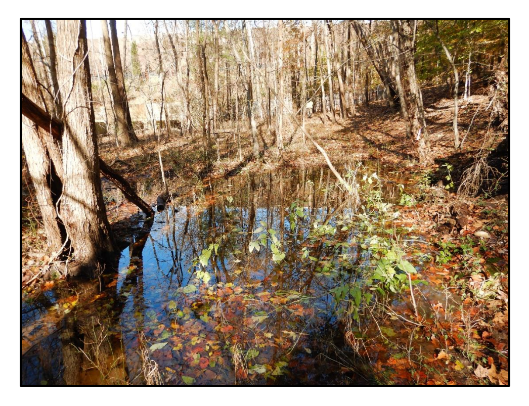
Wetland 1CCC - PFO