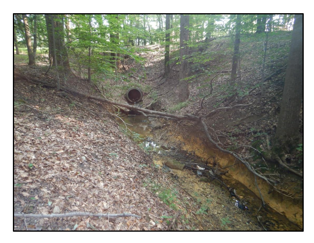
Waters 2MM – Perennial