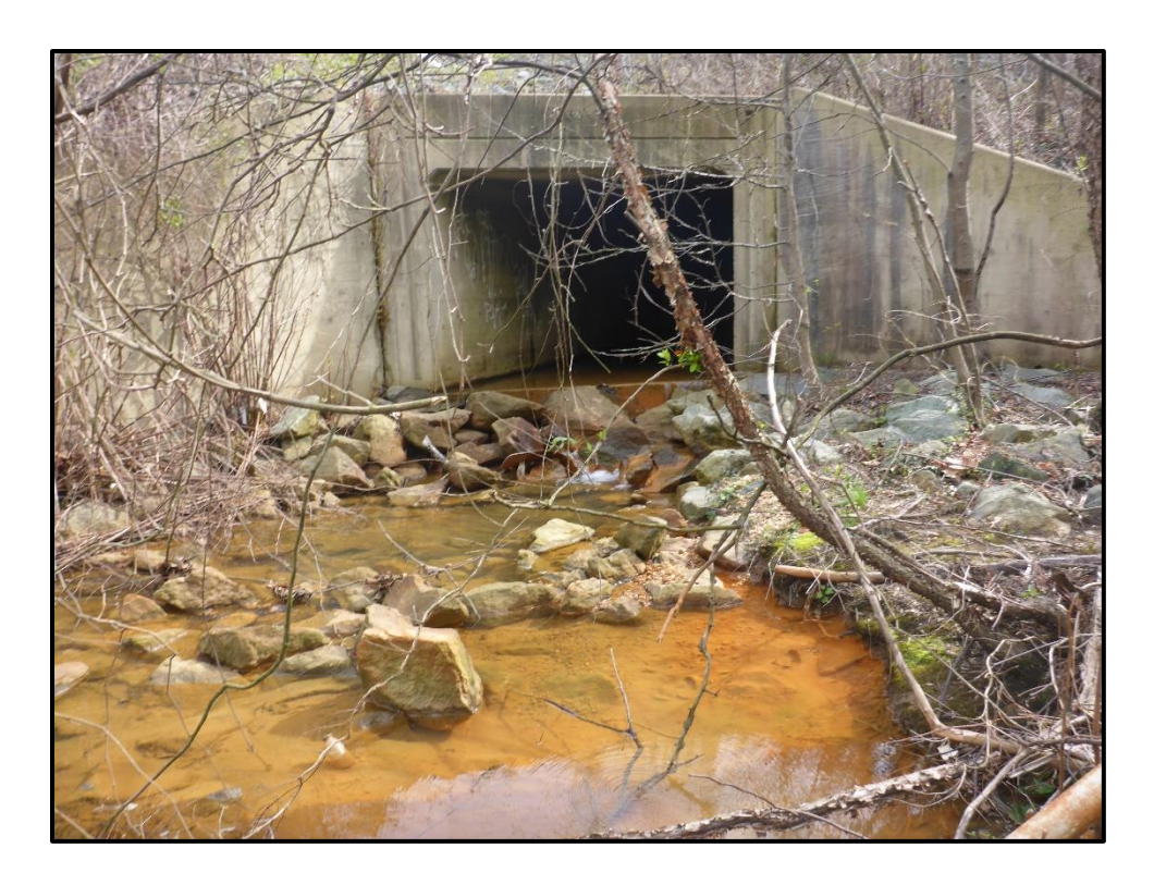
Waters 1Q - Perennial