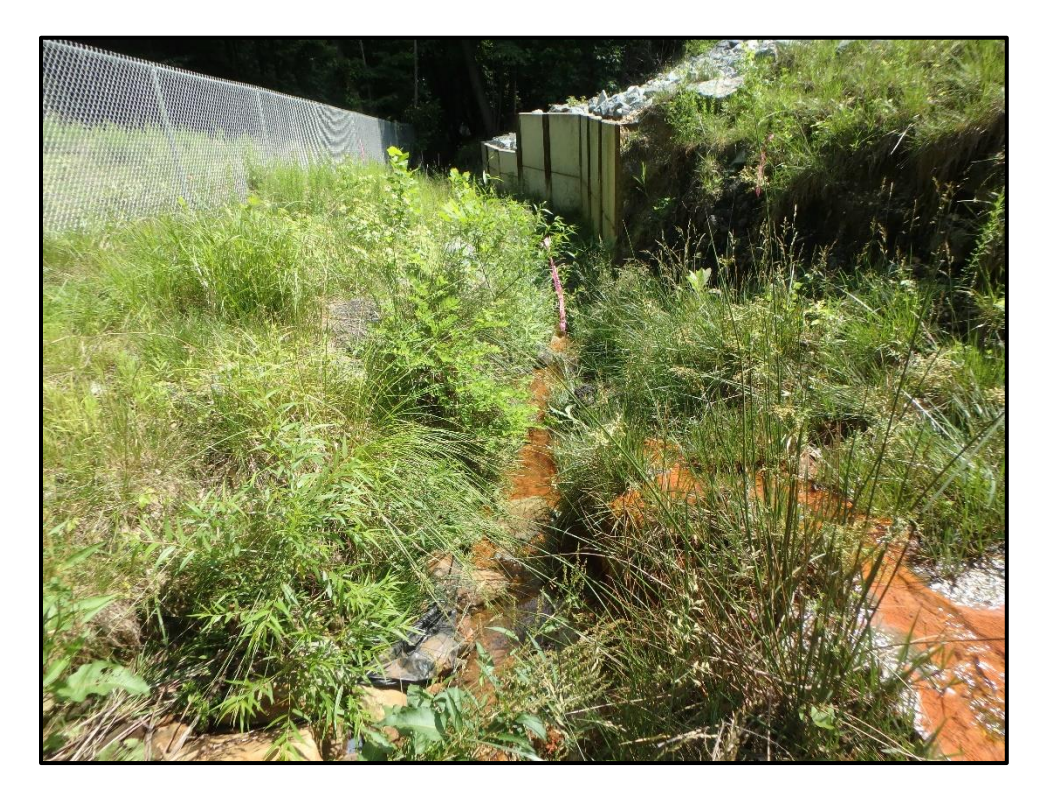
Waters 4BBB – Perennial