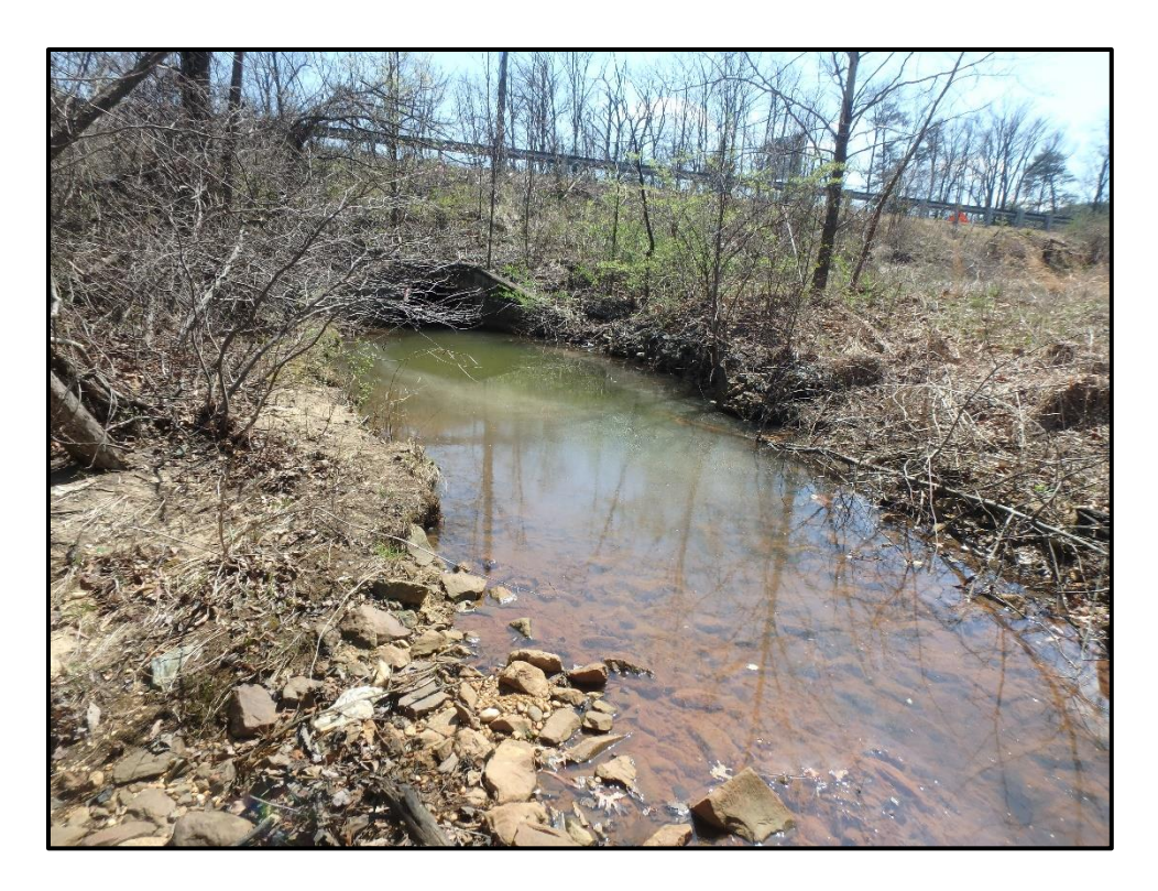
Waters 3D – Perennial