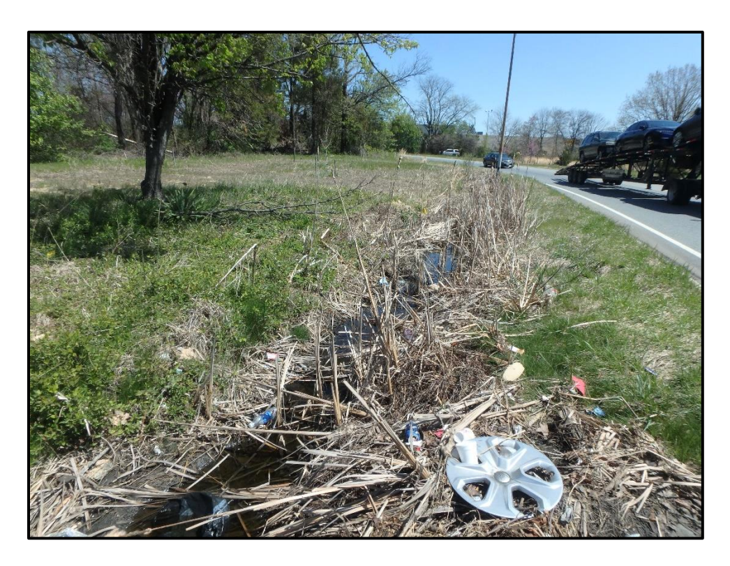
Wetland 4I – PEM