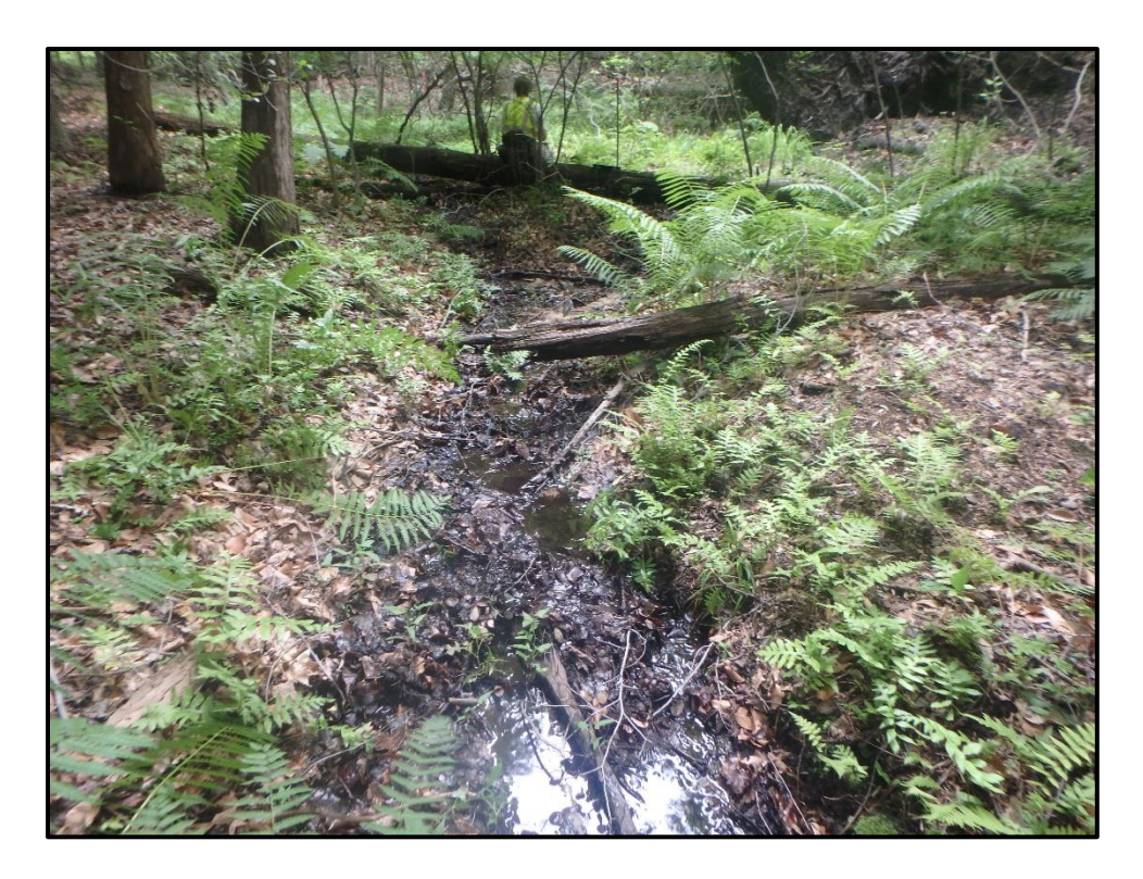
Waters 4SSSS – Intermittent