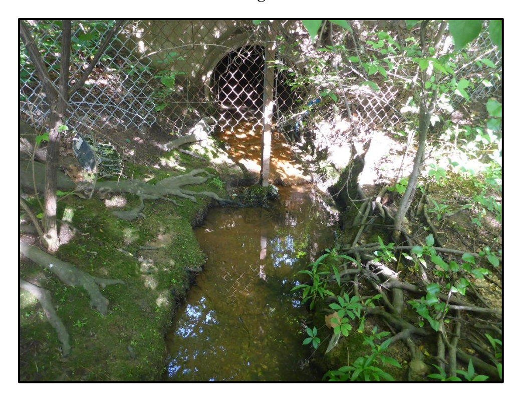
Waters 7A – Intermittent