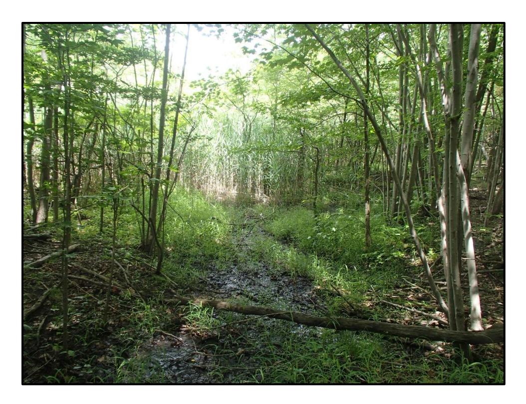
Wetland 4FFFF – PFO