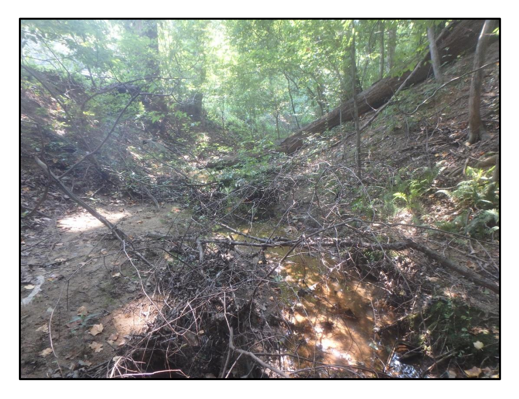
Waters 7JJ – Perennial