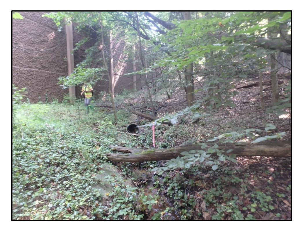
Waters 1LL - Intermittent