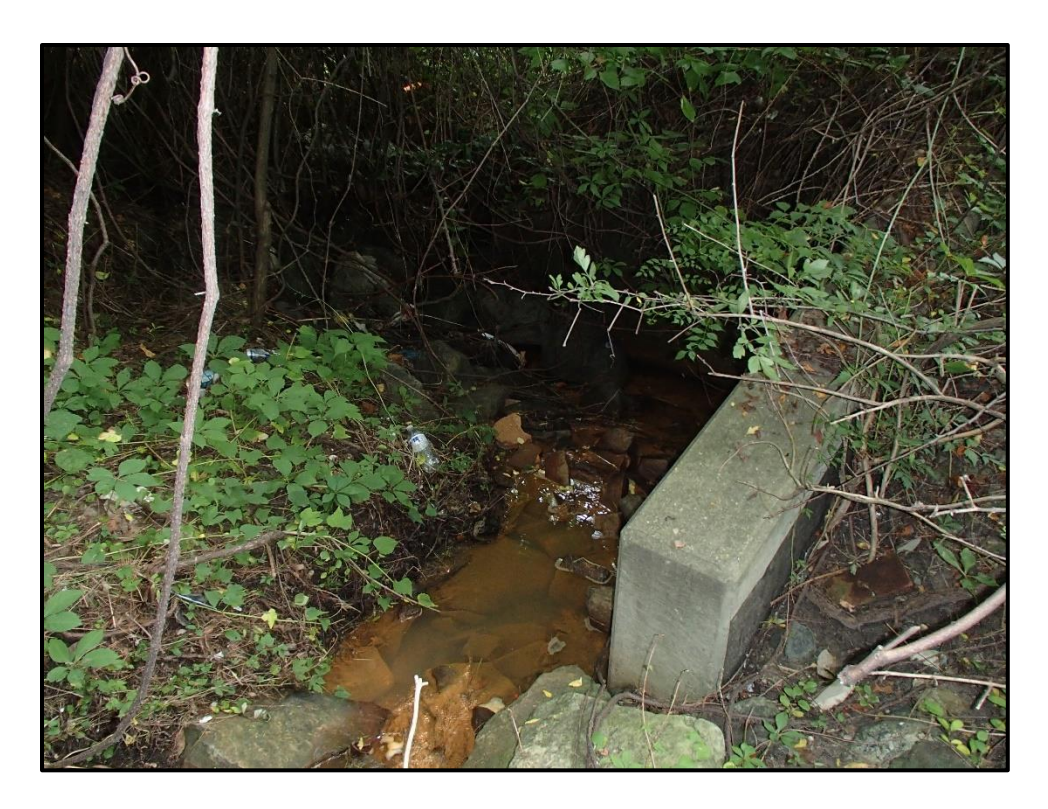
Waters 6JJJ – Perennial