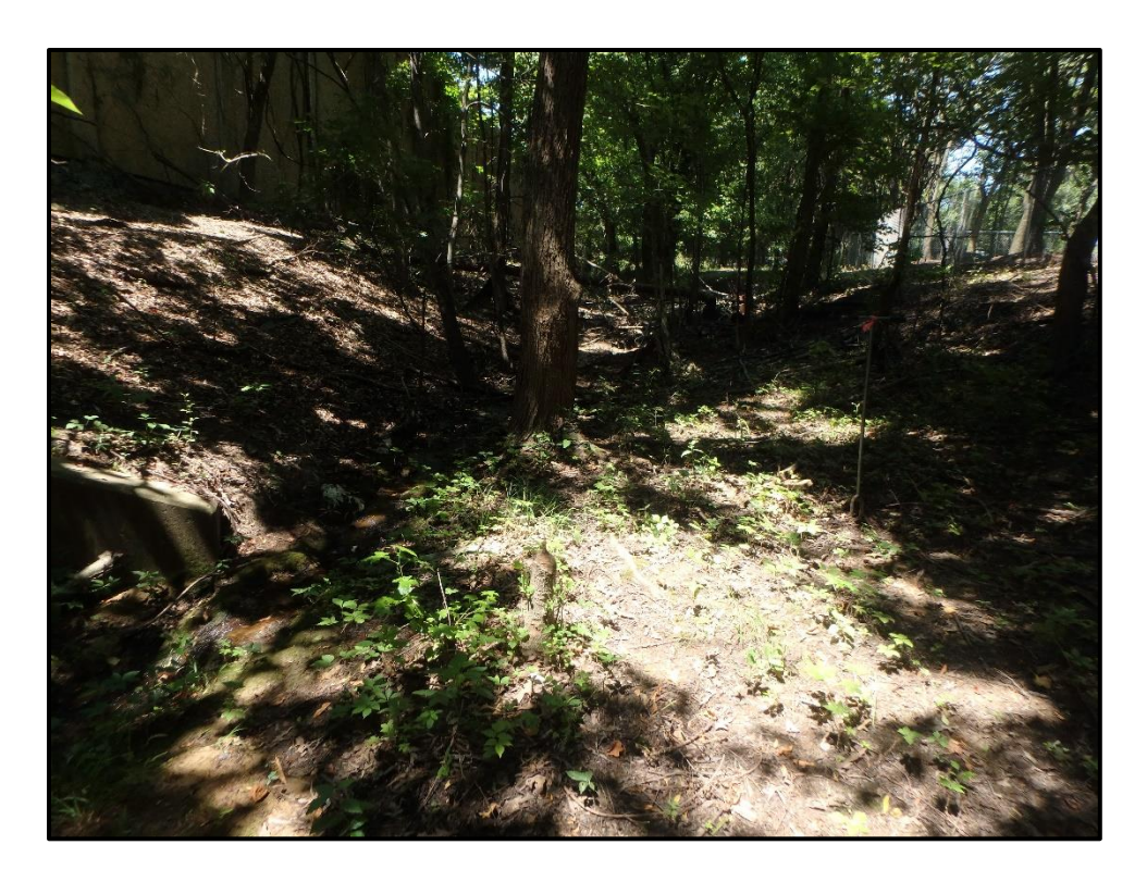
Wetland 7HH – PFO