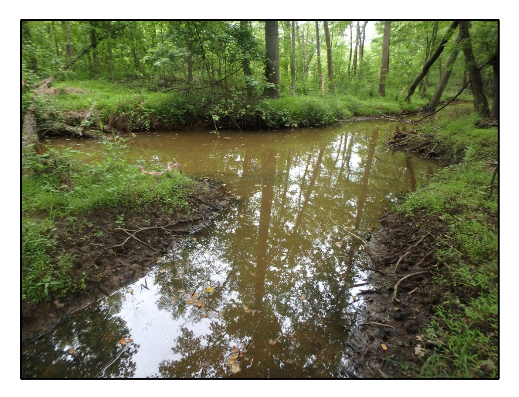
Wetland 4OO – Intermittent