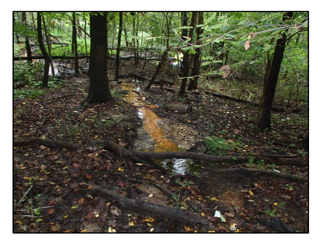
Waters 1TT – Intermittent