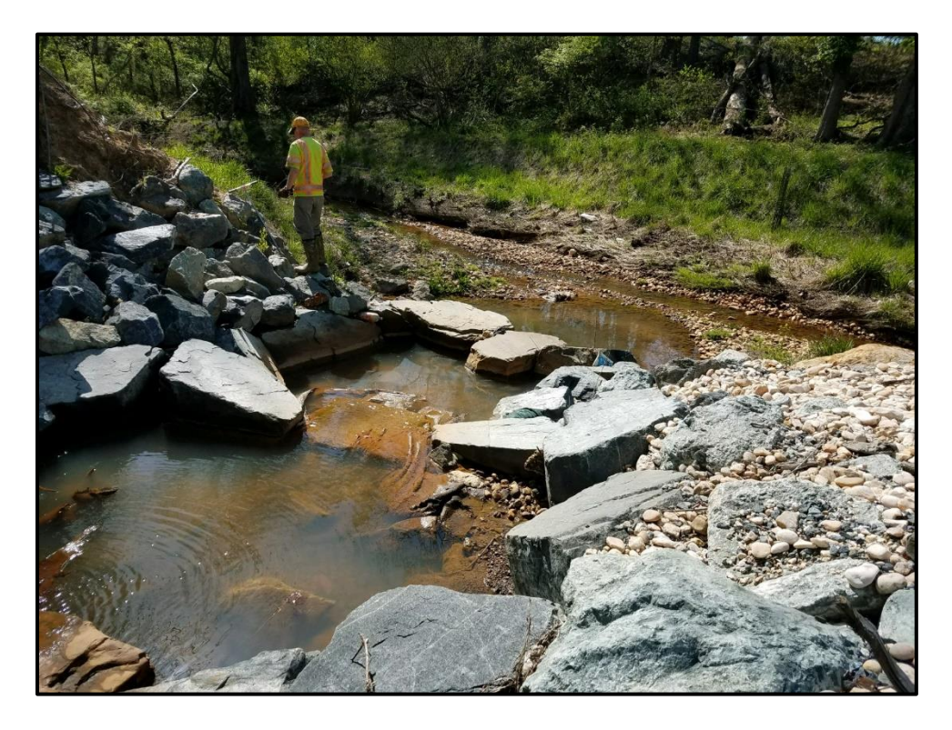
Waters 1W – Perennial