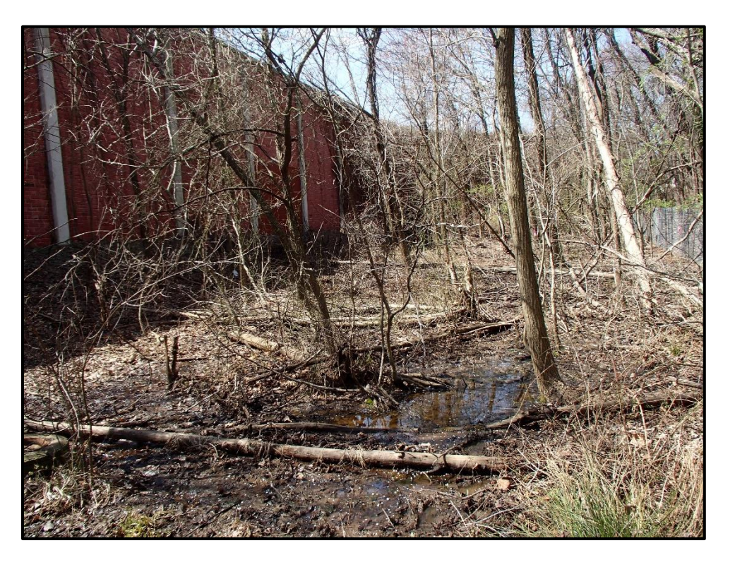
Wetland \ 2U-PFO