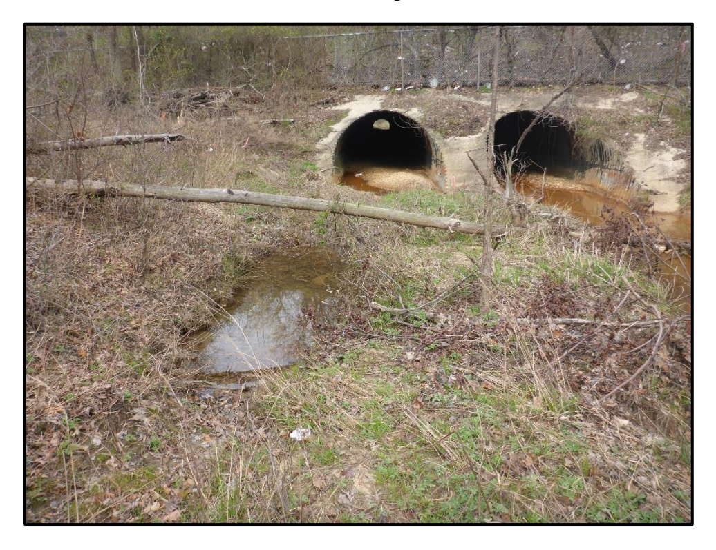
Wetland 3M – PEM