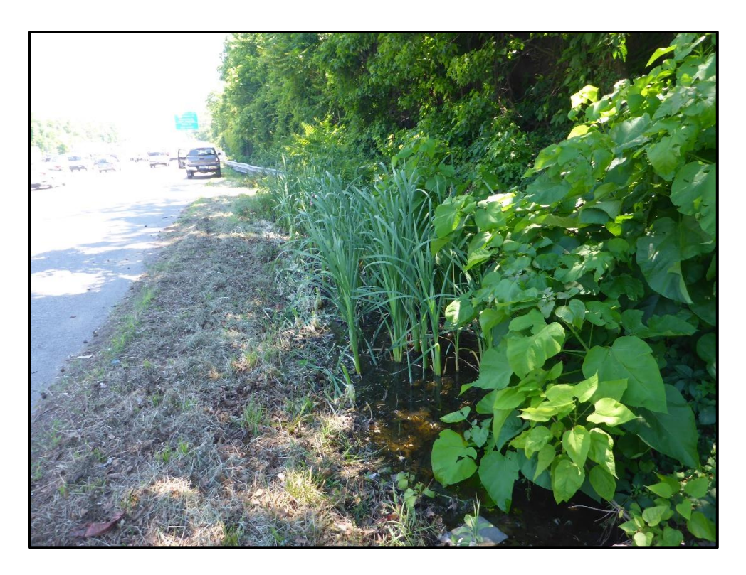
Wetland 7K - PEM