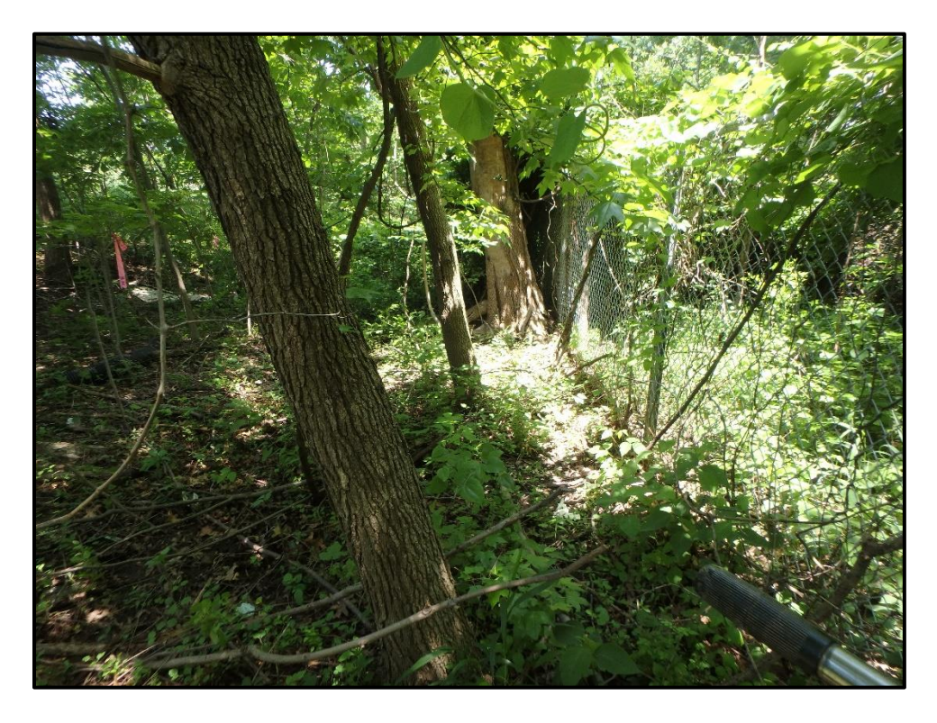
Wetland 6K - PFO