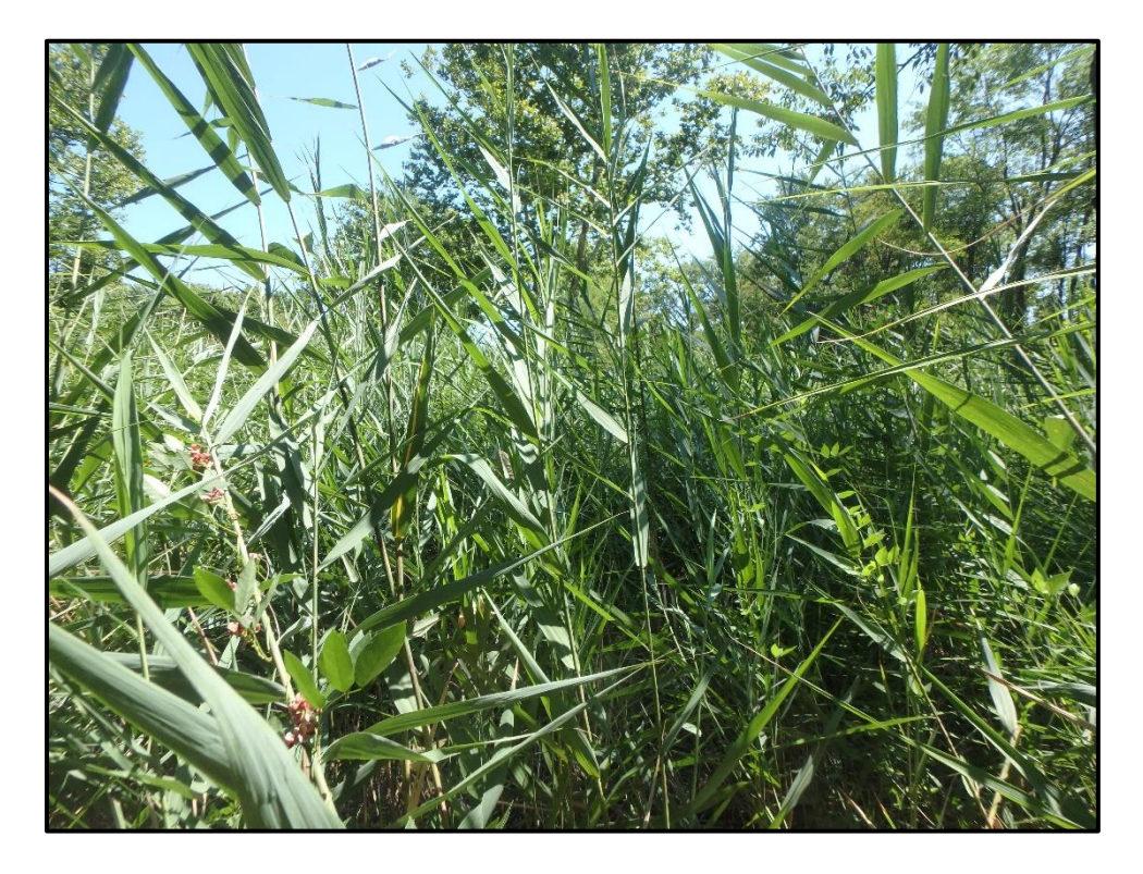
Wetland 1FF – PEM