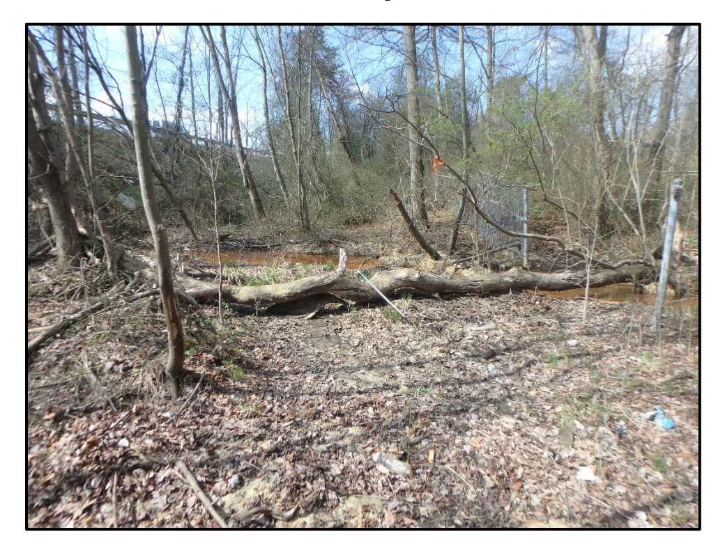
Wetland 3FF – PFO