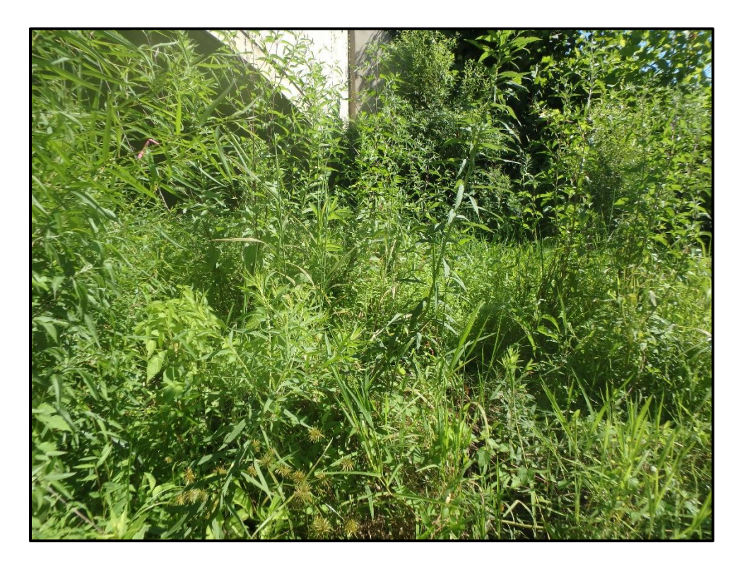
Wetland 5G – PSS