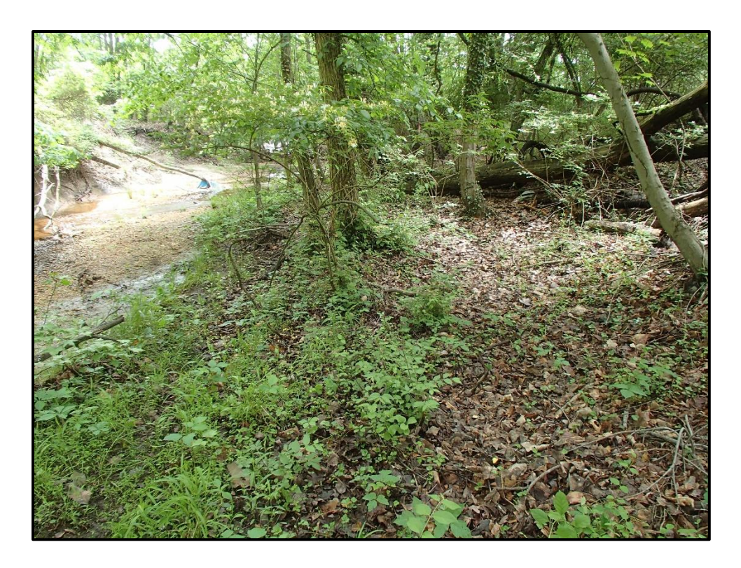
Wetland 3AAA – PFO