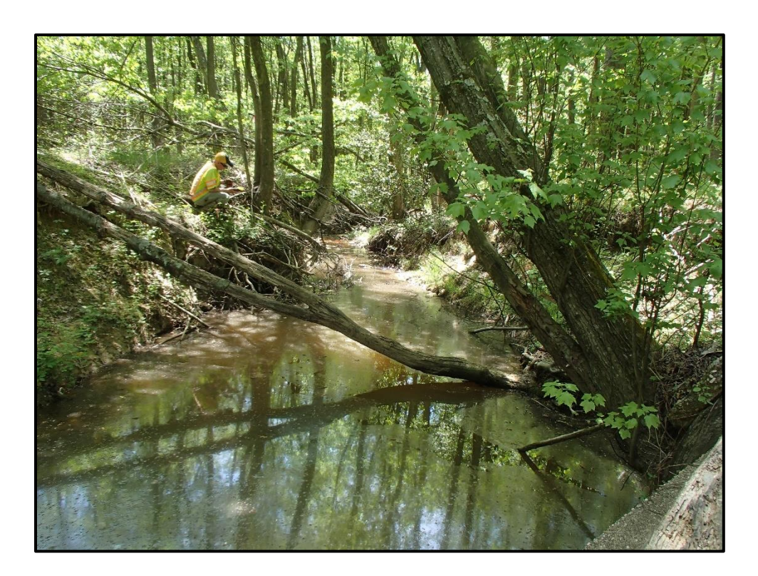
Waters 3ZZ – Perennial