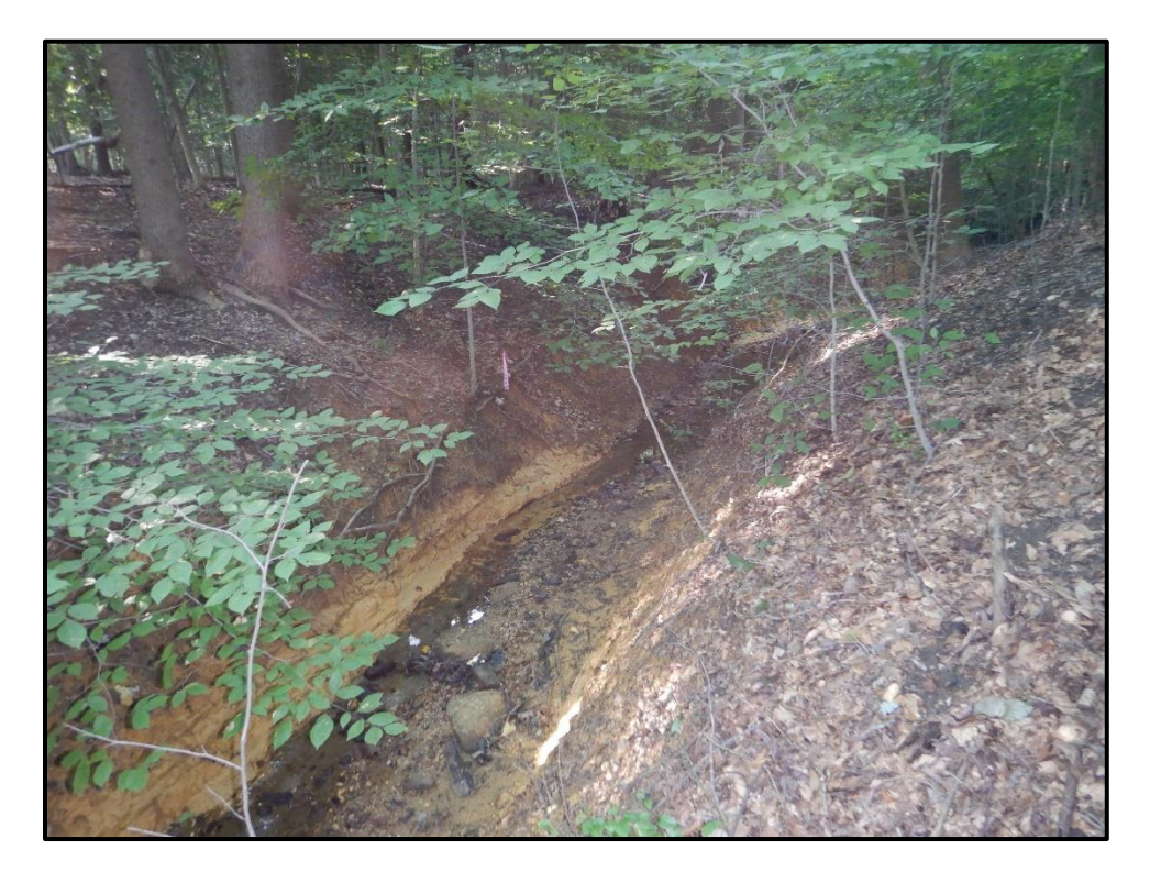
Waters 2MM – Perennial