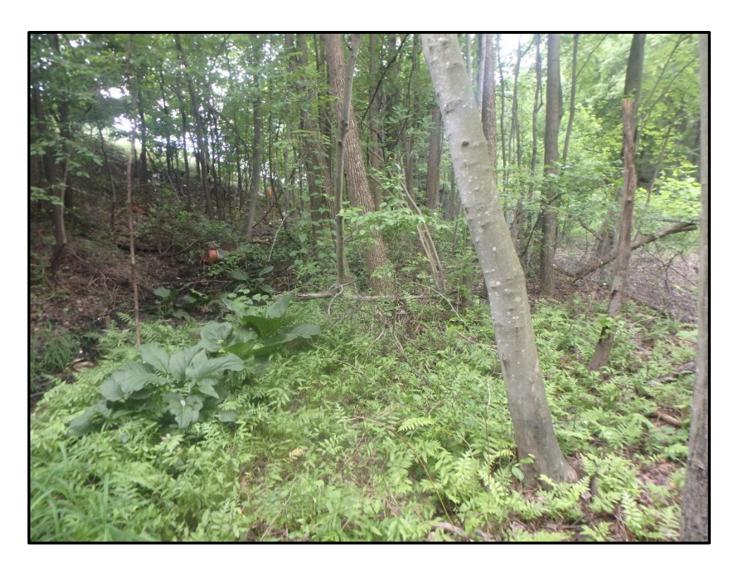
Wetland 4NNNN – PFO