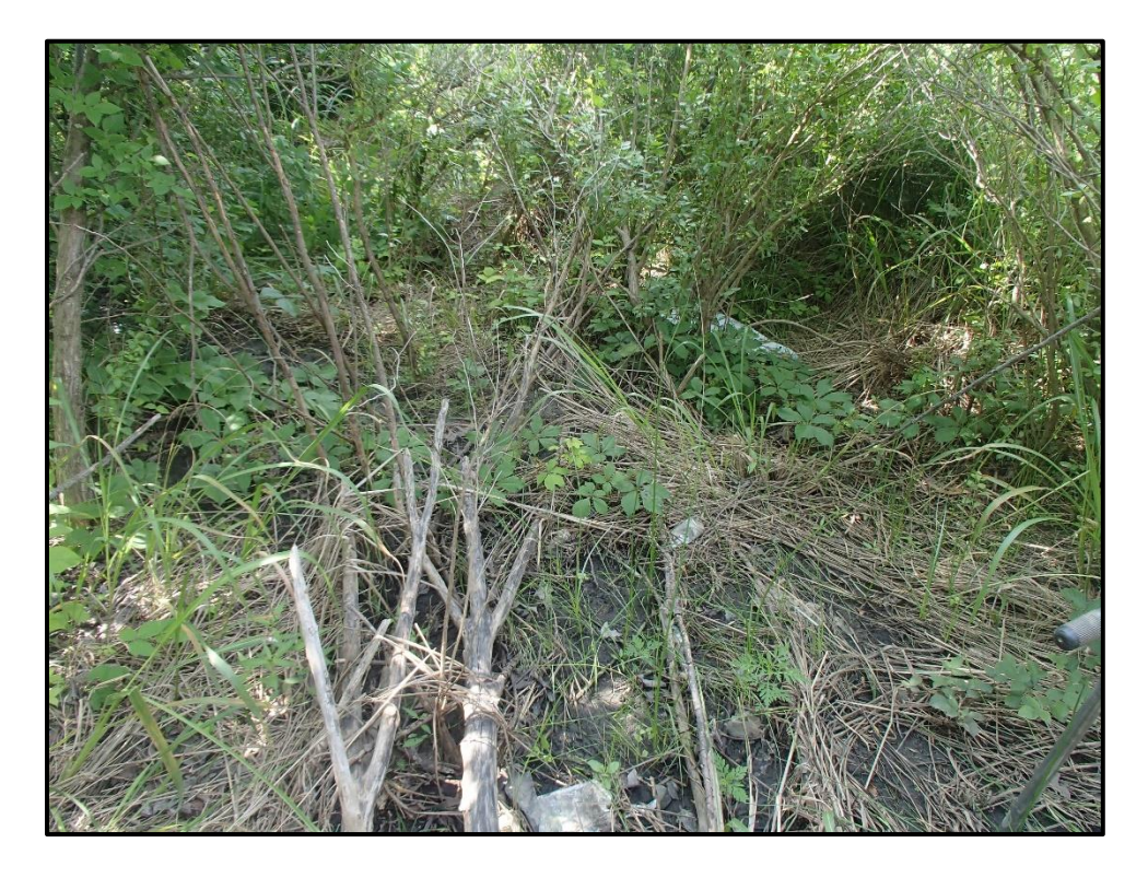
Wetland 4XXX – PFO