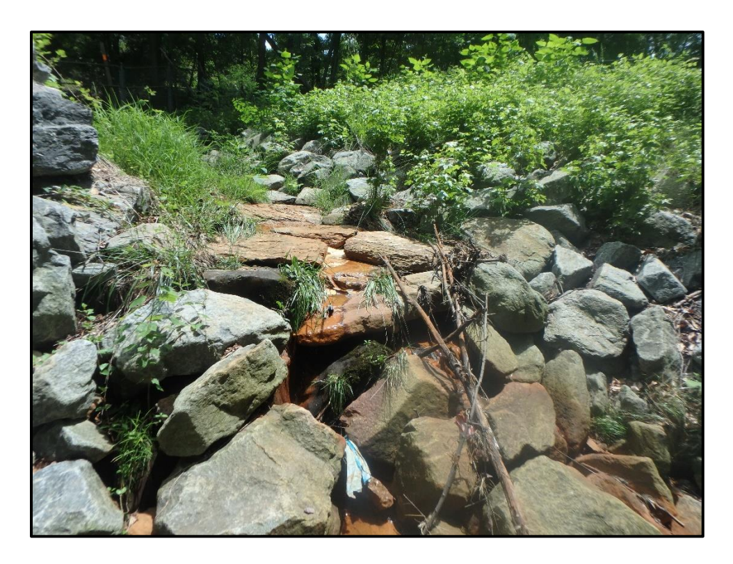
Waters 4JJJJ – Perennial