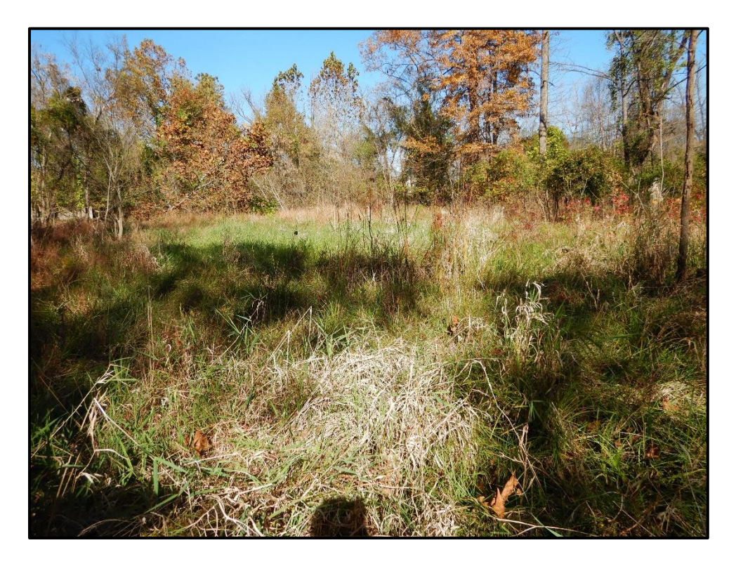
Wetland 5LL – PEM