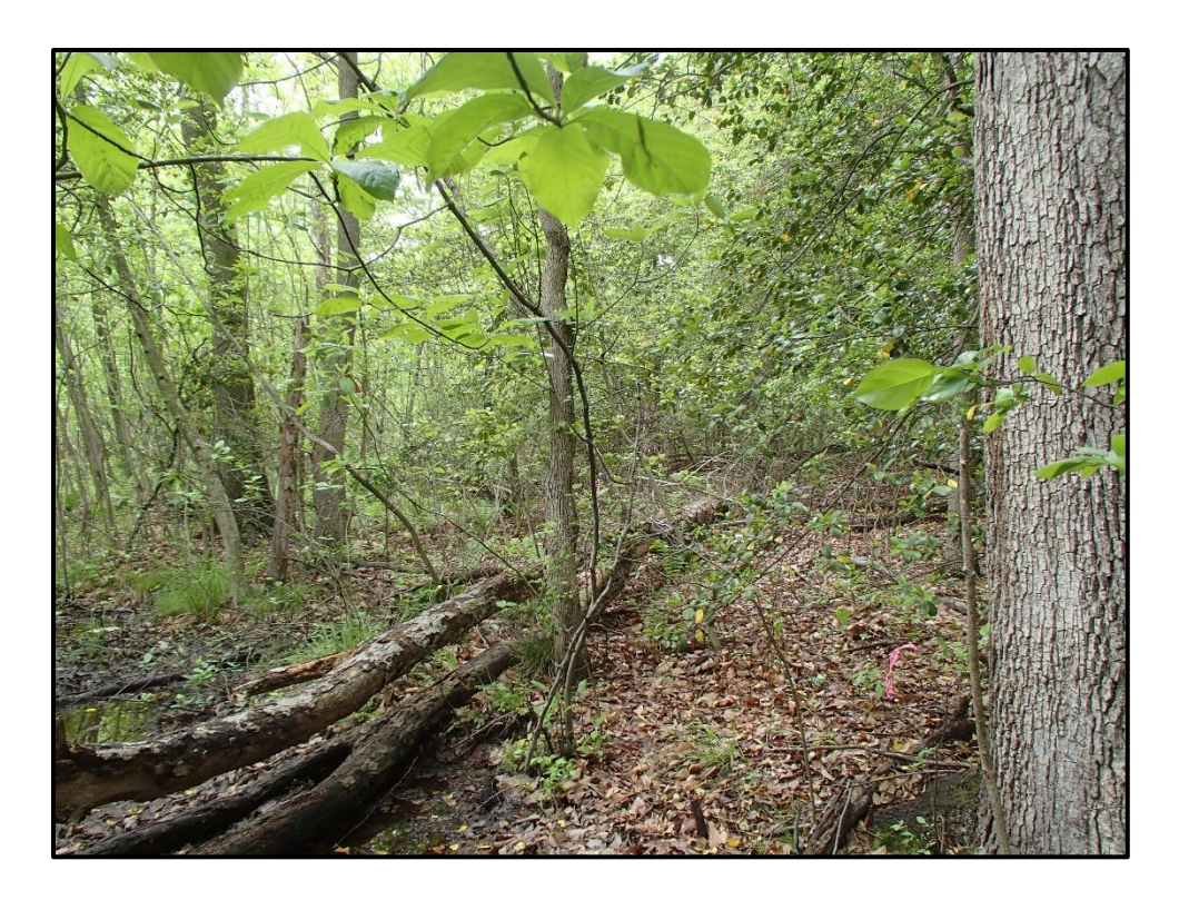
Wetland 3EE – PFO