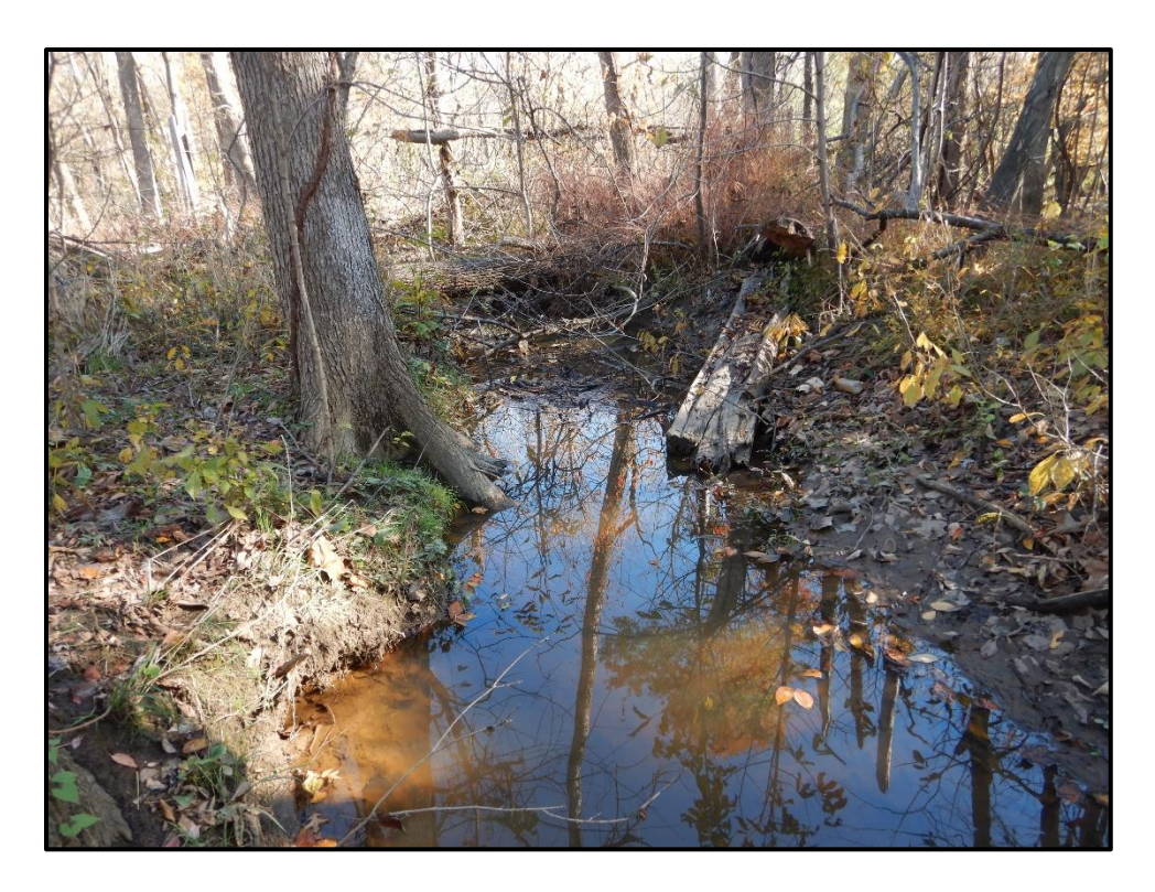
Waters 5MM – Intermittent