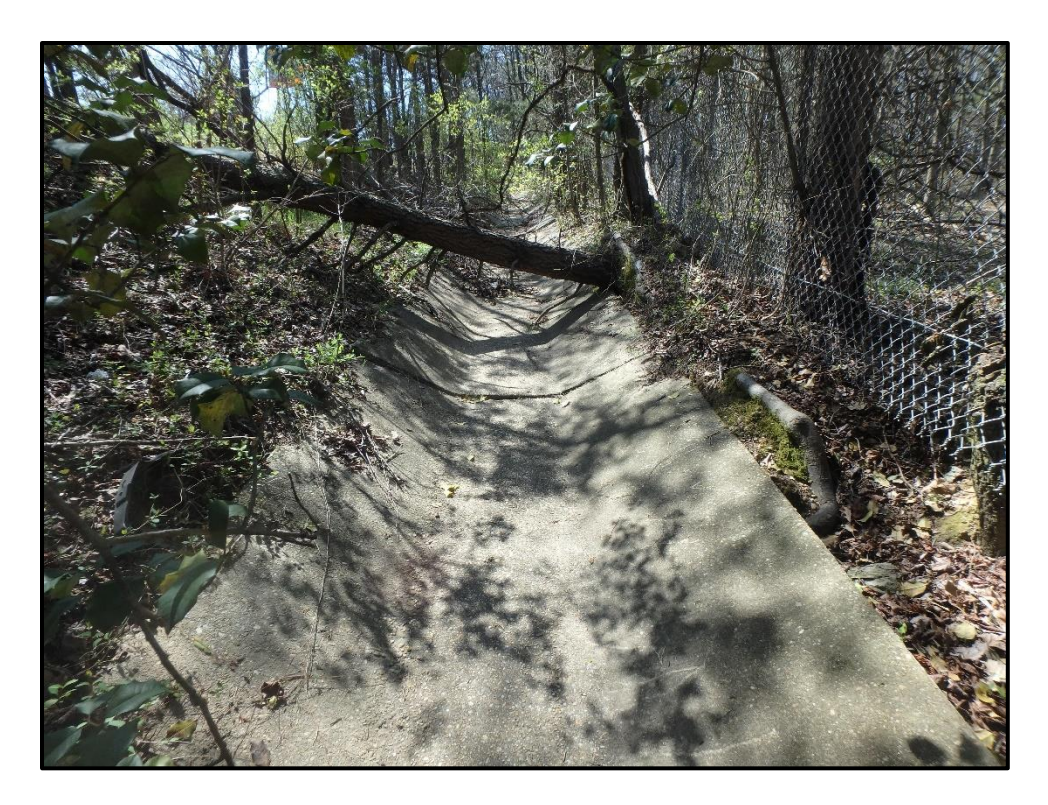
Waters 3RR – Ephemeral