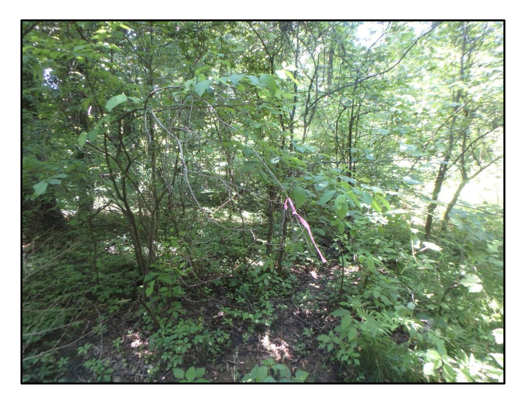
Wetland 4000 – PFO