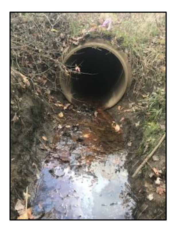
Waters 5PP – Intermittent