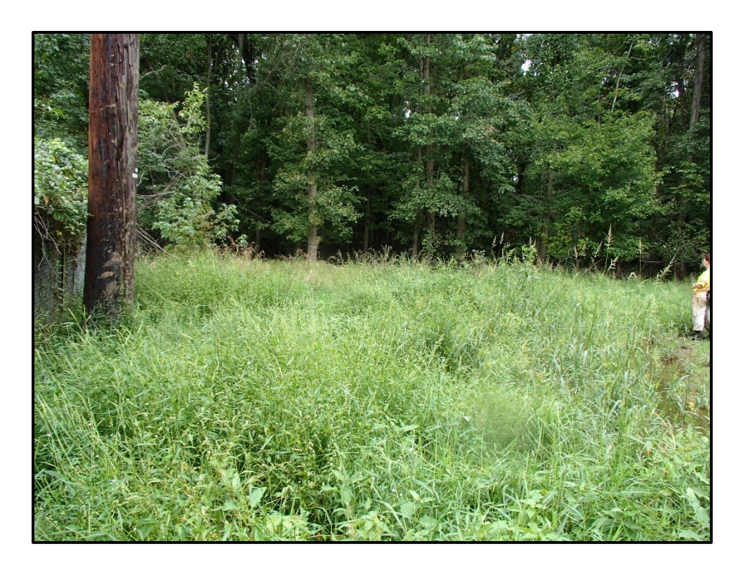
Wetland 1WW – PEM