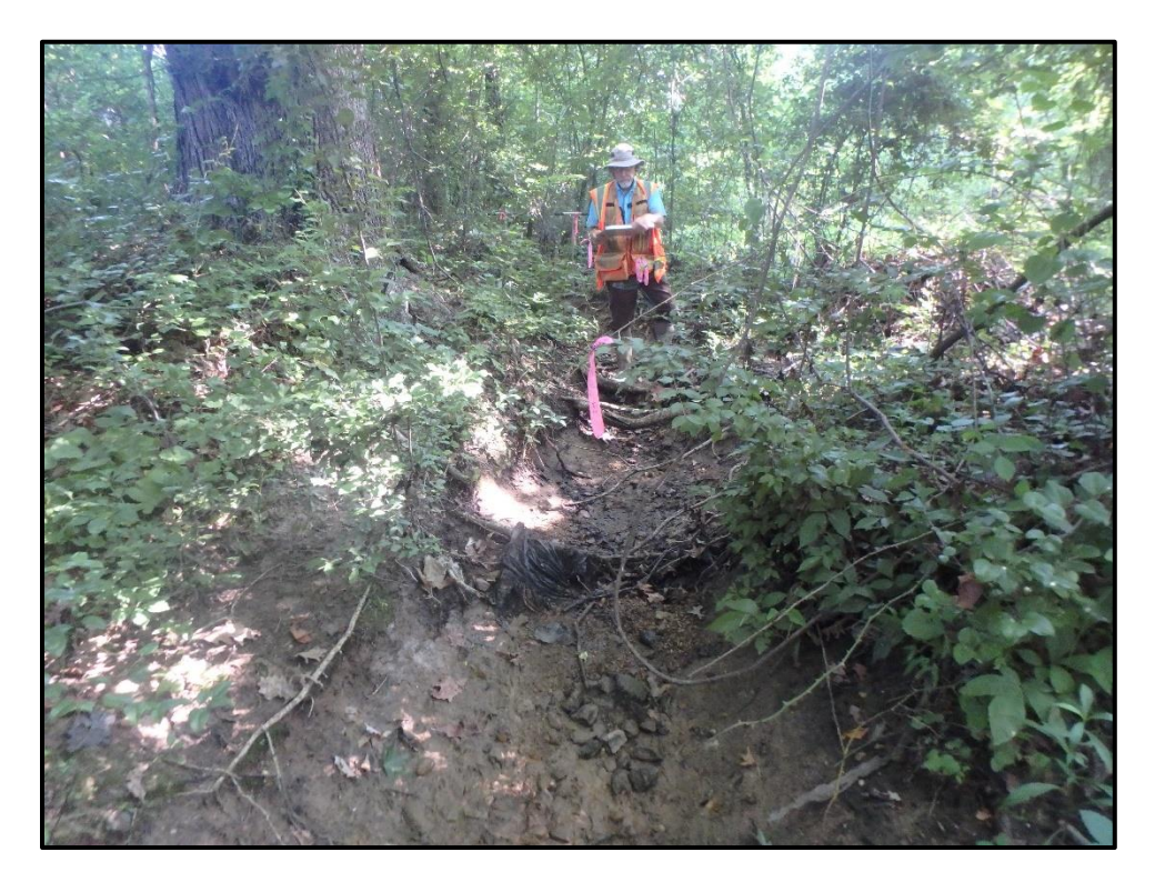
Waters 6T – Intermittent