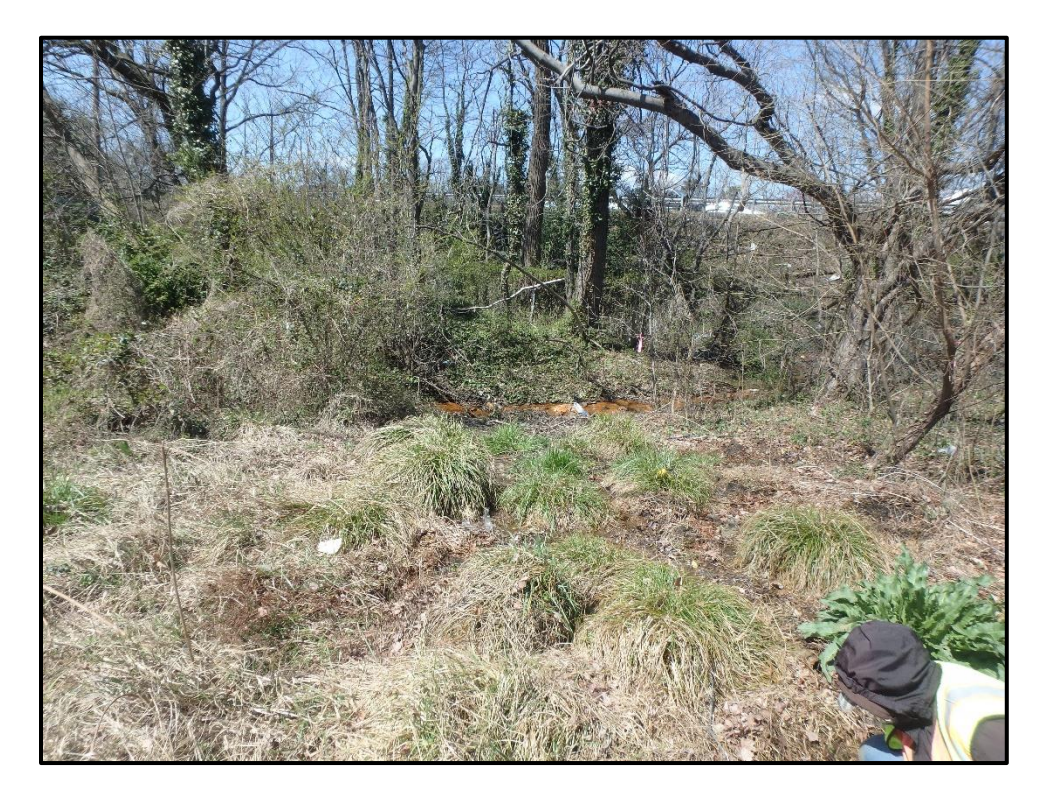
Wetland 3C – PEM