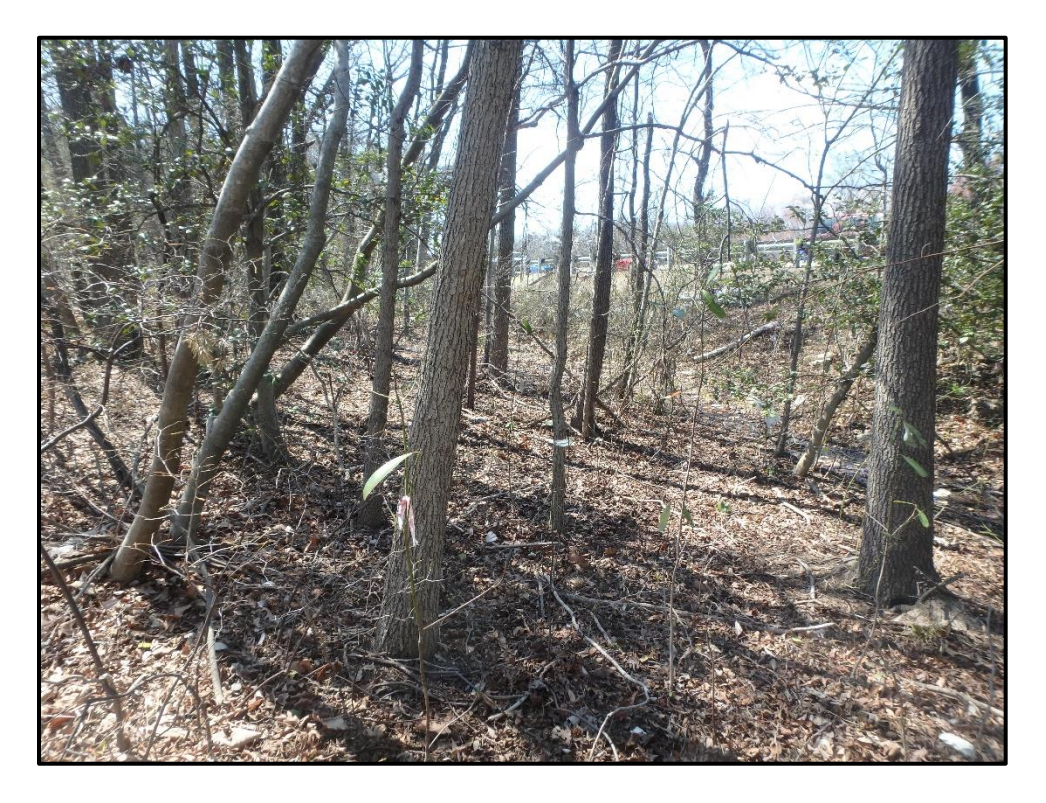
Wetland 3G - PFO