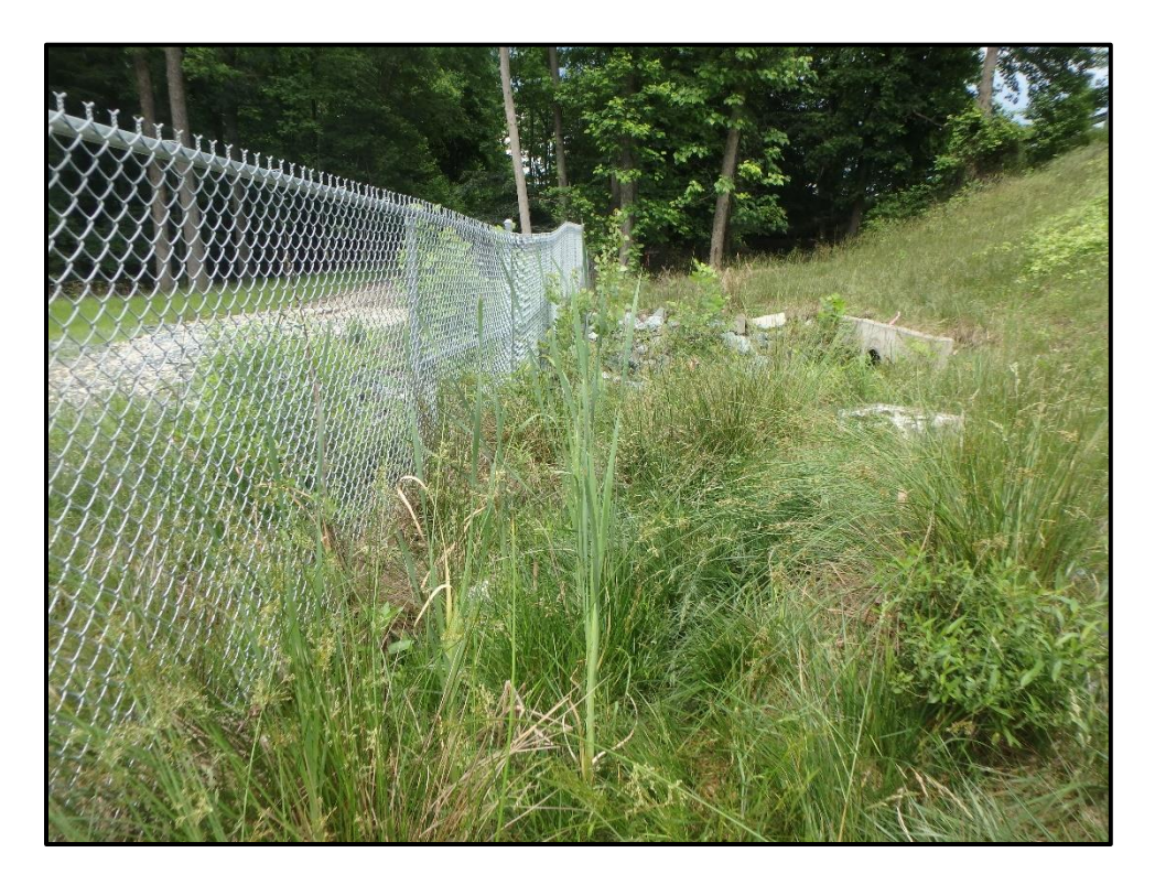
Wetland 4III – PEM