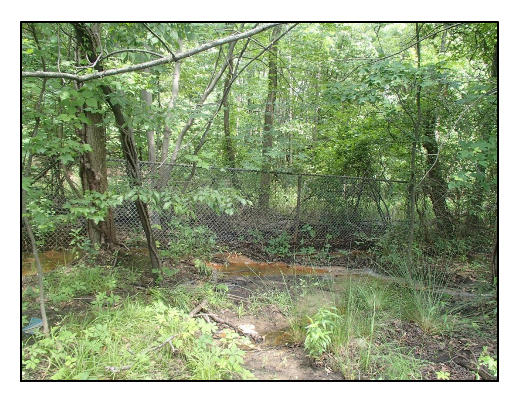
Wetland 4AAAA – PFO