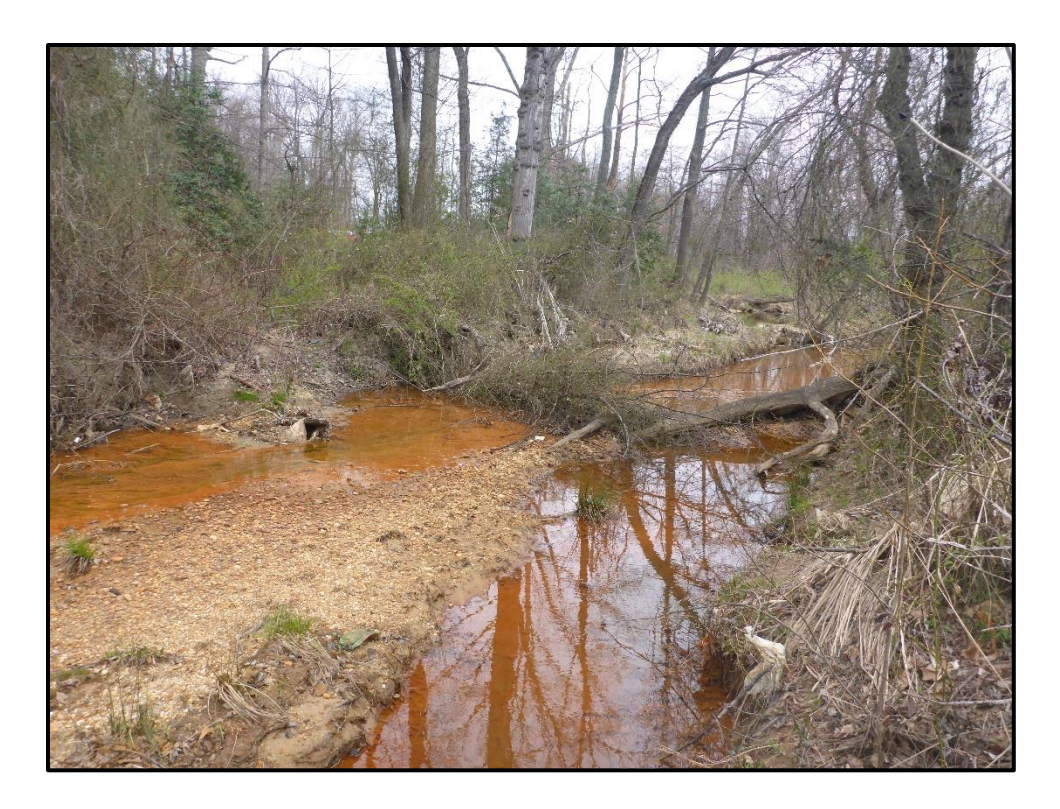
Waters 3S – Perennial