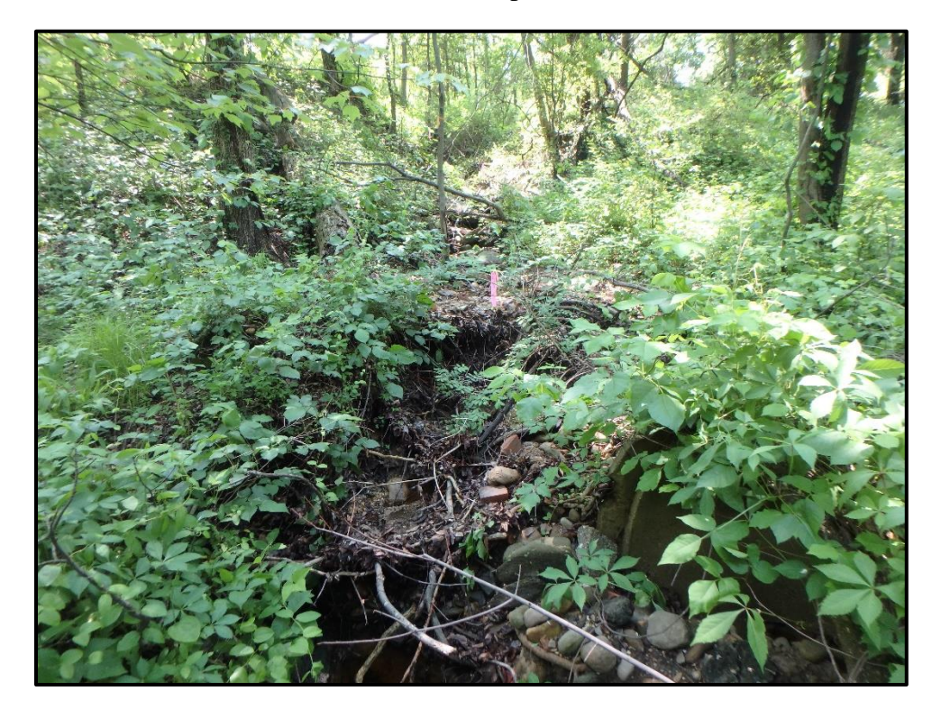
Waters 3BBB – Intermittent