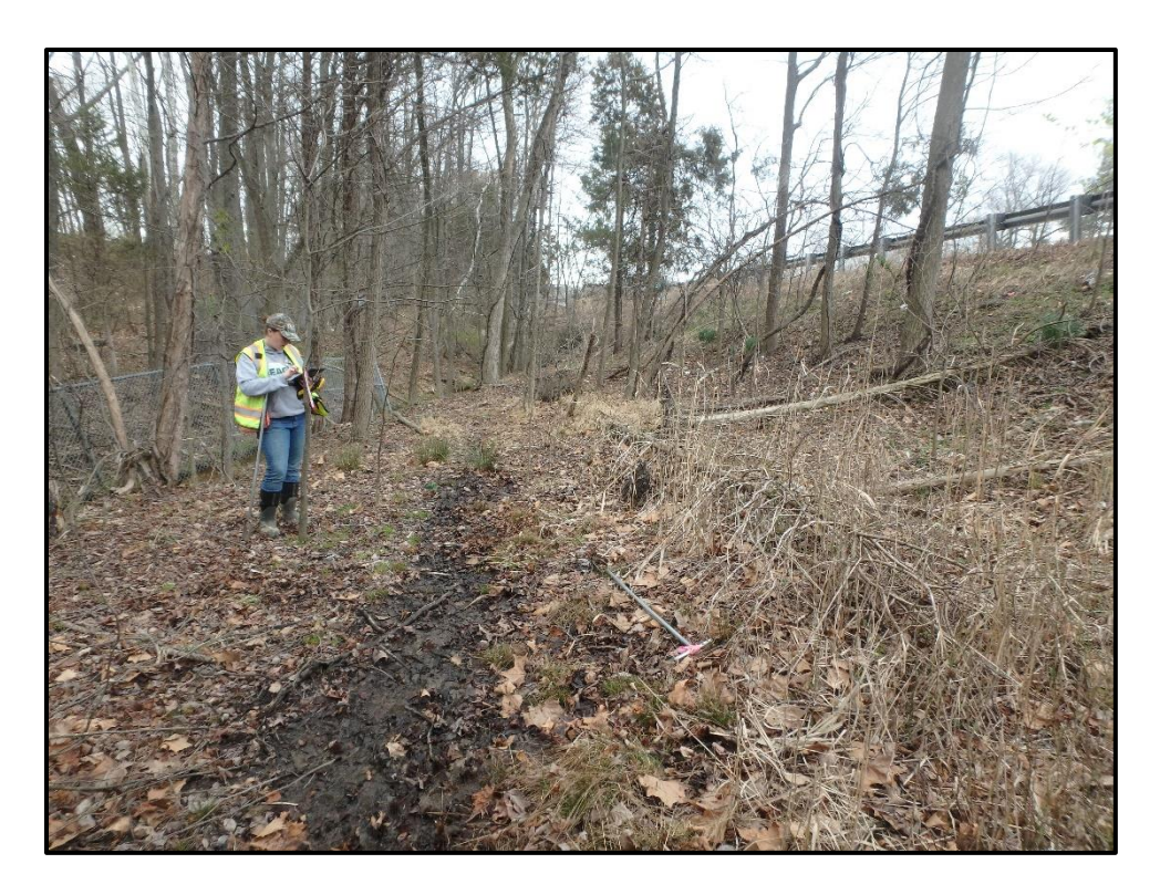
Wetland 1E – PFO