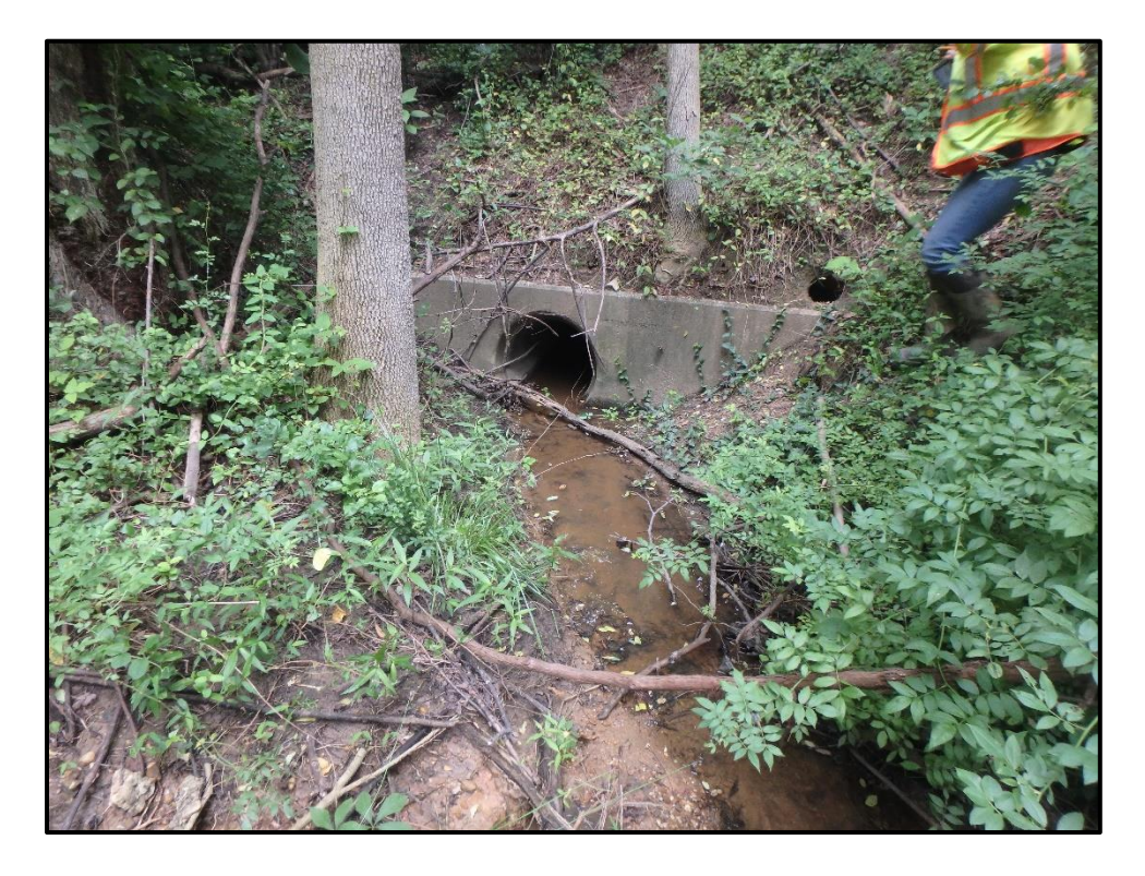
Waters 6WW – Intermittent