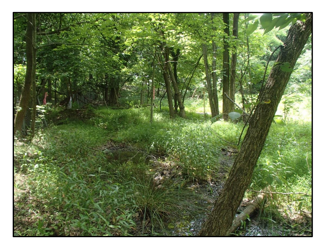
Wetland 4FFFF – PFO