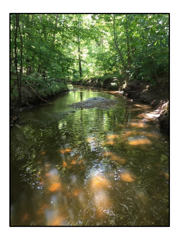
Waters 6G – Perennial