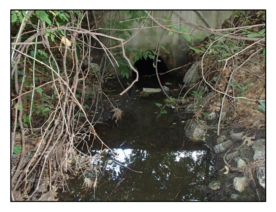
Waters 6III – Intermittent