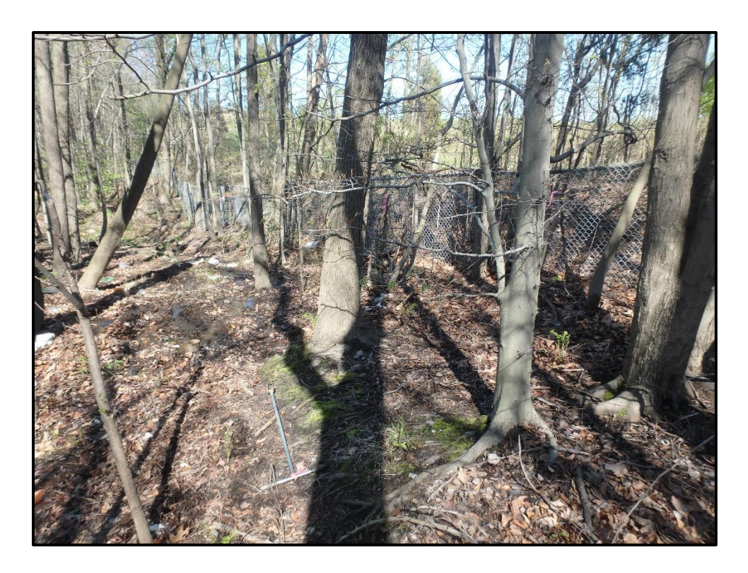
Wetland 4V - PFO