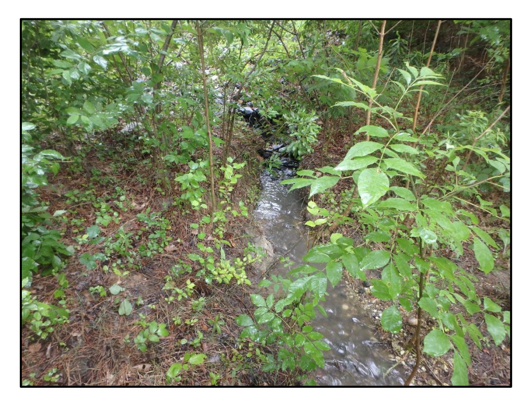
Waters 6EEE – Intermittent