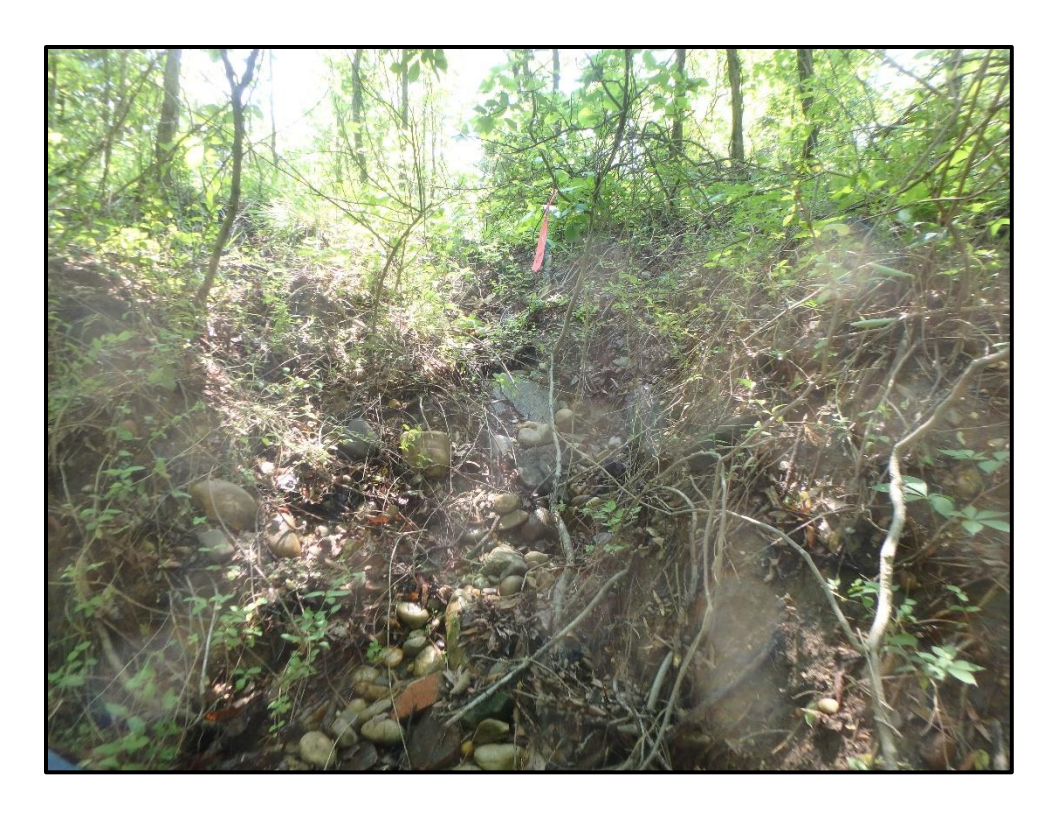
Waters 3CCC – Ephemeral