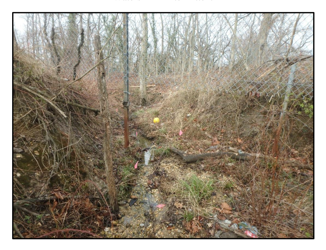
Waters 1A – Intermittent