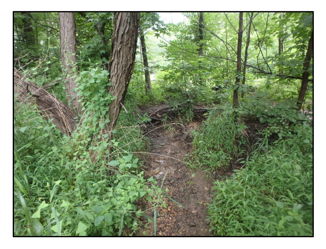
Waters 6NN – Intermittent