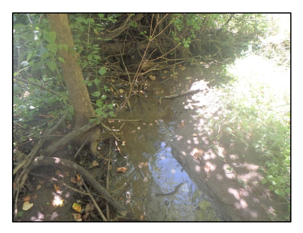
Waters 5H – Perennial