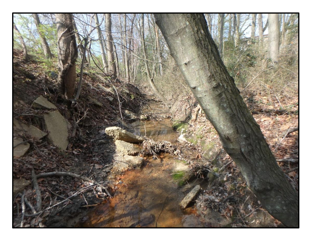
Waters 3DD – Perennial