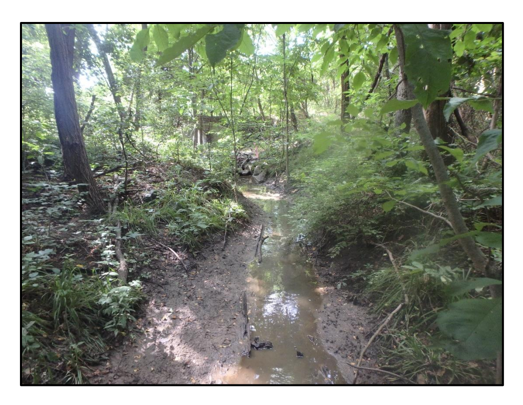
Waters 6BB – Intermittent