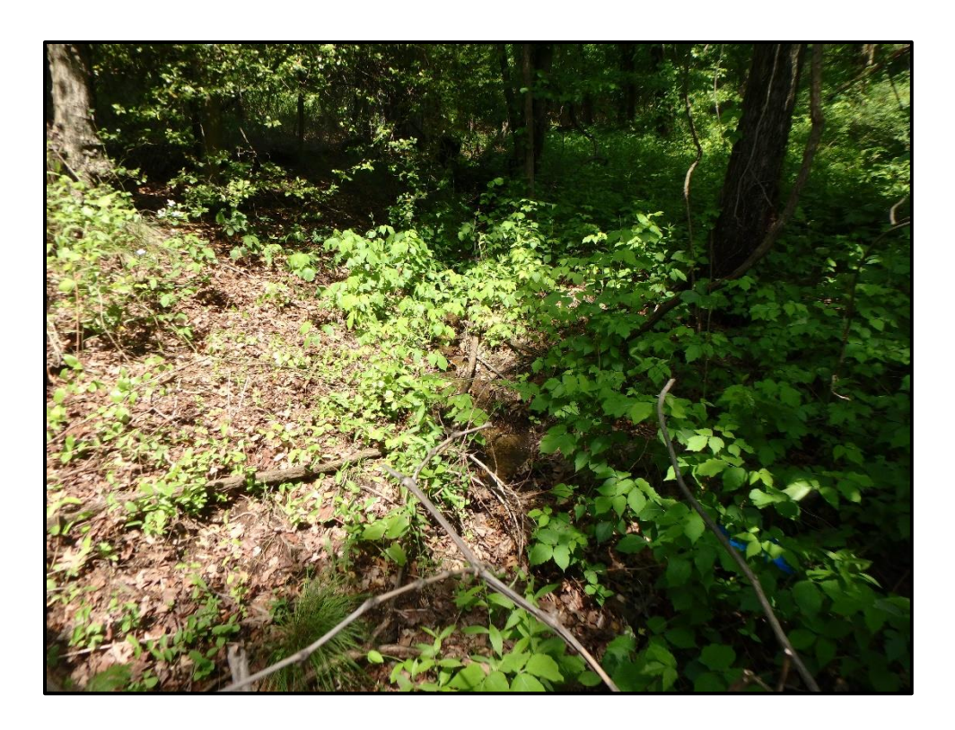
Waters 3F – Ephemeral