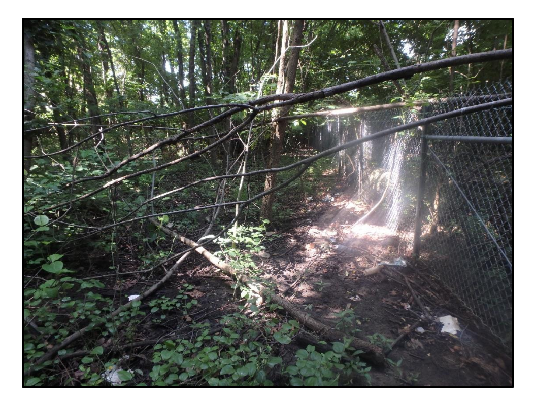
Wetland 6CC – PFO