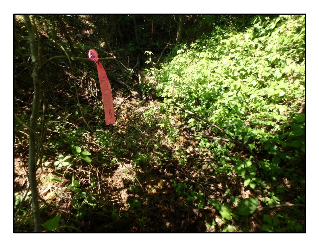
Waters 3EEE – Ephemeral