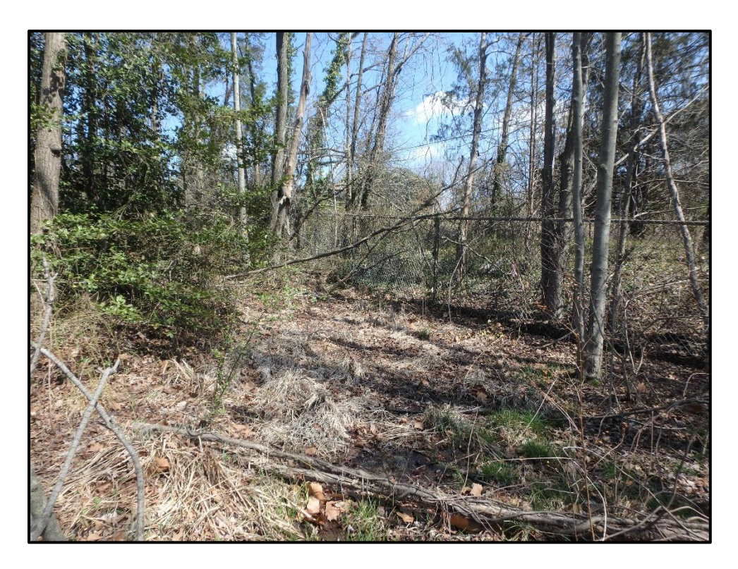
Wetland 3G – PFO