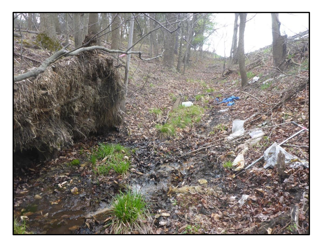
Wetland 4D – PFO