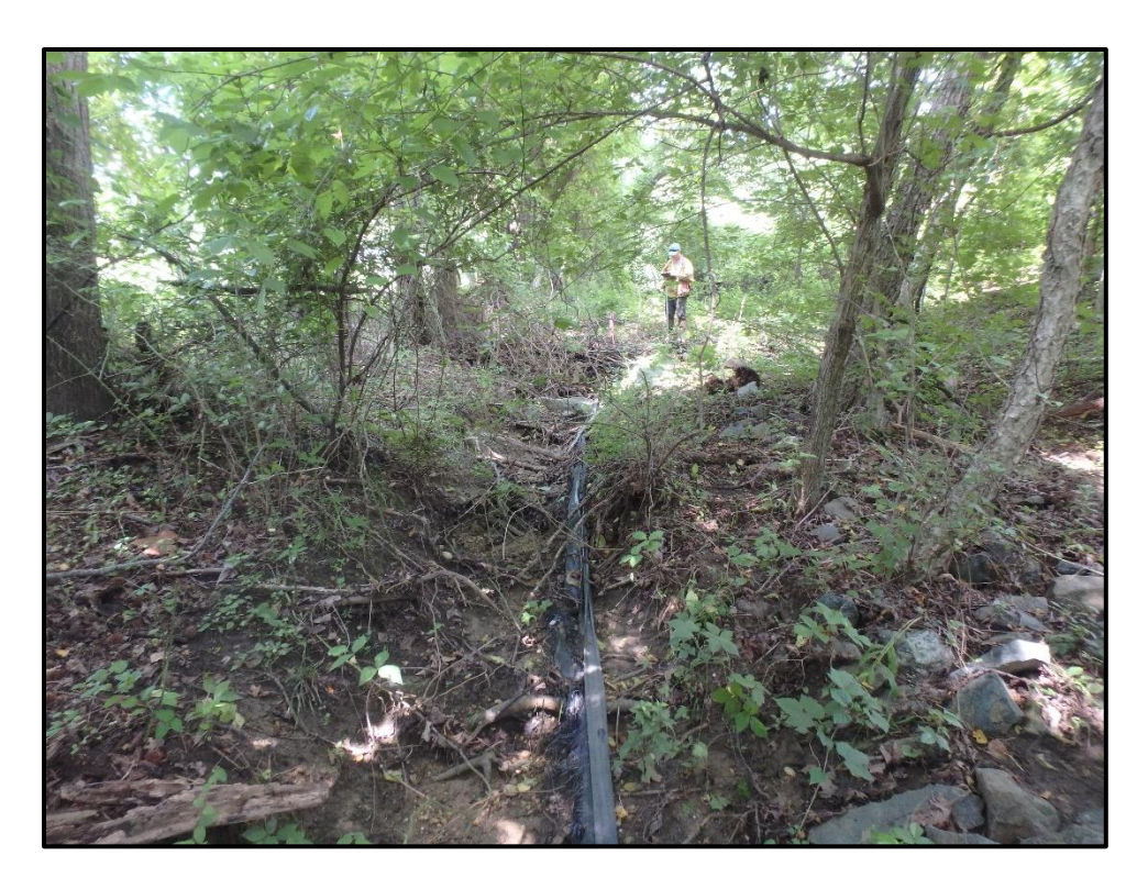
Waters 6UUU – Intermittent