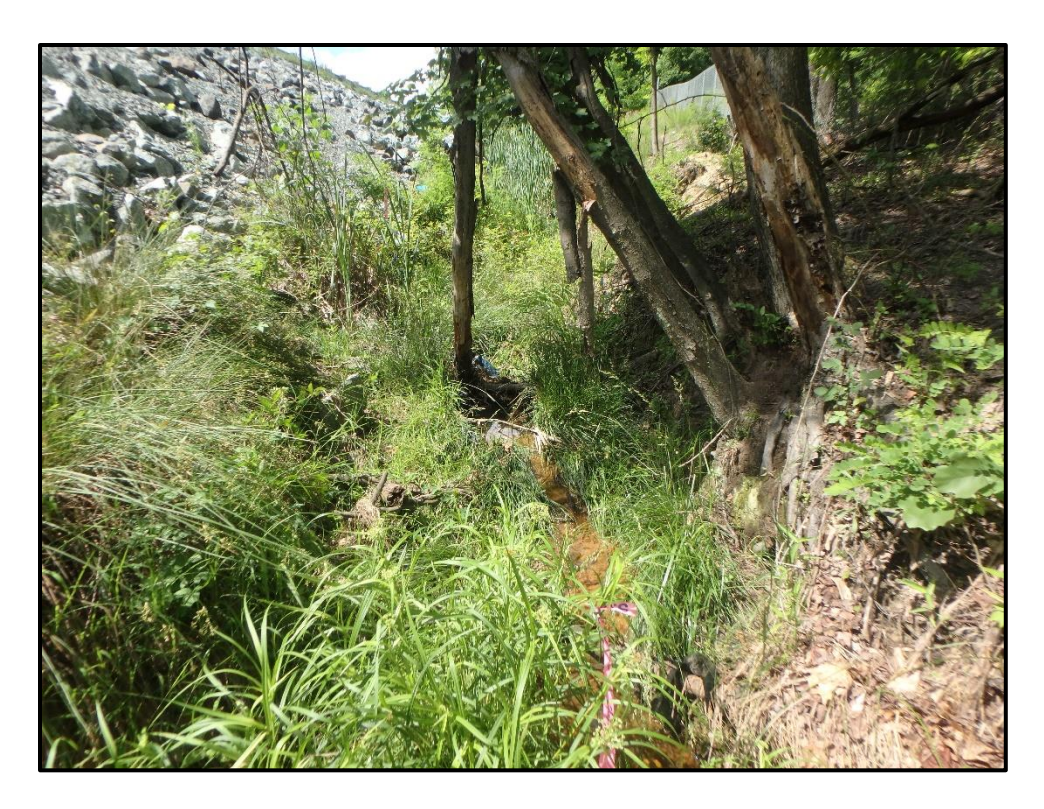
Waters 4BBB – Perennial