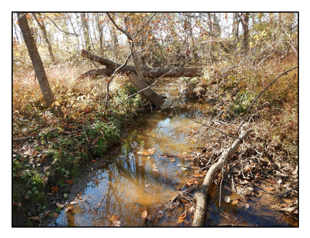
Waters 5MM – Intermittent