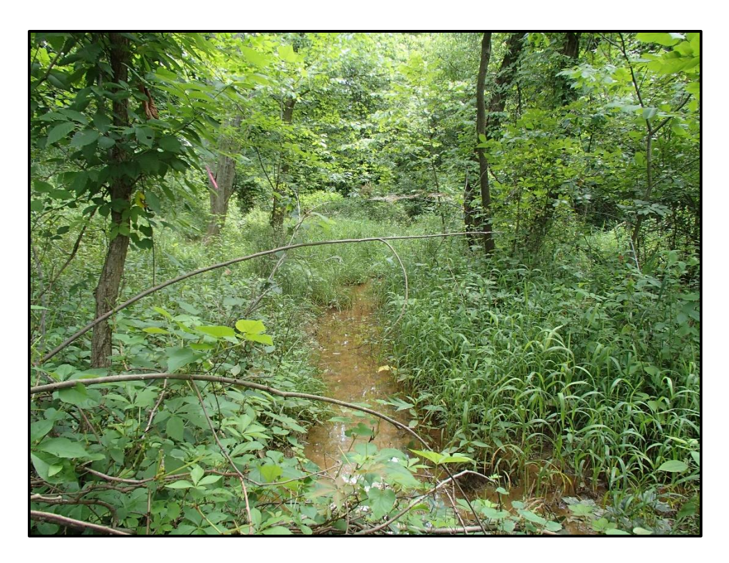
Waters 6NNN – Intermittent