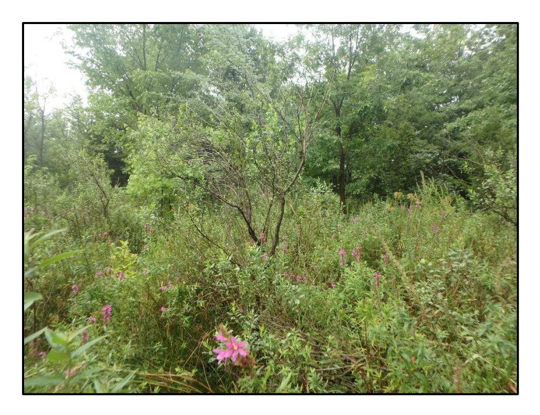
Wetland \ 5AA-PSS