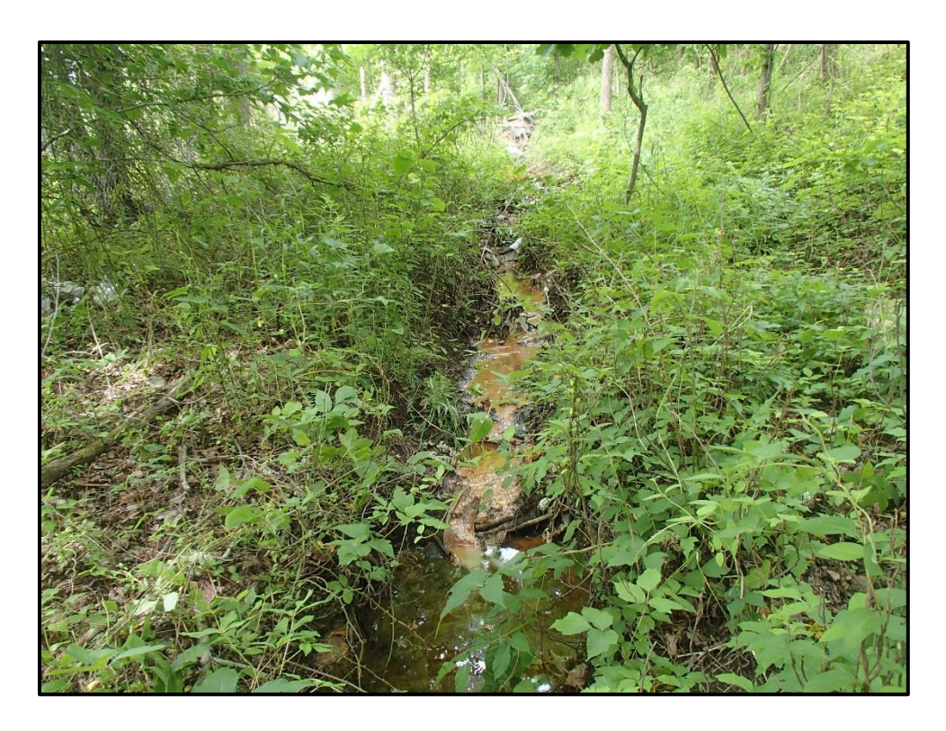
Waters 4QQQQ – Intermittent