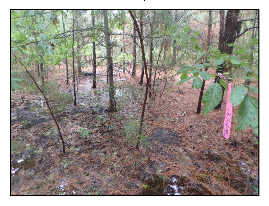
Wetland 5Z – PFO