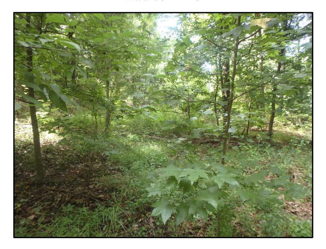
Wetland 5A – PFO