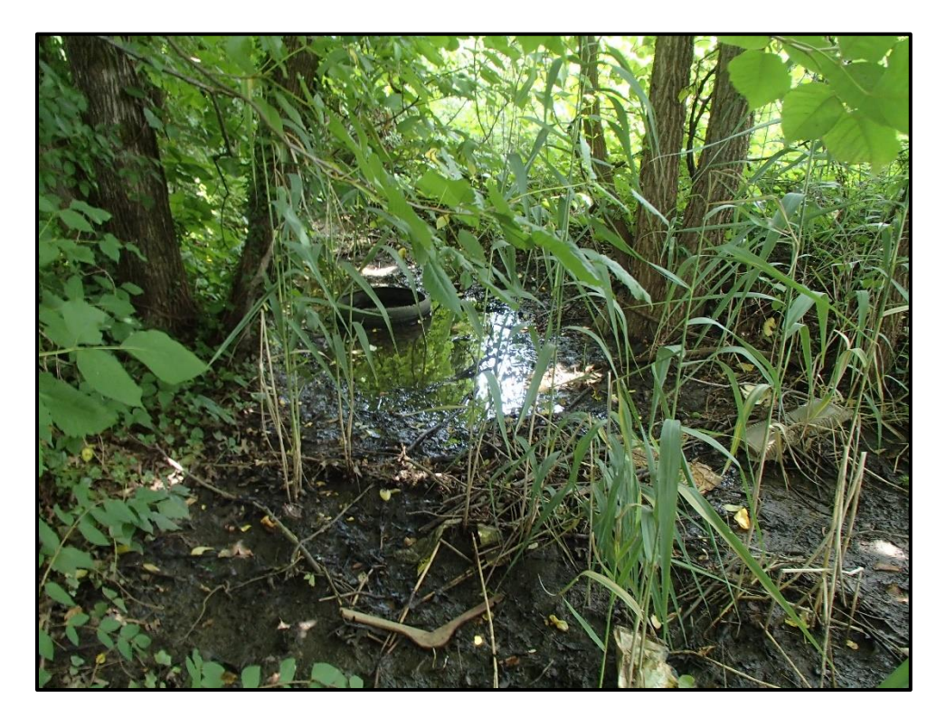
Wetland 6PPP – PFO