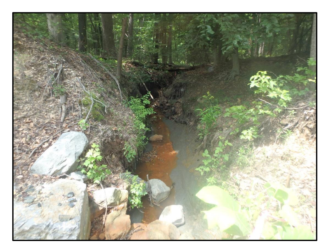
Waters 4JJJJ – Perennial