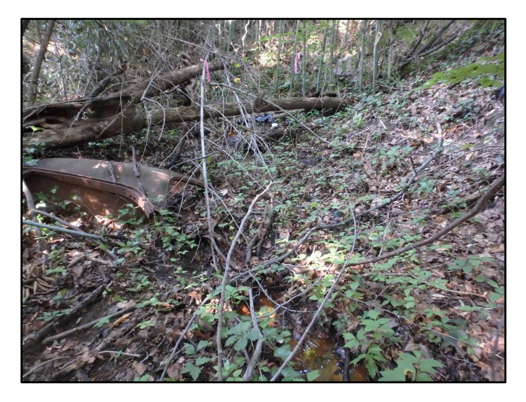
Wetland 1II – PFO