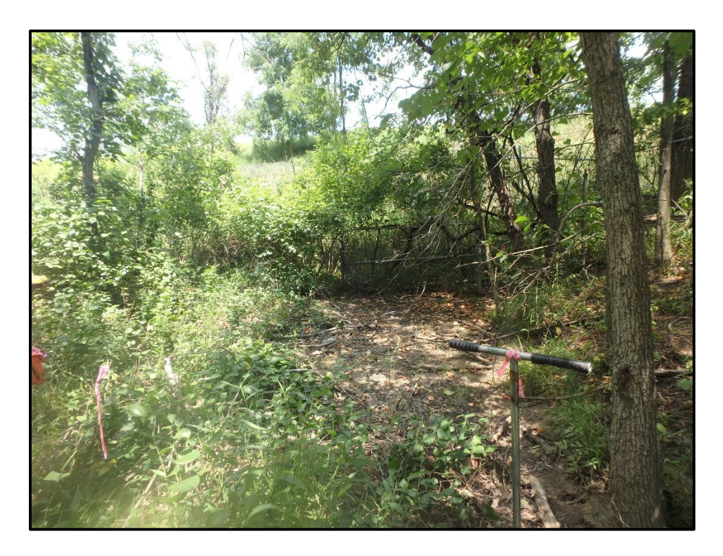
Wetland 7KK – PFO