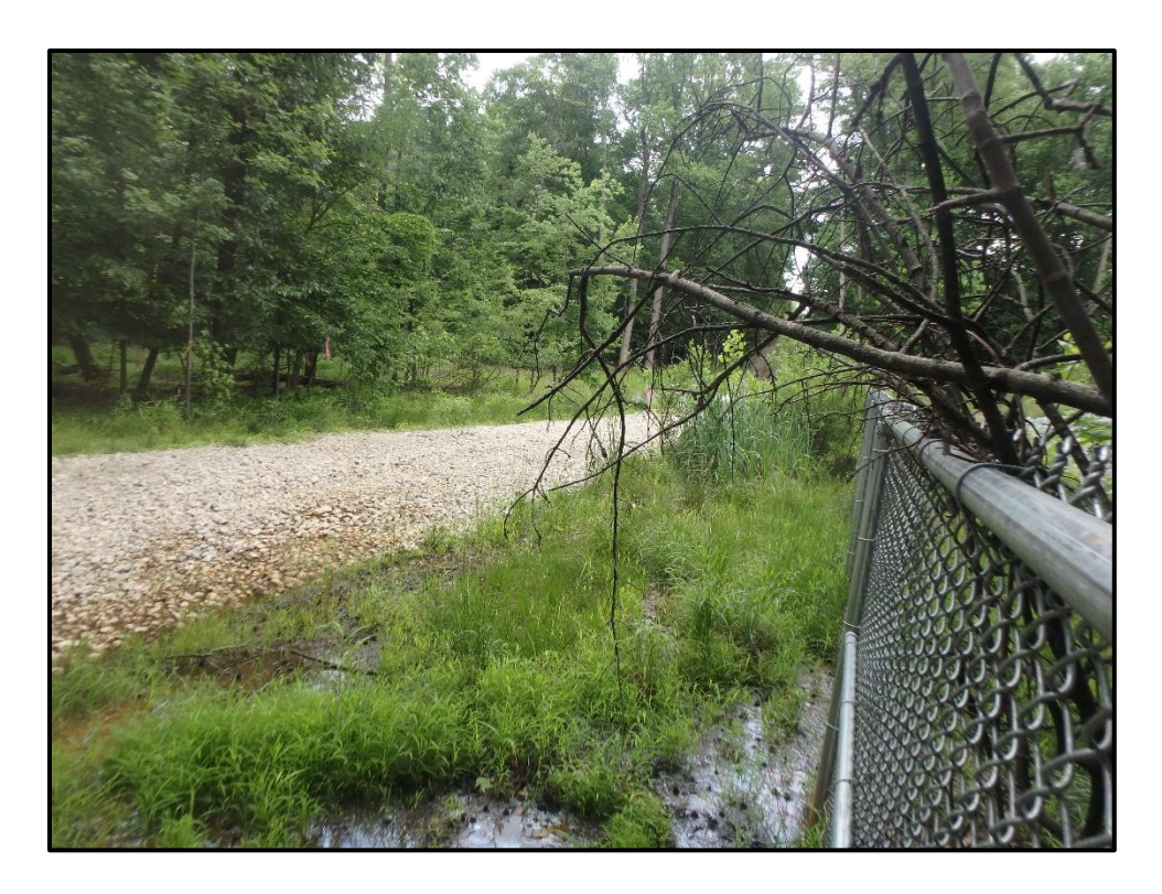
Wetland 4III – PEM