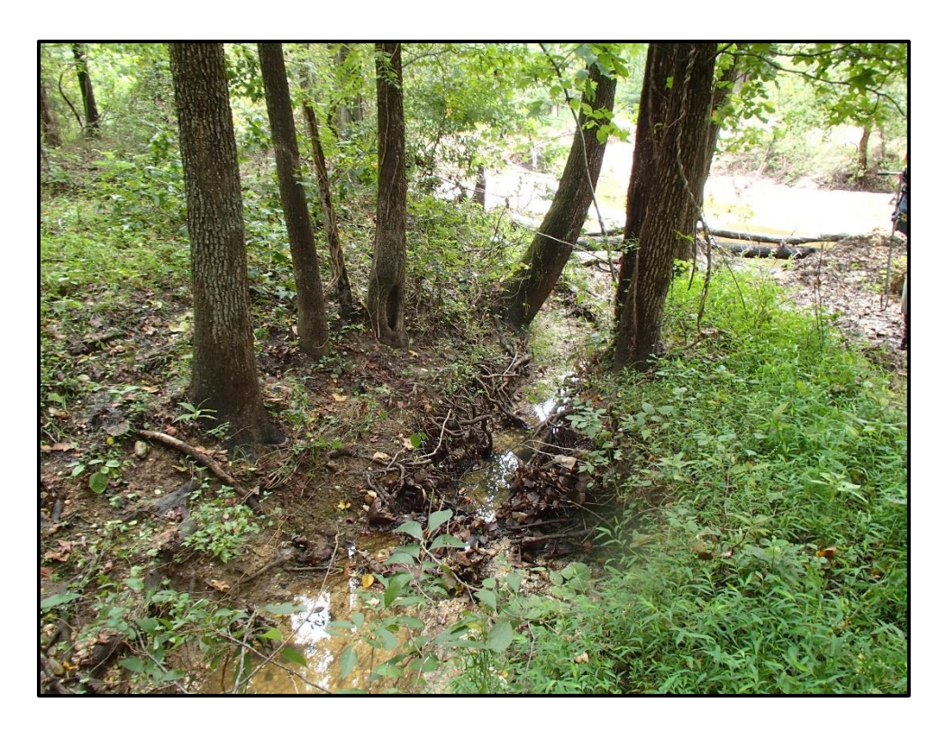
Waters 1XX – Intermittent