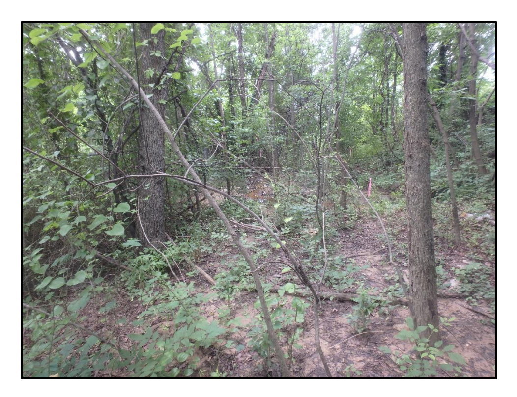
Wetland 6Y - PFO