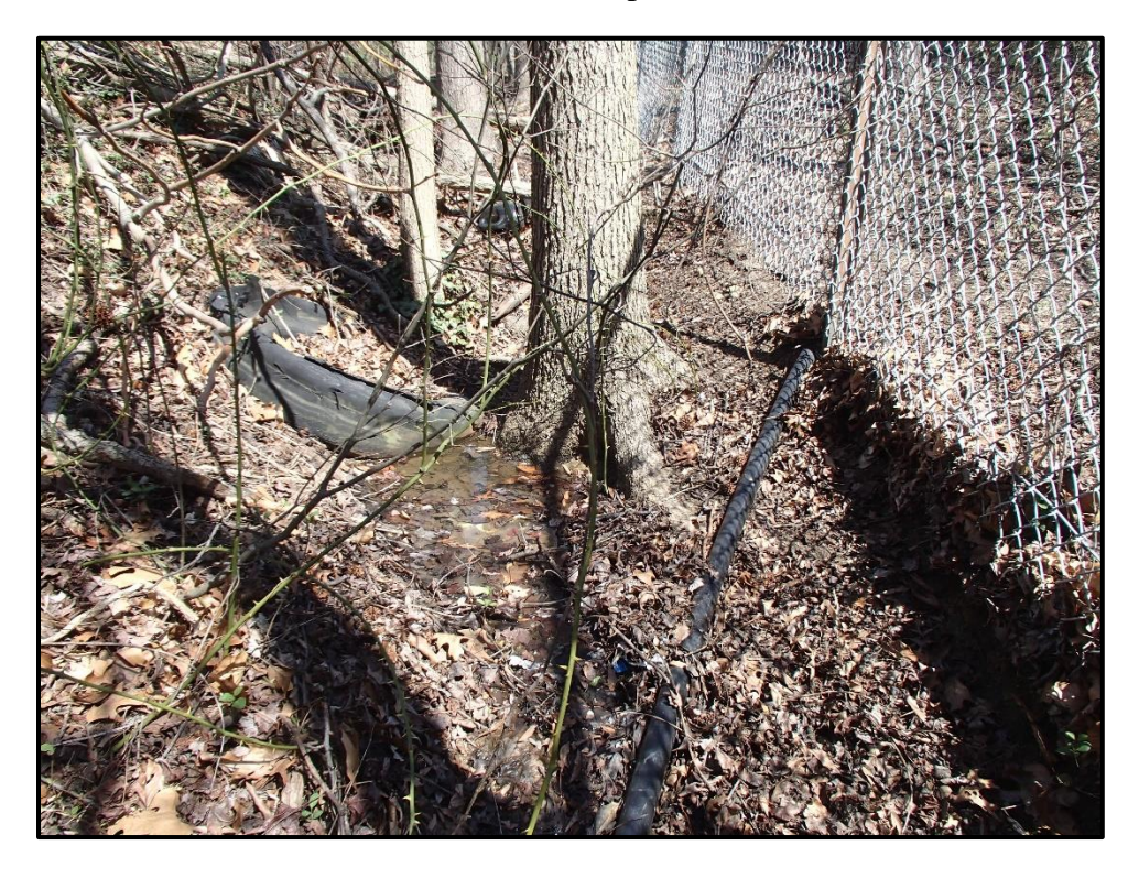
Waters 3F – Ephemeral