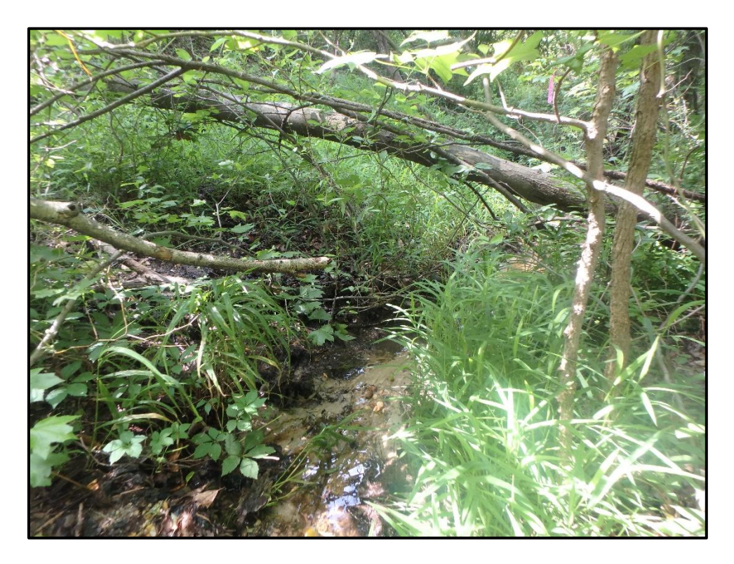
Waters 4RRR – Intermittent