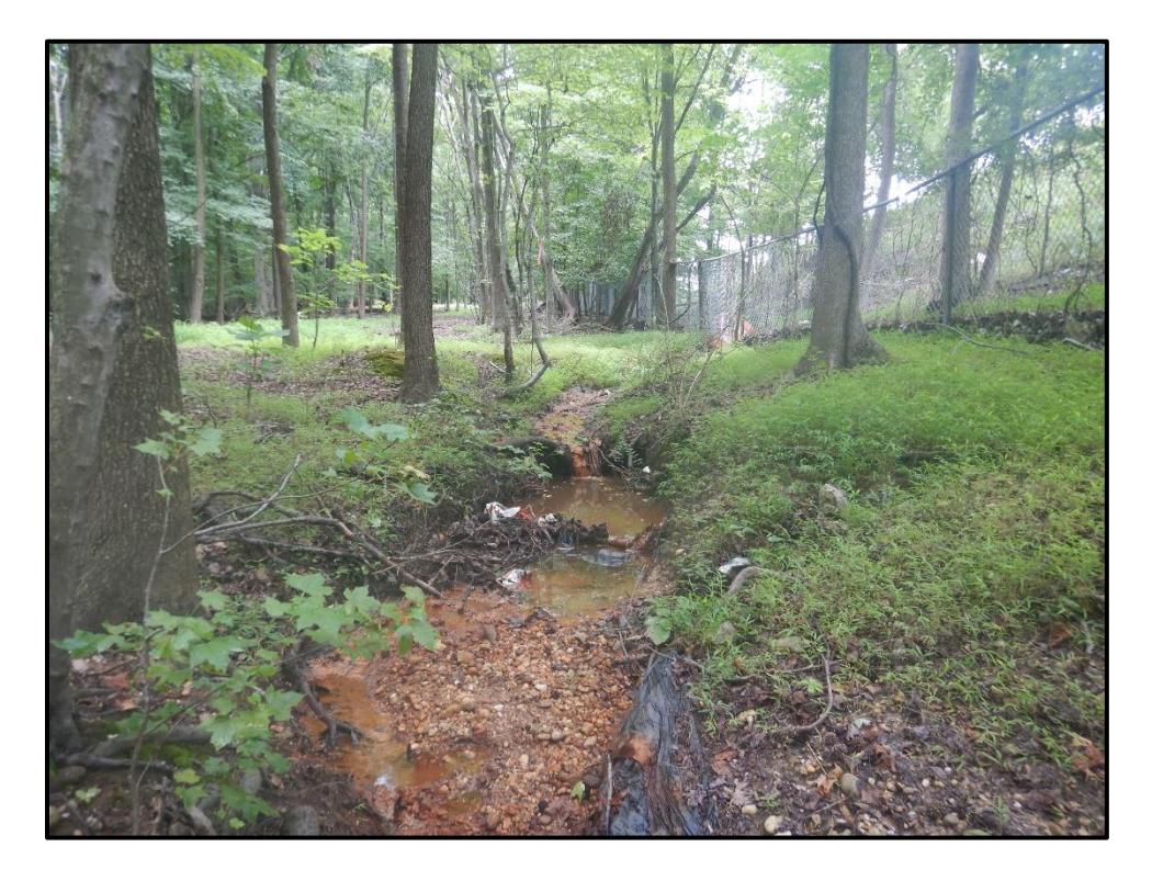
Waters 2E – Intermittent