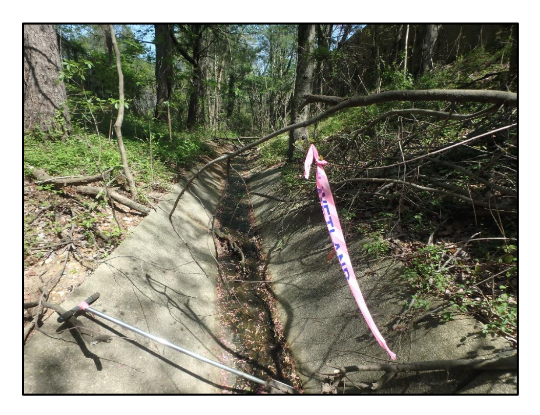
Waters 2W - Intermittent