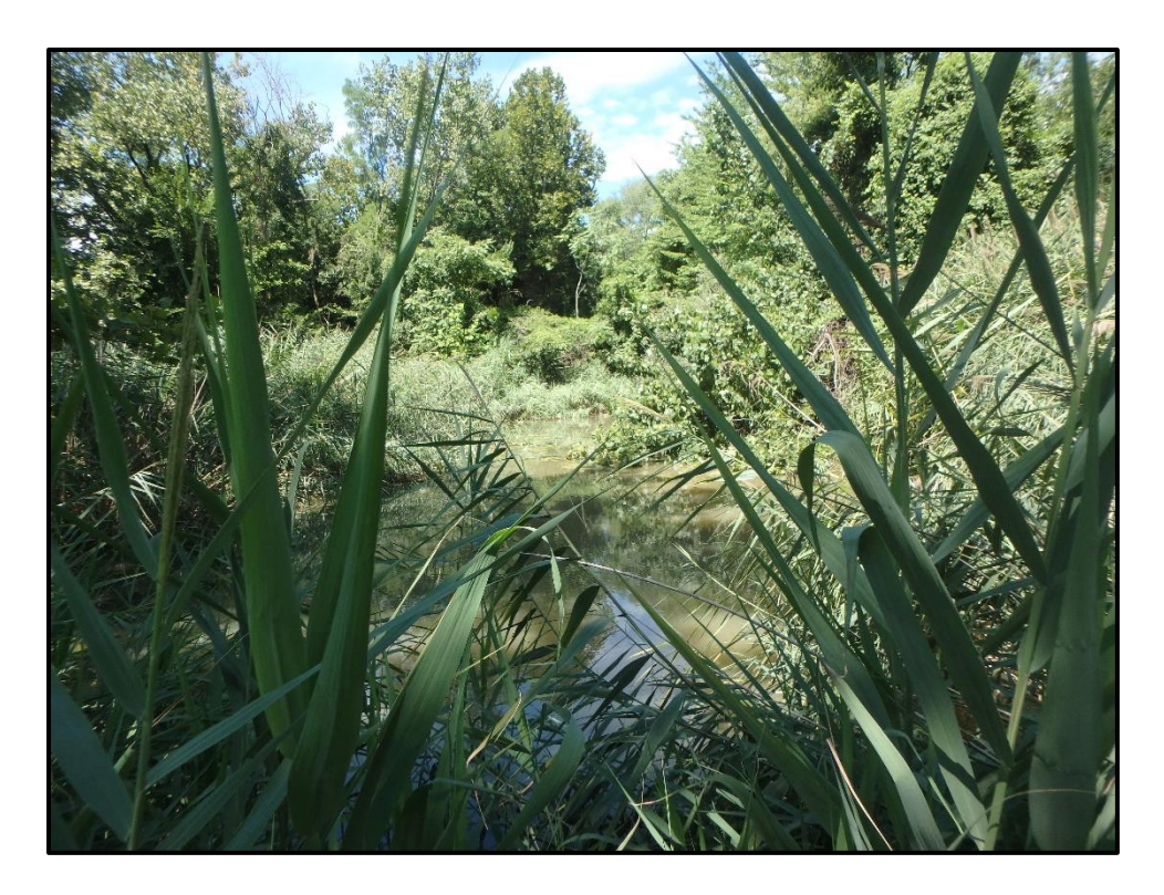
Waters 1GG - POW