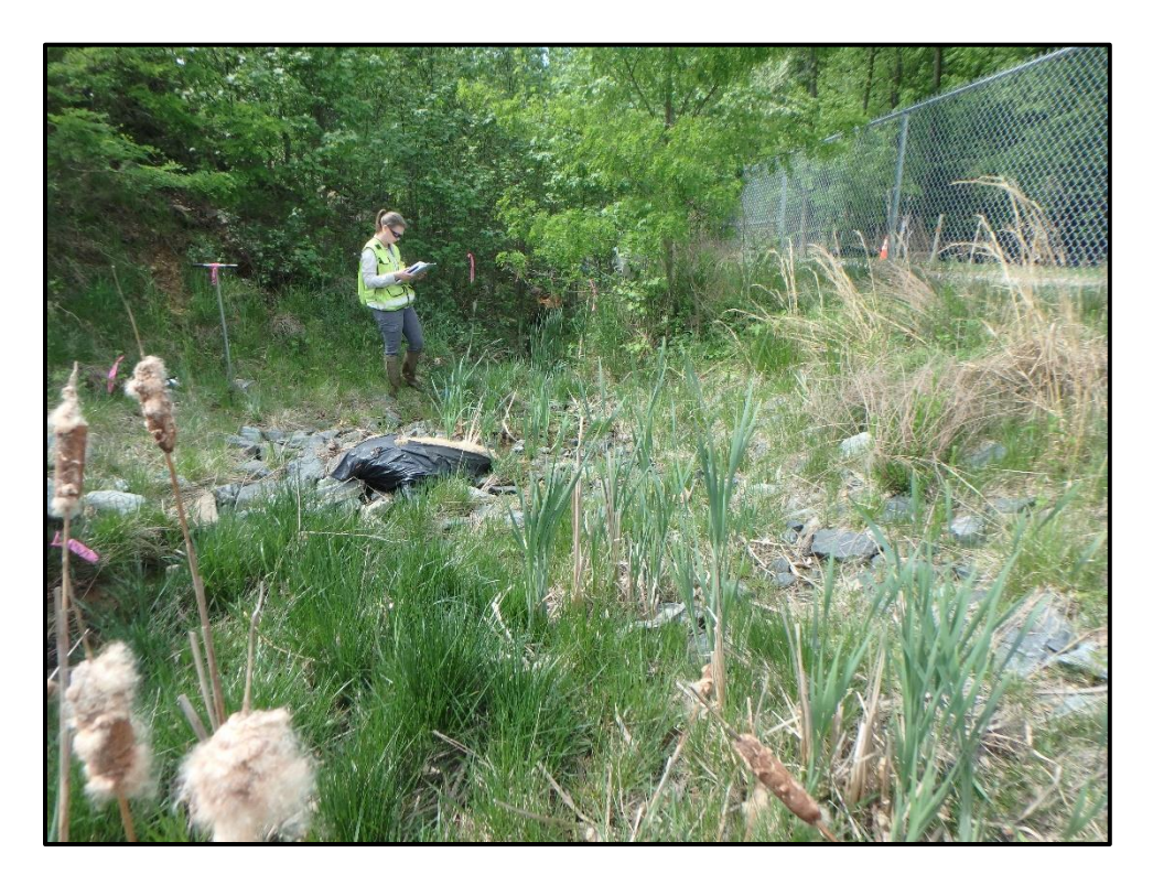
Wetland 4DD – PEM