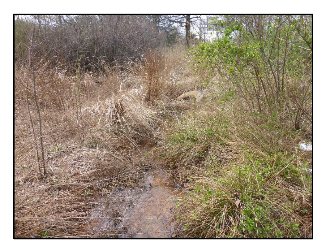
Waters 2L – Intermittent