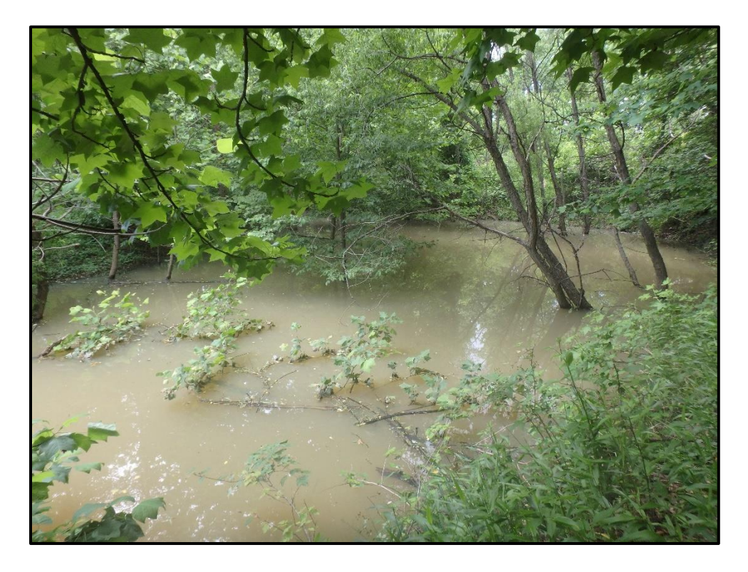
Wetland 4WW – PFO