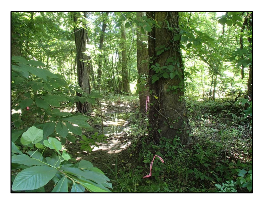
Wetland 6Q - PFO