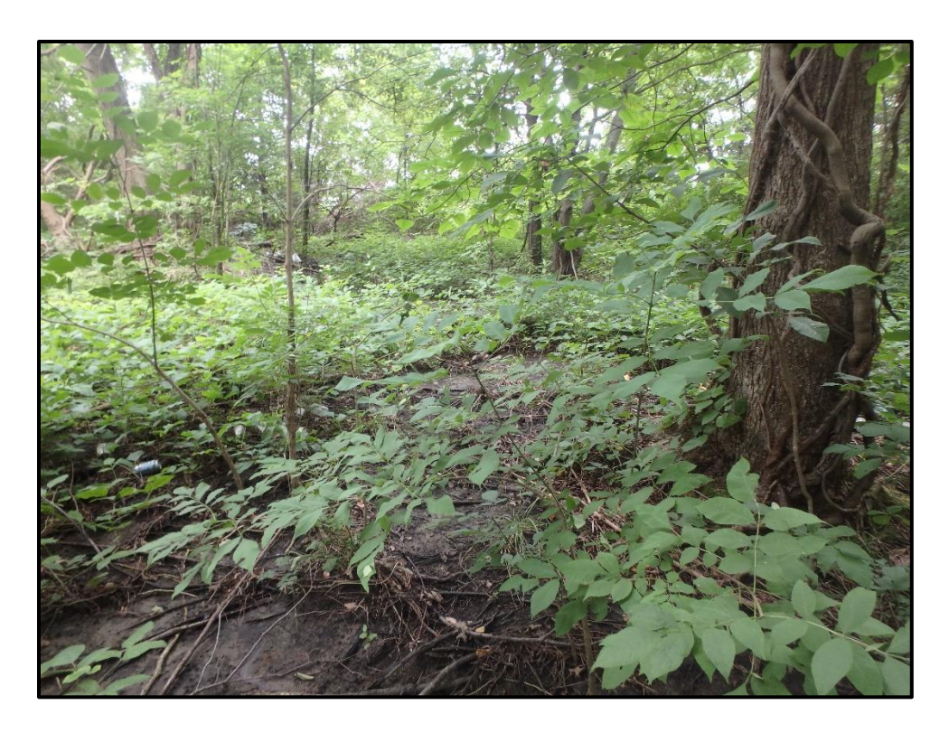
Wetland 6VV – PFO