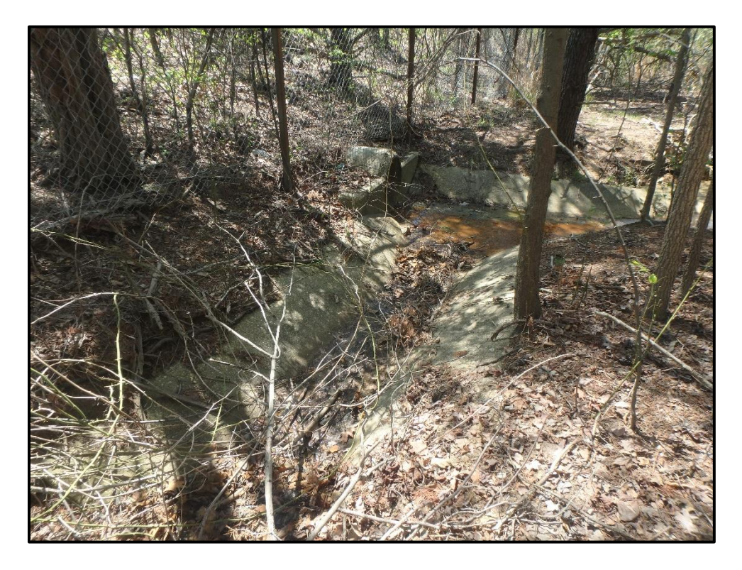
Waters 2AA – Intermittent