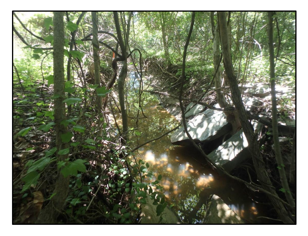
Waters 6B – Perennial