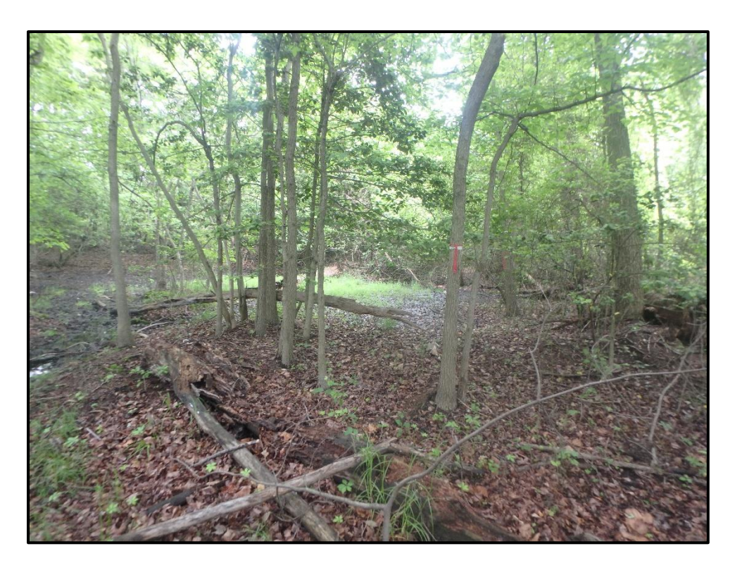
Wetland 3RRR – PFO