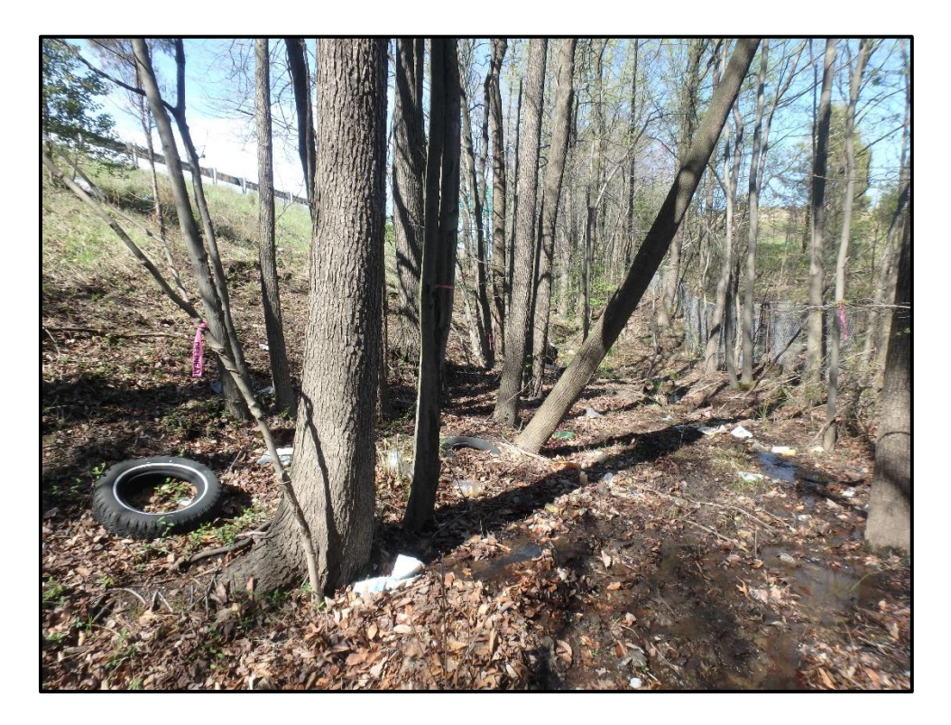
Wetland 4V - PFO