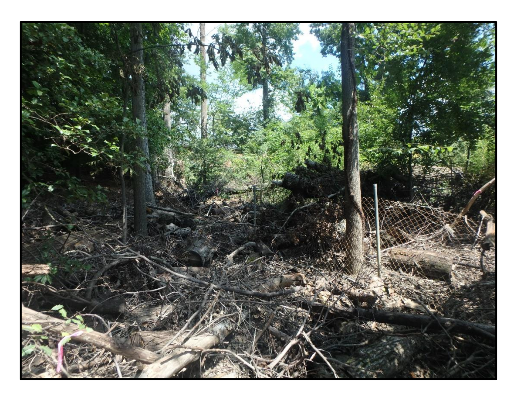
Wetland 1CC – PFO