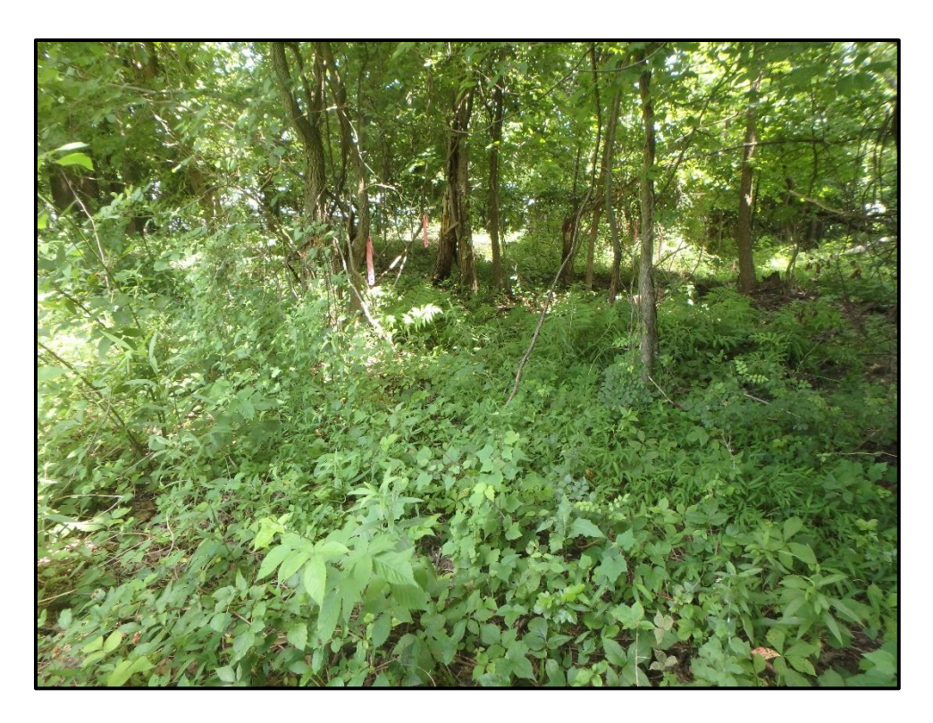
Wetland 6VVV – PFO