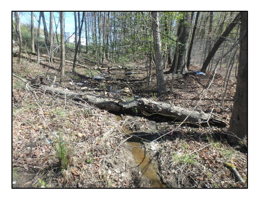
Waters 40 – Intermittent