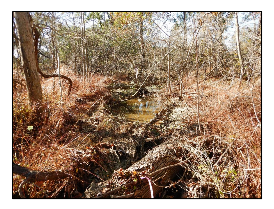
Waters 5NN – Intermittent