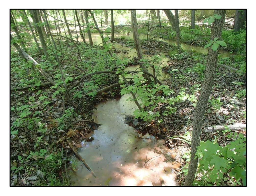
Waters 4AA – Intermittent