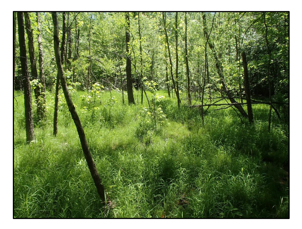
Wetland 4II – PFO