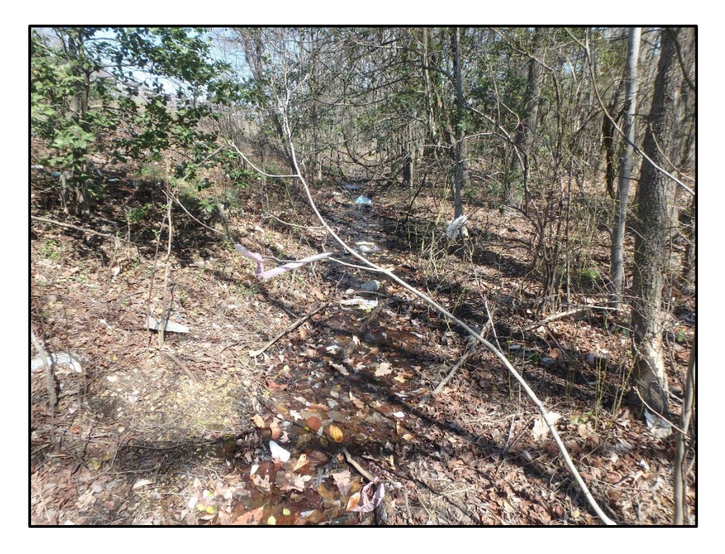
Waters 3H – Intermittent