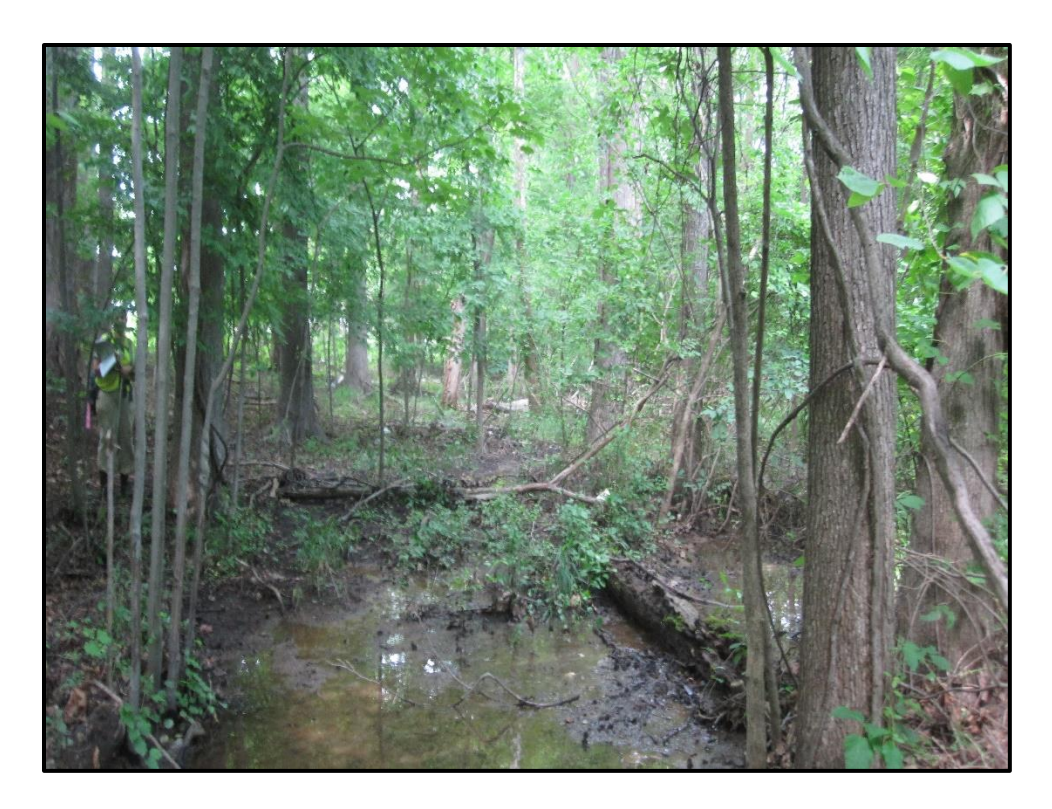
Wetland 6LL – PFO