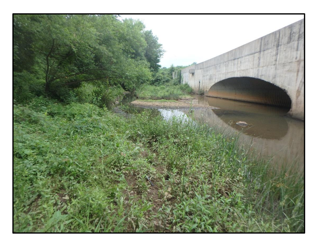
Wetland 6H – PEM