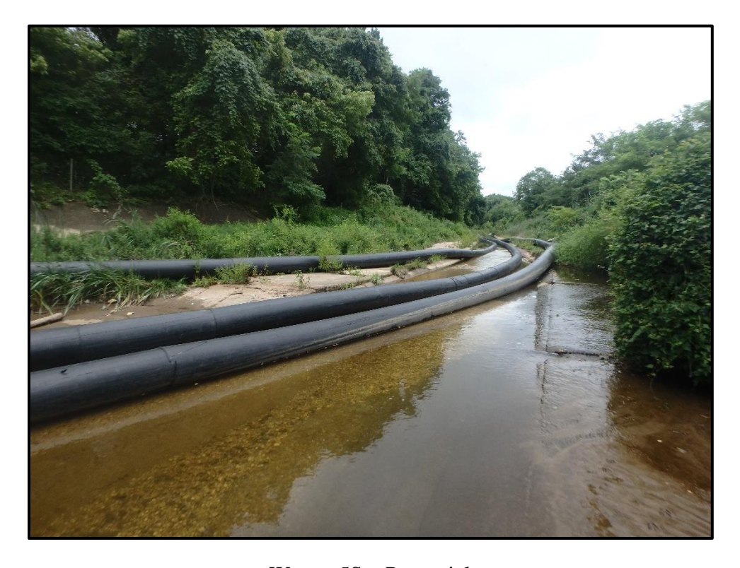
Waters 5S – Perennial