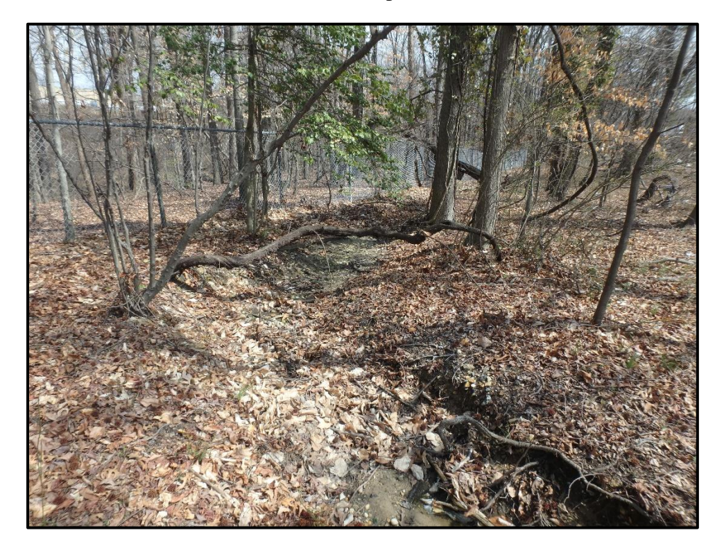
Waters 1Y – Ephemeral