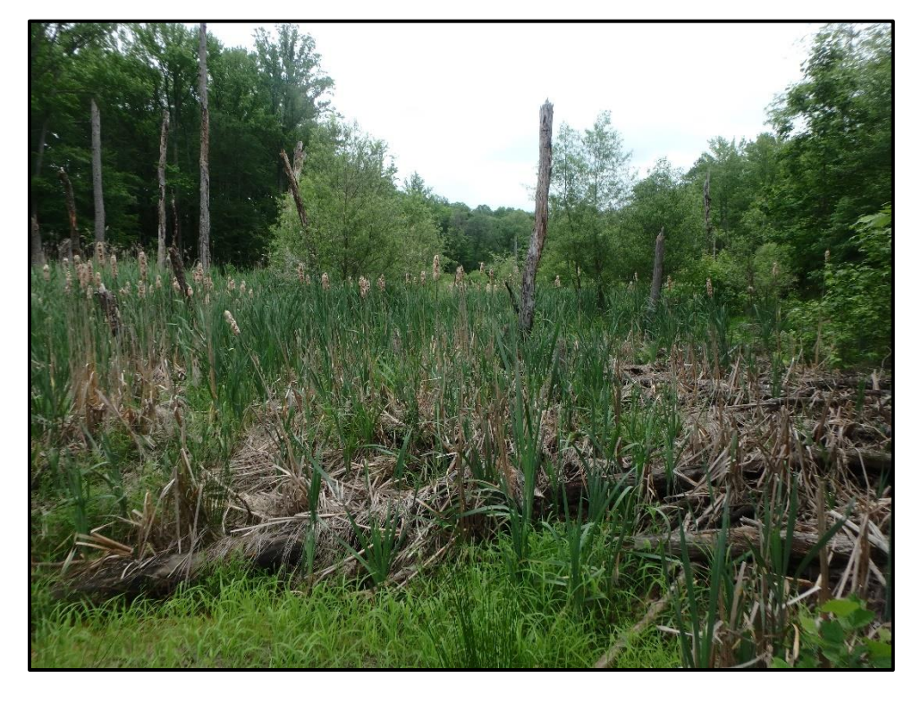
Wetland 4SS – PEM