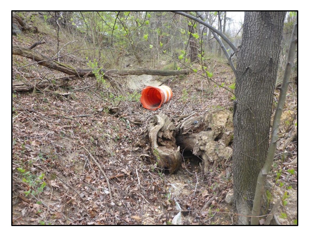
Waters 3BB – Ephemeral