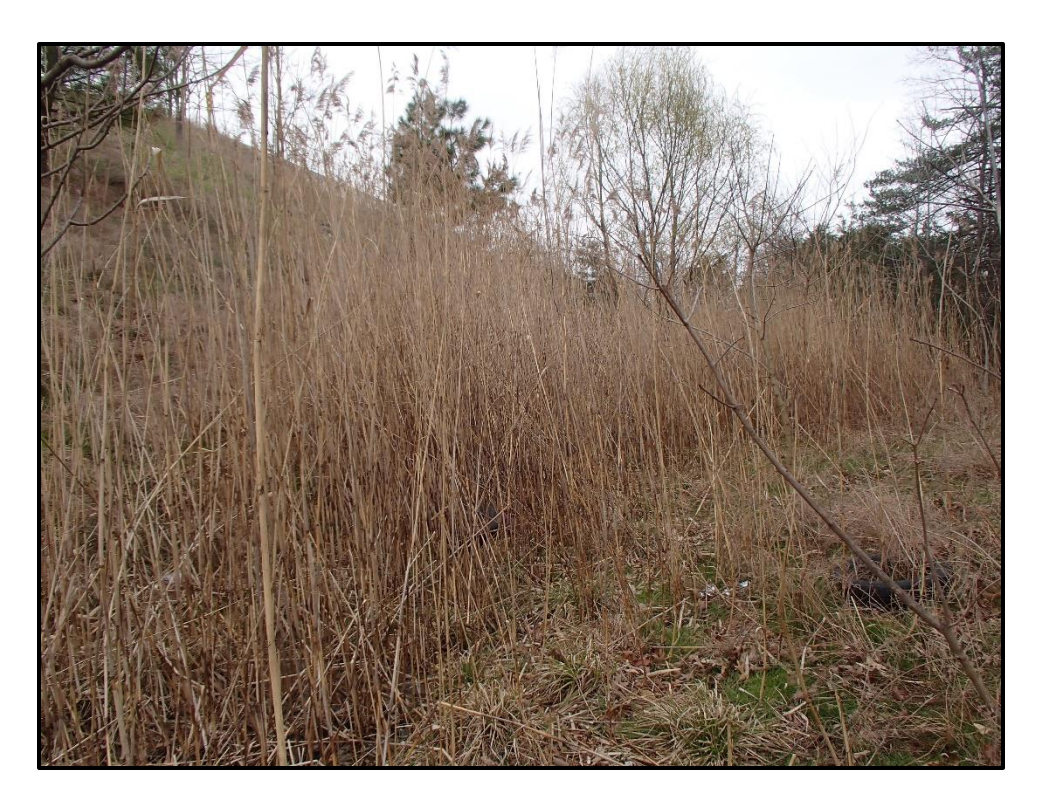
Wetland 1T – PSS