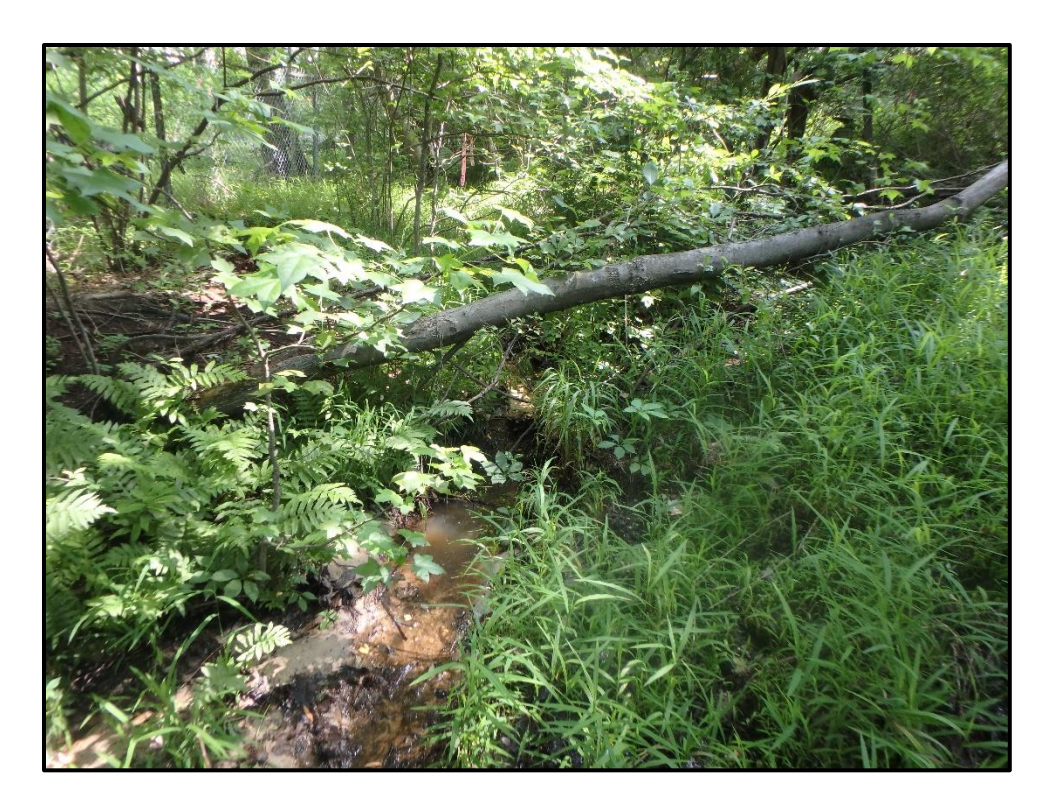
Waters 4RRR – Intermittent