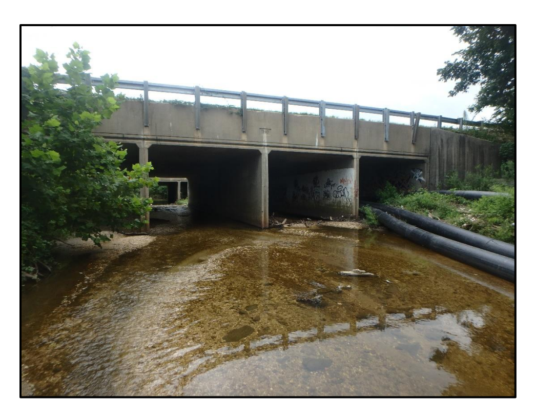
Waters 5S – Perennial