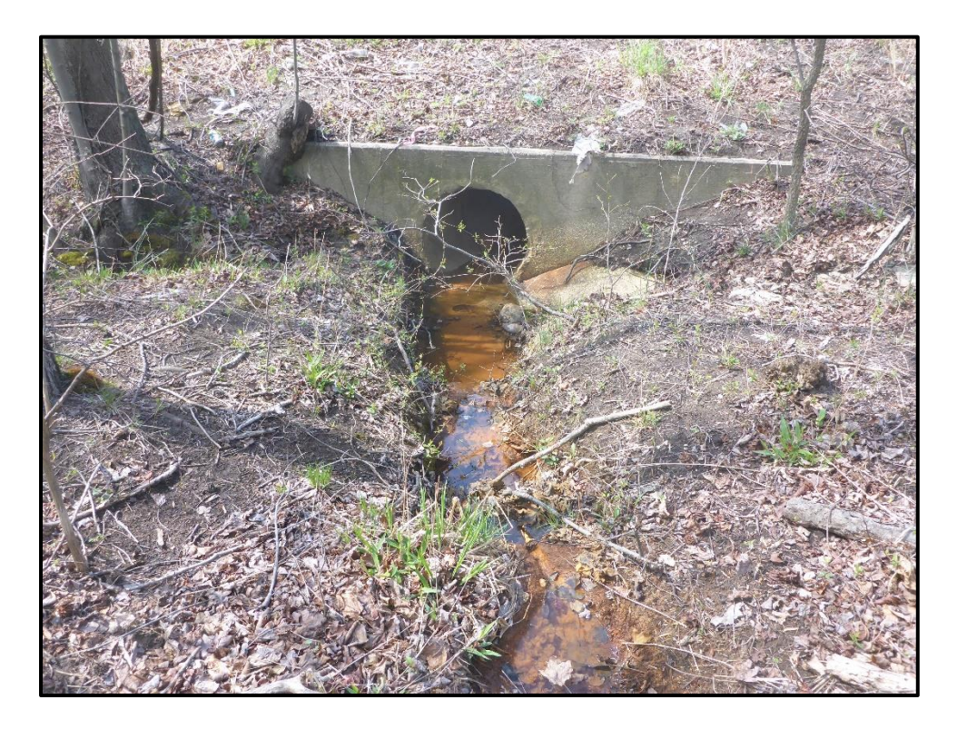
Waters 4E – Intermittent