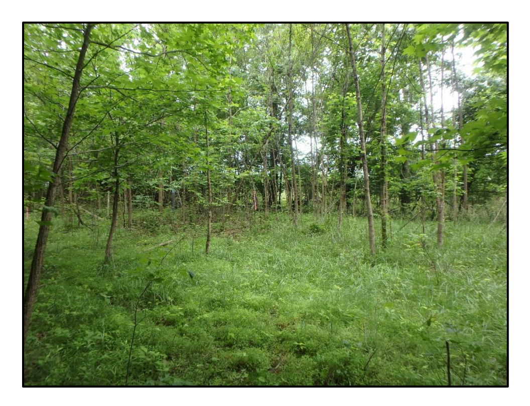
Wetland 4KK – PFO