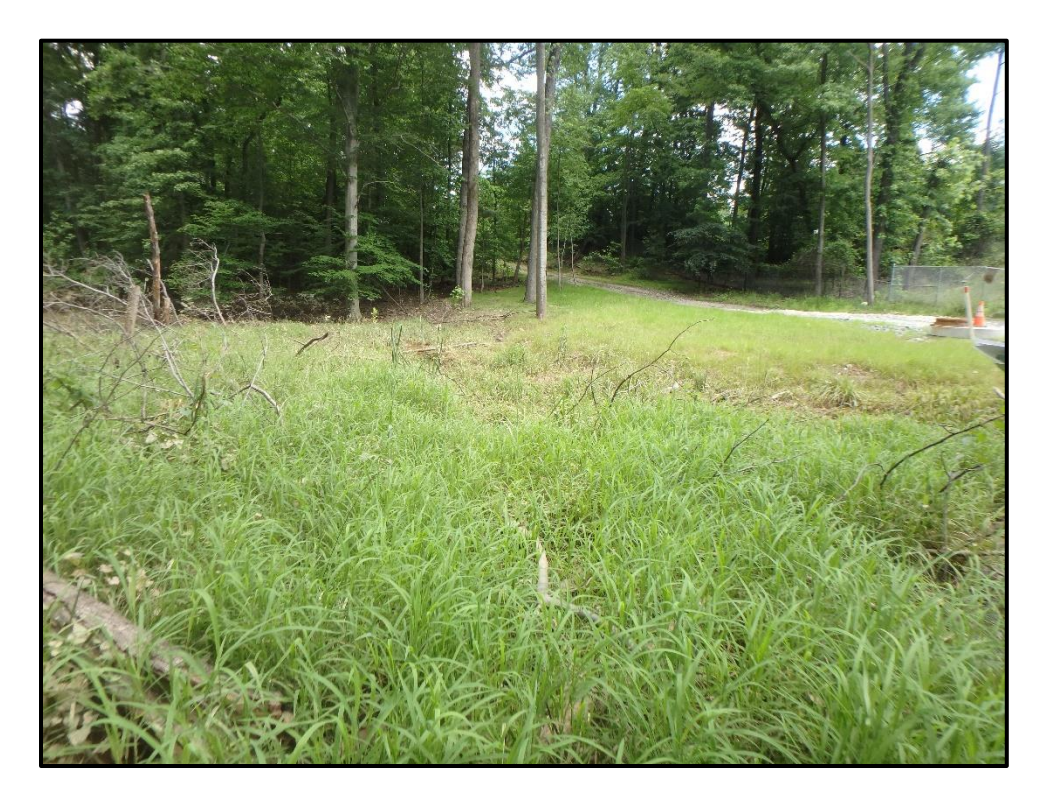
Wetland 4EEE – PEM