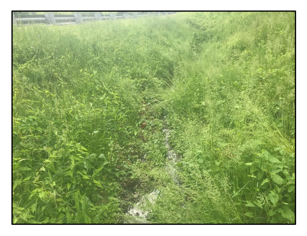
Waters 2YY – Intermittent