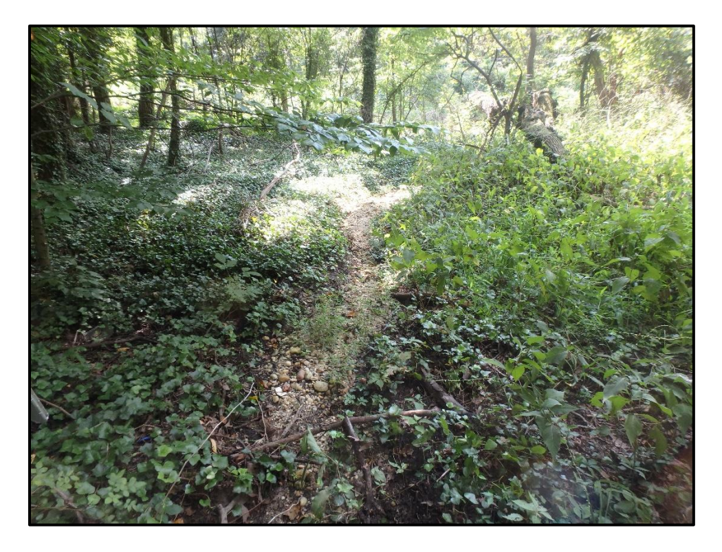
Waters 1PP – Ephemeral