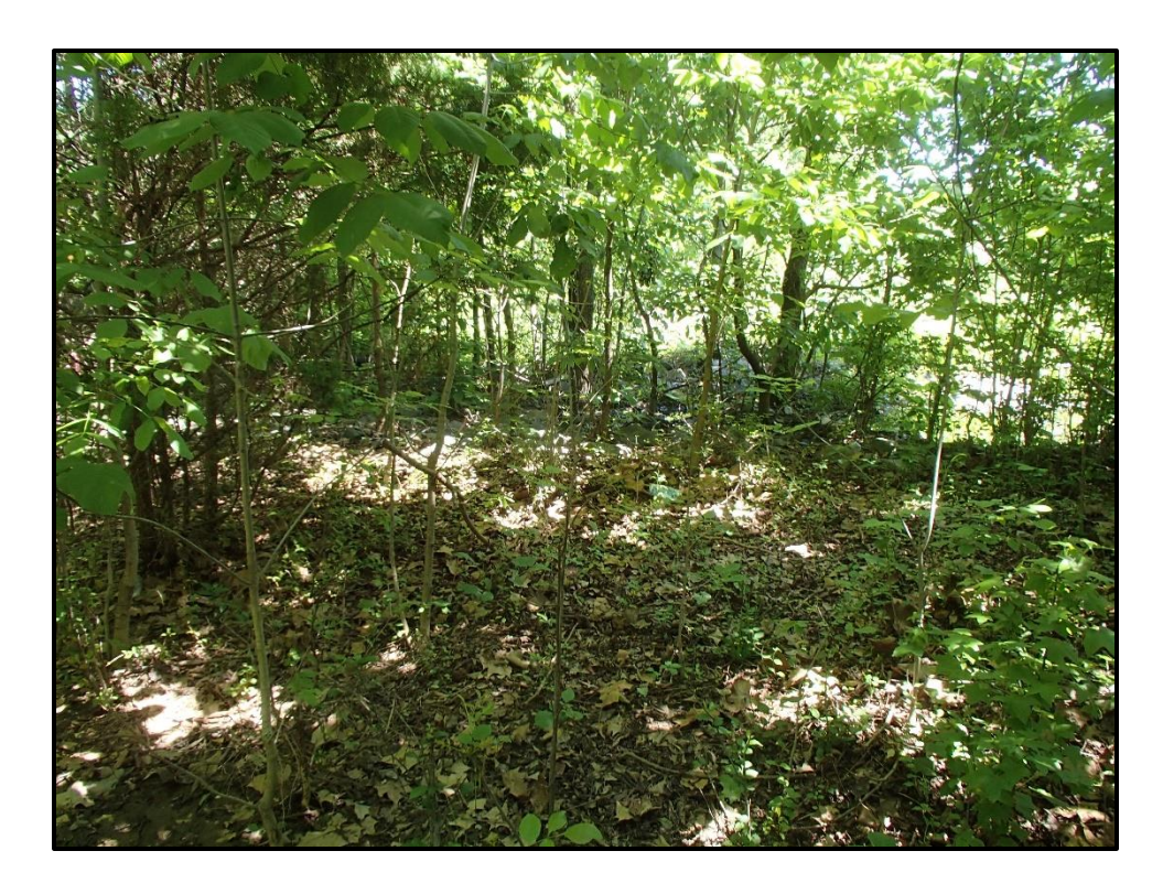
Wetland 4HH – PFO