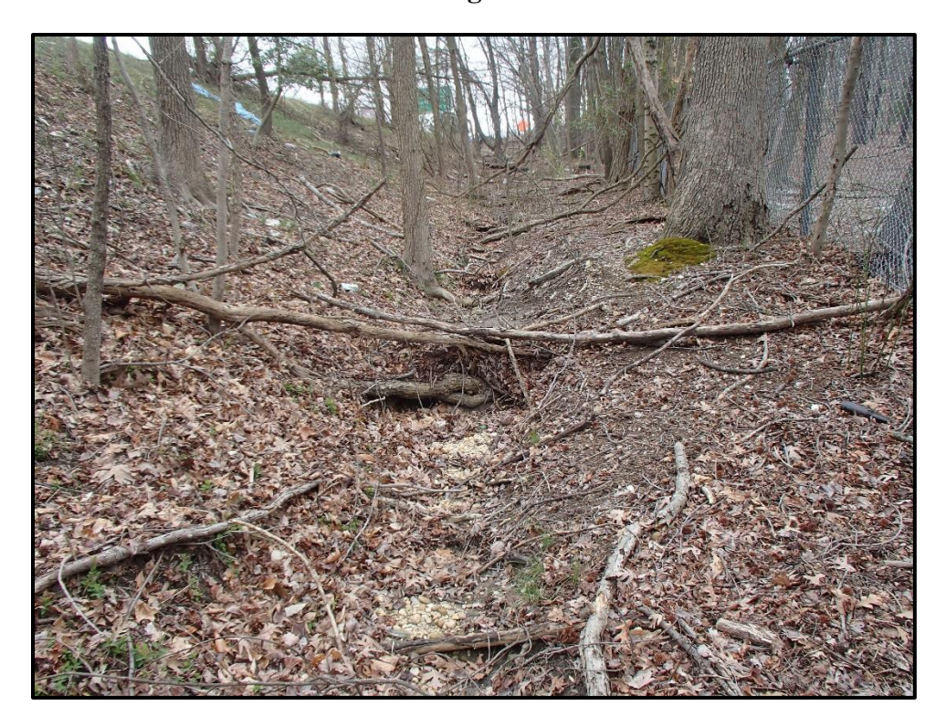
Waters 2A – Ephemeral