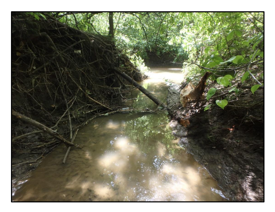
Waters 6M - Perennial