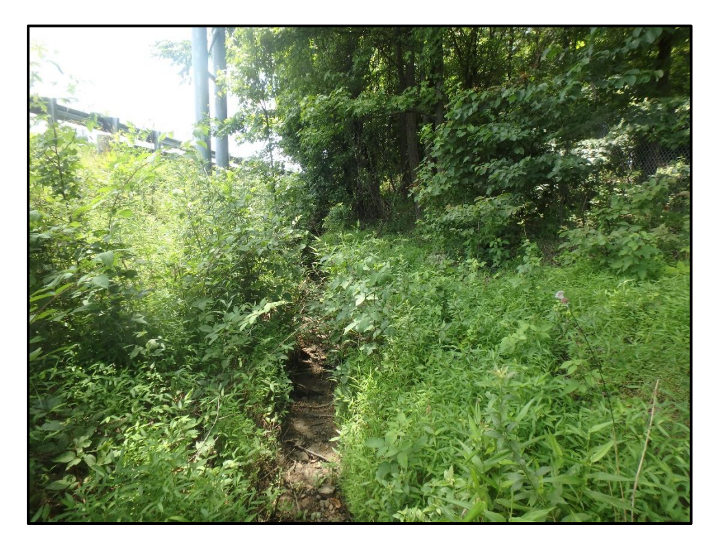
Waters 6TTT – Intermittent