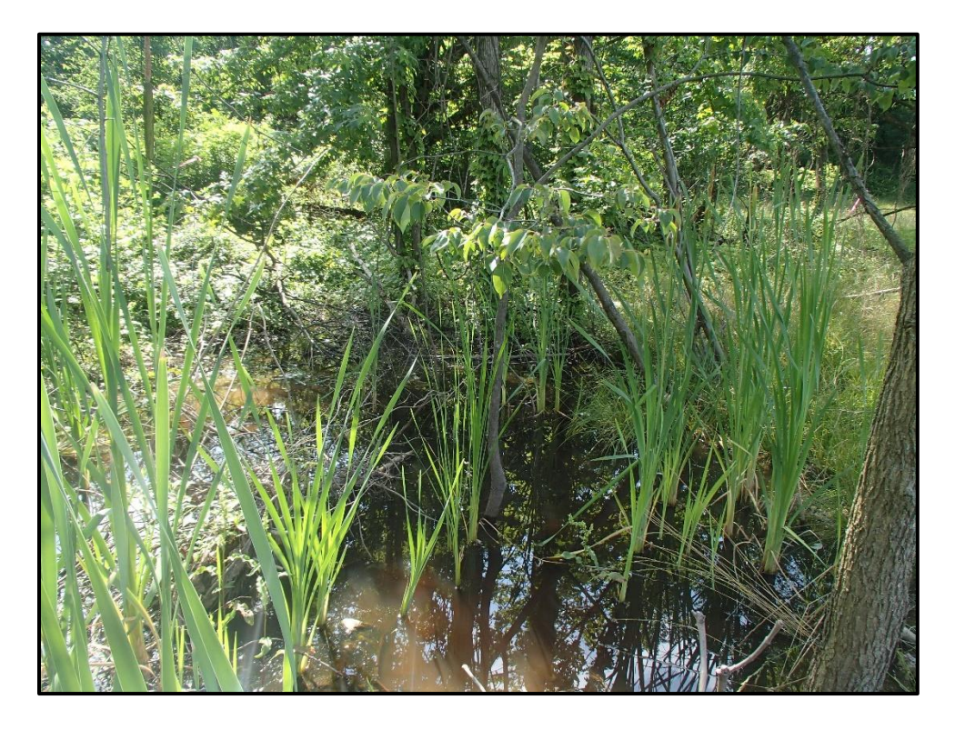
Wetland 4WWW – PFO