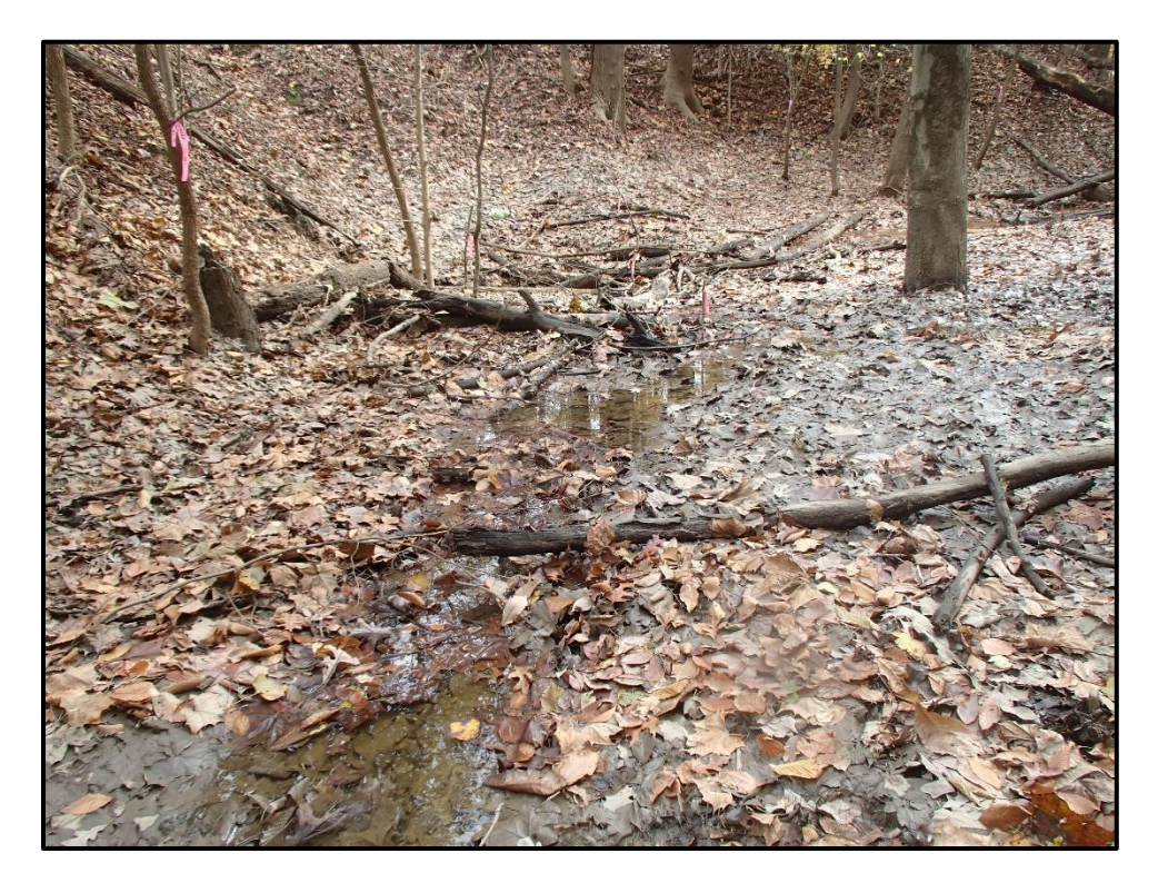
Waters 4UUUU – Intermittent