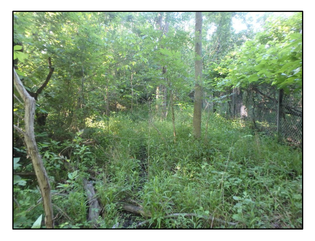
Wetland 6I – PFO