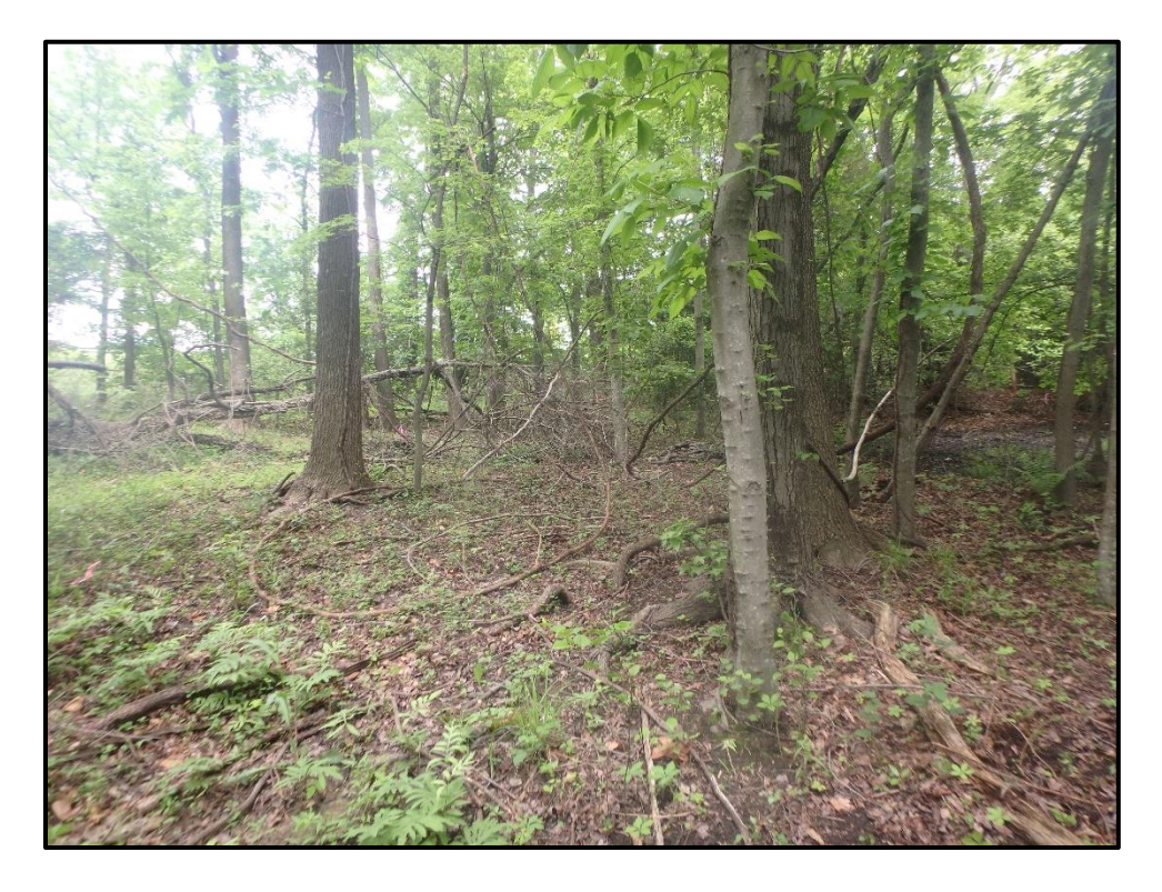
Wetland 3RRR – PFO