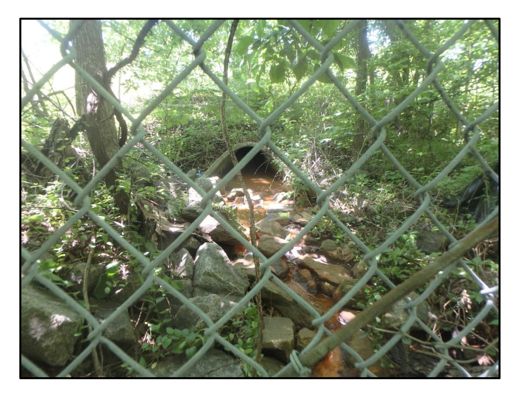
Waters 6D – Intermittent