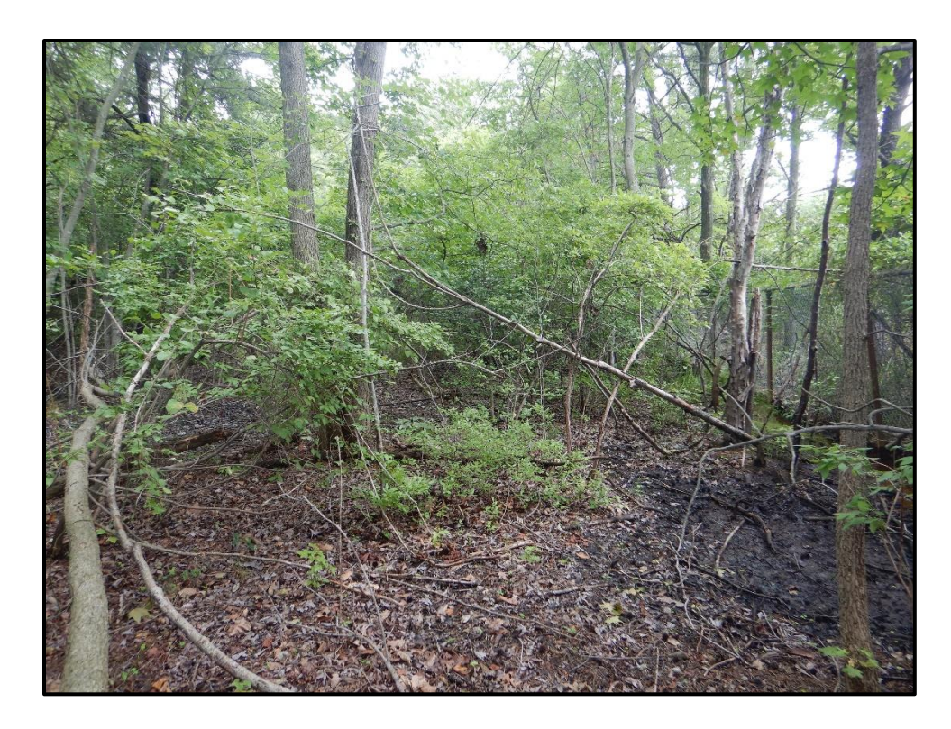
Wetland 2O - PFO