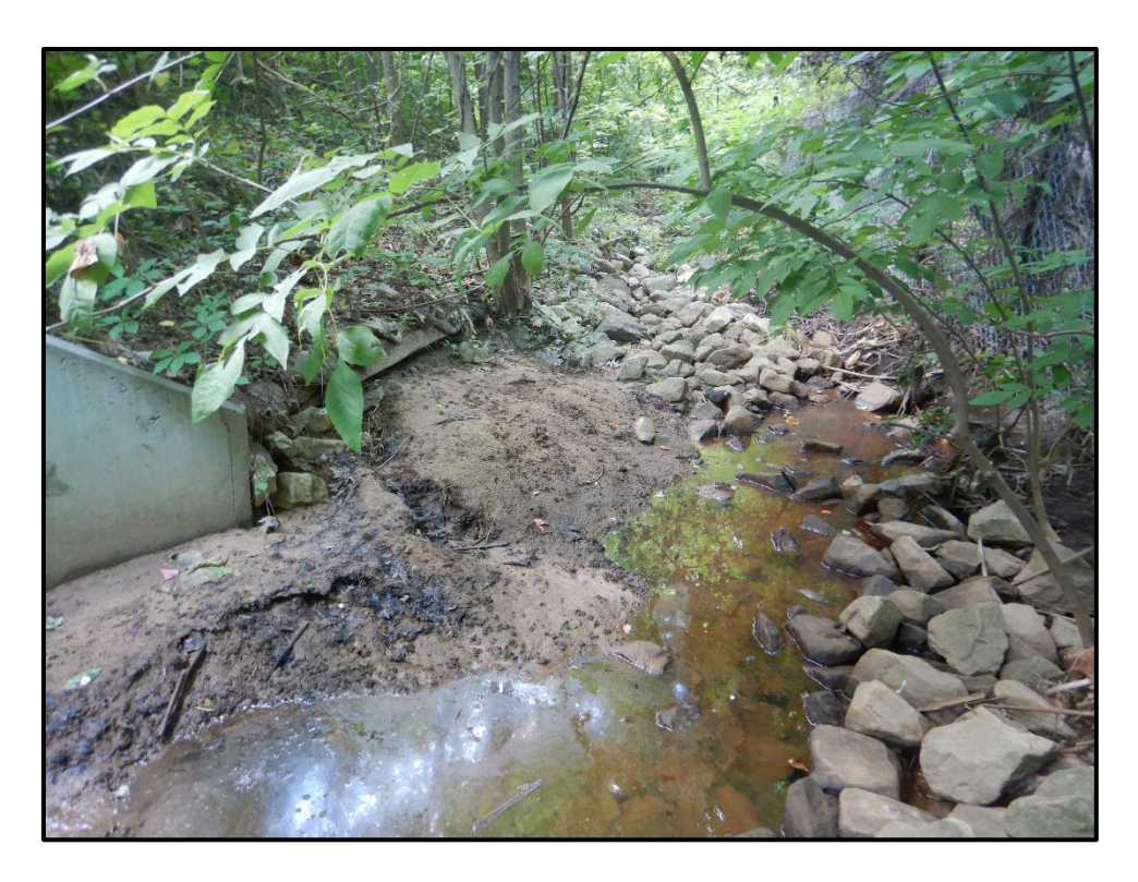
Waters 6RRR – Intermittent