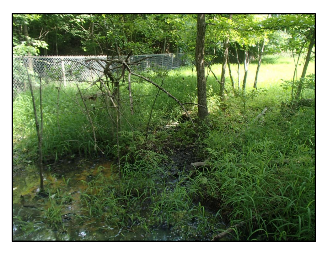
Wetland 4ZZZ – PFO