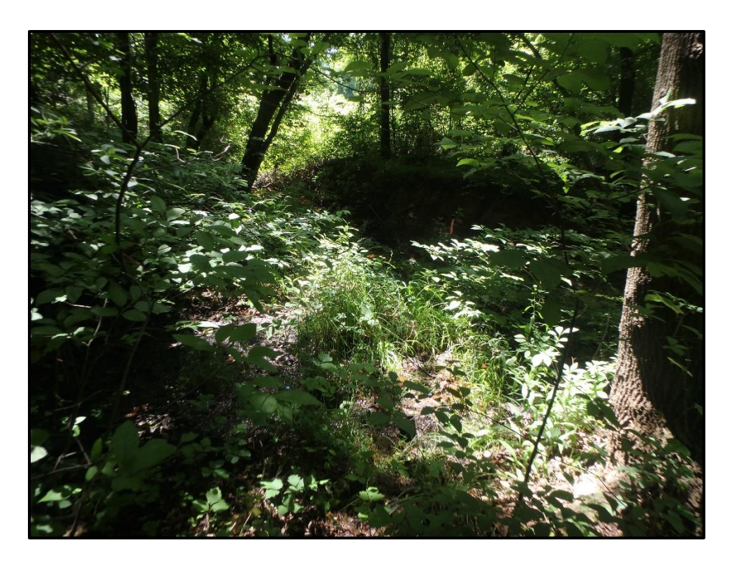
Wetland 4PPP – PFO