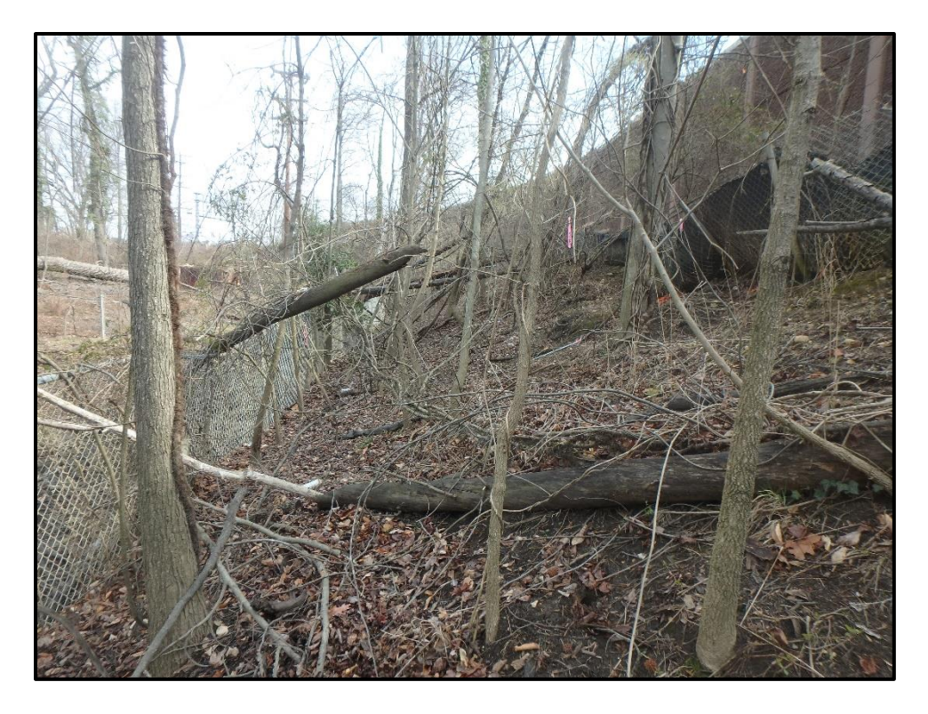
Wetland 1B - PFO