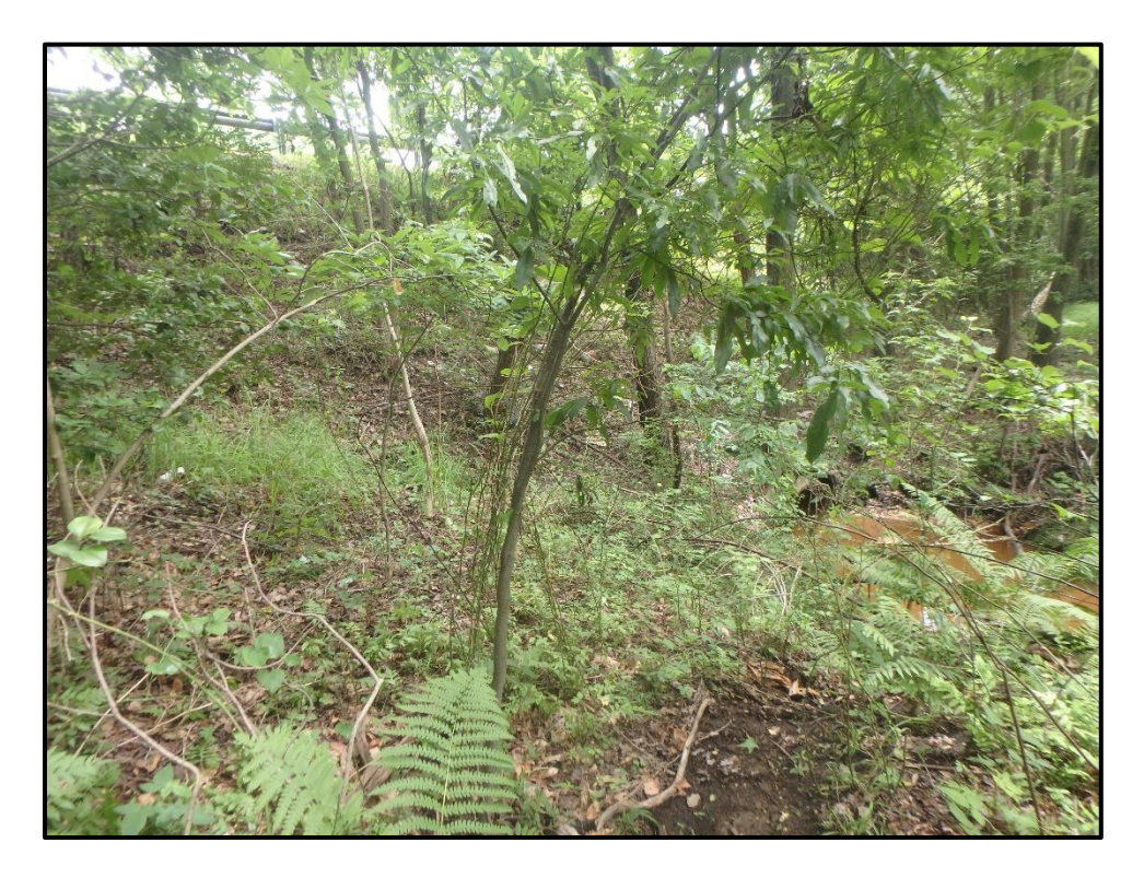
Wetland 4KKKK – PFO