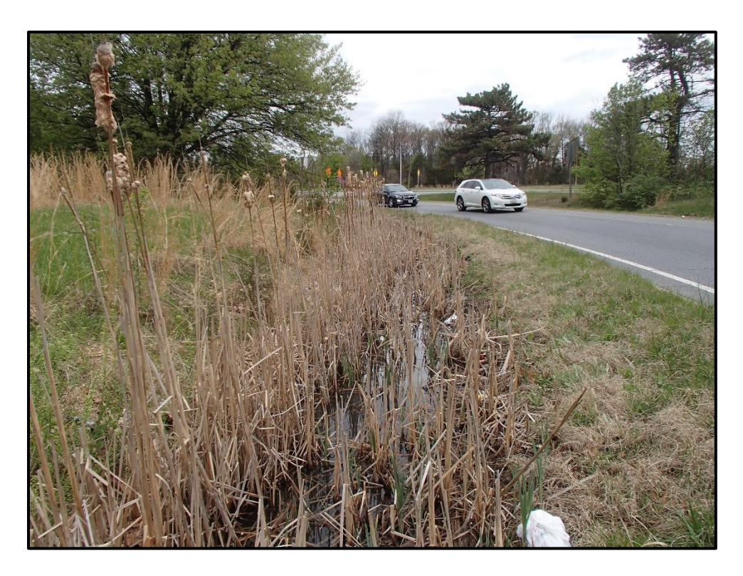
Wetland 3II – PEM