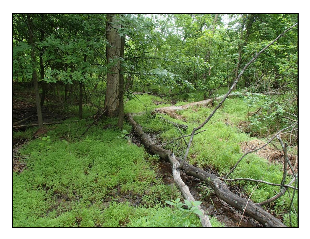
Wetland 4R – PFO