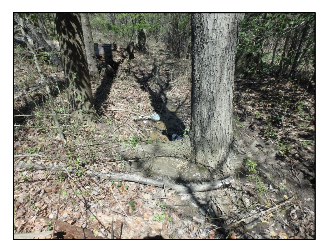
Waters 4K – Intermittent