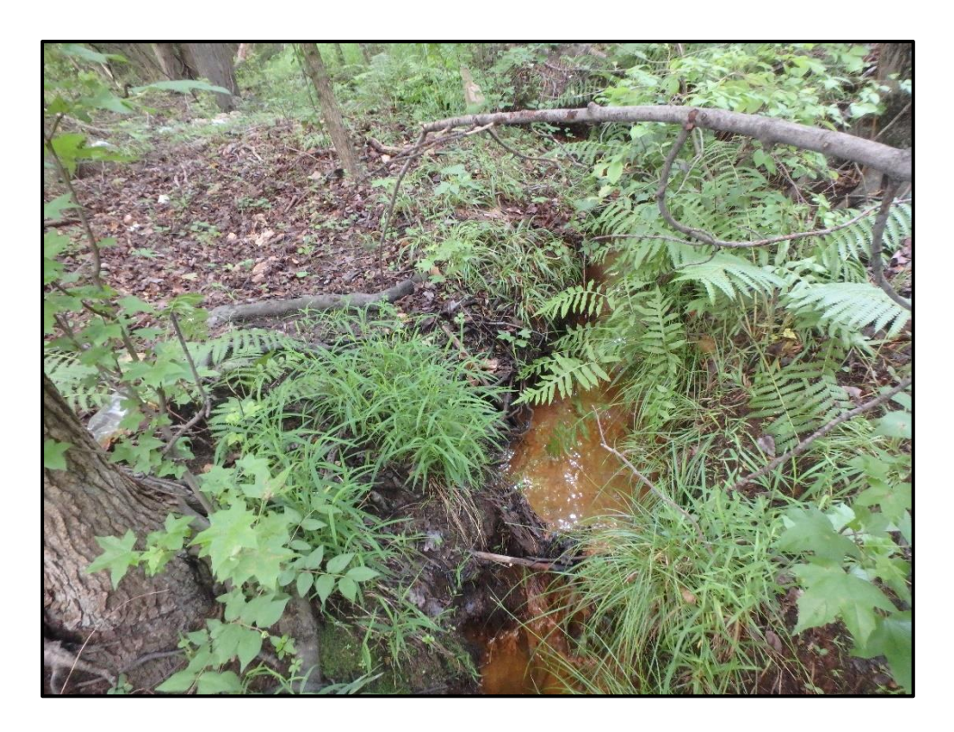
Waters 40000 – Intermittent