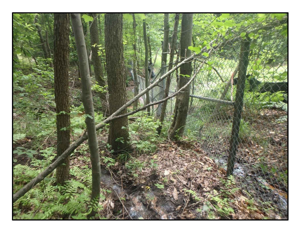
Wetland 4KKKK – PFO