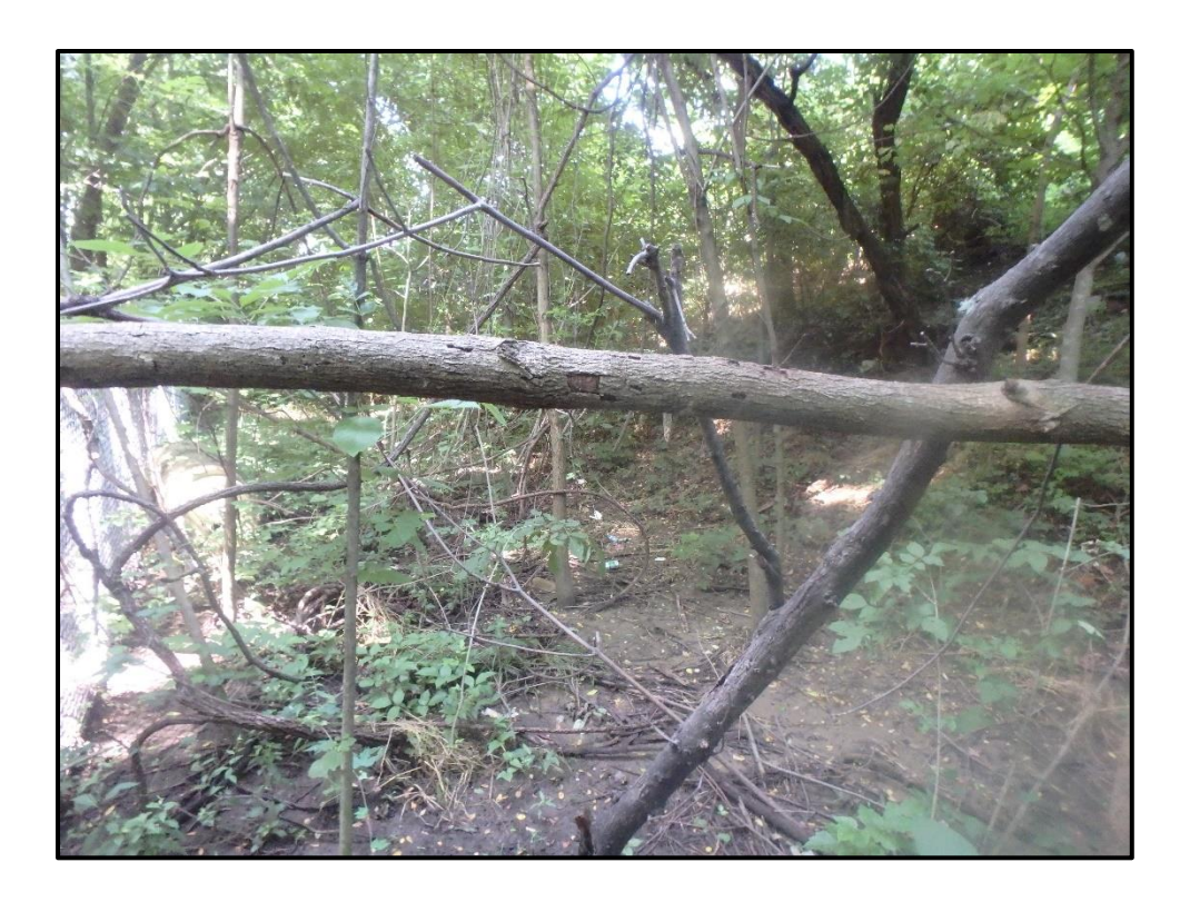
Wetland 6CC – PFO