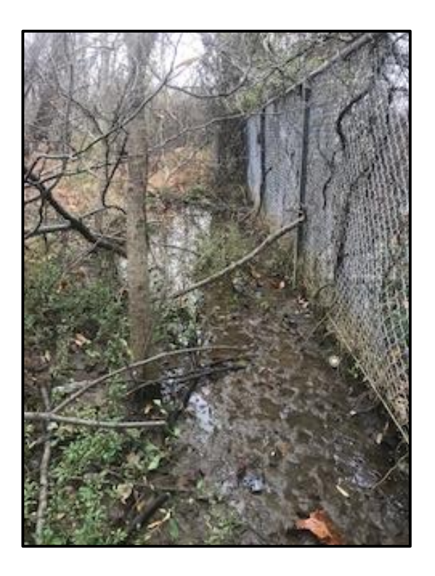
Wetland 5RR – PFO