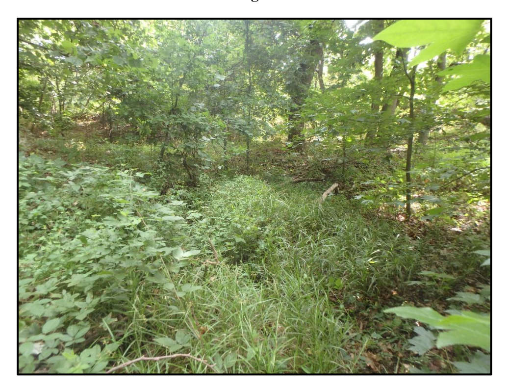
Wetland 5A - PFO