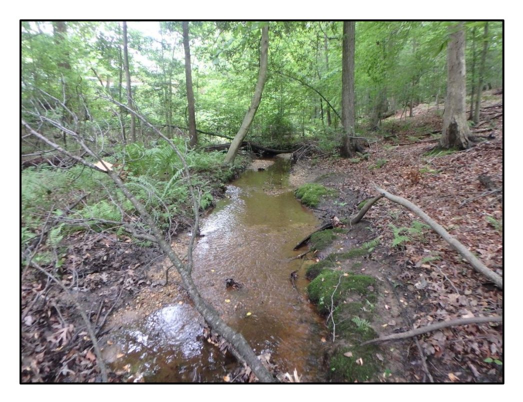
Waters 4M – Perennial