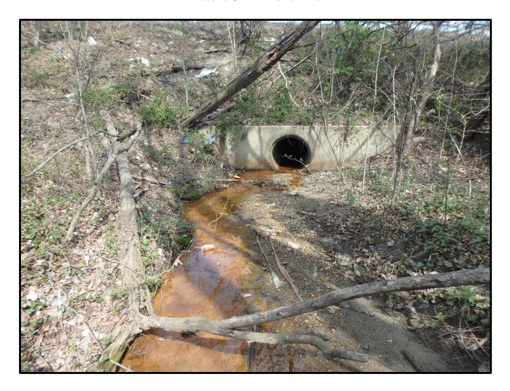
Waters 3A – Perennial