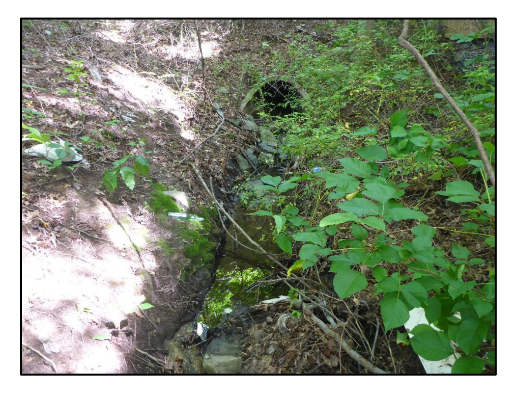
Waters 7E – Perennial