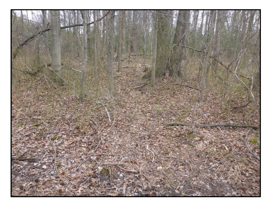
Wetland 3O – PFO