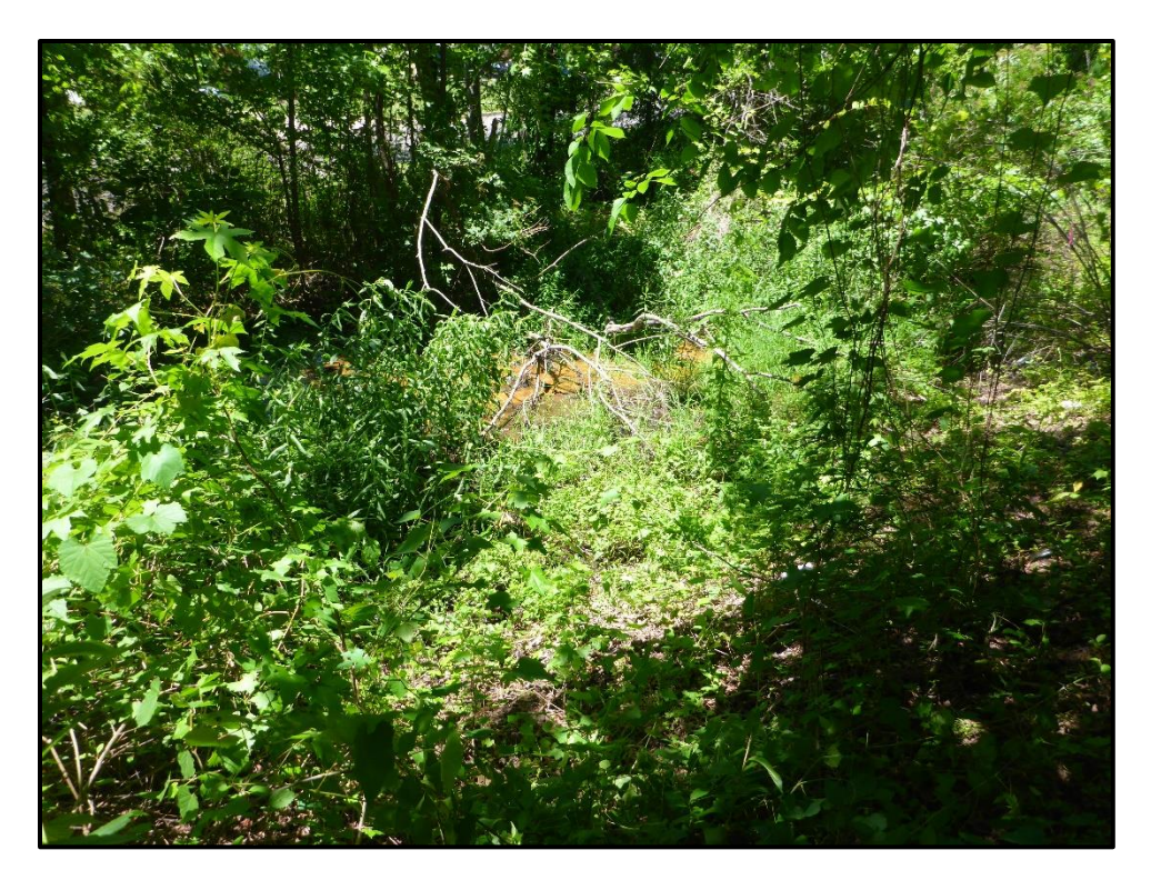
Wetland 7J – PFO