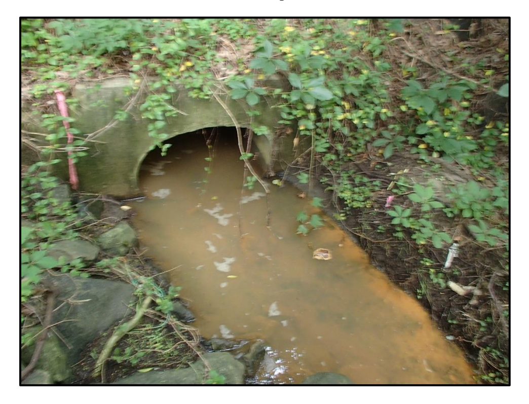
Waters 6JJJ – Perennial