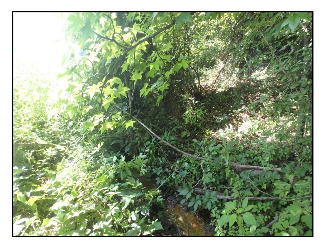
Wetland 6CCCC - PFO