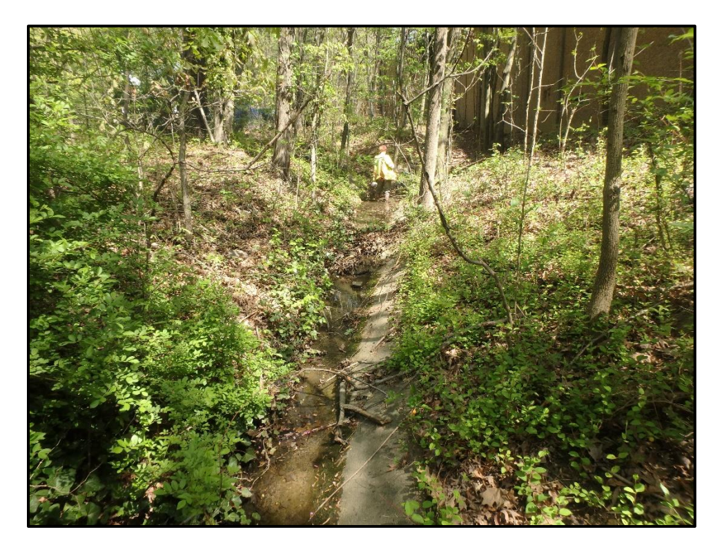
Waters 2W – Intermittent