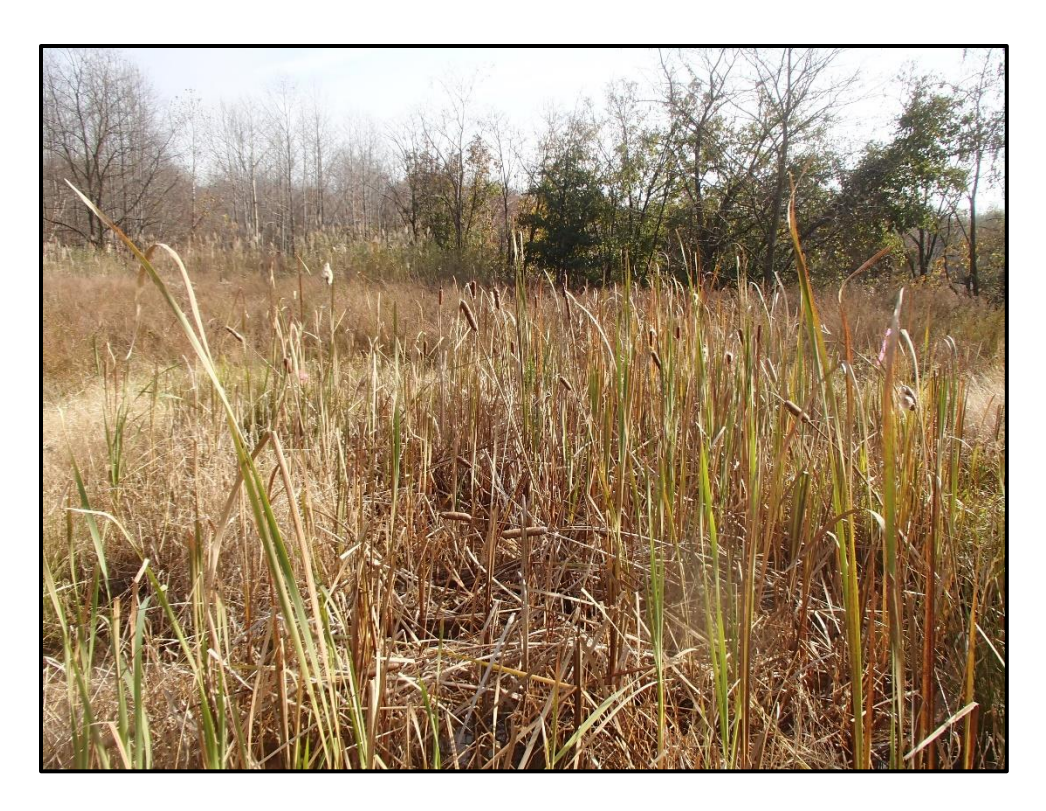
Wetland \ 4WWWW-PEM