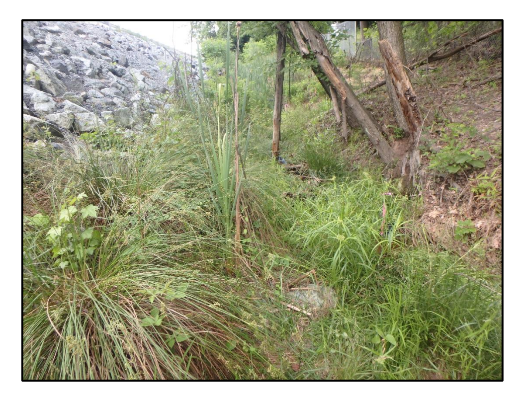
Wetland 4CCC – PEM