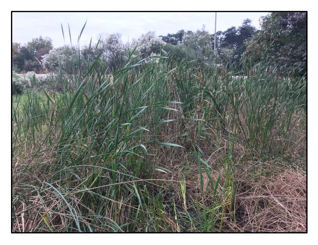
Wetland \ 7LL-PEM