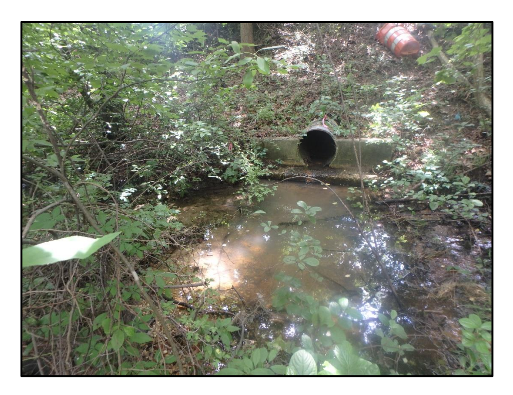
Waters 4UUU – Intermittent