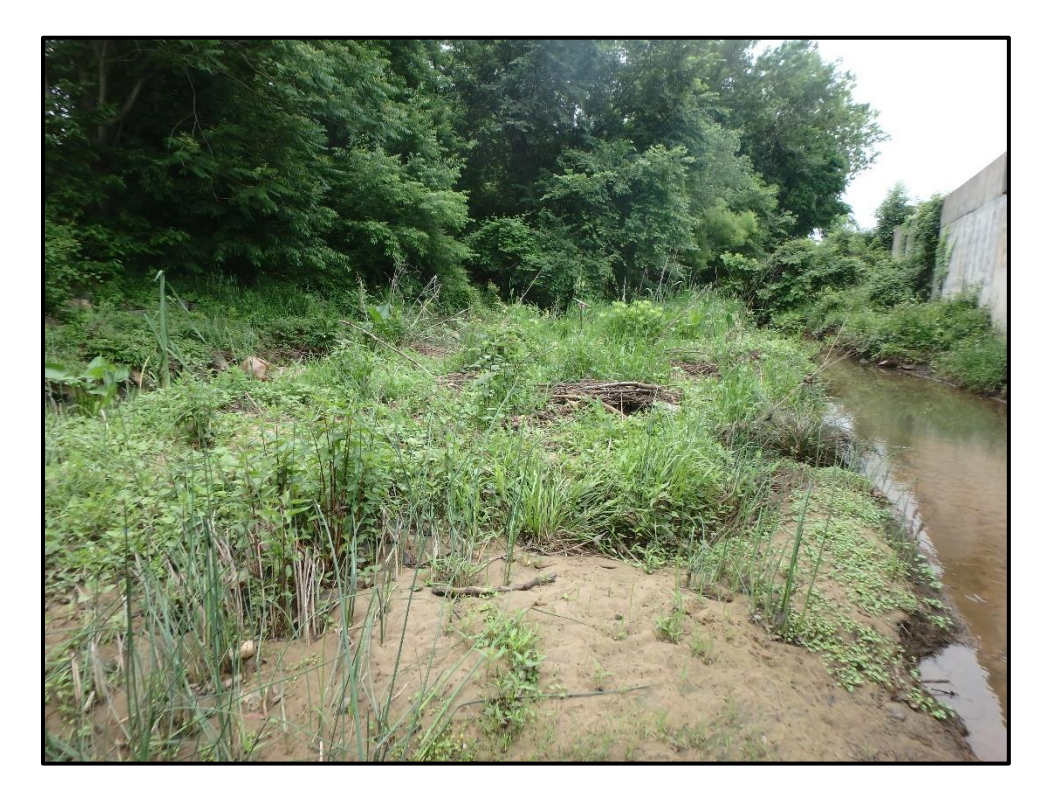
Wetland 6H – PEM