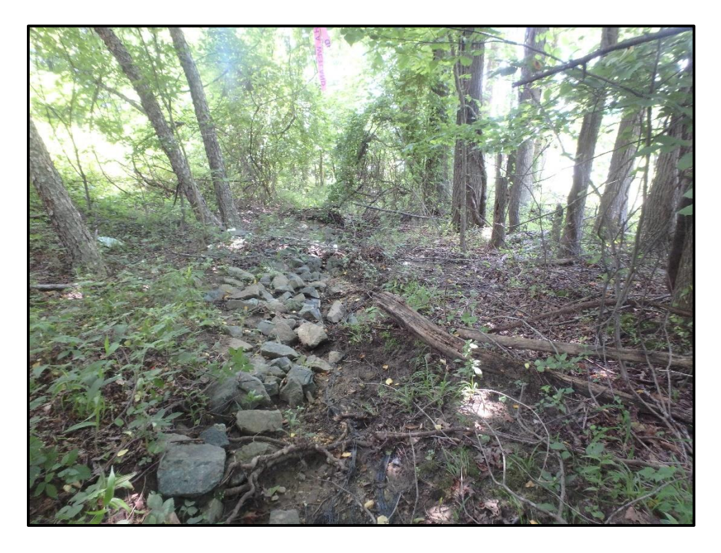
Waters 6UUU – Intermittent