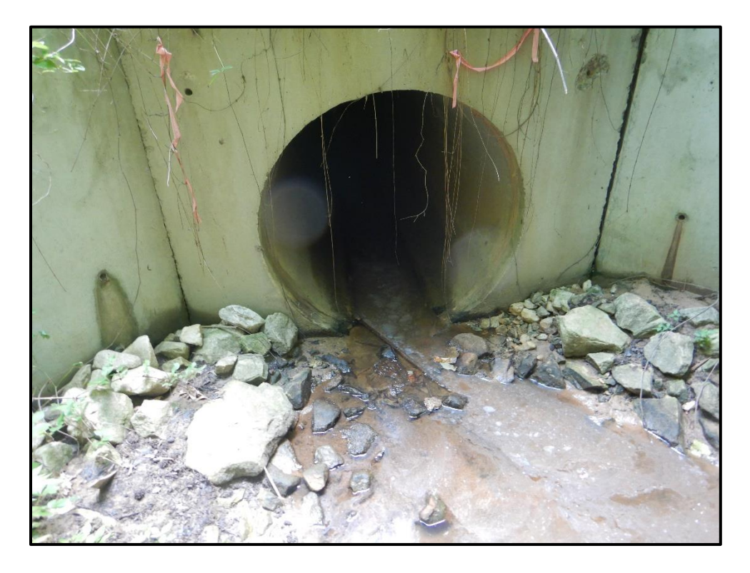
Waters 6RRR – Intermittent