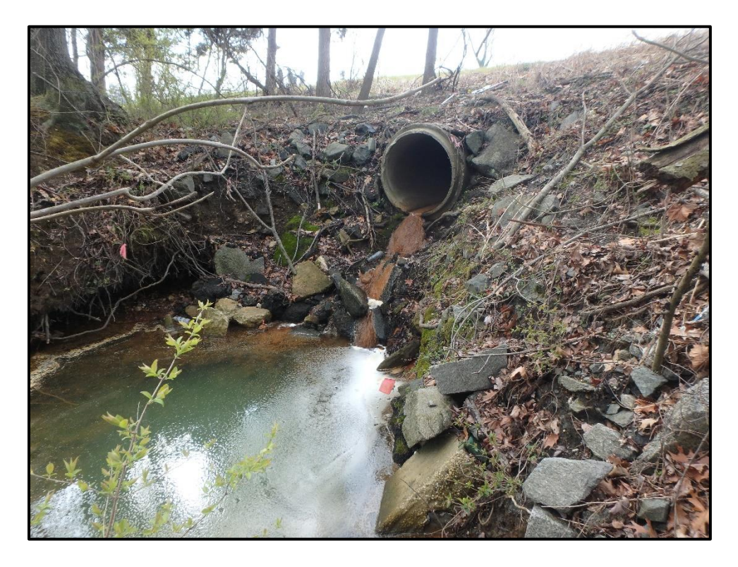
Waters 1H – Intermittent