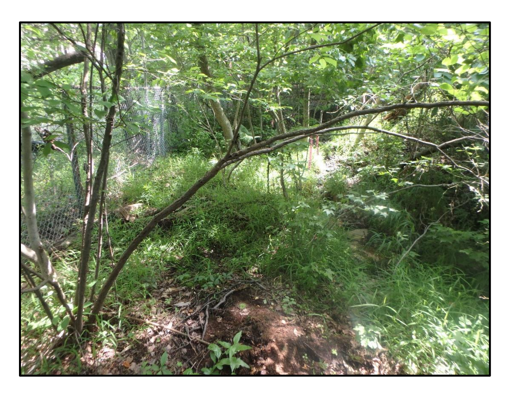
Wetland 4SSS – PFO