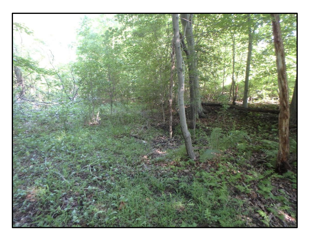
Wetland 4AAA – PFO