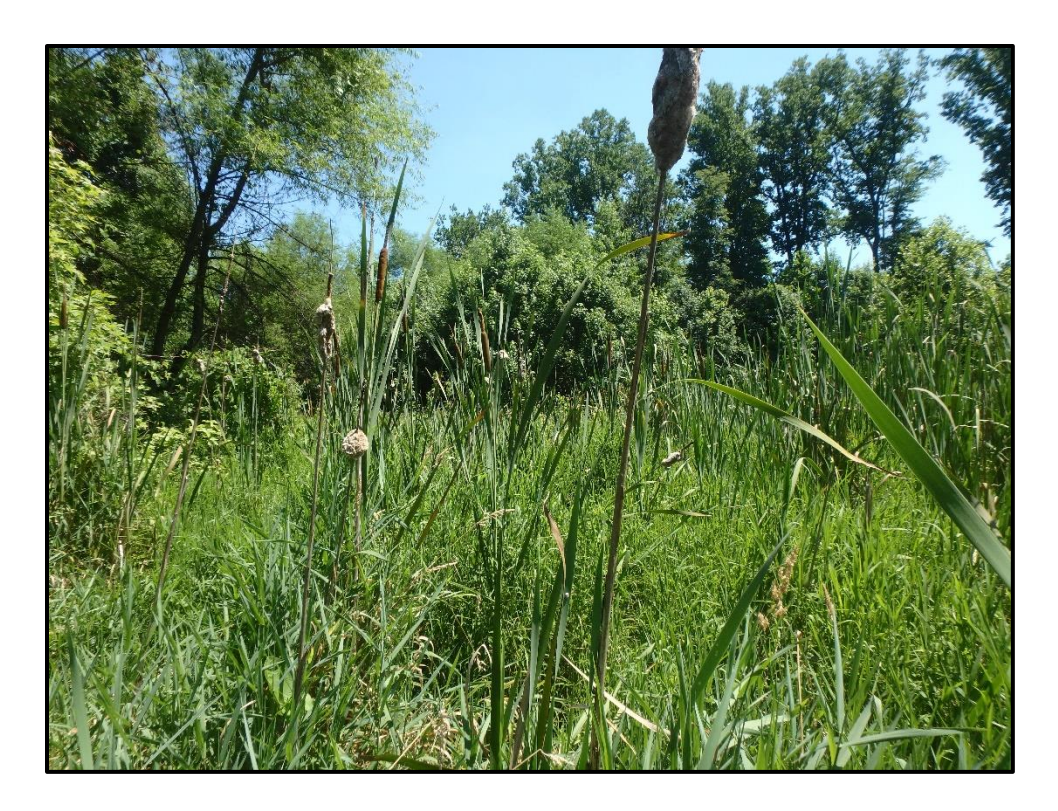
Wetland 7EE – PEM