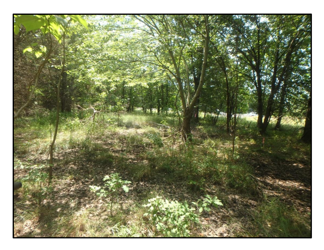
Wetland 7M – PFO