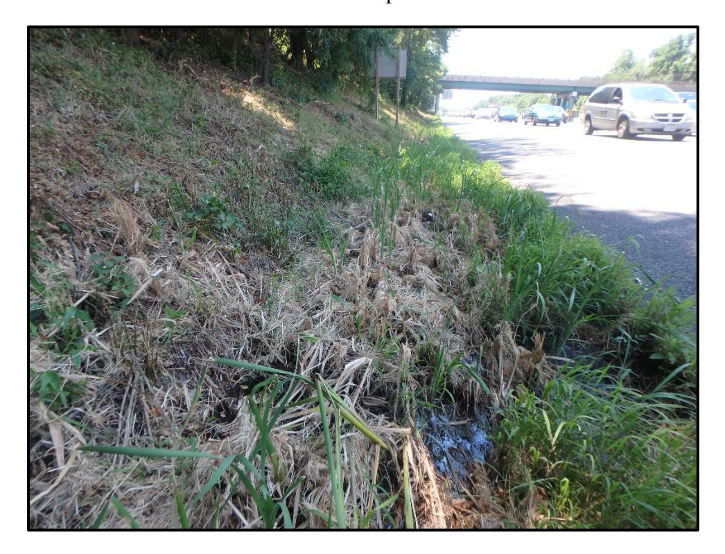
Waters 7BB – Intermittent