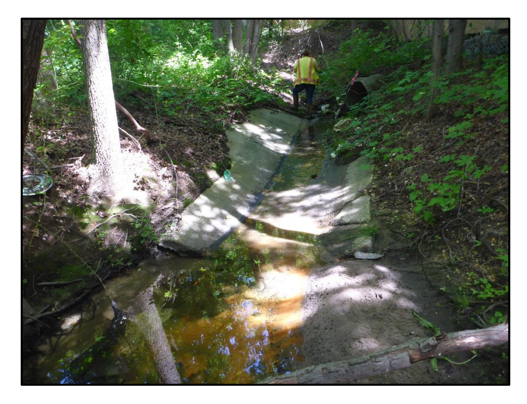
Waters 7E – Perennial