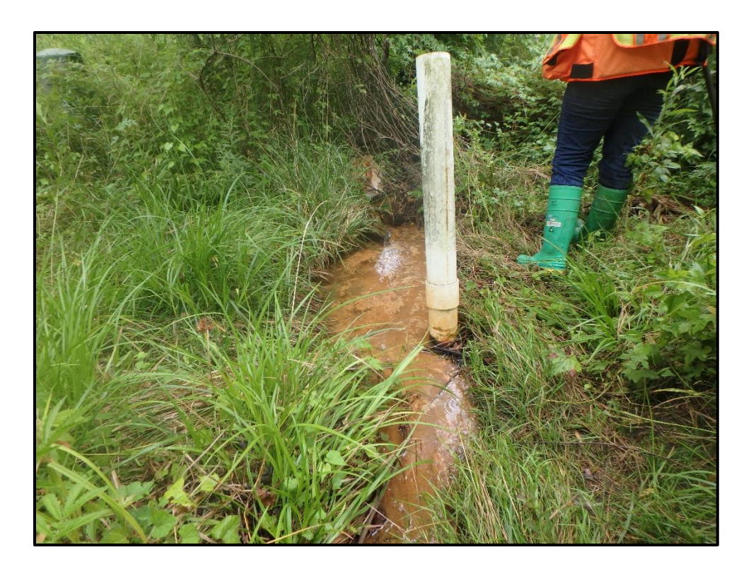
Waters 5N – Intermittent