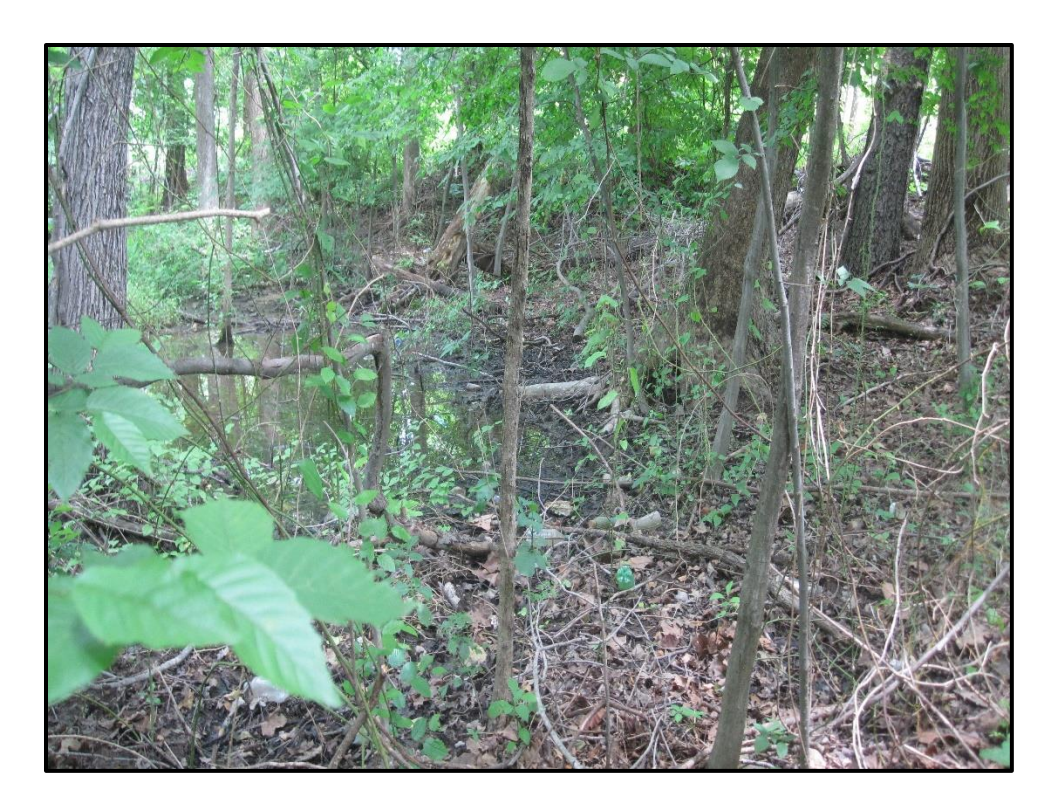
Wetland 6GG – PFO