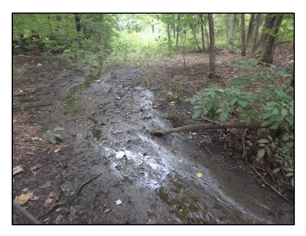
Wetland 5X – PFO