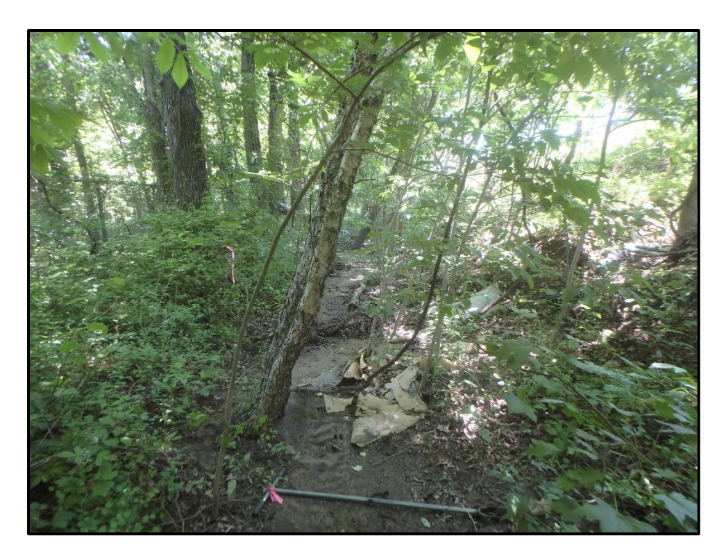
Wetland 6C – PFO