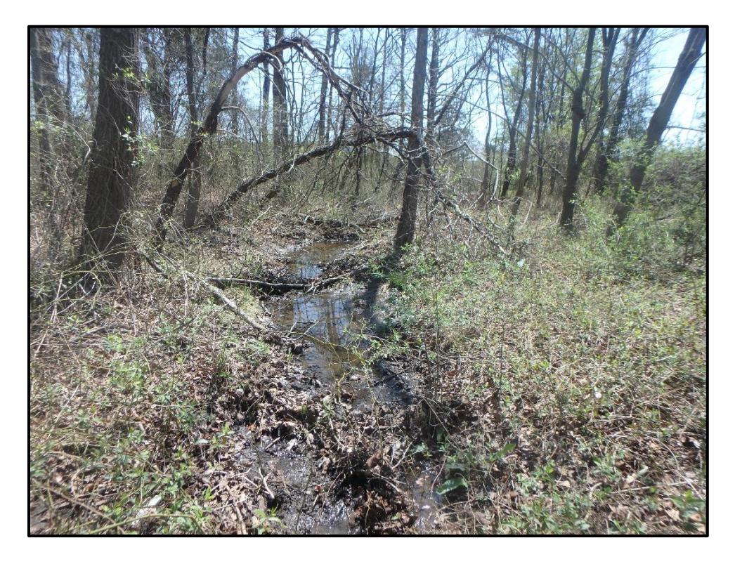
Wetland 3OO – PFO