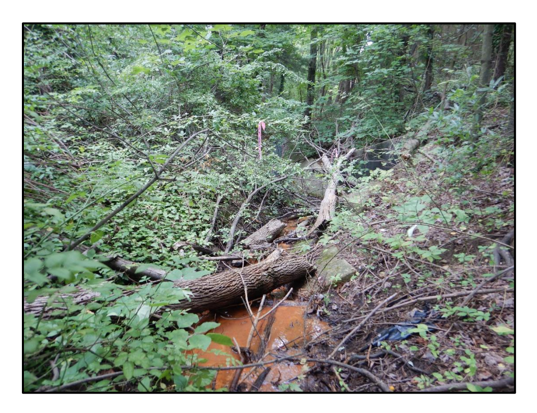
Waters 2JJ – Intermittent