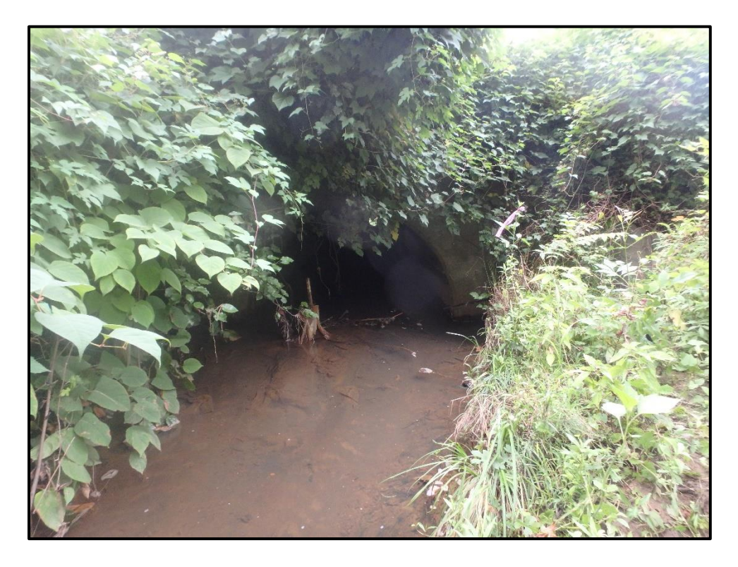
Waters 5F – Perennial