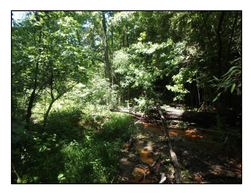
Wetland 4000 - PFO