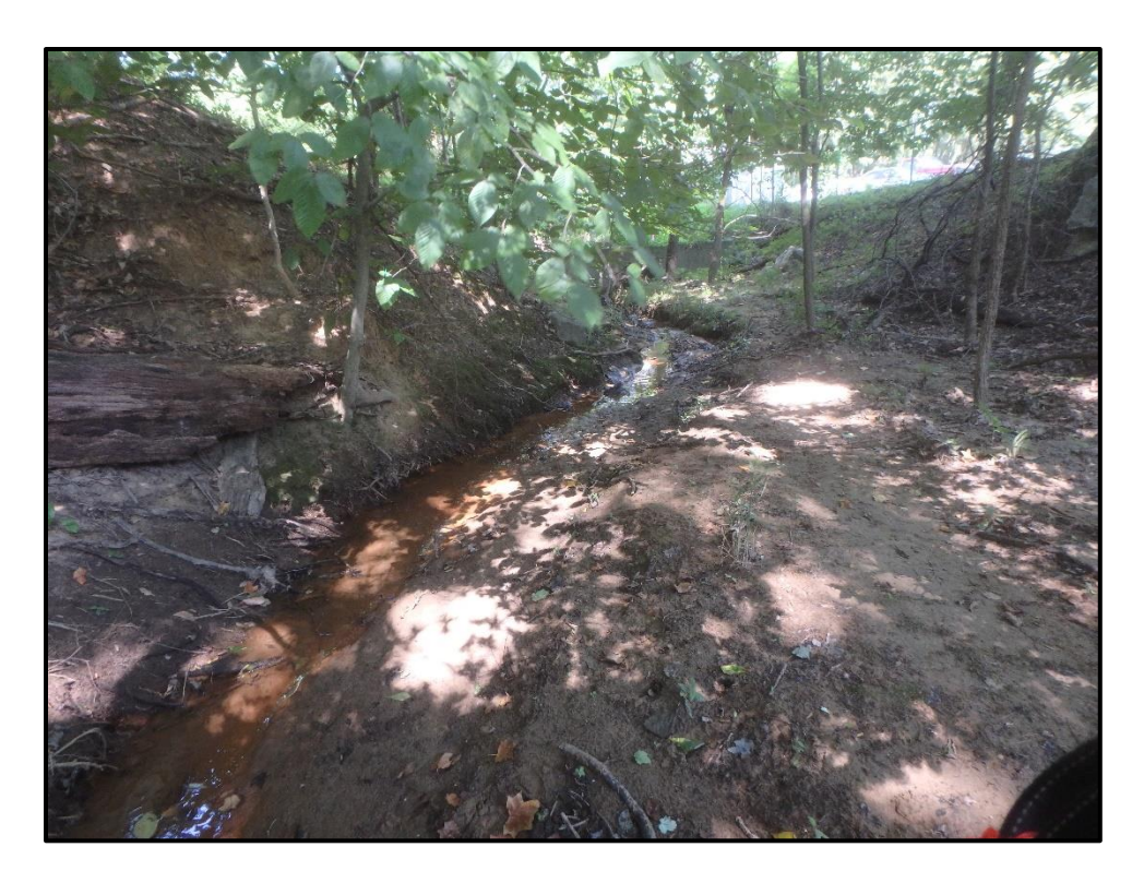
Waters 7JJ – Perennial