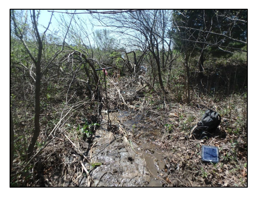
Wetland 3NN – PEM