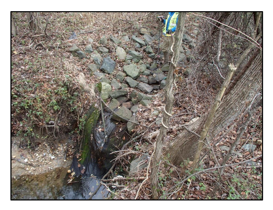
Waters 2UU – Intermittent