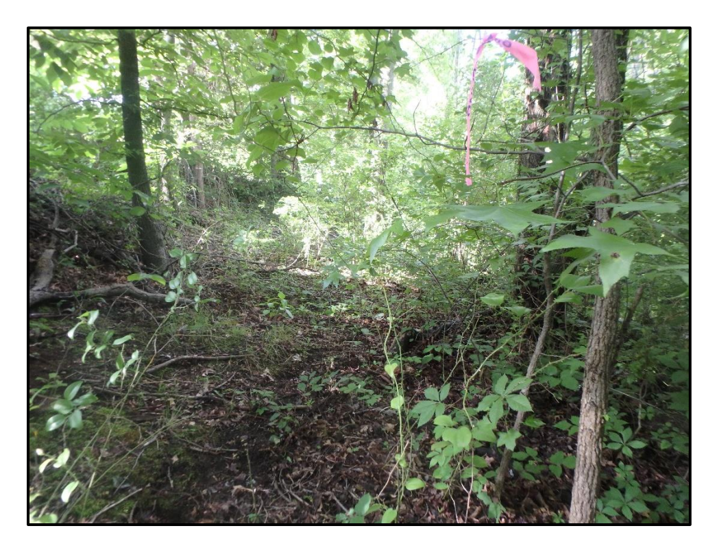
Wetland 4KKK – PFO