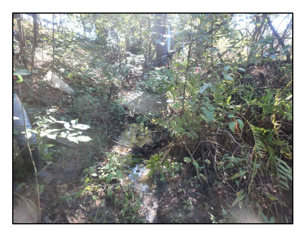
Wetland 5GG – PFO