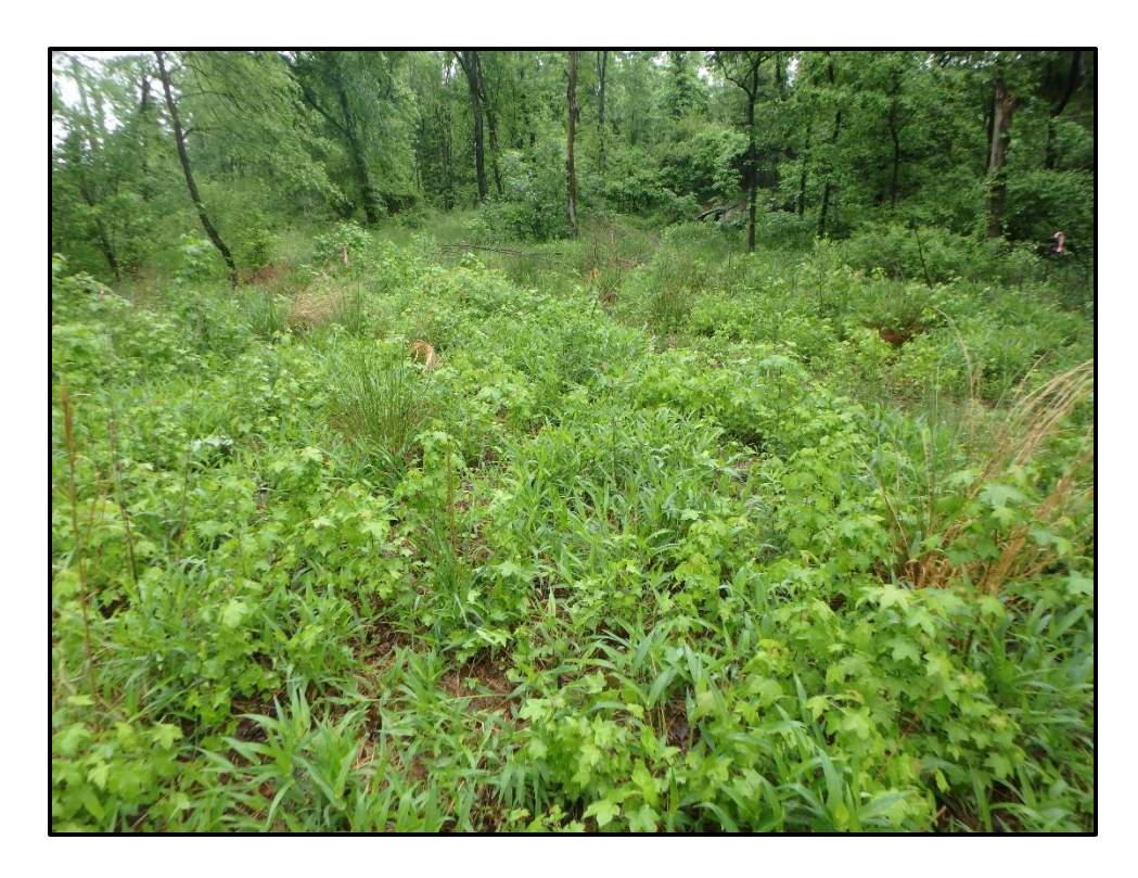
Wetland 3KKK – PSS