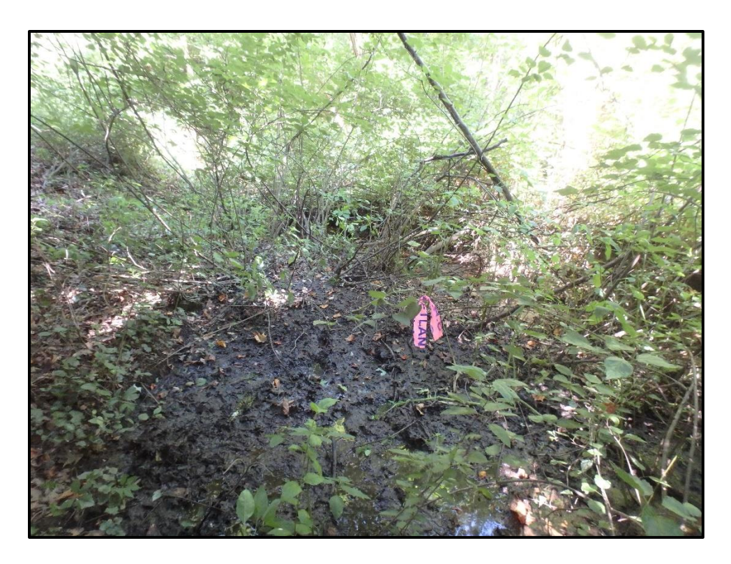
Wetland 7FF – PFO