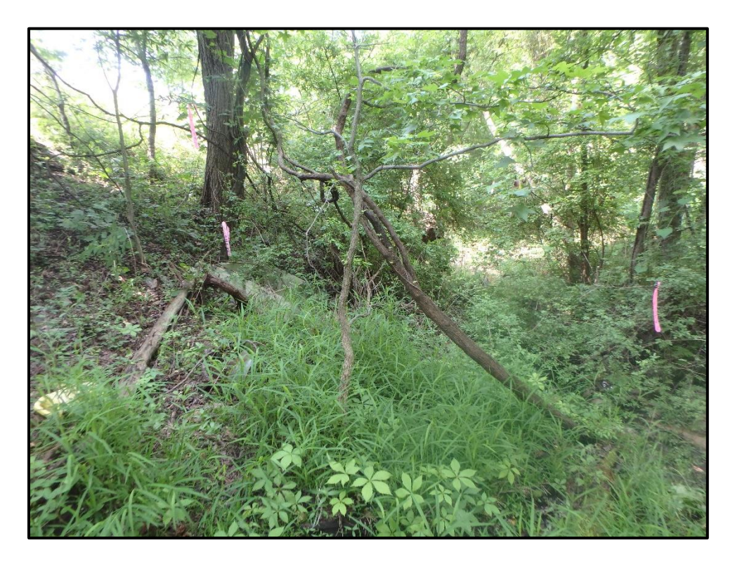
Wetland 4SSS – PFO