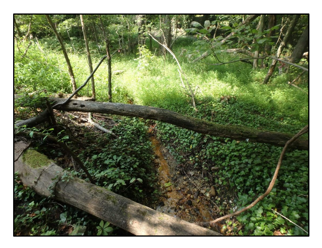
Waters 100 – Intermittent