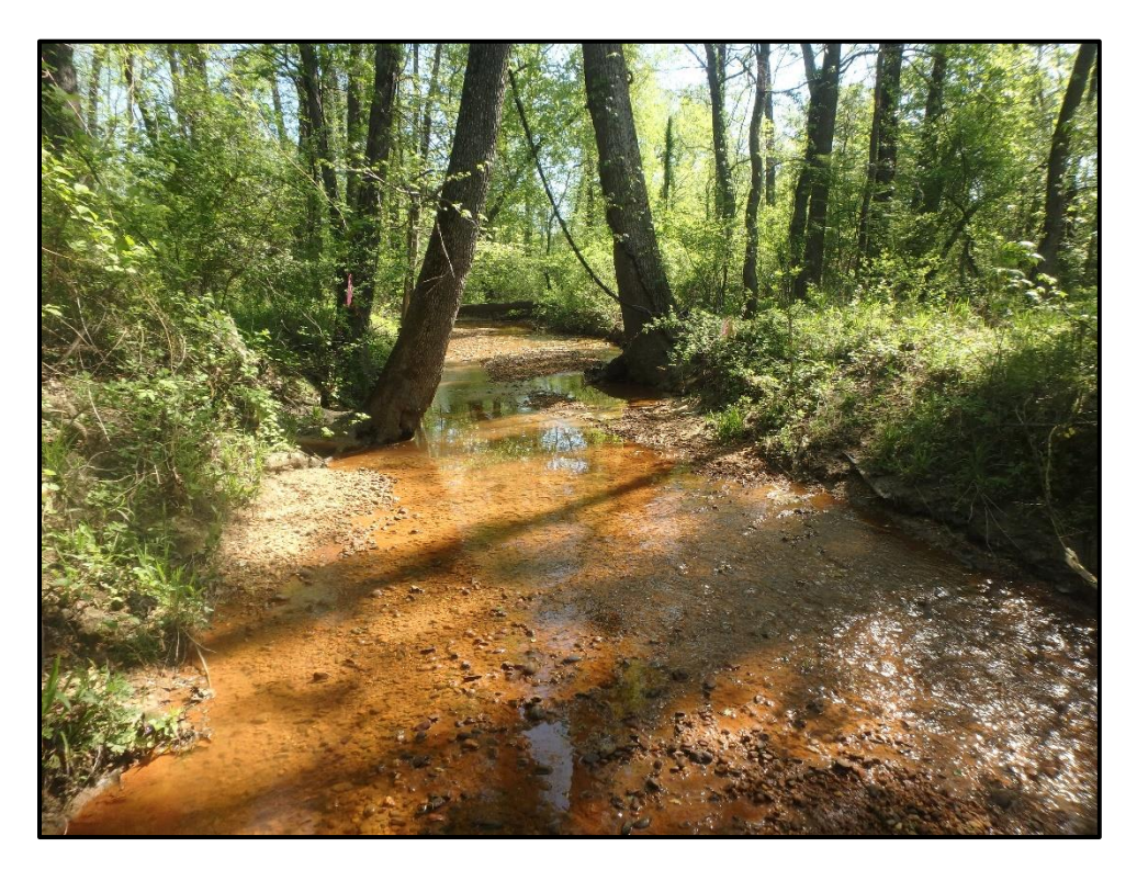
Waters 3S – Perennial