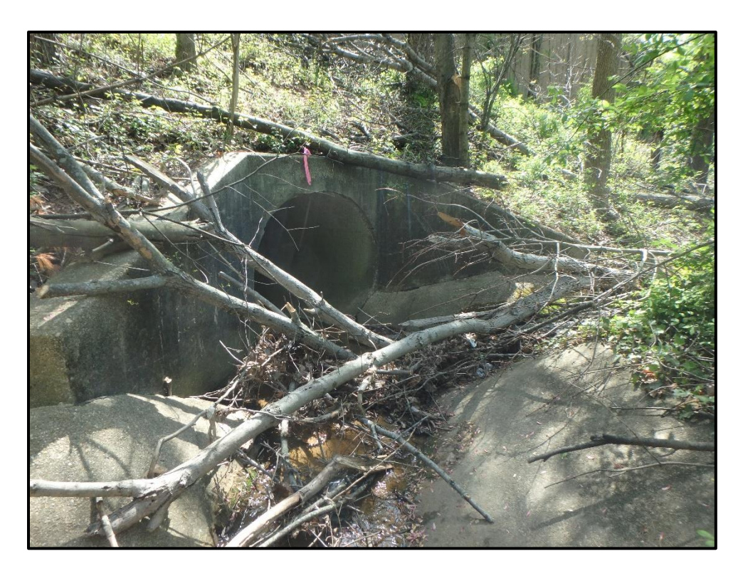
Waters 2X – Perennial