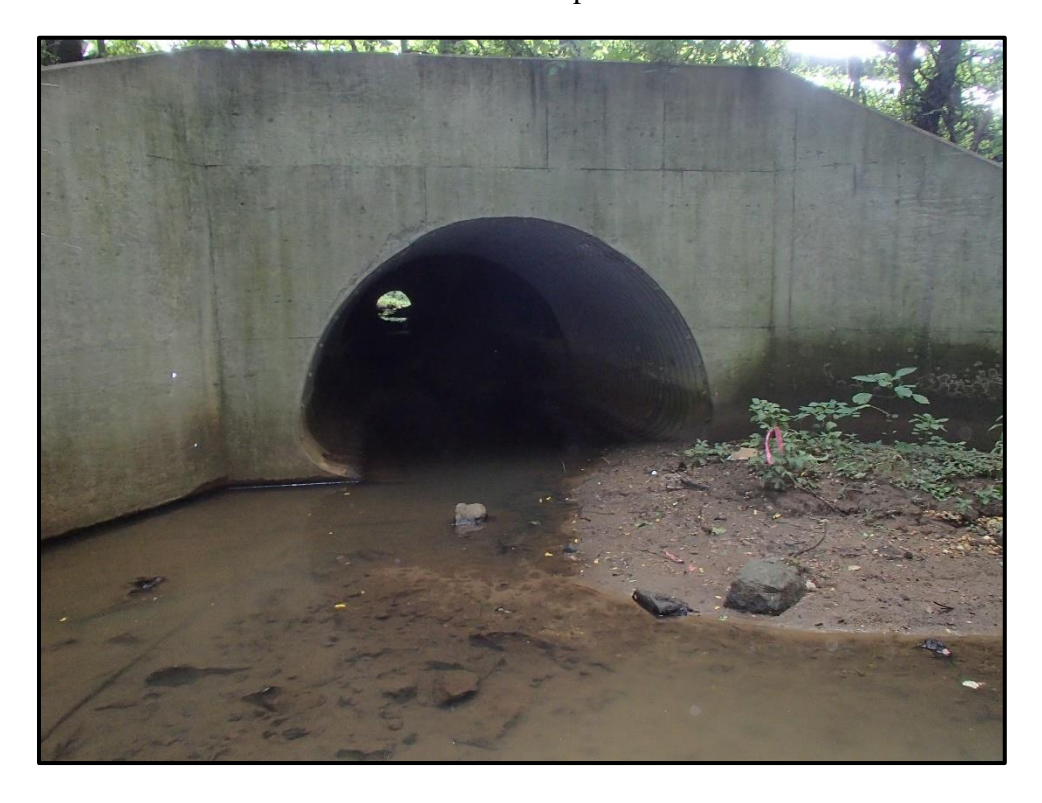
Waters 6MMM – Perennial