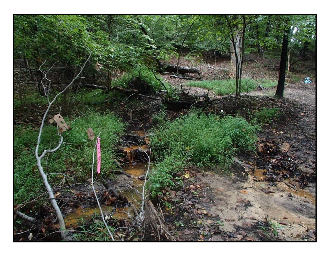
Waters 1TT – Intermittent