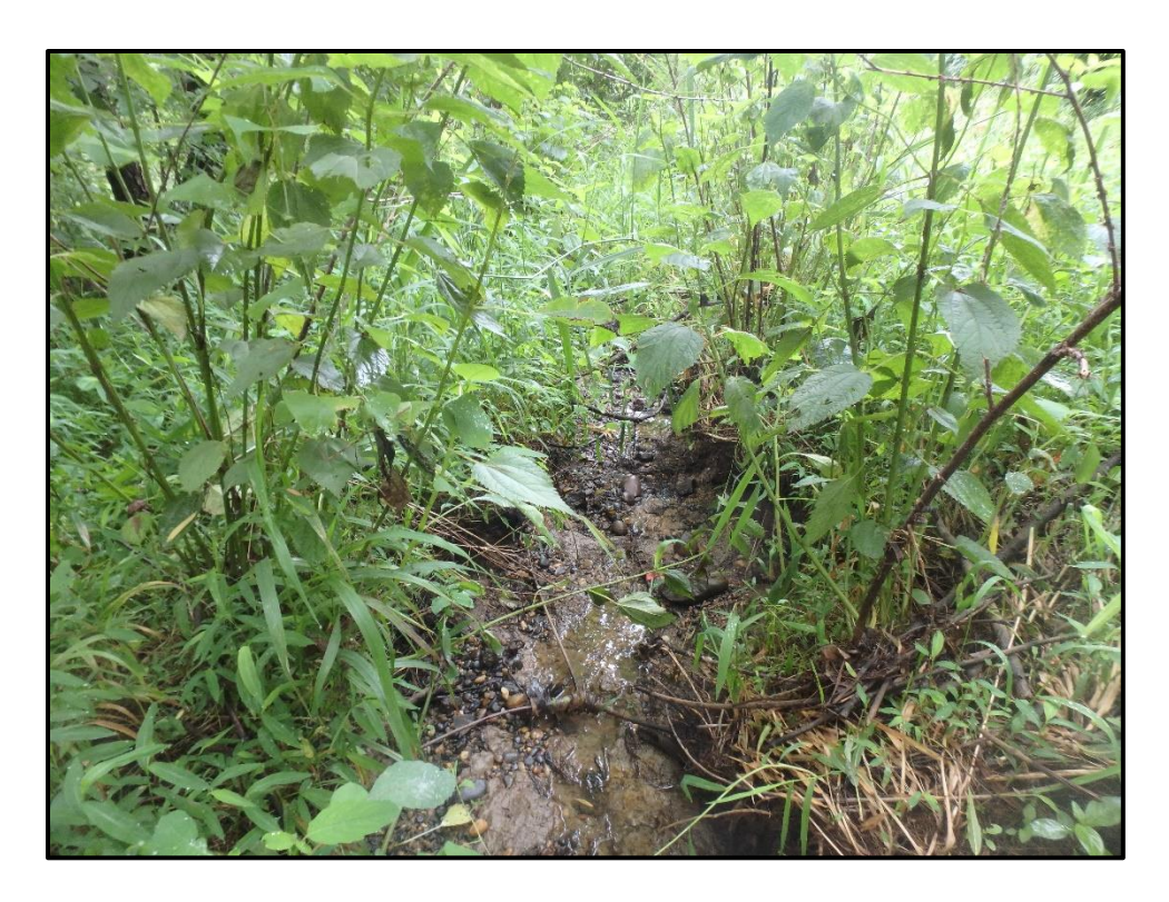
Waters 6NN – Intermittent