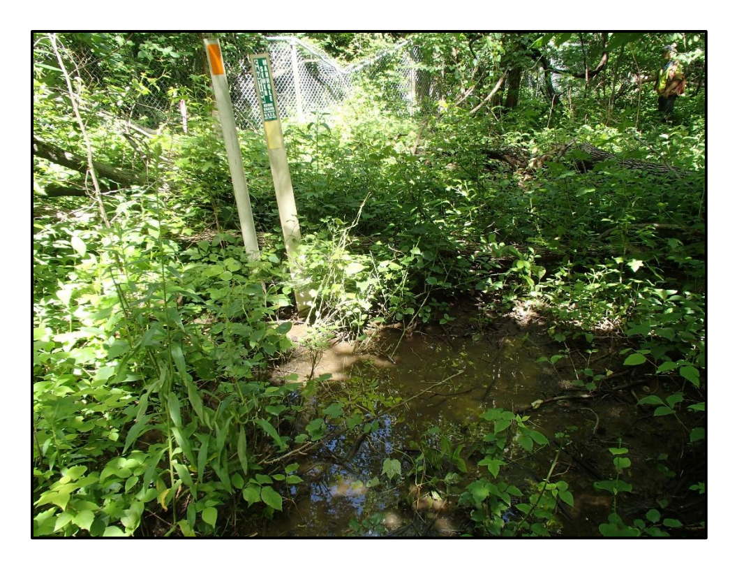
Wetland 6P – PFO