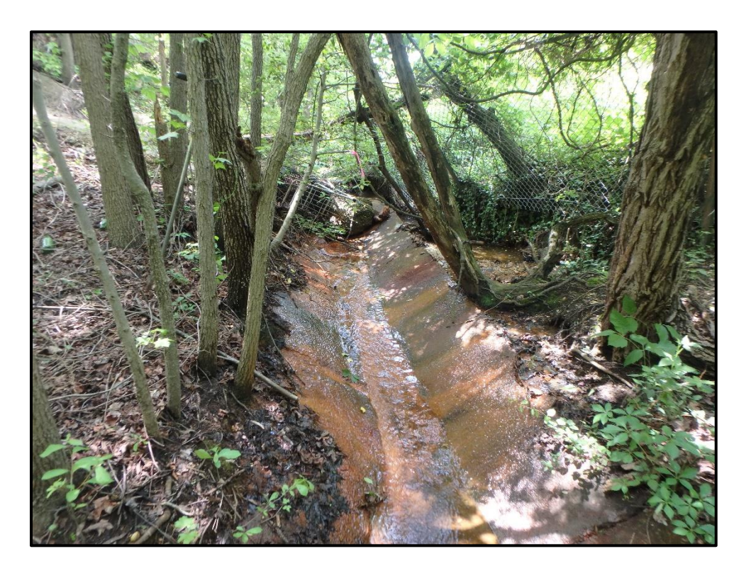
Waters 3FFF – Intermittent