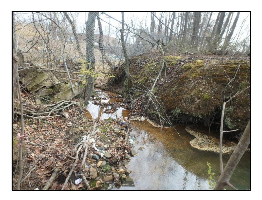
Waters 1H - Intermittent