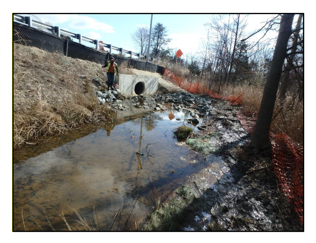
Waters 2N - POW