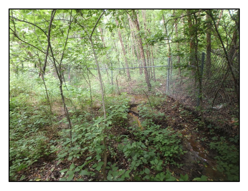
Wetland 6II – PFO