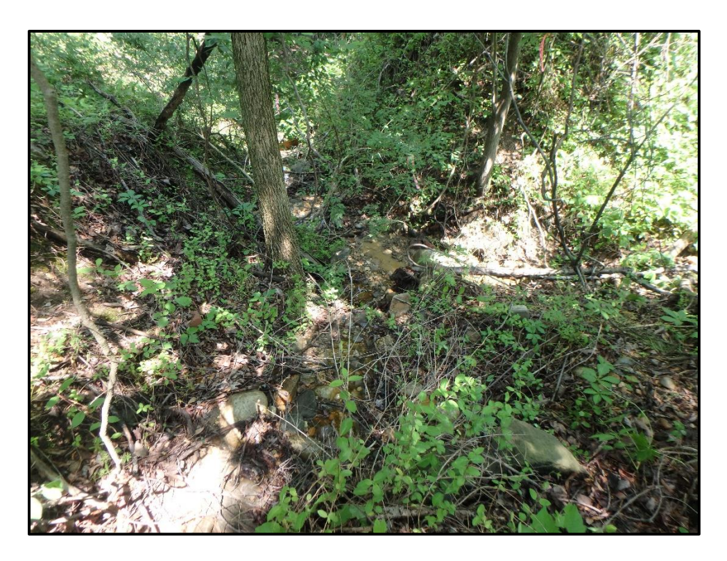
Waters 3BBB – Intermittent