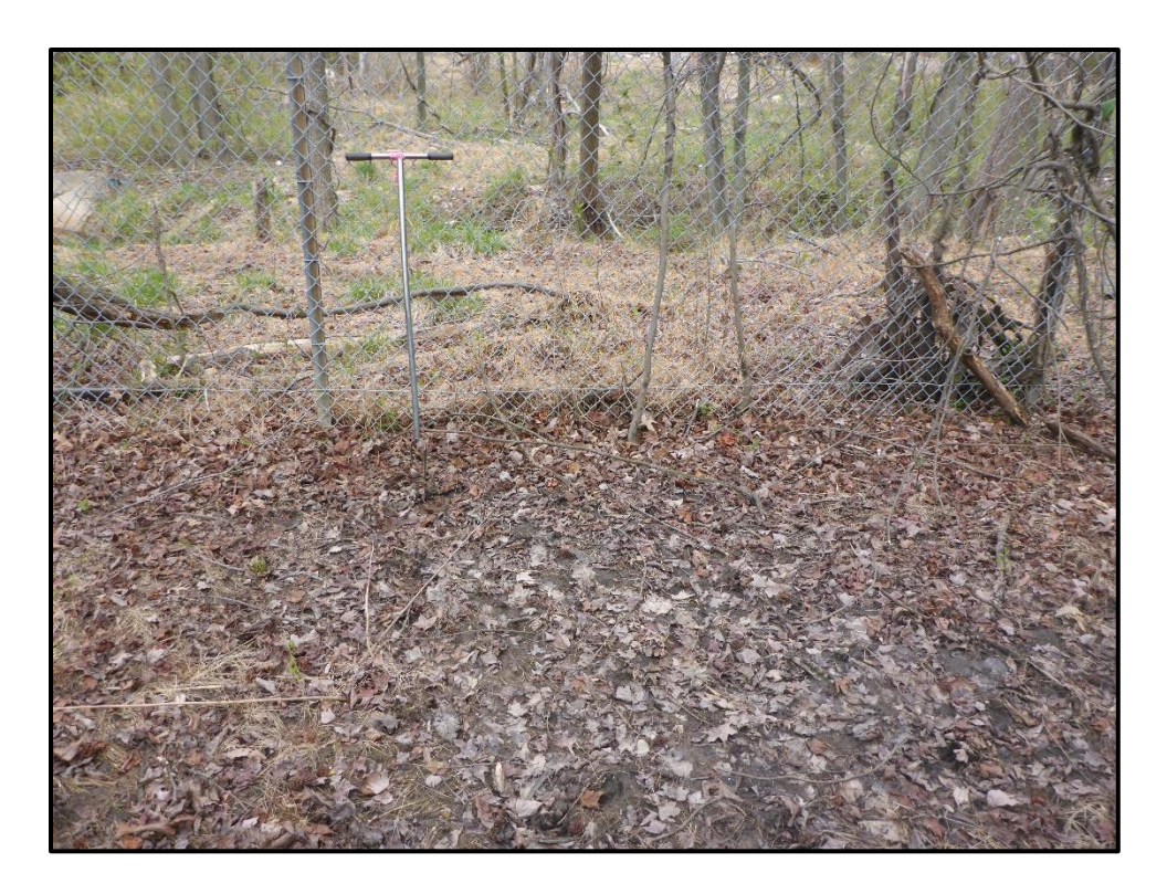
Wetland 3T – PFO