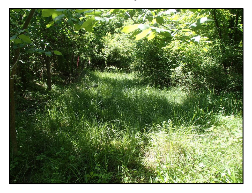
Wetland 4HH – PFO