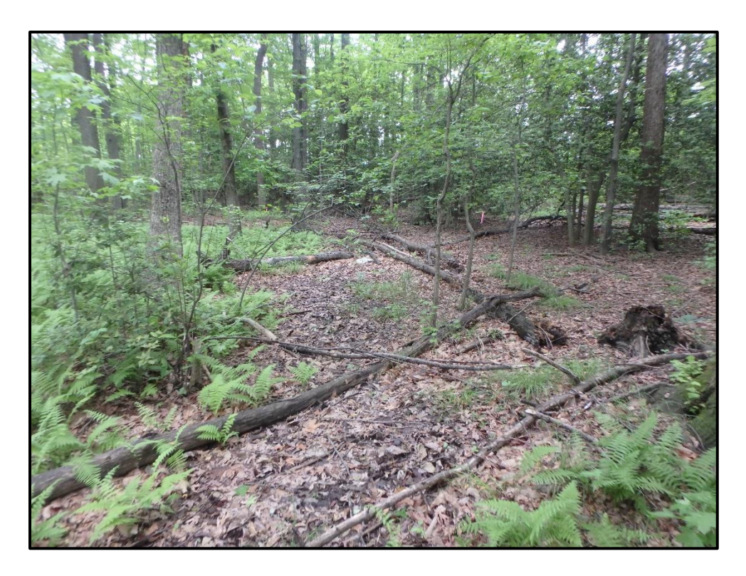
Wetland 3O – PFO