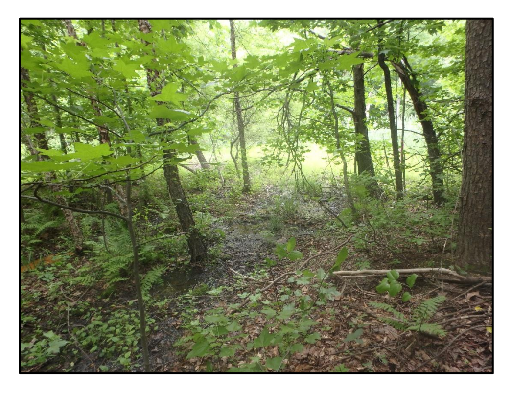
Wetland 4ZZ – PFO