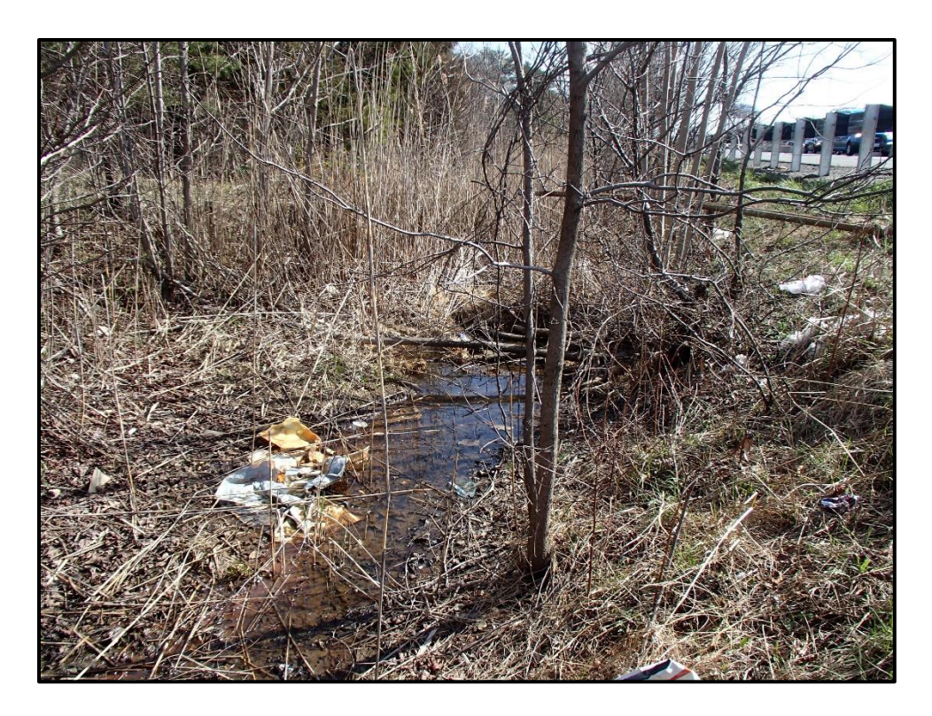
Wetland 2P – PEM