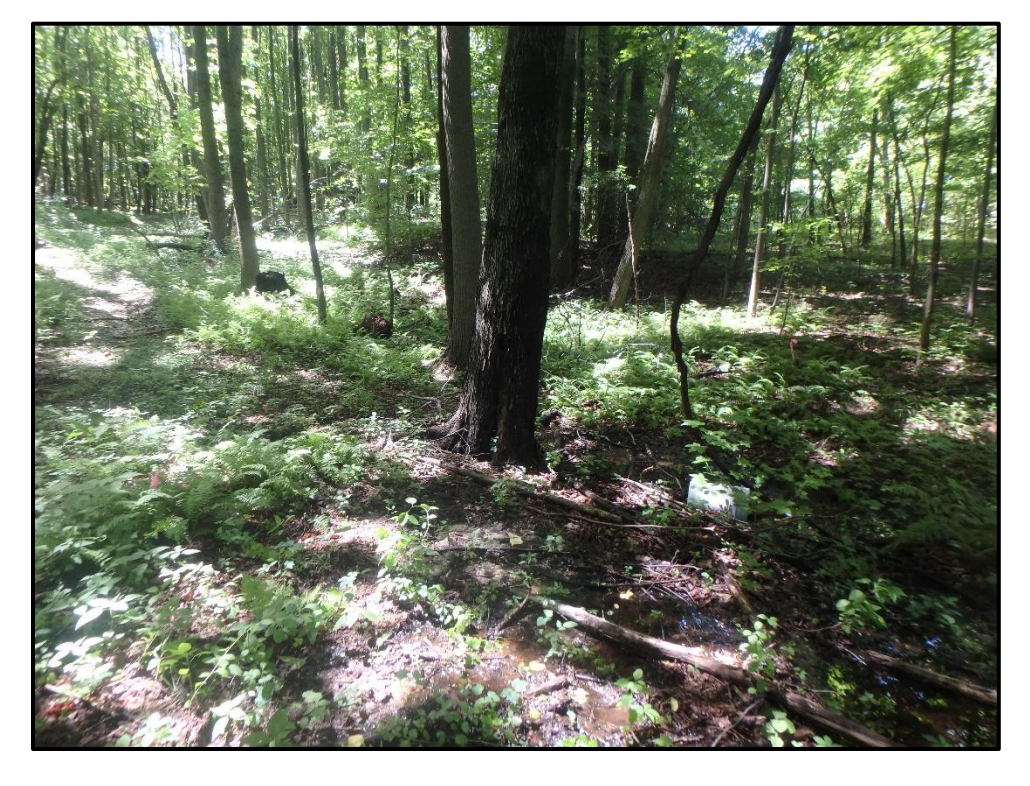
Wetland 4MMM – PFO