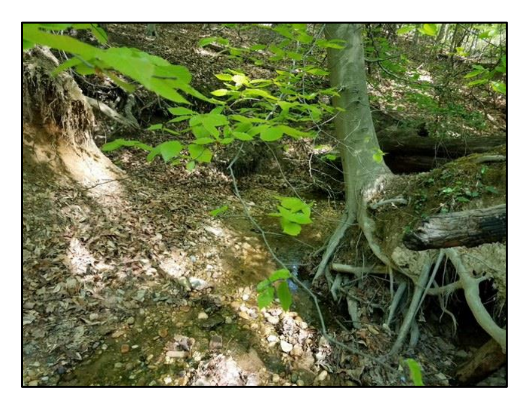
Waters 1Z – Intermittent