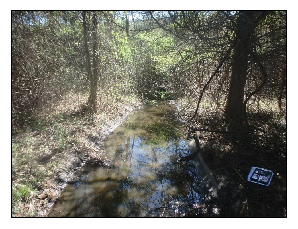
Waters 3LL – Intermittent