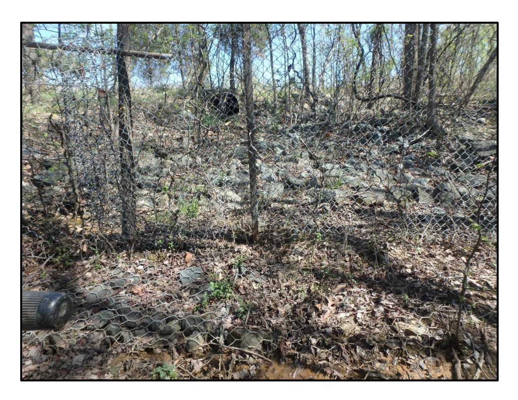
Waters 4T – Intermittent