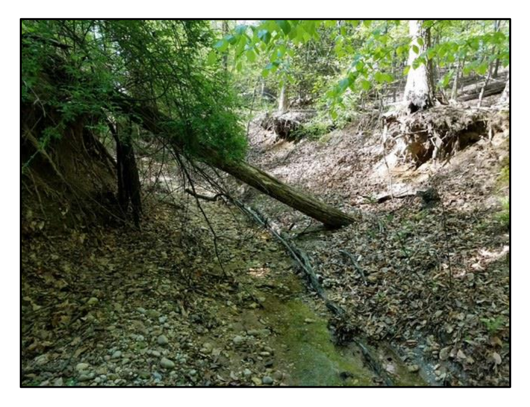
Waters 1Z – Intermittent