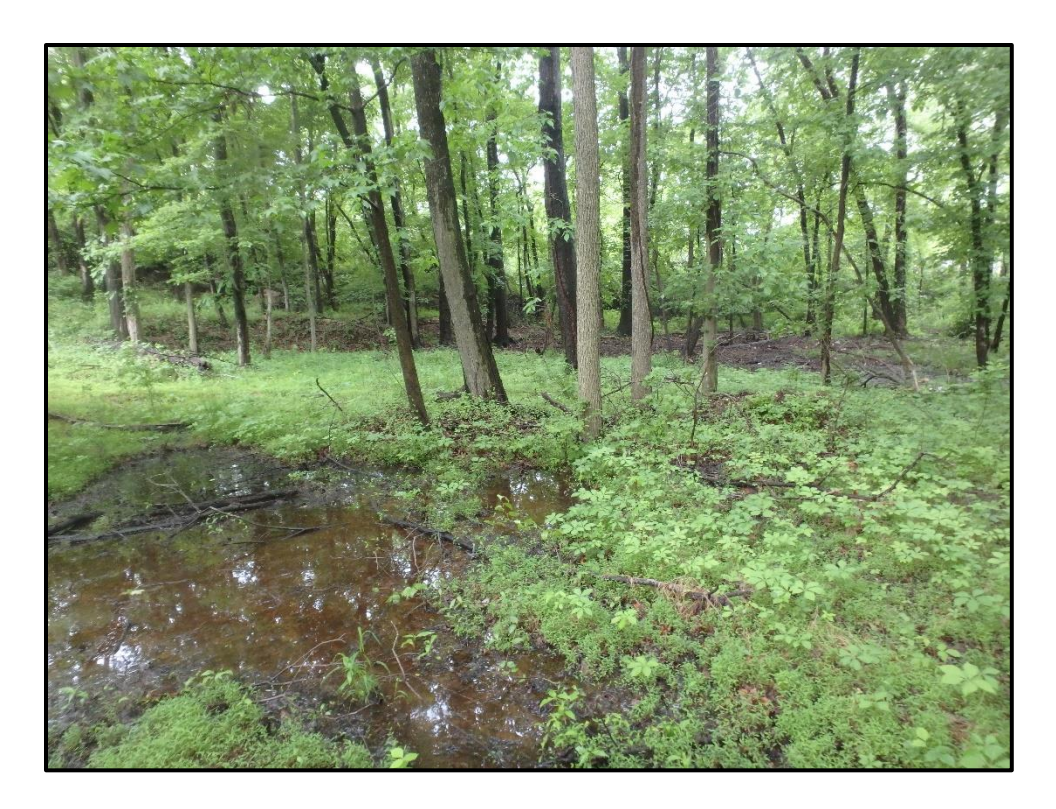
Wetland 3JJJ – PFO