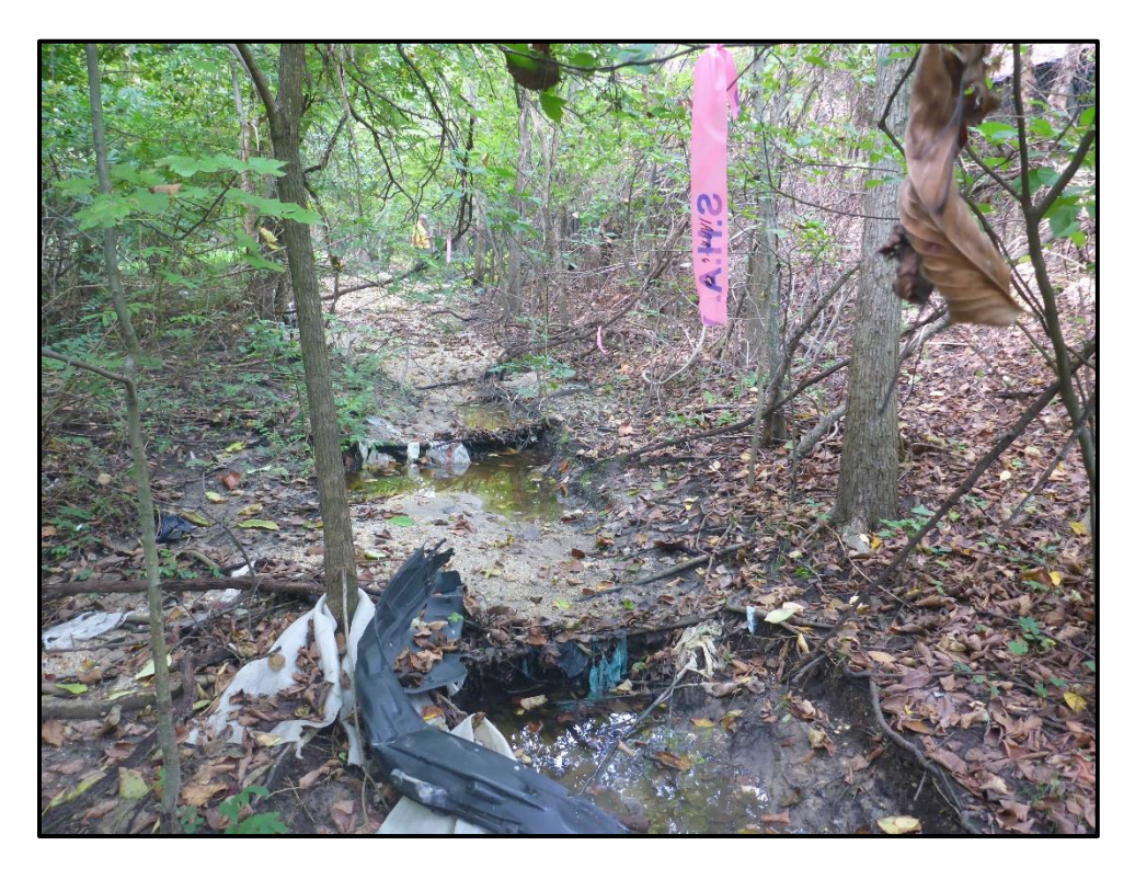
Waters 1AAA – Intermittent