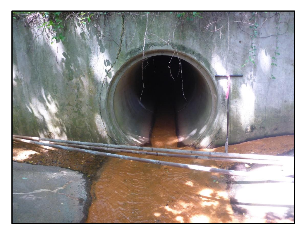
Waters 7G – Perennial