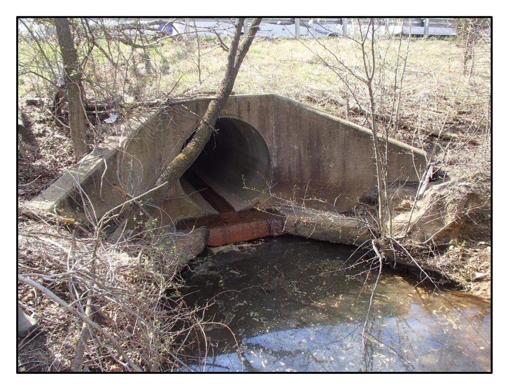
Waters 2R – Perennial