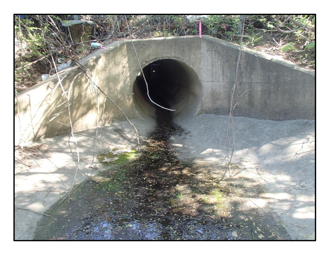
Waters 3WW – Perennial