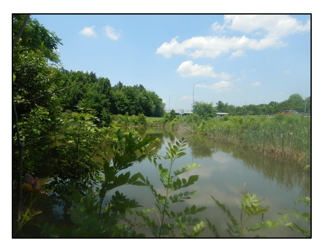
Waters 6EEEE – POW