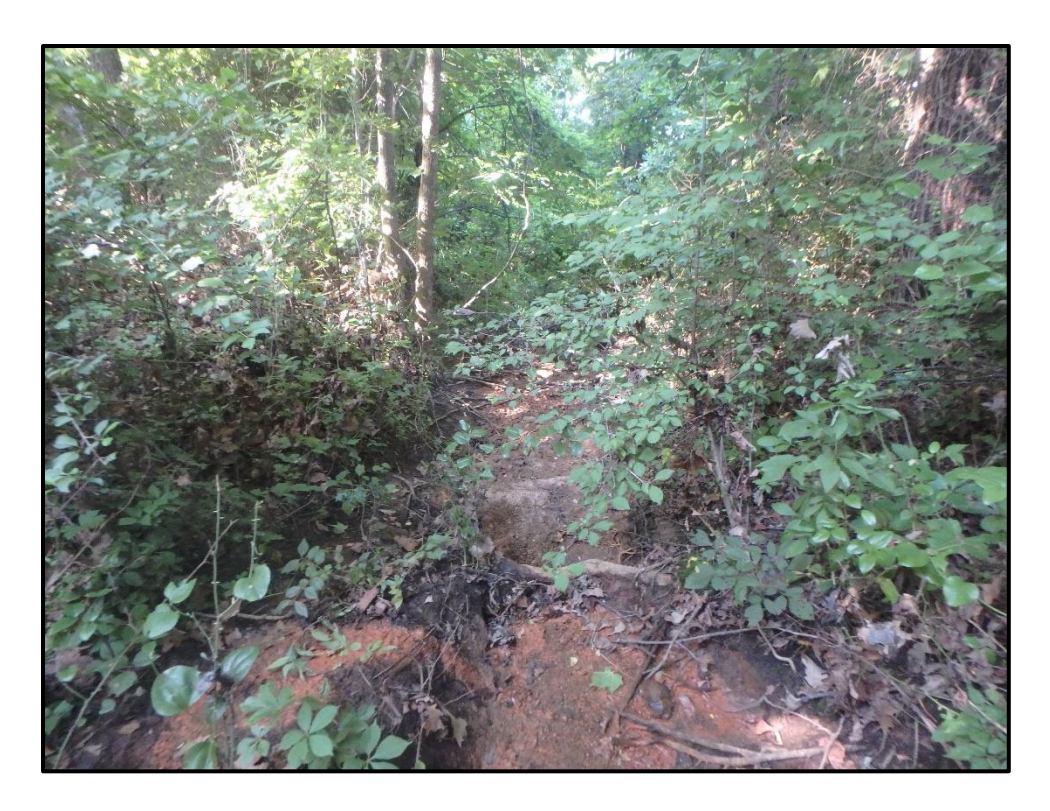
Waters 6T – Intermittent