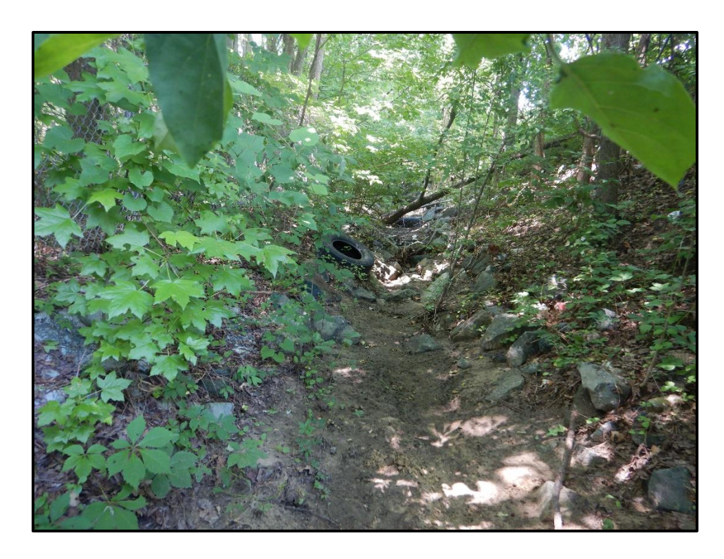
Waters 6DDDD – Ephemeral