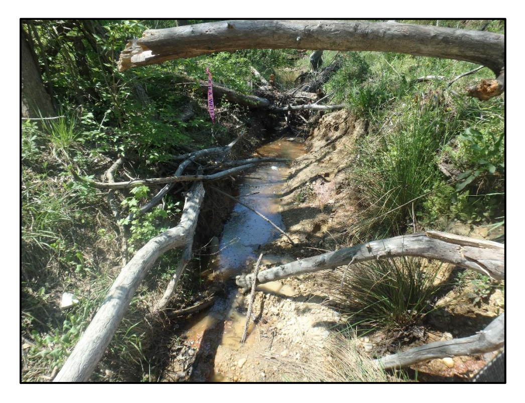
Waters 3SS – Intermittent