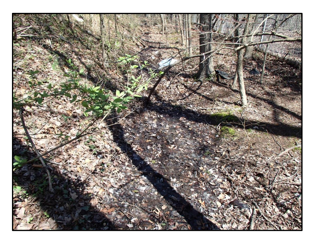
Wetland 3E – PFO