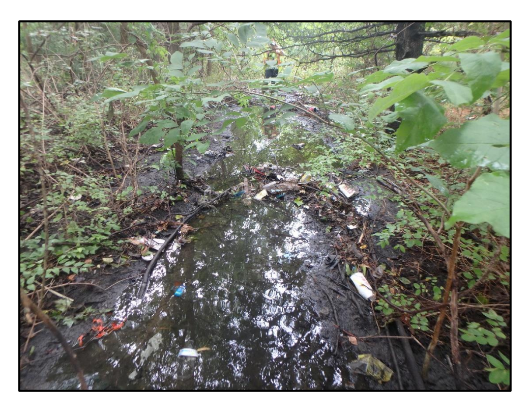
Waters 5BB – Ephemeral