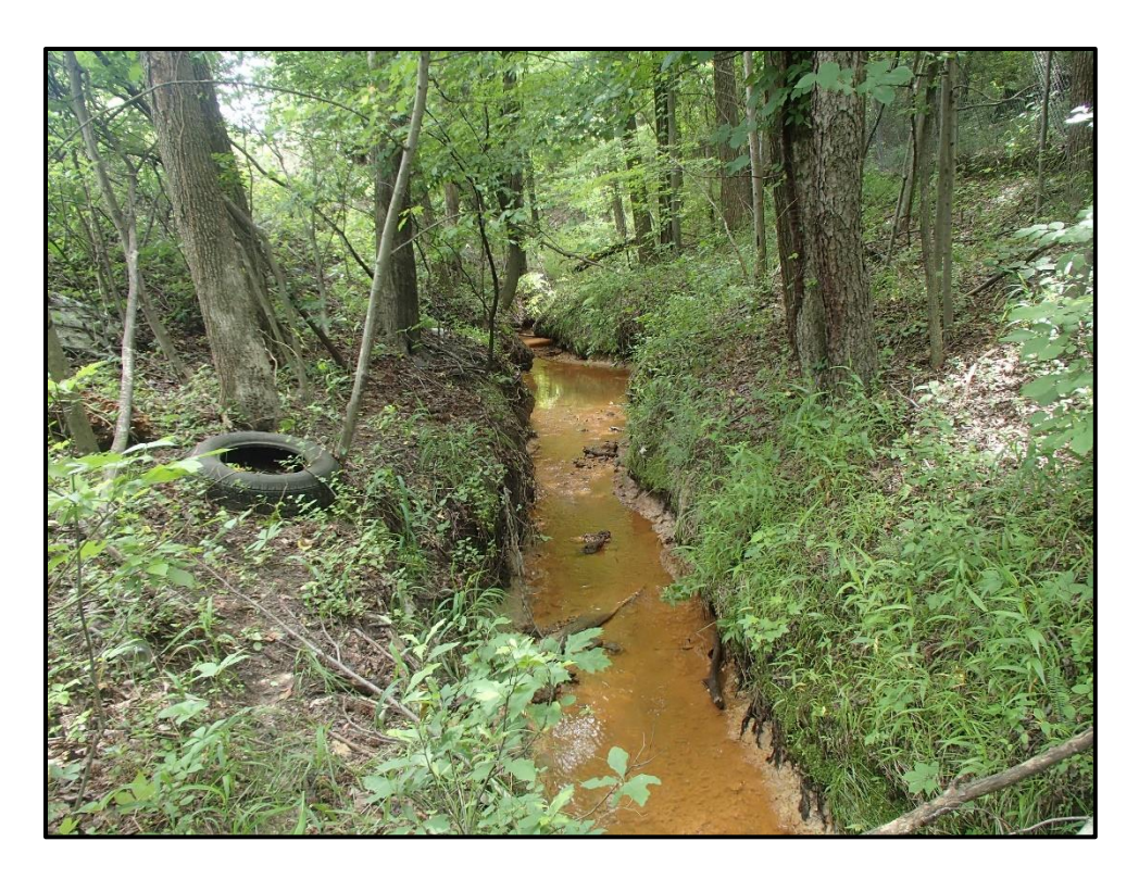
Waters 4PPPP – Perennial