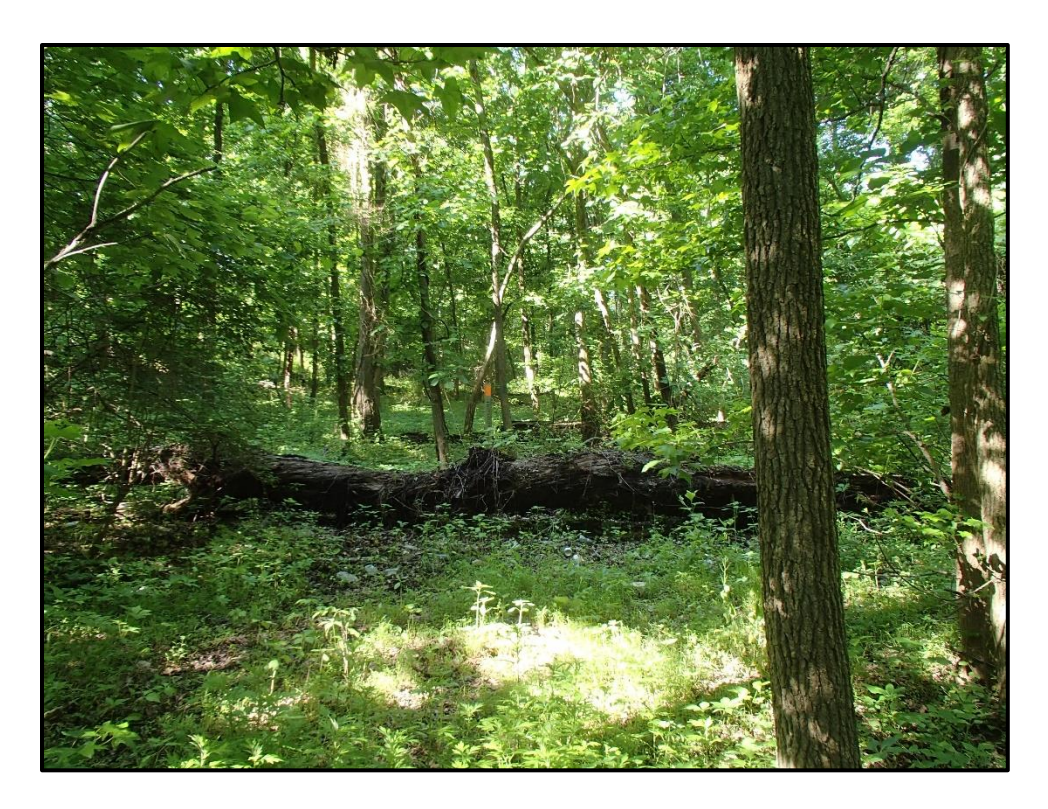
Wetland 3Y – PFO