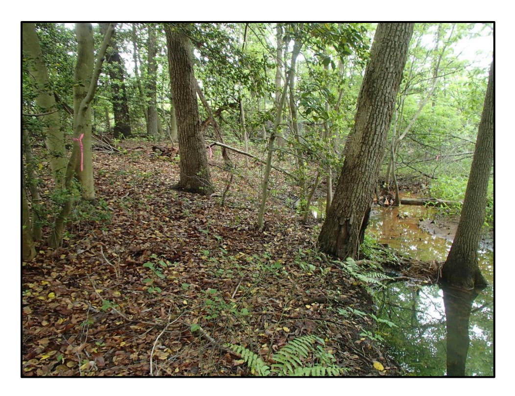
Wetland 3FF – PFO