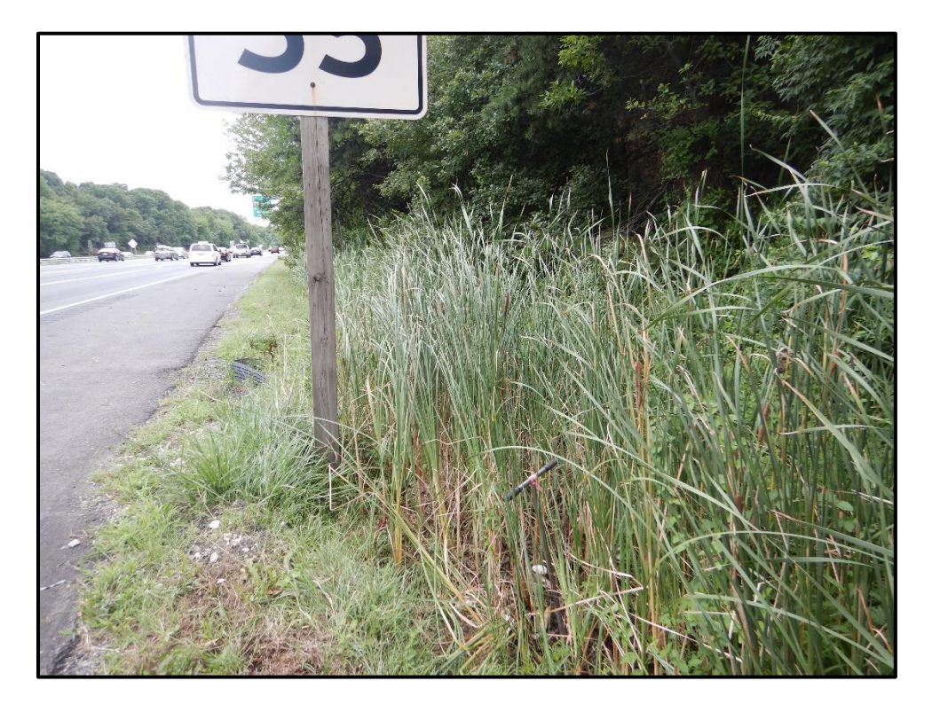
Wetland 2GG – PEM