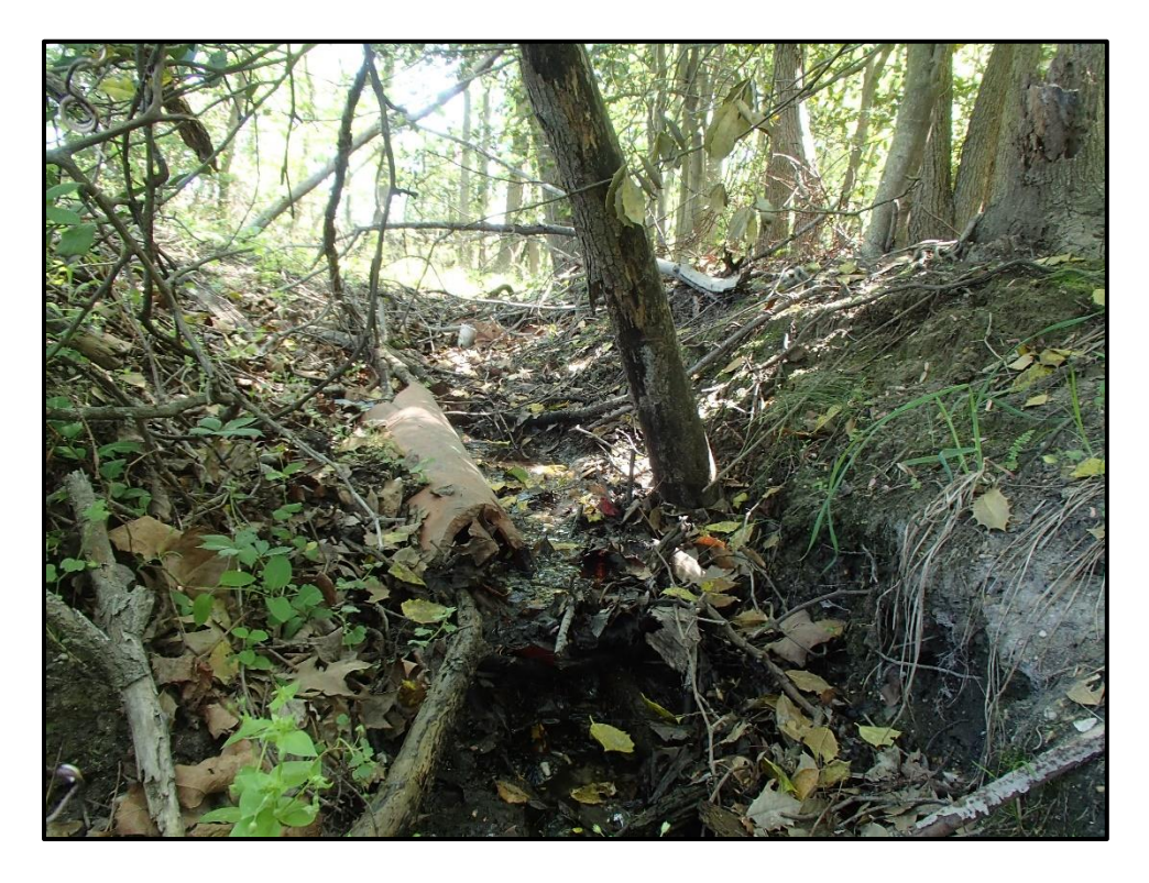
Waters 3XX – Intermittent