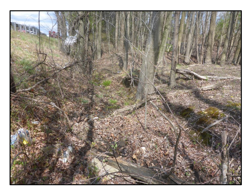
Wetland 4F – PFO