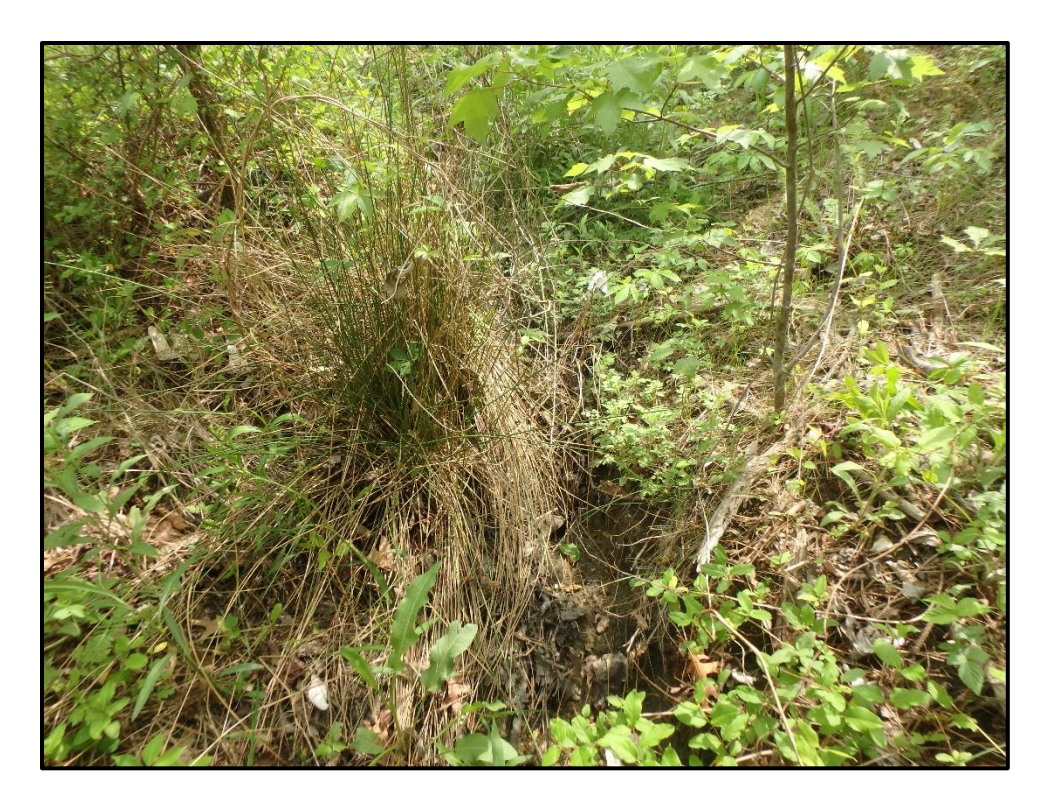
Waters 4FF – Ephemeral