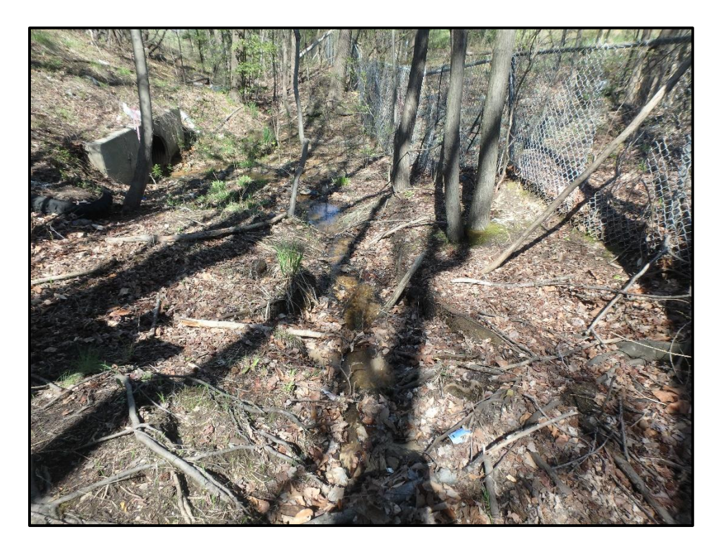
Waters 4U – Intermittent