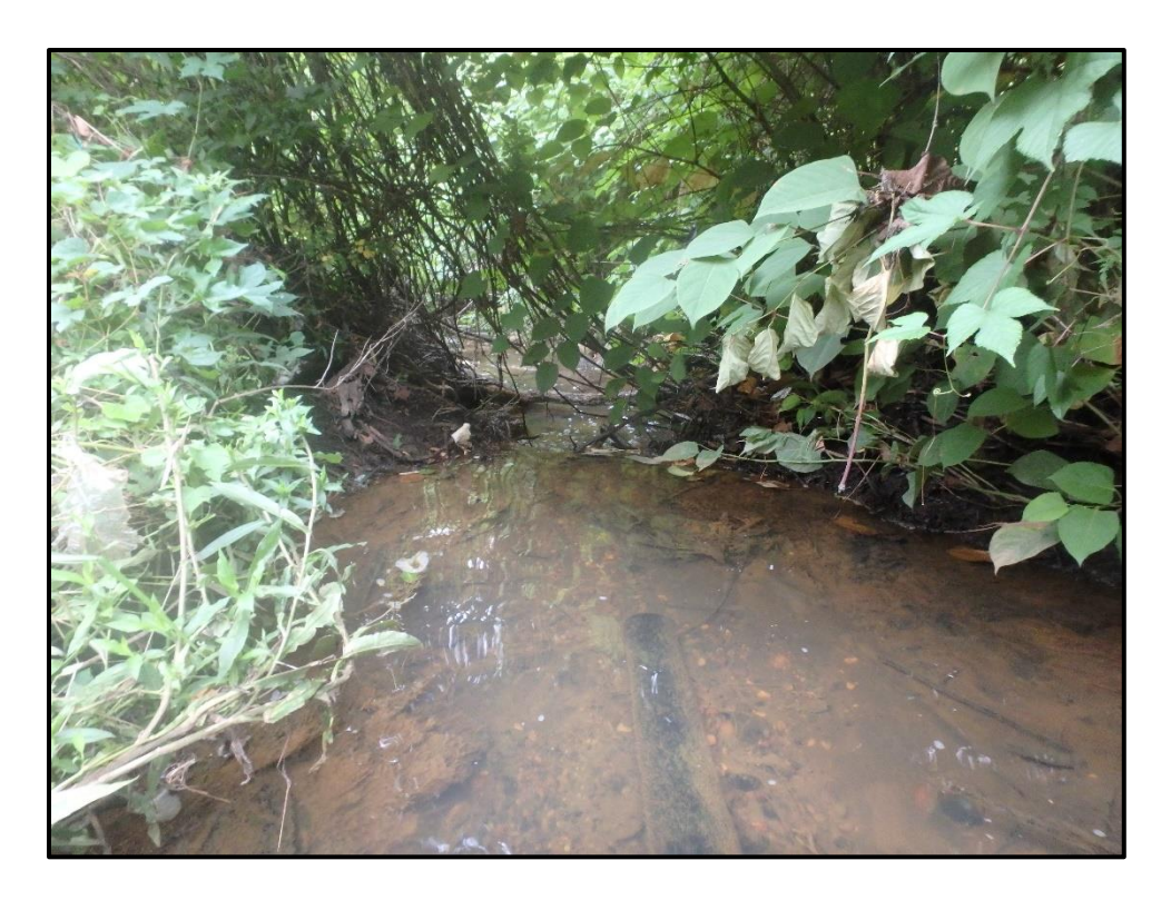
Waters 5F – Perennial