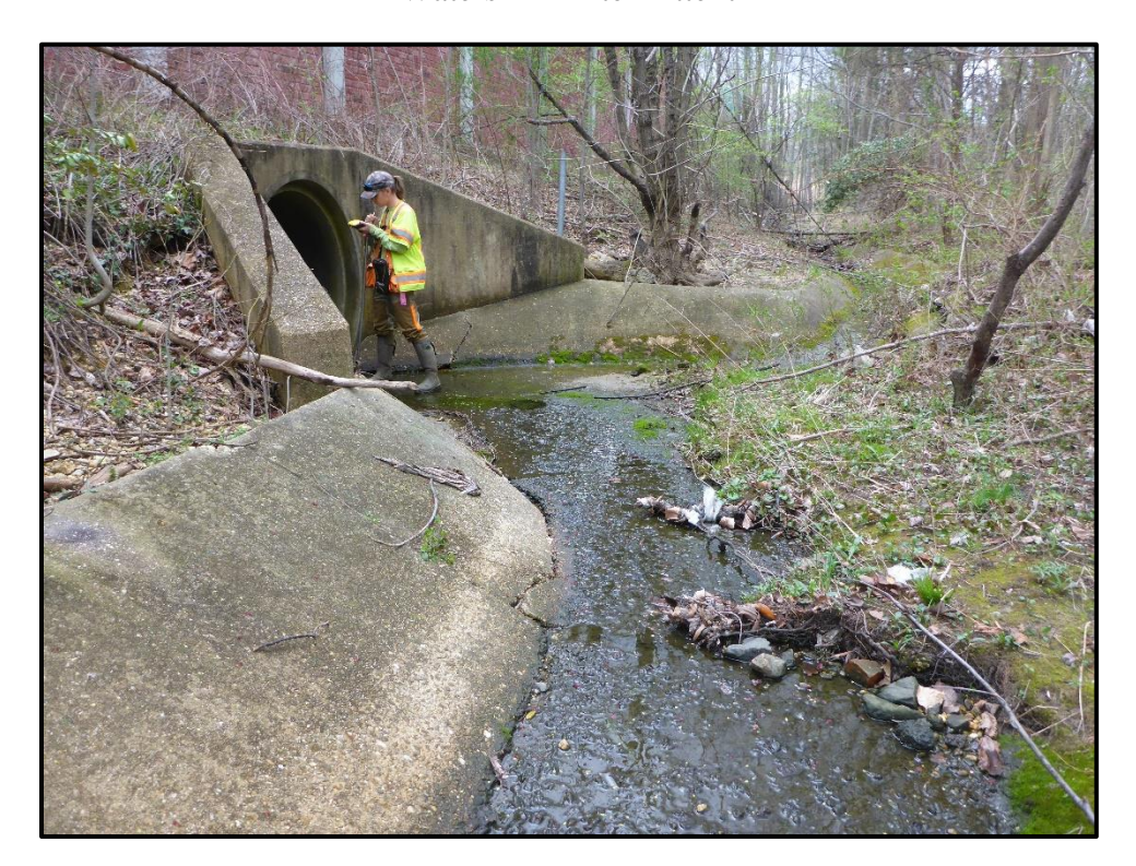
Waters 2I – Intermittent