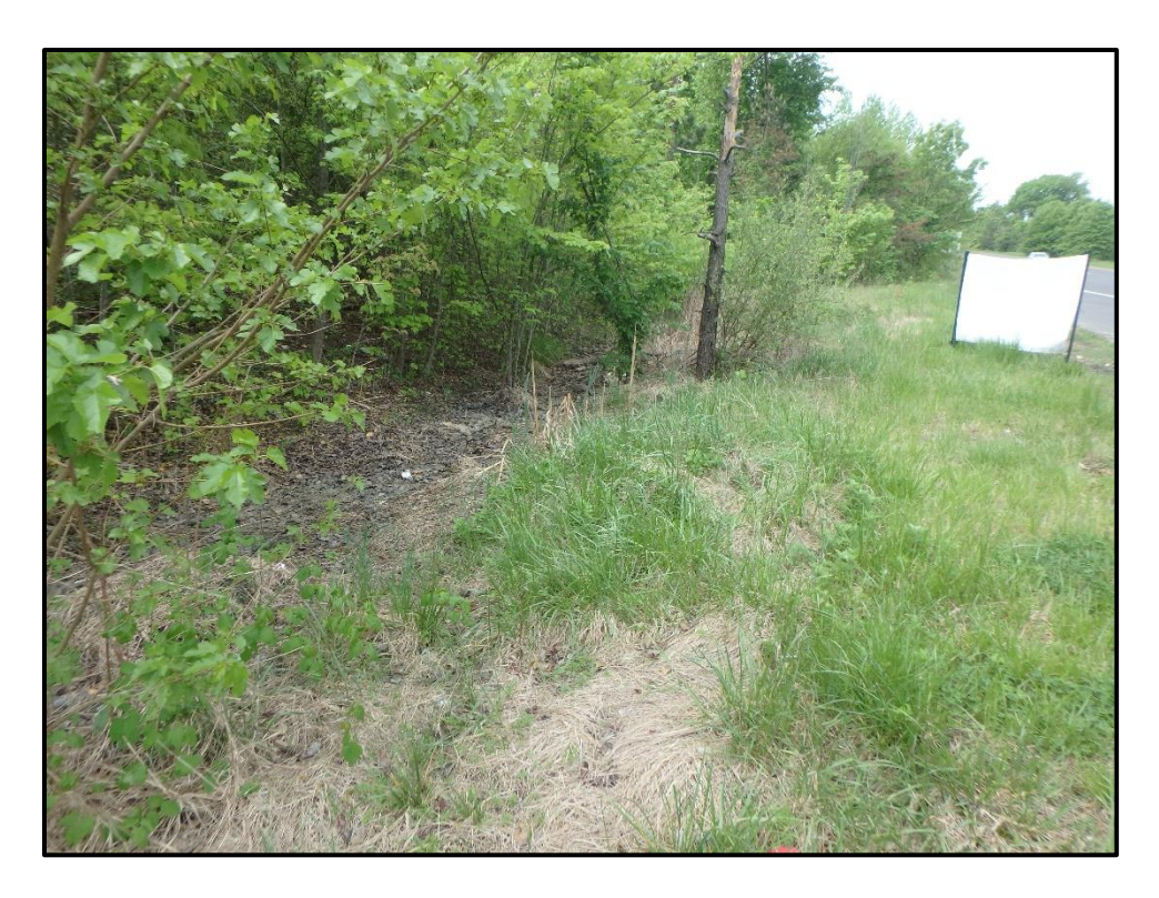
Wetland 4CC – PEM