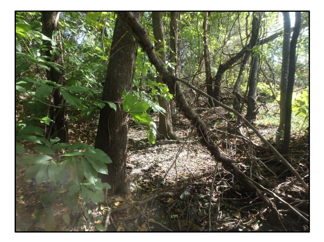
Wetland 5CC – PFO