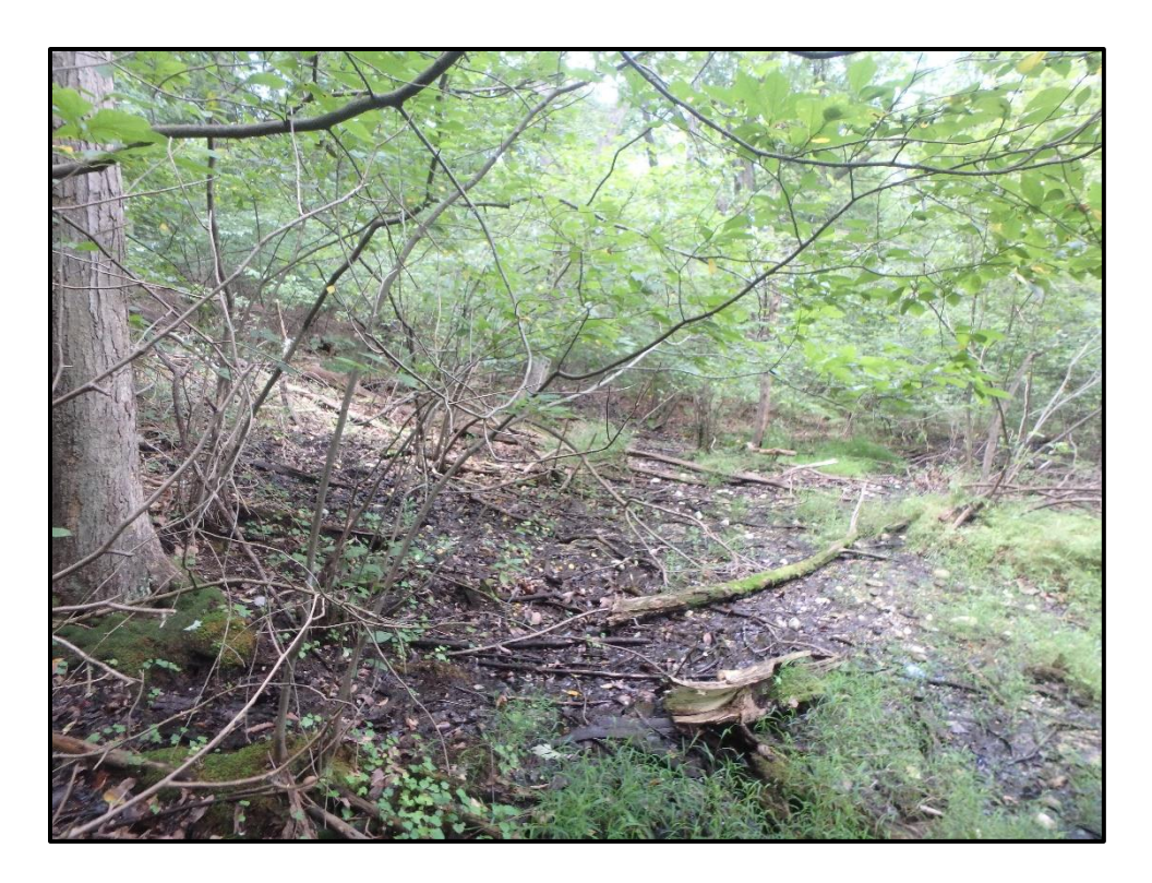
Wetland 1DD – PFO