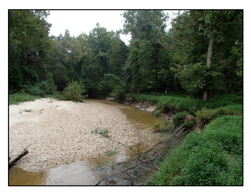
Waters 1VV – Perennial