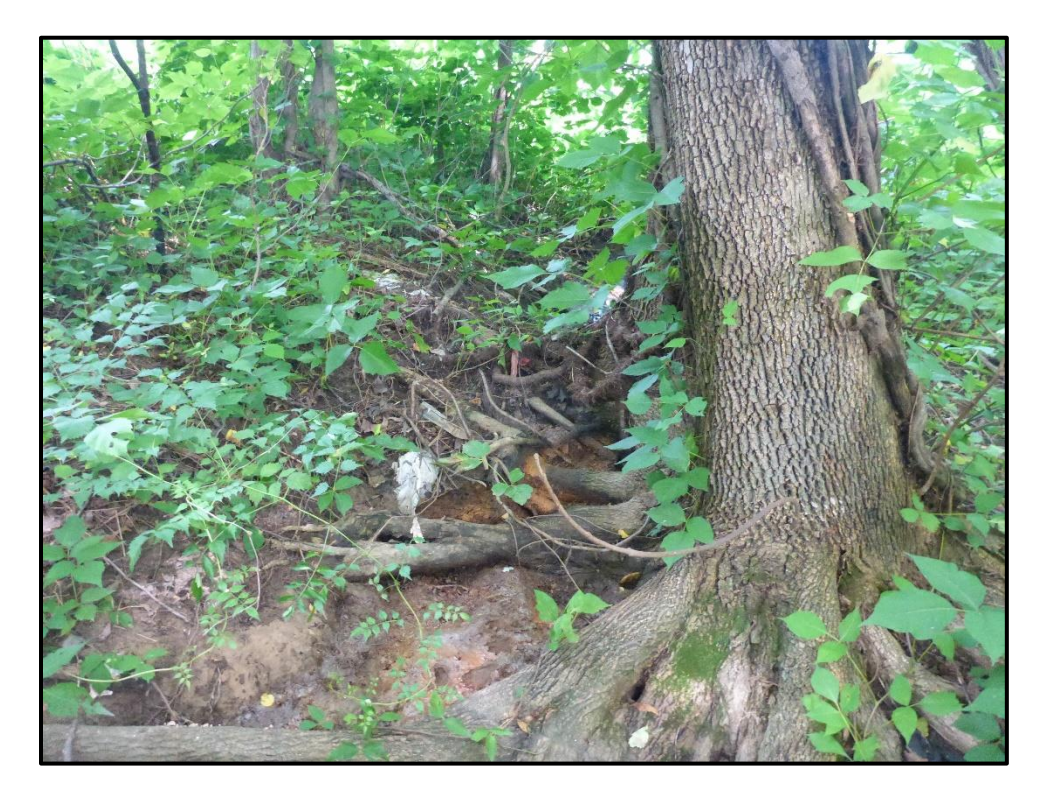
Waters 7D – Intermittent