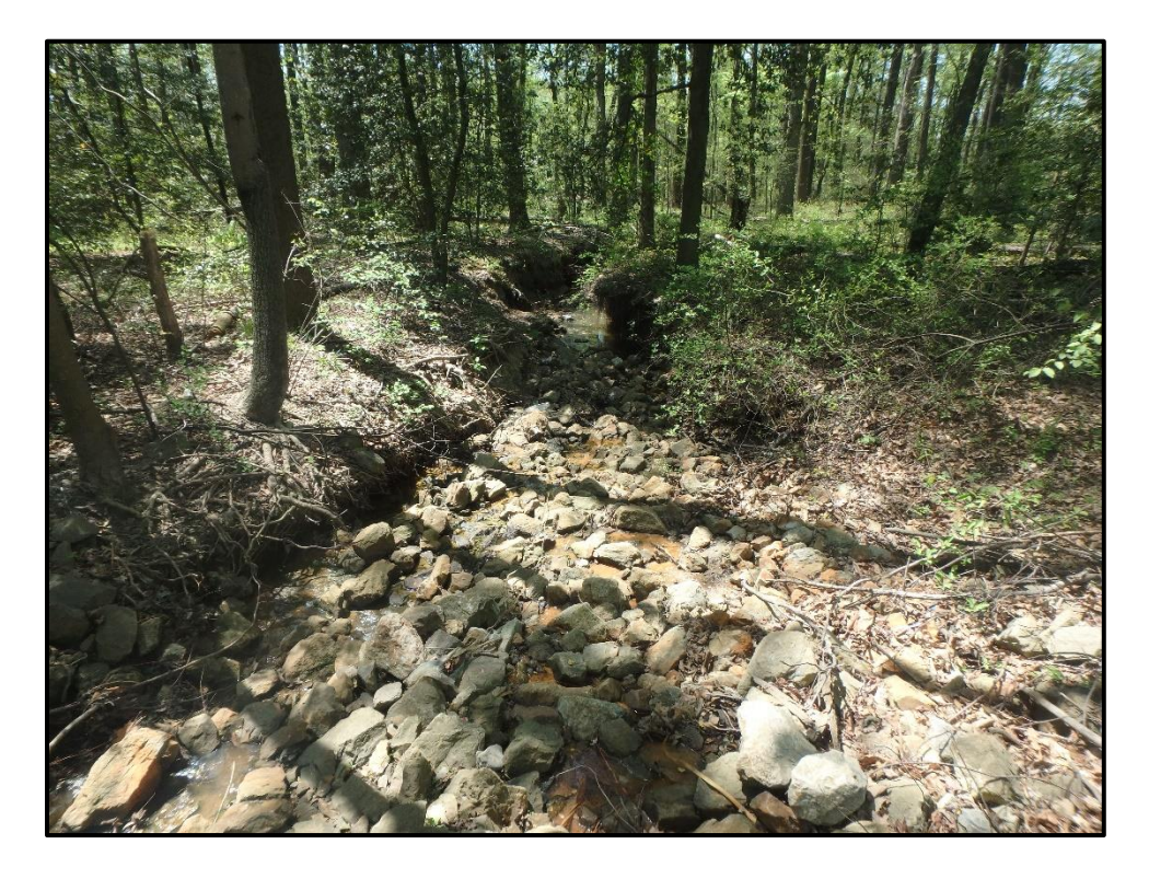
Waters 3TT – Perennial