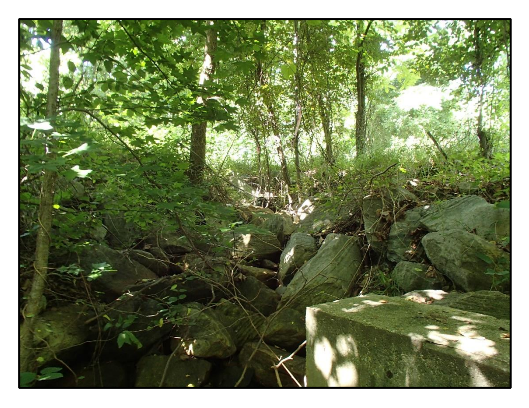
Waters 6NNN – Intermittent