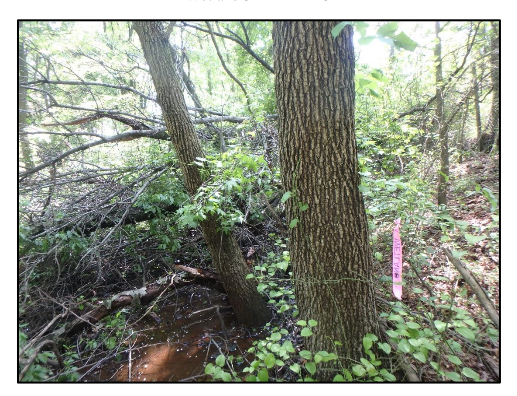
Wetland 3HHH – PFO