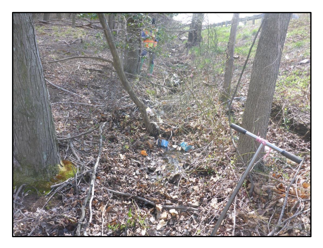
Wetland 4F – PFO