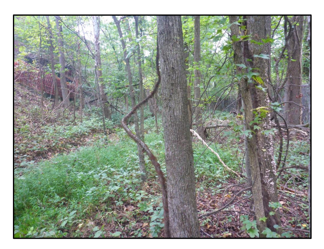
Wetland 1ZZ – PFO