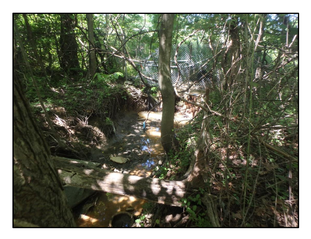
Waters 6B – Perennial