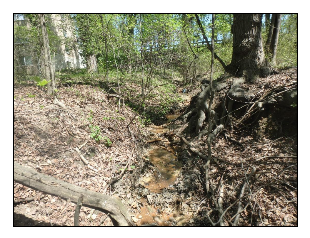
Waters 3UU – Intermittent