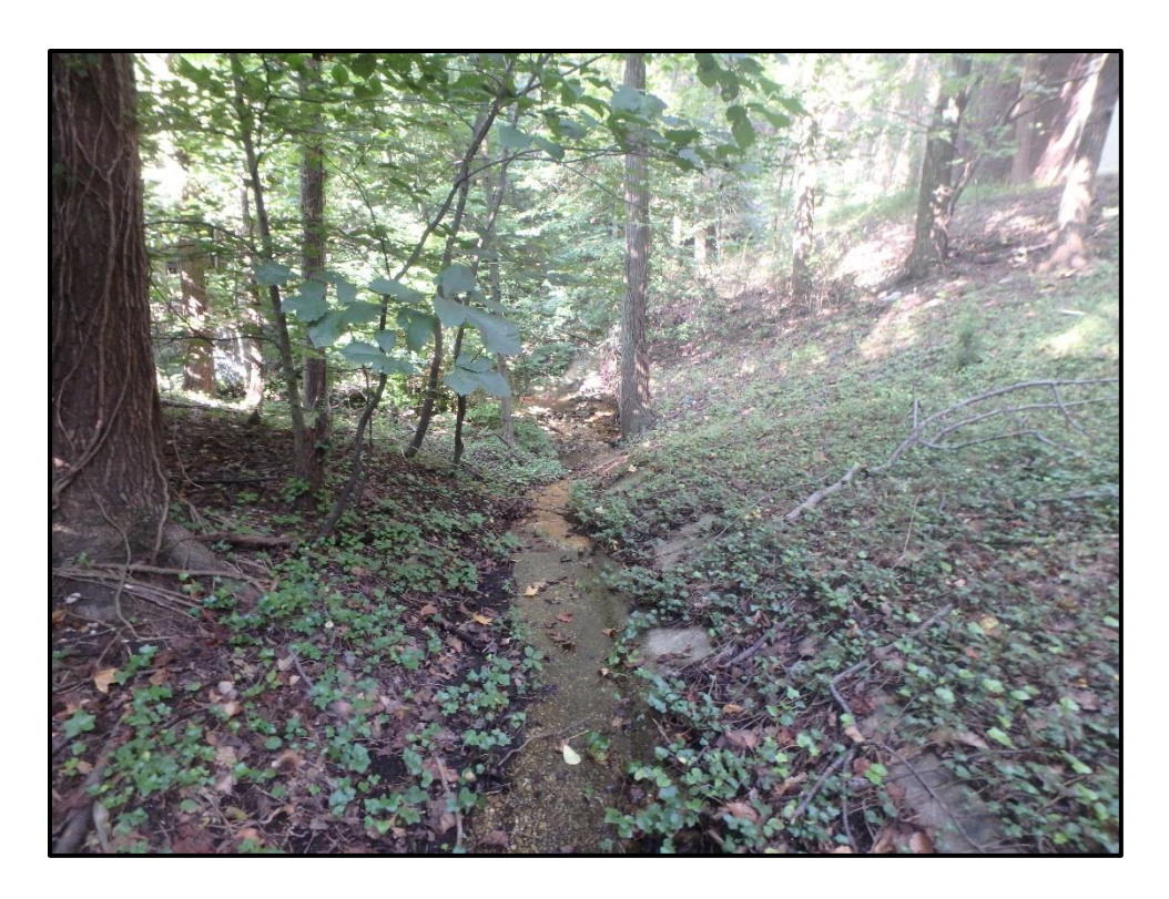
Waters 1LL – Intermittent