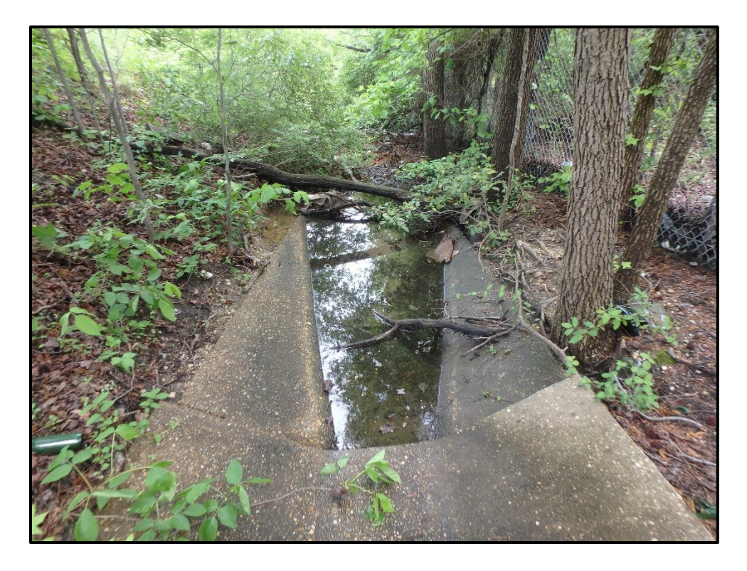
Waters 3FFF – Intermittent