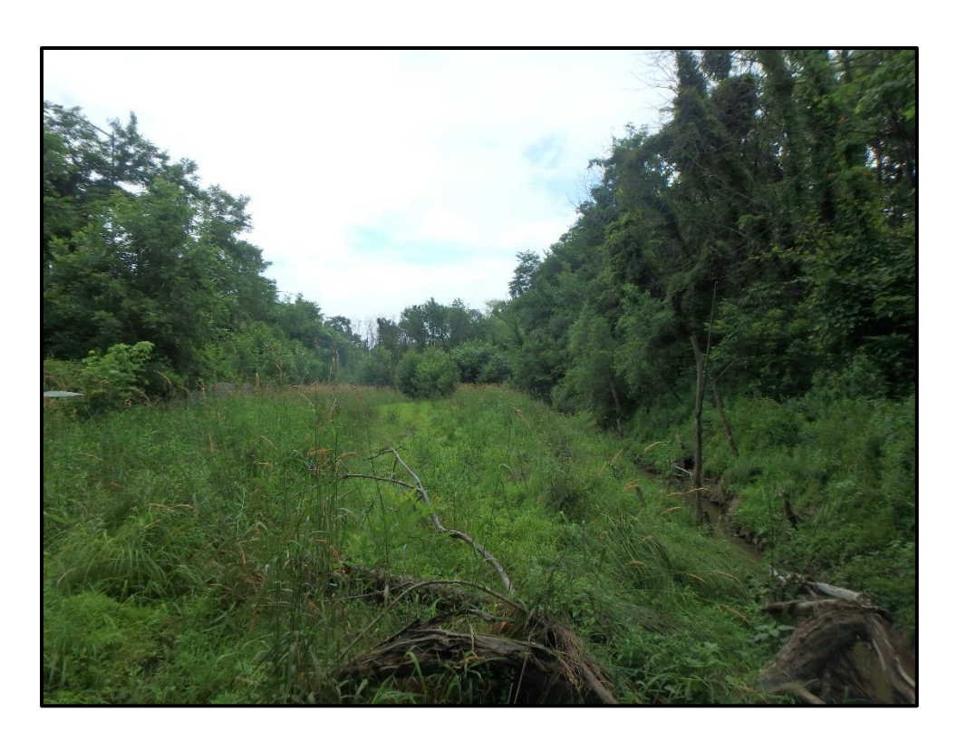
Wetland 6OO – PEM