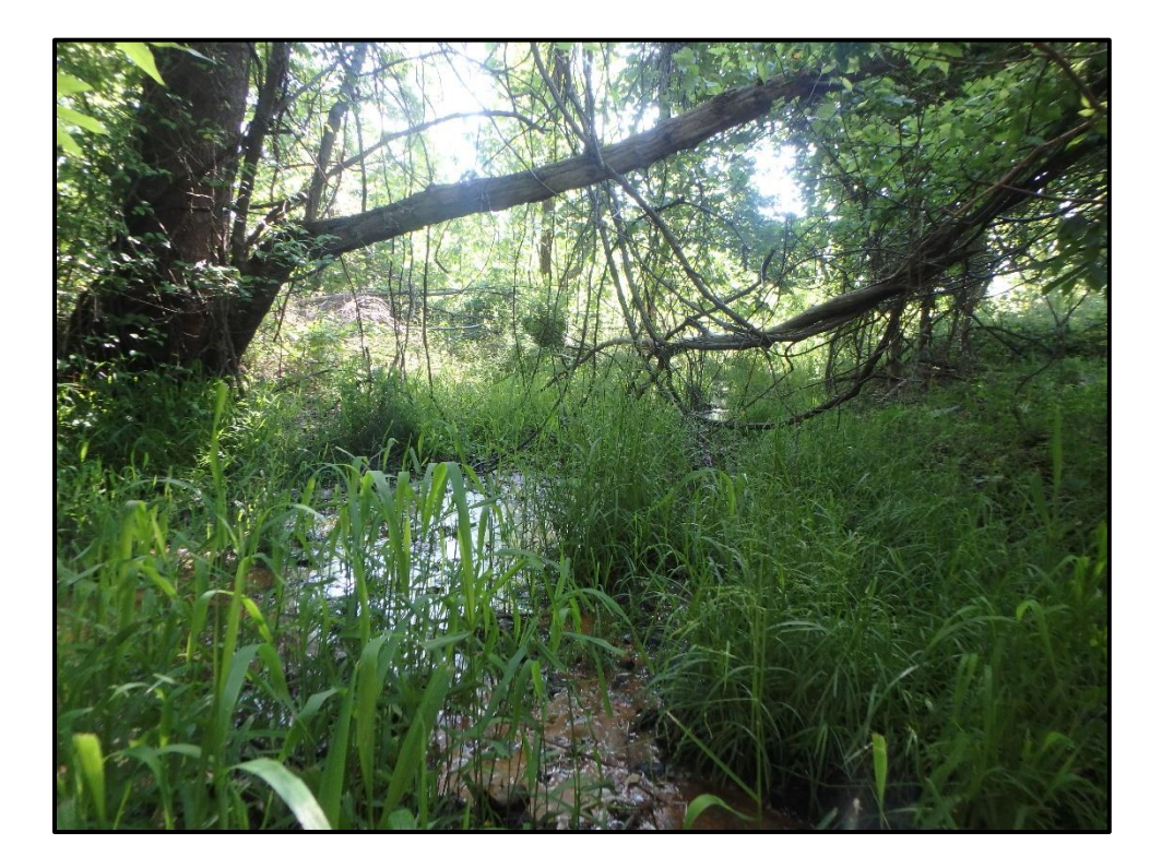
Wetland 6A – PFO