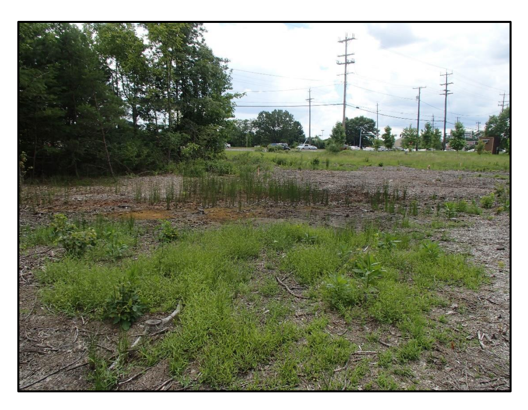
Wetland 6QQQ - PEM