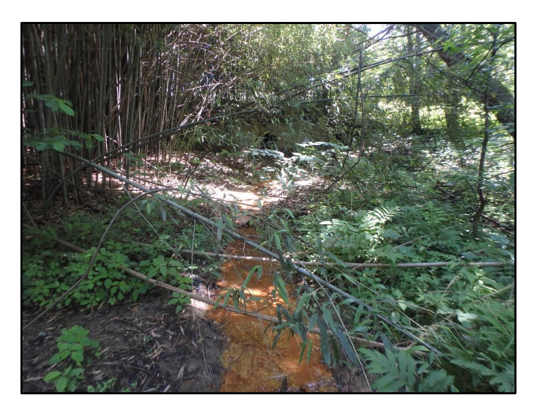
Waters 4NNN – Intermittent