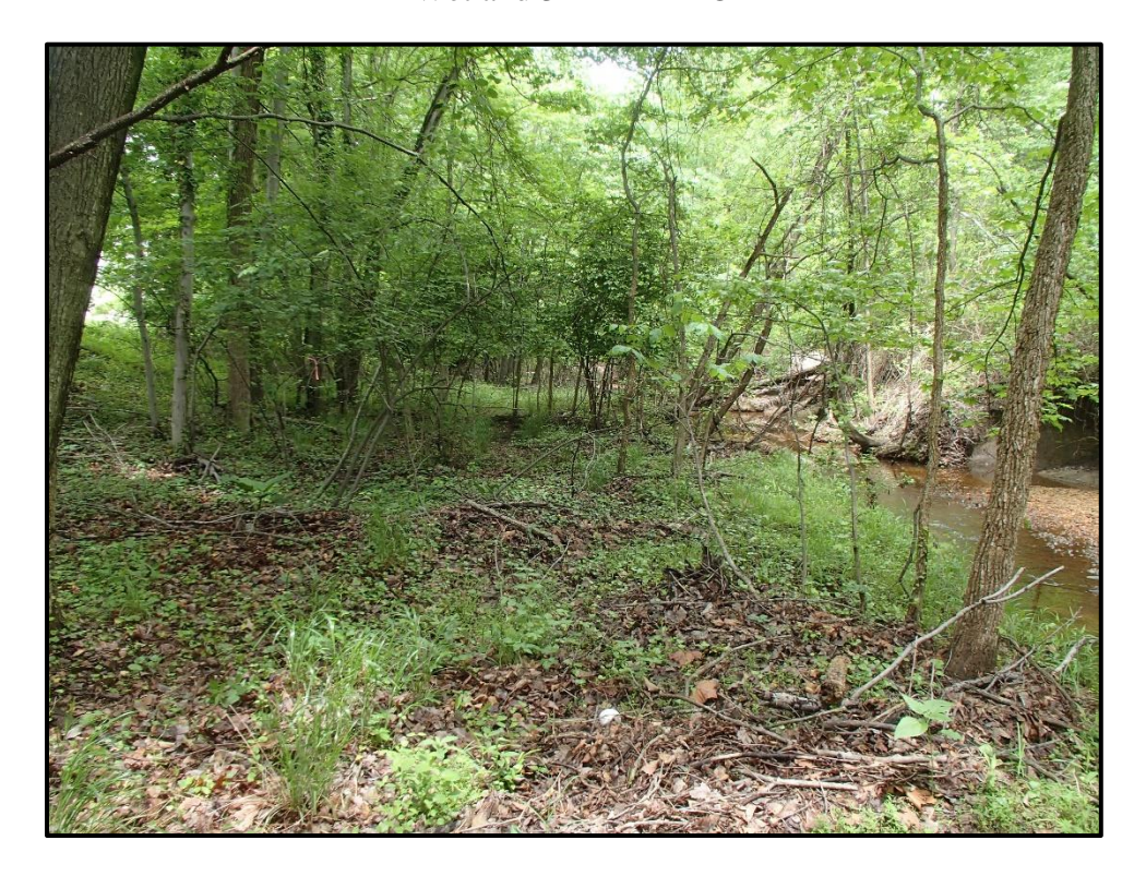
Wetland 3AAA – PFO