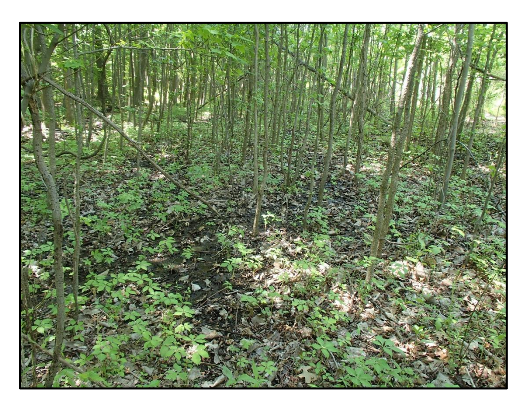
Wetland 4BB – PFO