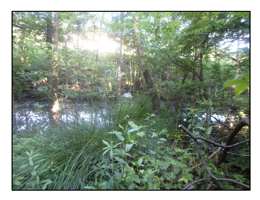
Wetland 6I – PFO