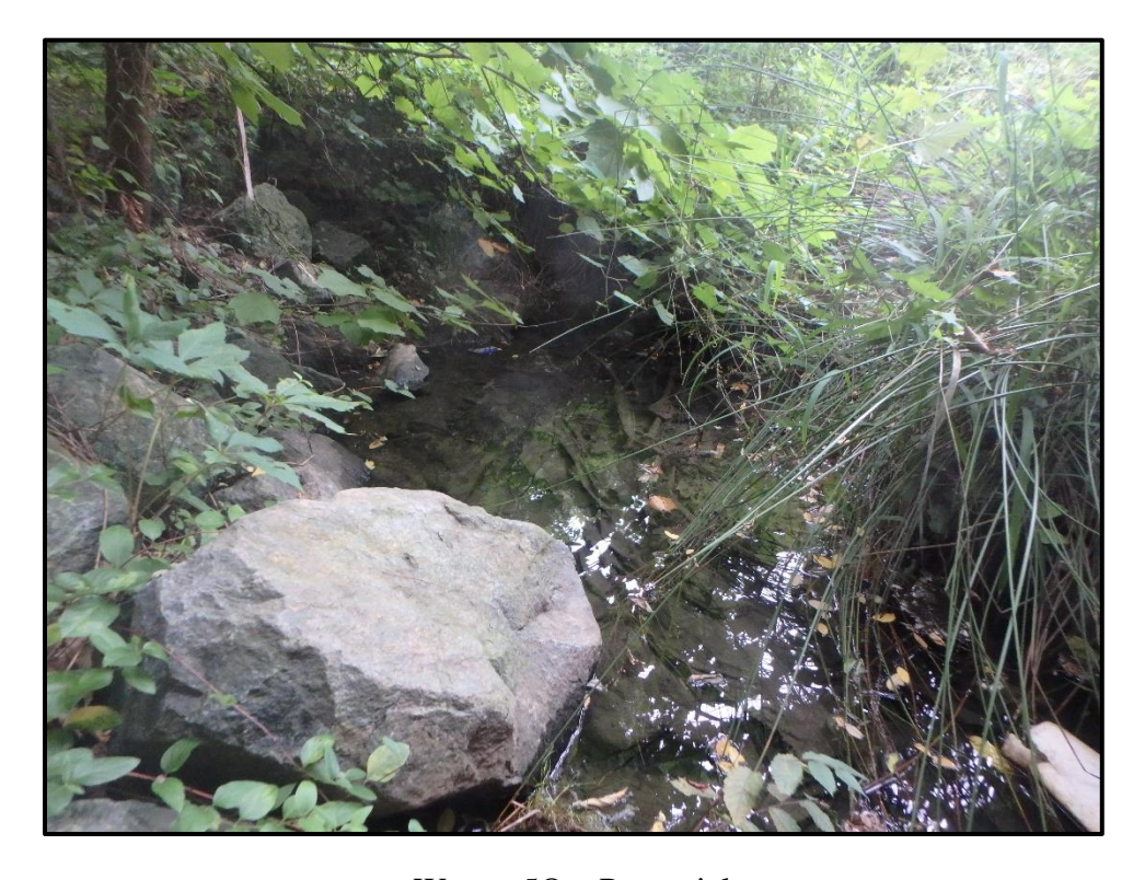
Waters 5Q - Perennial