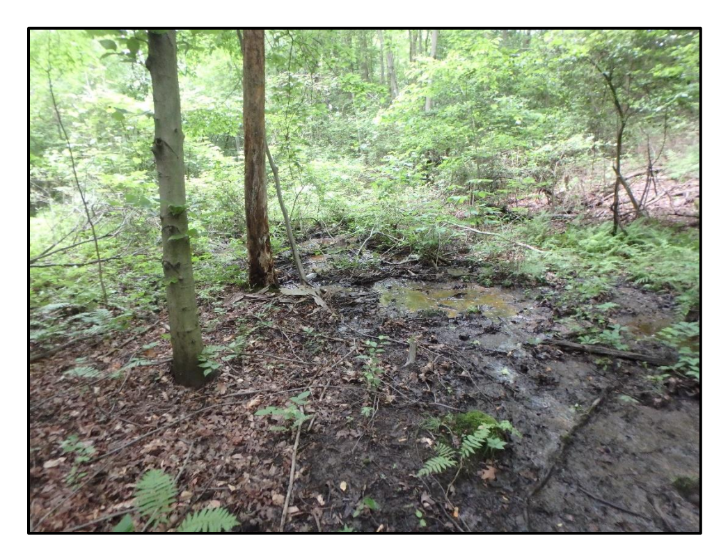
Wetland 4KK – PFO