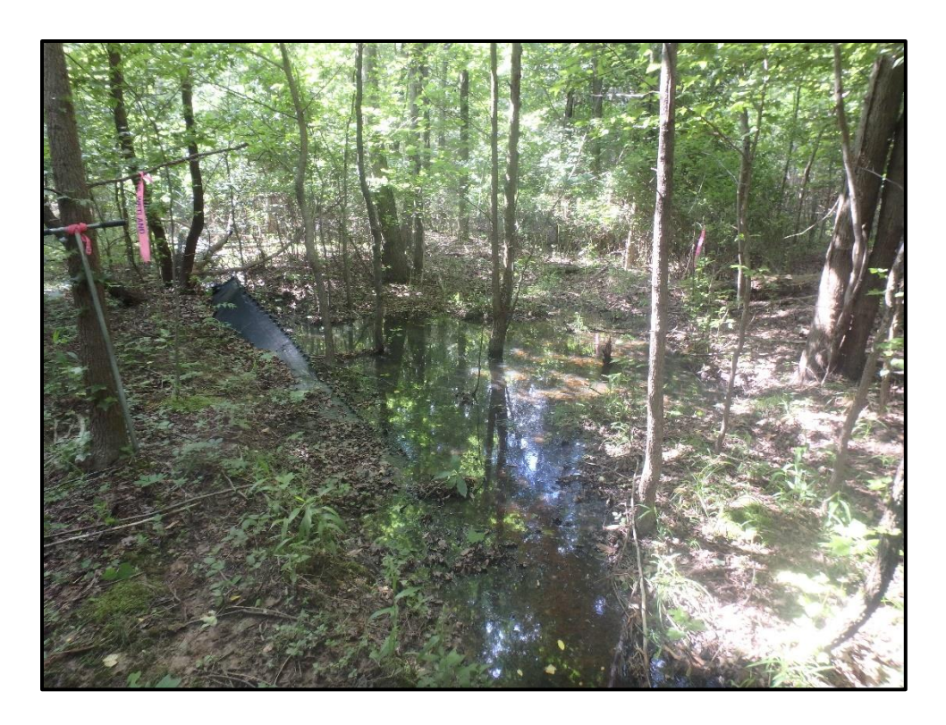
Wetland 4VV – PFO