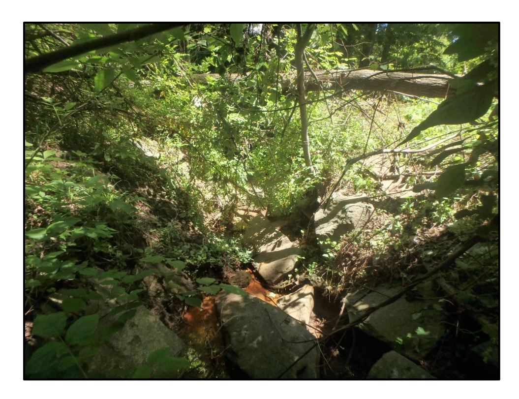
Waters 6D – Intermittent