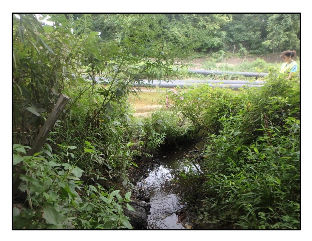
Waters 5Q - Perennial