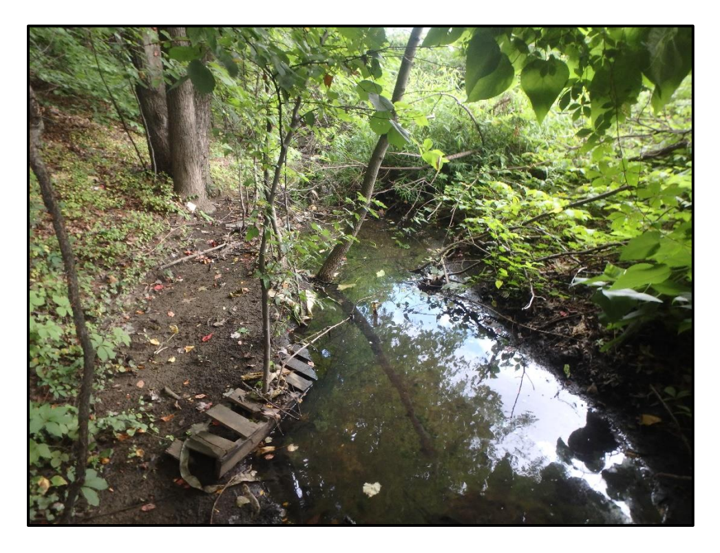
Waters 7N – Perennial