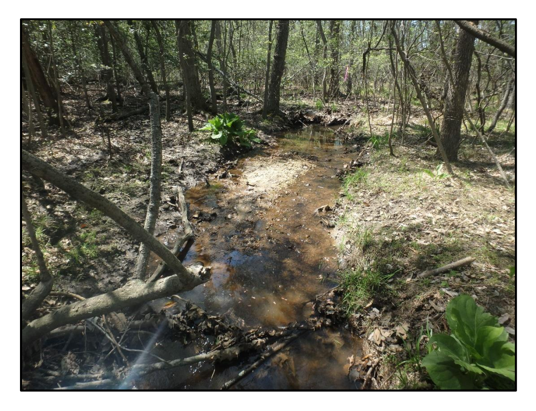
Waters 3VV – Perennial