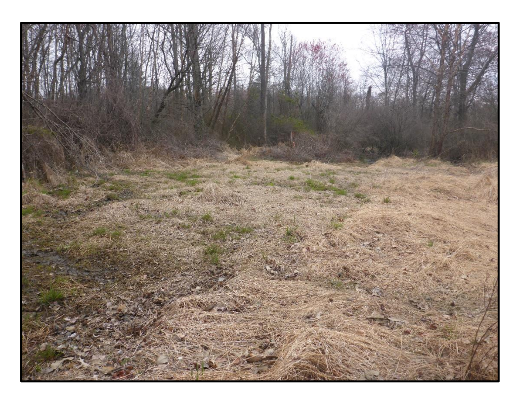
Wetland 3P – PEM