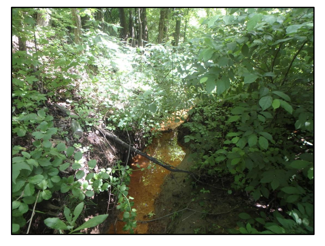
Waters 4NNN – Intermittent