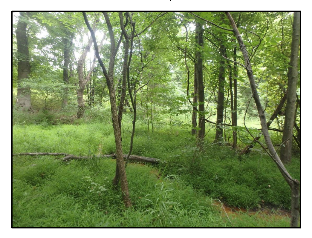
Wetland 5C – PFO