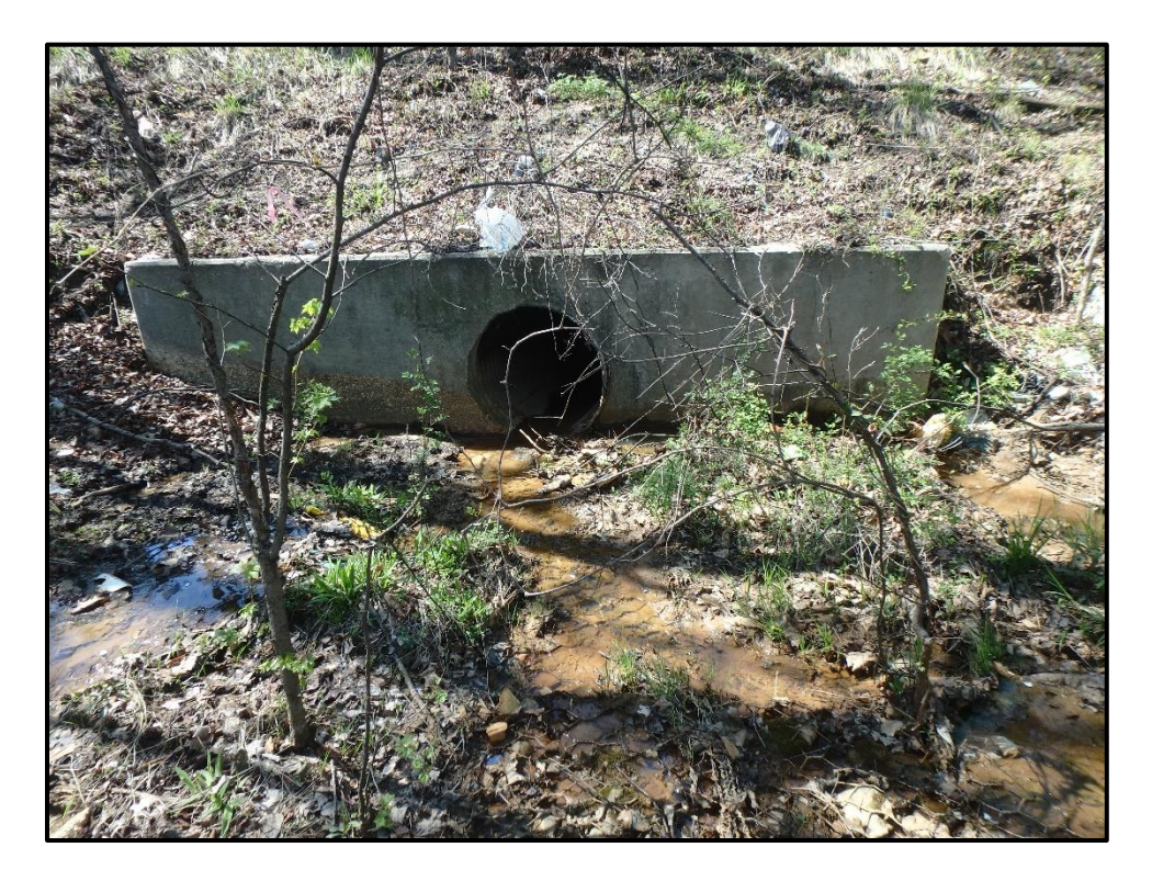
Waters 4T – Intermittent