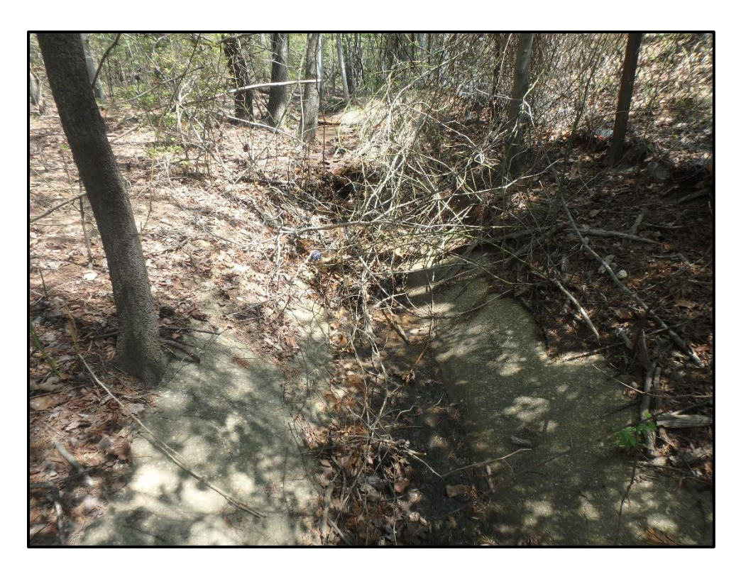
Waters 2AA – Intermittent