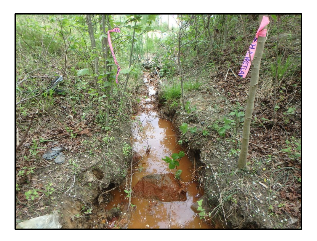
Waters 4EE – Perennial