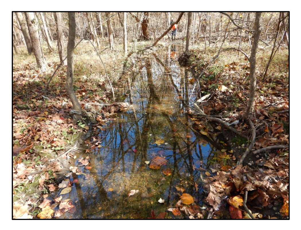
Waters 5KK – Intermittent