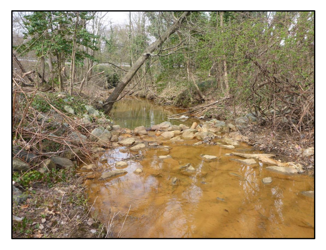
Waters 1Q – Perennial