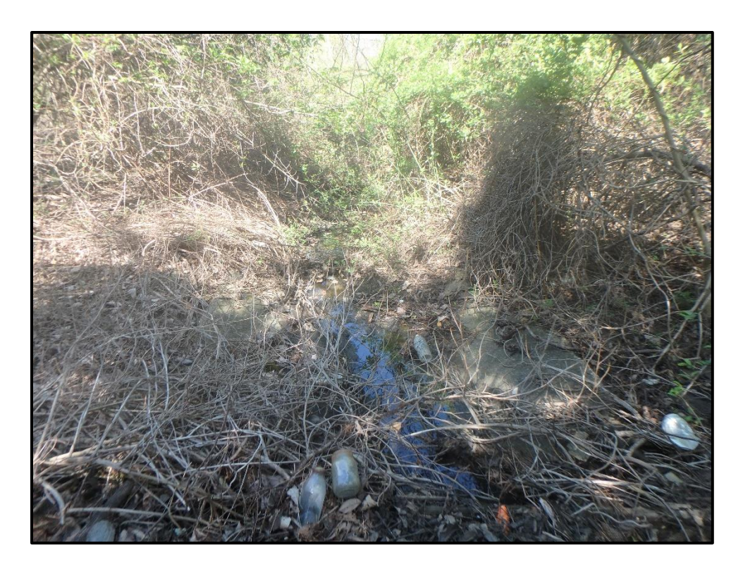
Waters 3LL – Intermittent