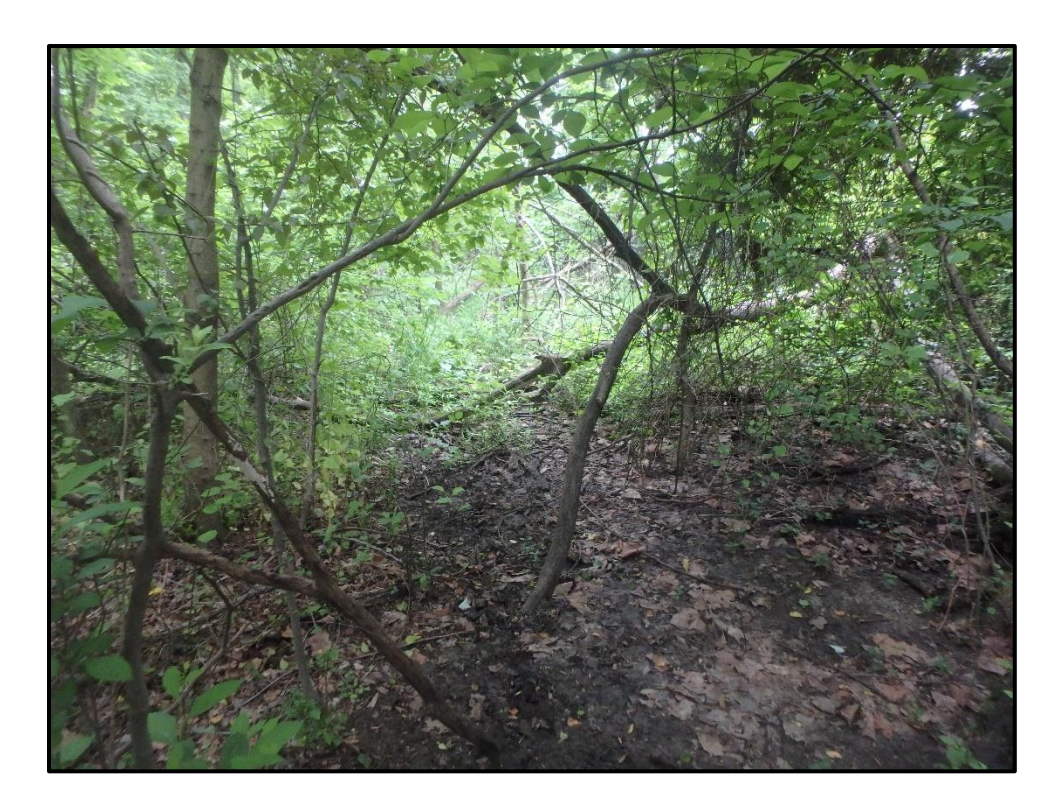
Wetland 6F – PFO