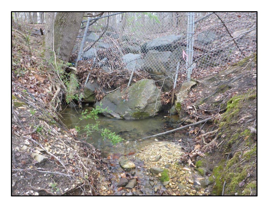
Waters 4B - Intermittent