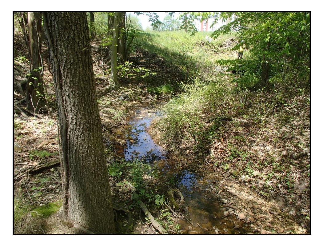
Waters 2Y – Perennial