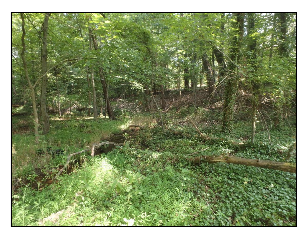
Wetland 1QQ - PFO