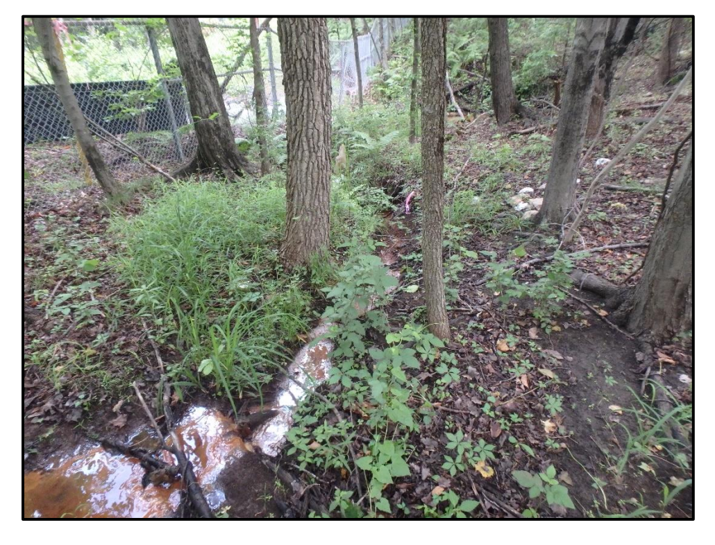
Waters 40000 – Intermittent