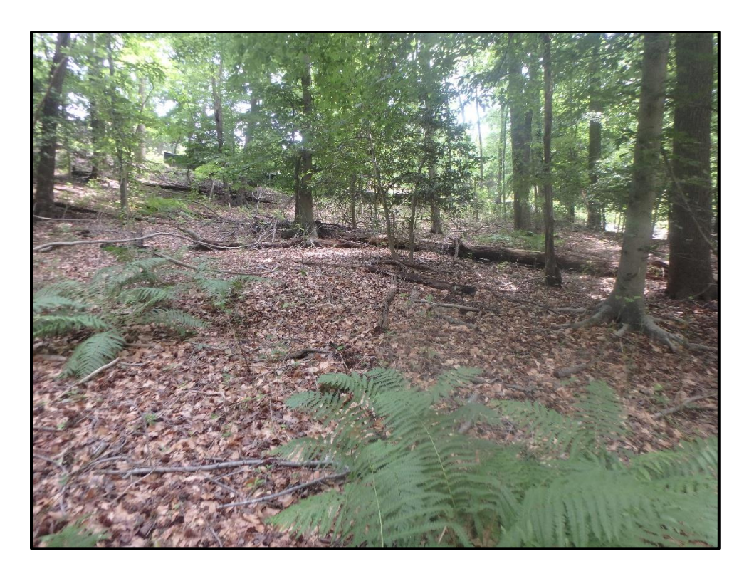
Wetland 4IIII – PFO