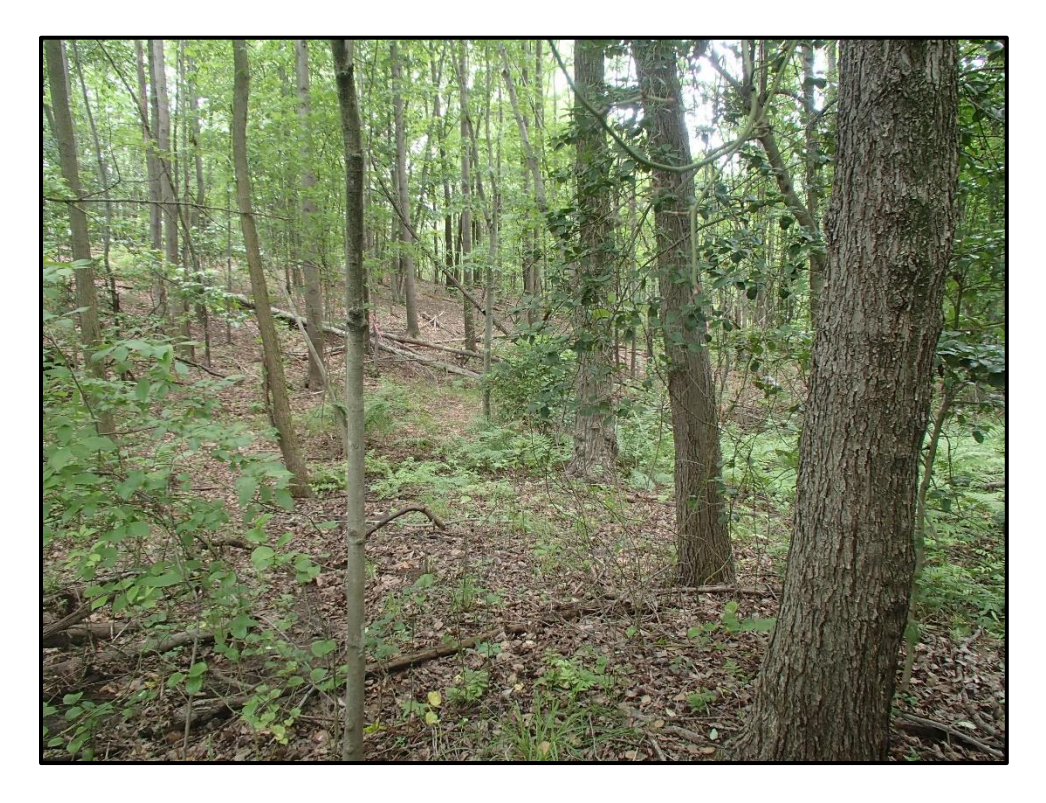
Wetland 4AAAA – PFO