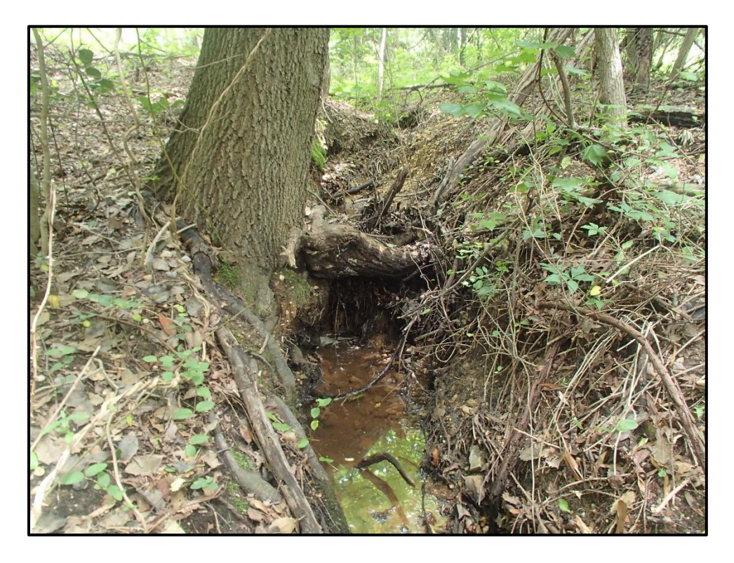
Waters 4GGGG – Perennial