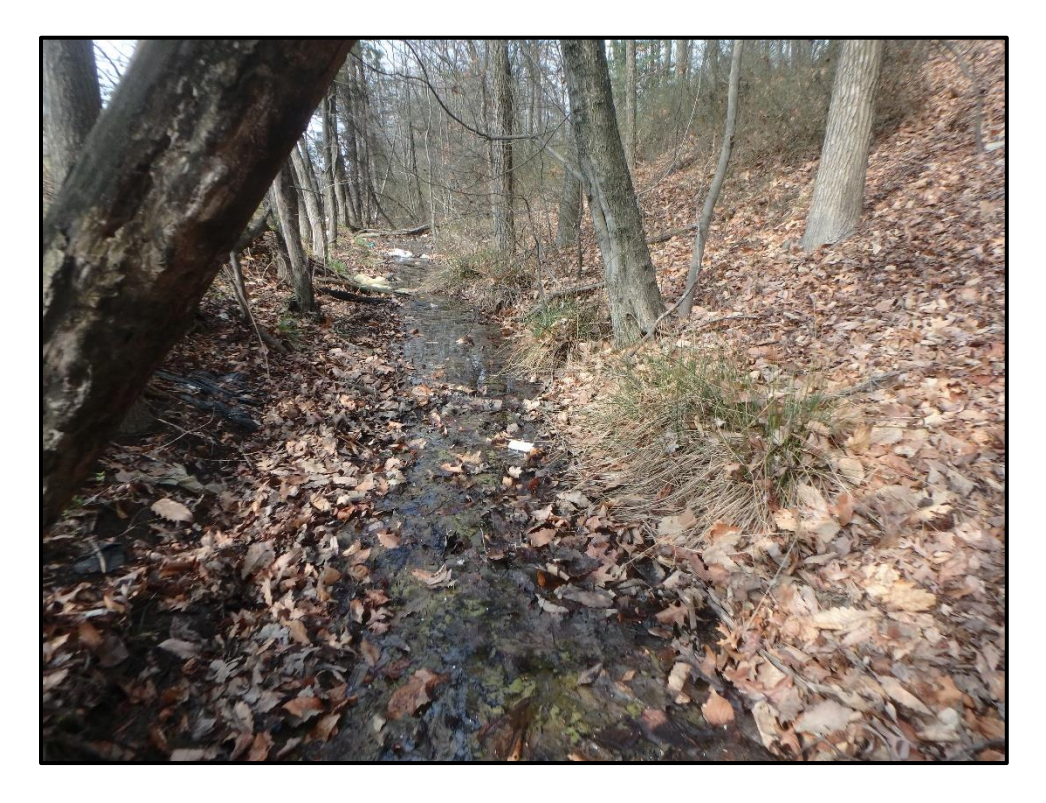
Waters 3CC – Intermittent