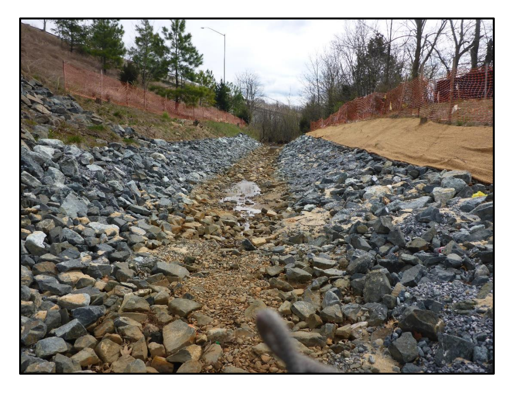
Waters 1R – Intermittent