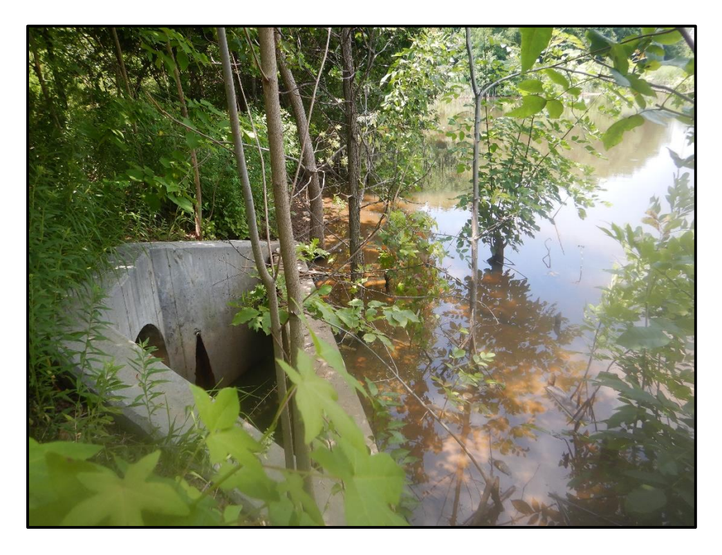
Waters 6EEEE – POW