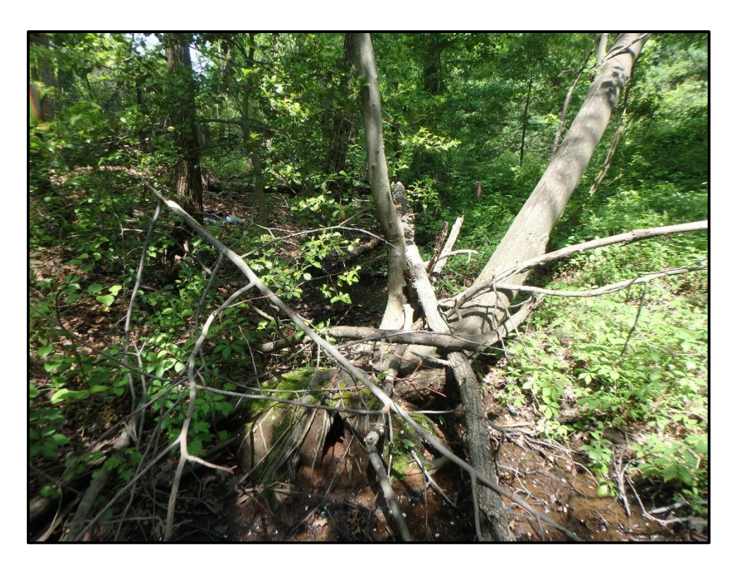
Wetland 3HHH – PFO