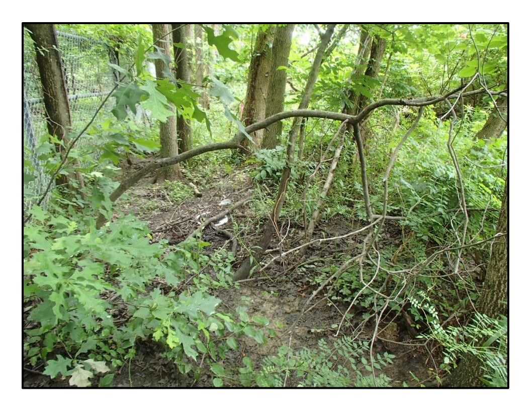
Wetland 6PP – PFO