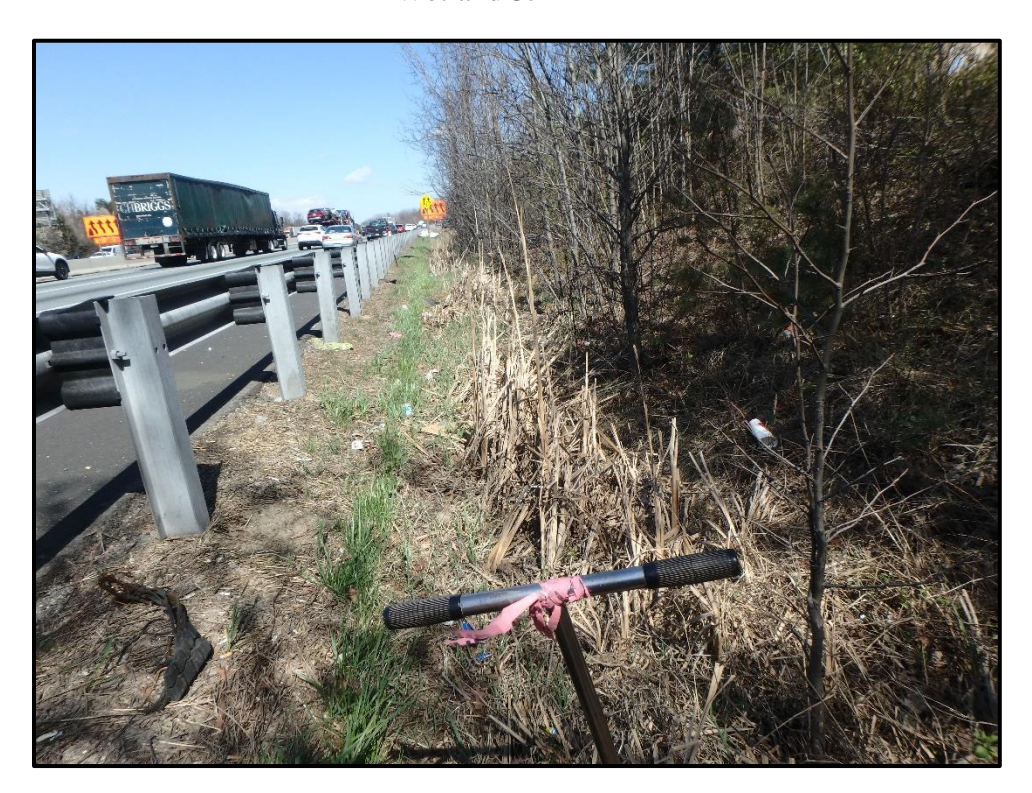
Wetland 3J – PEM