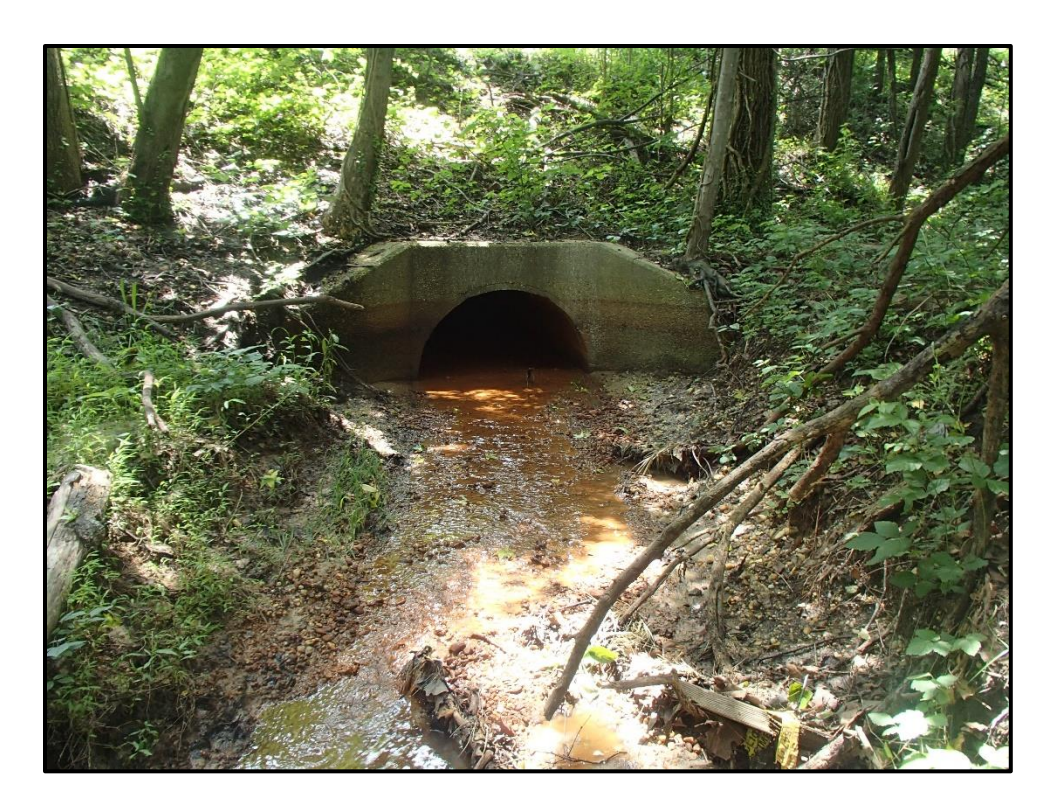
Waters 4DDDD – Intermittent