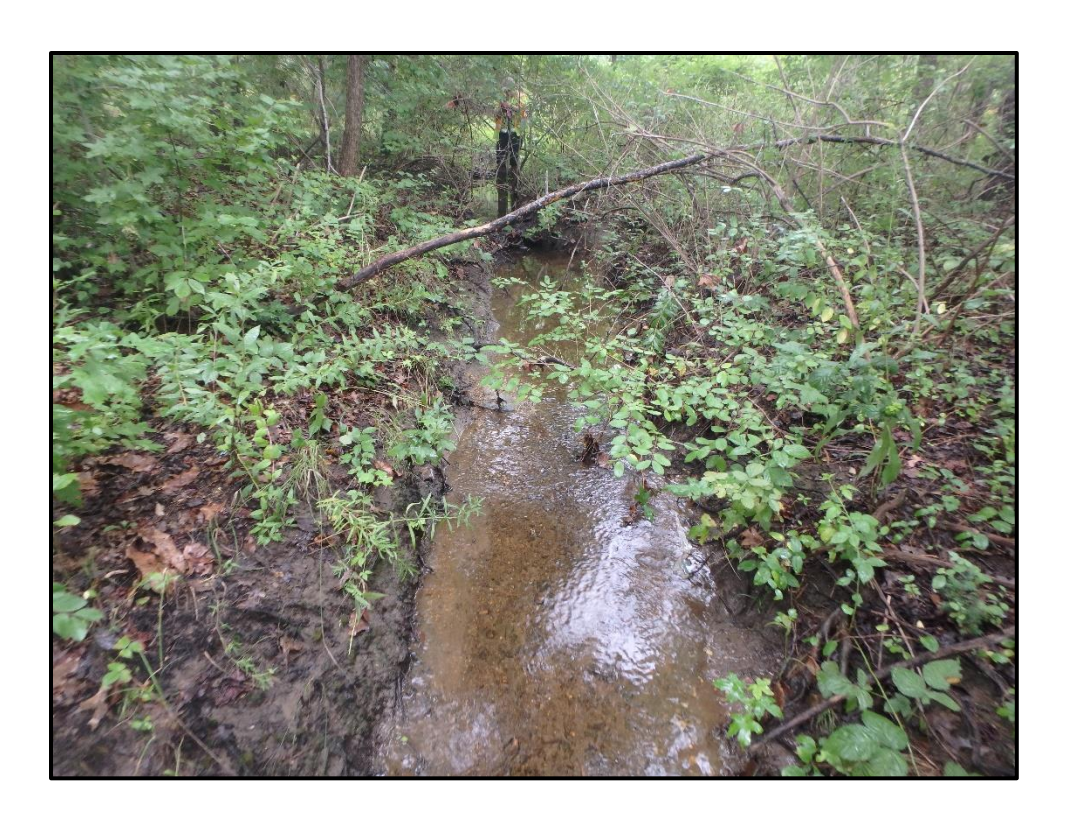
Waters 6GGG – Intermittent