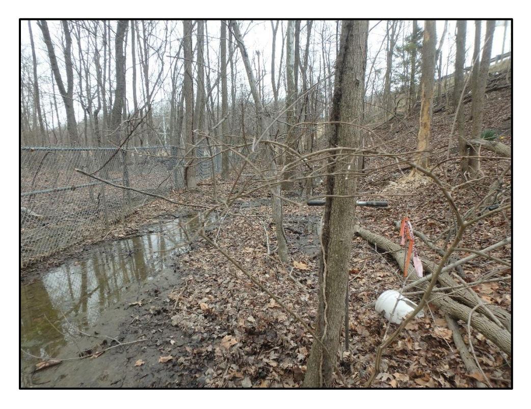
Wetland 1C - PFO