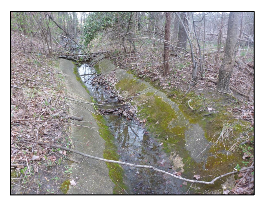
Waters 2H – Intermittent