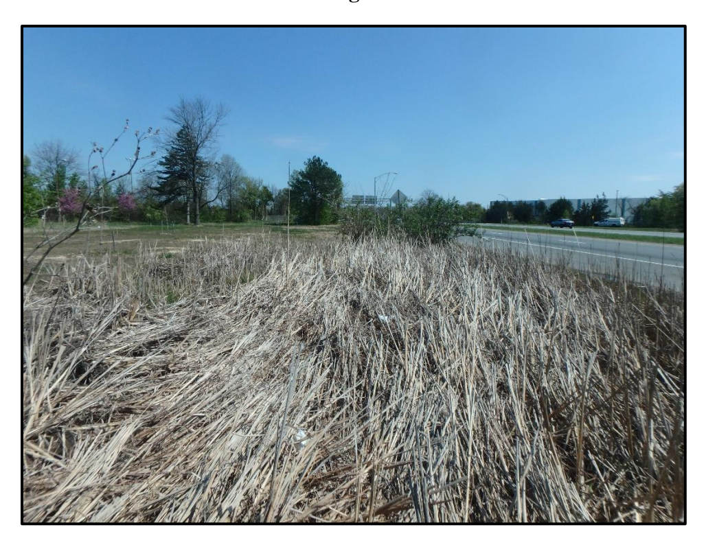
Wetland 4A – PEM