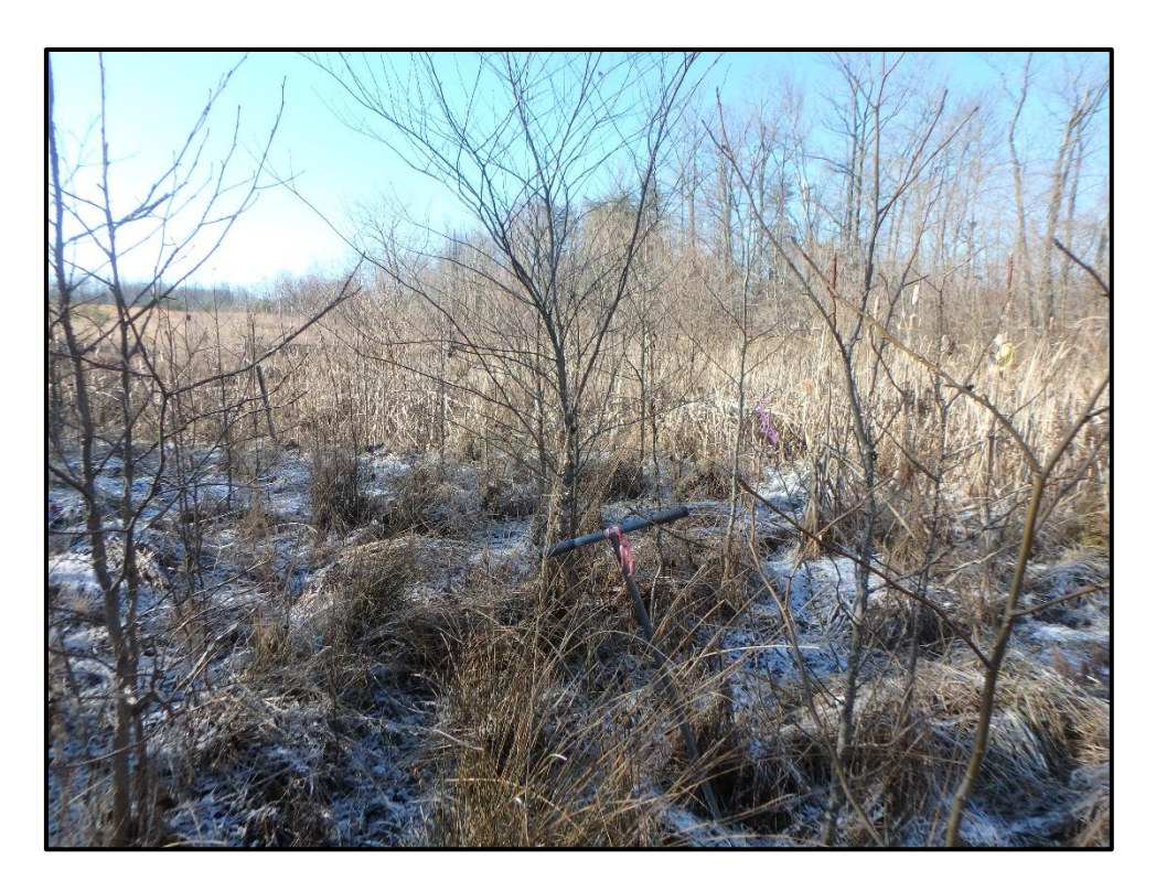
Wetland 4YYYY - PSS