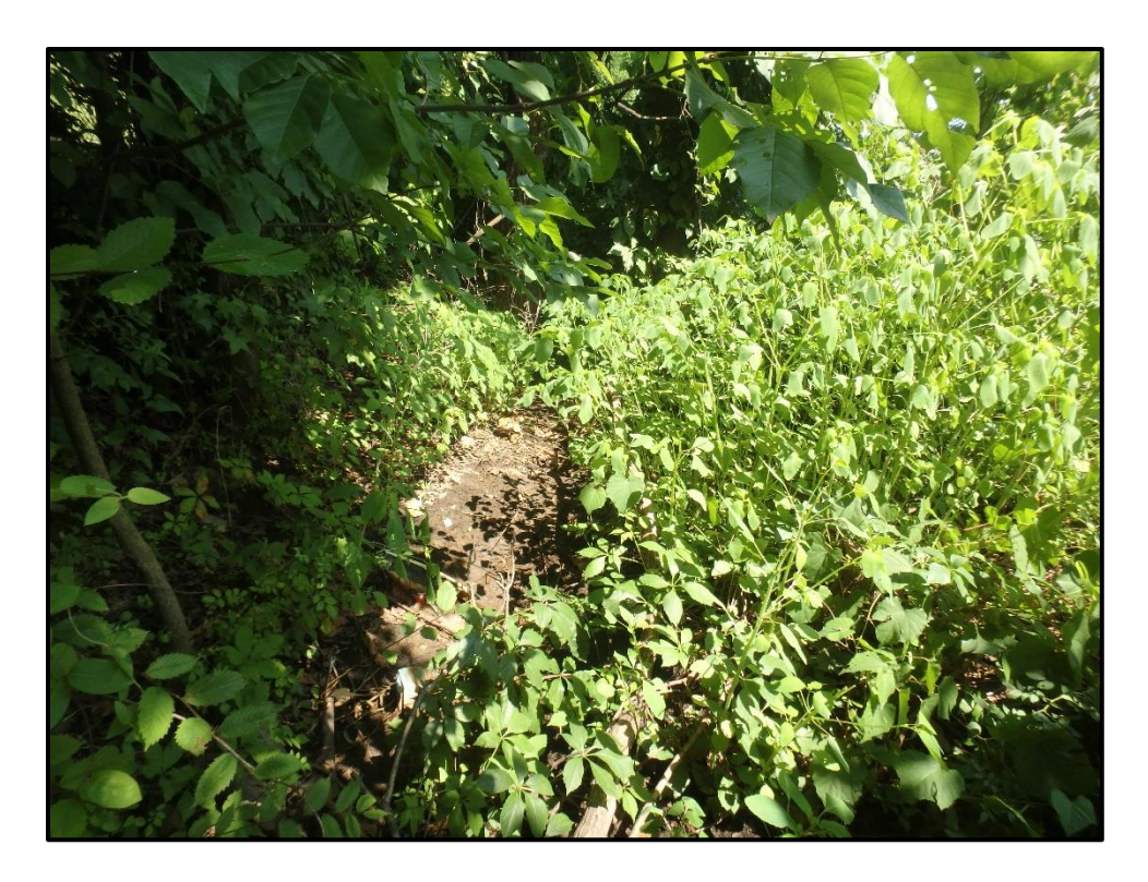
Wetland 6CCCC – PFO