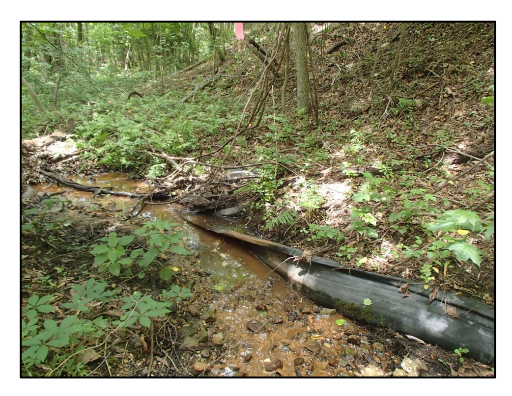
Waters 4GGGG – Perennial