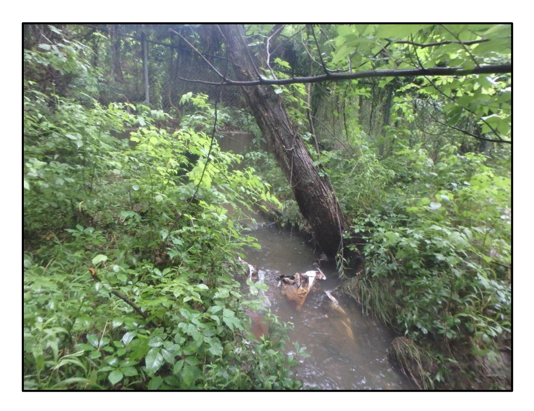
Waters 6AA – Intermittent