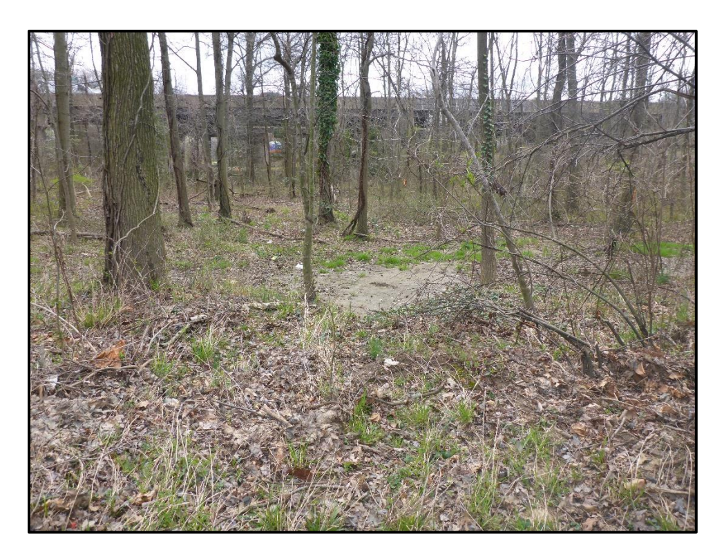
Wetland 3X – PFO