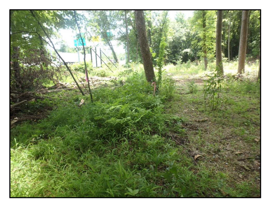
Wetland 6VVV – PFO