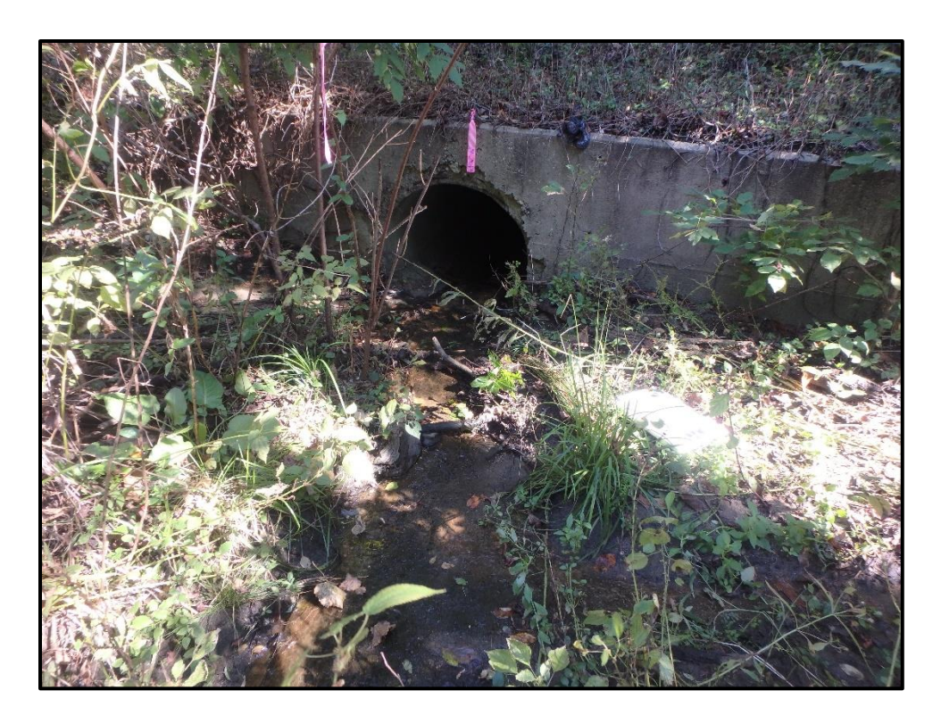
Waters 5FF – Intermittent