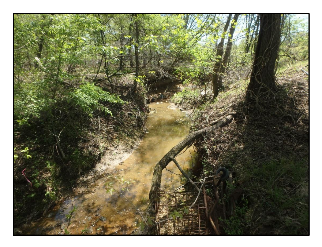
Waters 2R – Perennial