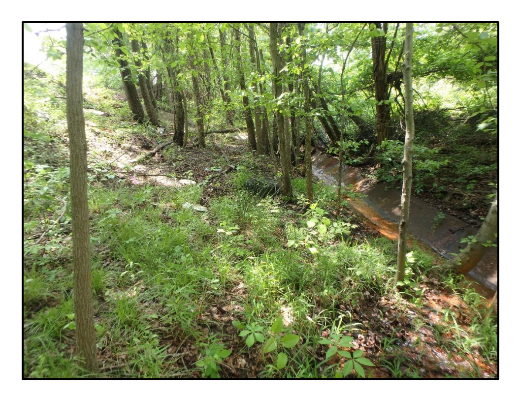
Wetland 3GGG - PFO