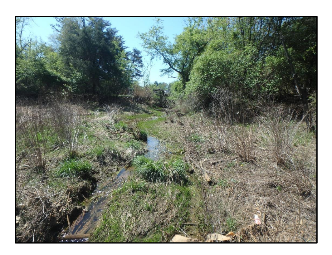
Waters 2J – Perennial