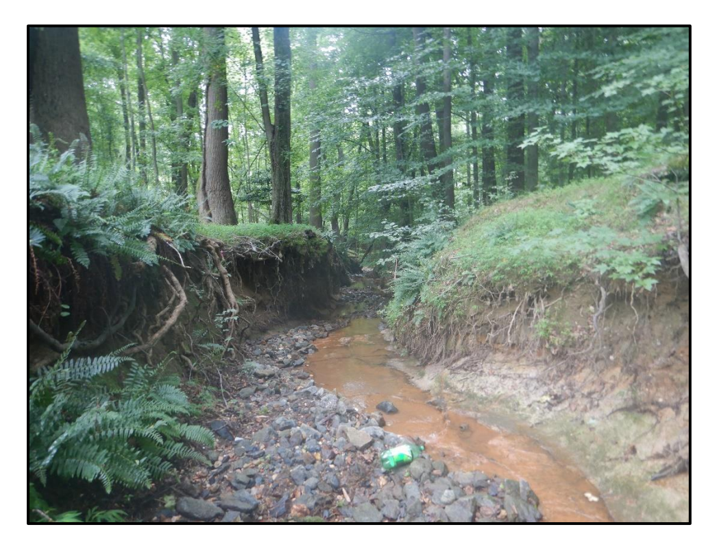
Waters 2X – Perennial