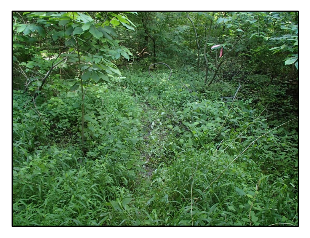
Wetland 6N – PEM