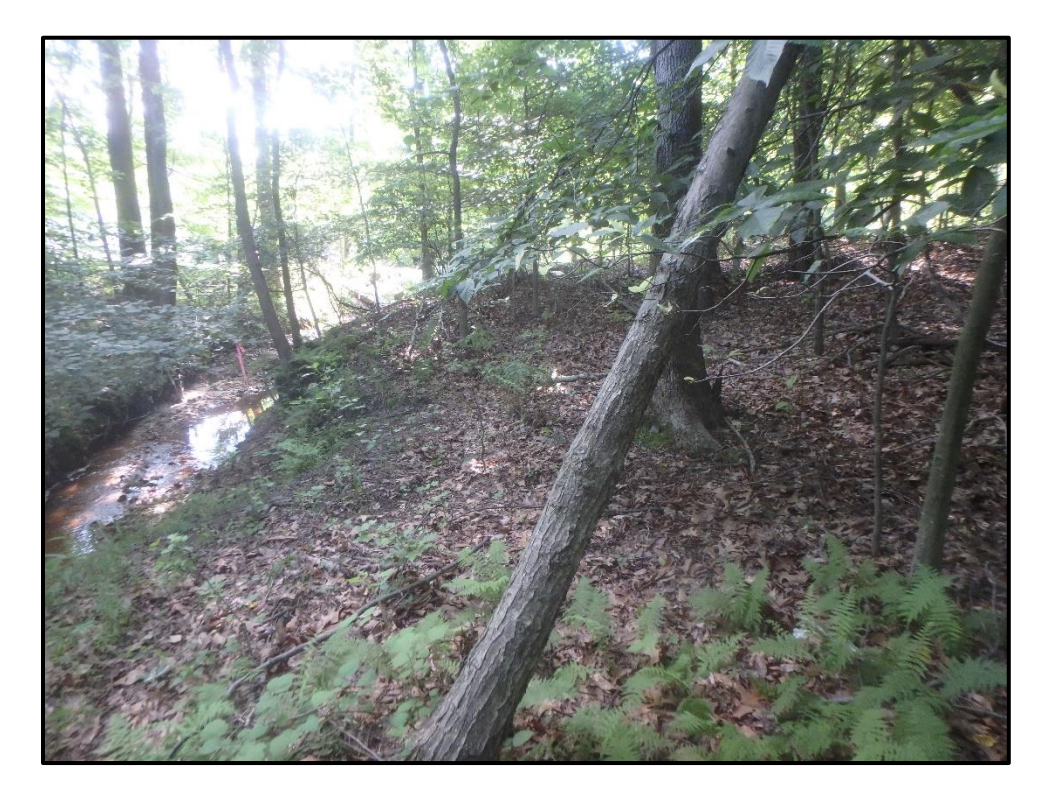
Wetland 4AAA – PFO