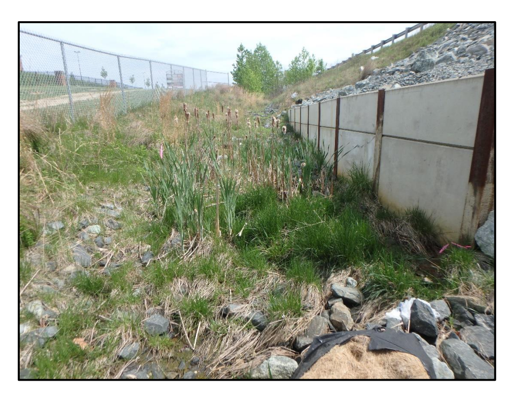
Wetland 4DD – PEM