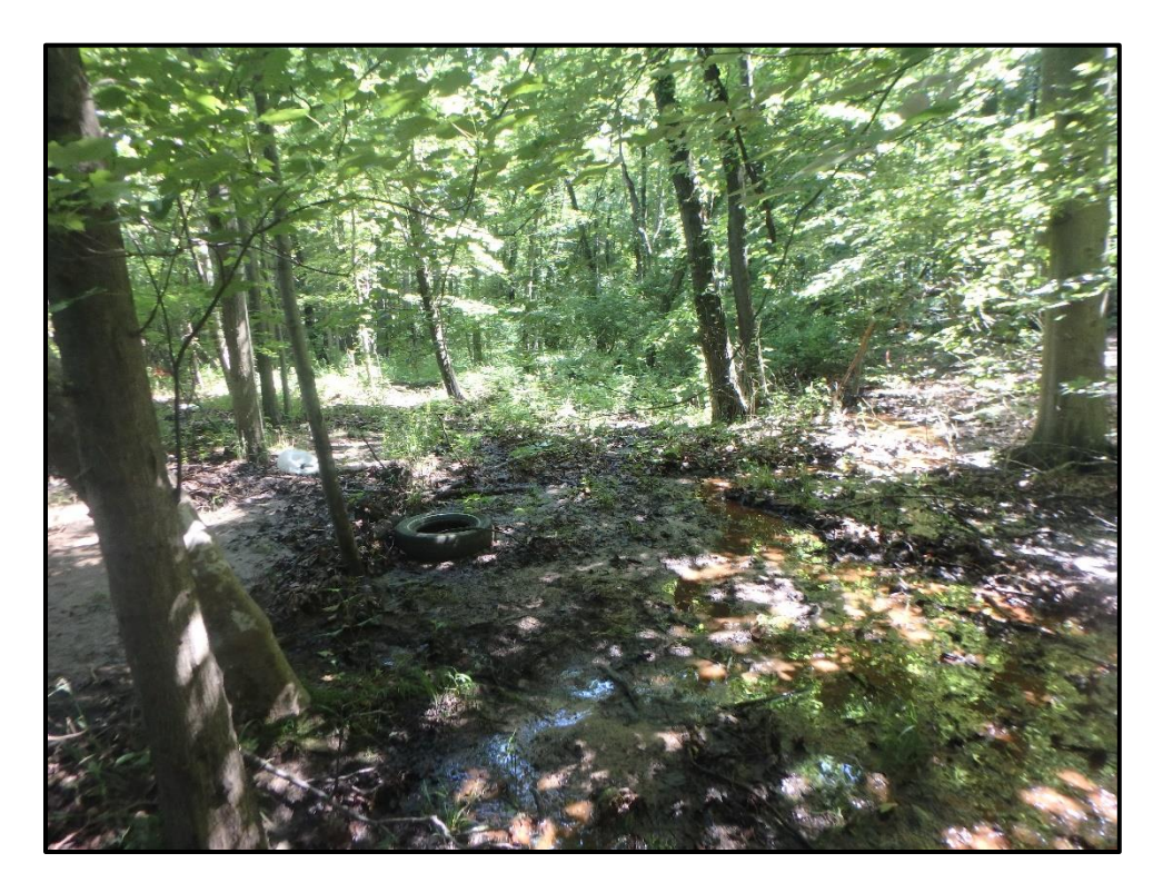
Wetland 4LLL – PFO