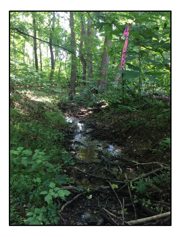
Waters 6EE – Intermittent