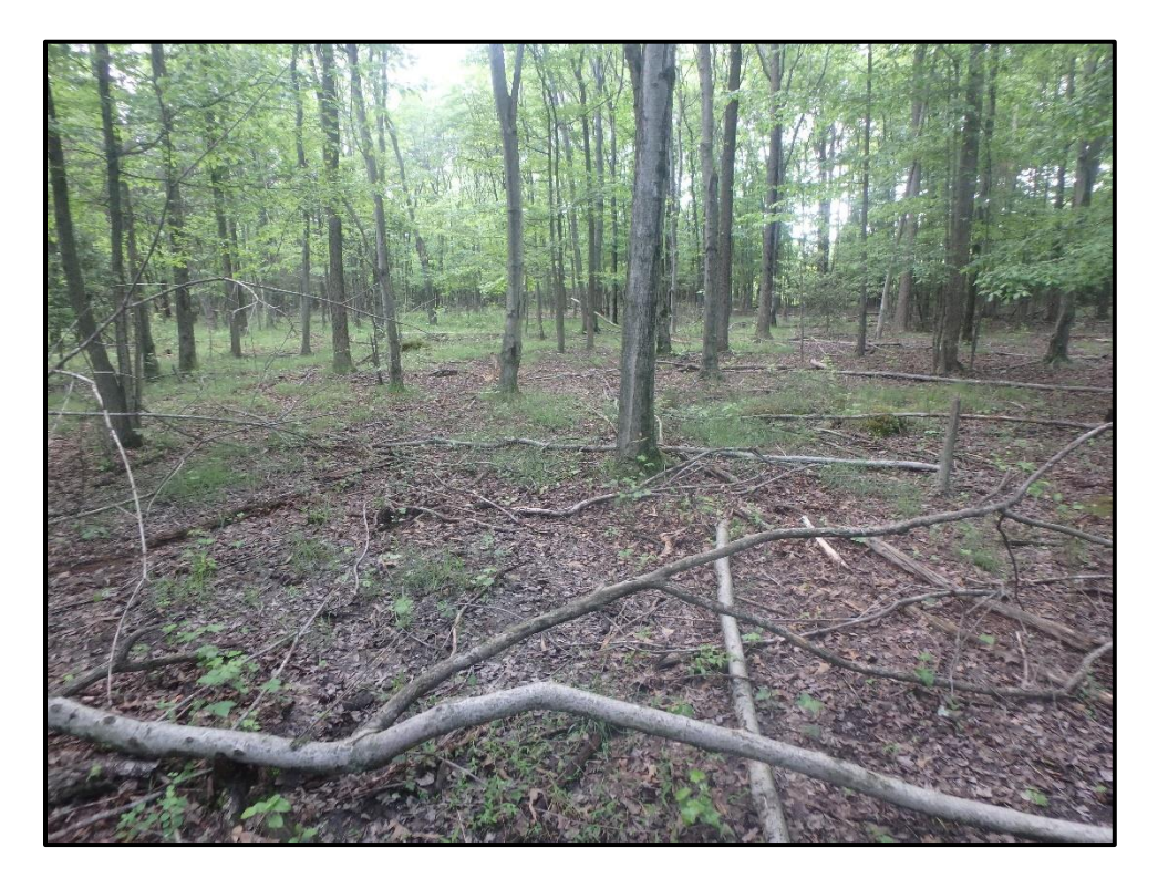
Wetland 3SSS – PFO