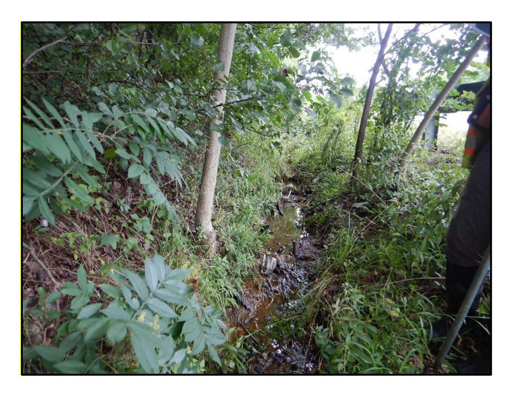
Waters 2HH – Intermittent