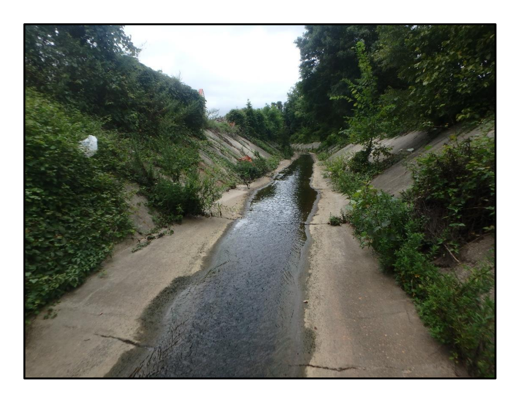
Waters 5T – Perennial