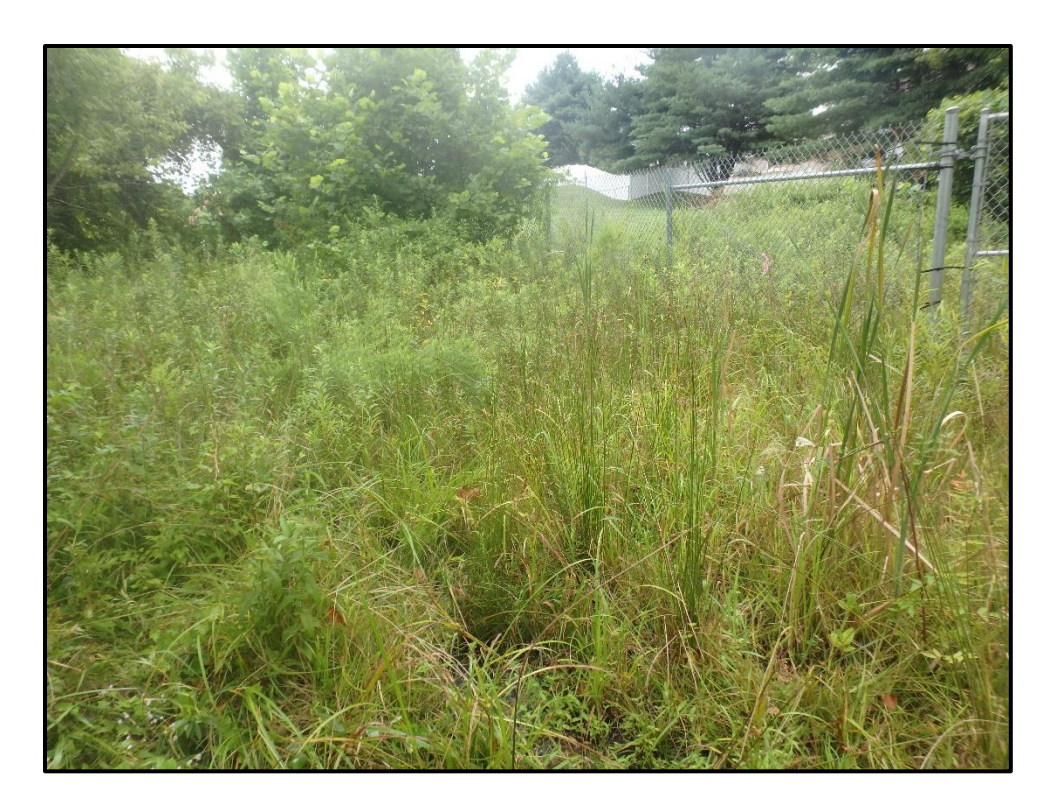
Wetland \ 5M-PEM