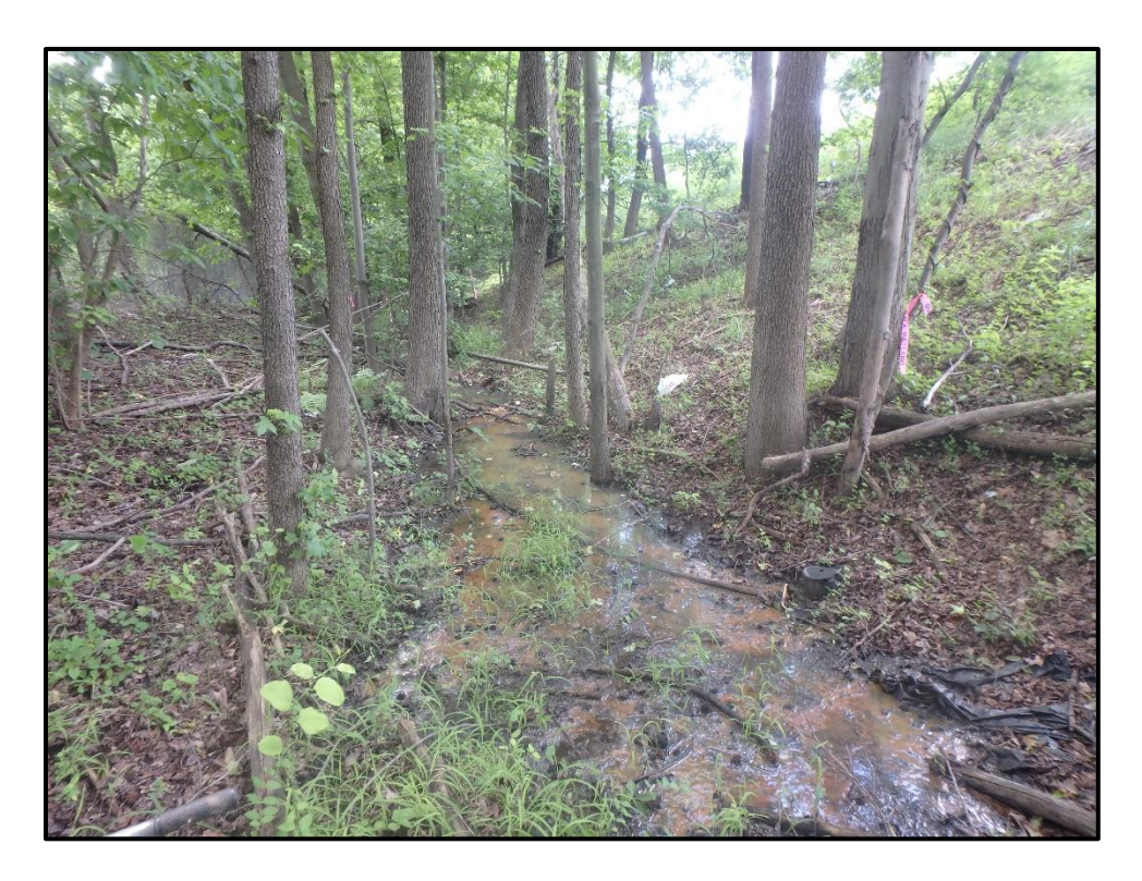
Wetland 4XX – PFO