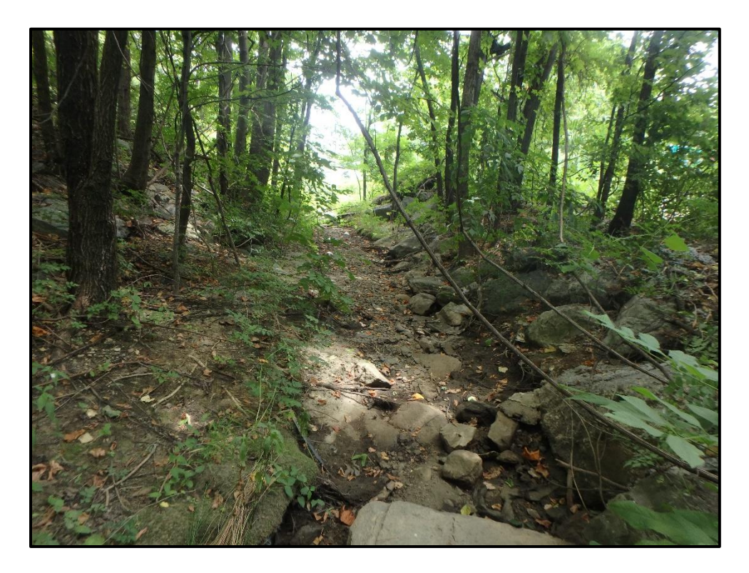
Waters 4TTTT – Intermittent