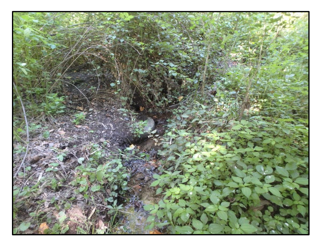
Waters 7II – Intermittent