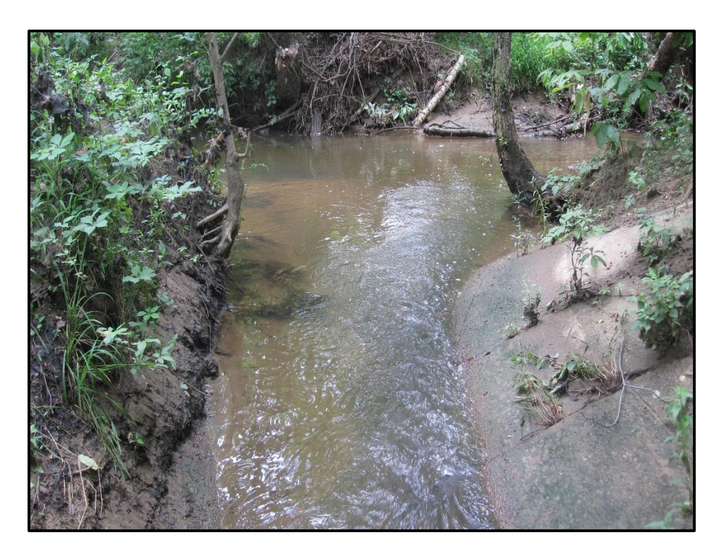
Waters 6HH – Perennial