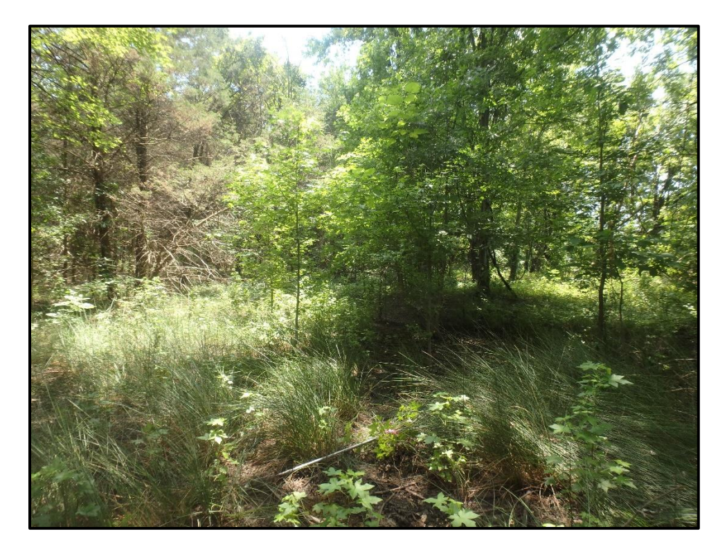
Wetland 7L – PFO