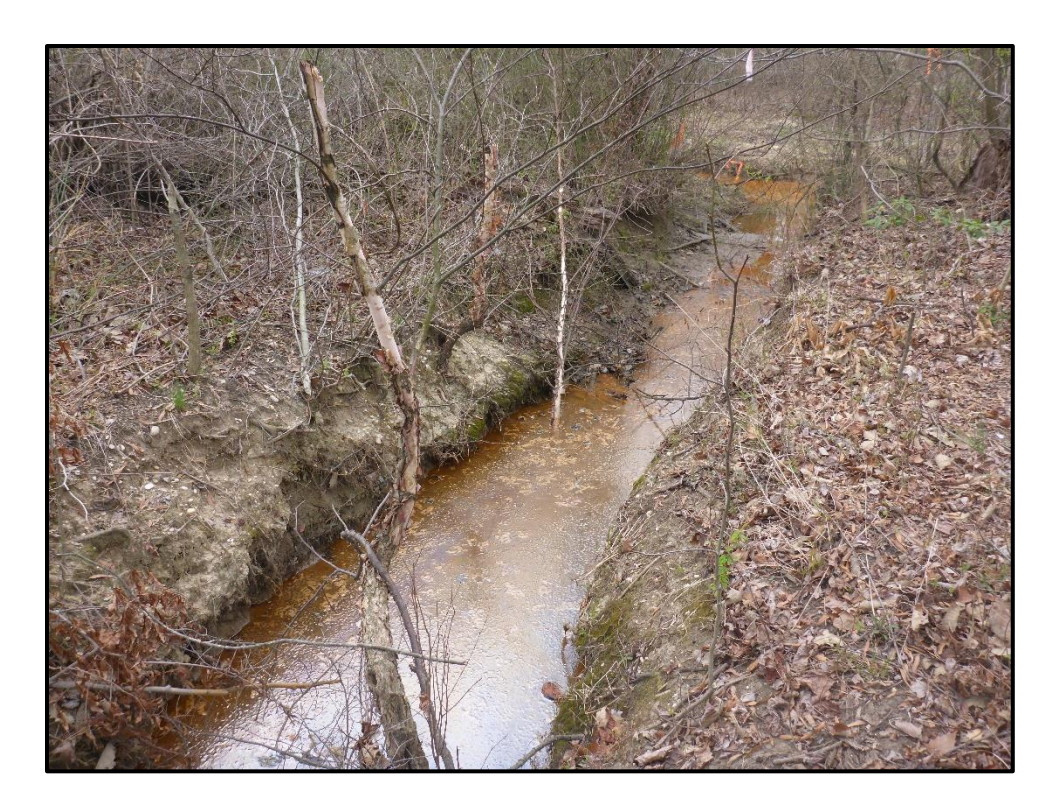
Waters 3N – Intermittent