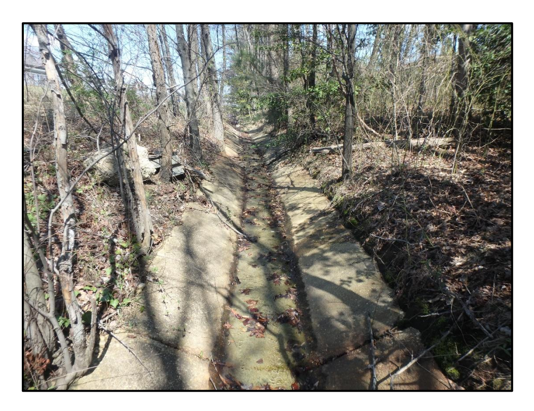
Waters 3I – Intermittent