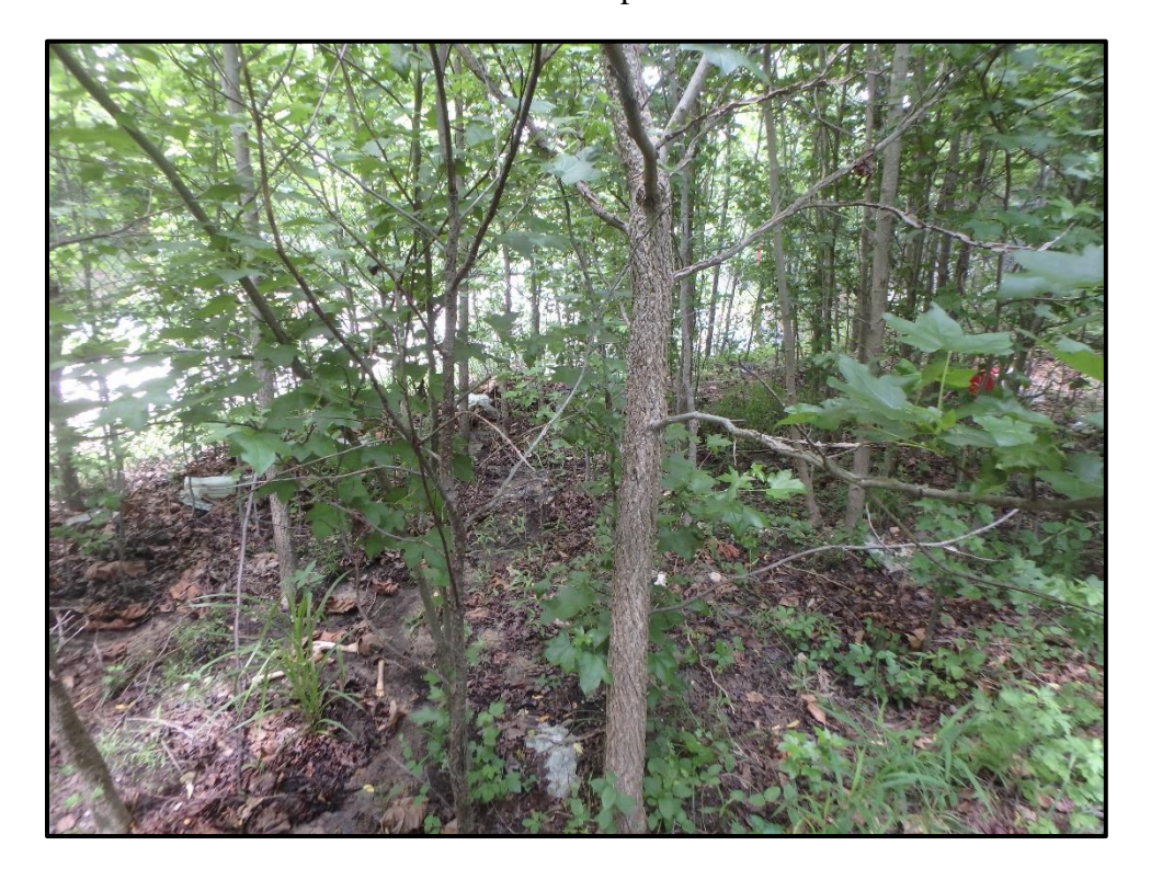
Wetland 4FFF – PFO