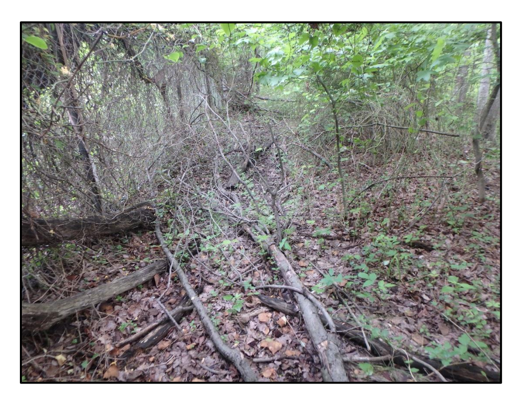
Wetland 4MM – PFO