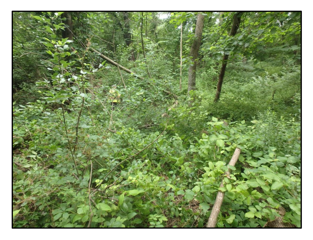
Wetland 6ZZ – PFO