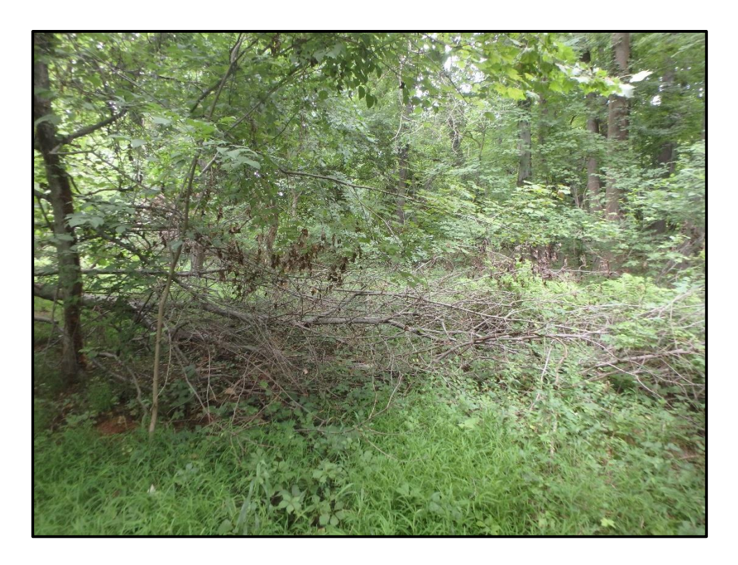
Wetland 5C – PFO