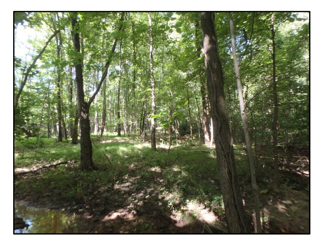
Wetland 1J – PFO