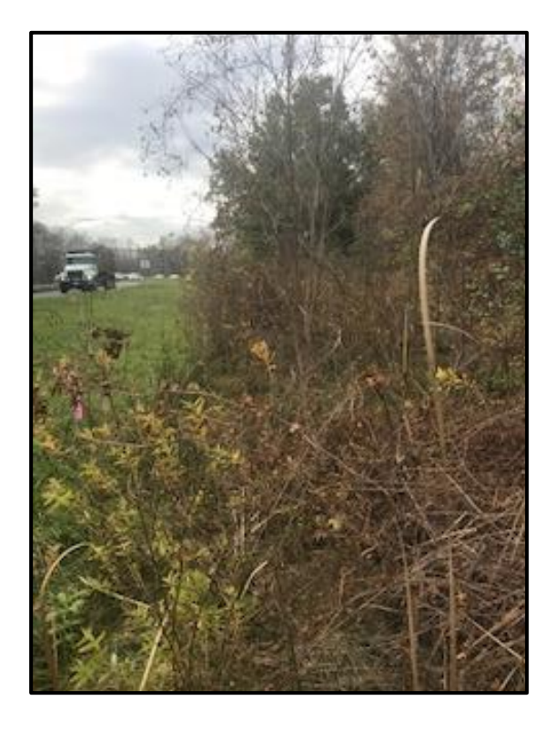
Wetland 5UU – PSS