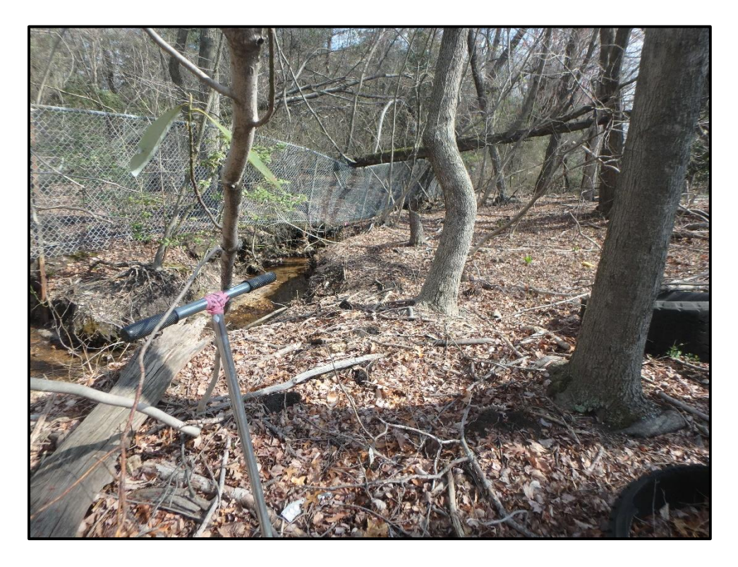
Wetland 3EE – PFO