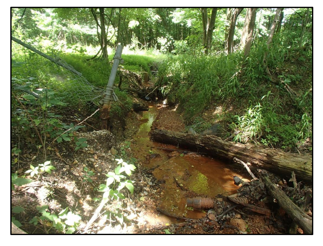
Waters 4DDDD – Intermittent