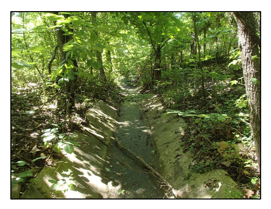
Waters 4GG – Intermittent