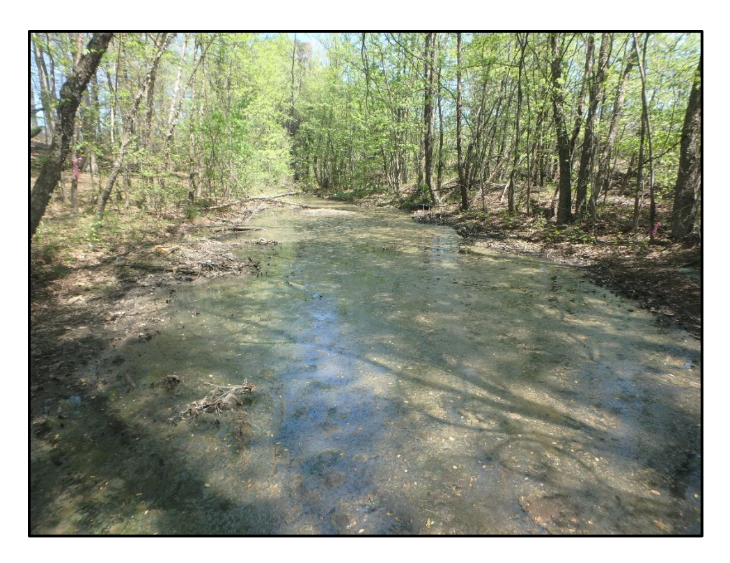
Waters 3TT – Perennial