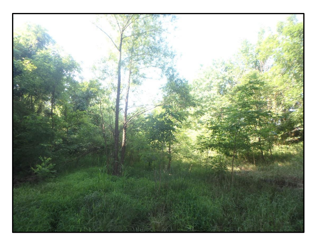
Wetland 6U - PFO