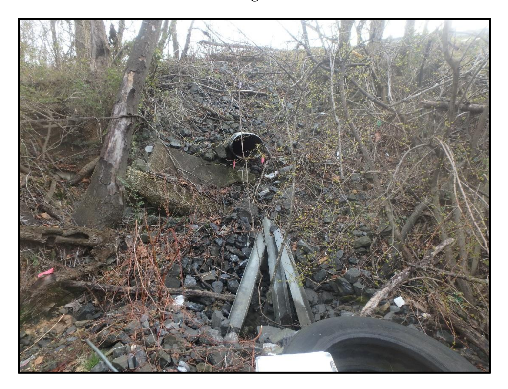
Waters 1A – Intermittent