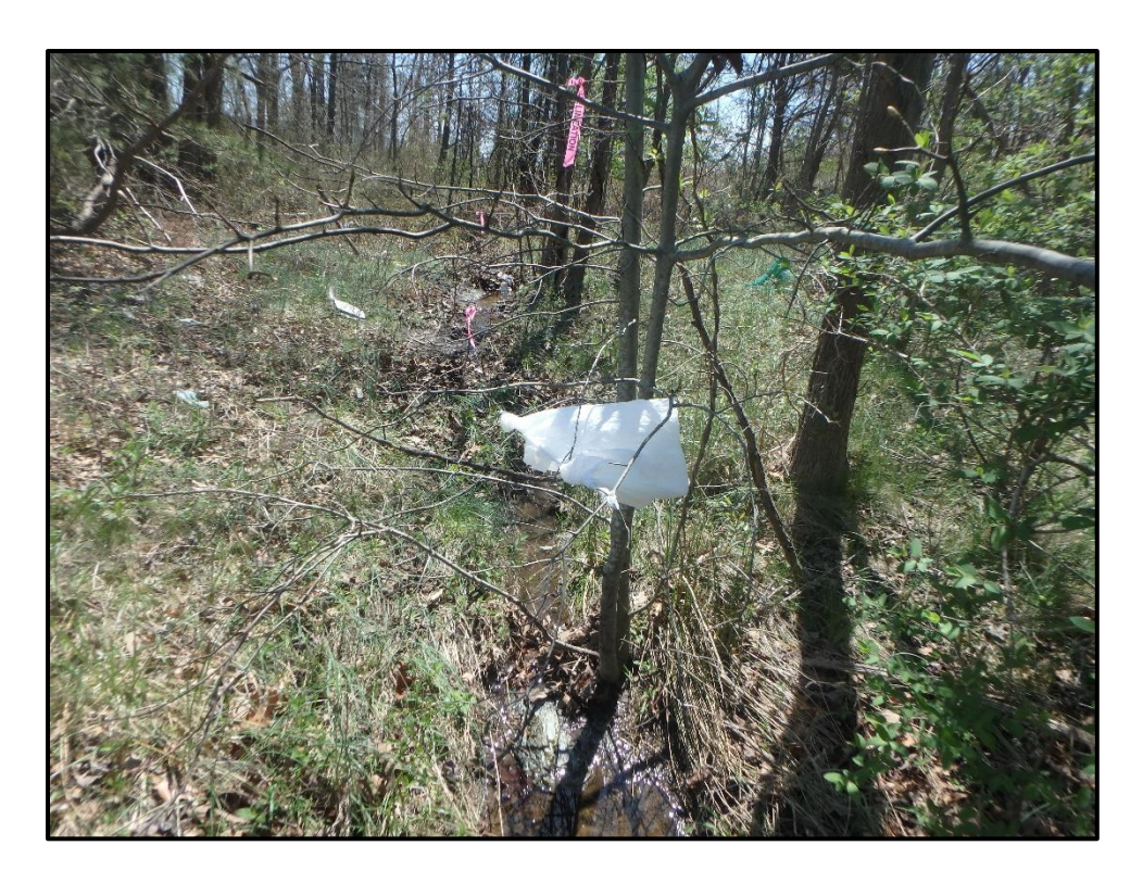
Waters 3PP – Ephemeral