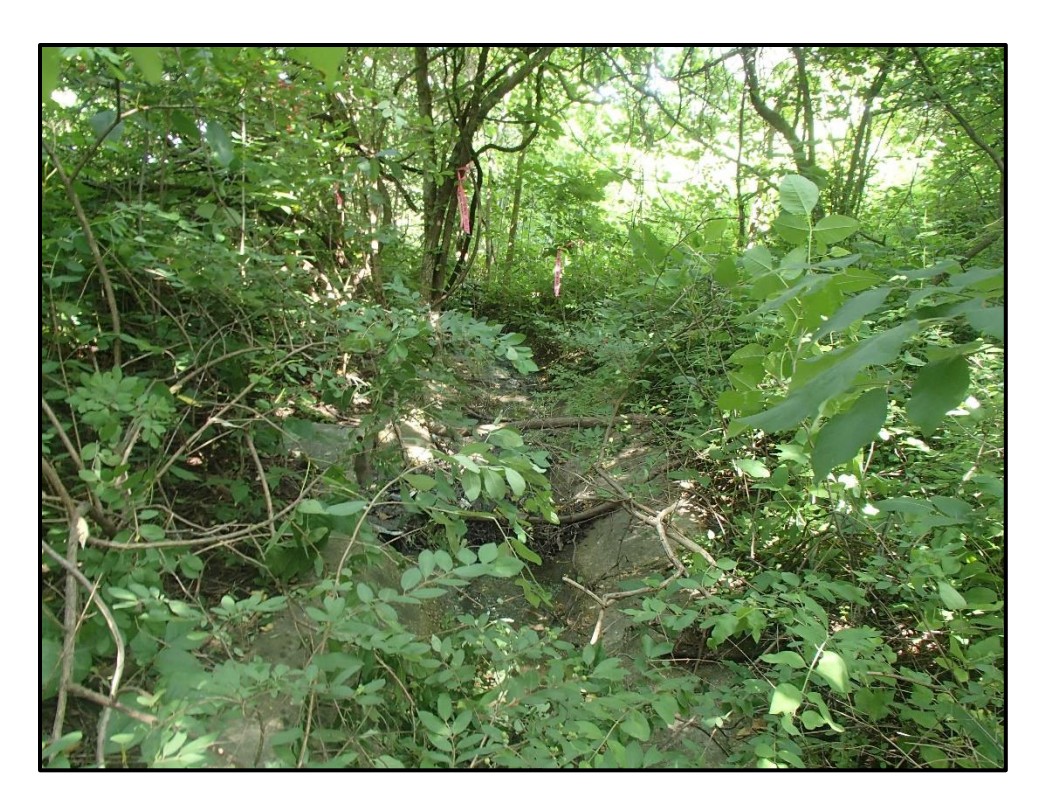
Waters 4YYY - Intermittent