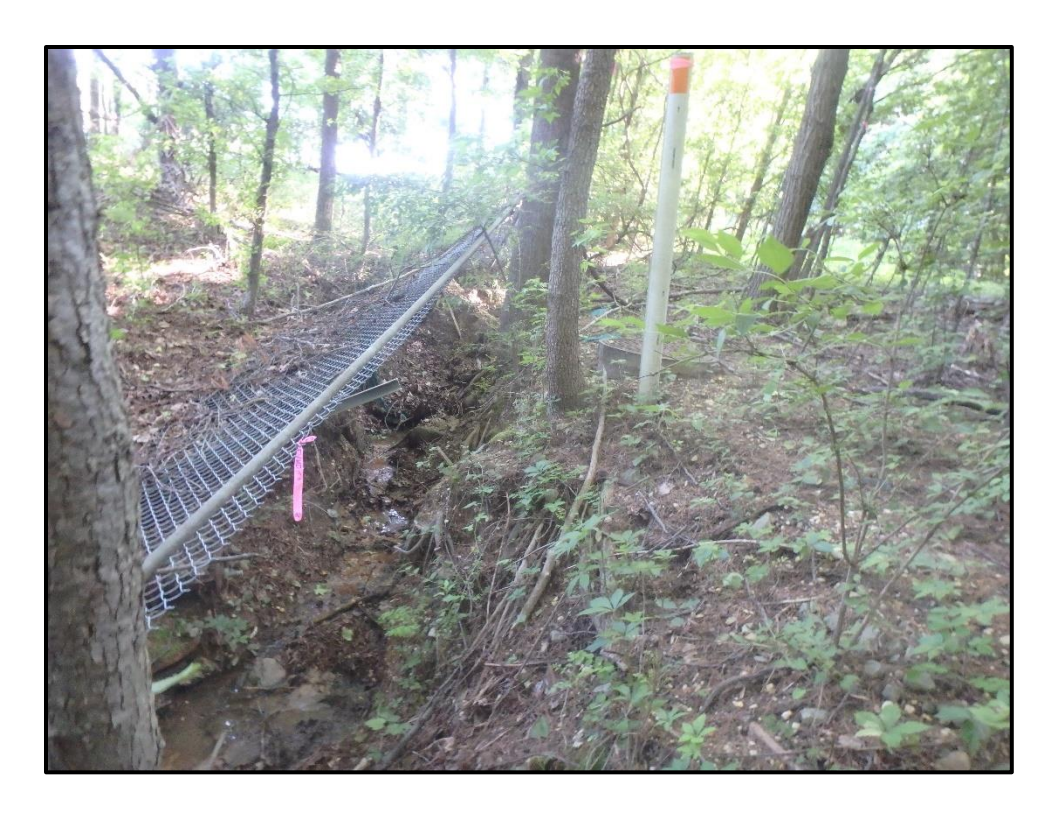
Waters 4TT – Ephemeral