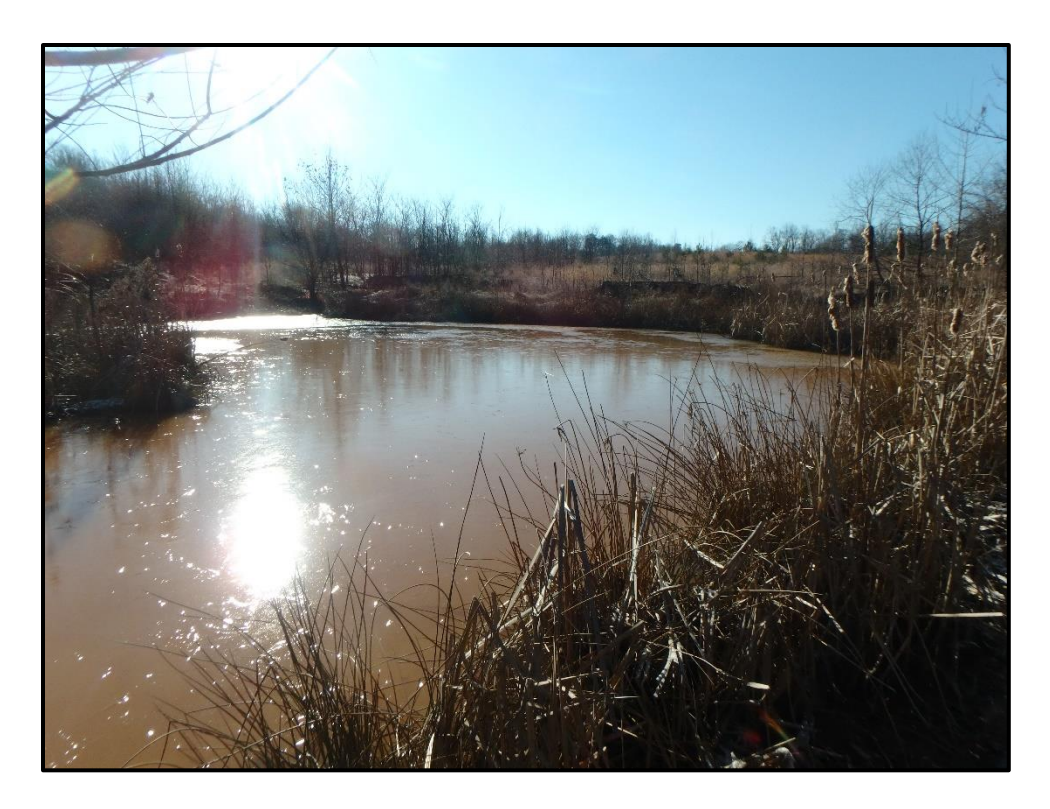
Waters 4XXXX - POW