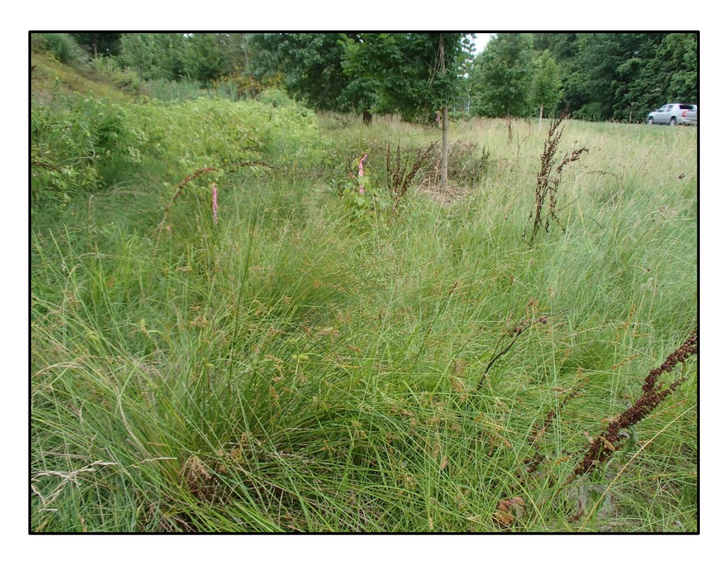
Wetland 6CCC – PEM