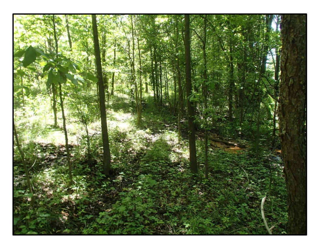
Wetland 4II – PFO