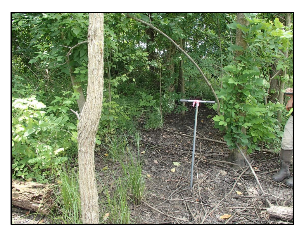
Wetland 6QQ - PFO