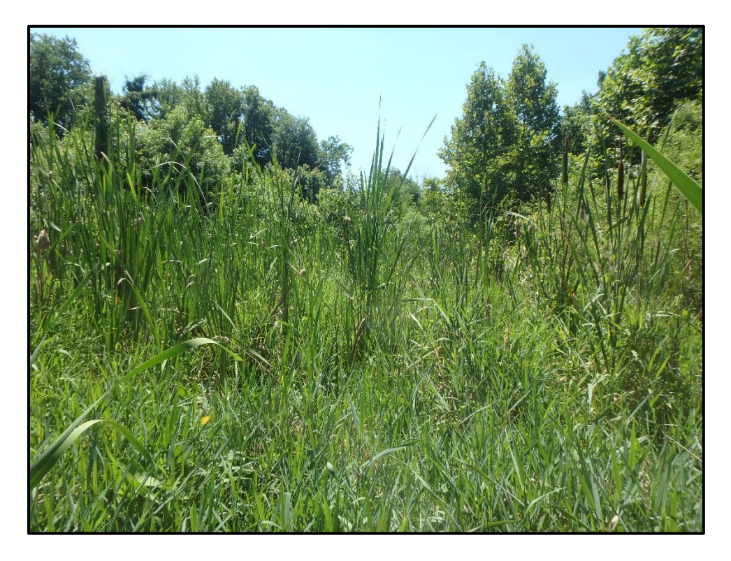
Wetland 7EE – PEM