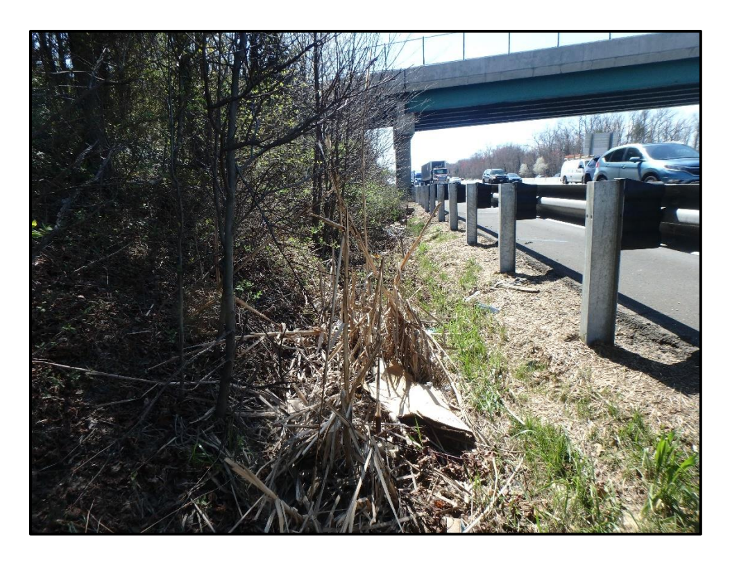
Wetland 3J – PEM