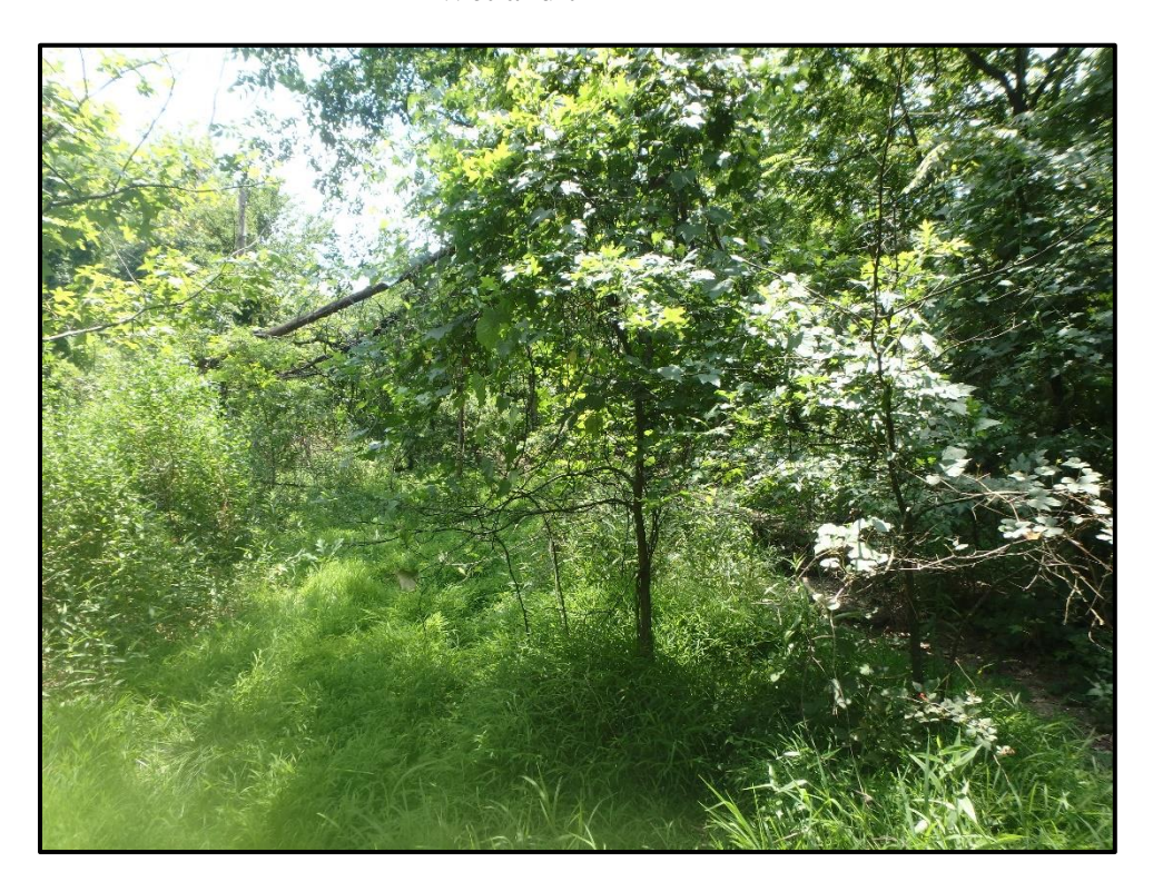
Wetland \ 7KK-PFO