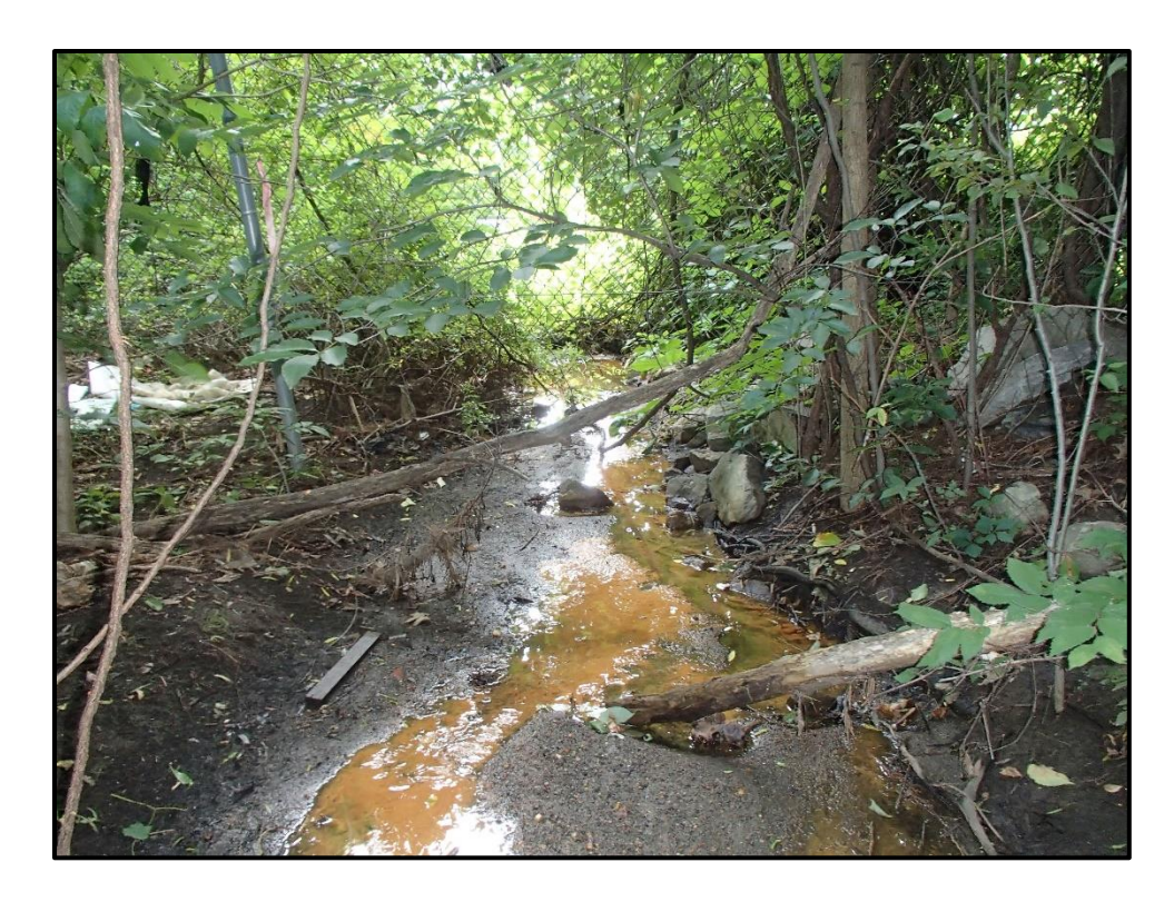
Waters 6LLL – Perennial