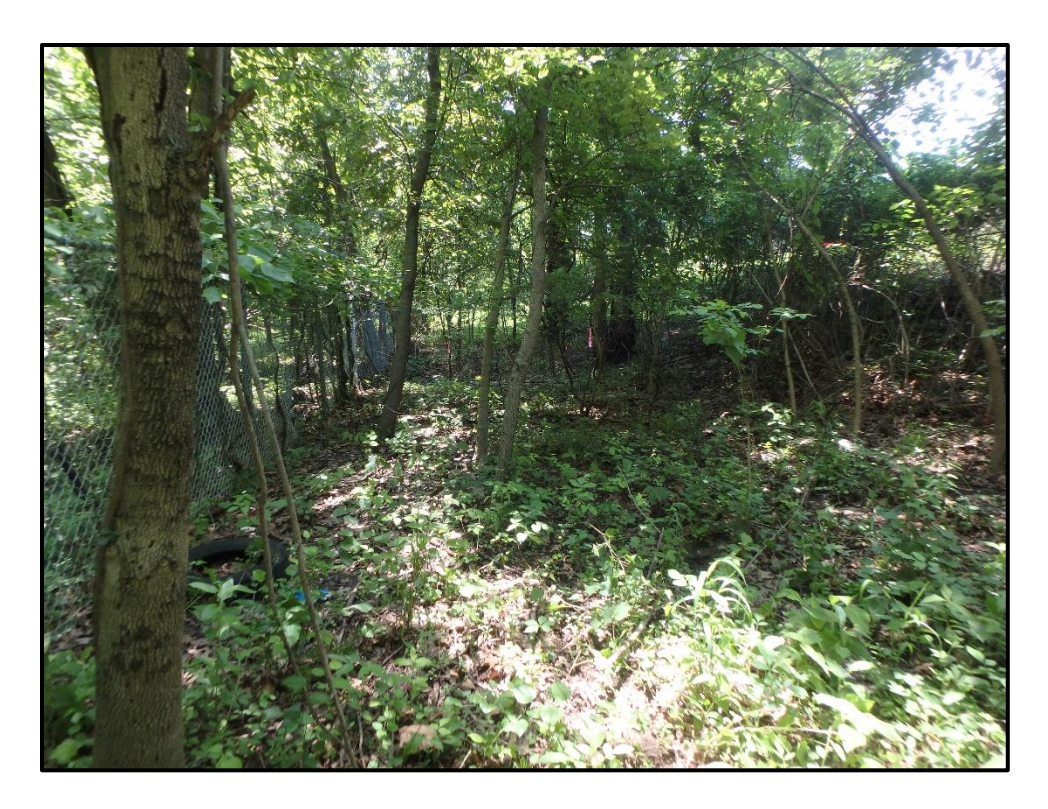
Wetland 6K - PFO