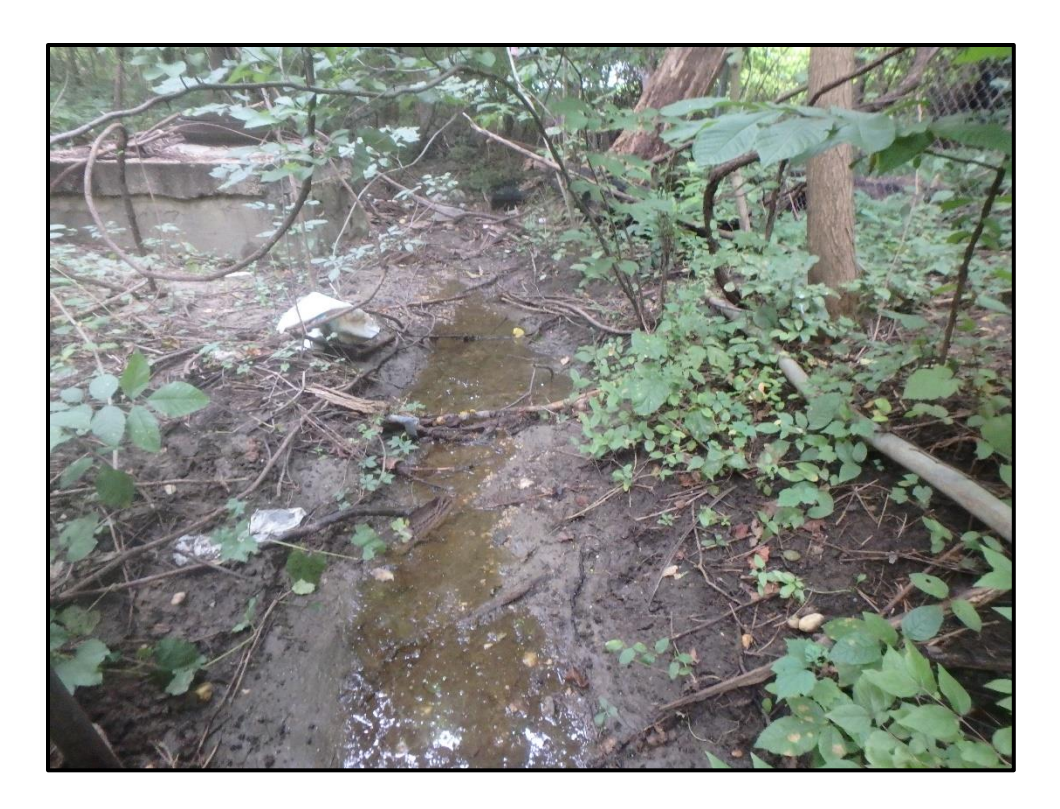
Waters 5P – Intermittent