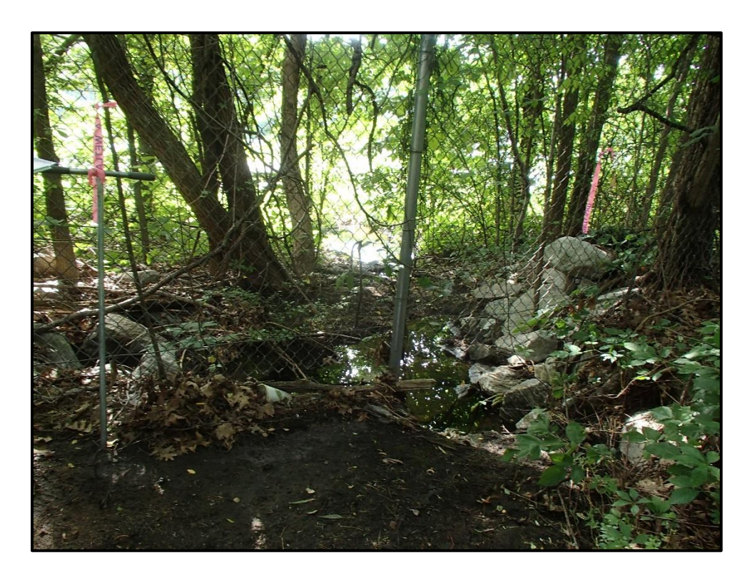
Waters 6III – Intermittent