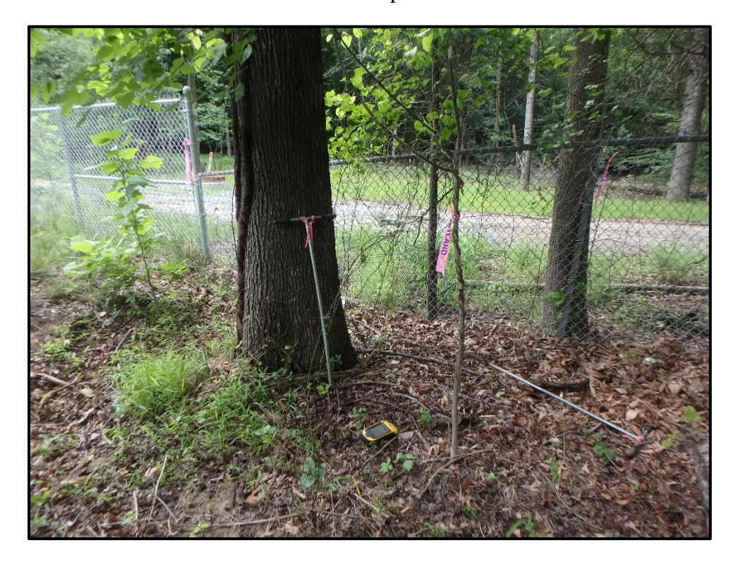
Wetland 4JJJ – PFO