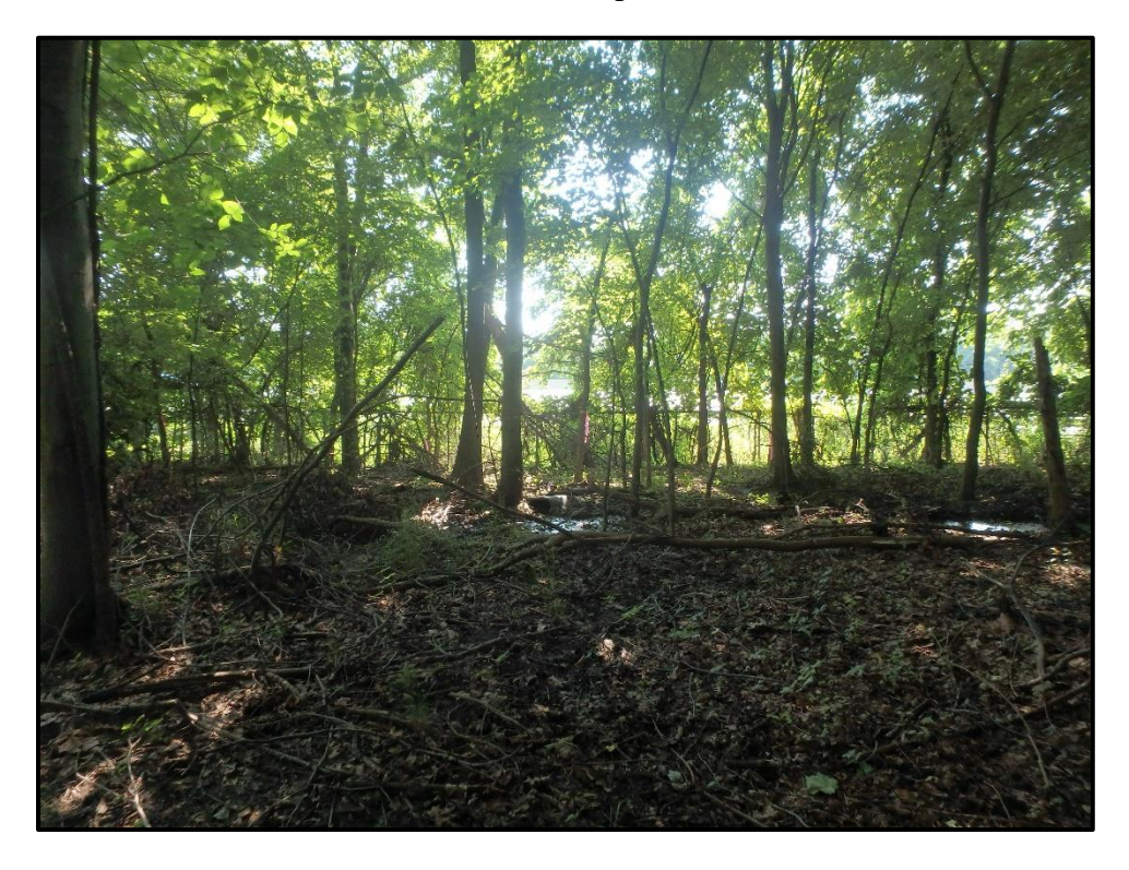
Wetland 6XXX – PFO