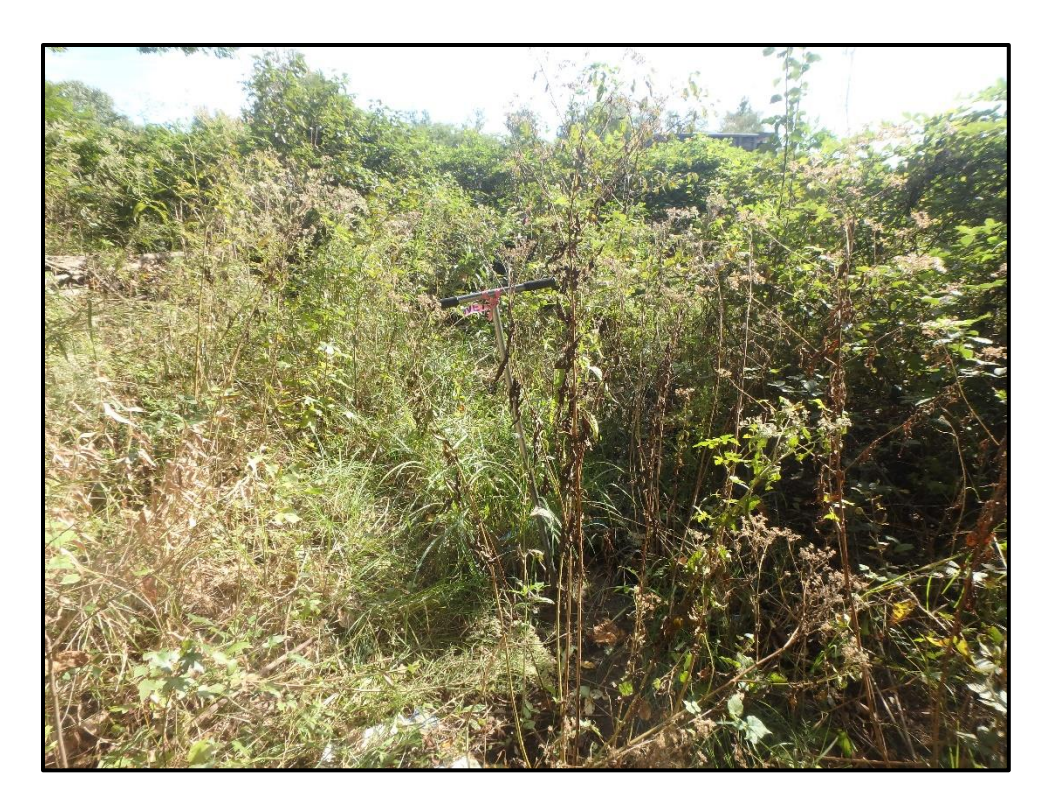
Wetland 5DD – PEM