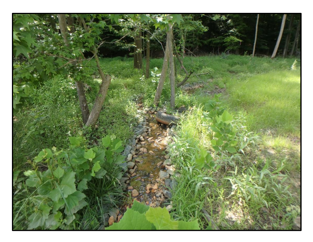
Waters 4HHH – Intermittent