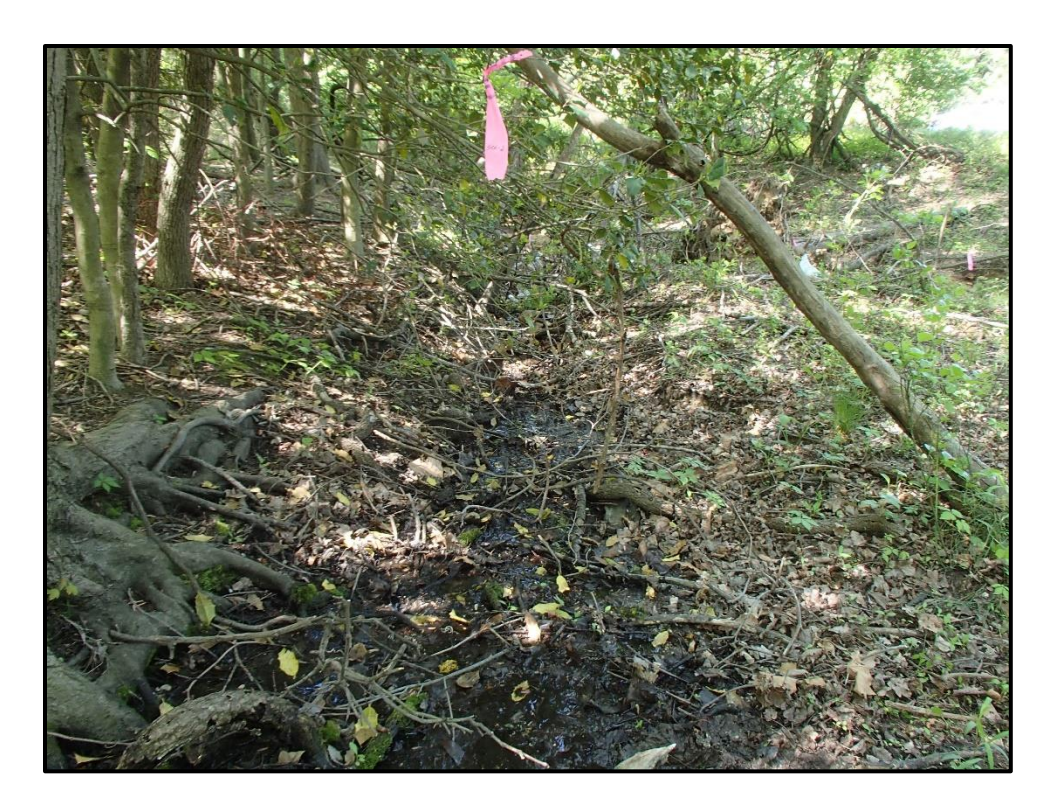
Waters 3XX – Intermittent