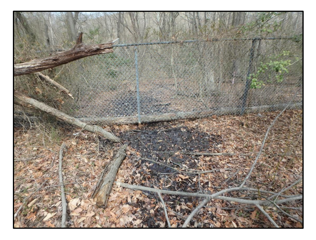
Wetland 1K – PFO