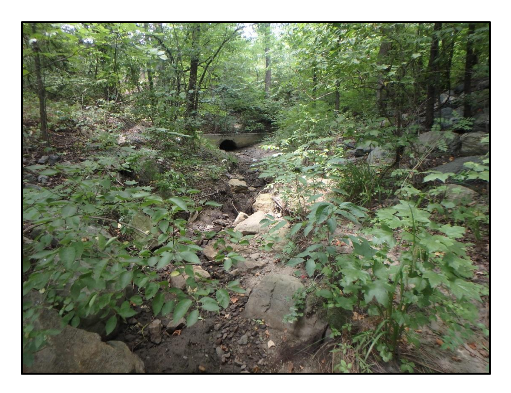
Waters 4TTTT – Intermittent