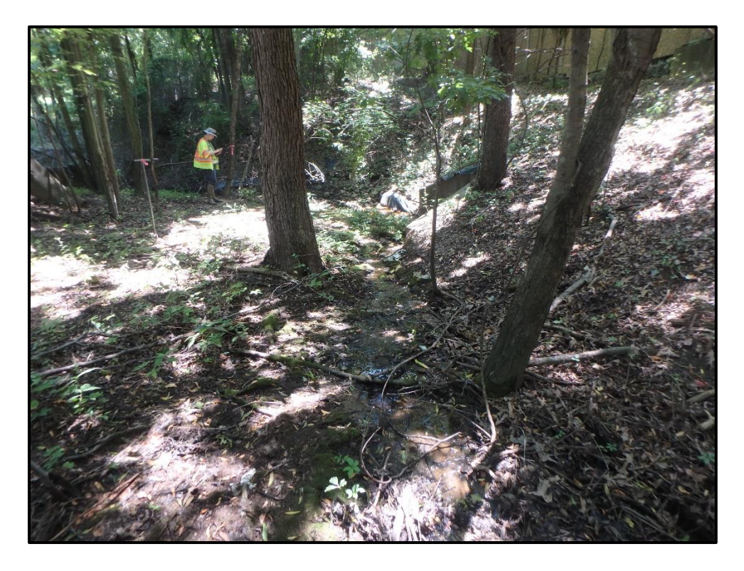
Waters 7GG – Intermittent