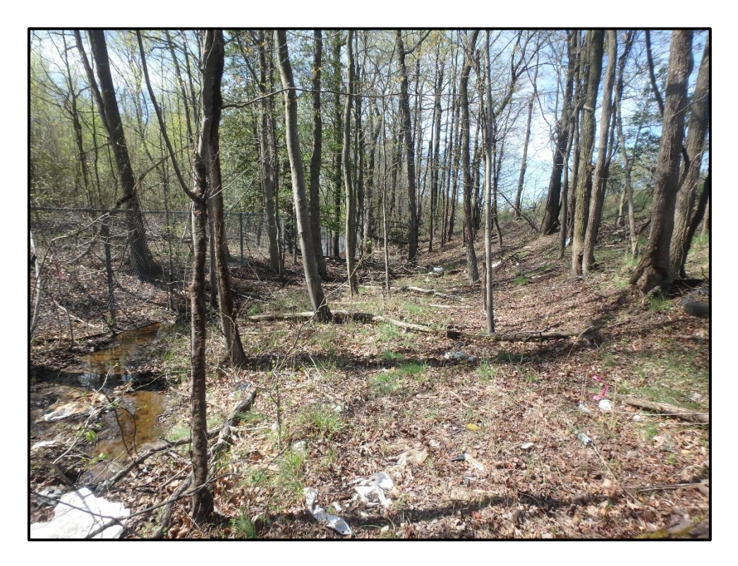
Wetland 4N – PFO