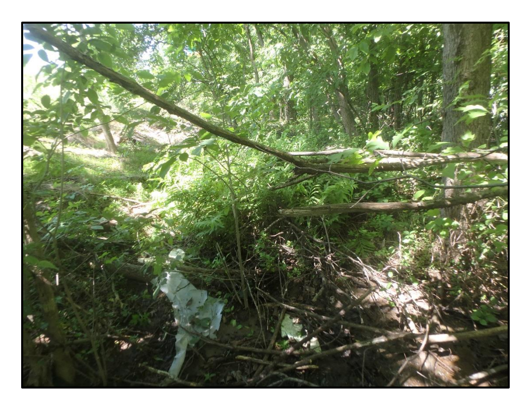
Wetland 6E – PFO