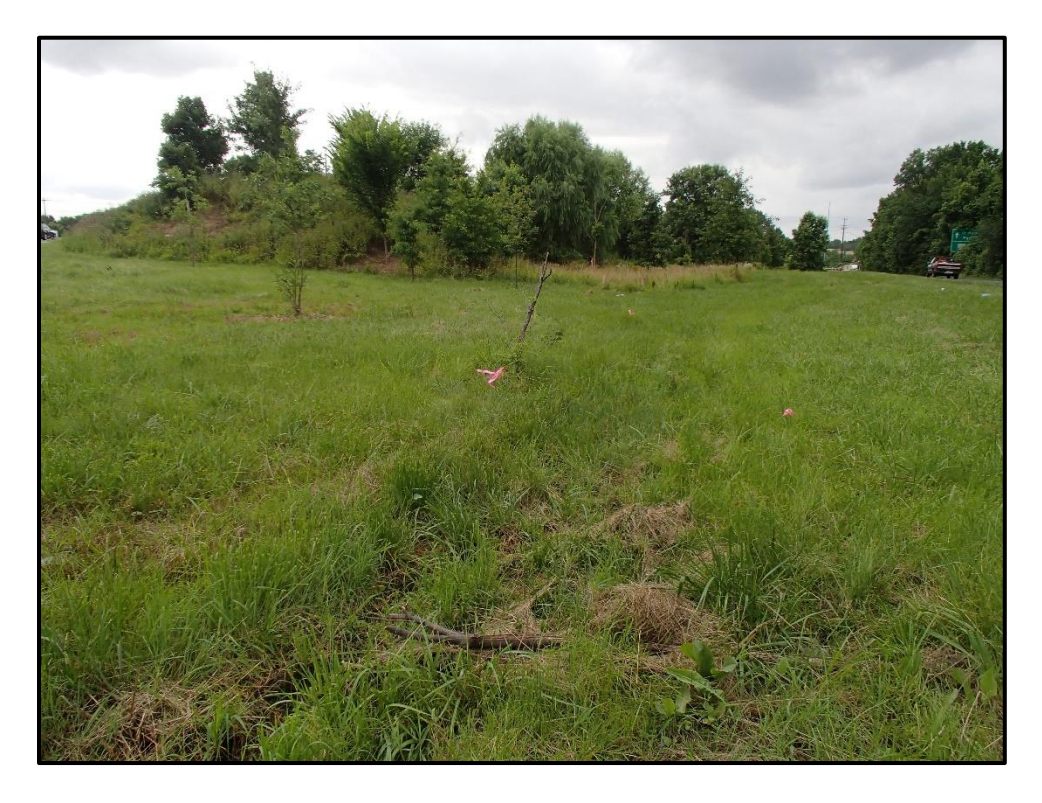
Wetland 6CCC – PEM