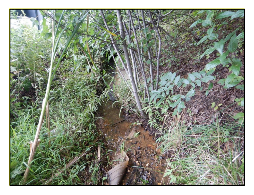
Waters 2HH – Intermittent