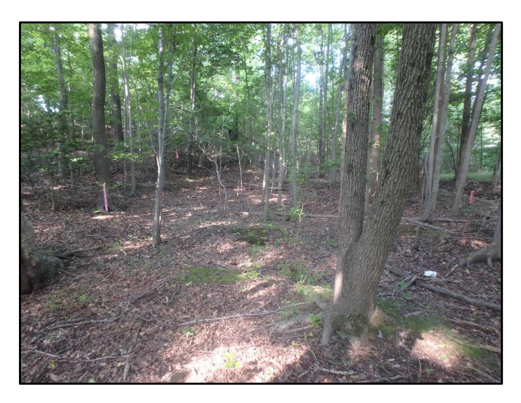
Wetland 4UU – PFO