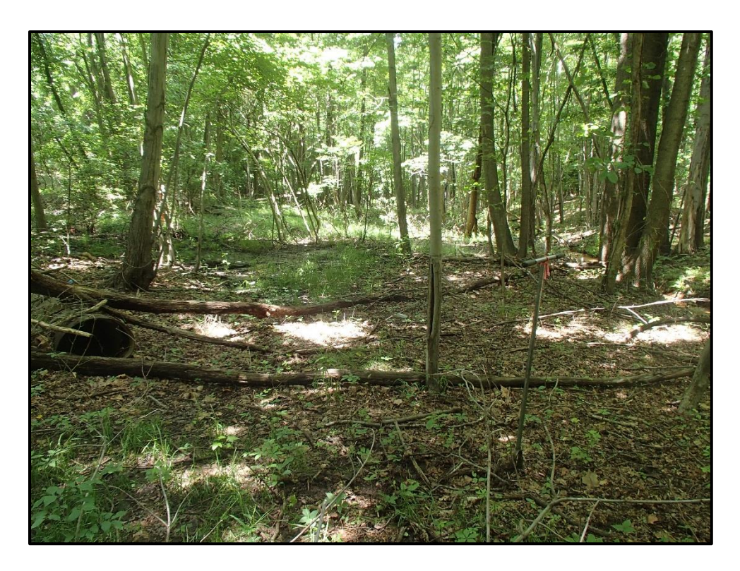
Wetland 4EEEE – PFO