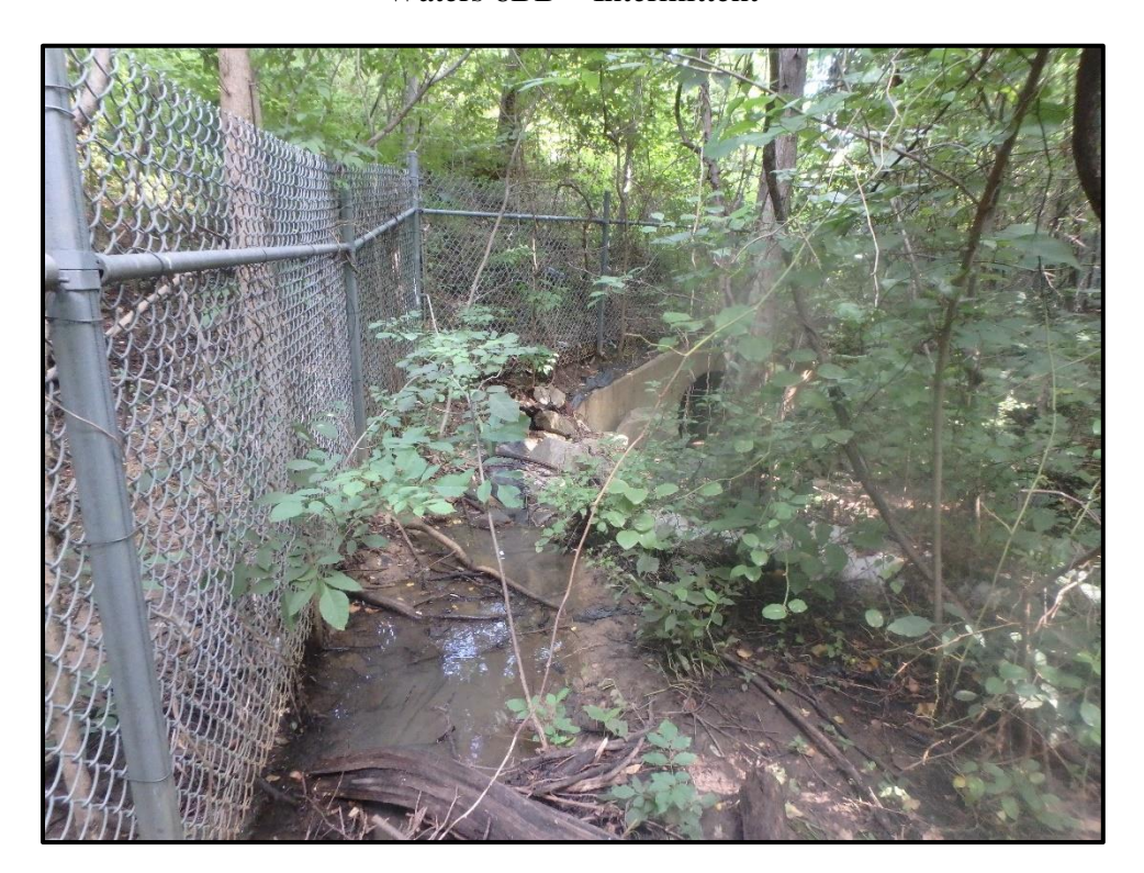
Waters 6BB – Intermittent