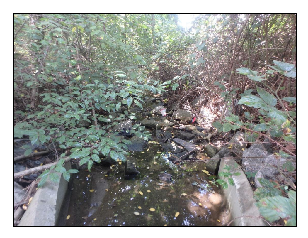
Waters 5W – Intermittent