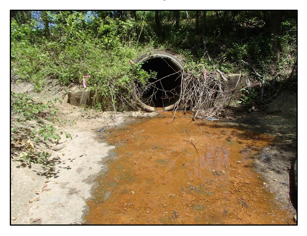
Waters 3ZZ – Perennial