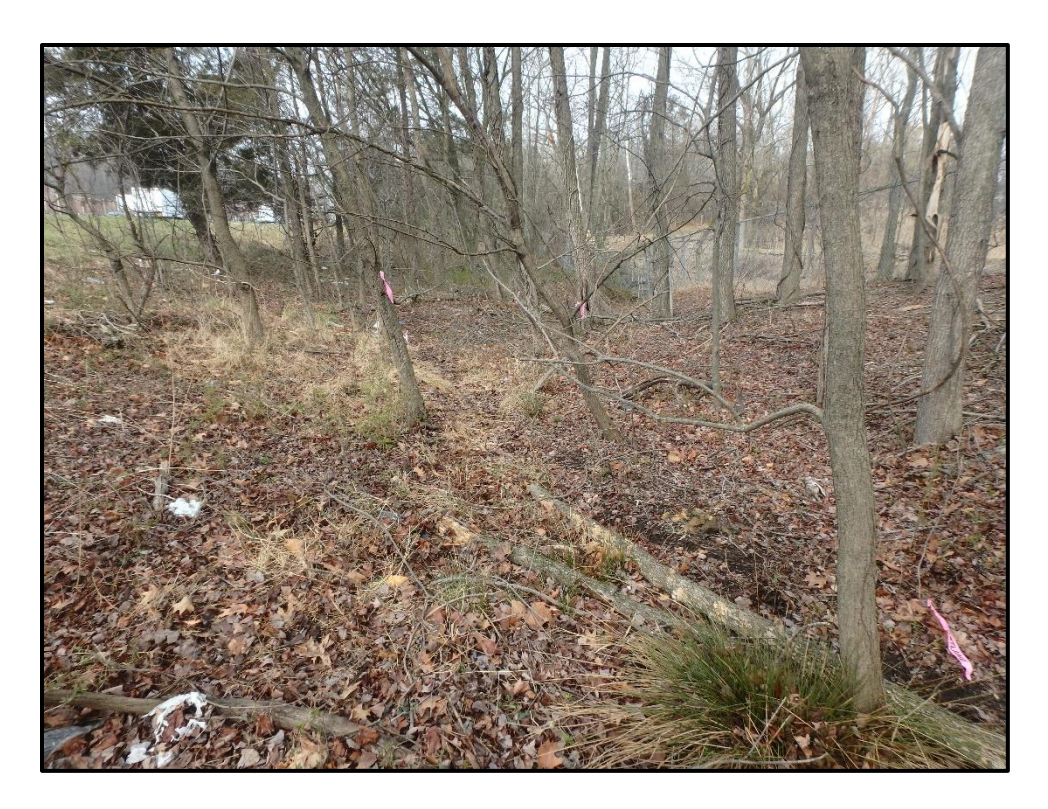
Wetland 1F – PFO