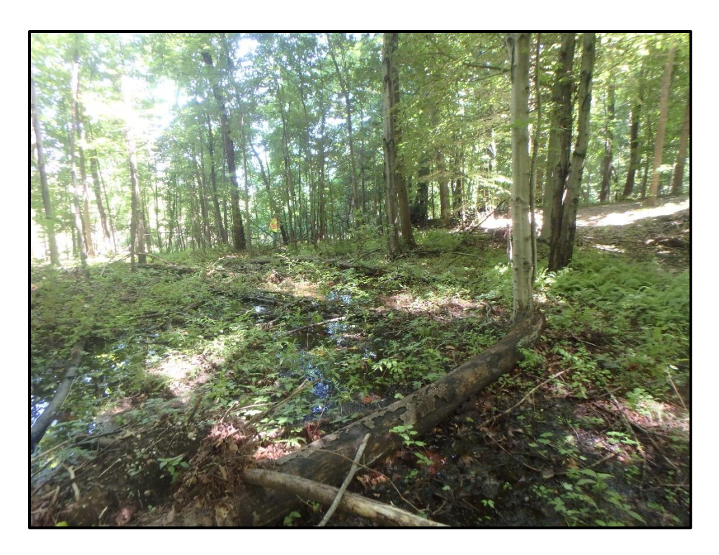
Wetland 4MMM – PFO