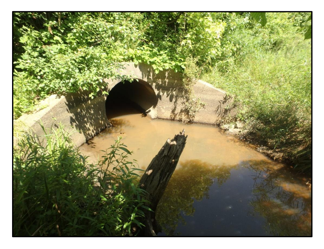
Waters 6TT – Perennial