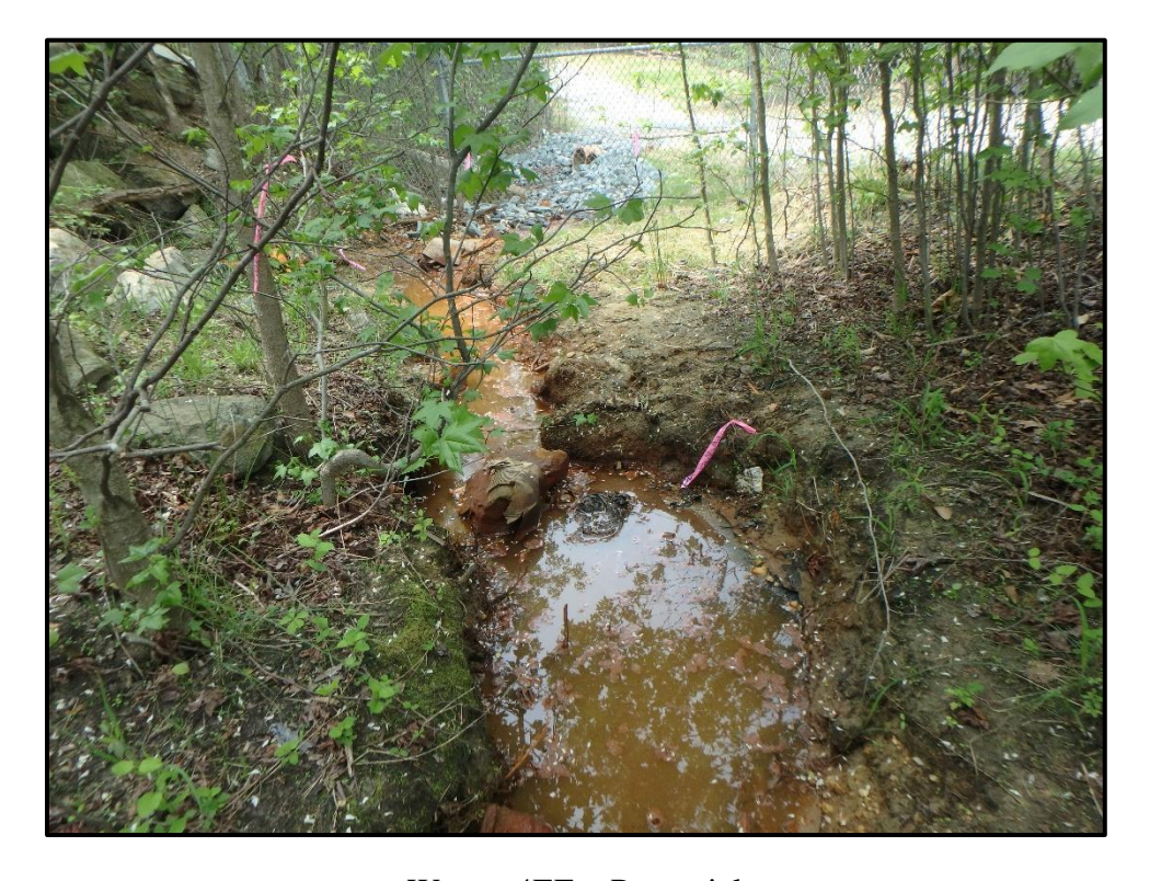
Waters 4EE – Perennial