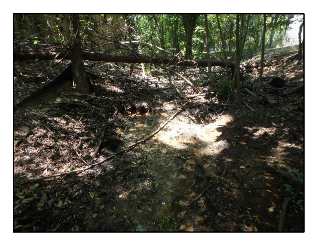
Waters 7GG – Intermittent