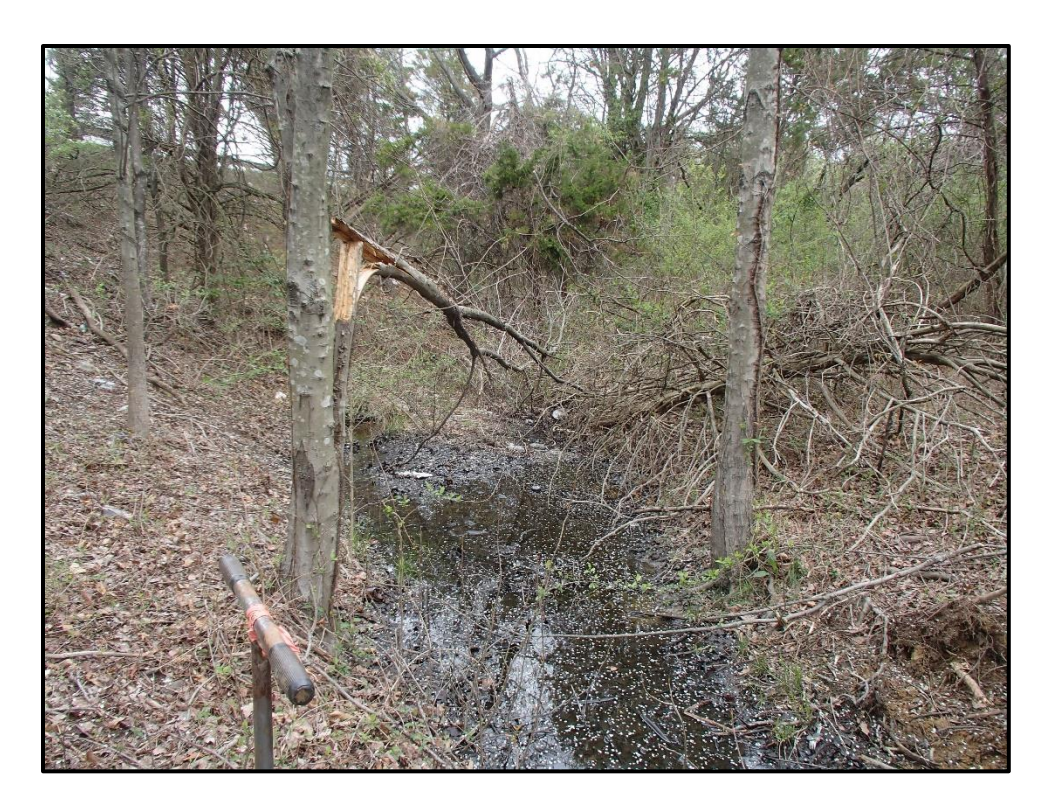
Waters 3JJ – Intermittent