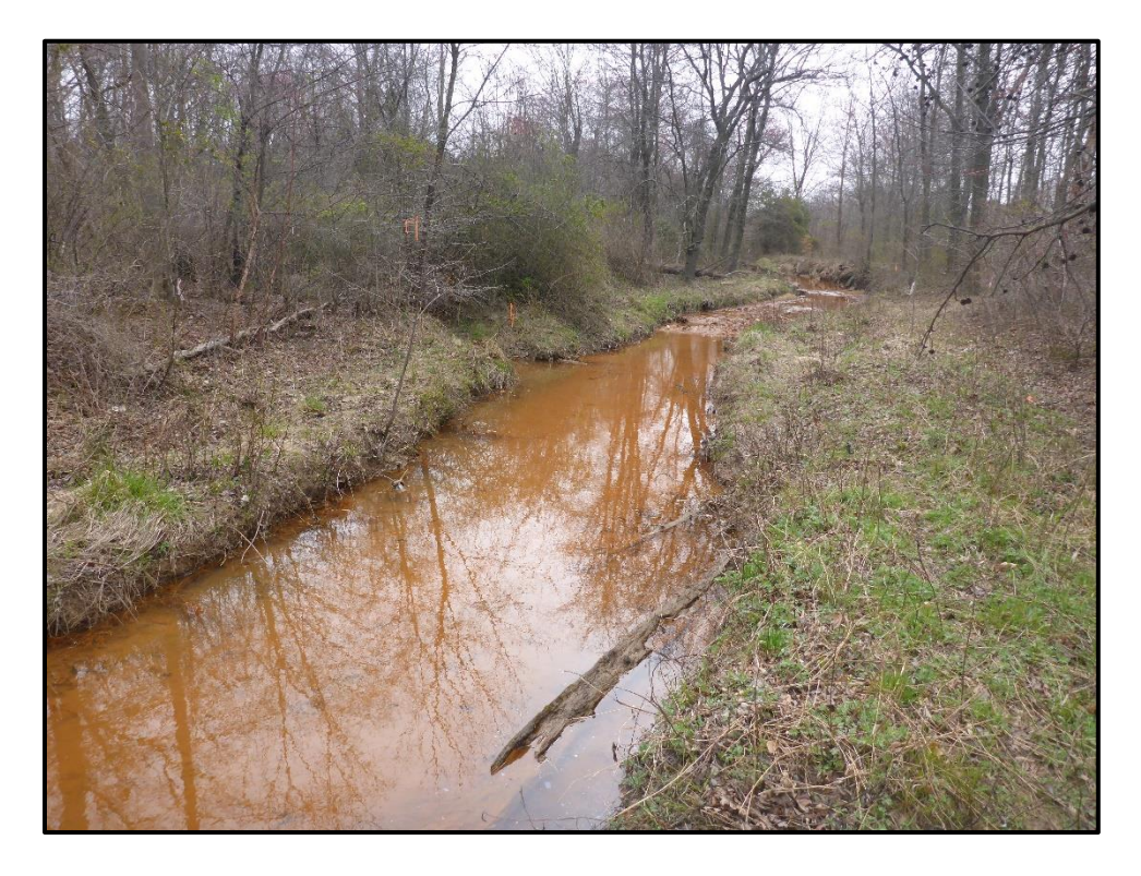
Waters 3L – Perennial