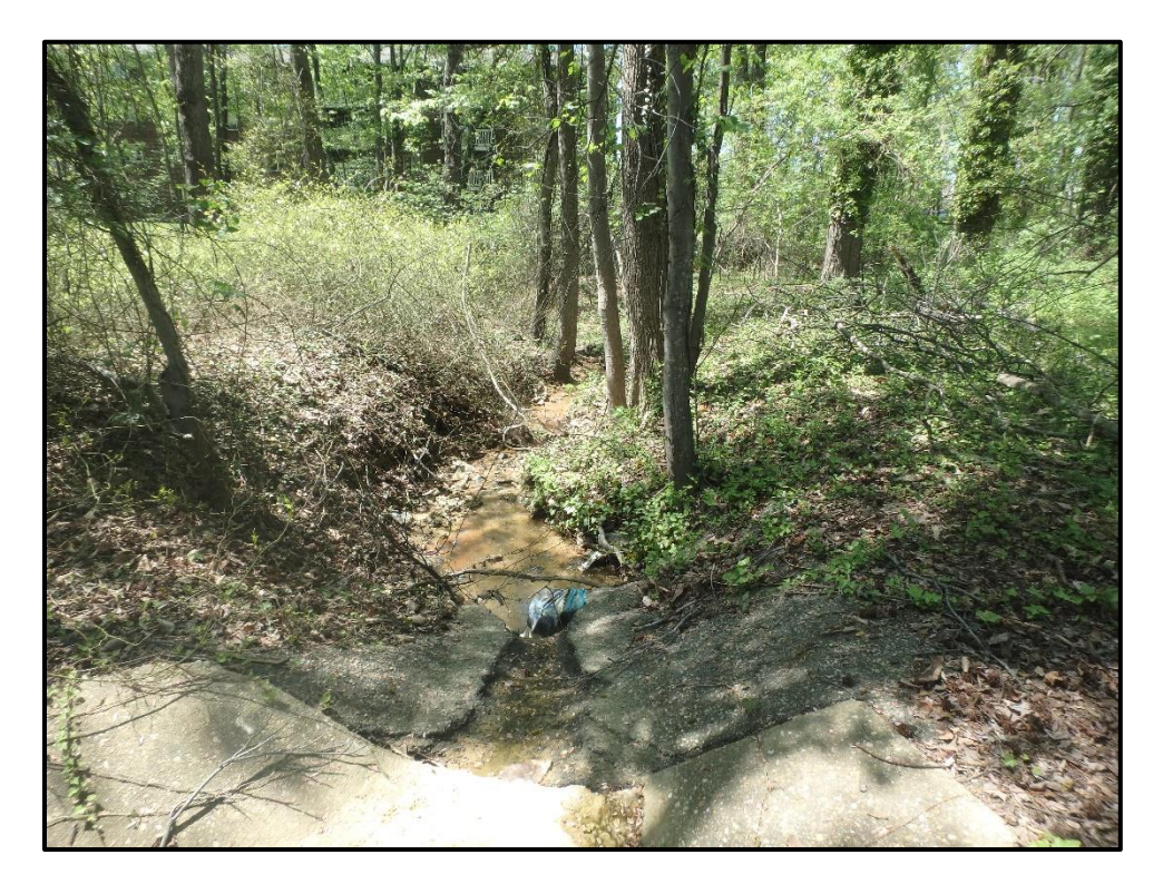
Waters 3UU – Intermittent