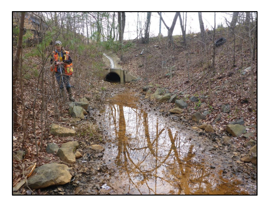
Waters 1R – Intermittent