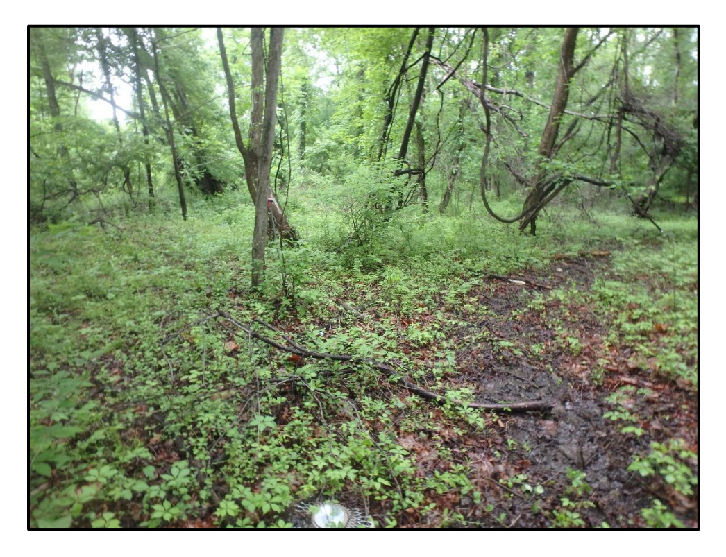
Wetland 3Y – PFO