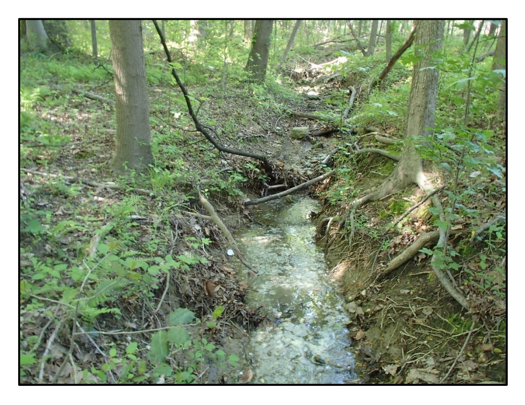
Waters 4Z – Perennial