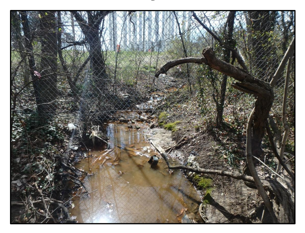
Waters 3A – Perennial