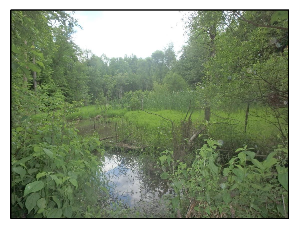
Wetland 4YY – PSS