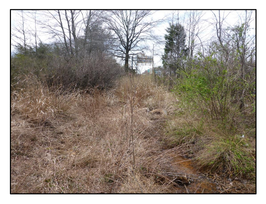
Wetland 2K – PEM